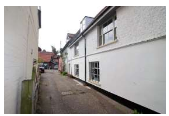
No.27 Earsham Street

Nos.23-25 Odd Earsham Street. A pair of altered c1800 cottages standing in a private courtyard to the rear of No.29. No.23 rendered and of a single storey with an attic lit by a gabled dormer. Late twentieth century window joinery. No.25, two storeys of painted brick with casement windows and a weatherboarded gabled dormer. The rear section of the plot on which this building stands is within the scheduled area of the Castle complex.