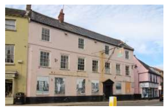
No.2 Market Place

No.2 Market Place and former Odd Fellows Hall to rear (grade II). An early eighteenth century former coaching inn which was until 2015 known as the Kings Head Hotel. It consists of two parallel ranges with a long rear wing facing a courtyard. The Market Place façade is of early eighteenth century date, and of three storeys and seven bays. Of painted red brick, with a plinth and a dentilled brick eaves cornice. Black pan tiles to roof and a single red brick ridge stack. Seven hornless twelve-light sash windows at first floor level with flush frames and flat arched lintels. Four similar windows to the second floor and six to the ground floor. Off-centre Six-panelled door in wooden Doric case with pilasters, a keyed architrave and a pediment. Return elevation with twin gables. Rear elevation with twelve-light hornless sashes to first and second floors.