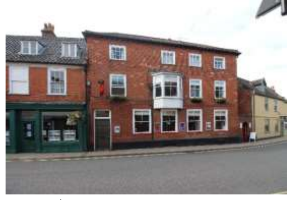
No.5 Earsham Street

Castle complex. Reeve C, Bungay Through Time (Stroud, 2009) p34.