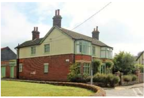
No.6 Outney Road

Cherry Tree House, No.4 Outney Road and red brick boundary wall. A former public house, which was in use as such from at least the beginning of the nineteenth century, it closed in the mid twentieth century. Probably of mid eighteenth century date altered c1930. Single storey with attics, rendered red brick façade with quoins and a black pan tile roof. Eight bay street frontage with two doorways and six small paned metal casement windows set back beneath flat lintels. The window openings to the right of the central doorway are not shown on late nineteenth century photographs. Three gabled dormers with late twentieth century casements. Two substantial red brick ridge stacks. Good red brick wall to Outney Road frontage. Reeve C, Bungay Through Time (Stroud, 2009) p49.