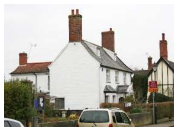
White House, No.32 Upper Olland Street

applied half-timbering, steeply pitched black pan tiled roof, cove cornice, two late twentieth century casements at first floor level. The ground floor detailing recorded in the statutory list has now gone including the doorcase, shop facia and casement window. Late twentieth century shop facia. Thin red brick at base of chimney shaft. Twin gabled northern return elevation. Early casement within front gable. Nos.30 to 34 (even), Emmanuel church and Nos.38 to 52 (even) form a group.