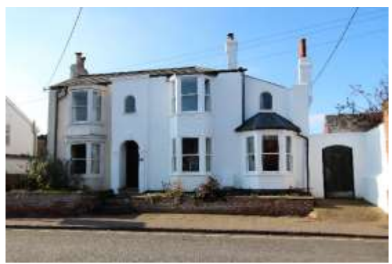
Nos.21-23 (Odd) Wingfield Street

Nos.21-23 (Odd) Wingfield Street and wall. A mid nineteenth century structure with the appearance, rendered brick with a Welsh slate roof. of once being a single villa, now two dwellings. No.21 retains much of its original appearance and has a canted bay with sash windows to Wingfield Street. The windows to No.23 have been replaced within the original openings. Central arched doorway with pronounced keystone within breakfront. Subsidiary Structures High nineteenth century painted brick wall with gate.