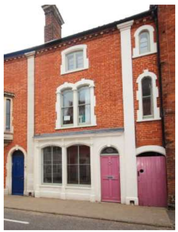
No.36 Bridge Street

No.36 Bridge Street (local list). A substantial later nineteenth century red brick former shop and dwelling with painted stone dressings, dentilled eaves cornice and full height pilasters. Plate glass sash windows. Three storey, two bay principal façade. Arched doorcase with keystone and four panelled door within rendered later nineteenth century former shop facia. Simple semi-circular fanlight. Twin shallow arched windows to left with keystones beneath a corbelled cornice. Passage way with boarded door within shallow arched opening to right. Substantial red brick chimneystack. Forms part of a semi-detached pair with No.36.