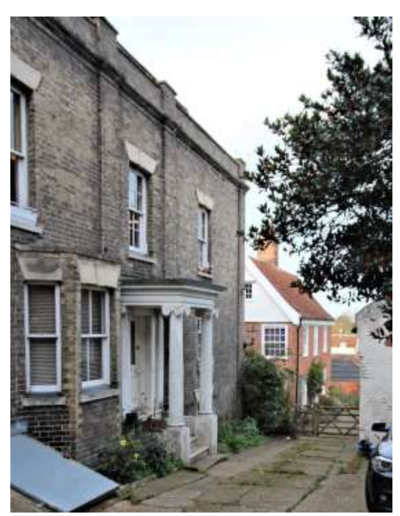
Nos.7 & 9 Trinity Street