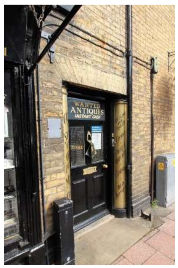
Doorcase No.28 Earsham Street

Nos.28-30 (even) Earsham Street (grade II). Mainly of seventeenth century date but with an early to mid-nineteenth century façade. Of two storeys and an attic. Two dormers with original leaded casements. Suffolk yellow brick front. Pan tiles. Two windows and blank centre panel, sash, with glazing bars and flat arches. Partially glazed six-panelled door flanked by one quarter radius Doric columns in reveals, beneath a flat arch. Wooden shop facia, the left-hand section only being evident on early twentieth century photographs. Nos.2 to 40 (even) form a group.