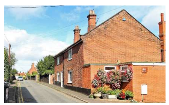
No. 16 Nethergate Street

Nos.8-12 (even), Nethergate Street A terrace of three c1800 cottages standing at a right-angle to the road within an alley to the rear of Nos.4 & 6. Built of red brick with a red pan tiled roof containing sloping roofed dormers with casement windows. Stack to gable at Nethergate Street end and one central ridge stack. Small pane casement windows beneath cambered brick lintels. Doors with similar lintels.