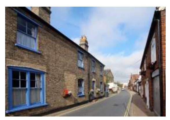
No.1 Chaucer Street

No.1 Chaucer Street. Attached to the rear of the grade II listed No.24 Earsham Street and shown as part of that structure on early Ordnance Survey maps. By 1969 it was shown on maps as a separate dwelling. It was possibly built as the postmaster's house for the former town post office at No.24 Earsham Street 1880. Gault brick façade to an