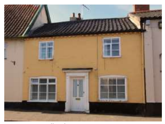
No.20 Upper Olland Street

No.18 Upper Olland Street. A mid nineteenth century shop on the southern corner of Rose Lane. Rendered and painted red brick with a black pan tiled roof. Dentilled eaves cornice, plinth. Upper Olland Street façade has a nineteenth century shop facia with reeded pilasters, containing a late twentieth century partially glazed door. Plate glass sashes with horns above. Rose Lane elevation with twentieth century casement windows. Rear gable also visible from Rose Lane, this has a canted bay window at ground floor level.