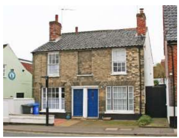
Nos. 6&8 Lower Olland Street

No.4 Lower Olland Street. Two cottages, latterly house and shop. Red brick with a steeply pitched black pan tiled roof. Possibly late eighteenth century. Well preserved later nineteenth century shop facia to southern end of a single bay. Two centrally opening casements to first floor which are possibly of nineteenth century date flanking a central blind recess. Southern return elevation partially rendered with replaced windows. Door and widow openings to ground floor with cambered brick lintels. Ground floor window at northern end now a late twentieth century four pane casement. Northern elevation rendered. Single storey rear range.