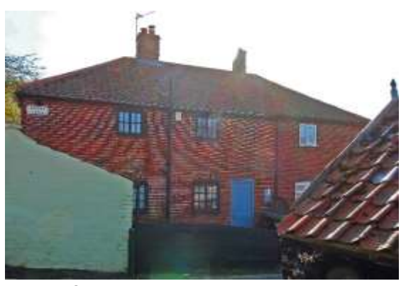
Nos.11 & 15 Quaves Lane

See also No.54 St Mary's Street and No.2 Upper Olland Street.