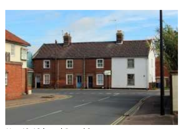
Nos.40-46 (even) Broad Street

No.38 Broad Street. A mid to late nineteenth century red brick two storey structure standing to the rear of No.40 Broad Street, also visible from Nethergate Street. Possibly built as a workshop. Four bay principal elevation with gault brick lintels to arched casement windows. Single storey red pan tile roofed projecting range. Return elevation to Broad Street has blocked arched window openings at first floor level and a larger blocked arched opening to the ground floor. Return elevation to Nethergate Street rendered. Red pan tile roof, red brick stack to rear. Good tall red brick boundary wall attached to rear gable. A building is shown on this site on the 1885 1:2,500 Ordnance Survey map.