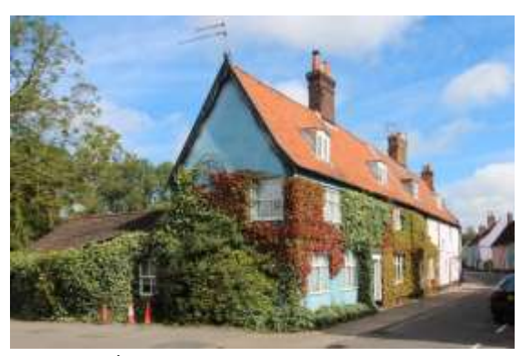
No. 29 Bridge Street

floor band, plinth. Three flush framed casement windows at first floor level. Segmental arched lintels to two casements flanking the front door. Six-panelled door with near-flush frame. The right-hand has later twentieth century door and window openings inserted following the demolition of the adjoining cottage in the mid twentieth century. Catslide roof to rear. Nos.17, 21, & 23 form a group. Honeywood F, Morrow P & Reeve C, The Town Recorder, A History of Bungay in Photographs (Bungay, 1994) p156. Reeve C, Bungay Through Time (Stroud, 2009) p58-59.