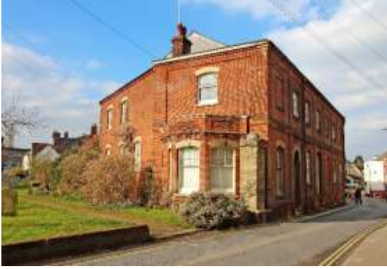
Trinity Street elevation of Owle's Warehouse

Owles Warehouse, including No.4 Trinity Street. Warehouse with attached house of red brick, with a Welsh slate roof. On the corner of Cross Street and Trinity Street. Built c1890 it replaced a large c1730 townhouse. Three bay gabled façade to Cross Street with a Diocletian widow to the gable. Seven bay façade to Trinity Street divided by pilasters rising from a plinth. Platt band above ground floor windows and heavy cornice. Windows and doors set beneath arched lintels, those to the house dressed in stone. House has principal elevation facing out over the churchyard. Four bays with splayed corner to Trinity Street with a canted bay window. A well-preserved industrial building of unusual design. Honeywood F, Morrow P & Reeve C, The Town Recorder, A History of Bungay in Photographs (Bungay, 1994) p159.