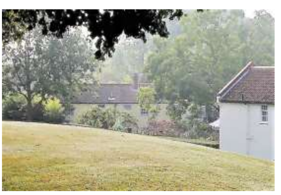
No.9 Outney Road

No.9 Outney Road. A later eighteenth century cottage of two storeys and three bays with a red pan tile roof, massively extended in the mid to late twentieth century on site of single storey range of outbuildings. Rendered façades, and external joinery largely replaced. The section between Outney Road and the central ridge brick ridge stack is all an addition to the original cottage. A further small cottage once stood immediately in front. Honeywood F, Morrow P, & Reeve C, The Town Recorder, A History of Bungay in Photographs (Bungay, 1994) p142.