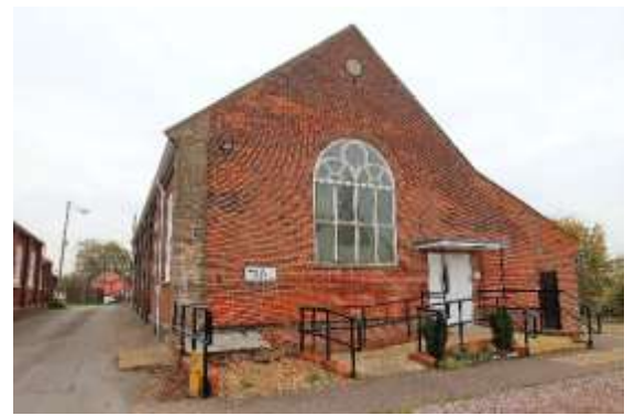
Former Sunday School, Rose Lane

Former Sunday School and lecture Hall, Rose Lane. Sunday School associated with Upper Olland Street Congregational Church built. 1867-69 to the designs of R.M. Marsden for Charles Stokes Carey. Red brick with gault brick dressings and pilasters. Traceried window in north gable and Twentieth century doorway. Return elevations with twelve-light hornless sashes and gault brick pilasters. Black pan tiled roof. Rear addition with wooden glazed roof and leaded coloured lights. Lecture rooms to rear of c1898 designed by JO Rees. Red brick with stone dressings. A prominently located structure at the junction with Rose Lane. Bettley, J, and Pevsner, N, The Buildings of England, Suffolk: East (London, 2015) p.151. Honeywood F, Morrow P, & Reeve C, The Town Recorder, A History of Bungay in Photographs (Bungay, 1994) p15 & p23.