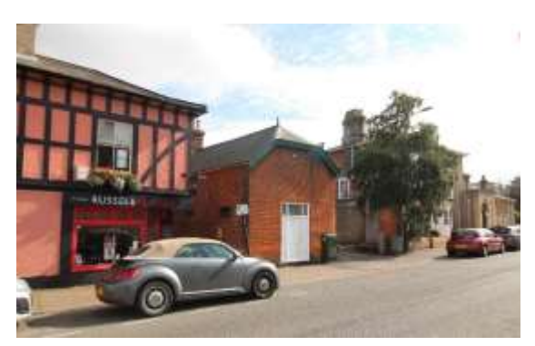
No.18a, Broad Street

Forecourt Wall to No.16 Broad Street (grade II). Early nineteenth century, curved on plan, yellow brick screen wall about eight feet high with stone cope and arched doorway, and with square pier with damaged stone finials.