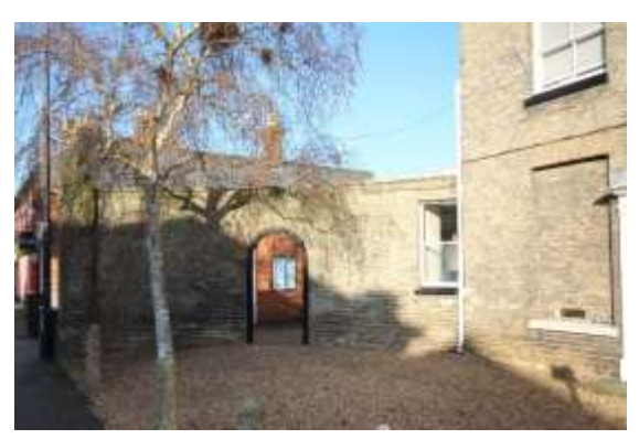
Forecourt Wall to No.16 Broad Street

Forecourt Wall to No.16 Broad Street (grade II). Early nineteenth century, curved on plan, yellow brick screen wall about eight feet high with stone cope and arched doorway, and with square pier with damaged stone finials.