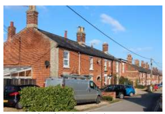
Nos.22-28 (even) Southend Road

Nos.12-20 (even) Southend Road. Terrace of mid to late nineteenth century cottages. Red brick with gault and blue brick dressings and a black pan tiled roof. Central arched opening leading to passage way to rear gardens and further passage entrances within end bays. Decorative gault brick corbelled eaves cornice. Blue brick diaper work between first floor windows. Gault brick sill band to first floor and lintel band to ground floor windows, with between further blue brick diapering. Further gault brick bands below. Dentilled gault brick frieze above doorcase lintels. External joinery largely replaced but original openings preserved.