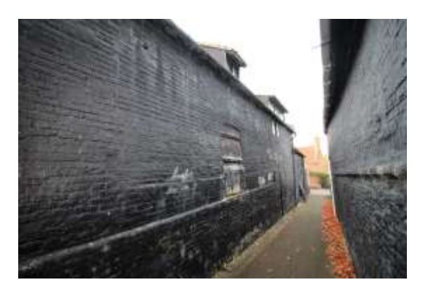
Brandy Lane elevation of No.18 Broad Street

building which has been a wine merchants for a long period are extensive barrel-vaulted cellars of considerable age. Subsidiary Structures Good red brick serpentine wall to the rear, probably of early nineteenth century date with later buttresses.