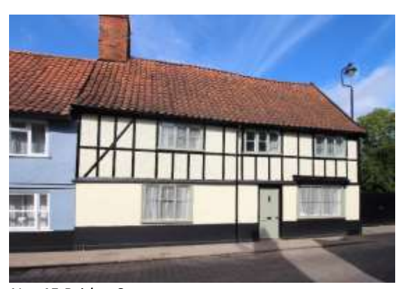
No. 45 Bridge Street

Nos.39-43 (odd) Bridge Street (grade II). A group of three seventeenth century cottages. Two storeys, with an attic which was formerly lit by dormers according to the statutory list. Red pan tiled roof and a centrally placed red brick ridge stack. Rendered brick ground floor, with a timber framed and plastered first floor. Continuous drip mould band at first floor level. Row of five casements in flush frames to the first floor, mostly of later twentieth century origin. Horned sash windows with margin lights to ground floor of Nos.41 & 43, No.39 with twentieth century casement windows in flush frames at ground floor level. Four-panelled front door to No.39. Nos.41 & 43 with panelled doors with glazed upper panels. Heavy flush door frames for Nos.39 and 43. Nos.29 to 45 (odd) form a group.