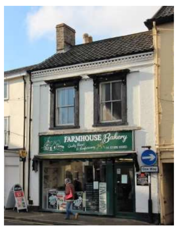
No.12 Market Place

limewashed, three twelve-light hornless sashes at second floor level with flush frames. The first floor windows have had their glazing bars removed. Stuccoed flat arched lintels with keys. Wide cart opening to left. Early nineteenth century wooden shop front, to right with slender reeded pilasters and entablature. Low pitched pan tiled roof. Long two storey rear range of c1800. Red brick with a red pan tiled roof, possibly originally a warehouse. Nos. 2 to 16 (even) form a group. The rear section of the plot on which this building stands is within the scheduled area of the Castle complex. Honeywood F, Reeve C, & Reeve T, The Town Recorder, Five Centuries of Bungay at Play (Bungay, 2008) p144.