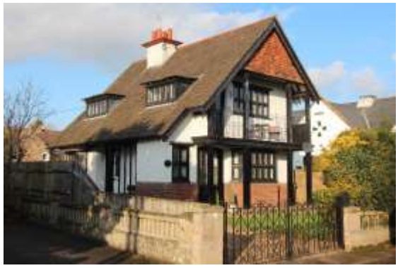
No.14 Scales Street

No.12 Scales Street. Former drill hall now car repair workshop. Probably designed and built by John Doe architect and builder of Bungay and dated 1906. Used primarily by the 2nd Volunteer Battalion Norfolk and 5<sup>th</sup> Battalion Suffolk Regiments. Single storey red brick with Welsh slate roof formerly with tall leaded ventilator on ridge. Iron roof with tie rods. Gabled elevation to Scales Street with central circular former window with stone decoration in the form of four keystones. Mullioned and transomed wooden casement windows.