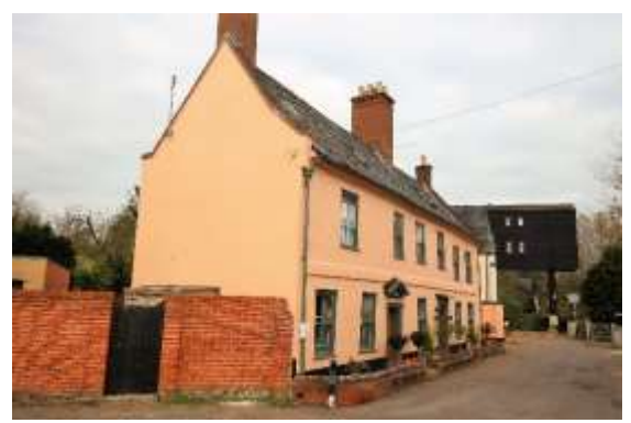
Nos.51 & 53 Staithe Road

Nos.51 & 53 Staithe Road. (grade II). Originally one early eighteenth century dwelling. Two storey, six bay façade, pebble dash on red brick. Platt band below first floor windows, plinth, and a coved cornice. Black pan tiled roof of steep pitch with overhanging eaves. Four-light sashes in flush frames, rendered flat arched lintels to ground floor windows. No.51, six-panelled door, with an eared architrave and a pediment. No.53, six-panelled door in a wood case with slender pilasters and a cornice. red brick chimney stacks. Subsidiary structures. Boundary walls appear to be later twentieth century red brick.