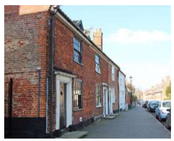
Nos.40-44 (even) Upper Olland Street

No.38 Upper Olland Street (grade II). Eighteenth century, of two storeys and an attic. Limewashed brick with a black pan-tiled roof. Two hornless, flush-framed twelve-light sash windows to each floor, cambered arched lintels to ground floor openings. Six-panelled door in wooden case with roundels and a mutular cornice. Nos.30 to 34 (even), Emmanuel church and Nos.38 to 52 (even) form a group.