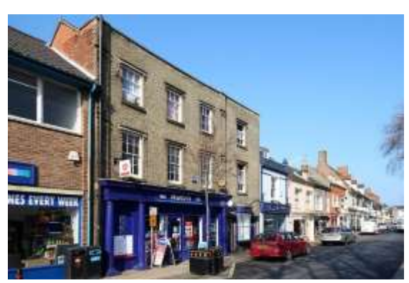
Nos.36-38 (even) St Mary's Street

twentieth century shop front. Red pan tiled roof with casement dormer.