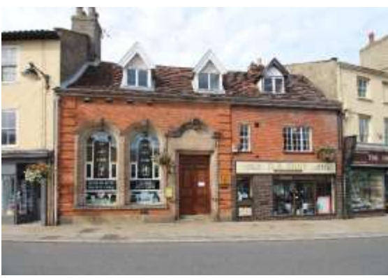
No.8 Market Place

No.6 Market Place. A mid nineteenth century shop with domestic accommodation above. Three storeys and three bays. Faced in gault brick with a painted façade. Nine light hornless sash windows to first and second floors. Second floor with blind central recess. Notable early twentieth century glazed tile shop facia with deep green and chocolate coloured tiles and carved wooden brackets. Decorative brass pilasters to entrance. The rear section of the plot on which this building stands is within the scheduled area of the Castle complex. Honeywood F, Morrow P, & Reeve C The Town Recorder, A History of Bungay in Photographs (Bungay, 1994) p135.