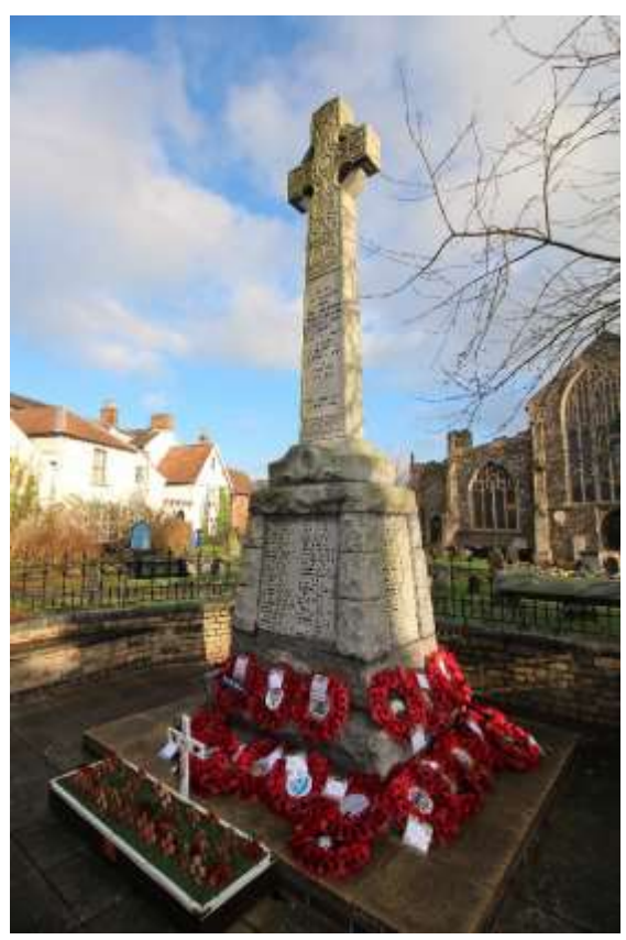
War Memorial, St Mary's Street

Pier with urn adjacent to K6 telephone box, St Mary's Churchyard. Probably a curtilage structure to St Mary's Church. Probably of early nineteenth century date. A square section Suffolk white brick pier with a stone cap and an urn. Painted plinth and lower section. A similar pier at the southern end of the churchyard is individually listed at grade II. A similar pier also once existed on Trinity Street but only its base now survives.