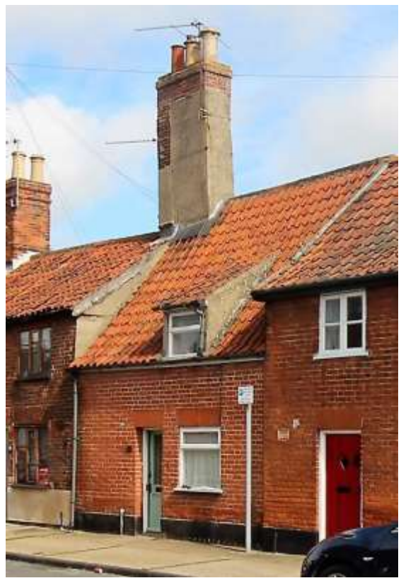
No.58 Broad Street

Nos.54 & 56 Broad Street A pair of cottages with early nineteenth century facades and steeply pitched red pan tile roofs. Shared central ridge stack. Possibly a re-fronting of an earlier structure. Casement windows. Those to No.56 are of late twentieth century date, however the first-floor window of No.54 may be earlier. Twentieth century front doors. Wedge shaped lintels to door and window openings. No.54 has a single storey late twentieth century addition to the rear and a rendered return elevation.