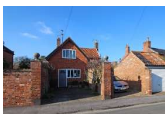
No.14 Trinity Street (Wharton Street elevation)

No.12 Trinity Street and boundary wall to rear. Substantial dwelling set back from the road. Probably early nineteenth century. Two storeys rendered facades with a hipped roof with later twentieth century replacement black pan tiles. Principal façade has moulded surrounds to windows and a canted bay window. Central ridge stack. Subsidiary Structures Red brick and cobble boundary wall to rear. Boundary walls to Trinity Street appear to be late twentieth century red brick structures.