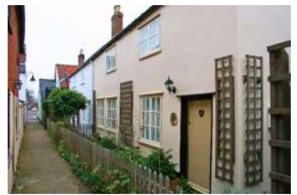
Nos.79 (Odd) Turnstile Lane

Nos.7-9 (Odd) Turnstile Lane. A terrace of four probably early nineteenth century cottages which were converted to two in the late twentieth century. Rendered façades with twelve-light casement windows and boarded doors. Red pan tiled roof, red brick ridge stacks.