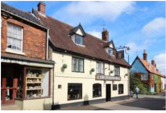
Chequers Inn, No. 23 Bridge Street

Nos.17-21 (odd) Bridge Street (grade II). No.19 early seventeenth century and later, with a nineteenth century public house façade. Now shop and dwelling. Of two storeys, faced in red brick and with a black pan tile roof covering to the main block. Single storey wing to left with red pan tile roof. Rendered ridge stack. Three hornless twelve-light sashes to the first floor with flat arched lintels and stone sills. Arched passage opening with sixpanelled door with wood tympanum above matching the door. Mid twentieth century shop facia to No 21. Two small twentieth century casements to ground floor, left. In the late nineteenth and early twentieth centuries at least part of the structure was the Beaconsfield Arms Public House. Nos.17, 21 & 23 form a group.