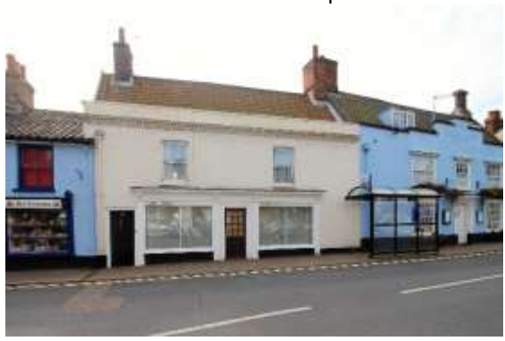
No.33 Earsham Street

No.31 Earsham Street. A mid nineteenth century symmetrical painted brick façade with two, horned, plate-glass sashes at first floor level. Black pan tile roof with gault brick ridge stack. Central partially glazed door flanked by shop facias. Historic photos show the building with small pane sashes to the first floor and ground floor left, the ground floor window having a wedge-shaped lintel. The rear section of the plot on which this building stands is within the scheduled area of the Castle complex.