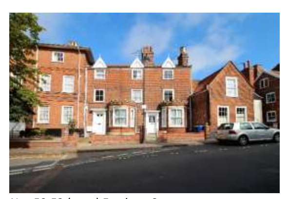
Nos.50-52 (even) Earsham Street

gable with tumbled foot. Flush frame sash window with glazing bars. Entrance at angle with fielded lower panel to door.