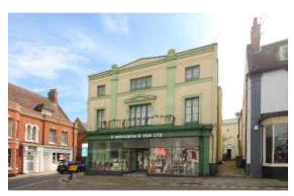
No.5 Market Place

England, Suffolk: East (London, 2015) p.157. Honeywood F, Reeve C, & Reeve T, The Town Recorder, Five Centuries of Bungay at Play (Bungay, 2008) p131.