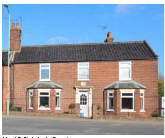
No.15 St John's Road

No.13 St John's Road. A red brick early to midnineteenth century cottage with a black pan tiled roof. Three bay two storey façade with central door. Doorcase with pilasters. Late twentieth century casement windows in original openings. Late twentieth century boundary wall to street not included. Prominently located at the termination of Bardolph Road.