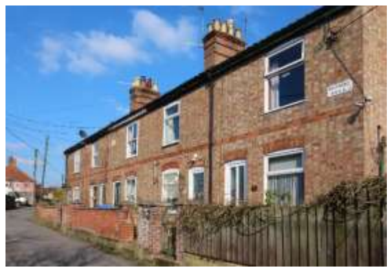
Sunnyside Cottages, Nos.55-63 (odd) Southend Road

Nos.47-53 (Odd) Southend Road. Two semidetached pairs of cottages. Gault brick facades to otherwise red brick structures. Symmetrical façades with centrally placed doors flanked by casement windows. Doors set back beneath flat arched lintels. Nos. 51 & 53 appear to retain their original casement windows. Shown on the 1885 1:2,500 Ordnance Survey map. No.47 has a later twentieth century flat roofed garage addition.