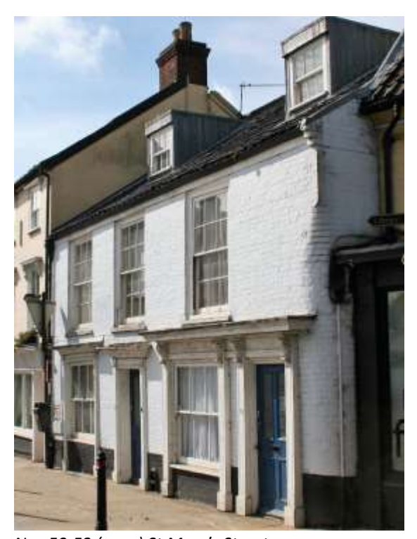
Nos.50-52 (even) St Mary's Street

No.48 St Mary's Street (grade II). Eighteenth century, of two storeys and an attic. Black pan tiled roof with two gabled dormers. Painted brick. Three-bay rendered façade with sixteen-light flush-framed sashes to the outer bays and a casement window to the centre. Coved cornice. Midnineteenth century shop front with cornice and consoles. Nos.42 to 56 (even) form a group.