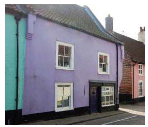
The Smokehouse, No.48 Bridge Street

Nos.40-44 (even) Bridge Street (grade II). A row of three cottages, Nos.42-44 the former Kings Arms Inn and recorded as such in the seventeenth century (closed c1910). Seventeenth century with later alterations, partially re-fronted. Of two storeys and attics. No.40 with black pan tile roof covering, Nos.42-44 red. No.40, is of two storeys and attics and has an early nineteenth century white brick façade with gauged flat arched lintels. A single, late twentieth century flush frame sash window with glazing bars to each floor and late twentieth century front door with original cambered lintel. Flat roofed dormer in roof slope above. Nos.42 and 44 rendered. No.42 with flush frame casement windows. Ground floor openings to No.44 recessed beneath cambered brick arched lintels. One four-light sash and one casement. Twelve-light hornless sash and small casement above. No. 42 has a later twentieth century sixpanelled door, No.44 a partially glazed fourpanelled door. Nos. 2, 4, 6A, 12 to 20 (even), 24 to 34 (even) 40 to 44 (even), 48 and 50 form a group. Honeywood F, Reeve C, & Reeve T, The Town Recorder, Five Centuries of Bungay at Play (Bungay, 2008) p136-137.