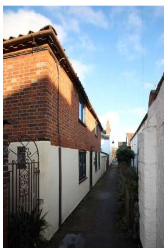
Nos.8 & 10 Turnstile Lane

Nos.7-9 (Odd) Turnstile Lane. A terrace of four probably early nineteenth century cottages which were converted to two in the late twentieth century. Rendered façades with twelve-light casement windows and boarded doors. Red pan tiled roof, red brick ridge stacks.