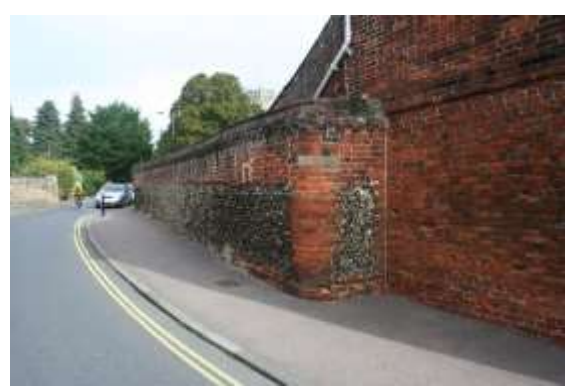
Wall of Garden to Trinity Hall, Trinity Street

brick with brick cope. Yellow brick pier with stone cap, west.