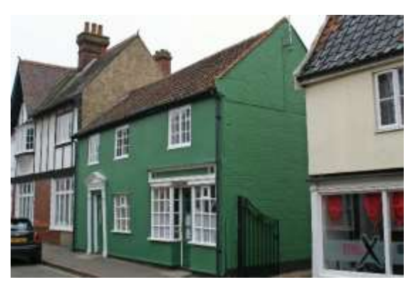
No.26 Upper Olland Street

No.26 Upper Olland Street. Probably of early nineteenth century date but much altered. Painted and rendered red brick. Red pan tiled roof. Three small pane casement windows to first floor. Late twentieth century pedimented doorcase and shop facia. Whilst much of the external joinery has been replaced the openings correspond to those shown on early twentieth century photographs. The building has significant group value with neighbouring properties.