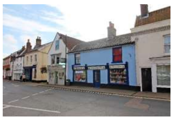
No.31 Earsham Street

No.31 Earsham Street. A mid nineteenth century symmetrical painted brick façade with two, horned, plate-glass sashes at first floor level. Black pan tile roof with gault brick ridge stack. Central partially glazed door flanked by shop facias. Historic photos show the building with small pane sashes to the first floor and ground floor left, the ground floor window having a wedge-shaped lintel. The rear section of the plot on which this building stands is within the scheduled area of the Castle complex.