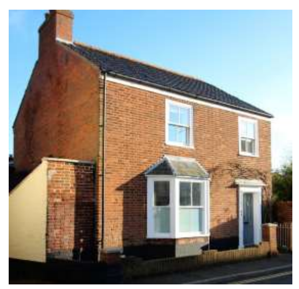
No.13 Upper Olland Street

No.11 Upper Olland Street. A former public house now converted to flats. Probably of early nineteenth century date. In use as The Queen Public House in the nineteenth and early twentieth centuries. Red brick. Twelve-light hornless sash windows to first floor in flush frames with flatarched lintels. Nine-light hornless sashes to second floor. Small inserted late twentieth century casement at first floor level. Large yard opening with boarded door to ground floor and a later nineteenth century public house facia with panelled pilasters. Return elevation to Turnstile Lane partially rendered. Two storey rear wing with casement windows. Honeywood F, Reeve C, & Reeve T, The Town Recorder, Five Centuries of Bungay at Play (Bungay, 2008) p152-153.