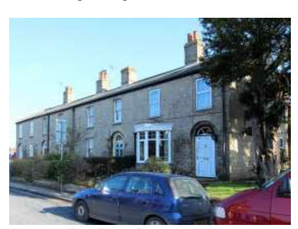
Nos.38-44 (even) Wingfield Street

Nos.16-20 (even) Wingfield Street. An early nineteenth century red brick terrace, which is now partially painted. Red pan tiled roof and dentilled brick eaves cornice. Casement windows, those to Nos.16 & 18 possibly original. Those to the ground floor beneath segmental arched lintels. Sixpanelled doors to Nos.16 & 18. No.20 with a partially glazed door. A further house in the terrace No.22 has been heavily altered and is therefore not worthy of inclusion. Nos.16-20 contribute positively to the setting of the grade II No.14.