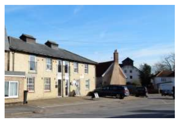
Staithe Business Suite, Staithe Road

setting of the grade II listed No.27. Subsidiary Structures Twentieth century garage not included.