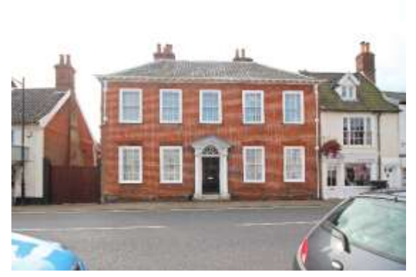
No.15 Earsham Street

No.15 Earsham Street (grade II). A substantial house with the date 1807 on its surviving original lead rainwater heads. Of two storeys and five bays with a distinguished symmetrical classical façade to Earsham Street. Red brick, plinth, and a wooden mutular cornice. Hipped black pan tile roof. Symmetrical five bay classical façade with twelvelight hornless sashes which are set within flush frames beneath wedge shaped brick lintels. Centrally placed six-panelled door, with panelled reveals to wooden case, arched radial bar fanlight, Doric columns and open pediment. Nos.1 to 19 (odd) form a group. The rear section of the plot on which this building stands is within the scheduled area of the Castle complex. Bettley, J, and Pevsner, N, The Buildings of England, Suffolk: East (London, 2015) p.154. Reeve C, Bungay Through Time (Stroud, 2009) p36.