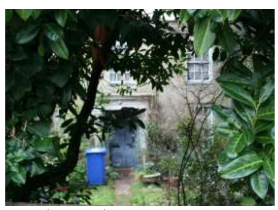
No.16 Flixton Road

No.16 Flixton Road and outbuildings (grade II). Early nineteenth century villa of Suffolk white brick built as the miller's house for a now demolished smock mill. Two storeys with a Welsh slate roof. Band below, parapet with a stone cope. Symmetrical