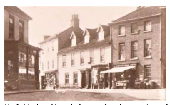
No.8 Market Place before re-fronting, a view of c1900

No.8 Market Place. Former bank and shop. c1900 red brick classical façade with stone dressings to an earlier structure. 1880s photos show a stuccoed early to mid-eighteenth century building of similar proportions on this site. Red plain tile roof with a row of three gabled dormers with bargeboards and casement windows. Rusticated red brick pilasters. Full height arched windows to left-hand section with heavy moulded surrounds and pronounced keystones. Doorcase with similar surround with robustly carved scrolled keystone. Right-hand section with small pane metal casement windows to first floor and late twentieth century shop facia. The rear section of the plot on which this building stands is within the scheduled area of the Castle complex. Honeywood F, Morrow P, & Reeve C, The Town Recorder, A History of Bungay in Photographs (Bungay, 1994) p135.