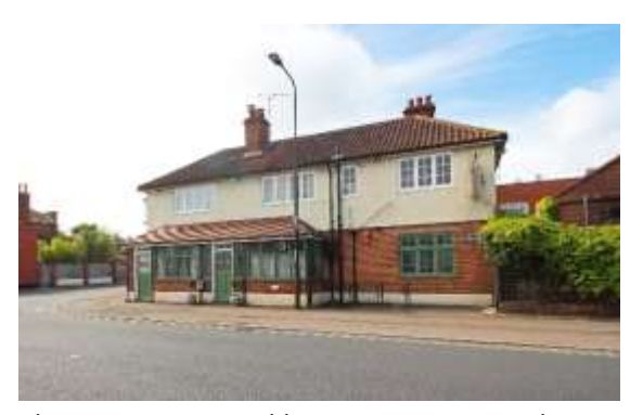
The Green Dragon Public House, No.29 Broad Street

No.21 Broad Street. Formerly a pair of early nineteenth century cottages, now a single dwelling. Red brick with a dentilled eaves cornice and a black pan tiled roof. Boarded door at northern end and a blocked door opening at the southern end. Twentieth century casement windows. Despite alteration this dwelling contributes positively to the adjoining grade II listed Nos.15-19 (odd).