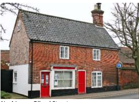
No.4 Lower Olland Street

No.2 Lower Olland Street (grade II). Early seventeenth century. This building interlocks with Nos.1 and 3 Upper Olland Street, qv, and incorporates part of a sixteenth century structure. Of two storeys and an attic. Tiles and pan tiles. Mock half timberwork painted on cement rendering. three-light casement window within gable, two-light casement at first floor level, mullioned and transomed casement to ground floor. Six-panelled door (entrance under left of No.56 St Mary's Street) with architrave convex frieze and cornice. 2'storey wing, left, brick, painted, includes small casement at each floor. No.2 forms part of a group with No.56 St Mary's Street and Nos. 1, 3 & 3a Upper Olland Street. Subsidiary structures. Fine panelled red brick garden wall to south fronting onto Lower Olland Street. Dentilled cornice beneath semi-circular brick cap. Blue brick embellishments.