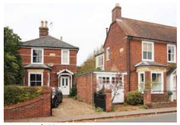
No.1 Wingfield Street

No.1 Wingfield Street. Detached villa of c1900. Red brick with a black glazed pan tiled roof. Stone dressings. Horned sash windows and partially glazed four-panelled door. Twentieth century wooden porch. Canted bay window to western bay of ground floor.