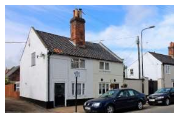
Nos.11-13 (odd) Broad Street

No.1a Broad Street see Earsham House No.12 Earsham Street.