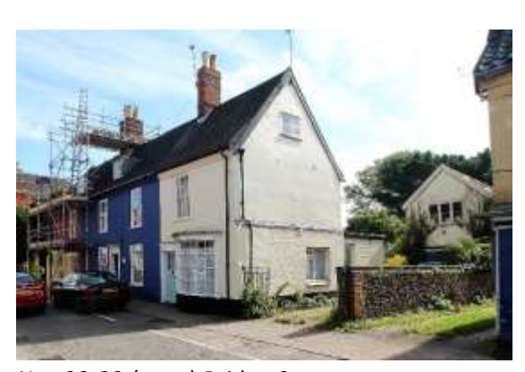
Nos.28-32 (even) Bridge Street

Substantial rear range with red brick façade, which was possibly originally a separate dwelling. Two storeys with a two-bay principal façade facing towards the river. Casement windows beneath cambered brick lintels, one hornless twelve-light sash at first floor level. Blocked door opening to ground floor centre. Good group of probably early nineteenth century red brick outbuildings in yard to the rear of No.26 including gabled cart shed with loft above. Red pan tiled roofs some now missing. Last used as an abattoir. Nos.2, 4, 6A, 12 to 20 (even), 24 to 34 (even) 40 to 44 (even), 48 and 50 form a group.