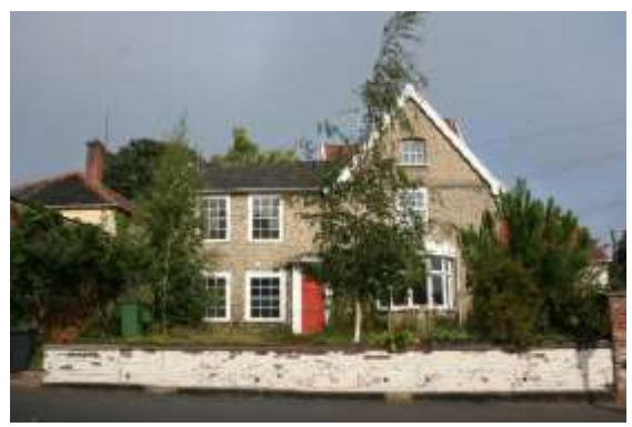
No.3 Staithe Road

No.3 Staithe Road (grade II). A detached house of later eighteenth, or early nineteenth century date. Of two storeys with a gabled attic lit by later windows. Suffolk yellow brick. Black pan tiled roof. Of three bays, the right-hand bay projecting slightly and having a gable. Twelve-light hornless flushframed sash windows. Those to the ground floor having segmental arched lintels. Five-sided canted bay window with casements to ground floor of gabled bay. Six-panelled door with wooden case. Elliptical fanlight Side door in wing wall with elliptical arch. Subsidiary structures to the right, now separated from No.3 by the entrance to a housing development, a red brick boundary wall of nineteenth century date with stone capped squaresection piers. Lower twentieth century section directly by street. Low painted brick retaining wall to front.