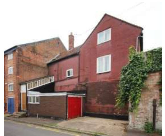
The Armoury, Nethergate Street

The Armoury, Nethergate Street. House of painted red brick with a red pan tiled roof. Probably of eighteenth-century date and formerly part of a maltings complex (see 1885 1:2,500 Ordnance Survey map). Also used as a regimental armoury for the 2<sup>nd</sup> Volunteer Battalion Norfolk Regiment (see also No.12 Scales Street). Nethergate Street façade of two bays, the right-hand bay gabled. Large blocked arched opening visible behind twentieth century garage addition and scarring for blocked window above. Entrance door at first floor level approached by enclosed flight of steps. All present windows in Nethergate Street façade late twentieth century casements. Return elevation to the garden of the grade II Nos.12-16 Broad Street largely blind.