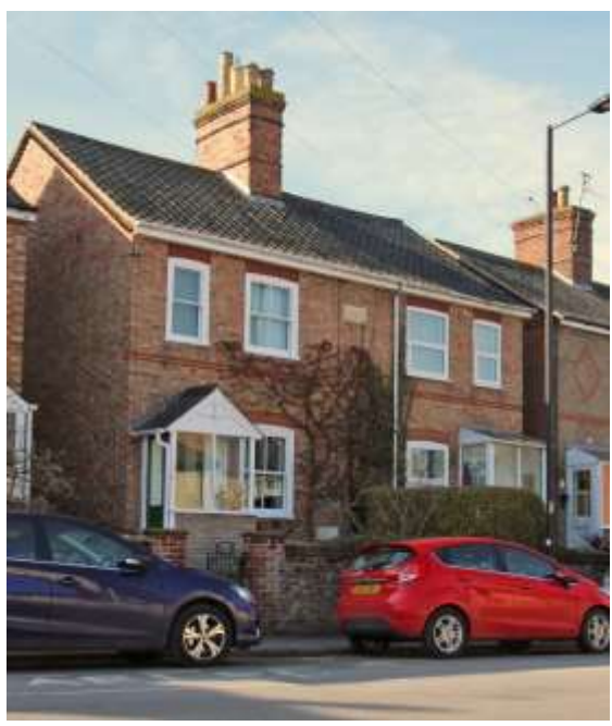
Alexandra Cottages, Nos.34-36 (even) Staithe Road

Nos.30-32 (even) Staite Road. Semi-detached pair of houses constructed between 1892 and 1905. Gault brick façade with red brick dressings to otherwise red brick structure. Replacement windows in original openings. Black pan tiled roof. Nineteenth century red brick boundary wall to Staithe Rd.