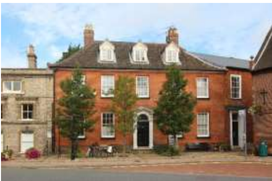
Earsham House, No.12, Earsham Street

Earsham House, No.12 Earsham Street including No.1a Broad Street (grade II). Eighteenth century two storey, attic, and basement, three pedimented dormers. Red brick, small wood cornice, modern tiles. Plinth. Five windows, sash, with glazing bars and flat arches. six-panel door in wood case with enriched pilasters, radial bar fanlight, consoles, and open pediment. Fine arts and crafts vernacular rear range of 1892 fronting onto Broad Street now part of the Council offices. Red brick with a hipped roof over wide projecting eaves. Fine oriel window at first floor level with mullions and a transom containing leaded lights. This housed a billiard room on the first floor and was designed by Bernard Smith with fittings by MFC Turpin and WB Simpson. The fine pargetted decoration is by Daymond and Son. Bettley, J, and Pevsner, N, The Buildings of England, Suffolk: East (London, 2015) p.154-155.