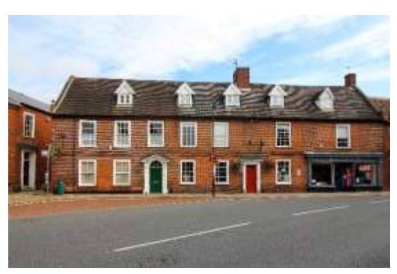
Nos. 4-8 (even) Earsham Street

No.4a Earsham Street. A structure of c1870 consisting of a shop with living accommodation above which replaced a timber-framed gabled building which is shown on early photographs. Of two storeys and two bays and faced in red brick with a red plain tile roof and terracotta ridge pieces. Southern gable with finials and dentilled cornice. Its present façade is radically different from that shown in Edwardian photographs, which show a central canted bay window at first floor level and a central doorway flanked by two small pane sashes below. Four light horned plate glass sashes at first floor level. Dentilled eaves cornice. Early to midtwentieth century shop facia, with late twentieth century partially glazed door inserted post 1977 within the original facia. Reeve C, Bungay Through Time (Stroud, 2009) p38.