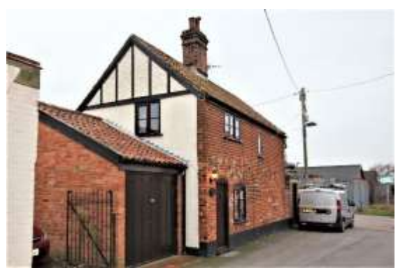
The Bakery, Rose Lane

Boundary wall to Santallen, Rose Lane. A red brick and stone rubble boundary wall of nineteenth century date fronting Rose Lane. Santallen itself is a late twentieth century house which does not contribute positively to the Conservation Area.