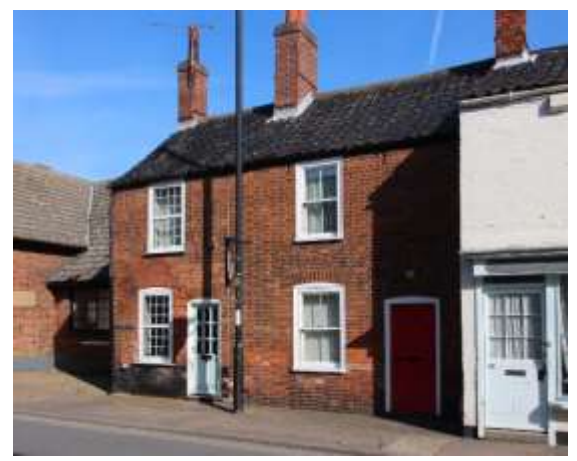
Nos.31-33 (odd) Lower Olland Street

No.29 Lower Olland Street. Former fire station built in 1930, of red brick over a concrete plinth. Single storey with decorative Dutch gables to return elevations and central section of entrance façade. Black concrete pan tile roof. Concrete lintels and small pane metal framed casement windows. Original top lit folding doors. A stylish and externally little altered piece of interwar design. According to research by Christopher Reeve the architect was Frederick J Meen of Beccles, the contractors Bedwell of Bungay and the cost £800. Honeywood F, Morrow P & Reeve C, The Town Recorder, A History of Bungay in Photographs (Bungay, 1994) p69.