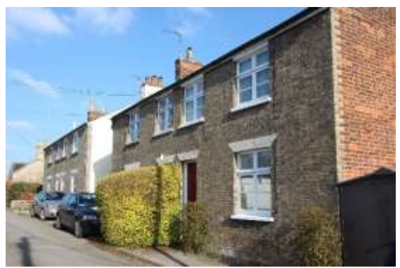
Nos.47-53 (Odd) Southend Road

Nos.47-53 (Odd) Southend Road. Two semidetached pairs of cottages. Gault brick facades to otherwise red brick structures. Symmetrical façades with centrally placed doors flanked by casement windows. Doors set back beneath flat arched lintels. Nos. 51 & 53 appear to retain their original casement windows. Shown on the 1885 1:2,500 Ordnance Survey map. No.47 has a later twentieth century flat roofed garage addition.