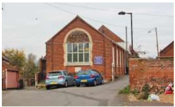
Lecture Hall, Rose Lane

Former Sunday School and lecture Hall, Rose Lane. Sunday School associated with Upper Olland Street Congregational Church built. 1867-69 to the designs of R.M. Marsden for Charles Stokes Carey. Red brick with gault brick dressings and pilasters. Traceried window in north gable and Twentieth century doorway. Return elevations with twelve-light hornless sashes and gault brick pilasters. Black pan tiled roof. Rear addition with wooden glazed roof and leaded coloured lights. Lecture rooms to rear of c1898 designed by JO Rees. Red brick with stone dressings. A prominently located structure at the junction with Rose Lane. Bettley, J, and Pevsner, N, The Buildings of England, Suffolk: East (London, 2015) p.151. Honeywood F, Morrow P, & Reeve C, The Town Recorder, A History of Bungay in Photographs (Bungay, 1994) p15 & p23.