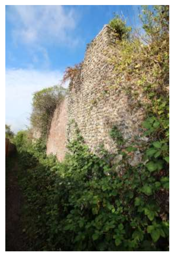
Garden wall of c1839, grounds of Scott House, Earsham Street

Fronting onto Castle Lane the walls are largely of red brick and probably of mid nineteenth century date.