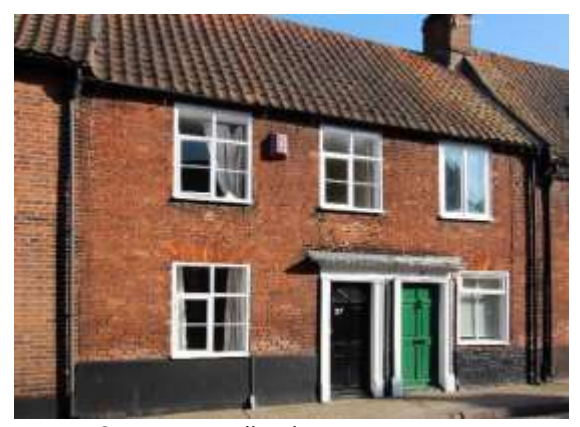
Nos.27 & 29 Upper Olland Street

cambered arches. No 25A has a wood reeded doorcase with roundels and a six-panelled door. No.25 to the right has a reeded doorcase with roundels and enriched canopy, and a twentieth century panelled door. Two gabled dormers. Formerly the Red Lion Public House. Honeywood F, Reeve C, & Reeve T, The Town Recorder, Five Centuries of Bungay at Play (Bungay, 2008) p155.