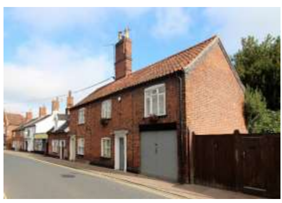
Nos.2 & 4 (even) Chaucer Street

See also No.22 Earsham Street its walls and outbuildings