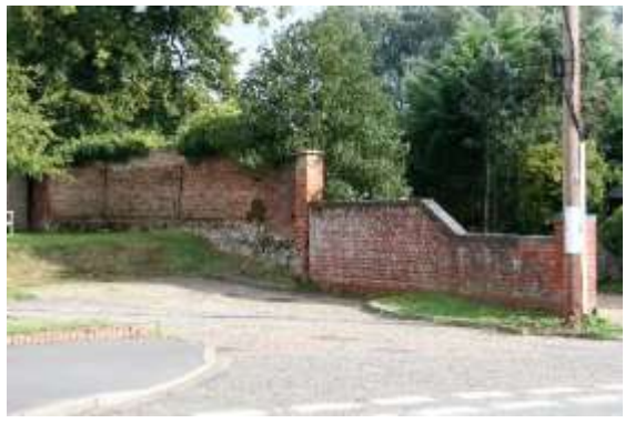
Boundary wall No.3 Staithe Road

No.3 Staithe Road (grade II). A detached house of later eighteenth, or early nineteenth century date. Of two storeys with a gabled attic lit by later windows. Suffolk yellow brick. Black pan tiled roof. Of three bays, the right-hand bay projecting slightly and having a gable. Twelve-light hornless flushframed sash windows. Those to the ground floor having segmental arched lintels. Five-sided canted bay window with casements to ground floor of gabled bay. Six-panelled door with wooden case. Elliptical fanlight Side door in wing wall with elliptical arch. Subsidiary structures to the right, now separated from No.3 by the entrance to a housing development, a red brick boundary wall of nineteenth century date with stone capped squaresection piers. Lower twentieth century section directly by street. Low painted brick retaining wall to front.