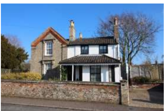
No.5-7 Flixton Road

Nos.1 & 3 Flixton Road, walls and gate piers. A semidetached pair of houses prominently located at the junction of Bardolph and Flixton Roads. Also visible from Laburnum Road. Shown on the 1885 Ordnance survey map and probably dating from c1870. Gault brick with a Welsh slate roof. Decorative corbelled eaves cornice, pilasters, and two storey canted bay windows. Original plate glass sashes largely preserved. Subsidiary Structures Good contemporary gault brick gate piers and low boundary wall. Tall nineteenth century red brick wall to Laburnum Road.