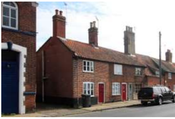
Nos.60-64 (even) Broad Street

No.58 Broad Street. A single storey cottage with a red brick façade and a red pan tile roof. Probably of mid to late eighteenth century date. The external joinery is now largely of late twentieth century date. Wedge-shaped lintels to door and window. Central rendered dormer with late twentieth century casement lighting attic. Massive red brick chimney stack.