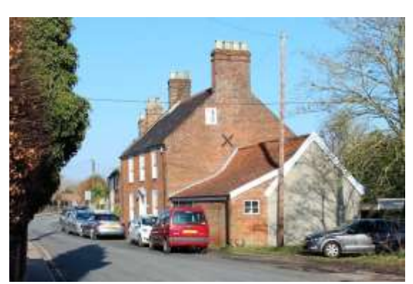
Wingfield House, No.14 Wingfield Street

See also No.67 Lower Olland Street (Ollands Character Area)