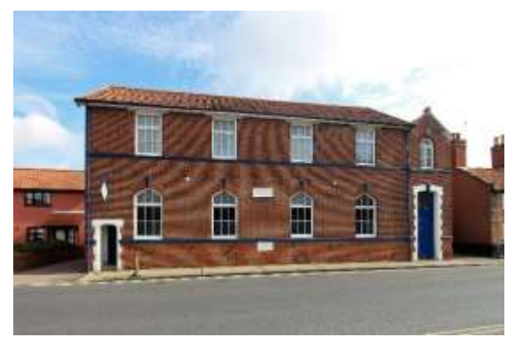
Former Saint Mary's Parish Rooms, Broad Street

Former Saint Mary's Parish Rooms, Broad Street. Former parish rooms and Sunday School built in 1882, but in a highly conservative style. Formerly with a Church of England Sunday School to the ground floor, and a mission hall above. Reputedly used as a soup kitchen in the two World Wars. Red brick with a shallow pitched red pan tile roof with blue tile stripes. Overhanging eaves with bargeboards to return elevations. Five bay, two storey, principal façade in a restrained gothic style. Painted stone dressings. Cambered brick arched windows to ground floor with painted stone rusticated keystones. Casement windows replaced with PVCu. Principal entrance in gabled bay to right with arched window at first floor level. Painted stone sill bands, with date stone below that to the ground floor. Closed c1939 and later a store and retail premises. Marked as a shoe factory on the 1969 Ordnance Survey map. Saint Mary's Church itself was declared redundant in 1977. Honeywood F, Morrow P & Reeve C, The Town Recorder, A History of Bungay in Photographs (Bungay, 1994) p14.