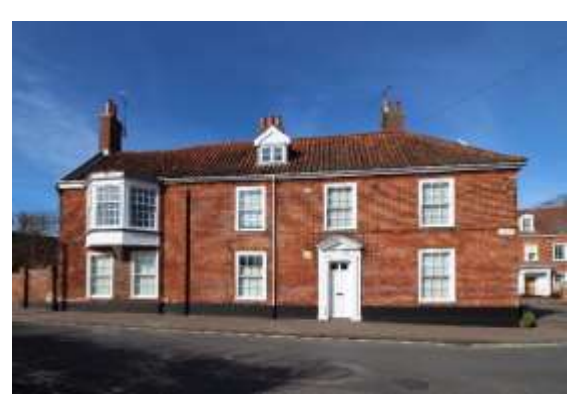
Nos.11 and 11a Wharton Street

The Hollyhocks No.9 Wharton Street and Garden Wall. A two-storey red brick house of c1820 with a black pan tiled roof. Symmetrical three bay façade with a blind recess above the doorcase. Sixpanelled front door. Twelve-light hornless sashes in flush frames. Gabled return elevations largely blind. Low red brick garden wall with taller return section.