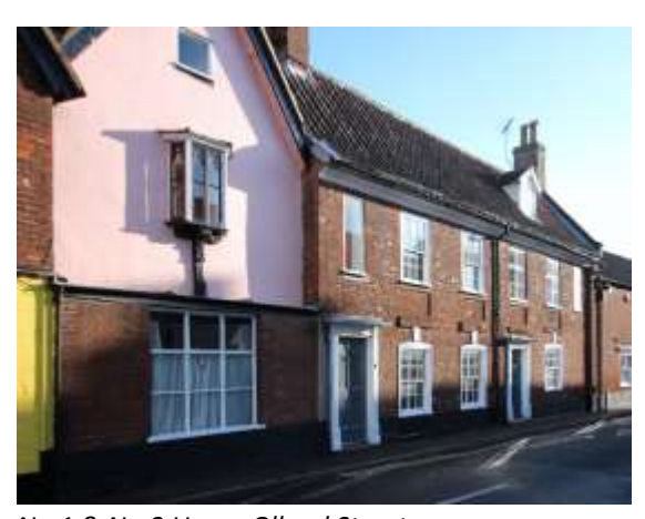
No.1 & No.3 Upper Olland Street

Ashby House, No.1 & Nos.3 &3a Upper Olland Street, (grade II) Early eighteenth century, of two storeys and an attic. One gabled dormer to No.3a. No.1 has a gabled end bay which is partially rendered. Eighteenth century of two storeys and an attic, one gabled dormer and gabled section to left. No.1 incorporates an older timber-framed structure of which one fully-moulded beamed and joisted ceiling remains in an excellent state of preservation. Gabled section stuccoed. Remainder red brick, plaster core cornice. Black pan tiled roof. interrupted brick band below first floor windows. Four windows in flush frames (two sash and two mullion transom casements) at first floor level, also half window left and half panel right, segmental arches at ground floor with stucco keys. Two sixpanelled doors, in wooden cases with pilasters,