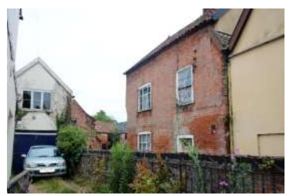
Rear range and outbuildings at No26 Bridge Street

shop windows described in the listing description now replaced by small pane sashes. No.26, stuccoed, with a nineteenth century wooden shop facia with pilasters retaining small glazed panelled windows. Panelled door. A single sixteen-light hornless sash above within a flush frame. Blocked doorway in gabled return elevation.