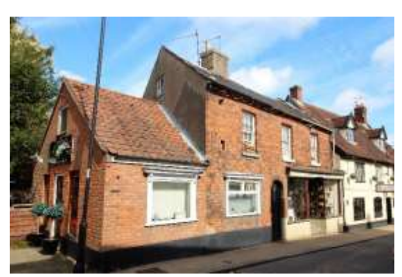
Nos.17-21 (odd) Bridge Street

twentieth century panelled doors with integral fanlights. No.7 retains two six-pane shop fronts which are possibly of mid nineteenth century date one beneath a segmental arched lintel. Single storey wing with a red pan tiled roof and a small pane casement window beneath a segmental arched lintel. Nos.1 to 7 (odd) form a group. Also Nos.1 to 5 (odd) form a group with Nos. 1 & 3 Nethergate Street.