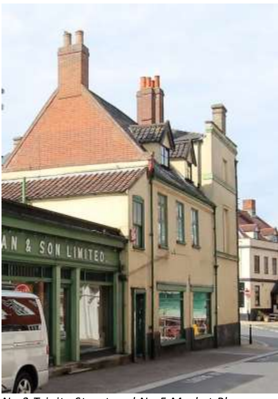
No.2 Trinity Street and No.5 Market Place.

No.2 Trinity Street (grade II). Seventeenth century and of two storeys with an attic lit by two gabled casement dormers. Limewashed brick, band cut away, plinth. Wooden cornice, black pan tiles, three first floor original mullioned and transomed casements. Six-panelled door in wing, left. Two late twentieth century plate glass shop windows to the ground floor. (See also No.5 Market Place).