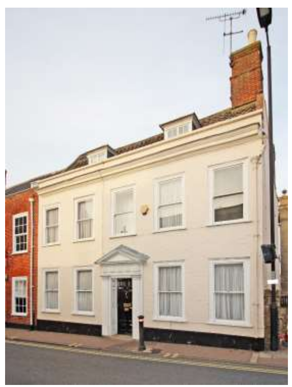
No.5 Trinity Street

No.5 Trinity Street (grade II). Eighteenth century, of two storeys with a colour-washed red brick façade. Moulded cornice and parapet. Black pan tiled roof. Symmetrical façade of five bays. Windows now later nineteenth century horned plate-glass sashes. Original flush frames with flat-arched lintels. Eightpanelled front door in a wooden case with fluted Doric pilasters, panelled reveals, triglyphs and a fret dentilled pediment. Gabled cross-wing containing fine staircase to rear. Twentieth century flat-roofed addition. Nos.1 to 19 (odd) form a group.