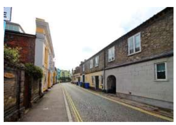
Nos. 1 &2 Bigod Flats, Broad Street

For the Three Tuns Inn see Earsham Street. For the Council Offices see Earsham House, No.12 Earsham Street, See also Nos.8-12 Earsham Street.