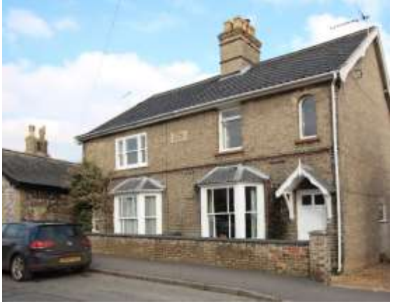
Pretoria Villas, Nos.19-21 (odd) Staithe Road

Dreyers Almshouses, Nos.9-17 (odd) Staithe Road (grade II). Single storey alms house block of 1848 faced in square knapped flint with gault brick dressings. Endowed by Eliza Dreyer for the widows of poor tradesmen. Seven-bay façade with gabled porches, outer bays gabled and slightly projecting. Gothick casement windows with three pointed lights. Octagonal shafts to chimneys with capping and drip moulded bases. Plinth. Near-flush-frame doors with cambered arches. Inscribed stone tablets in flank gables with date. Roof of octagonal Welsh slates, bargeboards with spear finials. Further gabled porches to return elevations.