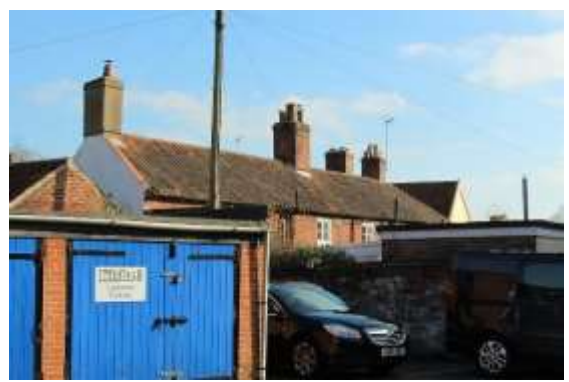
Nos.8 & 12 Turnstile Lane from Upper Olland Street

Nos.8 & 10 Turnstile Lane. The remaining section of what was once a courtyard of probably eight early nineteenth century dwellings. The surviving range appears now to form two houses but was probably originally four. Red brick, now partially rendered and with a red pan tiled roof. Dentilled brick eaves cornice. The remaining four cottages were demolished in the mid twentieth century.