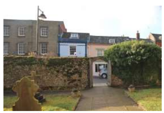
St Edmund's Churchyard Wall, St Mary's Street

mullioned surrounds. Two and three-light mullioned and transom windows to ground floor with leaded lights. Entrance under stone arch to right side of projecting gable. Side has similar paired and triple sashes and a projecting gable. Interior contains a corridor leading directly across the whole ground floor from entrance to sacristy of church (qv), to which the presbytery is linked. Together with the church, the Church of St Mary (including the remains of the Benedictine Convent) (qv), and walls in both churchyards (qv) the presbytery forms a very significant group in the centre of Bungay.