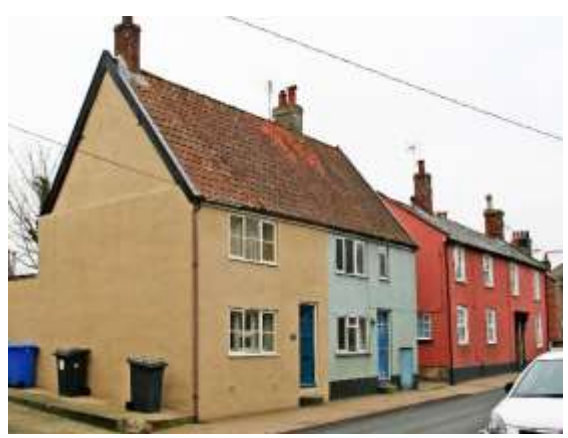
Nos.52 & 54 Lower Olland Street

No.48 Lower Olland Street. Four bay two storey house of possibly mid to late-eighteenth century date. Painted, and partially rendered red brick façades and a black pan tile roof. Dentilled eaves cornice. Doorcase with hood supported by decorative console brackets. Six-panelled door with rectangular fanlight above. Plinth. Late twentieth century uPVC windows in original openings. Cambered arched lintels to ground floor openings. Catslide roof over lower section to rear.