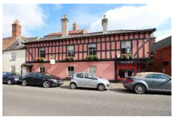
Oxnead, No.18 Broad Street

No.18a, Broad Street. Stable and coach house of later nineteenth century date. Latterly public library and now a dwelling. Not shown on the 1885 1:2,500 Ordnance Survey map, but on that of 1905. It replaces an earlier structure and was originally built to serve the house now known as 12-18 (even) Broad Street. Red brick with a Welsh slate roof. Four-light casement windows beneath shallow arched brick lintels. Boarded doors. Now converted to domestic use. Two storeys, single bay elevation to Broad Street and four bay return elevation to Brandy Lane. Garden wall earlier incorporated within Brandy Lane elevation. Further contemporary single storey red brick range to the rear. Lean-to garage addition of late twentieth century date. Possibly a curtilage structure to the grade II listed Nos.12-18 (even) Broad Street.