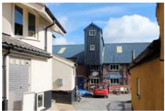
Broad Street façade of the Former Maltings, Nethergate Street

Former Maltings, Nethergate Street. A former maltings of c1900 date, with elevations to Nethergate Street and a courtyard off Broad Street. A rebuilding of an earlier maltings complex. The present structure postdates the 1885 Ordnance Survey map but is shown on that of 1905. Four storeys to Nethergate Street and two to Broad Street. Red brick with a blue corrugated metal roof. Nethergate Street façade of seven bays divided by pilasters. Casement windows and boarded doors beneath cambered brick lintels. The Broad Street façade has similar casements and is also divided by pilasters.