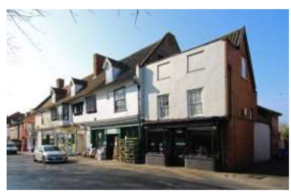
Nos.14-18 St Mary's Street

No.12 St Mary's Street (grade II) Later eighteenth century, three storey, red brick, with a stuccoed façade and a stone cope. Pan tiles. Good wooden shop facia with a central door and rounded corners to the flanking bays, later twentieth century glazing. Two twelve-light hornless sashes at first floor level. Two blank panels to second floor. Flush frame sash window in gable on norther return elevation. Nos.2-22 (even) form a group.