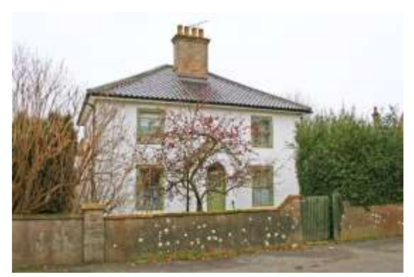
No.2 Bardolph Road

Henham Villa, No.2 Bardolph Road, boundary walls, and outbuilding. Early nineteenth century villa with later additions. Stuccoed with a hipped black pan tiled roof. Large gault brick central stack. Symmetrical façade with four-light, horned, plateglass sashes. Central gabled c1900 porch. Large late twentieth century rear addition. Flanking walls to either side that to Laburnum Road concealing a single storey outbuilding. Subsidiary Structures Low partially rendered gault brick nineteenth century wall to Bardolph Road and red brick wall to Laburnum Road. Nineteenth century outbuilding with red brick rear wall, single storey with chimneystack to Bardolph Road elevation. Map evidence suggests this is a c1900 heated greenhouse. Honeywood F, Morrow P, & Reeve C, The Town Recorder, A History of Bungay in Photographs (Bungay, 1994) p188.