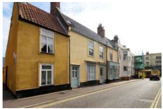
Nos. 6, 8 & 8a Broad Street

Nos. 6, 8 & 8a Broad Street (grade II). Of eighteenth-century date, No.8a is possibly a later addition. Two storey rendered street frontage, Nos. 6 & 8 having a black pan tile roof, the lower No.8a red pan tiles. Nos. 6 & 8 with three, twelve-light hornless sash windows at first floor level in flush frames with later lugged surrounds. No.8a has one casement at first floor level in a similar lugged surround. No.6 is flanked by two storey pilasters; square bay shop front. Smaller shop window to No.8 and partially glazed door in simple wooden surround. No.8A has an entrance with a modern glazed door in a narrow wooden case and a catslide roof to the rear.