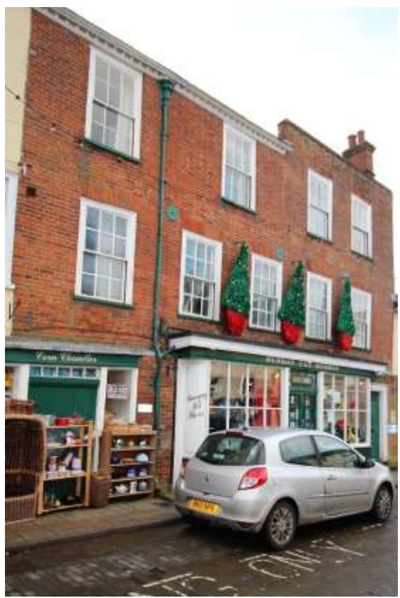
Nos.17-21 (Odd) Market Place

pilasters and entablature. Nineteenth century glazing bars, except to patterned fanlight. No.15 is described in the listing entry but its numbering is incorrect.