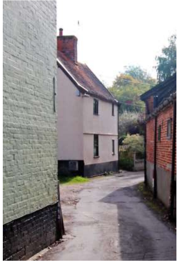
No.3 Castle Lane

For Scott House and garden walls see Earsham Street.