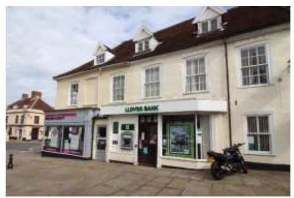
Nos. 9 & 11 Market Place

No.7a Market Place. Former outbuilding now a dwelling, probably of early nineteenth century date. Red and blue bricks. Two storeys. Original openings retained on ground floor. Shallow arched brick lintels. First floor opening probably an enlarged former taking-in door. Blind gabled return elevation.