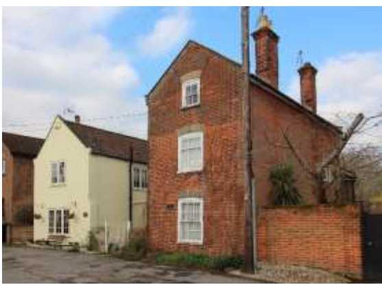
No.49 Staithe Road

Millers Cottage, No.47 Staithe Road. Detached dwelling with gable end to street probably dating from c1800. Two storeys. Rendered façade and red pan tiled roof. Late twentieth century casement windows. Red brick stack to western roof slope. Ground floor casement in gable replaces a door and a small sash window.