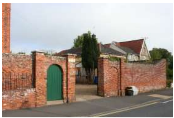
Front wall of courtyard, Trinity Hall, Staithe Rd

Entrance piers of front garden of Trinity Hall Staithe Rd (grade II). A later eighteenth-century pair of red brick piers, flanking the central entrance of the house. Stone caps and ball finials and pedestrian Gate of wrought iron with scroll ornament.