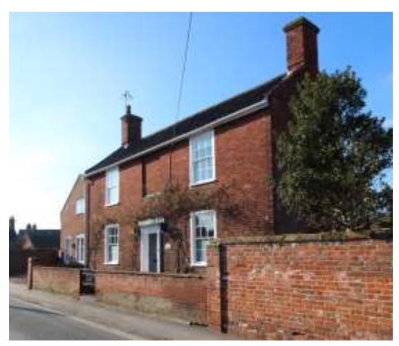
No.9 Wharton Street

Former Fire Station – see Lower Olland Street