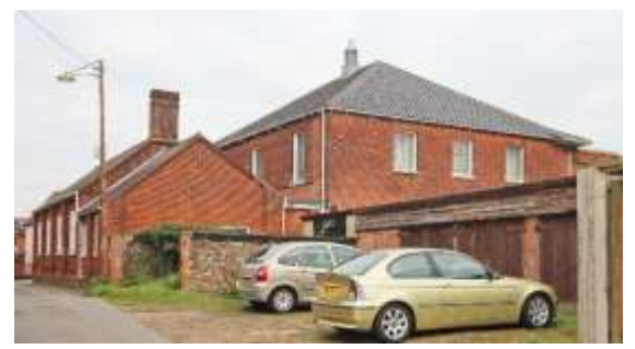
Rose Lane elevation of Emmanuel Church.