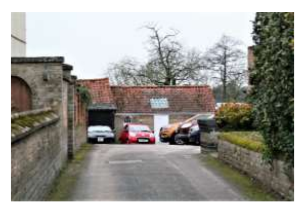
Outbuilding at No.8 Flixton Road