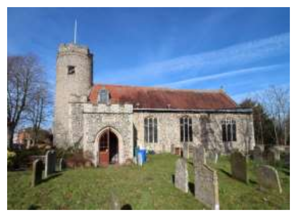
Holy Trinity Church, Trinity Street

Outbuildings to rear of No.19 Trinity Street (grade II) Eighteenth century, including former stables, red brick, pan tiles, wind vane, L-shaped on plan, of a single storey, part with loft. Nos.1 to 19 (odd) form a group.