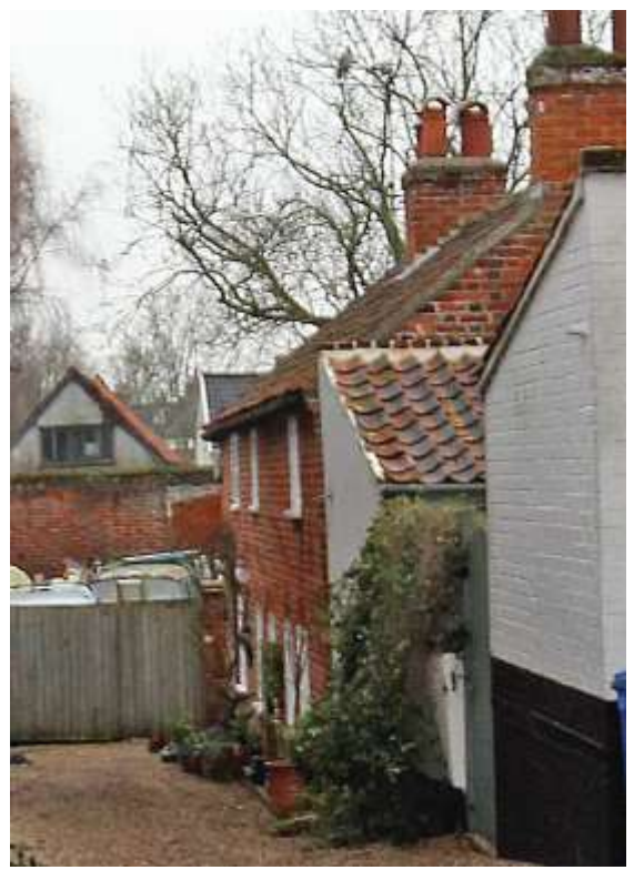
Nos.8-12 (even), Nethergate Street

Nos.8-12 (even), Nethergate Street A terrace of three c1800 cottages standing at a right-angle to the road within an alley to the rear of Nos.4 & 6. Built of red brick with a red pan tiled roof containing sloping roofed dormers with casement windows. Stack to gable at Nethergate Street end and one central ridge stack. Small pane casement windows beneath cambered brick lintels. Doors with similar lintels.