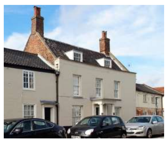
Cambridge House, No.19 Broad Street

small-paned casements in flush frames to the first floor. Twelve-light hornless sashes in flush frames to the ground floor, with flat arches. Two entrances with six-panelled doors, reeded pilasters and mutular cornices. Nos.15-19 form a group.