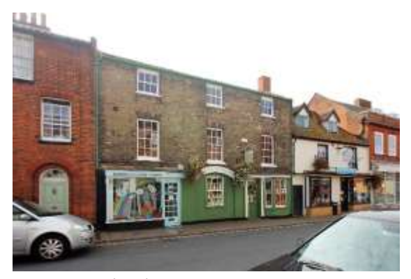
Nos.39 & 41 (odd), Earsham Street

Nos.39 & 41 (odd), Earsham Street (grade II). Early nineteenth century façade of Suffolk white brick. Of three storeys and three bays. At first floor level three twelve-light hornless sashes beneath wedge shaped lintels. Pan tiled roof. No.39 modern shop front. Central window, ground floor, with glazing bars, in wide panel with segmental arch. No. 41, four-panel door in wood case with consoles, canted bay window with plate glass sashes to right. Rear elevation of two storeys with red pan tiled roof slope. Nos.39, 41, 49, 51, 5, to 61 (odd) and Nos.65 to 73 (odd) form a group. The rear section of the plot on which this building stands is within the scheduled area of the Castle complex.