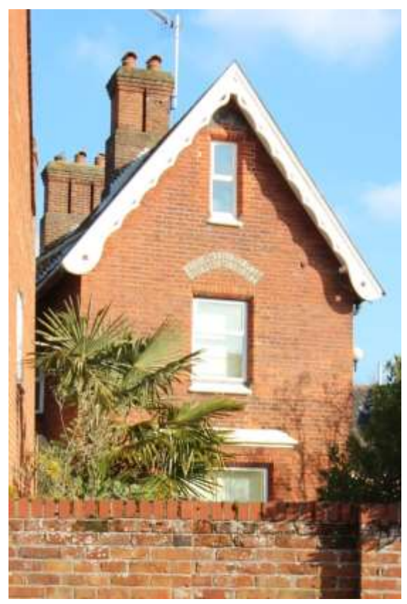
No.15 Upper Olland Street

No.13 Upper Olland Street. Detached villa of later nineteenth century date. Red brick with a black pan tiled roof. Two bay two storey façade with four pane plate-glass sashes to the first floor. Canted bay window to ground floor and partially glazed front door within doorcase with pilasters.