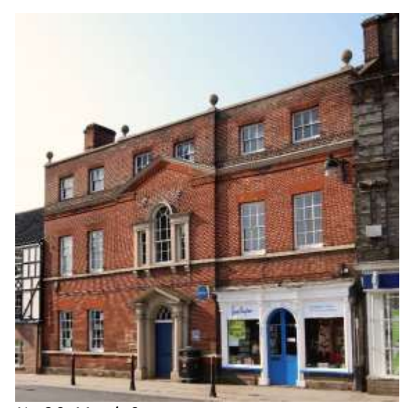
No.6 St Mary's Street

No.6 St Mary's Street and garden walls to rear (grade II). A substantial late eighteenth century townhouse. Of three storeys. Five-bay symmetrical principal façade of red brick with stone dressings. Central breakfront of a single bay, plinth, ground and first floor sill bands. The central breakfront has an open pediment at second floor level above a Venetian window with sashes. Open-pedimented doorcase with Doric 34 radius columns, triglyphs, and an arched fanlight. Six-panelled door. Twelvelight hornless sashes to ground and first floors, sixlight to second floor. Flat-arched lintels. Stone mouldings to cornice at second floor level. Stone cope with four stone ball finials. Fine midnineteenth century wooden office window to ground floor right of classical design, with consoles and an entablature. Central glazed entrance with arched door. Rendered rear range with twelve-light sashes. Subsidiary Structures. Good late eighteenth century red brick walls surrounding former rear garden. Nos.2 to 22 (even) form a group. Bettley, J, and Pevsner, N, The Buildings of England, Suffolk: East (London, 2015) p.157.