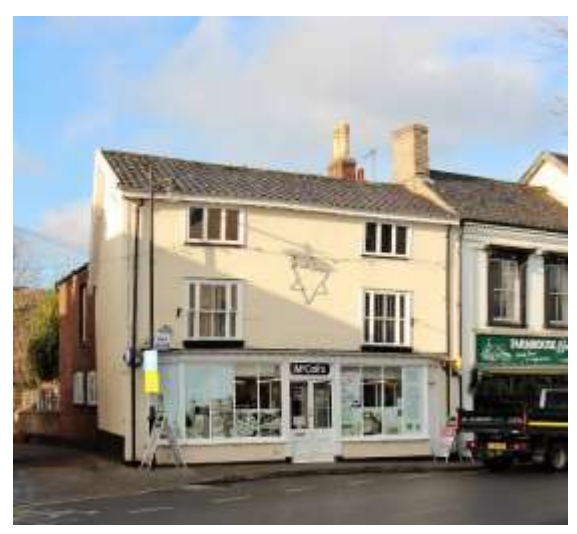
No.14 Market Place

No.12 Market Place. Former public house, now a shop, front range probably of mid-nineteenth century date. Painted brick with a black pan tile roof. Gault brick stack. Dentilled brick eaves cornice plain pilasters and heavy classical surrounds to first floor windows. Four-light horned sashes. Twentieth century shop facia. The Bell Inn closed c1920. The building plays an important and positive role within the setting of the grade II listed Nos.10 & 14 Market Place. The rear section of the plot on which this building stands is within the scheduled area of the Castle complex. Reeve C, Bungay Through Time (Stroud, 2009) p11. Honeywood F, Reeve C, & Reeve T, The Town Recorder, Five Centuries of Bungay at Play (Bungay, 2008) p144.