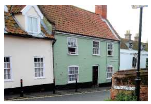
Nos.69-71 (odd), Earsham Street

Nos.69-71 (odd), Earsham Street (grade II). House, formerly three cottages of eighteenth century date, two storey with a lime washed brick façade. Standing on the corner of Castle Lane. Considerably altered since present listing description drafted. Front range facing Earsham Street formerly two cottages with a third in the rear outshot. Earsham Street façade formerly with two small pane sash windows to each floor with flush frames cambered arched lintels to ground floor. Six panelled door in a flush frame, formerly with a similar door to its immediate left. Inserted window immediately above. Roof formerly plain tiled but now covered with red pan tiles. Gabled return elevation to Castle Lane with two sashes. Rear elevation and two storey gabled rear outshot (formerly a separate small cottage No.1 Castle Lane) also visible from Castle Lane. Nos 39, 41, 49, 5l, 61 (odd) and Nos.65 to 73 (odd) form a group.