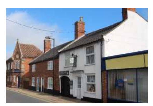
No.12 Chaucer Street

No.6 Chaucer Street. A small red brick structure externally of early to mid-nineteenth century appearance but possibly a re-casing of an earlier structure. Red brick with painted stone dressings and a black pan tile roof. Street frontage range of a single storey and attics, substantial largely nineteenth century rear range of two storeys. Hood moulds to window and door openings, gabled dormer to attic with elaborate bargeboards. External joinery largely replaced. Tall brick chimneystack to left-hand gable. In the nineteenth century the Two Brewers Public House.