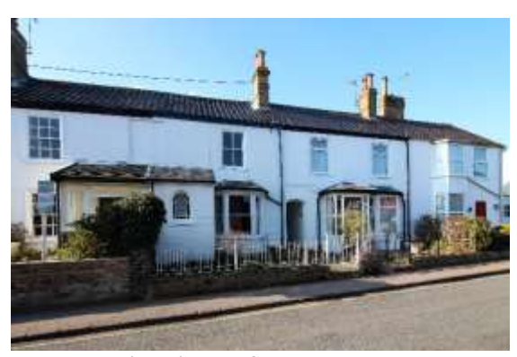
Nos.13-19 (Odd) Wingfield Street

Nos.5-11 (Odd) Wingfield Street (grade II). An early nineteenth century two storey terrace. Suffolk yellow brick, black pan tiles. Central blind panel at first floor level flanked by twelve-light hornless sashes within flush frames, flat arches at ground floor. Six-panelled doors in solid frames, set back in reveals, with blank tympana and arches. Nos.5 to 11 (odd) and No.14 form a group.