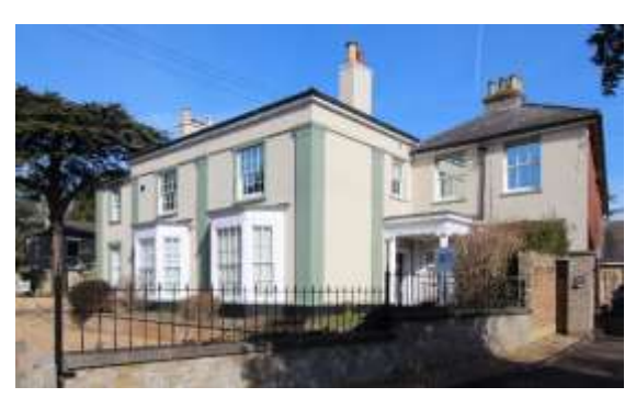
Dunelm House, No.65 Lower Olland Street

Nos.61 & 63 Lower Olland Street. A semi-detached pair of houses of mid nineteenth century date. Possibly originally one villa but map evidence suggests it has been divided since at least 1905. Two storeys. L-shaped, No.61 within projecting range at northern end with a hipped Welsh slate roof. Good Doric doorcase. Twelve-light hornless sashes beneath painted stone flat-arched lintels with rusticated panels. No.63 has parapet hiding roof and gable to southern bays. Twelve-light hornless sashes. Subsidiary Structures. Tall mid nineteenth century gault brick wall springing from entrance façade of No.63.