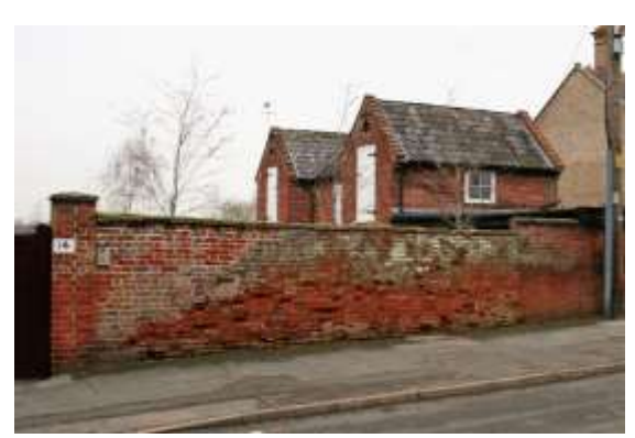
Stable at No.14 Flixton Road

The Red House, No.14 Flixton Road, stable and boundary walls. (grade II). Late-eighteenth century villa, facing south with return elevation to Flixton Road. Two storeys, red brick with an enriched wood cornice. First floor band, plinth, black pan tiles. Symmetrical three bay façade with sash windows beneath cambered flat arches. Louvred and panelled shutters. Sash windows, with glazing bars, set back in recesses to take shutters at first floor level with arches over the recesses. Three-light windows with glazing bars at ground floor level of the same width as the recesses over. Four-panelled door in wood case with panelled reveals. Formerly with porch. Subsidiary structures. Good nineteenth century stable range to rear. Red brick with a black pan tiled roof. Two storeys, the outer bays breaking forward and with gables. Boarded doors to ground and first floors and an oculus within each gable. Good red brick boundary wall to Flixton Road frontage of rear yard. The southern part of the wall fronting the garden appears to have been rebuilt. Nineteenth century red brick wall to northern return boundary.