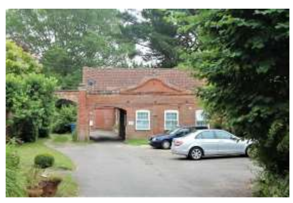
Former outbuildings Bridge House, Bridge Street

Earlier portion at rear, of two storeys and an attic, three dormers with segmental pediments. Brick, rendered. Tiles. Five flush-frame sash windows with glazing bars, and a canted oriel. four-panelled central door in wooden case with consoles. Second door, right, with six flush panels and a pedimented hood. Chateaubriand resided here in 1795 when the house was occupied by the Reverend J Clement Ives. Nos. 2, 4, 6a & 6b, 12 to 20 (even), 24 to 34 (even) 40 to 44 (even), 48 and 50 form a group. Bettley, J, and Pevsner, N, The Buildings of England, Suffolk: East (London, 2015) p.156-157.