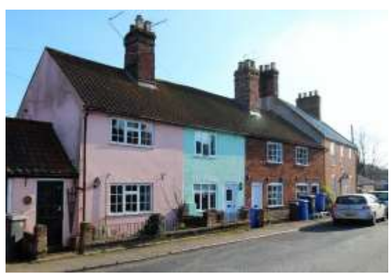
Nos.16-20 (even) Wingfield Street

Nos.5 to 11 (odd) and No.14 form a group. Subsidiary structures Red brick cart shed now garage range with boarded doors attached to right. Single storey. Red pan tiled roof possibly a re-front of an earlier structure. Reeve C, Bungay Through Time (Stroud, 2009) p88.