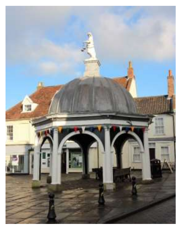
The Butter Cross, Market Place

For Aldeby House, No.1 Market Place see Nos.2-4 Broad Street