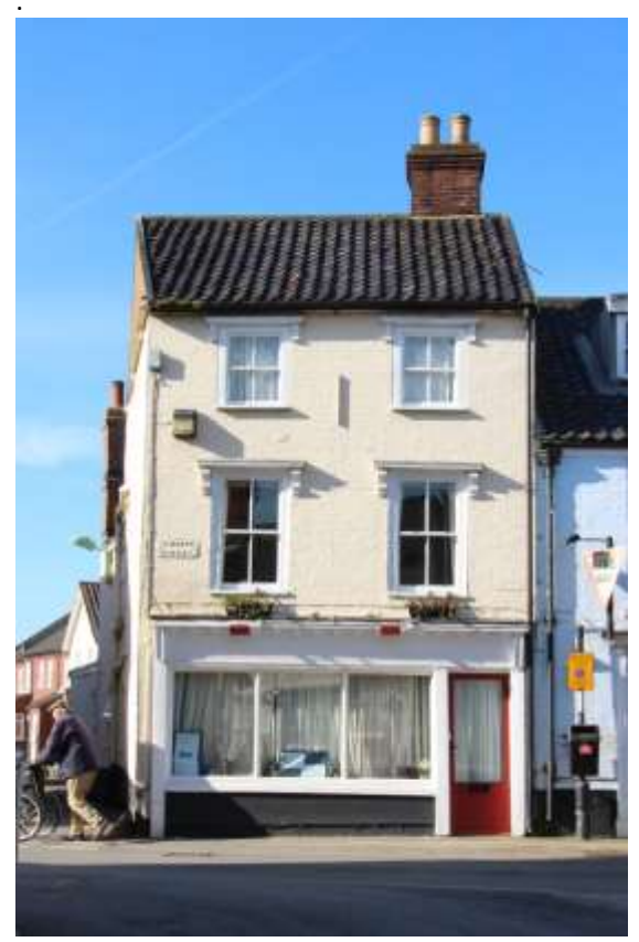
No.54 St Mary's Street

nineteenth and early twentieth centuries. The earliest reference to its dates from 1823 and the pub is believed to have closed c1912. Honeywood F, Reeve C, & Reeve T, The Town Recorder, Five Centuries of Bungay at Play (Bungay, 2008) p151.