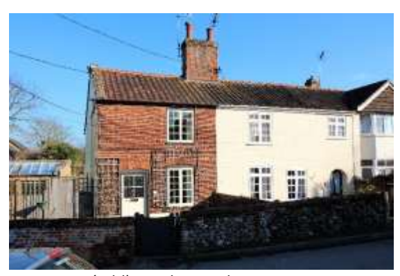
Nos.61-63 (odd) Staithe Road

Nos.1-23 (cons) The Maltings, Staithe Road. Former maltings of c1902 now apartments. Site shown as gardens on the 1892 Ordnance Survey map. Faced in painted red brick with an impressive asymmetrical fourteen bay principal façade divided by plain pilasters at first floor level. End bays gabled, and further three-bay section gabled towards centre. Steeply pitched Welsh slate roof with late twentieth century gabled dormers and roof lights. Late twentieth century window joinery of uniform design. Former taking-in doors to gables now balconied window openings. Low late twentieth century boundary wall.