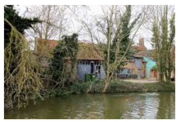
Outbuilding in Wharf Yard, Bridge Street

Outbuilding in Wharf Yard, Bridge Street Nineteenth century workshop range on the western side of Wharf Yard. Of one and a half-storeys and built in red brick, the lower section tard, red pan tile roof. Boarded doors. Boarded taking-in door to loft space and large central doors to river. Gabled return elevation to Bridge Street with first floor casement window. Single storey projecting range at southern end with corrugated roof. Probably a curtilage structure to the grade II listed No.48 Bridge Street.