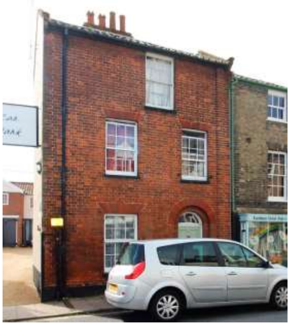
No.37 Earsham Street

The rear section of the plot on which this building stands is within the scheduled area of the Castle complex.