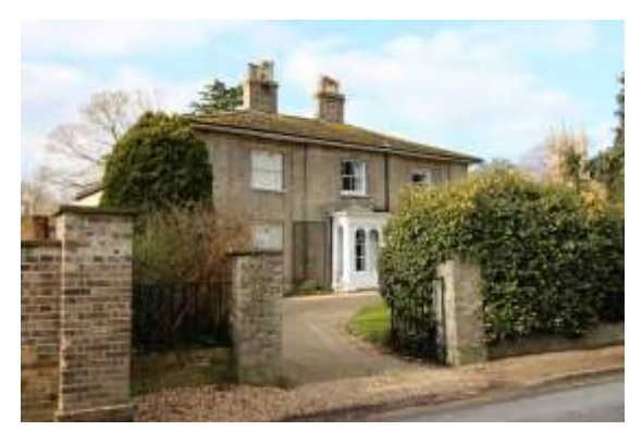
Trinity House, No.8 Trinity Street

western end. Red brick rear range. Subsidiary Structures Low brick boundary wall with iron railings.