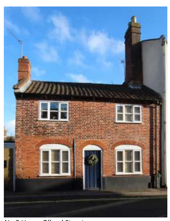
No.5 Upper Olland Street

No.3a early nineteenth century, two storey, red brick, shallow pitched red pan tiled roof. Flush Small pane casement at first floor level. Ground floor, flush frame sash, left, and shop front with glazing bars and wood case with channelled pilasters. Nos.1, 3, & 3a form a group with No.2 Lower Olland Street and No.56 St Mary's Street.