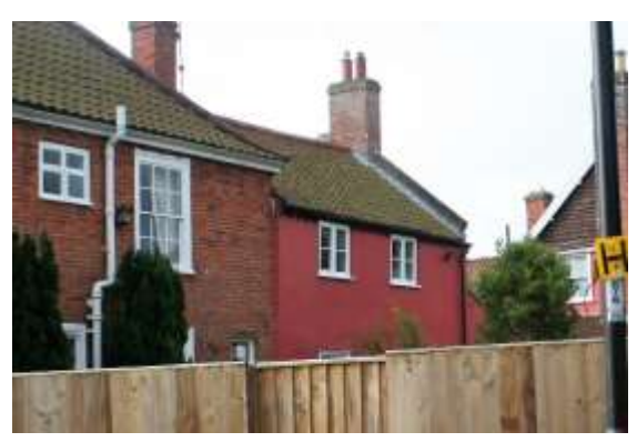
No.18a Trinity Street

No.16, 18a, & 18b Trinity Street (grade II). On the corner of Wharton Street. Two eighteenth century houses of two storeys with attics lit by three gabled dormers. Three-bay façade to Trinity Street. Twelve-light hornless sashes in flush frames, those to the ground floor with flat arched lintels. Red pan tiled roof. Six-panelled doors in wooden cases with dentilled cornices. No.16 has its entrance on the northern (return) elevation. This has three twelve-light hornless sashes in flush frames at first floor level and two similar below. Large nineteenth century casement to ground floor north-east corner. Nos.10 and Nos.14 to 18 (even) form a group. Nos.14 to 18 form a group with Nos.9, 11A & 11 Wharton Street.