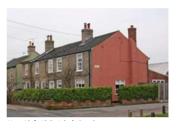
Nos. 10 & 12 St John's Road

No.4 St John's Road (grade II) An early nineteenth century cottage with a symmetrical two storey façade of limewashed brick. Hipped black pan tiled roof and dentilled eaves cornice. Red brick ridge stack. Horned four-light plate-glass sashes within flush frames, cambered flat arches at ground floor, four-panelled door in case with console brackets and an enriched cornice. Subsidiary structures. Low red brick wall to front with the plinths of former gate piers. Probably later nineteenth century.