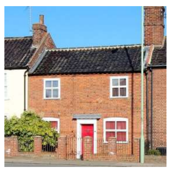
No.13 St John's Road

pilasters and six panelled doors. Late twentieth century casement windows within original openings with flat-arched lintels. Red brick stack to southern gable.