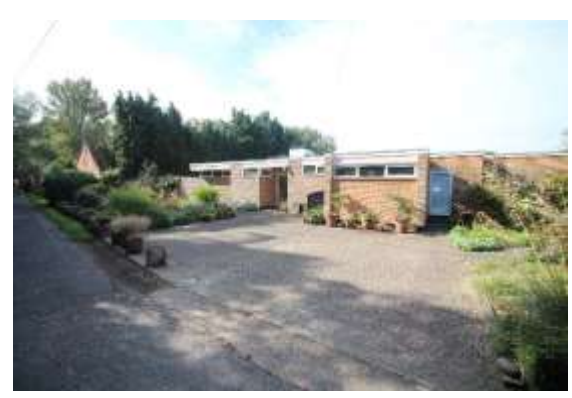
Willow Fen, Castle Lane

See Scott House, Earsham Street (Market Character Area) for garden walls, outbuildings, and folly tower on southern side of Castle Lane. See Market Character Area for Nos. 1-4 and the steps to Nathan's Yard. For No.1 Castle Lane see rear wing of Nos.69-71 (Odd) Earsham Street