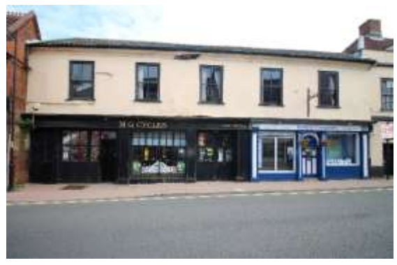
Nos.2a & 2b Earsham Street

Nineteenth and early twentieth century photographs show this flanked by three twelve pane sashes to each side, similar to those surviving above. Mid twentieth century pub facias now partially occupy the ground floor. Three bay Market Place façade with remodelled ground floor. This formerly had a central entrance door in a surround with fluted ionic columns flanked by windows with carved surrounds with pilasters. Interior: barrel vaulted ceiling with original plaster enrichments and cornice, well with date 1540 and old cellars dating from the earlier building which was destroyed in the 1688 fire. Nos.2 to 40 (even) form a group. Bettley, J, and Pevsner, N, The Buildings of England, Suffolk: East (London, 2015) p.154. Honeywood F, Morrow P & Reeve C, The Town Recorder, A History of Bungay in Photographs (Bungay, 1994) p62& 201. Reeve C, Bungay Through Time (Stroud, 2009) p18.