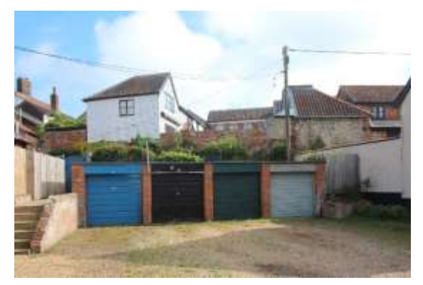
The Old Ironworks, Nathans Yard,

p.154. Reeve C, Bungay Through Time (Stroud, 2009) p45.