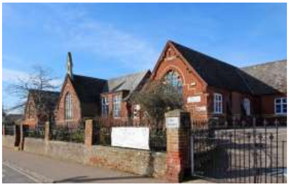
Bungay Primary School, Wingfield Street

Nos.21-23 (Odd) Wingfield Street and wall. A mid nineteenth century structure with the appearance, rendered brick with a Welsh slate roof. of once being a single villa, now two dwellings. No.21 retains much of its original appearance and has a canted bay with sash windows to Wingfield Street. The windows to No.23 have been replaced within the original openings. Central arched doorway with pronounced keystone within breakfront. Subsidiary Structures High nineteenth century painted brick wall with gate.