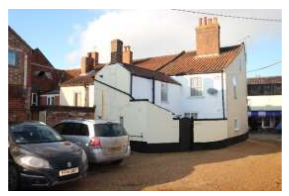
Rear elevation of No.37 Earsham Street