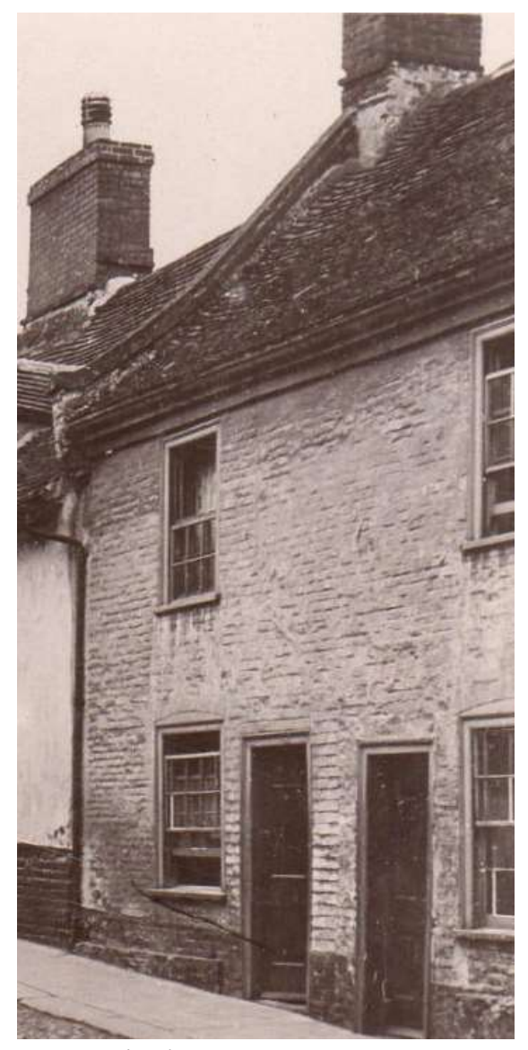
Nos.69-71 (odd), Earsham Street c1910

Nos.69-71 (odd), Earsham Street (grade II). House, formerly three cottages of eighteenth century date, two storey with a lime washed brick façade. Standing on the corner of Castle Lane. Considerably altered since present listing description drafted. Front range facing Earsham Street formerly two cottages with a third in the rear outshot. Earsham Street façade formerly with two small pane sash windows to each floor with flush frames cambered arched lintels to ground floor. Six panelled door in a flush frame, formerly with a similar door to its immediate left. Inserted window immediately above. Roof formerly plain tiled but now covered with red pan tiles. Gabled return elevation to Castle Lane with two sashes. Rear elevation and two storey gabled rear outshot (formerly a separate small cottage No.1 Castle Lane) also visible from Castle Lane. Nos 39, 41, 49, 5l, 61 (odd) and Nos.65 to 73 (odd) form a group.