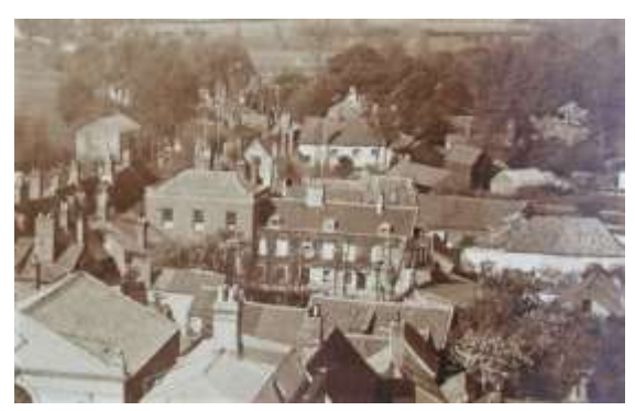
Bridge House from St Mary's Tower c1920

Bridge House No.34 Bridge Street (grade II). A substantial multi-phased townhouse of late sixteenth century origins with a large extension fronting Bridge Street of c1776. Further additions to rear. The house stands at a right-angle to the Street with a principal façade facing south. In 1688 it was occupied by Gregory Clarke who was rebuilding it at the time of the great fire, from which it was saved by the watchman. The western portion (fronting Bridge Street) is of red brick and of two high storeys. Its Bridge Street façade is of two bays with a blankwindow panel to right on each floor, with flat arches, and stone sills. Horned twelve-light sashes to left-hand bay. Cornice, below a parapet with a stone cope. Hipped roof. Entrance front to south of three bays, with hornless twelve-light sashes. Sixpanelled door with arched patterned radial fanlight above, set within a doorcase with panelled reveals, fluted Doric columns, triglyphs, and a dentilled pediment.