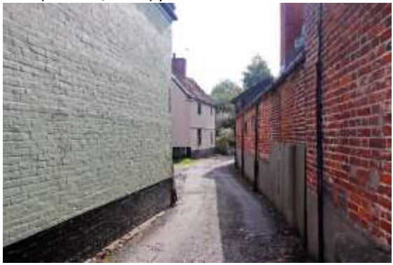
Castle Lane showing the outbuildings to Scott House on the right.