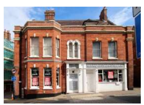
No.3 Market Place

No.3 Market Place (grade II). Former Queen's Head Inn, altered to form bank and manager's house in the late nineteenth century, now shops. Late seventeenth or early eighteenth century with a later nineteenth century red brick façade. The Buildings of England suggests an original building date of 1698. Of two storeys and attics. Market Place façade of three bays with corner pilasters and a parapet. Left hand bay with a two-storey canted bay window. Plate-glass sashes with gauged flat arches and ornamental keystones. Hipped machine tile roof, with two hipped dormer casements. Former bank entrance to ground floor right (records from 1871) Central entrance to former residence, six-panelled door with stucco case with consoles. Foliate cornice below parapet with stone cope. Western return elevation to Bridge Street, is of eighteenth century date, stuccoed and painted. Two flush framed sash windows at ground and first floors with glazing bars. Casement window in gable. Nos. 1 to 11 (odd), Nos. 11A, 13 and 17 to 21 (odd) form a group together with the butter cross. Bettley, J, and Pevsner, N, The Buildings of