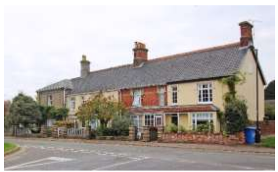
Nos.2-6 (even) Flixton Road

Nos.2-6 (even) Flixton Road and boundary walls. Terrace of three substantial houses c1900, attached to the rear of the larger and slightly earlier No.8. Red brick with stone dressings. Black pan tile roof