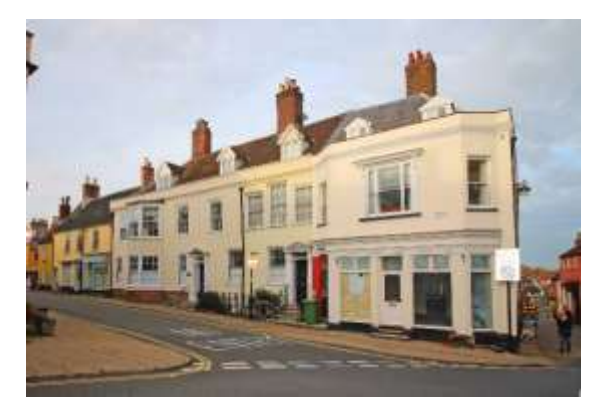
Nos.2 & 4 Broad Street with No.1 Market Place

For the former maltings adjacent to the Fisher Theatre see Nethergate Street