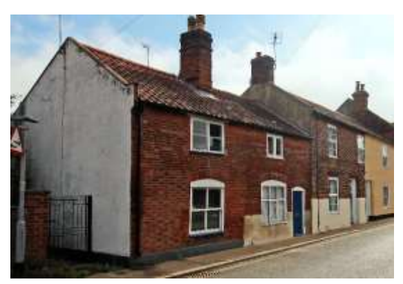
No.28 Chaucer Street

stack on return elevation of a highly decorative design. Left hand bay has cart entrance into a central courtyard. Lower late twentieth century rear range faced in red brick with a weatherboarded first floor. Bettley, J, and Pevsner, N, The Buildings of England, Suffolk: East (London, 2015) p.155. Honeywood F, Morrow P & Reeve C, The Town Recorder, A History of Bungay in Photographs (Bungay, 1994) p149.