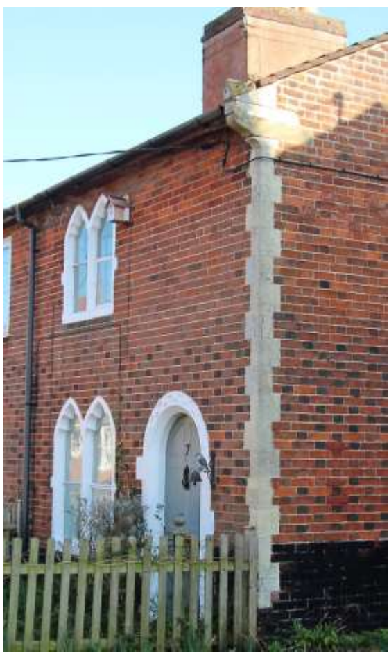
No.7 Southend Road

to front corner. Subsidiary Structures No.26 retains its original red brick front garden walls. Good stretch of stone rubble walling to garden of No.22 possibly of a much earlier date than the terrace.