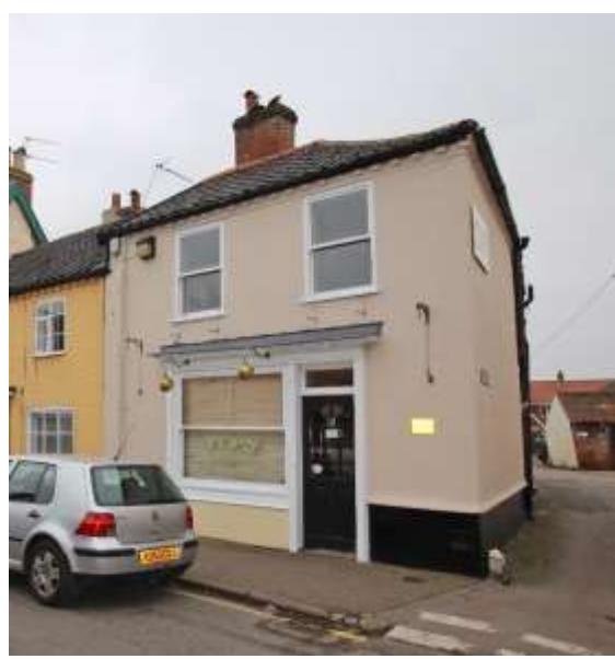
No.18 Upper Olland Street

Nos.14-16 (even) Upper Olland Street (grade II). An early eighteenth century block of two storeys and an attic. Five identical gabled dormers with bargeboards and casement windows. Six-bay façade of painted stucco over a plinth; red pan tiled roof. Twelve-light hornless sashes within flush frames at first floor level. No.14, six-panelled door in wooden case with pilasters, mid-twentieth century wooden shop front right. No.16, small early nineteenth century shop window with cornice. Nos.2 to 10 (even), 14, 16, and Nos.20 to 24 (even) form a group.