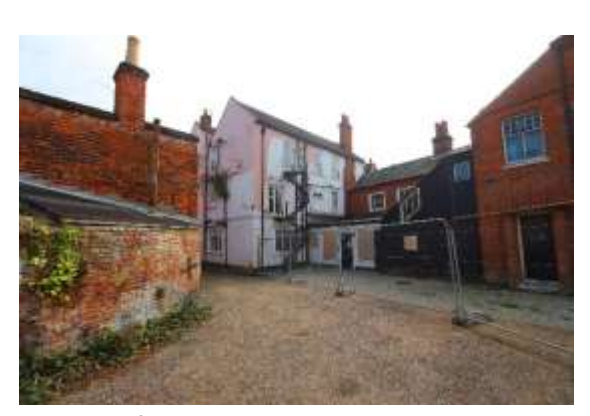
Courtyard façade, No.2 Market Place

No.2 Market Place and former Odd Fellows Hall to rear (grade II). An early eighteenth century former coaching inn which was until 2015 known as the Kings Head Hotel. It consists of two parallel ranges with a long rear wing facing a courtyard. The Market Place façade is of early eighteenth century date, and of three storeys and seven bays. Of painted red brick, with a plinth and a dentilled brick eaves cornice. Black pan tiles to roof and a single red brick ridge stack. Seven hornless twelve-light sash windows at first floor level with flush frames and flat arched lintels. Four similar windows to the second floor and six to the ground floor. Off-centre Six-panelled door in wooden Doric case with pilasters, a keyed architrave and a pediment. Return elevation with twin gables. Rear elevation with twelve-light hornless sashes to first and second floors.