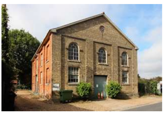
The Old Chapel (Former Bethesda Chapel)

otherwise red brick structure; Welsh slate roof. Bay window to left hand house now removed and original front door opening blocked. Present front door formed from a former window. Otherwise late nineteenth century joinery largely intact. An important part of the setting and history of the GII listed No.24 Earsham Street. Reeve C, Bungay Through Time (Stroud, 2009) p53. Honeywood F, Morrow P & Reeve C, The Town Recorder, A History of Bungay in Photographs (Bungay, 1994) p149.