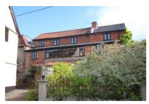
No.4 Castle Lane

pitched red pan tiled roof. Possibly of mid eighteenth century origins. Plat band above ground floor windows. Central red brick ridge stack. Dentilled eaves cornice. Entrance in gabled eastern return elevation. Four-panelled door with glazed upper lights. Western return elevation blind. Plain wooden bargeboards. Flat roofed single storey rear addition on site of earlier range shown on historic Ordnance Survey maps. Later twentieth century wooden casement windows. Group value with the grade II listed Nos.69-73 (odd) Earsham Street.