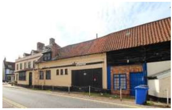
Broad Street façade of Nos.2a & 2b Earsham Street

Nos.2a & 2b Earsham Street. A pair of shops with a painted and rendered brick façade above a continuous early to mid-twentieth century shop facia. Rear elevation faces Broad Street. The shop front replaces sash windows shown on c1910 photographs, however the present shop facia was extant by mid 1920s. Formerly part of the Three Tuns and shown as part of the Inn on the 1905 1:2,500 Ordnance Survey map. Shown as separate premises on the 1927 1:2,500 map. Five hornless plate glass sashes at first floor level. Shallow pitched roof with twentieth century black tile roof. Moulded eaves cornice. Shallow pitched black pan tile roof. The listing status of this range is not entirely clear.