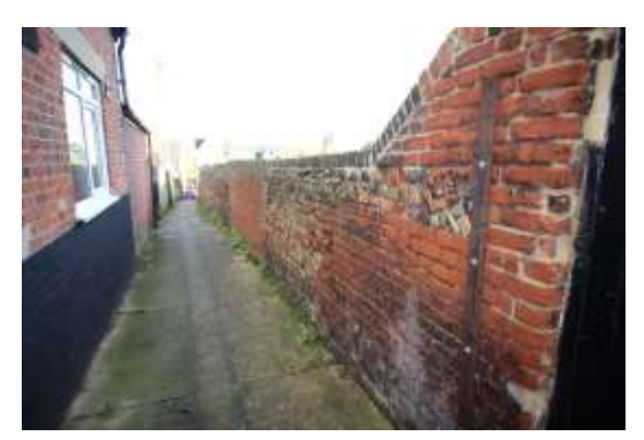
No.46 Broad Street walls to Stone Alley