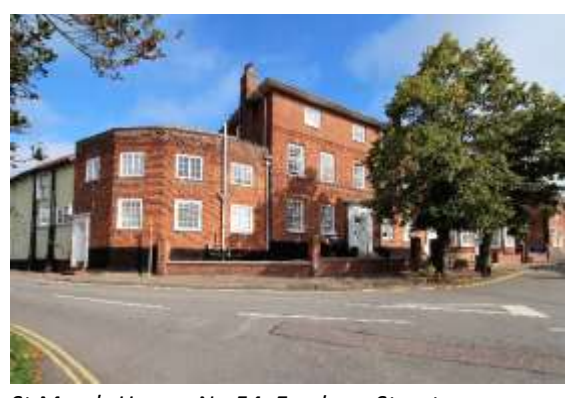
St Mary's House, No.54, Earsham Street

Nos.50-52 (even) Earsham Street. A pair of red brick terraced houses probably of early nineteenth century date. Left hand house of two bays and three storeys, right hand house of a single bay. Four light plate-glass sashes to first floor beneath wedge shaped gauged brick lintels. Similar windows above with later barge-boarded dormers above. Crenelated bow windows to ground floor with curved four light sashes. (Nb. These are not shown on c1900 photographs but are on views of c1914). Panelled doors with glazed upper lights within simple wooden door surrounds. They form part of a good group with the grade II listed, St Mary's House, No.54, Earsham Street and No.44.