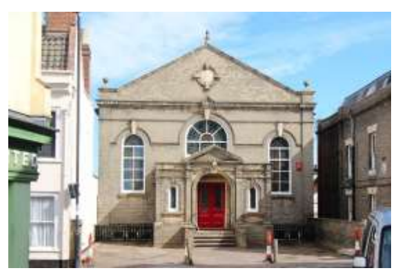
Former Wesleyan Methodist Chapel, Trinity Street

No.5 Trinity Street (grade II). Eighteenth century, of two storeys with a colour-washed red brick façade. Moulded cornice and parapet. Black pan tiled roof. Symmetrical façade of five bays. Windows now later nineteenth century horned plate-glass sashes. Original flush frames with flat-arched lintels. Eightpanelled front door in a wooden case with fluted Doric pilasters, panelled reveals, triglyphs and a fret dentilled pediment. Gabled cross-wing containing fine staircase to rear. Twentieth century flat-roofed addition. Nos.1 to 19 (odd) form a group.