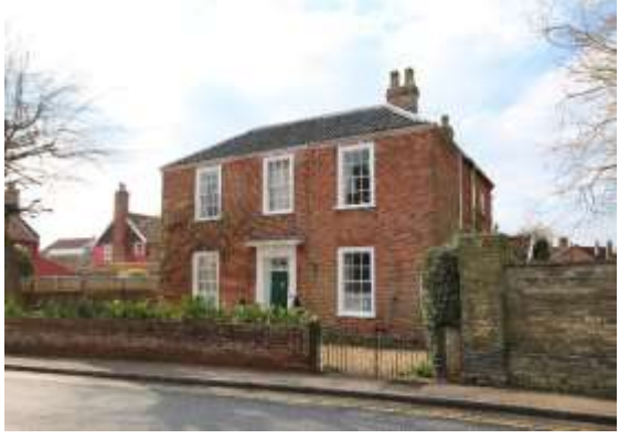
No.10 Trinity Street

Trinity House, No.8 Trinity Street and boundary wall to front. (grade II). An early to mid-nineteenth century villa of two storeys. Faced in Suffolk white brick. Hipped roof with a wide eave's soffit, now covered in late twentieth century machine tiles. Entrance façade of three bays with wide pilasters close to the outer corners. The central bay projects slightly and the windows of the outer bays set in shallow panels. Three hornless sash windows with narrow margin lights to first floor. Flat arched lintels and painted stone sills. Six-panelled door with arched radial-bar fanlight. Doric porch with exaggerated entasis to columns, and an enriched entablature. Porch enclosed at later date with glazed screen and doors. Subsidiary Structures include a nineteenth century Low white brick wall to Trinity Street with twentieth century railings. Four square- section gate piers.