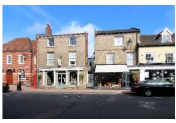
Nos.38-40 Earsham Street and telephone box

Nos.32-36 (even) Earsham Street (grade II). Eighteenth century two storey and attic, one gabled dormer. Stucco on brick, lined and painted. Pantiles. Five windows, sash, some with glazing bars and flush frames. Fine early nineteenth century wooden shop facia with three Doric columns and entablature, modern glass. Smaller modern shop front, left. Nos. 2-40 (even) form a group. Reeve C, Bungay Through Time (Stroud, 2009) p44.