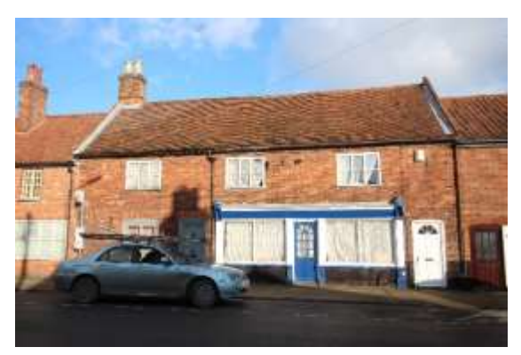
No.30 and 30a Broad Street

Nos.22-24 (even) Broad Street. A terrace of three two storey cottages, now two. Faced in red brick with gault brick lintels to door and window openings. Late twentieth century black pan tile roof covering. Red brick ridge stack to spine wall between cottages. A further ridge stack has probably been removed. No.22 has metal casements within original window openings and a glazed metal door. No.24 with four light horned sashes in heavy moulded frames. Return elevation has red brick lintels to openings and plain bargeboards. This short terrace forms an important part of the setting of the grade II listed Nos.20 and No.18.