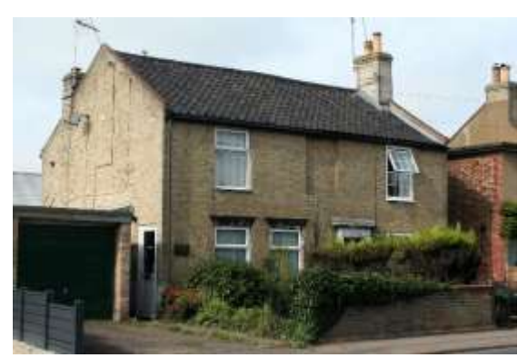
Nos.14 & 16 St John's Road

crenelated early twentieth century red brick boundary wall to the street. All other walls appear to be of late twentieth century date.