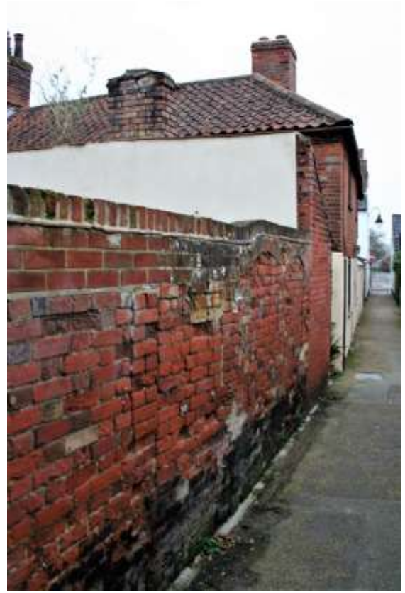
Wall to west of No.8

Outbuilding and Wall to west of No.8. Red brick boundary wall on the north side of Turnstile Lane, incorporating the remains of a partially demolished former cottage. Probably of early nineteenth century date. The structure was partially demolished after the publication of the 1970 Ordnance Survey map.