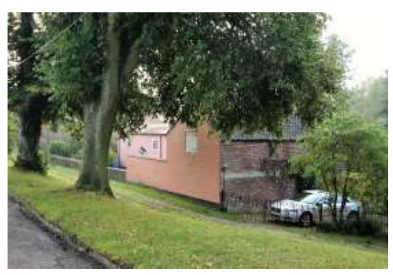
Outbuilding to Waveney Cottage, Outney Road

door in wooden case with reeded pilasters, fluted caps, radial bar fanlight and dentilled pediment. Lower range to rear at a right-angle with pan tiled roof. To its west a high rendered red brick wall, which is now painted linking the house to a contemporary stable or cart shed with a central arched opening and a hay loft at attic level. Single gabled bay to Outney Road with boarded taking-in door. Black pan tiled roof. Good red brick wall enclosing front courtyard.