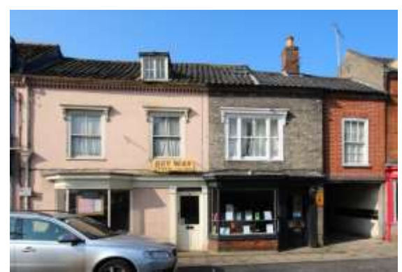
Nos.30-32 St Mary's Street

dormers. Red brick with a black pan tiled roof. No.20 has a shallow later nineteenth century canted splay bay at first floor level with centre glazing bars, and a cornice. Mid-twentieth century splayed shop front. No.22, two flush framed twelvelight sash windows at first floor level with glazing bars and cambered brick lintels. Early nineteenth century wooden shop front with pilasters. Rendered return gable with parapet. To the left a single-bay two storey wing with wide vehicle way under. Heavily repointed red brick. At first floor level a hornless twelve-light sash within a flush frame. Red brick single-storey outbuilding of possibly early nineteenth century date at rear of site close to Castle Orchard. Nos.2 to 22 (even) form a group.