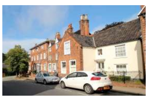
No.48 Earsham Street

No.44 Earsham Street. An early nineteenth century terraced house formerly attached to the hall of Bungay Grammar School but now free standing. Red brick, which was formerly rendered, with external joinery sympathetically replaced late twentieth century. Edwardian photographs show that the first-floor window was formerly of three lights with small leaded panes within. The door had glazed upper panels as today.