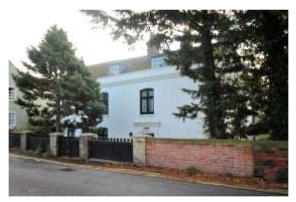
Scott House, No.73 Earsham Street