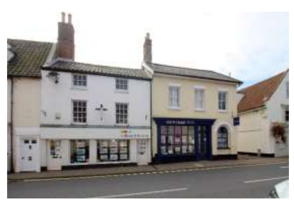
No.21 Earsham Street

No.19 Earsham Street (grade II). Probably of later eighteenth or early nineteenth century date. Painted brick façade of three storeys and two bays. Twelve-light sash windows with glazing bars and gauged flat arches, at first floor level. Six-light sashes above. Shallow pitched pan tile roof, tall red brick ridge stack. Late twentieth century shop front. Nos.1 to 19 (odd) form a group. The rear section of the plot on which this building stands is within the scheduled area of the Castle complex.