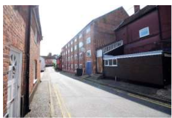
Former Maltings, Nethergate Street

Former Maltings, Nethergate Street. A former maltings of c1900 date, with elevations to Nethergate Street and a courtyard off Broad Street. A rebuilding of an earlier maltings complex. The present structure postdates the 1885 Ordnance Survey map but is shown on that of 1905. Four storeys to Nethergate Street and two to Broad Street. Red brick with a blue corrugated metal roof. Nethergate Street façade of seven bays divided by pilasters. Casement windows and boarded doors beneath cambered brick lintels. The Broad Street façade has similar casements and is also divided by pilasters.