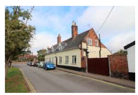
Cherry Tree House, Outney Road

Cherry Tree House, No.4 Outney Road and red brick boundary wall. A former public house, which was in use as such from at least the beginning of the nineteenth century, it closed in the mid twentieth century. Probably of mid eighteenth century date altered c1930. Single storey with attics, rendered red brick façade with quoins and a black pan tile roof. Eight bay street frontage with two doorways and six small paned metal casement windows set back beneath flat lintels. The window openings to the right of the central doorway are not shown on late nineteenth century photographs. Three gabled dormers with late twentieth century casements. Two substantial red brick ridge stacks. Good red brick wall to Outney Road frontage. Reeve C, Bungay Through Time (Stroud, 2009) p49.