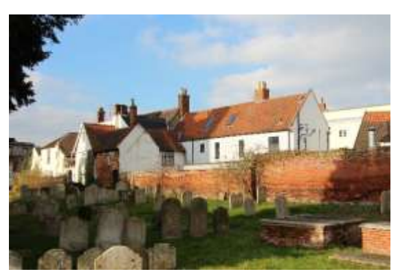
Churchyard elevation of Nos.2 & 4 Cross Street

Nos.2 & 4 Cross Street (grade II). Of later seventeenth century date with nineteenth century alterations. Of two storeys, with an attic lit by three gabled dormers. Roughcast on brick, with a coved cornice. Black pan tiled roof slope to Cross Street façade and red to the churchyard. Five mullioned and transomed casement windows at first floor level, and a near flush framed hornless sash window with glazing bars. No.2, has a late nineteenth century former pub facia of wood with pilasters to the right-hand bay (former Crown Inn), its other shop facia is probably a later twentieth century copy. No. 4, also has a late twentieth century shop front in the style of that of No.2. At the rear of No.2 a two-storey red brick eighteenth century range with a red pan tile roof and a single casement window at first floor level which abuts No.15 Market Place. The rear elevation which is visible from Saint Mary's Churchyard forms an important part of the setting of the grade I listed church. Honeywood F, Morrow P & Reeve C, The Town Recorder, A History of Bungay in Photographs (Bungay, 1994) p158. Honeywood F, Reeve C, & Reeve T, The Town Recorder, Five Centuries of Bungay at Play (Bungay, 2008) p141.