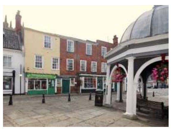
Nos.15-19 (odd) Market Place

No.13 Market Place. A mid-nineteenth century painted red brick structure with a parapeted gable to the Market Place. Four bay return elevation to Cross Street. Single horned plate-glass sash to first floor and shop facia with pilasters below. Cross Street elevation of four narrow bays with a dentilled brick eaves cornice and a single central casement window with a shallow arched brick lintel to the first floor. Blocked doorway and window to ground floor left, and two twentieth century casement windows. All with shallow arched brick lintels. Single storey rear outshot containing a door and a casement window. Red pan tile roof. Forms an important part of the setting of neighbouring listed structures.