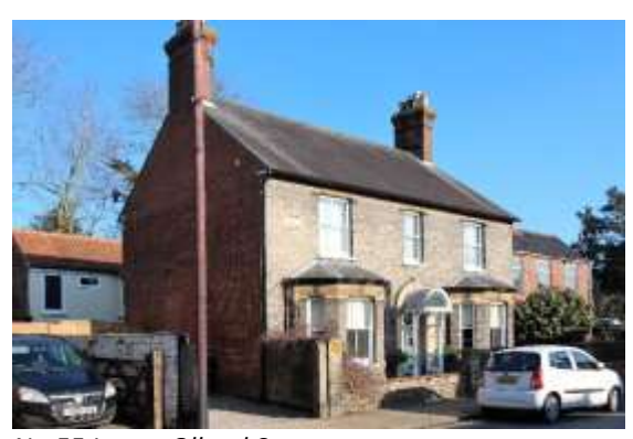
No.55 Lower Olland Street

No.53 Lower Olland Street. The former Ship Inn. A public house from 1791 or earlier, renovated and rendered 1923 when the fenestration was also altered. Closed 1980s. Red pan tiled gambrel roof with a single flat roofed dormer. Roughcast façades with leaded casement windows to first floor. Ground floor windows have had the leaded panes removed. Central partially glazed front door. Lower rear range possibly of early nineteenth century date. Red pan tiled roof. Casement windows. Honeywood F, Reeve C, & Reeve T, The Town Recorder, Five Centuries of Bungay at Play (Bungay, 2008) p166-167.