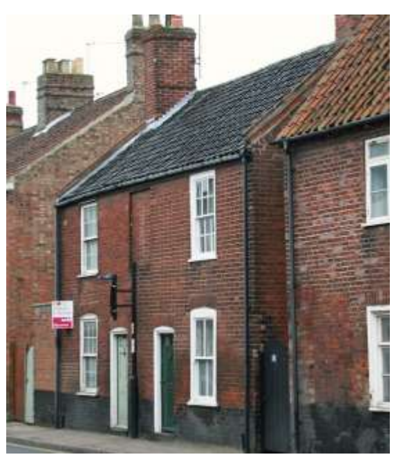
Nos.18 &20 (even) Lower Olland Street

eighteenth-century range at the southern corner of Turnstile Lane. Red brick, now partially rendered, with a red pan tiled roof. Dentilled brick eaves cornice. Turnstile Lane elevation gabled and rendered with largely late twentieth century casement windows. Four-panelled door. Blocked door opening in northern end of Lower Olland Street elevation. Poor quality late twentieth century windows in original openings. No.12 with twelve-light hornless sashes beneath flat arched lintels. Four-panelled door with a single, nineteenth century casement window above.No.14 has a nineteenth century wooden casement at first floor level and one sixteen-light sash. Four- panelled door. Cambered brick lintels. No.16 now entered from southern return elevation but with blocked opening on Lower Olland Street façade. Cambered brick lintel to ground floor window. Late twentieth century casement to ground floor and possibly nineteenth century casement above.