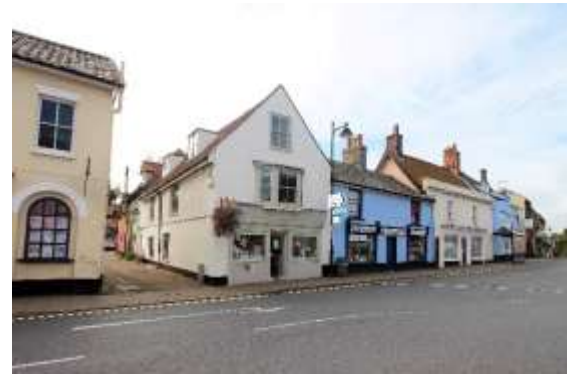
No.29 Earsham Street

Recorder, A History of Bungay in Photographs (Bungay, 1994) p147.