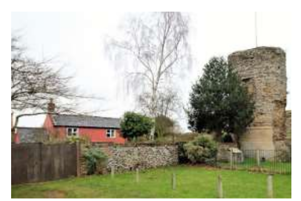
Keeper's Cottage, Castle Orchard

Keeper's Cottage and boundary wall, Castle Orchard (standing on scheduled land). A nineteenth century cottage with extensive later twentieth century alterations and additions, built within the remains of the Castle complex and within the scheduled ancient monument. Its rear retaining wall is part of the Castle wall. Original cottage has rendered walls and a black pan tiled roof. Red brick ridge stack. Two storeys with a single storey wing. Twentieth century flat roofed porch. Return gable with twentieth century timber oriel window to first floor. Lower red pan tile roofed range to rear. Twentieth century casement features. windows. Subsidiary Good nineteenth century flint wall.