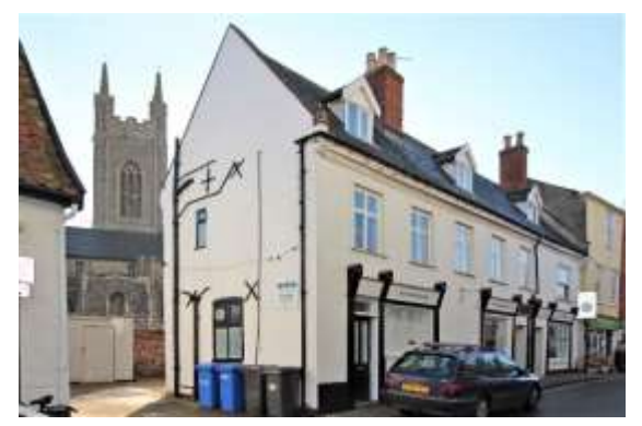
Nos.2 & 4 Cross Street

Nos.2 & 4 Cross Street (grade II). Of later seventeenth century date with nineteenth century alterations. Of two storeys, with an attic lit by three gabled dormers. Roughcast on brick, with a coved cornice. Black pan tiled roof slope to Cross Street façade and red to the churchyard. Five mullioned and transomed casement windows at first floor level, and a near flush framed hornless sash window with glazing bars. No.2, has a late nineteenth century former pub facia of wood with pilasters to the right-hand bay (former Crown Inn), its other shop facia is probably a later twentieth century copy. No. 4, also has a late twentieth century shop front in the style of that of No.2. At the rear of No.2 a two-storey red brick eighteenth century range with a red pan tile roof and a single casement window at first floor level which abuts No.15 Market Place. The rear elevation which is visible from Saint Mary's Churchyard forms an important part of the setting of the grade I listed church. Honeywood F, Morrow P & Reeve C, The Town Recorder, A History of Bungay in Photographs (Bungay, 1994) p158. Honeywood F, Reeve C, & Reeve T, The Town Recorder, Five Centuries of Bungay at Play (Bungay, 2008) p141.