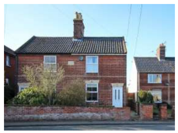
Nos.48-52 (even) Staithe Road

Nos.42-44 (even) Staithe Road. A pair of detached houses of Fletton brick c1904-10. No.42 has a Fletton and red brick façade to Staithe Road, red brick dressings, and replacement casement windows within original openings. A relatively early use of Fletton brick. No.44 with a gault brick elevation to Staithe Road with red brick dressings. Horned sash windows, and a partially glazed fourpanelled front door. Gabled wooden lattice porch. Gault brick chimney stack with red brick dressings. Fletton brick gable end. Good quality late twentieth century addition to rear. Replaced pan tile roof coverings. C1900 red brick boundary wall to Staithe Road.