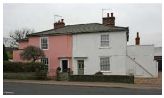
Nos.22 & 24 St John's Road

recently rebuilt. Stone rubble wall with red brick dressings separating Nos. 20 & 22, rear section of red brick. Late twentieth century garage to No.20 not included.