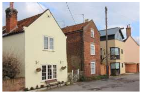
No.47 Staithe Road

workmanship, and in general the Inn is free from modernisation. Seventeenth century bolection moulded mantel. Honeywood F, Reeve C, & Reeve T, The Town Recorder, Five Centuries of Bungay at Play (Bungay, 2008) p104-106 & 168-169.