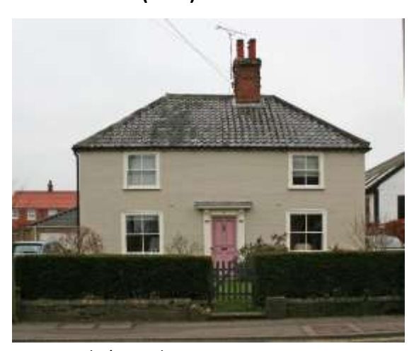
No.4 St John's Road

No.4 St John's Road (grade II) An early nineteenth century cottage with a symmetrical two storey façade of limewashed brick. Hipped black pan tiled roof and dentilled eaves cornice. Red brick ridge stack. Horned four-light plate-glass sashes within flush frames, cambered flat arches at ground floor, four-panelled door in case with console brackets and an enriched cornice. Subsidiary structures. Low red brick wall to front with the plinths of former gate piers. Probably later nineteenth century.