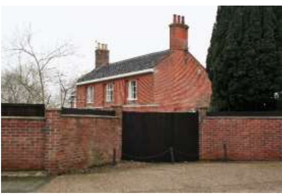
No.14 Flixton Road

Nos.10 & 12 Flixton Road and boundary walls. A semi-detached pair of late nineteenth century gault brick villas. Map evidence suggests that they were constructed between 1885 and 1905. Black pan tiled roof with decorative ridge pieces. Single storey canted bay windows to ground floor. Doors within arched recessed porches. No.12 has its original plate glass horned sashes. The windows to No.10 have been replaced with casements. Subsidiary Structures Notable stepped gault brick wall of c1890 to south side of No.12. Similar though less decorative wall to north of No.10. red brick wall with gault brick piers to Flixton Road. Gault brick gateway with arched door opening to north side of No.10. red brick garden walls to rear.