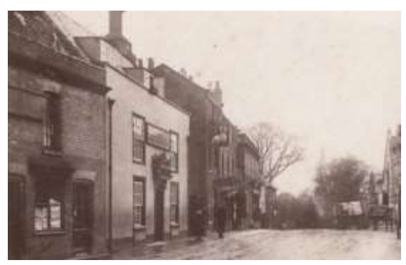
The Castle Inn, No.35 Earsham Street c1910

Small pane horned sash windows to the ground floor with similar hornless windows above. Sixpanelled door, set within simple wooden doorcase with console brackets. Window above inserted in early to mid-twentieth century. Black pan tile roof with two large flat roofed dormers. Twin gabled return elevation, the front gable crowned by massive gault brick stack with two octagonal flues. Two, small late-twentieth century horned sashes to the front range, and three casements to lower rear range. Further red brick ridge stack of late nineteenth or early twentieth century date. A refronting of an early eighteenth century but much altered building. At the rear facing the Castle is a lower parallel range with a red pan tiled roof and nine light casement windows which dates from c1800.