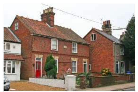
'Laurel Villas', Nos.38-40 Lower Olland Street

Subsidiary Structures Low red brick boundary wall to Lower Olland Street with square-section piers.