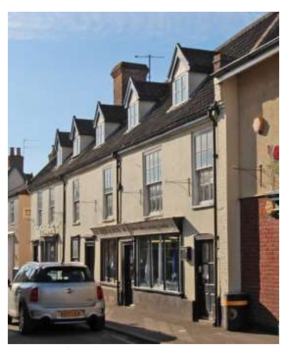
Nos.14-16 (even) Upper Olland Street

Nos.14-16 (even) Upper Olland Street (grade II). An early eighteenth century block of two storeys and an attic. Five identical gabled dormers with bargeboards and casement windows. Six-bay façade of painted stucco over a plinth; red pan tiled roof. Twelve-light hornless sashes within flush frames at first floor level. No.14, six-panelled door in wooden case with pilasters, mid-twentieth century wooden shop front right. No.16, small early nineteenth century shop window with cornice. Nos.2 to 10 (even), 14, 16, and Nos.20 to 24 (even) form a group.