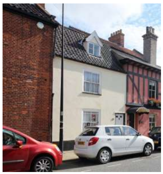
No.18a Broad Street

Long range of attached outbuildings backing onto Brandy Lane which are probably of early eighteenth century or earlier origins, although at least partially rebuilt. Painted red brick with red pan tile roofs. Range nearest Broad Street of two storeys with boarded taking-in door at first floor level. Twentieth century dormers. Central range of narrow red bricks with a steeply pitched red pan tile roof. Single storey with attic and elaborate tumble or diaper work to gable ends. Blocked taking-in door to gable facing Nethergate Street at attic level. Lean-to addition to garden side. At the Nethergate Street end is an extensive rebuilt structure now with a flat roof and blocked door and window openings to Brandy Lane and a large garage opening to Nethergate Street.