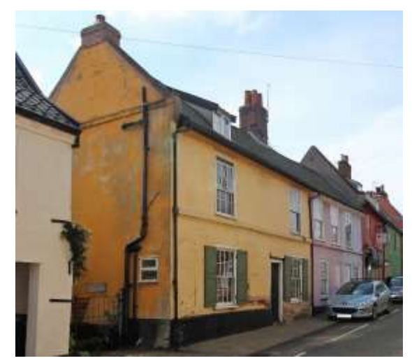
Nos.18-22 (even) Bridge Street

Nos.16-22 (even) Bridge Street (grade II). Three cottages, two within front range and No.22 at the rear. Early eighteenth century, of two storeys and an attic. Black pan tiled roof with a single flat roofed dormer to No.20. Colour-washed brick, with a moulded brick platt-band. Part with later applied projecting plinth. Nos.16-18, have their original sixteen-light hornless sashes at first floor level. To the ground floor centrally placed four panelled doors flanked by similar flush framed hornless sash windows with flat lintels. No.20 has two sixteenlight hornless sash windows to each floor. Those to the ground floor having panelled shutters. Centrally placed six-panelled door with near-flush frame. Scarring of former window openings with segmental heads visible in front wall to both ground and first floors of No.20. Lower range to the rear. Nos.2, 4, 6a & 6b, 12 to 20 (even), 24 to 34 (even) 40 to 44 (even), 48 and 50 form a group.