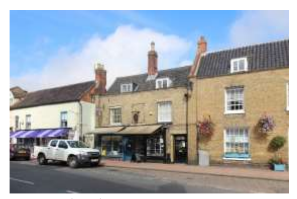
Nos.28-30 (even) Earsham Street

Recorder, A History of Bungay in Photographs (Bungay, 1994) p63.