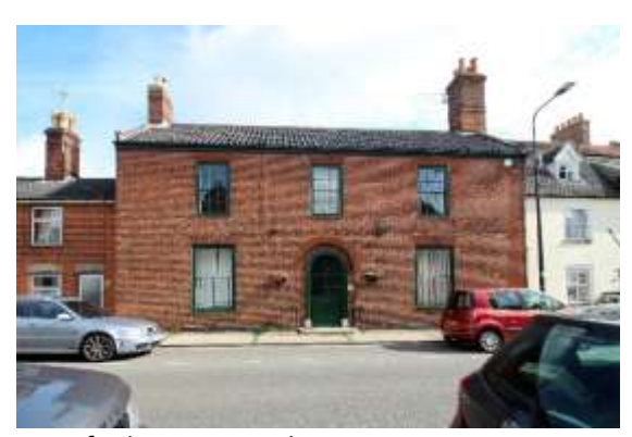
Cransford, No.20 Broad Street

No.18a Broad Street. Probably an early to midnineteenth century reworking of an earlier dwelling. Its Broad Street façade is rendered with a steeply pitched black pan tile roof. A single horned sash window to each floor with margin lights. Six panelled front door, with glazed upper panels. Gabled dormer with casement window and bargeboards. No.18a forms an important part of the setting of the grade II listed Nos.18 & 20 Broad Street.