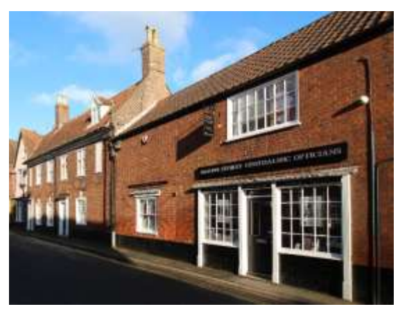
Nos.1-3a (Odd) Upper Olland Street

roundels, and a mutular cornice. Interior: fine enriched early eighteenth century mantel and cupboard with enrichment and 1/4 domed head with shell ornament.