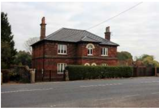
No.55 St John's Road

floor. The full height gabled and jettied porch projection has a similar first floor window and a small sash in the gable. The oak door is in original condition, divided into ten panels by moulded battens, in heavy moulded frame with enriched stop-chamfer. Original wooden case lock, bolts and fittings remain. Twentieth century multiple splayed bay window to ground floor, right. The stair is a fine example of the period in oak with turned balusters, moulded rail, strings, and newels. No. 53, has its entrance on the south-eastern face, it is of two storeys and an attic which is lit by a window within the gable. Timber-framed and plastered, mullioned and transomed casements, (one blocked but showing frame). The St John's Road façade has hornless sash windows in flush frames in the gabled wing. Six-panelled door with an arched radial bar fanlight. Twentieth century bay window ground floor. Good Adam type mantel. Bettley, J, and Pevsner, N, The Buildings of England, Suffolk: East (London, 2015) p.158.