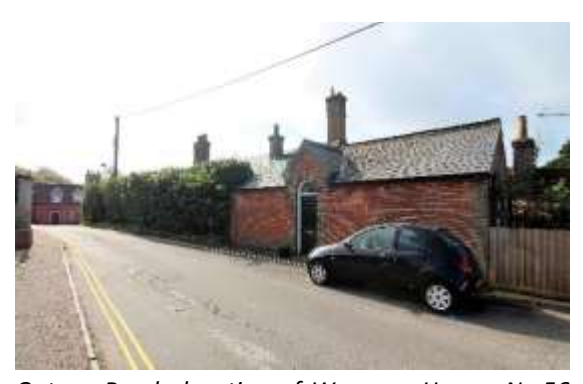
Outney Road elevation of Waveney House, No.56 Earsham Street

Early eighteenth century red brick walled garden fronting onto Outney Road, 14 to 18 feet high with brick on end sloping cope, and with panels formed by brick pier buttresses and stepped plinth or splayed base widening. Cope rounded on outer side above band with toothing. Nos. 54, 56, wing adjoining, walls and ancillary building together with the bridge over the river Waveney form a group.