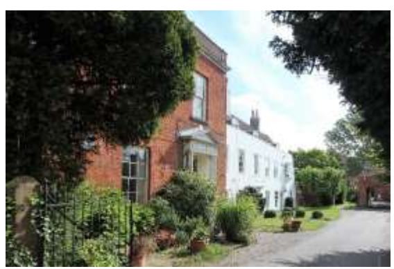
Bridge House No.34 Bridge Street

painted brick with a coved cornice. Nos.30-32 with platt band below first floor windows. Sash windows to Nos.28 and 30 now horned late twentieth century replacements. Those to No.32 nineteenth century plate-glass sashes. Early nineteenth century bowed shop windows to Nos.28 & 32, but the original glazing bars to No.28 only. Doorcase to No.28 replaced in twentieth century and containing a partially glazed twentieth century door. Nos.30-32 have c1800 wooden doorcases, No.30 with a sixpanelled door with cornice frieze and architrave. No.32 door with 4 flush panels. Low cobble boundary wall with red brick dressings between Nos.26 & 28. Large altered outbuilding to rear of No.28 of two storeys with a gable end to Bridge Street. Nos.2, 4, 6a & 6b, 12 to 20 (even), 24 to 34 (even) 40 to 44 (even), 48 and 50 form a group.