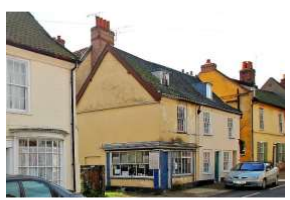
Nos.24 & 26 (even) Bridge Street

Nos.16-22 (even) Bridge Street (grade II). Three cottages, two within front range and No.22 at the rear. Early eighteenth century, of two storeys and an attic. Black pan tiled roof with a single flat roofed dormer to No.20. Colour-washed brick, with a moulded brick platt-band. Part with later applied projecting plinth. Nos.16-18, have their original sixteen-light hornless sashes at first floor level. To the ground floor centrally placed four panelled doors flanked by similar flush framed hornless sash windows with flat lintels. No.20 has two sixteenlight hornless sash windows to each floor. Those to the ground floor having panelled shutters. Centrally placed six-panelled door with near-flush frame. Scarring of former window openings with segmental heads visible in front wall to both ground and first floors of No.20. Lower range to the rear. Nos.2, 4, 6a & 6b, 12 to 20 (even), 24 to 34 (even) 40 to 44 (even), 48 and 50 form a group.