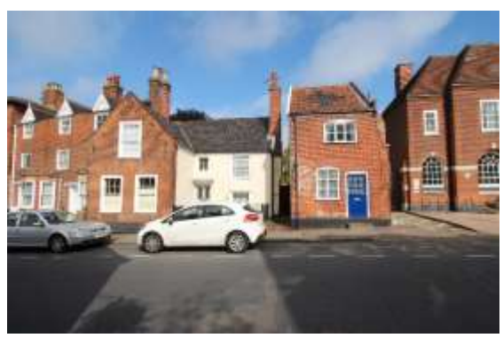
No.44 Earsham Street

No.42 Earsham Street. Built as a post office C1938-40 and attributed by The Buildings of England to David N Dyke. A good example of interwar classical design. Clad in red brick with stone dressings. Plain tile roof. Two storeys and five bays with three bay central breakfront. Arched openings with keystones to the ground floor. Central pair of panelled double doors beneath semi-circular fanlight. Flanking the doors are c1940 small pane metal casements. Small pane wooden sashes to first floor. The structure occupies the site of the former Bungay Grammar School which occupied the site from c1580 to c1925. Its forecourt undisturbed since the demolition of the Tudor school is possibly of considerable archaeological interest. Bettley, J, and Pevsner, N, The Buildings of England, Suffolk: East (London, 2015) p.154.