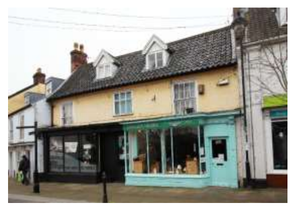
No.48 St Mary's Street

No.48 St Mary's Street (grade II). Eighteenth century, of two storeys and an attic. Black pan tiled roof with two gabled dormers. Painted brick. Three-bay rendered façade with sixteen-light flush-framed sashes to the outer bays and a casement window to the centre. Coved cornice. Midnineteenth century shop front with cornice and consoles. Nos.42 to 56 (even) form a group.