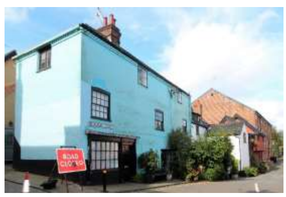
No.1 Nethergate Street

Nos.1 & 3 Nethergate Street. (grade II) On the corner of Bridge Street. No.1 is an eighteenthcentury brick structure of three storeys. Limewashed with a black pan tiled roof which is hipped at its eastern end. Diagonal toothed eaves cornice. Casement windows to second floor with original leaded lights. Sixteen light hornless sashes to first floor beneath cambered lintels. Casement windows to ground floor. Good quality wooden former shop facia with pilasters, glazing bars, and a six-panelled door near the corner with Bridge Street. No.3 (the lower section to the right). Black pan tiled roof with a single small flat roofed dormer. Projecting gabled wing and windows. Nos.1 & 3 form a group with Nos.1 to 5 (odd) Bridge Street