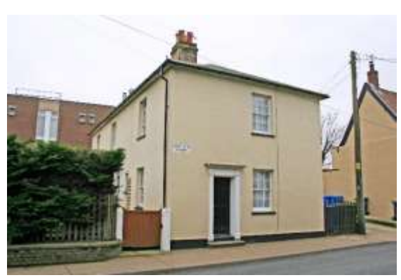
Nos.58 & 60 Lower Olland Street

Nos.52 & 54 Lower Olland Street (grade II). An early seventeenth century dwelling now altered and subdivided. Of two storeys and an attic, timber-framed and plastered with a plinth. Steeply pitched red pan tiled roof. Later twentieth century casement windows and doors. Old photographs show that it was thatched until c1920. Return elevations blind. Nos.46, 48, 52, 58 and No.60 form a group