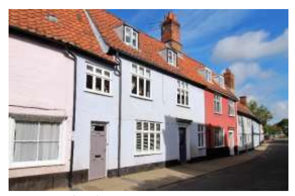
Nos. 35-37 (odd) Bridge Street

Nos.31-33 (odd) Bridge Street (grade II). Seventeenth century, and of two storeys with an attic. Two flat roofed dormers with centrally opening casements, within a red pan tiled roof. Brick colour-washed, with platt band. First floor has two early mullioned and transomed casements with flush frames which the statutory list describes as being 'original' to the present facade. Twenty-light hornless sash window to ground floor of No.31. Other ground floor windows now casements but all retain segmental arched lintels. Mid twentieth century door with oval light to No.31, twentieth century boarded door to No.33, both set within flush frames. Small nineteenth century former shop window to No.33. Nos.29 to 45 (odd) form a group.