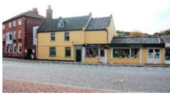
No.7-9 Earsham Street

No.5 Earsham Street (grade II). An early nineteenth century red brick structure with a hipped pan tile roof. Slightly projecting plinth. Brick toothed cornice. Four windows sash with flush frames and flat arches. Three-light sashed wooden canted bay to the first floor flanked by four-pane plate-glass sashes. Nine-light sashes to second floor windows. Modified plate-glass sashes to ground floor. Later twentieth century panelled door with fanlight and flat arch. Former garden entrance to right now leading into a c2010 top-lit single storey addition. Nos.1 to 19 (odd) form a group. The rear section of the plot on which this building stands is within the scheduled area of the Castle complex.