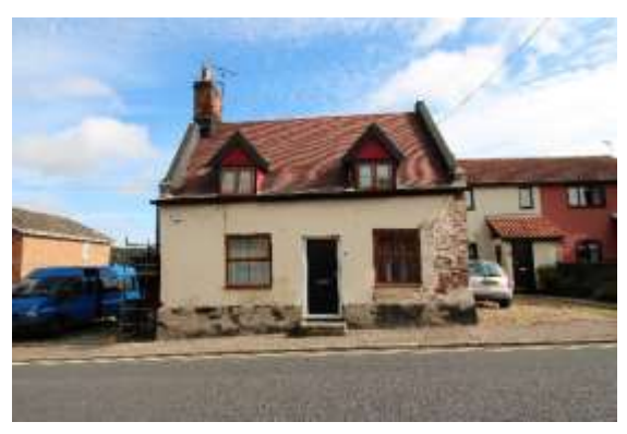
No.86 Broad Street

Former Saint Mary's Parish Rooms, Broad Street. Former parish rooms and Sunday School built in 1882, but in a highly conservative style. Formerly with a Church of England Sunday School to the ground floor, and a mission hall above. Reputedly used as a soup kitchen in the two World Wars. Red brick with a shallow pitched red pan tile roof with blue tile stripes. Overhanging eaves with bargeboards to return elevations. Five bay, two storey, principal façade in a restrained gothic style. Painted stone dressings. Cambered brick arched windows to ground floor with painted stone rusticated keystones. Casement windows replaced with PVCu. Principal entrance in gabled bay to right with arched window at first floor level. Painted stone sill bands, with date stone below that to the ground floor. Closed c1939 and later a store and retail premises. Marked as a shoe factory on the 1969 Ordnance Survey map. Saint Mary's Church itself was declared redundant in 1977. Honeywood F, Morrow P & Reeve C, The Town Recorder, A History of Bungay in Photographs (Bungay, 1994) p14.