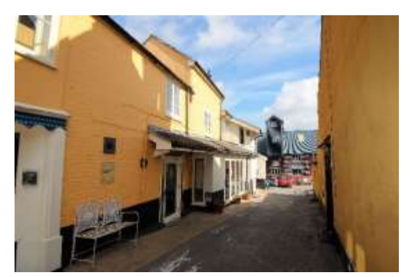
Fisher Theatre, return elevation

The Buildings of England, Suffolk: East (London, 2015) p.153-154.