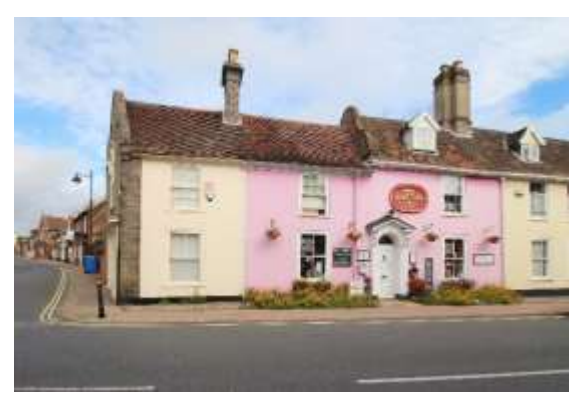
Nos.20-22 (even) Earsham Street

No.18 Earsham Street (grade II). Part of the same structure as Nos.20 & 22 (even). Of mid to late Seventeenth century date, and of two storeys with an attic. Red pan tile roof covering with two gabled dormers. Gault brick chimneystacks, that shared with No.20 partially rendered. Painted stucco, façade to Earsham Street. Twelve light hornless sashes within flush frames. Two Dutch gables. Sixpanelled door with semi-circular radial fanlight, set within a doorcase with panelled reveals, pilasters, and an open pediment. Nos. 2 to 40 (even) form a group.