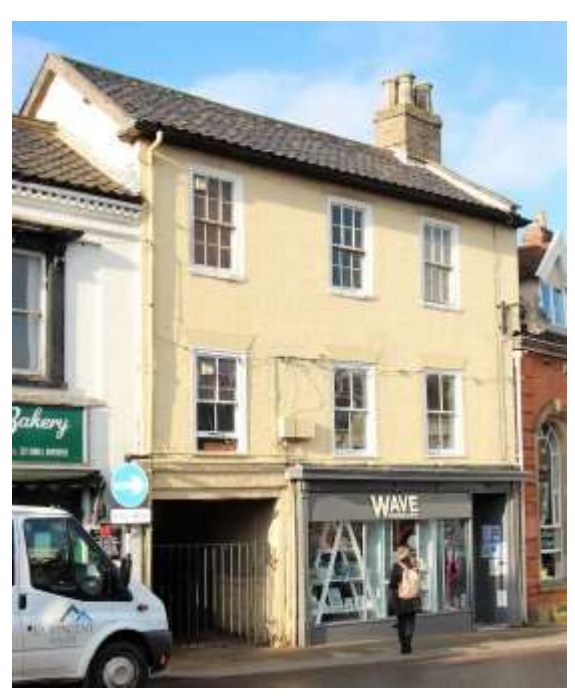
No.10 Market Place

No.10 Market Place (grade II). Probably of early nineteenth century date, with a three storey and three bay façade to the Market Place, brick,