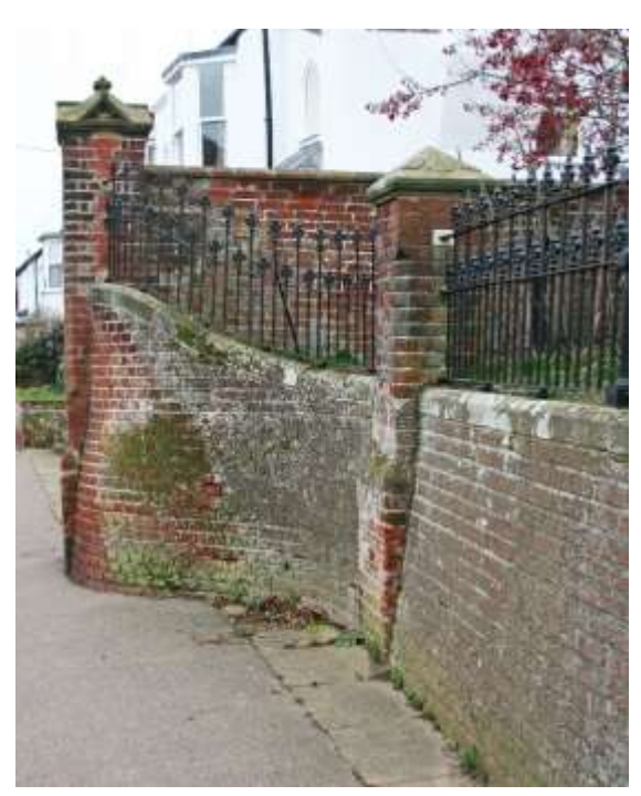
Detail of boundary wall Bungay Primary School, Wingfield Street

1914 (Kindred, Ipswich, 1991) p155. Honeywood F, Morrow P & Reeve C, The Town Recorder, A History of Bungay in Photographs (Bungay, 1994) p99-100, & 105.