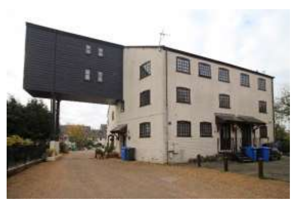
Nos.1-5 The Watermill, Staithe Road

Nos.51 & 53 Staithe Road. (grade II). Originally one early eighteenth century dwelling. Two storey, six bay façade, pebble dash on red brick. Platt band below first floor windows, plinth, and a coved cornice. Black pan tiled roof of steep pitch with overhanging eaves. Four-light sashes in flush frames, rendered flat arched lintels to ground floor windows. No.51, six-panelled door, with an eared architrave and a pediment. No.53, six-panelled door in a wood case with slender pilasters and a cornice. red brick chimney stacks. Subsidiary structures. Boundary walls appear to be later twentieth century red brick.