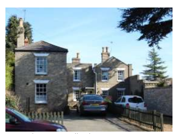
Nos.61 & 63 Lower Olland Street

Boundary wall to north of No.61 Lower Olland Street. A high gault brick mid nineteenth century boundary wall with panels and a stone cap. Curved sections flanking drive entrance at southern end.