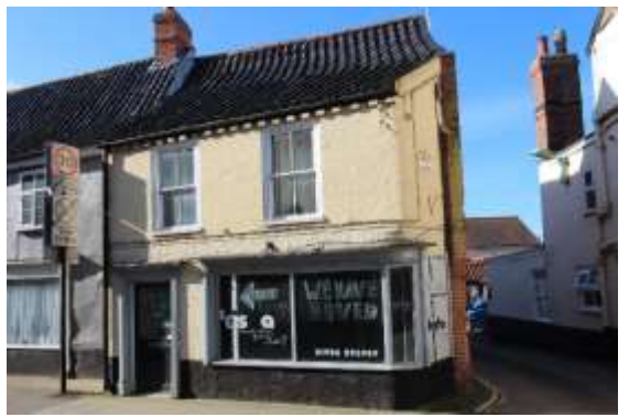
No.2 Upper Olland Street

No.2 Upper Olland Street (grade II). A seventeenth century structure with a nineteenth century façade of painted brick. Standing on the southern corner of Quaves Lane. Black pan tiled roof, dentilled eaves cornice, red brick chimney stack. First floor windows now plate-glass hornless sashes. Early nineteenth century wooden doorcase and shop facia with pilasters and delicate entablature. Nos.2 to 10 (even), 14, 16 and Nos.20 to 24 (even) form a group. Honeywood F, Morrow P, & Reeve C, The Town Recorder, A History of Bungay in Photographs (Bungay, 1994) p185.