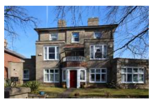
No.67 Lower Olland Street

occupies the site of a former conservatory. To the right a later recessed bay with an Ionic porch. Door with glazed upper panels. In the nineteenth century the home of the Walker family owners of the Staithe Maltings. Honeywood F, Morrow P, & Reeve C, The Town Recorder, A History of Bungay in Photographs (Bungay, 1994) p104.