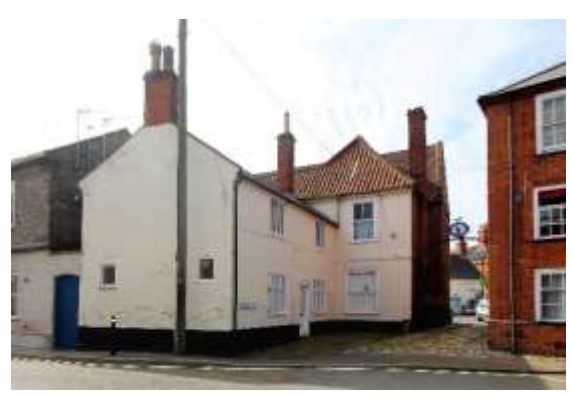
No.8 Earsham Street from Broad Street

fanlight, 3/4 columns triglyphs and open pediment. The rear range of No.8 is painted and is visible from both Broad Street and Cork Bricks. It is slightly lower in height and has a symmetrical façade to Cork Bricks with a central doorway. Black pan tiled roof, dentilled brick eaves cornice and casement windows. Nos.2 to 40 (even) form a group. Bettley, J, and Pevsner, N, The Buildings of England, Suffolk: East (London, 2015) p.154.