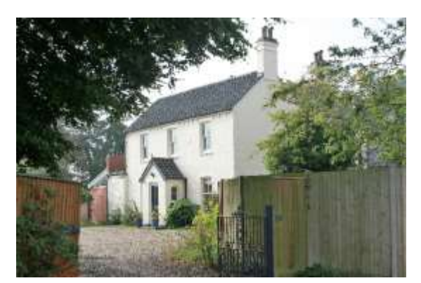
No.14 Wharton Street

garden wall to No.11a. Bettley, J, and Pevsner, N, The Buildings of England, Suffolk: East (London, 2015) p.157. Honeywood F, Morrow P & Reeve C, The Town Recorder, A History of Bungay in Photographs (Bungay, 1994) p109. Reeve C, Bungay Through Time (Stroud, 2009) p65.