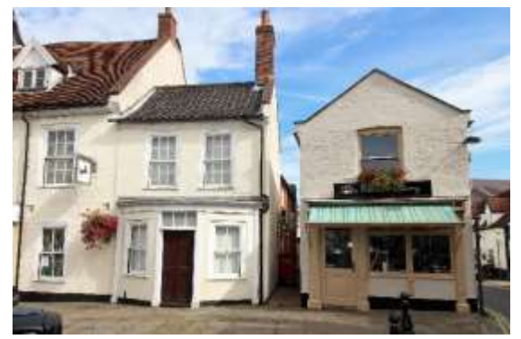
No.13 Market Place

No.13 Market Place. A mid-nineteenth century painted red brick structure with a parapeted gable to the Market Place. Four bay return elevation to Cross Street. Single horned plate-glass sash to first floor and shop facia with pilasters below. Cross Street elevation of four narrow bays with a dentilled brick eaves cornice and a single central casement window with a shallow arched brick lintel to the first floor. Blocked doorway and window to ground floor left, and two twentieth century casement windows. All with shallow arched brick lintels. Single storey rear outshot containing a door and a casement window. Red pan tile roof. Forms an important part of the setting of neighbouring listed structures.