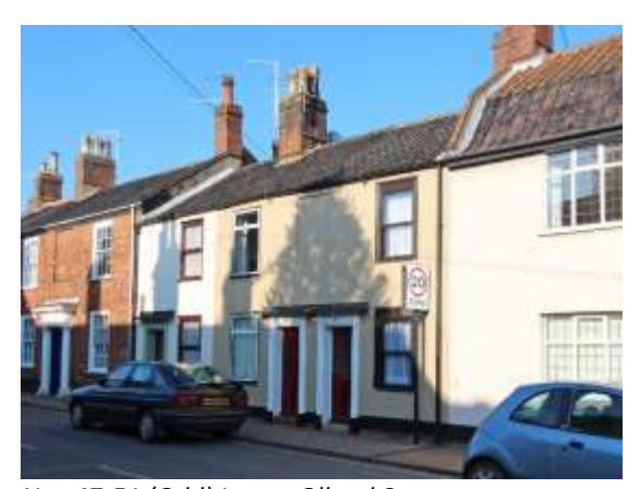
Nos.47-51 (Odd) Lower Olland Street

Nos.41-45 (Odd) Lower Olland Street (grade II). Later eighteenth or early nineteenth century, of two storeys, red brick, black pan tiled roof. Six bay façade with replaced sash windows within flush frames to each floor. Flat arched lintels to ground floor. Nos.41 and 43 have six-panelled doors in wooden cases with pilasters. No.45, a six-panelled door within an altered wooden doorcase with Doric pilasters. Blind recess above. Arched passage between Nos.41 and 43,