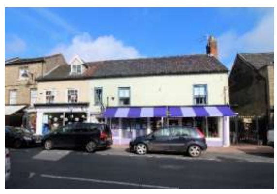
Nos.32-36 (even) Earsham Street

Nos.32-36 (even) Earsham Street (grade II). Eighteenth century two storey and attic, one gabled dormer. Stucco on brick, lined and painted. Pantiles. Five windows, sash, some with glazing bars and flush frames. Fine early nineteenth century wooden shop facia with three Doric columns and entablature, modern glass. Smaller modern shop front, left. Nos. 2-40 (even) form a group. Reeve C, Bungay Through Time (Stroud, 2009) p44.