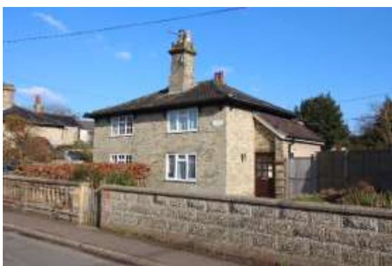
Nos.21 & 23 Flixton Road

Nos.21 & 23 Flixton Road. A semi-detached pair of cottages of probably mid-nineteenth century date. Faced in gault brick with a hipped black pan tiled roof and overhanging eaves. Central brick stack rising from former spine wall. Window openings remodelled to hold casements in late twentieth century. Included here primarily for its group value. Subsidiary Structures Low mid-nineteenth century white brick wall with red brick bands and brick balustrade. Wall to side of No.21 rebuilt in later twentieth century and not of interest. Single storey nineteenth century red brick outbuilding to rear.