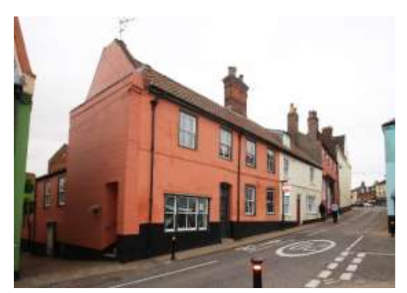
Nos.4, No. 6a, & 6b Bridge Street

Nos.4, No. 6a & 6b Bridge Street and garden walls to rear. (grade II). Standing on the corner of Borough Well Lane and probably of early eighteenth century date. Of two storeys and an attic, with a low two storey rear range facing Borough Well Lane. Rendered and painted with a platt band below the first-floor windows. Four-light plate glass sashes with horns to the first floor. One gabled dormer to No.4 within a replaced red pan tiled roof. No.4 is shown with a shop facia to the ground floor right on c1920 photographs, but this has been replaced by a tripartite sash. To the left of the four-panelled front door is a relatively recent four-light horned sash, in a segmental arched opening. A small central window at first floor level is also shown on early photographs. To the rear of No.4 is a red brick range with an elevation facing a yard off Trinity Street. This has a black pan tiled roof to Borough Well Lane and a red pan tiled roof to its other faces. A late nineteenth century wooden oriel window is set within the end wall at first floor level. Below this window there was evidently a further recently demolished single storey projection