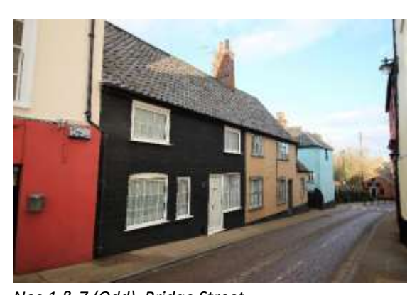
Nos.1 & 7 (Odd), Bridge Street

For Aldeby House, No.1 Market Place see Nos.2-4 Broad Street