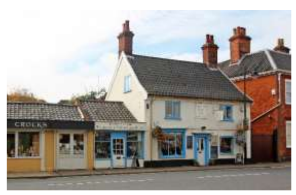
No.11-13 Earsham Street

Nos.9-11 (odd) Earsham Street (grade II). Probably of early nineteenth century date, and of a single storey with shallow pitched black pan tiled roofs. No.9 has an early nineteenth century wooden shop facia with pilasters. No.11, nineteenth century wooden shop facia with glazing bars and a central entrance. Nos.1 to 19 (odd) form a group. The rear section of the plot on which this building stands is within the scheduled area of the Castle complex.