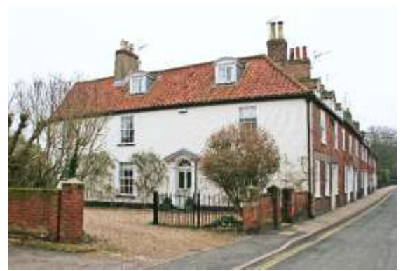
Nos.21 & 23 Upper Olland Street

brick chimneystacks with paired flues. Canted bay window to Upper Olland Street façade. Black pan tiled roof with large twentieth century dormer in southern elevation. Most external joinery replaced.