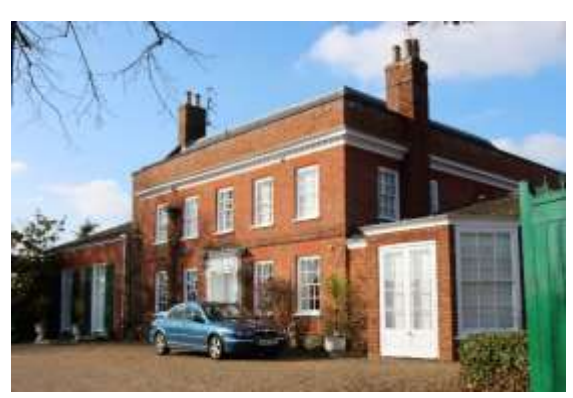
Rose Hall, No.52 Upper Olland Street

No.50 Upper Olland Street (grade II). Early eighteenth century, of two storeys, red brick, with a plinth. On the corner of Boyscott Lane. Black pan tiled roof covering to Upper Olland Street, red to Boyscott Lane. Upper Olland Street façade of three bays with a coved cornice. 2 windows, flush frame sash, with glazing bars, segmental arches at ground floor. Four-panelled door in wood case-with fanlight and fluted pilasters. Three bay return elevation with a hipped roof. Segmental arched lintels to sash windows. Central ground floor window a larger casement. Largely blind rear gable. Nos.30 to 34 (even), Emmanuel church and Nos.38 to 52 (even) form a group.