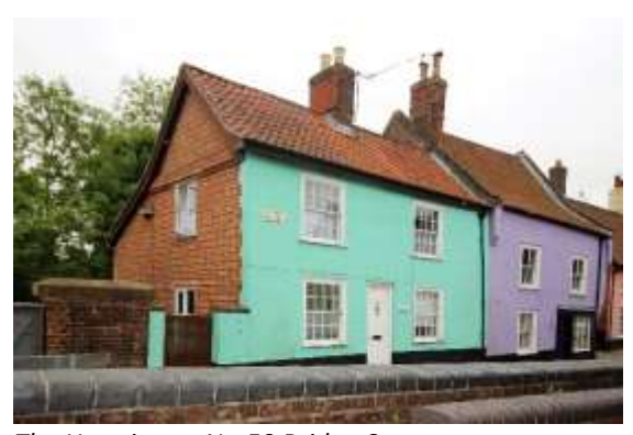
The Hermitage, No.50 Bridge Street

black pitch finish, small casement windows above. Pan tiled roof patched in various colours. Highly visible from the river side footpath. Reeve C, Bungay Through Time (Stroud, 2009) p61.