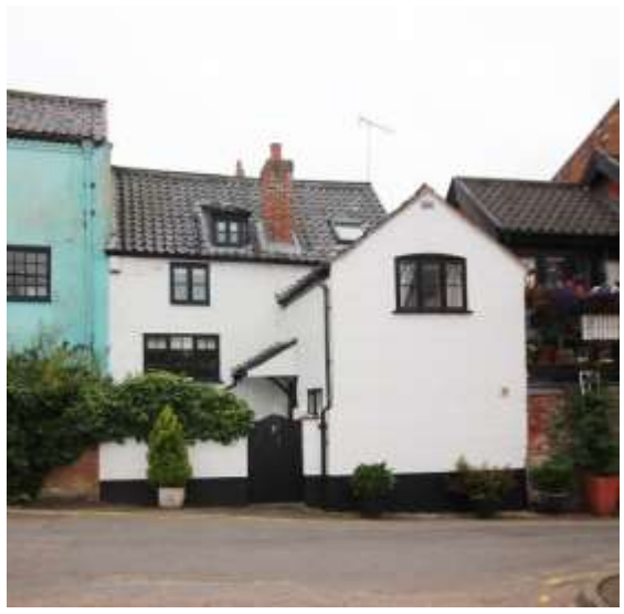
No.3 Nethergate Street