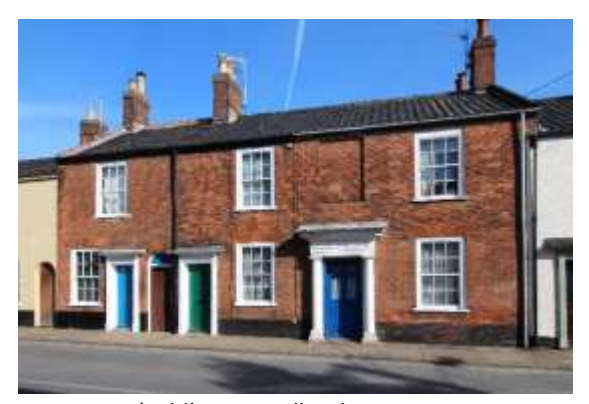
Nos.41-45 (Odd) Lower Olland Street

Nos.41-45 (Odd) Lower Olland Street (grade II). Later eighteenth or early nineteenth century, of two storeys, red brick, black pan tiled roof. Six bay façade with replaced sash windows within flush frames to each floor. Flat arched lintels to ground floor. Nos.41 and 43 have six-panelled doors in wooden cases with pilasters. No.45, a six-panelled door within an altered wooden doorcase with Doric pilasters. Blind recess above. Arched passage between Nos.41 and 43,