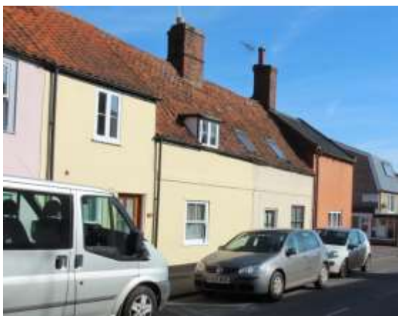
Nos.27 -29 (odd) Staithe Road

Nos.23-25 (odd) Staithe Road. Small rendered pair of cottages of c1800 forming an important part of the setting of the grade II listed. No.23 with central four-panelled door flanked by horned sashes. No.25. Horned sash to ground floor and twentieth century top-lit boarded front door. Twentieth century casement above in earlier opening. Red pan tiled roof. No.23 extended to rear.