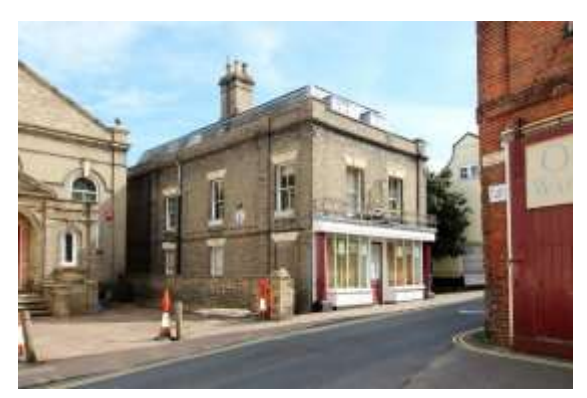
No.7 Trinity Street

Borough Well Lane which are well preserved and retain the bulk of their original joinery and stained glass. Its Trinity Street façade terminates views along Cross Street. Pedimented gault brick façade to Trinity Street of three bays with corner pilasters capped by ball finials. Three arched casement windows with pronounced keystones. Pedimented projecting single storey porch. Elevation to Borough Well Lane of an additional storey and faced in red brick. Tall nineteenth century gault brick boundary wall to Borough Well Lane of considerable townscape value. Red brick retaining walls to rear of lesser interest. Honeywood F, Morrow P, & Reeve C, The Town Recorder, A History of Bungay in Photographs (Bungay, 1994) p17 & 27. Bettley, J, and Pevsner, N, The Buildings of England, Suffolk: East (London, 2015) p.157.