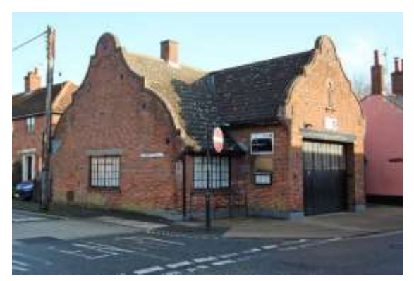
No.29 Lower Olland Street

Nos.1-3 (odd), Lower Olland Street (grade II). The former Angel public house, in use as such from the early nineteenth century, the pub closed in 2009. Seventeenth century timber-framed, now with a stuccoed, and largely early nineteenth century façade. lined and painted, coved cornice, black pan tiled roof covering. Four-bay principal façade with plate-glass sashes within flush frames. Two early nineteenth century six-panelled doors in wooden cases with mutular cornices. Former pub facia with small pane casements. Honeywood F, Reeve C, & Reeve T, The Town Recorder, Five Centuries of Bungay at Play (Bungay, 2008) p164.