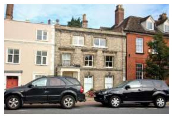
No.14 Earsham Street

No.14 Earsham Street (grade II). A substantial dwelling with seventeenth century origins. It is reputed to have been built in 1620 but is probably of c1660, and once formed part of a much larger dwelling which included No.16. Three storeys and three bays. Mid nineteenth century gault brick classical façade with low parapet and corner pilasters capped by finials. Red pan tile roof covering. Horned plate glass sashes to ground and first floors. Six-panelled door, panelled reveals, enriched consoles, key, and bed mould remains of original entablature. Mid nineteenth century porch with slender columns, entablature, and cast-iron ornament. Partially glazed in the late twentieth century. Low eighteenth century rear service range with mid twentieth century Crittall windows and nineteenth century addition. This range is rendered and has a red pan tiled roof. Interior; panelled room, right, with fluted pilasters and cornice. In 1933, thirty-five horse's skulls were found fixed in rows between the joists of the floor of this room, said to be a music room, placed there to improve its acoustics. (No. 16, adjoining originally part of this room; similar skulls found under corresponding room on opposite side of the house). Original staircase gone and many other features. Panelled room used as hairdressing saloon. Nos. 14 and 16 are two of the few buildings which survived the fire of 1688.