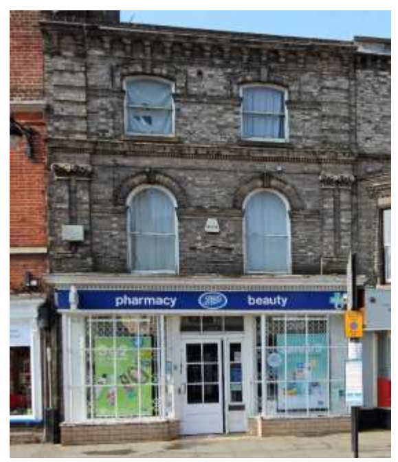
No.4 St Mary's Street

No.2 St Mary's Street. A red brick house and shop of c1800, re-fronted and partially rebuilt in Suffolk white brick c1870 probably to the designs of William Oldham Chambers of Lowestoft who designed the adjacent façade to the south. Three storey white brick façade of two bays, with canted bay to first-floor left. Horned plate-glass sashes. Parapet with dentilled cornice. Late twentieth century shop facia. Early nineteenth century red brick range to rear with hornless sashes. Some windows with glazing bars removed. Taller two bay mid-nineteenth century red brick addition with plate-glass sashes. Flat-arched lintels and stone sills. Hipped roof with overhanging eaves. Return elevation rendered.