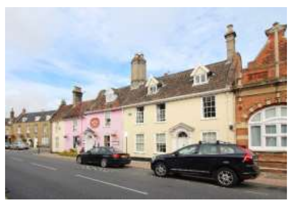
No.18 Earsham Street

No.18a Earsham Street. Former bank c1890, now a dwelling. Built for the London and Provincial Bank Limited. Faced in red brick with elaborate stone dressings and decorative terracotta panels, much original joinery. Of a single storey and two bays, doorway to right in arched opening with fine radial fanlight and panelled door. Large casement window in arched opening to left hand bay. Parapet and Dutch gable. Welsh slate roof. Many late nineteenth century features preserved within. Bettley, J, and Pevsner, N, The Buildings of England, Suffolk: East (London, 2015) p.154.