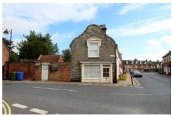
The Chaucer Street façade of No.22 Earsham Street

Nos.20-22 (even) Earsham Street and outbuilding to rear of No.22 (grade II). Part of the same structure as No 18. Probably of mid to late seventeenth century date, two storeys and an attic. Roof to No.22 covered with red plain tiles that to No.20 red pan tiles. These are separated by a partially rendered Dutch gable of possible seventeenth century date. Projecting eaves, and tall gault brick ridge stacks. No.20 with a single gabled dormer containing small pane casement windows. Painted stucco façade to Earsham Street. Six, twelve-light hornless sash windows at first floor level within flush frames. Mid to late nineteenth century horned plate-glass sashes to ground floor. Sixpanelled door to No.20, with semi-circular fanlight the radial bars of which have been removed (see No.18). Set within doorcase with open pediment supported on brackets.