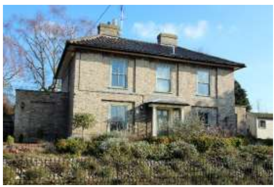
No.9 Flixton Road

roof and decorative tile ridge pieces. Entrance façade to north of three bays with central gabled porch and hornless sash windows. Flixton Road elevation with corner pilasters and pediment with a terracotta raking cornice. Hornless twelve-light sash windows with moulded brick surrounds with pilasters and stone corbels. No.7 of painted brick with a pan tiled roof. Casement windows to first floor. Wooden veranda with hipped pan tiled roof and fretwork frieze containing a canted bay window with sashes and shutters. Subsidiary Structures. Low nineteenth century red brick wall with a moulded gault brick cap and gault brick piers.