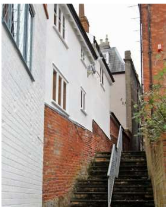
Borough Well Lane elevation of No.9 Trinity Street

No.9 Trinity Street. An altered eighteenth century detached dwelling standing at a right-angle to Trinity Street behind No.7. The house backs onto Borough Well Lane. Red brick with a partially rendered gable end. Sixteen-light sashes in heavy moulded frames. Three-bay two storey entrance façade with central doorway. Replaced red tile roof and central ridge stack. Rear elevation to Borough Well Lane with high basement storey. Red brick partially rendered with casement windows.