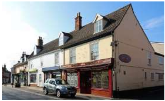
Nos.42-46 (even) St Mary's Street

Nos.36-38 (even) St Mary's Street. Early nineteenth century building of red brick, with a Suffolk white brick façade. Of three storeys and four-bays No.36 of one bay, No.38 of three with pilasters. Twelvelight hornless sash windows and a high parapet. Good possibly nineteenth century shop facia with pilasters to No.38. Nineteenth century shop window to No.36.