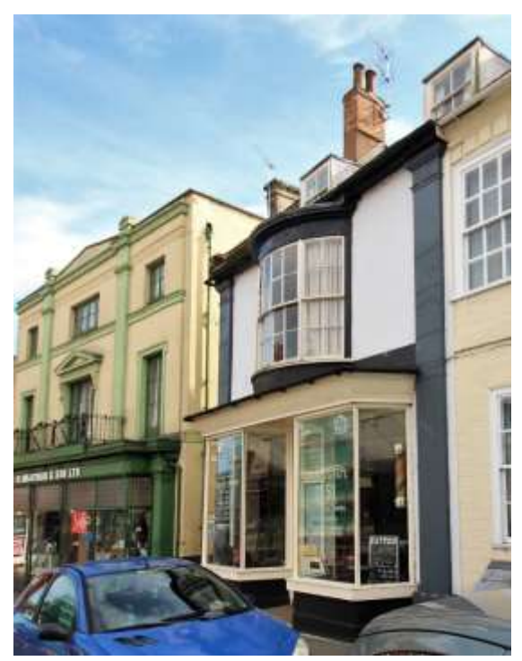
No.7 Market Place

No.7 Market Place (grade II). Early eighteenth century, of two storeys and an attic, two casement dormers within roof slope. Stucco. Market Place façade of two storeys flanked by pilasters. Red plain tile roof. Bowed oriel sash window at first floor level, with small pane sashes and a dentilled cornice. Mid nineteenth century wooden splayed bay shop front with a central entrance. Nos. 1 to 11 (odd), Nos. 11A, 13 and 17 to 21 (odd) form a group together with the Butter Cross.