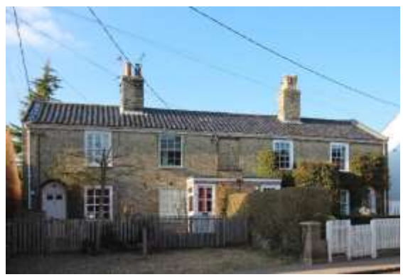
Nos.5-11 (Odd) Wingfield Street

No.3 Wingfield Street, outbuilding, and boundary wall. A detached villa of c1900 with earlier outbuilding to rear. The outbuilding is shown on the 1885 1:2,500 map, the villa not till that of 1905. Villa red brick with stone dressings and a plain tile roof. Plate- glass sash windows in flush frames. Canted bay windows to ground floor with carved stone lintels to windows and keystones. Gabled wooden porch containing a six-panelled door. Subsidiary structures Attached red brick outbuilding with red pan tiled roof to rear, partially built over stone boundary wall. C1900 red brick dwarf wall and piers to front with decorative railings. Twentieth century flat-roofed garage addition not of significance.