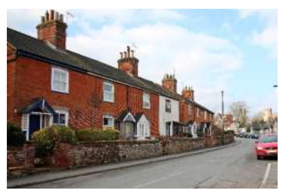
Nos.12-28 (even) Staithe Road

Kimberley Terrace Nos.12-28 (even) Staithe Road. Two terraces of red brick cottages of c1902. Gault brick cambered lintels to ground floor windows. Black pan tiled roof. Most external joinery replaced but original openings preserved. Contemporary red brick boundary wall to Staithe Road.