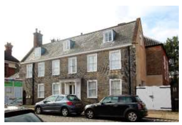
Charlotte House, Broad Street

Nos. 1 &2 Bigod Flats, Broad Street. Probably of early to mid-nineteenth century date and built as stabling and outbuildings for properties on Earsham Street. White brick with a black pan tile roof and a rendered ground floor. Restrained neo-Tudor detailing including hood mould to doorway and flanking window. Casement windows, decorative eaves cornice and dentilled string course.