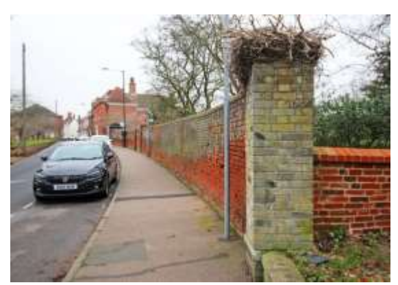
Wall of Garden to Trinity Hall, Trinity Street with pier of Holy Trinity Churchyard walls

No.19 Trinity Street (grade II) A later eighteenthcentury façade to a late seventeenth century structure. Two storeys with an attic lit by three hipped casement dormers, red plain tiles at front, pan tiles at back. Parapet with stone cope, and a moulded brick dentilled cornice. Symmetrical five bay façade to Trinity Street. To the first floor five twelve-light hornless sash windows with flat arched lintels. Central first floor window lintel with a shaped soffit. Five-panelled door, with an elliptical fanlight with curved bars, panelled pilasters, consoles, and an open pediment. Windows to older portion are either sashes in flush frames, or mullion transomed leaded casements. Coved cornice. Lower two-storey wing, two windows, corbelled brick cornice, pan tiles, cambered arches. Interior: some original mantels and wood arched panelled screen. Nos.1 to 19 (odd) form a group. A number of the subsidiary features at No.19 are separately listed. Bettley, J, and Pevsner, N, The Buildings of England, Suffolk: East (London, 2015) p.157.