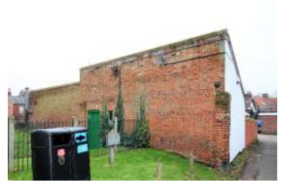
Jester's Shop, The Keep, Castle Orchard

Keeper's Cottage and boundary wall, Castle Orchard (standing on scheduled land). A nineteenth century cottage with extensive later twentieth century alterations and additions, built within the remains of the Castle complex and within the scheduled ancient monument. Its rear retaining wall is part of the Castle wall. Original cottage has rendered walls and a black pan tiled roof. Red brick ridge stack. Two storeys with a single storey wing. Twentieth century flat roofed porch. Return gable with twentieth century timber oriel window to first floor. Lower red pan tile roofed range to rear. Twentieth century casement features. windows. Subsidiary Good nineteenth century flint wall.