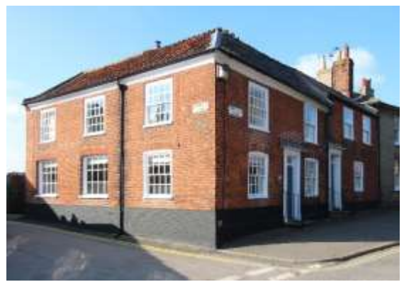
Nos.48 & 50 Upper Olland Street

The Old Maltings, No.46 Upper Olland Street (grade II). An eighteenth century house with a symmetrical early nineteenth century Suffolk white brick façade. Two storeys and three bays with a hipped Welsh slate roof and projecting eaves. White brick chimney stacks. Twelve-light hornless sashes with flat arched lintels. Six-panelled front door with Greek fluted Doric one quarter radius columns to the reveals, below an arched radial-bar fanlight. Return elevation of painted red brick with a single flush framed sash window to the first floor. Pan tiled portion at rear. Nos.30 to 34 (even), Emmanuel church and Nos.38 to 52 (even) form a group.