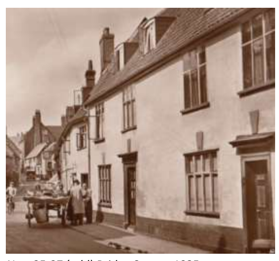
Nos. 35-37 (odd) Bridge Street c1925

Nos.35-37 (odd) Bridge Street (grade II) Early eighteenth century, of two storeys with an attic lit by four flat roofed dormers. Red pan tiled roof and substantial central red brick ridge stack rising from party wall. Stucco on brick, lined as ashlar. The first floor has early nineteenth century casements, of six lights, in flush frames. Flat heads formerly with keys to two eight-light ground floor windows. Inserted four-light casement to right of doorway within No.35. Part glazed door to No.35 eared architrave, pulvinate frieze and dentil cornice. Modern door to No.37 in wooden case with architrave frieze and cornice. Nos.29 to 45 (odd) form a group.