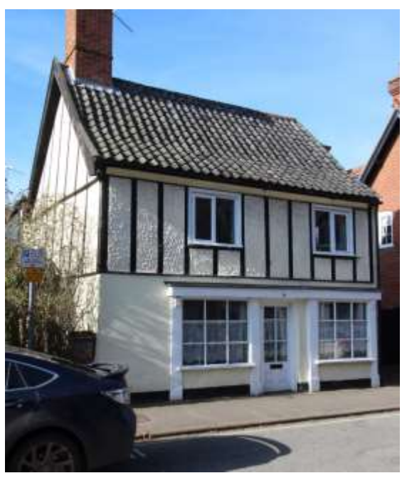
No.30 Upper Olland Street

No.28 Upper Olland Street. A purpose-built public house of c1913 on the site of an earlier inn. Formerly the Rose and Crown, it closed c1970 and is now a dwelling. Vernacular revival style, with unaltered façade. Red brick with a roughcast rendered first floor and applied decorative halftimbering. Plain tile roof with decorative pierced ridge pieces. Overhanging eaves and simple wooden bargeboards. Three substantial mullioned and transomed windows to ground floor in painted stone surrounds. Painted stone doorcase. Oriel window within gable at first floor level and two wooden casements with mullions. Plaster inn sign with a rose and a crown set within name panel. Honeywood F, Reeve C, & Reeve T, The Town Recorder, Five Centuries of Bungay at Play (Bungay, 2008) p100-101 & 156-7.