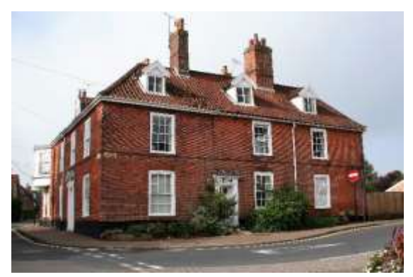
Nos.16 &18 Trinity Street

Wharton Street. Altered first floor sash windows. No.10 and Nos.14 to 18 (even) form a group. Nos.14 to 18 (even) form a group with Nos.9, 11A, 11 Wharton Street.