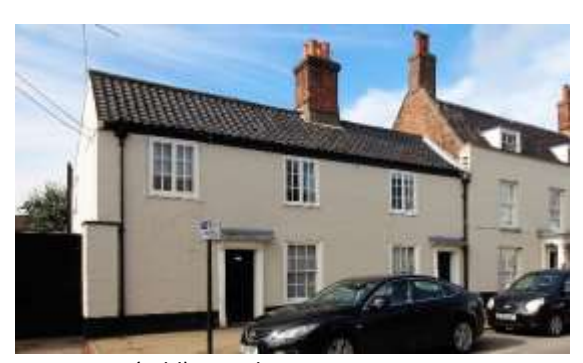
Nos.15-17 (odd) Broad Street

Nos.11-13 (odd) Broad Street Semi-detached pair of two storey cottages of c1800 date. Black pan-tiled roof covering, patched with red pan tiles. Large central red brick chimneystack rising from spine wall between the cottages. Dentilled brick eaves cornice. Late twentieth century casements to first floor and sashes below. Front doors both late twentieth century. Attached to the rear of No.13 is a substantial two storey red brick outbuilding of probably early nineteenth century date. This pair of cottages make a strong positive contribution to the setting of the grade II listed Nos.17-19 (Odd).