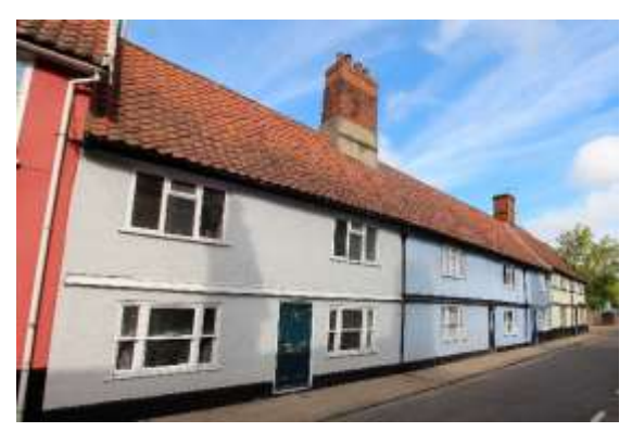
Nos. 39-43 (odd) Bridge Street