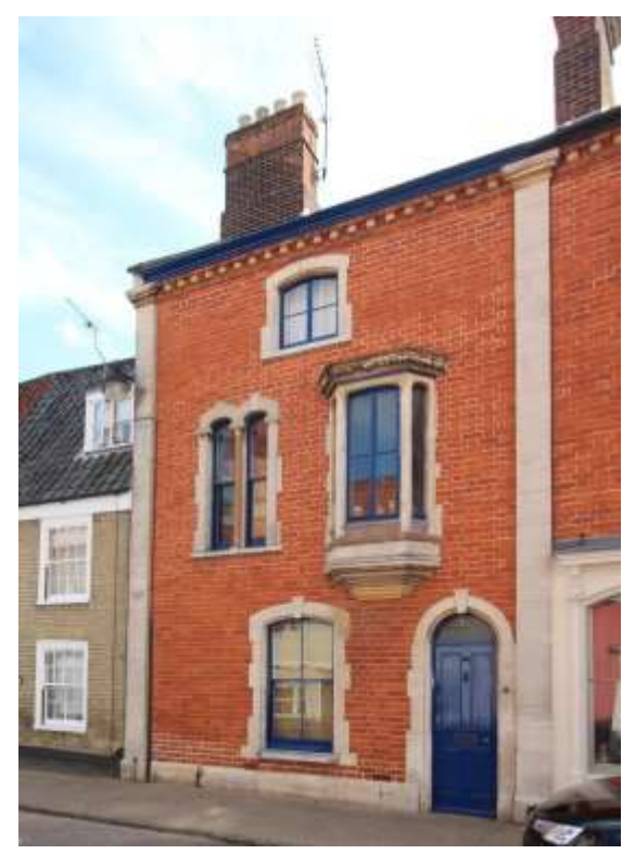
No.38 Bridge Street

No.36 Bridge Street (local list). A substantial later nineteenth century red brick former shop and dwelling with painted stone dressings, dentilled eaves cornice and full height pilasters. Plate glass sash windows. Three storey, two bay principal façade. Arched doorcase with keystone and four panelled door within rendered later nineteenth century former shop facia. Simple semi-circular fanlight. Twin shallow arched windows to left with keystones beneath a corbelled cornice. Passage way with boarded door within shallow arched opening to right. Substantial red brick chimneystack. Forms part of a semi-detached pair with No.36.