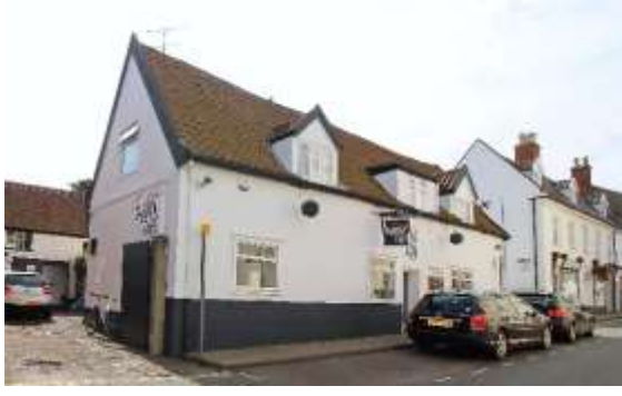
No.6 Cross Street

No.6 Cross Street and outbuilding (grade II). Former Jolly Butchers Public House; closed early twentieth century. Of early seventeenth century date, and of a single storey with attics. Timber framed and plastered. Replaced red pan tile roof covering with two gabled, and one flat roofed dormer; the latter of later twentieth century date. Later twentieth century door and casement windows. To the rear a detached former stable and cart shed probably of early nineteenth century date. Painted brick with a red pan tile roof. The building reputedly suffered bomb damage in World War Two. Honeywood F, Morrow P & Reeve C, The Town Recorder, A History of Bungay in Photographs (Bungay, 1994) p158. Honeywood F, Reeve C, & Reeve T, The Town Recorder, Five Centuries of Bungay at Play (Bungay, 2008) p140. Honeywood F, Reeve C, & Reeve T, The Town Recorder, Five Centuries of Bungay at Play (Bungay, 2008) p91-92 & 139.