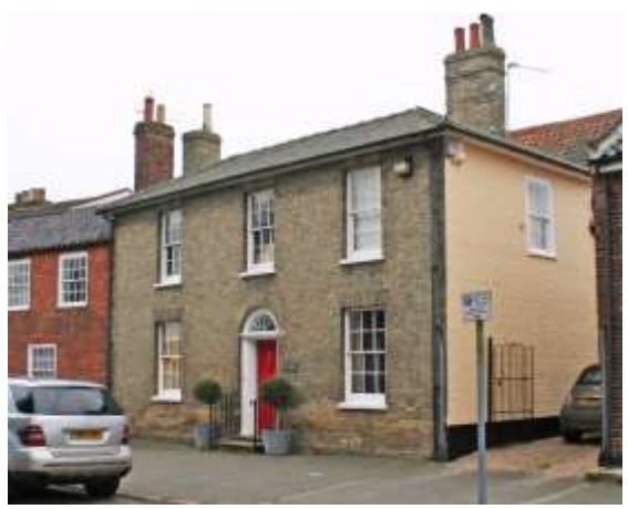
The Old Maltings, No.46 Upper Olland Street

dormers. Red brick with a plinth, black pan tiled roof. Nos.42 & 44 retain early sixteen-light hornless sashes. No. 40 now has plate glass sashes. Flat arched lintels to ground floor. Six-panelled doors in wooden cases with roundels and mutular cornices. Nos.30 to 34 (even), Emmanuel church and Nos.38 to 52 (even) form a group.