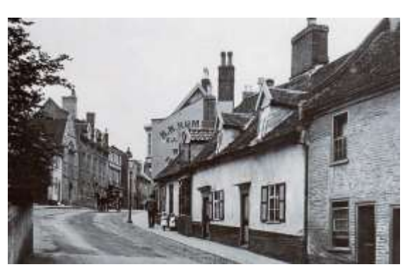
Nos.61, 65, & 67 Earsham Street c1920.

Nos.61-67 (odd), Earsham Street (grade II). A picturesque terrace of three single storey cottages with attics, formerly four dwellings. Red pan tile roof with black pan tile insets forming a decorative geometric pattern. Seven gabled dormers with decorative bargeboards on the Earsham Street roof face containing mostly late twentieth century casement windows. Edwardian views show only three dormers at that time. Of timber framed construction but faced in painted plaster. Twelvelight sash windows with glazing bars and flush frames. Nos.61, 65 and 67, have wood doorcases. No.61, a six-panelled door, the rest have twentieth century four-panelled doors. Nos.39, 41, 49, 5l, 61 (odd) and Nos.65 to 73 (odd) form a group.