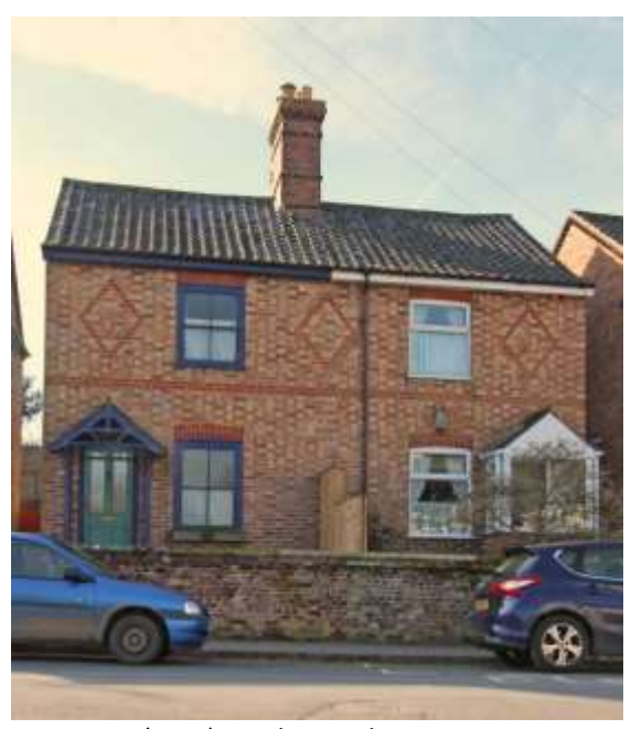
Nos.38-40 (even) Staithe Road

Alexandra Cottages, Nos.34-36 (even) Staithe Road. A semi-detached pair of houses of 1901. Alternate Fletton and red brick façade with elaborate red brick dressings. Black pan tiled roof and central ridge stack to spine wall. Replacement windows in original openings. Twentieth century porches. A relatively early use of Fletton brick. Nineteenth century red brick boundary wall to Staithe Rd.