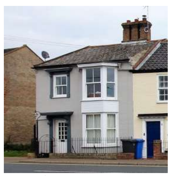
No.9 St John's Road

preserved to first floor. The sashes to the canted bays also appear to be original. Partially glazed four panelled doors and doorcases with decorative corbels. Subsidiary Features Low gault brick boundary wall to street formerly with cast iron spear type railings and hooped cast iron gates.