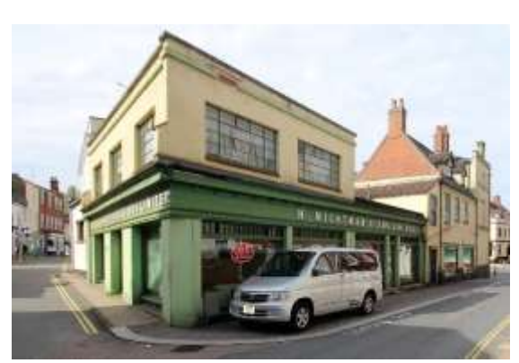
Nos.2 & 2a Trinity Street with No.5 Market Place in the distance

No.2 Trinity Street (grade II). Seventeenth century and of two storeys with an attic lit by two gabled casement dormers. Limewashed brick, band cut away, plinth. Wooden cornice, black pan tiles, three first floor original mullioned and transomed casements. Six-panelled door in wing, left. Two late twentieth century plate glass shop windows to the ground floor. (See also No.5 Market Place).