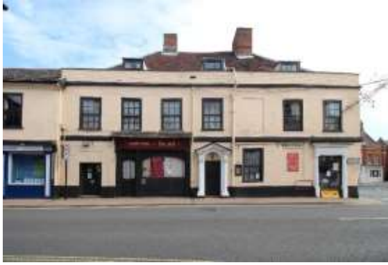
The Three Tuns, No.2 Earsham Street

The Three Tuns Inn, No.2 Earsham Street (grade II). A seventeenth century structure of two storeys and an attic, occupying an island site with façades to Earsham Street, Broad Street and Market Place. The large wing to the left was in retail use by early