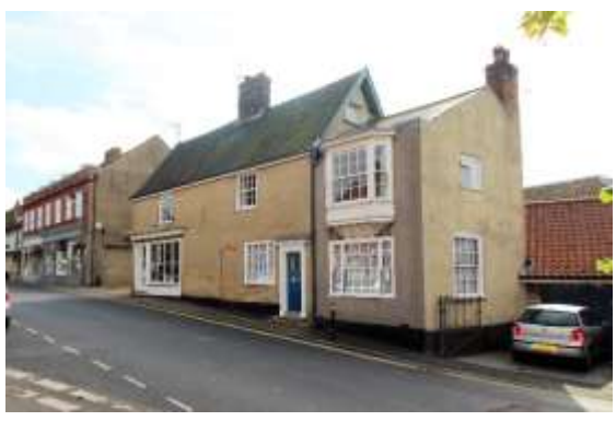
Nos.57 -59 (odd) Earsham Street

Cameron House and The Old Ironworks, Nathans Yard, Earsham Street. Remains of former Rumsby's Waveney Ironworks (closed 1966) now dwellings. The ironworks was originally established by the Cameron family in the early nineteenth century. Mid and later nineteenth century with substantial later twentieth century alterations and additions. Red pan tile roof. At the rear a flint and stone rubble structure with red brick quoins and a hipped red pan tiled roof. The Old Ironworks is largely formed from a later nineteenth century red brick former workshop range. Now partially painted, arched window openings with blue brick lintels and dentilled brick eaves cornice. Late twentieth century replicas of the original iron framed casements. Weatherboarded return elevations. Former vehicle entrance to building now infilled with boarding and containing a twentieth century six-panelled door. Narrower stone rubble section to rear. This complex partially stands within the area of the scheduled Castle earthworks and contains a section of Castle wall. It is visible from Castle Lane.