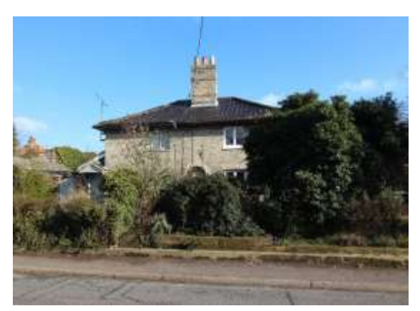
Autumn Cottage, No.13 Flixton Road

No.11 Flixton Road (grade II). An early nineteenth century two storey, Suffolk yellow brick, villa, greywashed. Hipped black pan tiled roof and wide eaves. Two sixteen-light hornless sash windows with flush frames, at first floor level. Two canted and sashed bays to ground floor. Small wings with blank arched panels. Six-panelled door. Wooden Doric porch. Nos.9 to 13 (odd) form a group.