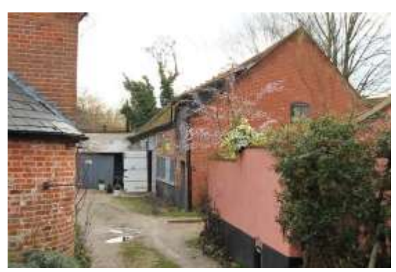
Outbuilding in Wharf Yard, Bridge Street

For the Smoke House located directly behind No.48 Bridge Street see No.48 Bridge Street.