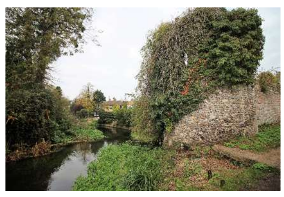
Folly tower, grounds of Scott House, Earsham Street

The extensive gardens of Scott House lay between Castle Lane and the River Waveney to the south and south-west of the house and onto the far bank of the river. The southern- most section beyond the bridleway from Castle Lane to the river has been developed for housing, fine garden walls and a folly tower however survive within the northern section. The gardens are open to the river with a low retaining wall separating the lawn from the water. On the Castle Lane side of the garden is a high boundary wall. The Buildings of England mentions a rockery created in 1844 by John Scott from stones taken from Bungay Priory. Within the gardens a later twentieth century wooden footbridge crosses the river to a wooded section of the house's grounds.