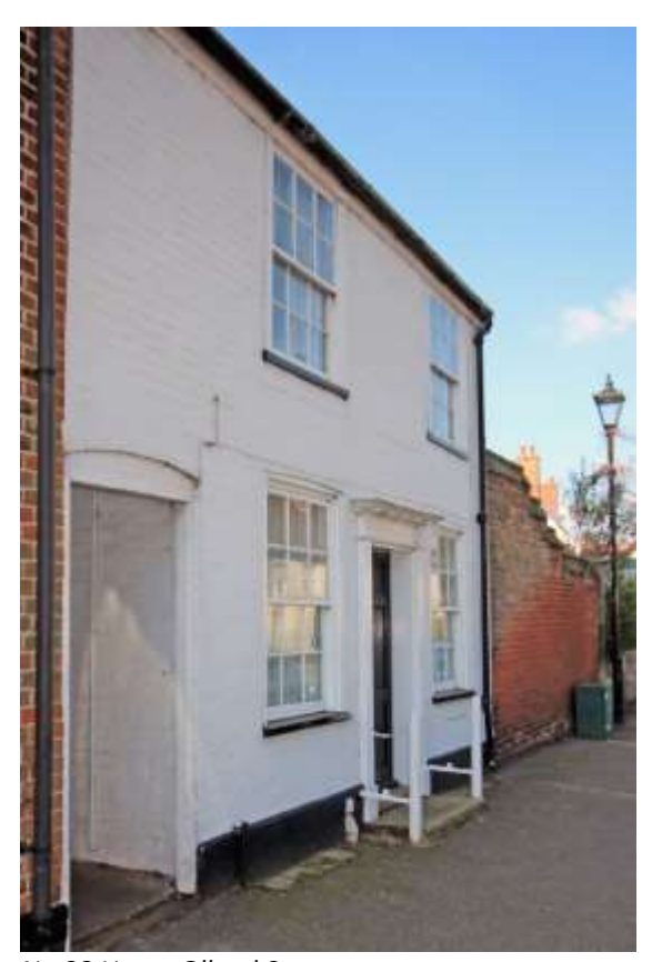
No.38 Upper Olland Street

No.34 Upper Olland Street (grade II). An early nineteenth century detached villa with a symmetrical classical entrance façade of three bays. Of two storeys with attics lit from within the gabled return elevations. Suffolk white brick façade with a mutular cornice, and a black pan tiled roof. Rear elevation red brick, side elevations rendered. Three twelve-light hornless sashes within flush frames at first floor level. Two further twelve-light sashes with flat arched lintels flanking the doorcase. Sixpanelled entrance door with arched patterned fanlight in an enriched wooden case. Northern return elevation highly visible from chapel graveyard. Rear elevation with nineteenth century casements beneath cambered lintels. Subsidiary Structures Screen walls to the left and right at a right-angle, each seven feet high with a stone cope, with a side door and blank panel respectively, square section piers. Low brick wall to front. Nos.30 to 34 (even), Emmanuel church and Nos.38 to 52 (even) form a group.