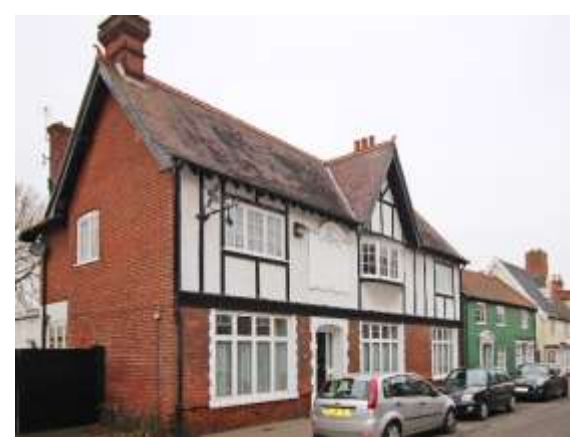
No.28 Upper Olland Street

No.26 Upper Olland Street. Probably of early nineteenth century date but much altered. Painted and rendered red brick. Red pan tiled roof. Three small pane casement windows to first floor. Late twentieth century pedimented doorcase and shop facia. Whilst much of the external joinery has been replaced the openings correspond to those shown on early twentieth century photographs. The building has significant group value with neighbouring properties.