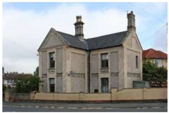
No.71 Staithe Road

No.71 Staithe Road. A substantial mid- nineteenth century classical villa of a bold and inventive design.