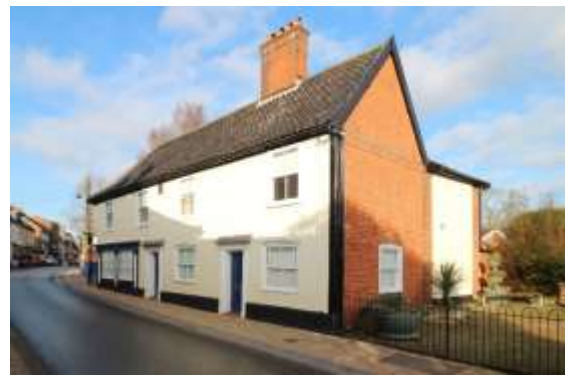
Nos.1-3 (odd), Lower Olland Street

Nos.1-3 (odd), Lower Olland Street (grade II). The former Angel public house, in use as such from the early nineteenth century, the pub closed in 2009. Seventeenth century timber-framed, now with a stuccoed, and largely early nineteenth century façade. lined and painted, coved cornice, black pan tiled roof covering. Four-bay principal façade with plate-glass sashes within flush frames. Two early nineteenth century six-panelled doors in wooden cases with mutular cornices. Former pub facia with small pane casements. Honeywood F, Reeve C, & Reeve T, The Town Recorder, Five Centuries of Bungay at Play (Bungay, 2008) p164.