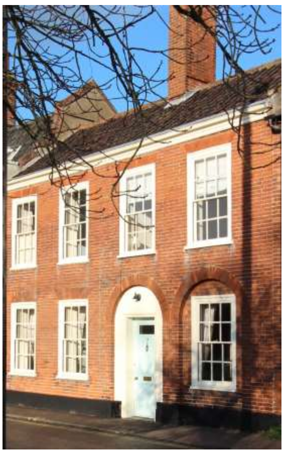
No.15 Trinity Street

No.15 Trinity Street (grade II). Late seventeenth century with eighteenth century red brick façade. Two storey, red brick, wood cornice, black pan tiled roof. Twelve light hornless sashes in flush frames. Flat arched lintels. Pair of arched recesses under each right-hand window the left-hand one containing a five-panelled door, the right a twelve-light sash. Nos 1 to 19 (odd) form a group.