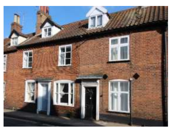
Nos.25 & 25a Upper Olland Street

Nos.21 & 23 Upper Olland Street (grade II) Eighteenth century double fronted structure. No.21 having its entrance in the north elevation. No.21 rendered with a pedimented doorcase and semicircular radial fanlight. Partially glazed fourpanelled door. Two dormers with shallow curved pediments and casement windows. Hornless twelve-light sashes. No.23 in the western or Upper Olland Street elevation. Eighteenth century. No.23 of two storeys and an attic with a single gabled dormer. Red brick with a red pan tiled roof. A single flush framed hornless twelve-light sash to each floor and a six-panelled door within wooden case with a mutular cornice. Nos.21 to 37 (odd) form a group. Subsidiary Structures No.21 has early twentieth century red brick boundary walls to its garden with square section piers.