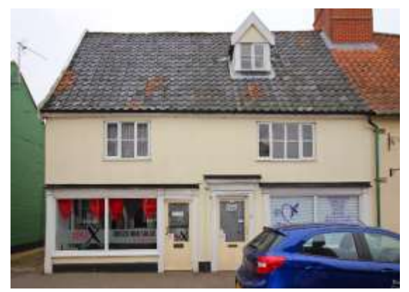
No.24 Upper Olland Street

Nos.22-24 (even) Upper Olland Street (grade II). A seventeenth century structure of two storeys and an attic. Steeply pitched red pan tiled roof containing a single gabled dormer to No.22, No.24 with a black pan tiled roof and a similar dormer. Rendered red brick to timber framed core, plinth. Massive red brick ridge stack rising from spine wall. No.22 with twentieth century casement windows and shop facia. Dentilled eaves cornice. No.24 has casement windows at first floor level. Central late twentieth century glazed door within a wooden doorcase with an eared architrave. Good shop fronts to either side which are possibly of early nineteenth century date. Nos.2 to 10 (even), 14, 16, and Nos.20 to 24 (even) form a group.