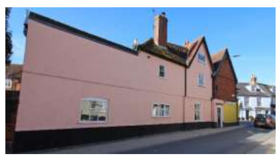
No.2 Lower Olland Street

No.2 Lower Olland Street (grade II). Early seventeenth century. This building interlocks with Nos.1 and 3 Upper Olland Street, qv, and incorporates part of a sixteenth century structure. Of two storeys and an attic. Tiles and pan tiles. Mock half timberwork painted on cement rendering. three-light casement window within gable, two-light casement at first floor level, mullioned and transomed casement to ground floor. Six-panelled door (entrance under left of No.56 St Mary's Street) with architrave convex frieze and cornice. 2'storey wing, left, brick, painted, includes small casement at each floor. No.2 forms part of a group with No.56 St Mary's Street and Nos. 1, 3 & 3a Upper Olland Street. Subsidiary structures. Fine panelled red brick garden wall to south fronting onto Lower Olland Street. Dentilled cornice beneath semi-circular brick cap. Blue brick embellishments.