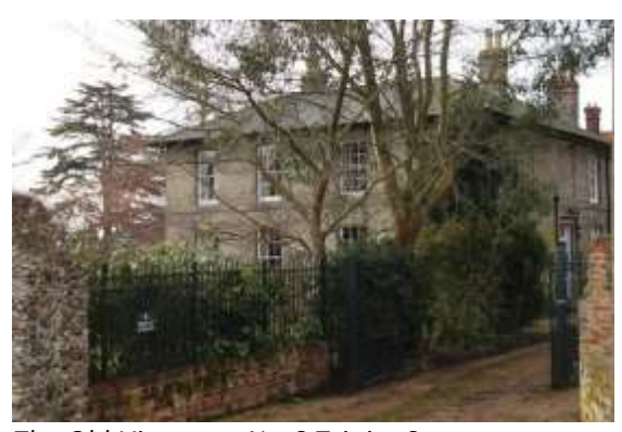
The Old Vicarage, No.6 Trinity Street

For Nos.2 & 4 (Even) including Owles Warehouse, see The Market Character Area.