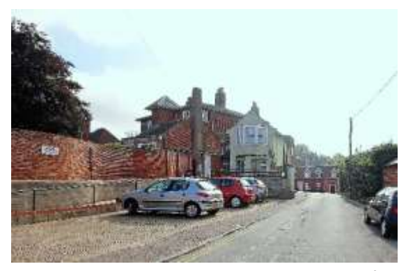
Outney Road elevation and serpentine wall of St Mary's House, No.54, Earsham Street

Eight-panelled door in wooden case with fluted Doric pilasters triglyphs and fret dentil cornice. Wing, to left partly seventeenth century. House built by Giles Borrett. Good early nineteenth century red brick serpentine wall fronting Outney Road. Nos. 54, 56, wing adjoining, walls, and ancillary building together with the bridge over the river Waveney form a group. Bettley, J, and Pevsner, N, The Buildings of England, Suffolk: East (London, 2015) p.154. Reeve C, Bungay Through Time (Stroud, 2009) p41.