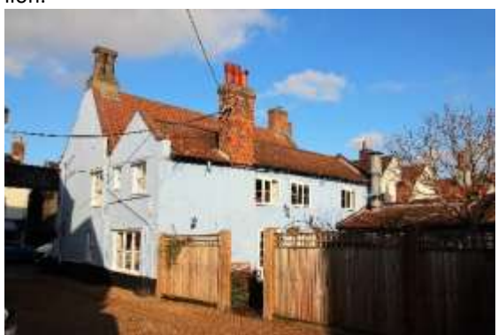
Rear range of The Castle Inn, No.35 Earsham Street

The Castle Inn, No.35 Earsham Street. Public house, formerly known as the White Lion. Reputedly an inn since the seventeenth century or earlier. Early nineteenth century roughcast rendered brick façade which is capped by a parapet which has been reduced in height, and an early to mid-twentieth century stepped pediment surmounted by a stone lion.