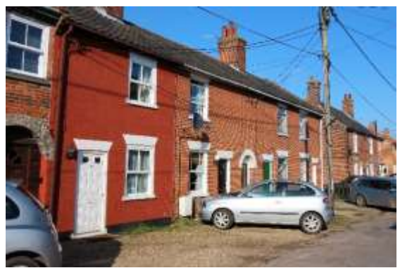
Nos.6-10 (even) Southend Road

Nos.2 & 4 Southend Road. A semi-detached pair of red brick cottages of mid nineteenth century date. Black pan tiled roof. Original door and window openings survive but external joinery replaced. Horned small pane sashes beneath rendered lintels. Door to No.4 boarded, that to No.2 two paneled. Blind return elevation. Garage to No.2 not included.