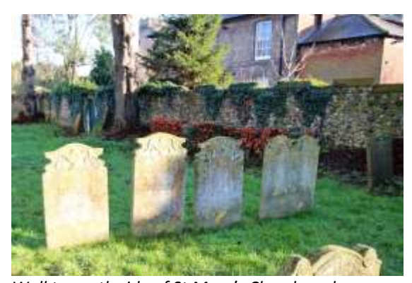
Wall to south side of St Mary's Churchyard