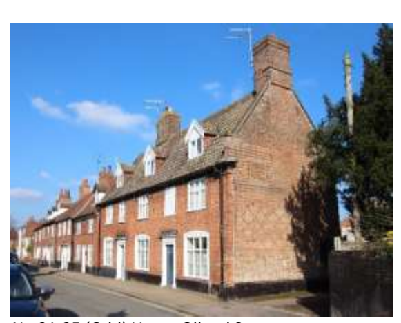
No.31-35 (Odd) Upper Olland Street

Nos.27 & 29 Upper Olland Street (grade II) Eighteenth century pair of cottages of two storeys and an attic. Red brick with a red pan tiled roof. Three-bay façade, with paired front doors to the centre under one enriched cornice. Late twentieth century panelled front doors. Nineteenth century casements to No.27, late twentieth century ones to No.29. Nos.21 to 37 (odd) form a group