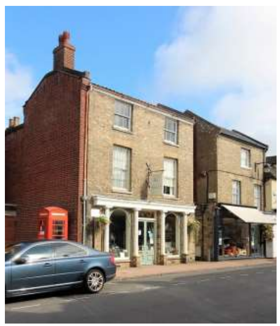
No.40 Earsham Street

No.40 Earsham Street (grade II). Probably of early nineteenth century date and built of red brick with a Suffolk white brick façade of three storeys and two bays, gauged flat arches and glazing bars to sash windows. The building's listing description describes the fine shop facia as being of nineteenth century date. It has fluted Greek Doric three quarter radius columns below a wooden entablature, central entrance with fanlight with gold leaf figures, and arched window each side with ornamental spandrels. The facia does not however, appear on late nineteenth century photographs of the building. Nos. 2 to 40 (even) form a group. Reeve C, Bungay Through Time (Stroud, 2009) p46.