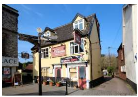
The White Swan, No.16 Market Place

No.14 Market Place (grade II) An early nineteenth century shop of three storeys, two, three-light casement windows at second floor level with flush frames. Two, three-light flush frame sash windows at first floor level. Stucco painted. Low pitched black pan tiled roof. Coupled mutules to eaves. Early nineteenth century shallow projecting splay ended wooden shop front running the full width of the ground floor, with central double doors and a mutular entablature. Red brick two storey rear range. Nos.2 to 16 (even) form a group. The rear section of the plot on which this building stands is within the scheduled area of the Castle complex.