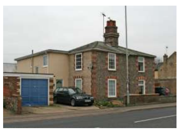
Nos.18 & 20 St John's Road

Nos.14 & 16 St John's Road. An early to midnineteenth century semi-detached pair of cottages. Suffolk white brick façade with a black pan tiled roof. Formerly symmetrical façade, No.16 now altered. No.14 retains a wooden doorcase with pilasters and a dentilled cornice. Late twentieth century partially glazed front door. Blind panel above doorcase. Late twentieth century casements within original openings. No.16 has had its front door replaced by a window and again has late twentieth century casements. Subsidiary Structures Low red brick boundary wall with glazed cap probably of early twentieth century date. Garage to No.16 not included.