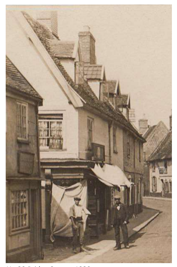
No.29 Bridge Street c1920