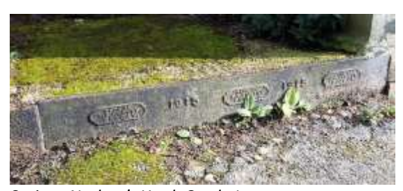
Stair to Nathan's Yard, Castle Lane

No.4 Castle Lane. Two storey red brick with pan tiled roof of both red and black pan tiles. Probably early to mid-nineteenth century but with late twentieth century casement windows. The central two bays probably represent the earliest surviving phase and have a single bay, two storey addition at either end. Ridge stack on former gable end. Forms part of the setting of a section of the scheduled Castle wall.