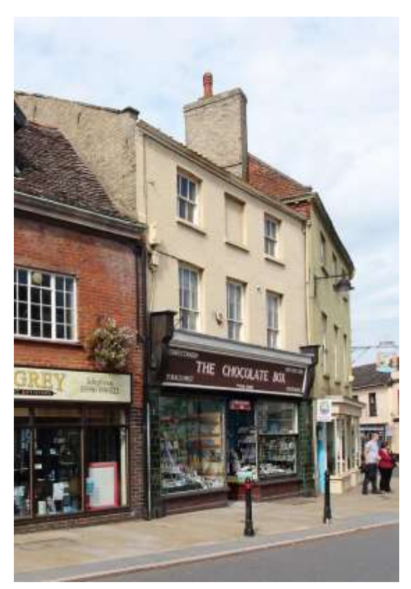
No.6 Market Place

No.6 Market Place. A mid nineteenth century shop with domestic accommodation above. Three storeys and three bays. Faced in gault brick with a painted façade. Nine light hornless sash windows to first and second floors. Second floor with blind central recess. Notable early twentieth century glazed tile shop facia with deep green and chocolate coloured tiles and carved wooden brackets. Decorative brass pilasters to entrance. The rear section of the plot on which this building stands is within the scheduled area of the Castle complex. Honeywood F, Morrow P, & Reeve C The Town Recorder, A History of Bungay in Photographs (Bungay, 1994) p135.