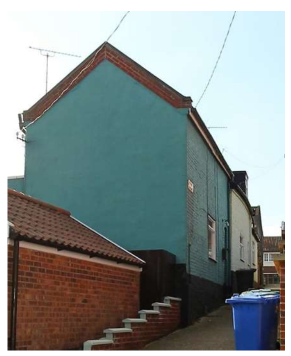
Rose Cottage and No.4 Stone Alley

Rose Cottage and No.4 Stone Alley. A semidetached pair of small cottages of probably later eighteenth-century date, which were altered in the later twentieth century. They are of one and a half storeys, and faced in brick which is either painted or rendered. Late twentieth century casement windows. Pan tiled roof. Early twenty first century addition to No.4.