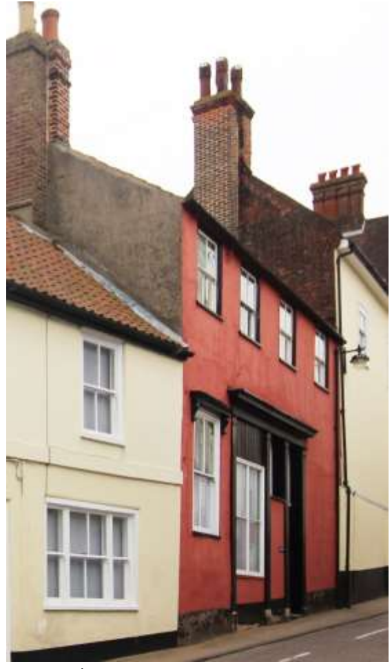
Nos.2 Bridge Street

Nos.2 Bridge Street (grade II). Formerly part of the Queen's Head Public House (see also No.3 Market Place) and probably of eighteenth, or early nineteenth century date. Painted stucco or imitation brick front of two storeys with a pan tiled roof. The first floor is lit by four, flush framed plateglass sash windows. Later nineteenth century tall wooden former public house facia with elongated pilasters. Part of the facia now contains a twentieth century casement window. Nineteenth century flush-framed plate glass sash window to ground floor left, with hood supported on consoles. Twentieth century door. Tall red brick stack to left hand gable. The Queen's Head probably closed c1913. Nos.2, 4, 6a & 6b, 12 to 20 (even), 24 to 34 (even), 40 to 44 (even), 48 and 50 form a group. Honeywood F, Reeve C, & Reeve T, The Town Recorder, Five Centuries of Bungay at Play (Bungay, 2008) p 89 & 131.