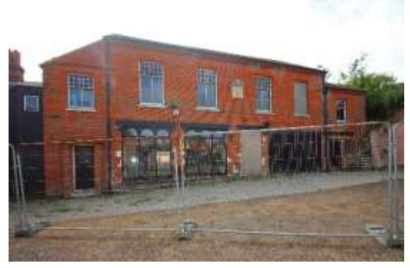
Odd Fellows Hall to the rear of No.2 Market Place

Two storey early to mid-nineteenth century red brick range to the rear, attached to which is a former Odd Fellows Hall of 1887. This is a two storey red brick structure with a hall at first floor level and cart sheds beneath. Horned sash windows to first floor. Black pan tile roof. Nos.2 to 16 (even) form a group. The walls to the rear of the plot are within the scheduled area of the Castle complex.