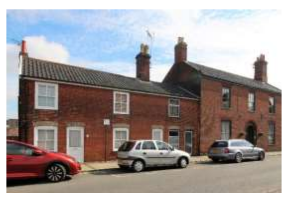
Nos.22, and 24 Broad Street

Cransford, No.20 Broad Street (grade II). An early to mid-nineteenth century dwelling with symmetrical classical façade of two storeys and three bays. Faced in red brick, with a black pan tile roof. At the first-floor level are three flush frame twelve-light sash windows with wedge-shaped brick lintels. The ground floor windows are now plate-glass sashes with narrow margin lights. Central six-panelled arched front door recessed within a double brick arch. Reeded wooden architrave with roundels at the arch's springing point, surmounted by double arch, inner set back 4½ ins. Iron segmental fanlight window, to staircase at back, with radial bars. Seventeenth century wing to the east of two storeys and an attic, rendered, with a pan tile roof. Flush frame sash window at each floor now with centre and margin bars only, four-panel door with glazed upper panels. Later twentieth century two storey rear addition.