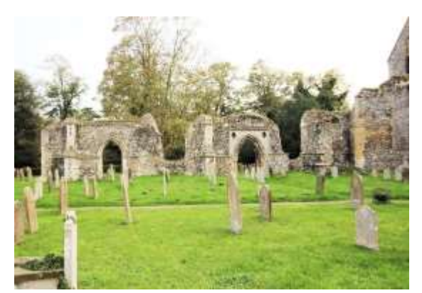
Benedictine Abbey Ruins, St Mary's Street