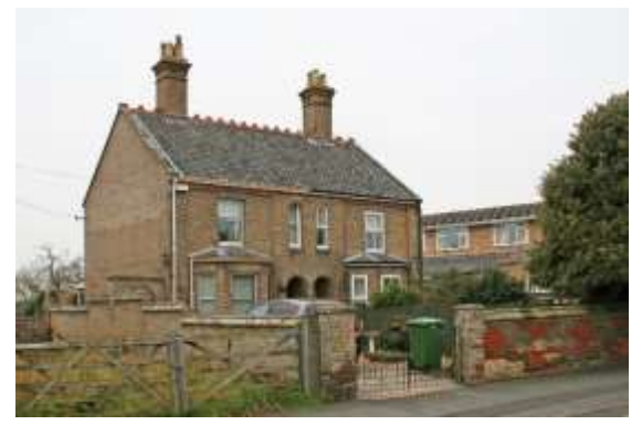
Nos.10 & 12 Flixton Road

Nos.10 & 12 Flixton Road and boundary walls. A semi-detached pair of late nineteenth century gault brick villas. Map evidence suggests that they were constructed between 1885 and 1905. Black pan tiled roof with decorative ridge pieces. Single storey canted bay windows to ground floor. Doors within arched recessed porches. No.12 has its original plate glass horned sashes. The windows to No.10 have been replaced with casements. Subsidiary Structures Notable stepped gault brick wall of c1890 to south side of No.12. Similar though less decorative wall to north of No.10. red brick wall with gault brick piers to Flixton Road. Gault brick gateway with arched door opening to north side of No.10. red brick garden walls to rear.