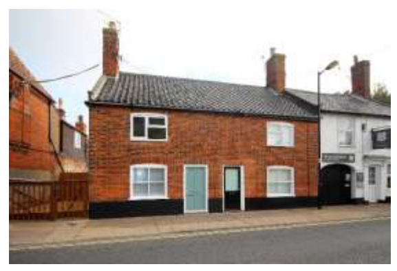
Nos. 14 & 16 Chaucer Street

No.12 Chaucer Street. A mid nineteenth century dwelling, now (2017) offices. Painted red brick with a black pan tile roof. Two storeys and two bays with a cart entrance to the rear yard in the left-hand bay. Window joinery replaced in the early twenty first century. Doorcase with panelled pilasters and scrolled corbels. Door within a later twentieth century partially glazed one.