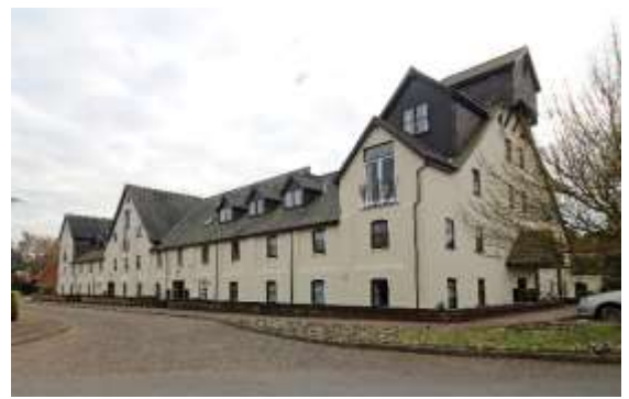
Nos.1-23 (cons) The Maltings, Staithe Road

Nos.1-5 The Watermill, Staithe Road). Former provinder (or animal feed) mill of 1902 built for the Marston family, closed c1956 and now converted to apartments. Wheel and machinery removed. Its watercourses have been partially filled in and turfed over. Painted brick and weatherboarding. Twentieth century wooden casement windows. The site has long been occupied by water powered mills, the previous one being destroyed by fire c1900.