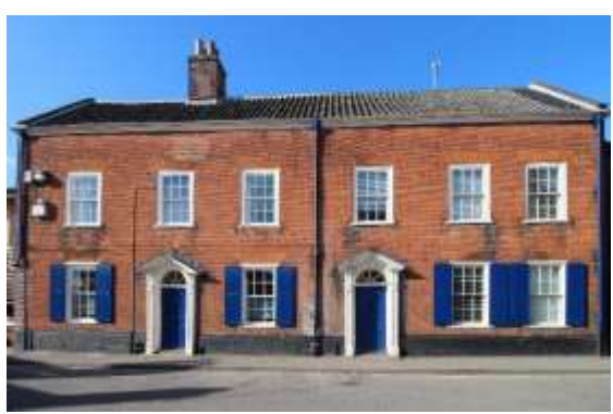
Nos.8-10 (even) Upper Olland Street

No.6 Upper Olland Street (grade II). Early eighteenth century, two storey, red brick. Black pan tiled roof, tumbled gables, and a coved cornice. Full height corner pilasters with moulded caps. Two bay street façade with hornless twelve-light sash windows to the first floor within flush frames. Late twentieth century shop front. Nos.2 to 10 (even) Nos.14, 16 and Nos.20 to 24 (even) form a group