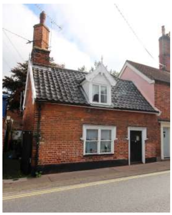
No.6 Chaucer Street

No.6 Chaucer Street. A small red brick structure externally of early to mid-nineteenth century appearance but possibly a re-casing of an earlier structure. Red brick with painted stone dressings and a black pan tile roof. Street frontage range of a single storey and attics, substantial largely nineteenth century rear range of two storeys. Hood moulds to window and door openings, gabled dormer to attic with elaborate bargeboards. External joinery largely replaced. Tall brick chimneystack to left-hand gable. In the nineteenth century the Two Brewers Public House.