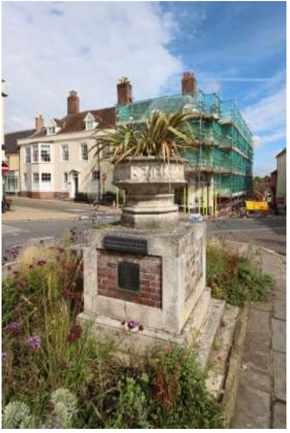
Memorial in Market Place

Wall to rear of No.23 Market Place -see Saint Mary's Street