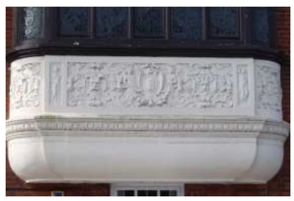
Pargetted decoration, Billiard Room wing, Earsham House, No.12, Earsham Street