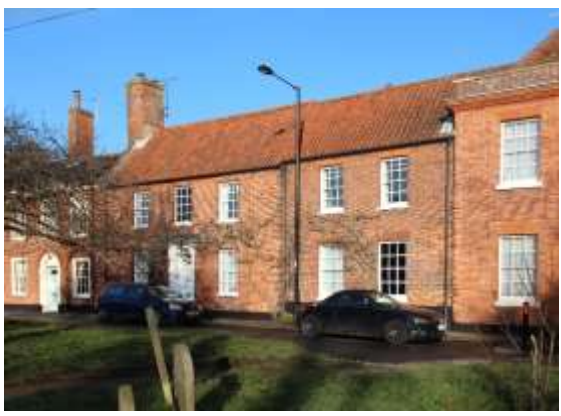
No.17 Trinity Street

No.15 Trinity Street (grade II). Late seventeenth century with eighteenth century red brick façade. Two storey, red brick, wood cornice, black pan tiled roof. Twelve light hornless sashes in flush frames. Flat arched lintels. Pair of arched recesses under each right-hand window the left-hand one containing a five-panelled door, the right a twelve-light sash. Nos 1 to 19 (odd) form a group.