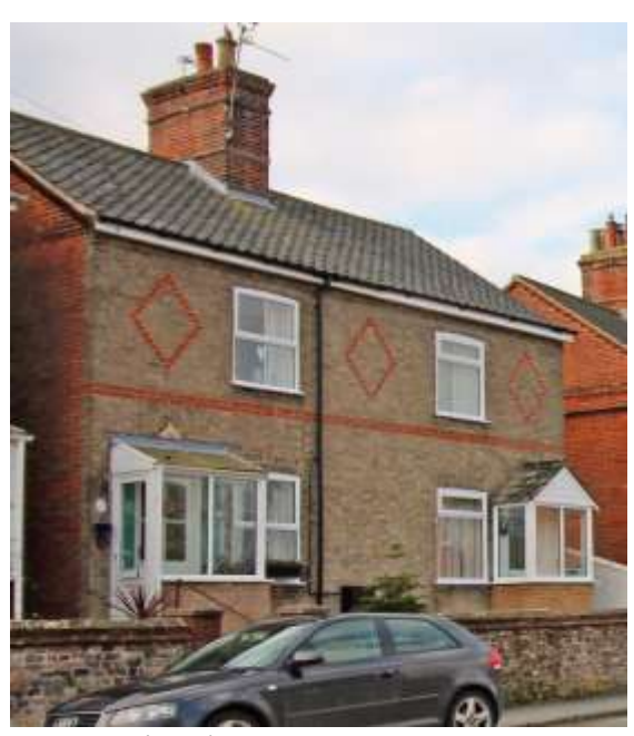
Nos.30-32 (even) Staite Road

Kimberley Terrace Nos.12-28 (even) Staithe Road. Two terraces of red brick cottages of c1902. Gault brick cambered lintels to ground floor windows. Black pan tiled roof. Most external joinery replaced but original openings preserved. Contemporary red brick boundary wall to Staithe Road.