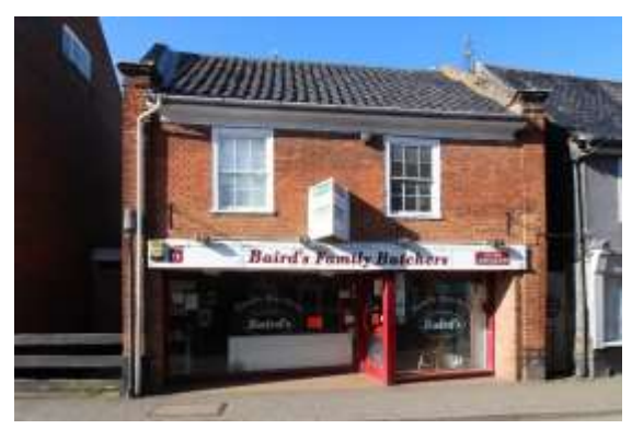
No.6 Upper Olland Street

No.4 Upper Olland Street (grade II). Eighteenth century, of two storeys with a painted stucco façade. Two flush framed mullioned and transomed casements at first floor level. The shop facia is not of nineteenth century date as suggested in the listing as it does not correspond to that in c1900 photographs. Six-panelled door. Black pan tiled roof. Nos.2 to 10 to late-(even), No.14, I6 and Nos.20 to 24 (even) form a group. Honeywood F, Morrow P, & Reeve C, The Town Recorder, A History of Bungay in Photographs (Bungay, 1994) p185.