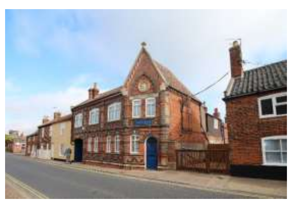
Masonic Rooms, Nos.18-22 Chaucer Street

Nos. 14 & 16 Chaucer Street. An early to midnineteenth century semi-detached pair of cottages. Of red brick with a shallow pitched black pan tile roof. Red brick stacks rising from gable ends. Replacement casement windows beneath shallow arched brick lintels. Brick lintels to doors possibly replaced. Four-panelled door to No.16. No.14 has a late twentieth century partially glazed front door.