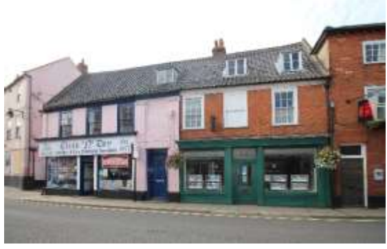
Nos.1-3 Earsham Street

Nos.1-3 Earsham Street (grade II). An eighteenthcentury house, now converted to shops. Of two storeys and an attic, with three dormers set within a black pan tiled roof. Red brick, with a coved cornice. A pair of two storey brick pilasters with stucco caps flank the central entrance, with a blank panel above at first floor level. Six twelve-light sashes with flush frames. Central six-panelled door (No.1) with lozenged fanlight and case with reeded architrave and roundels. Twentieth century shop facia to No.1, and an early nineteenth century wood shop front, to No.3 with a central entrance and pilasters. The section to the left of the door is a later addition to the original facia. Nos.1 to 19 (odd) form a group. The rear section of the plot on which this building stands is within the scheduled area of the