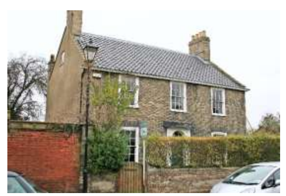
No.34 Upper Olland Street

No.34 Upper Olland Street (grade II). An early nineteenth century detached villa with a symmetrical classical entrance façade of three bays. Of two storeys with attics lit from within the gabled return elevations. Suffolk white brick façade with a mutular cornice, and a black pan tiled roof. Rear elevation red brick, side elevations rendered. Three twelve-light hornless sashes within flush frames at first floor level. Two further twelve-light sashes with flat arched lintels flanking the doorcase. Sixpanelled entrance door with arched patterned fanlight in an enriched wooden case. Northern return elevation highly visible from chapel graveyard. Rear elevation with nineteenth century casements beneath cambered lintels. Subsidiary Structures Screen walls to the left and right at a right-angle, each seven feet high with a stone cope, with a side door and blank panel respectively, square section piers. Low brick wall to front. Nos.30 to 34 (even), Emmanuel church and Nos.38 to 52 (even) form a group.