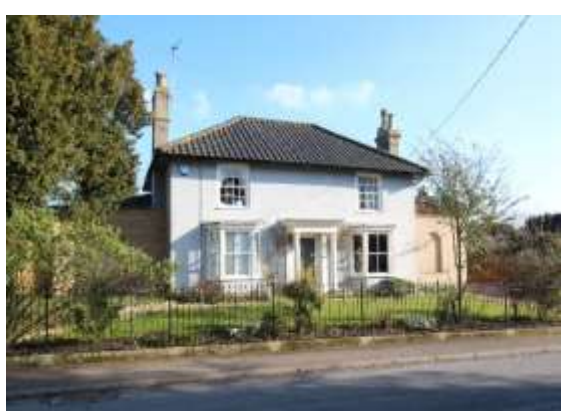
No.11 Flixton Road

No.9 Flixton Road (grade II). Early nineteenth century villa of two storeys. Faced in Suffolk yellow brick, with a hipped black pan tiled roof with wide overhanging eaves. Symmetrical façade divided into three bays with wide shallow brick panels and with wide connecting horizontal band at first floor level. Each panel has a horned plate-glass sash at its centre with a margin to take louvred and panelled shutters, now removed. Sashes, in flush frames, with glazing bars and small border panes at sides, flat arches. Single storey wings with blank panels. Six-panelled door with frieze and cornice, Wooden porch with square-section panelled columns, trellis screen either side. Nos.9 to 13 (odd) form a group.