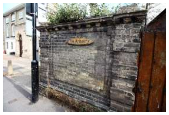
Boundary wall to The Armoury, Broad Street

Boundary wall to The Armoury. Mid nineteenth century gault brick wall with decorative panels between rusticated pilasters. Dentilled cornice and projecting plinth. Flanks the Broad Street garden entrance to The Armoury. For 'The Armoury' itself, see No.10a Nethergate Street.