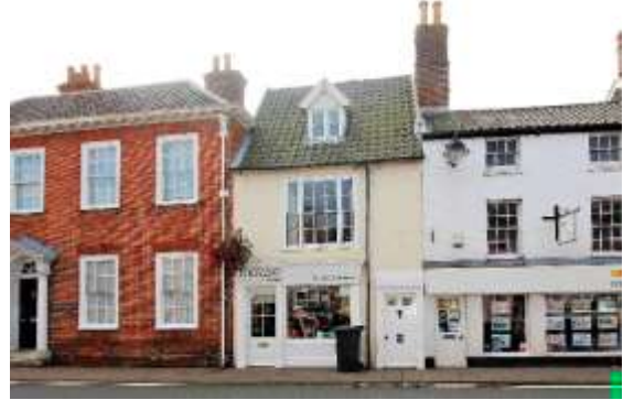
No.17 Earsham Street

No.15 Earsham Street (grade II). A substantial house with the date 1807 on its surviving original lead rainwater heads. Of two storeys and five bays with a distinguished symmetrical classical façade to Earsham Street. Red brick, plinth, and a wooden mutular cornice. Hipped black pan tile roof. Symmetrical five bay classical façade with twelvelight hornless sashes which are set within flush frames beneath wedge shaped brick lintels. Centrally placed six-panelled door, with panelled reveals to wooden case, arched radial bar fanlight, Doric columns and open pediment. Nos.1 to 19 (odd) form a group. The rear section of the plot on which this building stands is within the scheduled area of the Castle complex. Bettley, J, and Pevsner, N, The Buildings of England, Suffolk: East (London, 2015) p.154. Reeve C, Bungay Through Time (Stroud, 2009) p36.