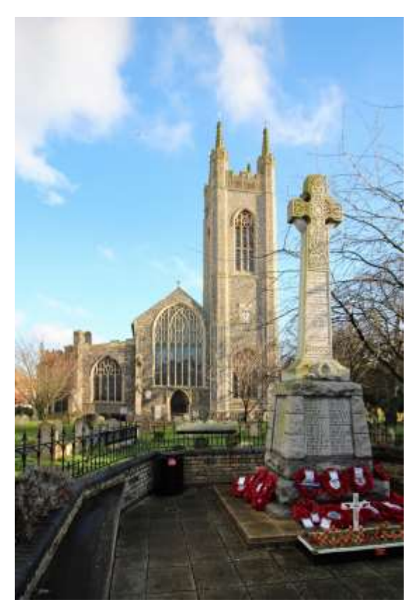
St Mary' Church, St Mary's Street

St Mary' Church and Benedictine Abbey Ruins, St Mary's Street (grade I). A former parish church, closed 1977, and now redundant. Originally this was the Church of the Holy Cross, attached to a Benedictine nunnery, the ruins of which partially survive to the east side of the church. The nunnery was dissolved and partially dismantled at The Reformation and then badly damaged in the fire of 1688. Nave, aisle and porch primarily fifteenth century. The late fifteenth century tower is arguably the dominant feature in the townscape. Its parapet and battlements are of 1702. Octagonal buttresses carried above the parapet as pinnacles. Fire damaged 1688, internally refitted and south aisle re-roofed, as dated on a rafter, in 1699. Church