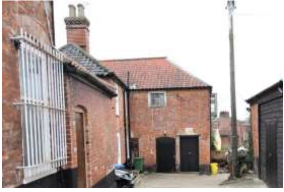
Rear range of No.4 Bridge Street from Trinity Street

Nos.4, No. 6a & 6b Bridge Street and garden walls to rear. (grade II). Standing on the corner of Borough Well Lane and probably of early eighteenth century date. Of two storeys and an attic, with a low two storey rear range facing Borough Well Lane. Rendered and painted with a platt band below the first-floor windows. Four-light plate glass sashes with horns to the first floor. One gabled dormer to No.4 within a replaced red pan tiled roof. No.4 is shown with a shop facia to the ground floor right on c1920 photographs, but this has been replaced by a tripartite sash. To the left of the four-panelled front door is a relatively recent four-light horned sash, in a segmental arched opening. A small central window at first floor level is also shown on early photographs. To the rear of No.4 is a red brick range with an elevation facing a yard off Trinity Street. This has a black pan tiled roof to Borough Well Lane and a red pan tiled roof to its other faces. A late nineteenth century wooden oriel window is set within the end wall at first floor level. Below this window there was evidently a further recently demolished single storey projection