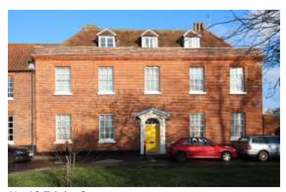
No.19 Trinity Street

hornless sashes to the outer bays. Six-panelled door in wooden case with panelled reveals, eared architrave, frieze, and cornice. Lozenged fanlight. Slightly recessed two storey wing to the right, including painted dummy window at ground floor and brickwork with dark headers. Nos.1 to 19 (odd) form a group.