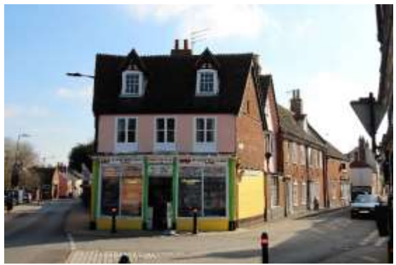
No.56 St Mary's Street

No.56 St Mary's Street (grade II). An eighteenth-century structure of two storeys and an attic, standing in a prominent location at the junction of St Mary's Street, Upper Olland Street, and Lower Olland Street. Tiled roof with two gabled sash dormers with glazing bars. St Mary's Street façade of two bays with two, near flush framed casements at first floor level. Red brick, part painted, and part stuccoed. Bowed shop front, with a central entrance, in a wooden case with reeded pilasters and an enriched entablature. No.56 forms a group with No.2 Lower Olland Street and Nos.1, 3, 3A Upper Olland Street. Nos.42 to 56 (even) form a group.