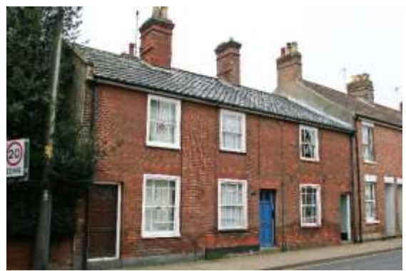
Nos.30-34 (even) Lower Olland Street.

Nos.18 &20 (even) Lower Olland Street. A semidetached pair of early nineteenth century cottages. Red brick with a black pan tiled roof. Three bays wide with, at first floor level, a blind central panel flanked by sash windows. Twelve-light hornless sash window to first floor of No.18 probably the only original survival. The other windows are late twentieth century ones of varying designs. Six panelled front doors.