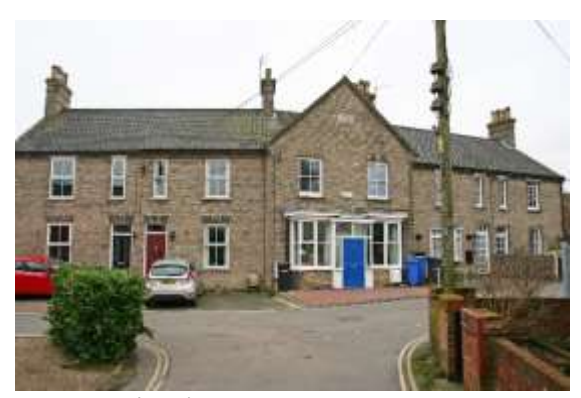
Nos.33-41 (Odd) Southend Road

Nos.9 & 11 Southend Road. A semi-detached pair of mid-nineteenth century houses. Principal façade of red and blue brick with painted stone dressings and quoins. Shallow pitched Welsh slate roof with deep overhang to eaves. Neo-Norman arched doorcases with quarter pilasters and dog tooth frieze. Original arched six-paneled doors. No.11 retains its fourpane horned sashes. No.9 with casement windows and shutters. Substantial twentieth century additions to the rear.