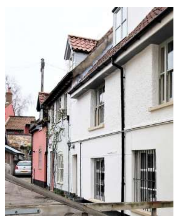
Nos.23-27 (odd) Earsham Street

Nos.23-25 Odd Earsham Street. A pair of altered c1800 cottages standing in a private courtyard to the rear of No.29. No.23 rendered and of a single storey with an attic lit by a gabled dormer. Late twentieth century window joinery. No.25, two storeys of painted brick with casement windows and a weatherboarded gabled dormer. The rear section of the plot on which this building stands is within the scheduled area of the Castle complex.