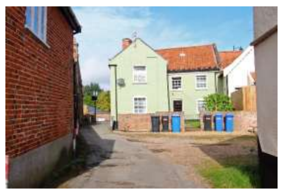
Nos.69-71 Earsham Street from Castle Lane, the wing on the left was formerly a separate cottage.