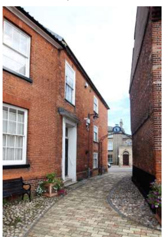
No.10 Earsham Street

No.10 Earsham Street. A red brick two and three storey structure of mid to late eighteenth century date formerly part of the service range of the grade II listed No.12 Earsham Street. Simple wooden doorcase and hornless sash windows. The listed status of this range is not clear.