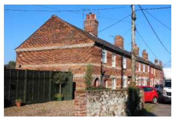
Nos.12-20 (even) Southend Road

front door. Other external joinery replaced but original openings preserved.