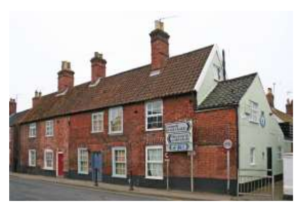
Nos.10-16 (even) Lower Olland Street

Nos.6&8 Lower Olland Street. A semi-detached early to mid-nineteenth century pair of houses with a gault brick façade and rendered red brick return elevations. Black pan tiled roof. Red brick chimney stacks. Three bay façade, with central blind panel flanked by twelve-light hornless sashes at first floor level. Paired four panelled front doors beneath a continuous flat-arched lintel. Wide tripartite hornless sashes to outer bays.