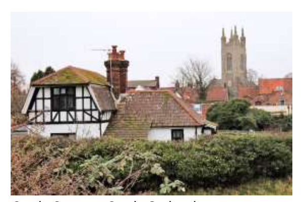
Castle Cottage, Castle Orchard

Outbuilding, The Keep, Castle Orchard. A small red brick and rubble outbuilding with a weatherboarded gable and a black and red pan tiled roof. Probably of mid nineteenth century date. Prominently located within the setting of the scheduled ancient monument.