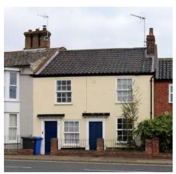
No.11 St John's Road

No.9 St John's Road. House of early to midnineteenth century date. Of painted red brick. Black pan tiled roof. Red brick stack of three linked grouped shafts to ridge. Two storey wooden canted bay window with four-pane plate-glass sashes. Doorcase with corbels. Twentieth century partially glazed door. Window above door with corbelled hood and pilastered frame.