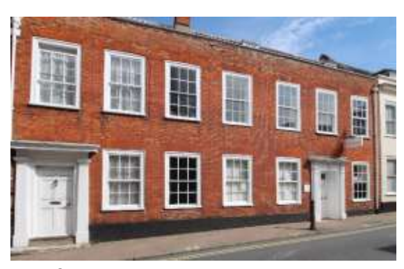
Nos.1&3 Trinity Street

Nos.1&3 Trinity Street (grade II). A pair of eighteenth-century houses with a unified seven bay two storey red brick façade to Trinity Street. Attic floor lit by dormers largely hidden behind parapet with a rendered cope. Pan tiled roof. Two false windows painted to look likes sashes. Twelve-light hornless sash windows within flush frames, and beneath flat arches. Where windows have been replaced the replacements have horns. Lead rainwater heads. No.1 has a six-panelled door in wooden Doric case. No.3 with a six-panelled door, panelled reveals, fluted pilasters, frieze with swag enrichment and centre medallion head. Nos.1 to 19 (odd) form a group.