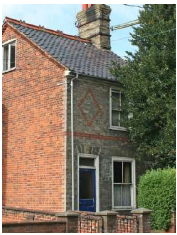
No.36 Lower Olland Street

Nos.30-34 (even) Lower Olland Street. A well-preserved row of three small terraced houses of mid-nineteenth century date. Red brick with a black pan tiled roof. Entrance to No.30 within a passage way accessed from a doorway at the far north of the Lower Olland Street elevation. Six-panelled door to No.32 with glazed upper lights. Late twentieth century panelled door to No.34. Horned sashes with margin lights and flush frames to ground and first floors. Ground floor openings with flat arched lintels.