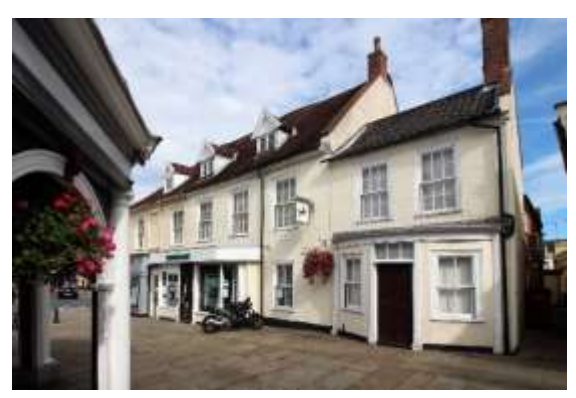
No.11a Market Place

Nos.9 & 11 Market Place (grade II). An early eighteenth century building on a prominent corner site. Of two storeys with attics which are lit by gabled sash dormers. Colour-washed brick. Red plain tile roof covering. Principal elevation of six bays and a return elevation of four. Flush framed twelve-light hornless sashes beneath rusticated cambered arches to first floor. Entrance door with fanlight and wood case. Mainly modern shop fronts. Originally one building. Essentially part of the old market. Nos.1 to 11 (odd), Nos.11A, 13 and Nos.17 to 21 (odd) form a group together with the Butter Cross.