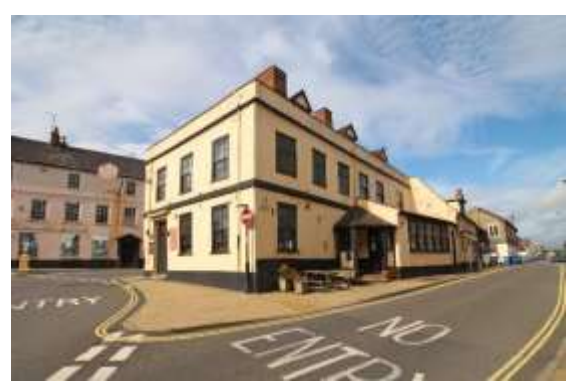
Broad Street and Market Place facades of The Three Tuns, No.2 Earsham Street

twentieth century and is not included within the listing. Hipped plain tile roof with two massive red brick ridge stacks, and three flat roofed dormers to the Earsham Street façade. Faced in painted red brick with a plat band below the first-floor windows, and a high plinth. Four first floor original leaded mullion transom windows to Broad Street front, the rest being sashes in flush frames in replacement of the originals, flat arches. At ground floor, former garage, and butcher's shop with wood fronts. Earsham Street façade of seven bays with a centrally placed six-panelled door with an arched fanlight (now blank) in a wooden case with Doric columns and an open pediment.