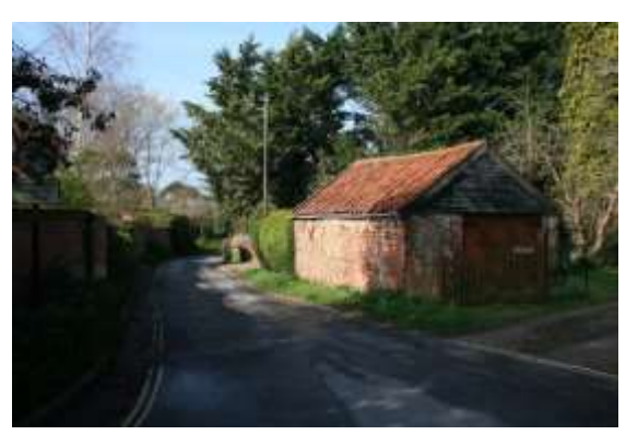
Outbuilding, The Keep, Castle Orchard

setting of the Castle ruins and directly abuts the scheduled monument.