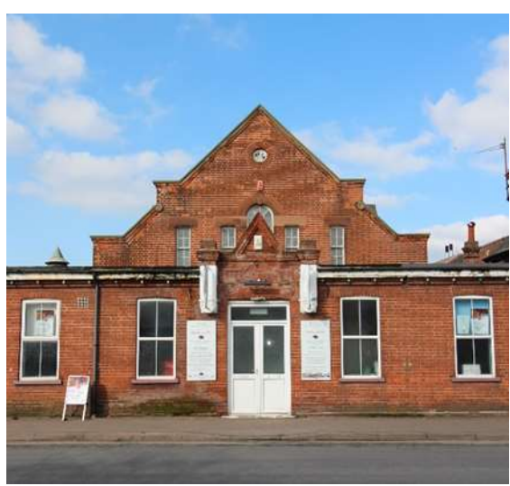
The Chaucer Club

For the Green Dragon Inn and its outbuildings see Broad Street.