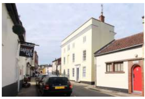
Nos.1-3 Cross Street

See also No.12 Market Place & 2a Trinity Street