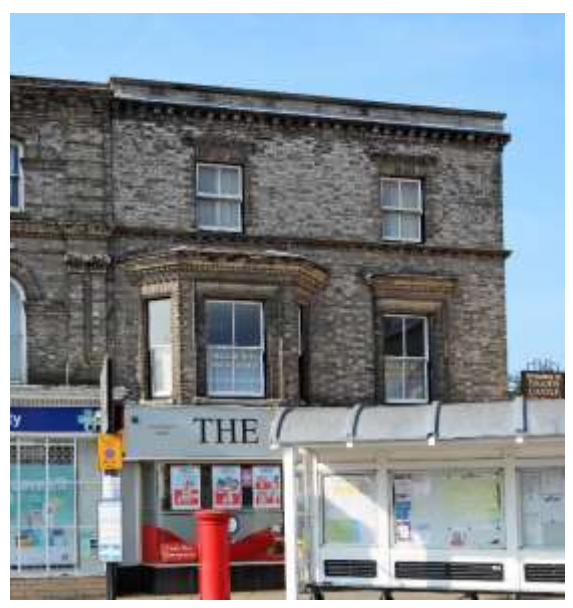
No.2 St Mary's Street

No.2 St Mary's Street. A red brick house and shop of c1800, re-fronted and partially rebuilt in Suffolk white brick c1870 probably to the designs of William Oldham Chambers of Lowestoft who designed the adjacent façade to the south. Three storey white brick façade of two bays, with canted bay to first-floor left. Horned plate-glass sashes. Parapet with dentilled cornice. Late twentieth century shop facia. Early nineteenth century red brick range to rear with hornless sashes. Some windows with glazing bars removed. Taller two bay mid-nineteenth century red brick addition with plate-glass sashes. Flat-arched lintels and stone sills. Hipped roof with overhanging eaves. Return elevation rendered.