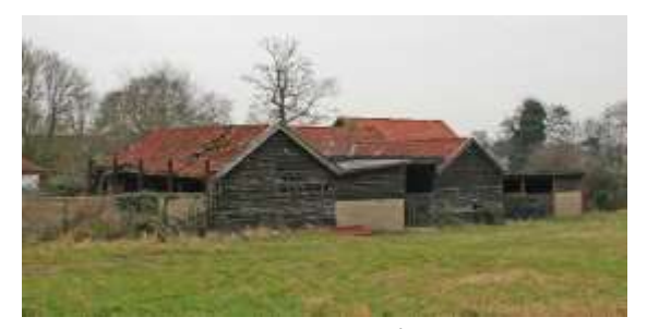
Farm buildings at No.55 St John's Road

Farm buildings, St John's Road. A weather boarded single storey group of farm buildings with red pan tile roofs. Grouped around the north, east, and west sides of a formerly open courtyard and located to the south of No.55 St John's Road. Including an open-fronted cart or implement shed. A key group of buildings at the southern entrance to the Conservation Area. Red brick nineteenth century structure with a red pan tiled roof to rear of two storeys. Shown on the 1885 1:2,500 Ordnance Survey map and at that time part of Ollands Farm. Late twentieth century breeze block additions and infill to courtyard not of interest.