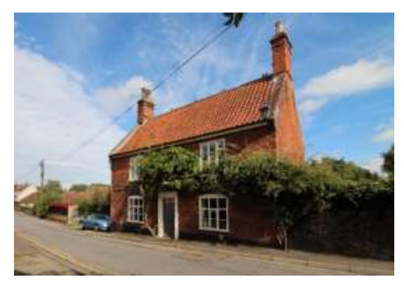
No. 18 Nethergate Street

No.16 Nethergate Street. A detached red brick dwelling of early nineteenth century date. Formerly two houses. Black pan tiled roof with decorative ridge pieces. Tall decorative ridge stacks. Late twentieth century six-panelled door and casement windows within original openings. Flat-arched brick lintels. Late twentieth century flat roofed addition to right and rear.