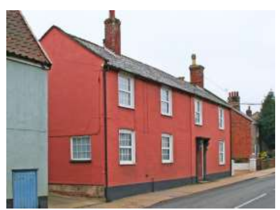
No.48 Lower Olland Street

'Laurel Villas', Nos.38-40 (even), Lower Olland Street. A semi-detached pair of cottages of 1893 built of red brick with blue brick embellishments and stone dressings. red pan tiled roof wit central ridge stack rising from the spine wall. Four- pane horned plate-glass sash windows and partially glazed front doors. Dentilled eaves cornice, string course, and tile panel to centre. Single storey twentieth century additions to rear. Subsidiary Structures Contemporary low red brick boundary wall with square-section piers to Lower Olland Street and northern boundary.