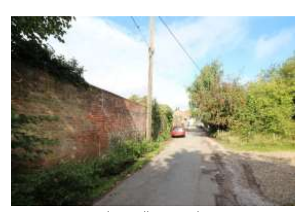
Scott House, garden walls to Castle Lane

Fronting onto Castle Lane the walls are largely of red brick and probably of mid nineteenth century date.