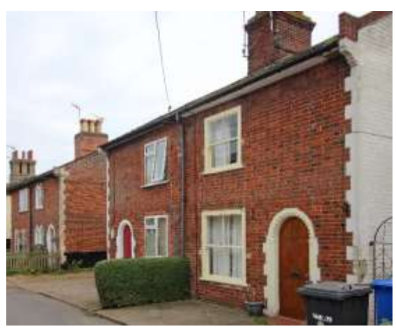
Nos.9 & 11 Southend Road

No.7 Southend Road. A mid-nineteenth century cottage which forms part of a semi-detached pair with the much altered No.5 (not included). Red and blue brick with painted stone dressings and quoins. Shallow pitched Welsh slate roof with deep overhang to eaves. Neo-Norman arched doorcase. Six-paneled door. Pointed arched windows divided by central splayed mullion.