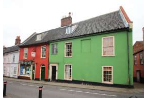
Nos.12-14 (even) Bridge Street.

missing. Four-light plate glass sashes to rear range fronting Borough Well Lane. Nos.6a & 6b were once the Green Dragon Public House and are shown as a public house on the 1885 Ordnance Survey map. The pub reputedly closed c1909. Nos.2, 4, 6a & 6b, 12 to 20 (even) 24 to 34 (even), 40 to 44 (even) 48 and 50 form a group. Reeve C, Bungay Through Time (Stroud, 2009) p57. Honeywood F, Reeve C, & Reeve T, The Town Recorder, Five Centuries of Bungay at Play (Bungay, 2008) p97 & 132.