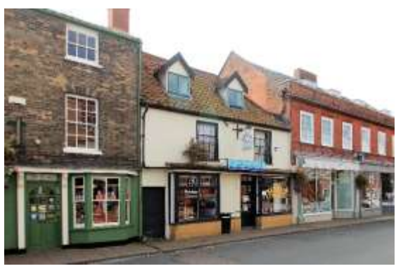
No.49 Earsham Street

The Folly, No.47 Earsham Street. Nineteenth century single storey structure of painted brick set well back from Earsham Street. Twentieth century additions not of interest. Close to the site of the Castle and within the scheduled area of the Castle complex.