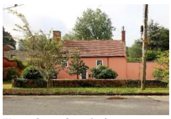
Waveney Cottage, Outney Road

Waveney Terrace, Nos.24-34 (even). Outney Road with boundary walls. A terrace of six substantial houses in three mirrored pairs of c1881. Shown on the 1885 1:2,500 Ordnance Survey map. Red brick with a gault brick façade and stone dressings. Welsh slate roof and corbelled eaves cornice. Each house is of two bays, one with a full height canted bay window. The other containing an arched porch with a pronounced key stone. Four-light plate glass sash above. Four panelled doors with glazed arched upper lights. Horned plate glass sashes. Late nineteenth century low gault brick boundary wall with square section gault brick gate piers. Decorative iron railings and gates now removed. Glazed tile paths to front doors of a geometric design. Red brick rear boundary walls and rear elevation. A good example of a speculatively built later nineteenth century terrace retaining the bulk of its original features and joinery. Honeywood F, Morrow P & Reeve C, The Town Recorder, A History of Bungay in Photographs (Bungay, 1994) p143.