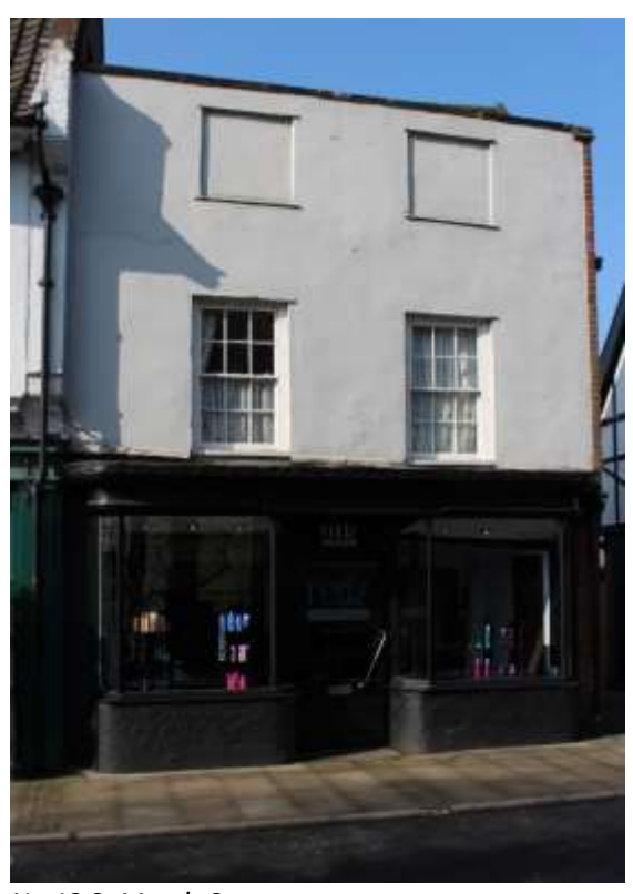
No.12 St Mary's Street

No.12 St Mary's Street (grade II) Later eighteenth century, three storey, red brick, with a stuccoed façade and a stone cope. Pan tiles. Good wooden shop facia with a central door and rounded corners to the flanking bays, later twentieth century glazing. Two twelve-light hornless sashes at first floor level. Two blank panels to second floor. Flush frame sash window in gable on norther return elevation. Nos.2-22 (even) form a group.