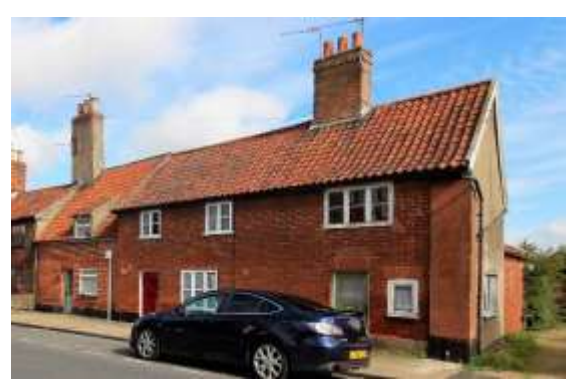
Nos.54 & 56 Broad Street

Nos.54 & 56 Broad Street A pair of cottages with early nineteenth century facades and steeply pitched red pan tile roofs. Shared central ridge stack. Possibly a re-fronting of an earlier structure. Casement windows. Those to No.56 are of late twentieth century date, however the first-floor window of No.54 may be earlier. Twentieth century front doors. Wedge shaped lintels to door and window openings. No.54 has a single storey late twentieth century addition to the rear and a rendered return elevation.