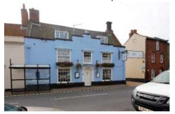
The Castle Inn, No.35 Earsham Street

beneath cambered arches. Possibly the public house known as the Butchers Arms listed in the 1909 town rates book. The rear section of the plot on which this building stands is within the scheduled area of the Castle complex.