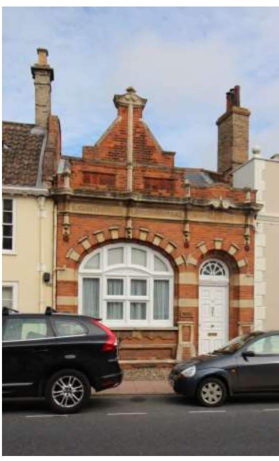
No.18a Earsham Street.

No.16 Earsham Street (grade II). A substantial seventeenth century townhouse, which is reputed to have been built in 1620. Three-storey, four-bay, stuccoed façade to Earsham Street with rusticated quoins and a parapet capped by ball finials. Moulded plaster plat band beneath second floor windows, moulded cope to parapet. Four original mullioned and transomed casements with stucco architraves at first floor level. Eight-panelled door, right of centre, in wood case with panelled reveals, pilasters and entablature flanked by twelve-light sashes. Black pan tile roof with gault brick stacks. Some original interior doors. Nb. C1900 photos show the house without the present second floor and parapet but with dormers set within the roof this part of the façade is however evident in c1930 views. Nos. 2 to 40 (even) form a group. Honeywood F, Morrow P & Reeve C, The Town Recorder, A History of Bungay in Photographs (Bungay, 1994) p148.