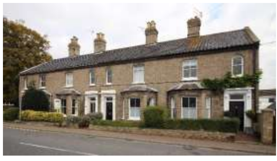
Nos.1-7 (Odd) St John's Road

Southend Terrace, Nos.1-7 (odd) St John's Road. A well-preserved gault brick terrace of 1893. Black pan tiled roof. Each house has a pilastered doorcase and a canted bay to the ground floor and at first floor level a strong course and two sash windows. The window above each doorcase is a narrow arched one. Original horned glass sashes