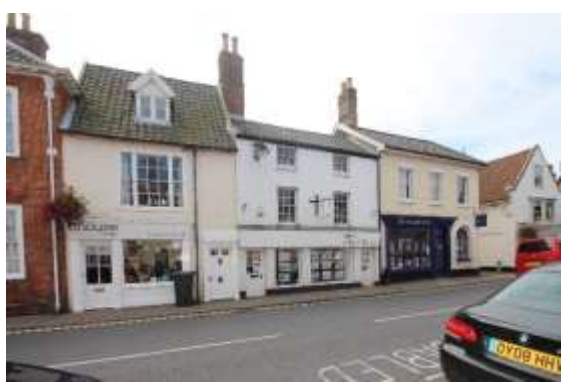
No.19 Earsham Street

No.17 Earsham Street (grade II) Early eighteenth century, two storey and attic, gabled dormer, pantiles. Brick, painted. three-light sash window with flush frame and glazing bars. Early nineteenth century shop front with pilasters, modillion cornice (covered), and modern glazing. Separate sixpanelled door in wood case. Nos.1 to 19 (odd) form a group. The rear section of the plot on which this building stands is within the scheduled area of the Castle complex.