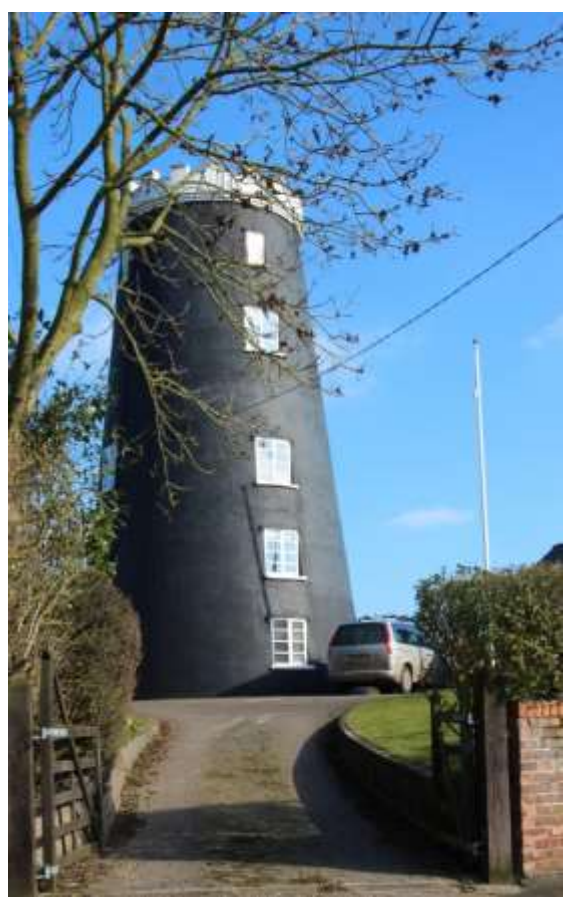
Tower Mill, Tower Mill Road

Tower Mill, Tower Mill Road (grade II). A former wind powered corn mill of c1830. The mill was in use until c1918 but its boat shaped cap, sails, fantail, and top storey were reputedly removed soon after. Now converted into a dwelling. Now a five-storey circular tower with c1924 crenellations, painted brown brick. Formerly linked to the adjoining single storey red brick engine house by a drive belt enclosed in a boarded wooden frame. Subsidiary Structures Later nineteenth century single storey red brick engine house now converted to a dwelling. This provided auxiliary power to the mill.