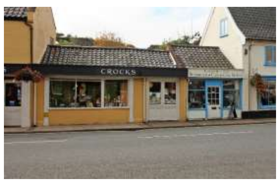
Nos.9-11 Earsham Street

No.7 Earsham Street (grade II). A house and shop of eighteenth and early nineteenth century date. Of two storeys and an attic and faced in painted brick. First floor platt band, plinth, black pan tiled roof. Two sash windows to each floor with glazing bars and flush frames, cambered arches to ground floor windows. Four-panelled door in stucco case with consoles. Modern shop facia in small wing on righthand end. Nos.1 to 19 (odd) form a group. The rear section of the plot on which this building stands is within the scheduled area of the Castle complex.