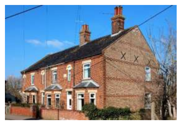
Nos.17-21 odd St John's Road

brick wall with square-section piers and decorative early twentieth century railings.