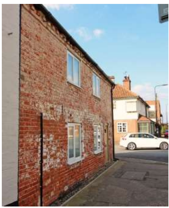
No.21 Broad Street

Cambridge House, No.19 Broad Street (grade II). Later eighteenth century façade of two storeys and three bays, with an attic lit by twin flat roofed dormers with sashes. Black pan tile roof covering with red brick stacks rising from the gable ends. Symmetrical classical façade of painted red brick with a high parapet. Three twelve light hornless sashes at first floor level beneath wedge shaped lintels. Centrally placed six-panelled front door with a wooden architrave and panelled reveals. Wooden Doric porch with an enriched entablature. Nos.15-19 form a group.