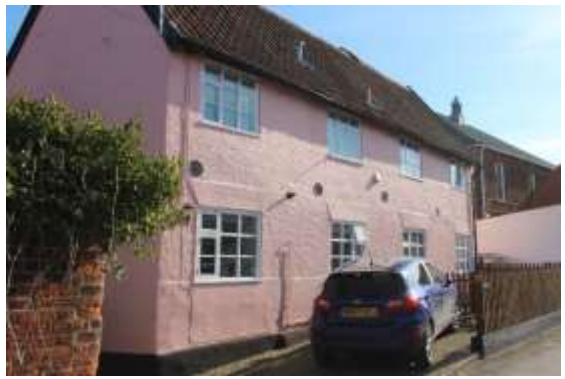
Nos.5 & 9 Rose Lane

Nos. 5 & 9 Rose Lane. A pair of cottages of late eighteenth century date, which are now a single dwelling. Painted red brick with mullioned and transomed casement windows and a red pan tiled roof. Ground floor windows have rendered flatarched lintels. Blocked doorway. Rendered northern return elevation. Substantial rendered rear range with a red pan tiled roof with a red brick ridge stack and single storey lean-tos.