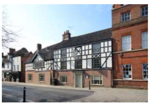
The Fleece Hotel, St Mary's Street

No.6 St Mary's Street and garden walls to rear (grade II). A substantial late eighteenth century townhouse. Of three storeys. Five-bay symmetrical principal façade of red brick with stone dressings. Central breakfront of a single bay, plinth, ground and first floor sill bands. The central breakfront has an open pediment at second floor level above a Venetian window with sashes. Open-pedimented doorcase with Doric 34 radius columns, triglyphs, and an arched fanlight. Six-panelled door. Twelvelight hornless sashes to ground and first floors, sixlight to second floor. Flat-arched lintels. Stone mouldings to cornice at second floor level. Stone cope with four stone ball finials. Fine midnineteenth century wooden office window to ground floor right of classical design, with consoles and an entablature. Central glazed entrance with arched door. Rendered rear range with twelve-light sashes. Subsidiary Structures. Good late eighteenth century red brick walls surrounding former rear garden. Nos.2 to 22 (even) form a group. Bettley, J, and Pevsner, N, The Buildings of England, Suffolk: East (London, 2015) p.157.