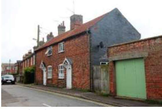
Nos.2-4 (even) Webster Street

St Edmunds Homes see Outney Road and No.6 Outney Road