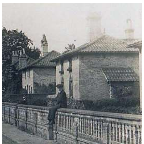
Nos.17 & 19 Flixton Road c1920

former spine wall. No.17 retains four-pane plate glass sashes, the window joinery to No.19 has however been replaced with casements. Late twentieth century glazed addition. Lean-to side porch to No.19. Subsidiary Structures: Low midnineteenth century white brick wall with red brick bands and brick balustrade. Honeywood F, Morrow P, & Reeve C, The Town Recorder, A History of Bungay in Photographs (Bungay, 1994) p190.