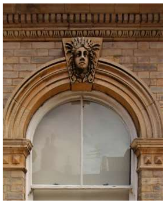
Detail of former banking hall, Nos.12-16 (even) Broad Street