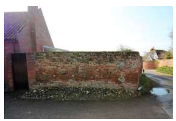
Boundary Wall, Clover Corner, Castle Orchard

The Fleece Hotel, Nos.8-10 (even) St Mary's Street and Inn yard walls (grade II). Early seventeenth century with a later eighteenth century red brick façade, which was rendered and had applied decorative timber-framing added c1920. Ground floor cement rendering in imitation of red brick. Main block has a three storey, three bay principal façade with hornless sixteen-light sashes within flush frames to the first and second floors. Tripartite sashes to ground floor. Painted wooden doorcase with Doric ½ columns and an unusual bed mould to the cornice. Six-panelled door. Black pan tiles to front face of roof, red to rear face. Left-hand wing formerly with shop front now tripartite sashes. At first floor level a long casement window with leaded lights. Small gable of c1920. Rear elevation also with applied timber-framing. Red brick rear range with red tile roof. Interior: evidence of timber-frame construction, oak corner cupboard and original doors. Nos.6 to 22 (even) form a group. Subsidiary structures. The inn yard at the rear (entered from Castle Orchard) is surrounded by red brick walls of primarily nineteenth century date. Some earlier sections which appear to have originally been part of structures. Twentieth century weatherboarded outbuilding. (See also Clover Corner, Castle Orchard) Honeywood F, Reeve C, & Reeve T, The Town Recorder, Five Centuries of Bungay at Play (Bungay, 2008) p148-149.