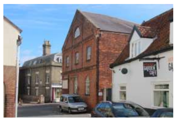
Owles Warehouse, Cross Street elevation.

to first floor. Linked to No.2 Trinity Street by a single storey flat-roofed range which based on photographic evidence probably pre-dates the two-storey section. Mid-twentieth century shop facia with pilasters and projecting boxed cornice. Bombed c1940 and partially rebuilt late 1940s. A comparatively rare and unaltered example of its kind for Suffolk. (See also No.2 Trinity Street and 5 Market Place). Reeve C, Bungay Through Time (Stroud, 2009) p9.