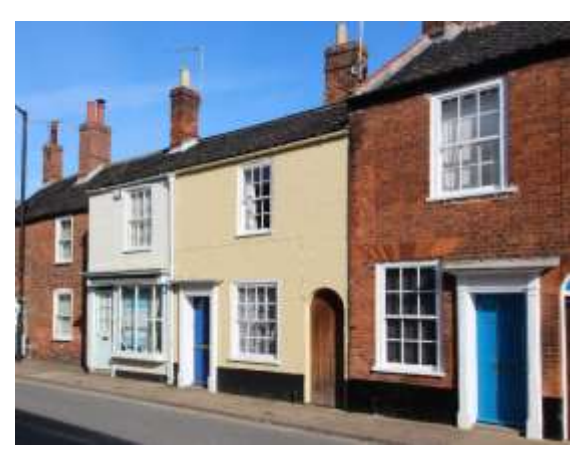
Nos.35-37 (odd) Lower Olland Street

Nos.31-33 (odd) Lower Olland Street. A pair of red brick terraced house of c1800 with a black pan tiled roof. Cambered arched lintels to window openings. External joinery replaced in the late twentieth century. Straight joint between the two properties.