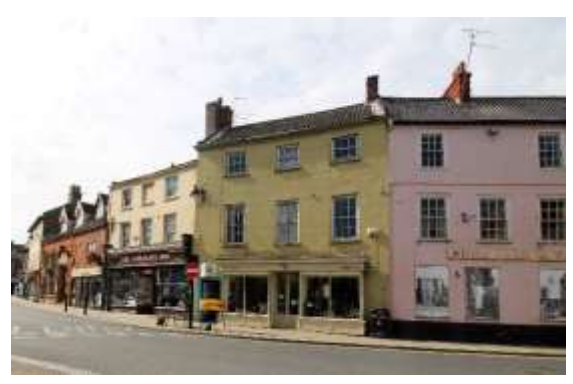
No.4 Market Place

No.4 Market Place (grade II). Early nineteenth century, with a Market Place façade of three storeys and three bays. Hornless sash windows to first and second floors with flat arched lintels. Slightly projecting wooden shop facia with a central entrance Glazing bars to shop facia shown on early twentieth century photos now removed. Brick, limewashed. Wide passage under, left, with a fourpanelled door. Pan tiled roof, brick toothed eaves band. Nos, 2 to 16 (even) form a group. The rear section of the plot is within the scheduled area of the Castle complex. Reeve C, Bungay Through Time (Stroud, 2009) p14.