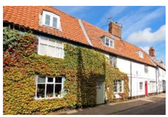
Nos. 31-33 (odd) Bridge Street

Nos.31-33 (odd) Bridge Street (grade II). Seventeenth century, and of two storeys with an attic. Two flat roofed dormers with centrally opening casements, within a red pan tiled roof. Brick colour-washed, with platt band. First floor has two early mullioned and transomed casements with flush frames which the statutory list describes as being 'original' to the present facade. Twenty-light hornless sash window to ground floor of No.31. Other ground floor windows now casements but all retain segmental arched lintels. Mid twentieth century door with oval light to No.31, twentieth century boarded door to No.33, both set within flush frames. Small nineteenth century former shop window to No.33. Nos.29 to 45 (odd) form a group.