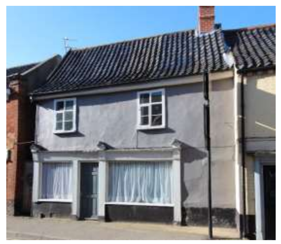
No.4 Upper Olland Street

No.2 Upper Olland Street (grade II). A seventeenth century structure with a nineteenth century façade of painted brick. Standing on the southern corner of Quaves Lane. Black pan tiled roof, dentilled eaves cornice, red brick chimney stack. First floor windows now plate-glass hornless sashes. Early nineteenth century wooden doorcase and shop facia with pilasters and delicate entablature. Nos.2 to 10 (even), 14, 16 and Nos.20 to 24 (even) form a group. Honeywood F, Morrow P, & Reeve C, The Town Recorder, A History of Bungay in Photographs (Bungay, 1994) p185.