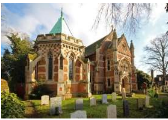
St Edmund's RC Church, St Mary's Street

Wall to south side of St Mary's Churchyard (grade II.) Eighteenth century and earlier mainly flint with red brick face on south side, moulded terra cotta, quasi battlemented cope. At each end, a square white brick pier with stone cap, west end pier with stone vase finial. Generally, about 8ft high.