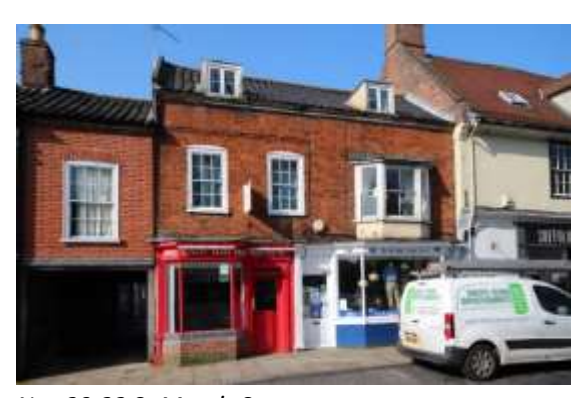
Nos.20-22 St Mary's Street

Nos.20-22 St Mary's Street and outbuilding to rear (grade II). Eighteenth century, of two storeys and an attic which is lit by two flat-roofed casement