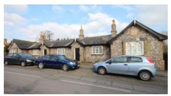
Dreyers Almshouses, Nos.9-17 (odd) Staithe Road

Dreyers Almshouses, Nos.9-17 (odd) Staithe Road (grade II). Single storey alms house block of 1848 faced in square knapped flint with gault brick dressings. Endowed by Eliza Dreyer for the widows of poor tradesmen. Seven-bay façade with gabled porches, outer bays gabled and slightly projecting. Gothick casement windows with three pointed lights. Octagonal shafts to chimneys with capping and drip moulded bases. Plinth. Near-flush-frame doors with cambered arches. Inscribed stone tablets in flank gables with date. Roof of octagonal Welsh slates, bargeboards with spear finials. Further gabled porches to return elevations.