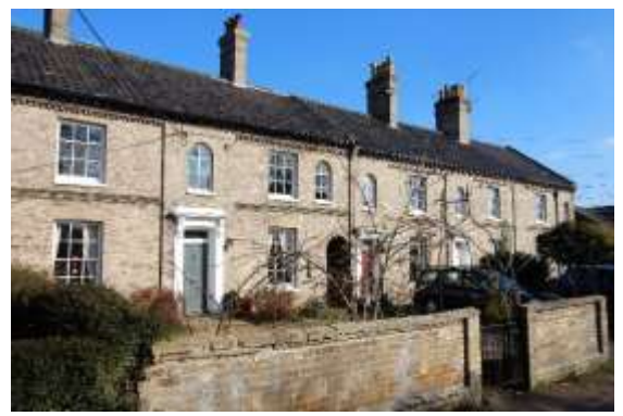
Nos.1-9 (Odd) Laburnum Road

See also No.2 Bardolph Road and boundary walls, Nos.1 &3 Flixton Road, and No.28 Southend Road.