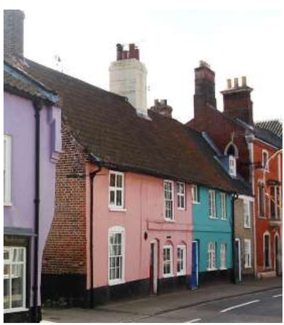
Nos.40-44 (even) Bridge Street

No.38 Bridge Street (local list). A substantial later nineteenth century red brick dwelling with stone dressings, dentilled eaves cornice and full height pilasters. Plate glass sashes and some later casements. Three storey, two bay principal façade. Arched doorcase with keystone and four panelled door. Simple semi-circular fanlight. Canted stone oriel window above. Substantial red brick chimneystack. Forms part of a semi-detached pair with No.36.