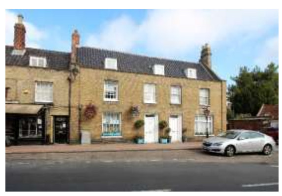
Nos.24-26 (even) Earsham Street

The western or Chaucer Street façade of No. 22 is of mid nineteenth century date and of gault brick with painted stone dressings. Dutch gable, and wooden shop facia. The First floor has a centrally placed plate-glass sash window with a pediment supported on console brackets. Single storey red brick outbuilding with red pan tile roof to rear probably of early nineteenth century or earlier date. Nos. 2 to 40 (even) form a group.