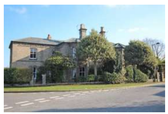
Nos.1 & 3 Flixton Road

Nos.1 & 3 Flixton Road, walls and gate piers. A semidetached pair of houses prominently located at the junction of Bardolph and Flixton Roads. Also visible from Laburnum Road. Shown on the 1885 Ordnance survey map and probably dating from c1870. Gault brick with a Welsh slate roof. Decorative corbelled eaves cornice, pilasters, and two storey canted bay windows. Original plate glass sashes largely preserved. Subsidiary Structures Good contemporary gault brick gate piers and low boundary wall. Tall nineteenth century red brick wall to Laburnum Road.