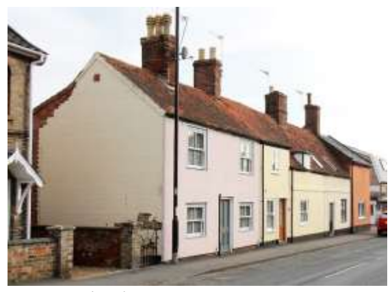
Nos.23-25 (odd) Staithe Road

Pretoria Villas, Nos.19-21 (odd) Staithe Road. Semidetached pair of dwellings faced in white brick dated 1901. Canted wooden bay windows to the ground floor. Tripartite casement sash to first floor of No.19, first floor window to No.21 recently replaced. Dentilled plat band. Black pan tiled roof with substantial ridge stack to spine wall. No.21 has a gabled porch with bargeboards and a spear finial. Subsidiary Structures low nineteenth century wall to front and to side of No.21 the front wall being of gault brick the side wall of red.