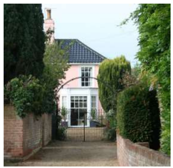
No.12 Trinity Street

panelled door with geometric glazing to rectangular fanlight. Doric fluted pilasters to wooded doorcase. No.10 and Nos 14 to 18 (even) form a group. Subsidiary Structures Low late twentieth century red brick boundary wall.