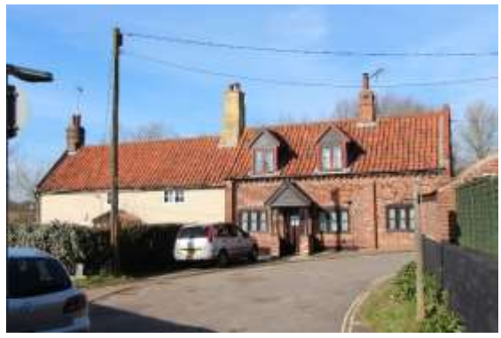
Nos.27 & 28 Quaves Lane

Nos.11 & 15 Quaves Lane with outbuilding and boundary wall to No.11. A pair of semi-detached houses which were built in the early to mid-nineteenth century as three cottages, Nos.11& 13 are now combined. Red brick with a hipped red pan tiled roof. Two storeys with a single storey nineteenth century lean-to to the north-east (No.11). The east wall to Castle Lane is tarred. Late twentieth century timber doors and casement windows in original openings. Subsidiary Structures Low painted boundary wall to Quaves Lane elevation of No.11 which appears to be of nineteenth century date. Twentieth century wall to No.15.