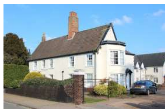
The Old Vicarage, No.37 Upper Olland Street

Brick pilasters with moulded caps and bases. Brick lozenge pattern on end wall, and two earlier window openings filled in. Letters RR in wrought iron ties on gable. Eight bay façade with two blank panels, and six casements in flush frames, ground floor windows with segmental arches. No.31, four-panelled door. Nos.33 and 35, 6-panel doors in wood cases. Nos.21 to 37 (odd) form a group.