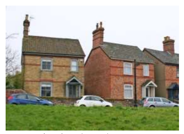
Nos.42-44 (even) Staithe Road

pan tiled roof and central ridge stack to spine wall. C1900 red brick boundary wall to Staithe Road. A relatively early use of Fletton brick.