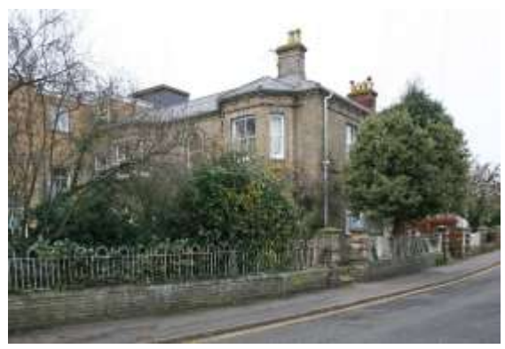
No.8 Flixton Road

with decorative ridge pieces. Mullioned and transomed timber casements with stone hood moulds. Bay window to ground floor f each house with a tile roof continued over door to form a porch. Wooden pillars flanking doors. Subsidiary Structures . Good boundary wall and gate piers of alternate gault and red brick layers c1900. Nos. 4 & 6 with decorative iron railings. The wall to No.2 has been rebuilt but the original piers are preserved. No.2 has a good red brick boundary wall to Rose Hall Gardens. The terrace occupies the site of the medieval chapel of St Mary Magdalene and is thus likely to be of archaeological value.