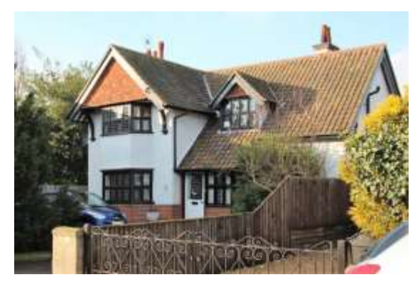
No.16 Scales Street

Bedford House No.14 Scales Street and front garden wall (local list). Early twentieth century detached villa designed and built by John Doe. Inventive free Arts and Crafts Tudor vernacular style. Red brick and rough cast elevations. Wooden mullioned and transomed windows with leaded lights. Scales Street elevation gabled with plain tile hung apex which projects and is supported on a full height wooden veranda. Late twentieth century pan tiled roof with original flat roofed dormers. Subsidiary Structures Low contemporary concrete garden wall to Street frontage with balustrade. Bettley, J, and Pevsner, N, The Buildings of England, Suffolk: East (London, 2015) p.155.