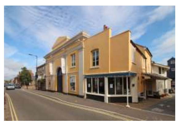
Fisher Theatre No.10 Broad Street

Nos. 6, 8 & 8a Broad Street (grade II). Of eighteenth-century date, No.8a is possibly a later addition. Two storey rendered street frontage, Nos. 6 & 8 having a black pan tile roof, the lower No.8a red pan tiles. Nos. 6 & 8 with three, twelve-light hornless sash windows at first floor level in flush frames with later lugged surrounds. No.8a has one casement at first floor level in a similar lugged surround. No.6 is flanked by two storey pilasters; square bay shop front. Smaller shop window to No.8 and partially glazed door in simple wooden surround. No.8A has an entrance with a modern glazed door in a narrow wooden case and a catslide roof to the rear.