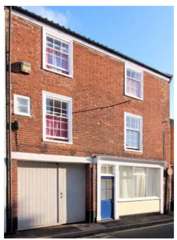
No.11 Upper Olland Street

Ground floor openings beneath segmental arched lintels. Large chimneystack to right-hand gable. Small rebuilt stack to left-hand gable.