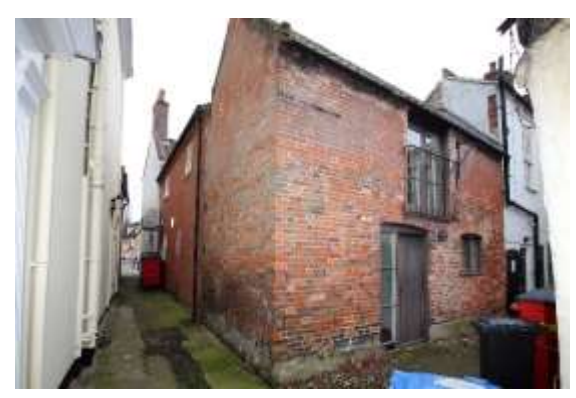
No.7a Market Place

No.7 Market Place (grade II). Early eighteenth century, of two storeys and an attic, two casement dormers within roof slope. Stucco. Market Place façade of two storeys flanked by pilasters. Red plain tile roof. Bowed oriel sash window at first floor level, with small pane sashes and a dentilled cornice. Mid nineteenth century wooden splayed bay shop front with a central entrance. Nos. 1 to 11 (odd), Nos. 11A, 13 and 17 to 21 (odd) form a group together with the Butter Cross.