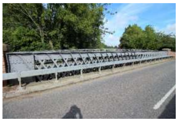
Falcon Bridge, Bridge Street

No.45 Bridge Street (grade II). A seventeenth century, two storey brick building, with a twentieth century cement rendered ground floor. Timber framed, plastered and with twentieth century applied half-timbering to the first floor. Red pan tiled roof. Three, three-light casement windows to the first floor. Small former shop window to ground floor right probably of later nineteenth century date. Four panelled front door of probably twentieth century date with near-flush frame. Gabled return elevation to the bridge with applied timber framing and casement windows. Lower outshot to rear. Nos.29 to 45 (odd) form a group.