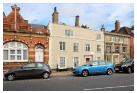
No.16 Earsham Street

No.16 Earsham Street (grade II). A substantial seventeenth century townhouse, which is reputed to have been built in 1620. Three-storey, four-bay, stuccoed façade to Earsham Street with rusticated quoins and a parapet capped by ball finials. Moulded plaster plat band beneath second floor windows, moulded cope to parapet. Four original mullioned and transomed casements with stucco architraves at first floor level. Eight-panelled door, right of centre, in wood case with panelled reveals, pilasters and entablature flanked by twelve-light sashes. Black pan tile roof with gault brick stacks. Some original interior doors. Nb. C1900 photos show the house without the present second floor and parapet but with dormers set within the roof this part of the façade is however evident in c1930 views. Nos. 2 to 40 (even) form a group. Honeywood F, Morrow P & Reeve C, The Town Recorder, A History of Bungay in Photographs (Bungay, 1994) p148.