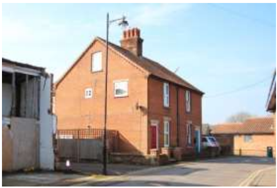
Nos.5-7 (odd) Priory Lane

Nos.24-28 (even) Priory Lane (grade II). A large, early-nineteenth century, detached house, which has been converted into three dwellings. In a sensitive location close to a scheduled ancient monument. Of three storeys, with a symmetrical Suffolk white brick façade of three bays. Return elevations red brick, black pan tiled roof. Sash windows with narrow margin lights and flush frames to first floor. Flatarched lintels. Twentieth century casements to second floor. Two storey one bay wing with side entrances with twentieth century gabled porch to left. Six-panelled door with arched radial-bar fanlight within a wooden doorcase with pilasters and an open pediment. Subsidiary structures Late twentieth century red brick boundary wall and gate piers to Priory Lane not included.