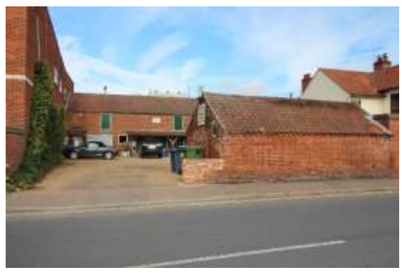
Outbuildings at The Green Dragon Public House

The Green Dragon Public House and outbuildings to rear, No.29 Broad Street and Popson Street. A purpose-built public house of c1926, replacing an earlier inn. Formerly known as the Horse and Groom. Restrained 'arts and crafts' vernacular style. Much of the building's original external detailing has survived including its external joinery and leaded windows. The pub is faced in red brick with pebble dashed first floor, and a hipped red pan tile roof. Wooden casement windows divided by mullions and a transom and with small leaded panes to the ground floor. The first-floor windows are similar but do not have a transom. Fine decorative rainwater heads. Subsidiary Structures To the rear are two much earlier outbuildings. Fronting Popson Street is a single storey red brick outbuilding of c1800 with a red pan tile roof and a dentilled brick eaves cornice. This is a survival from a range of out buildings shown on late nineteenth century Ordnance Survey maps. To the rear of the yard a two-storey red brick stable range with boarded doors and a red pan tile roof. Probably of early nineteenth century date, its ground floor openings show signs of alteration and a number of the original brick lintels have been replaced.