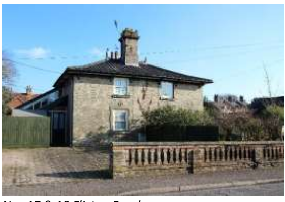
Nos.17 & 19 Flixton Road

Autumn Cottage, No.13 Flixton Road (grade II). A pair of semi-detached cottages; now converted to a single dwelling. Early nineteenth century. Symmetrical two storey, and three-bay principal façade with a hipped black pan tile roof. Central white brick stack rising from former spine wall and façades of Suffolk white brick. Eaves soffit. Two windows, casements in reveals with flat- arches. Plain door, left, in reveals with flat arch. Central arched blank panel at ground floor. Former entrance (to former No.15) filled in. Nos.9 to 13 (odd) form a group.