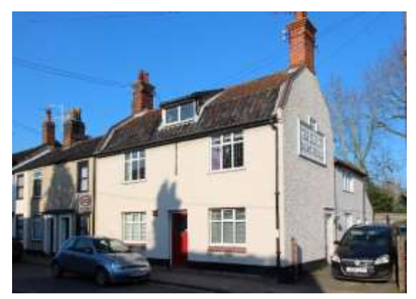
No.53 Lower Olland Street

Nos.47-51 (Odd) Lower Olland Street. Terrace of three early nineteenth century terraced houses of red brick, the façades now rendered and painted. Black pan tiled roof. Doorcases with pilasters identical to Nos.41-45. Window joinery now of late twentieth century date but original openings preserved.