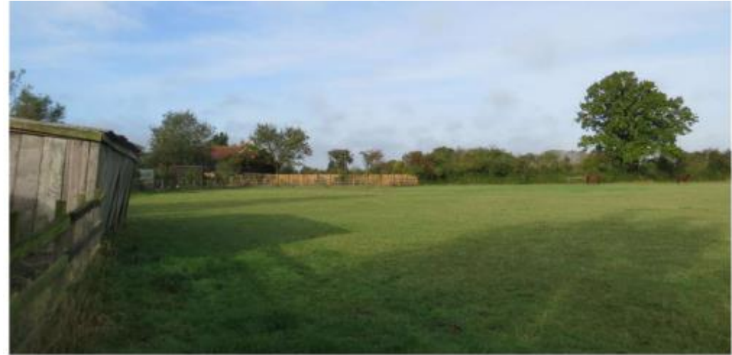
View of the western paddock boundary from within the site