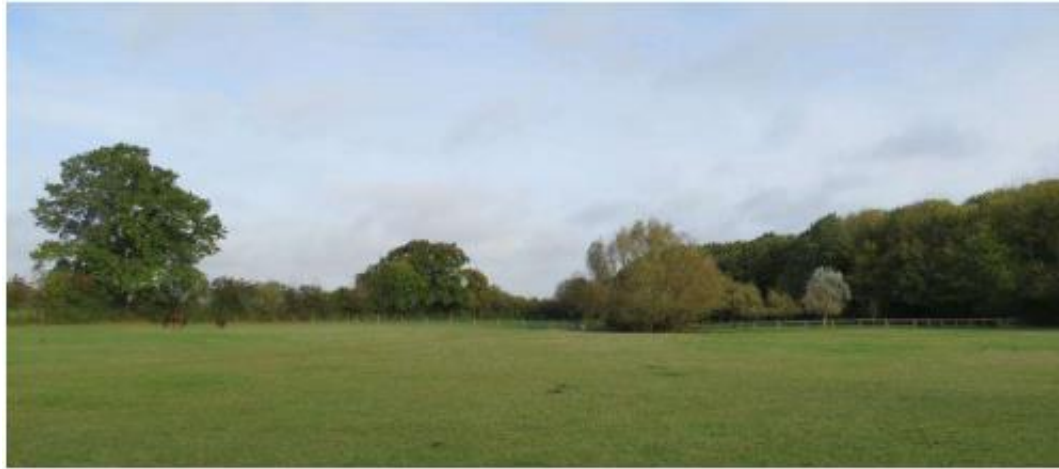
View of the paddock looking north