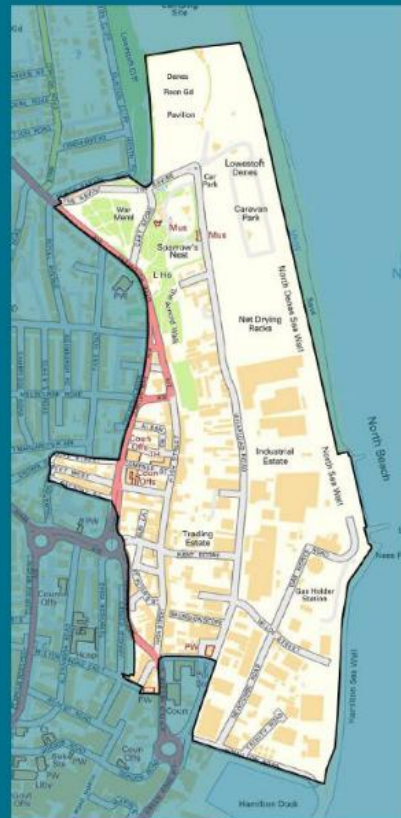
Contains OS data © Crown copyright and database right 2019

Comments to be received by 5pm on 24 th January 2020