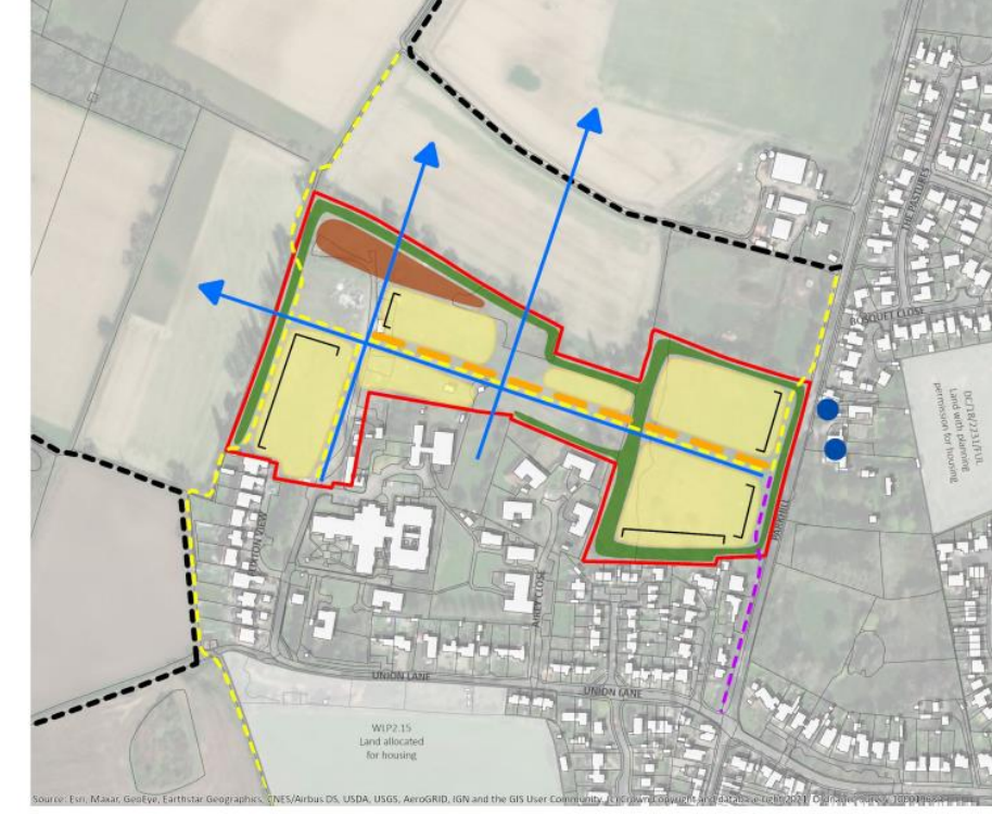
Site boundary (WLP2.14) Development parcel Indicative historic burial ground area Existing vegetation Listed building Key built frontage - Key view Cycling and walking infrastructure - Walking infrastructure Primary access road - Public right of way