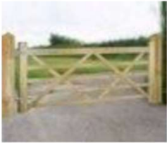
Diagram B – gate that was in place along boundary fence with 41 wacker field rd to be moved to new position marked on diagram

1.83m High Fence currently in place along North side