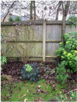
Diagram A – picture of 1.83m fence already in position

1.83m High Fence currently in place along North side