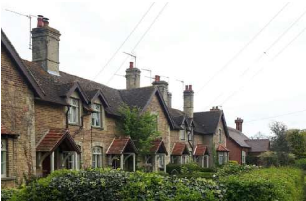
Victorian Estate Housing in Somerleyton

7.4.3 Somerleyton is linked with the parishes of Herringfleet and Ashby for administrative purposes but each of these is very small, consisting simply of an ancient church with its adjacent farm and manor house groups of historic buildings. Herringfleet is located along the St Olave's Road while Ashby has its church isolated in the fields with a farm group of traditional buildings to the north on Blocka Road.