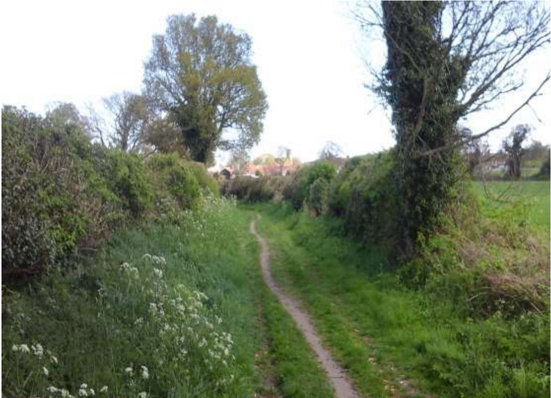
Snakes Lane approaching Lound