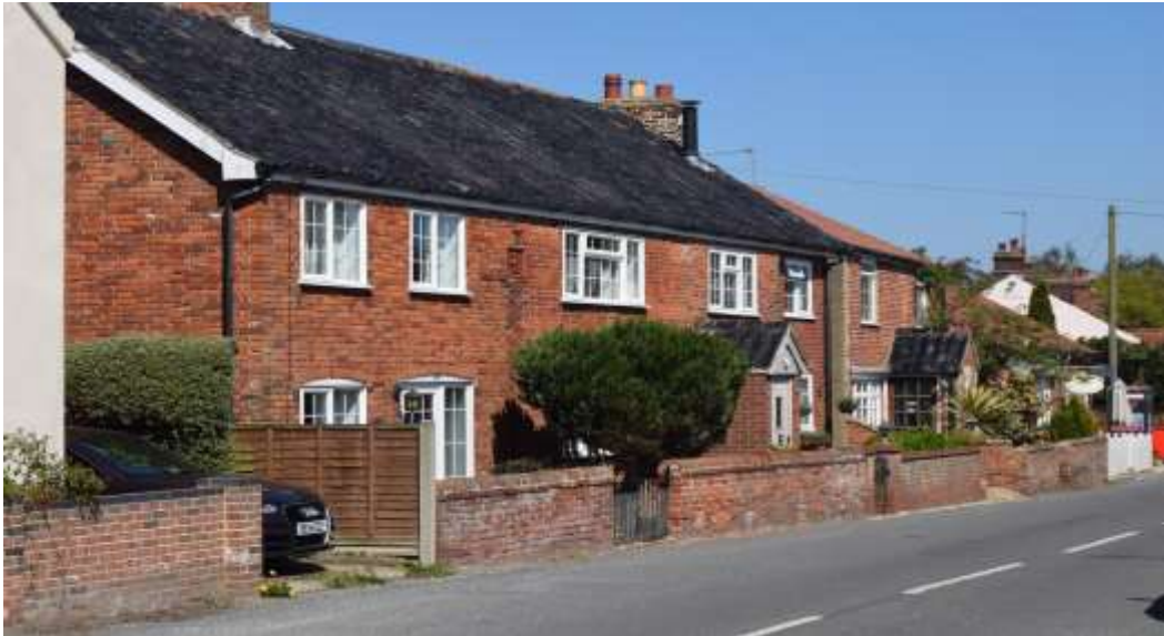
The Street, Lound