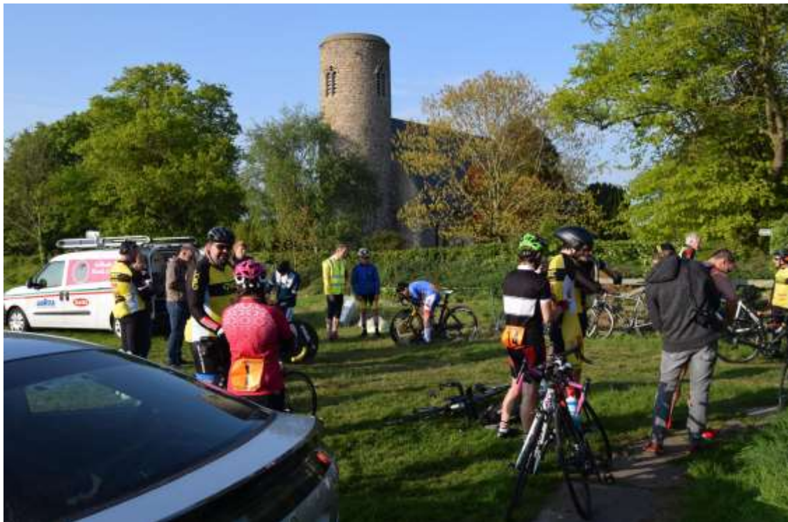
Cyclists signing in for weekly time trial

11.1.3 Access to green outside spaces is recognised as contributing to improvements to both physical and mental health and wellbeing for the population as a whole, including increasing the quality of life for the elderly, working age adults, and for children.