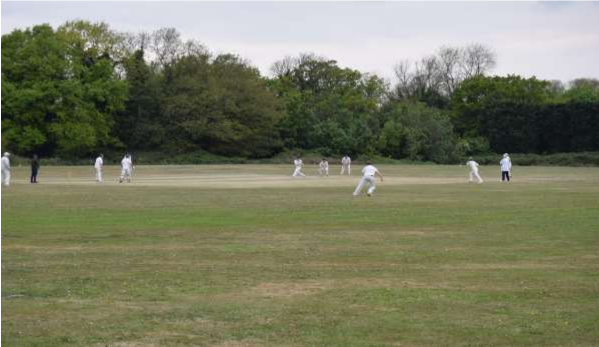
Cricket on Somerleyton Playing Field