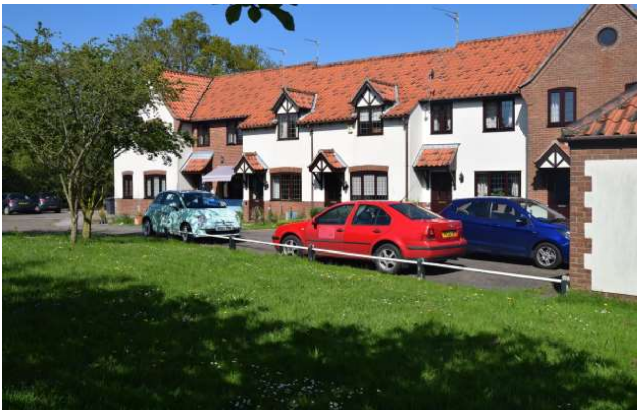
Modern housing with green open space and parking is highly visible