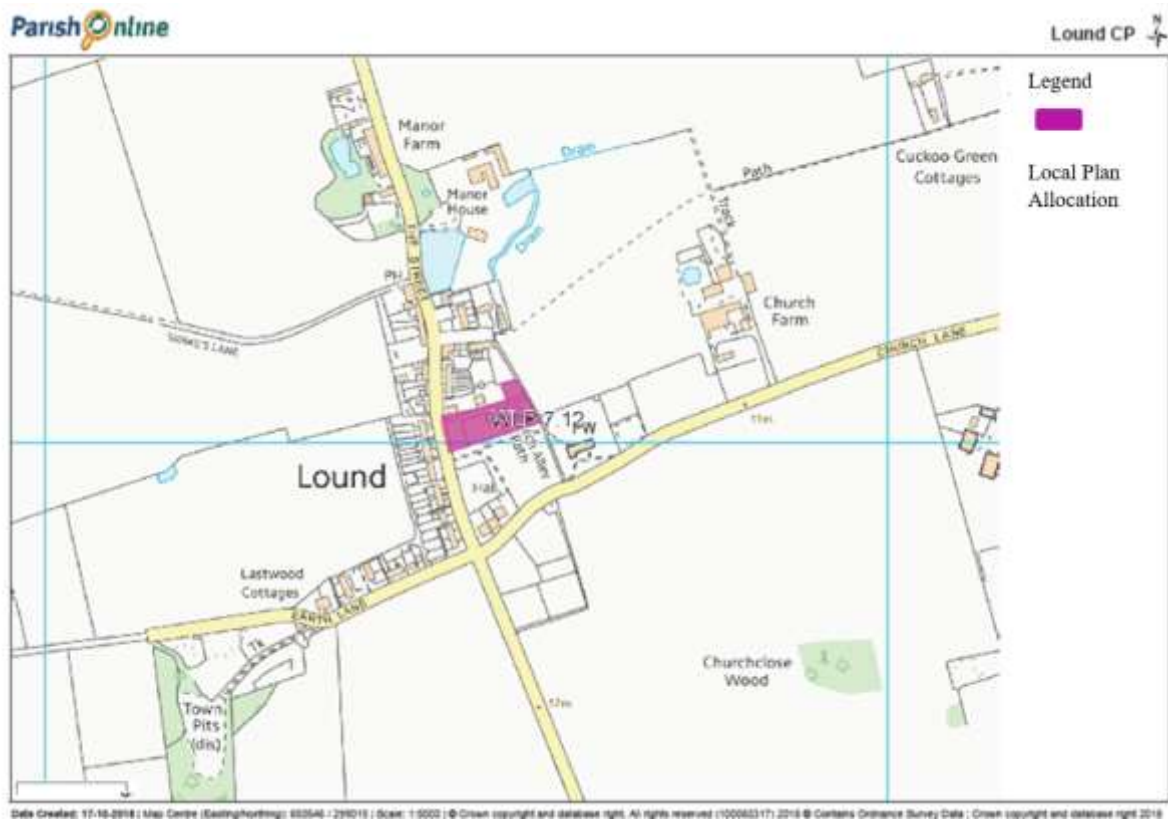
Lound Map indicating Local Plan allocation