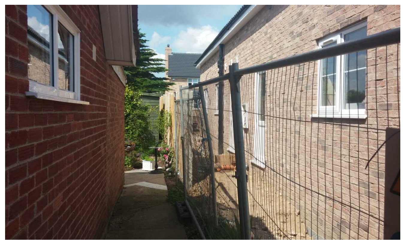
As viewed from the opposite direction: