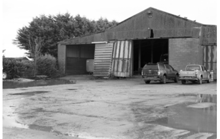
Seventeen Acres Barn with windbreak and eastern side barn visible

The landscape has the capacity to manage the change. With sensitive design and by following the recommendations the landscape may be improved or remain neutral. The reduction in size of the built form as well as the removal of the visually prominent side barns is an important consideration when assessing the effect of the proposal on the landscape.