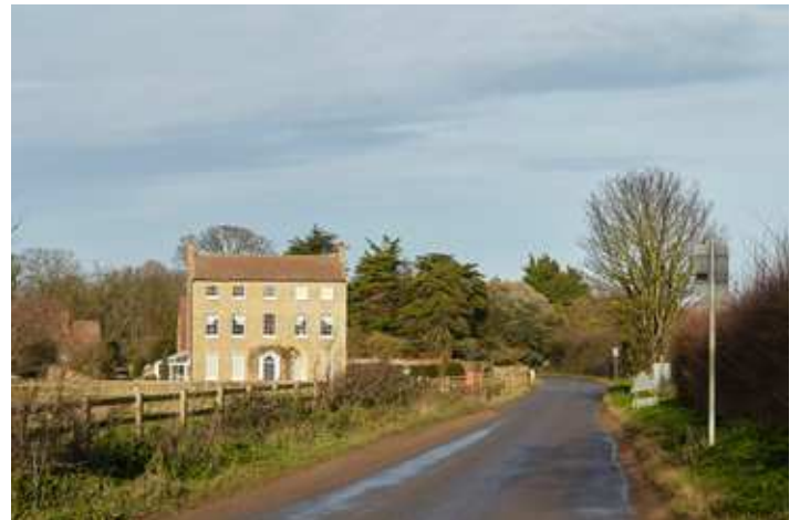
High House, Ferry Road