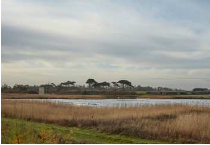
Looking South/South West. Characteristic pines can be seen on the horizon

Guidelines for Landscape and Visual Impact Assessment Third Edition (2013), (GLVIA3) published by the Landscape Institute and the Institute of Environmental Management & Assessment