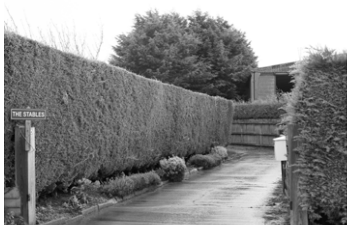
Entrance to the stables with windbreak behind