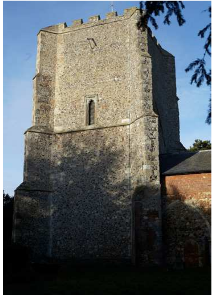
St Mary's Church, Bawdsey (Grade II* Listed)

More recently the film “Yesterday” was shot around the River Deben and at Shingle Street to the north of Bawdsey.