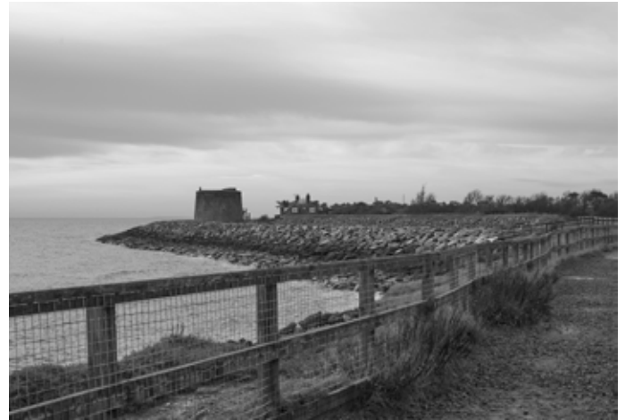
Martello Tower Z. Scheduled Monument

As a look out they are naturally designed to survey the surrounding area from a higher vantage point.