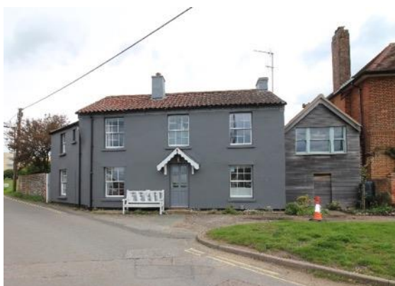
Ferry Cottage, Skilmans Hill

Ferry Cottage, Skilmans Hill (Positive Unlisted Building). A prominently positioned two storey detached villa with painted render walls and red clay pan tile roof covering. Dating from the late 19 th century. Circa 2004 a scheme of restoration and alteration was undertaken, which included raising the height of the side addition from single to two storey and replacing all the enlarged window openings with sash windows. While the joinery is