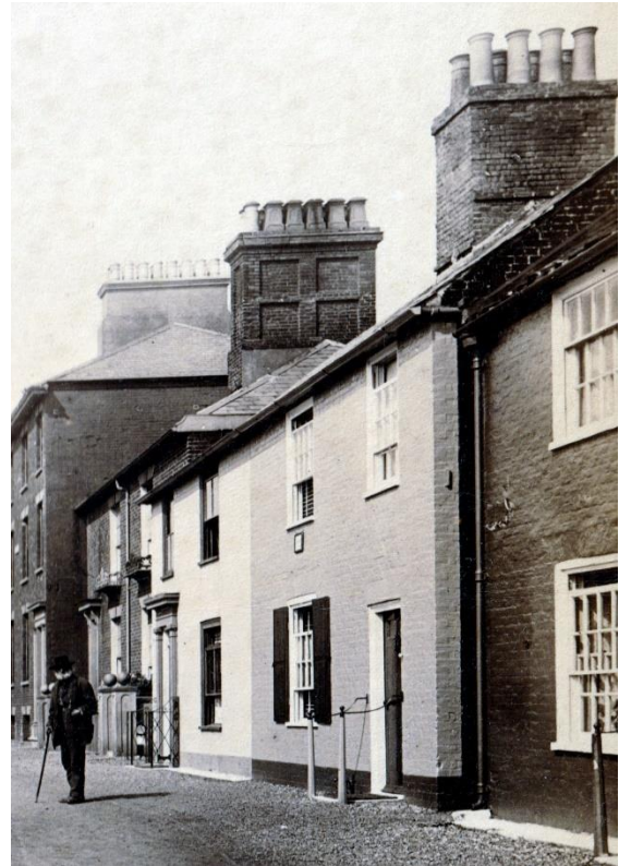
No.14 & 15 East Cliff c.1880