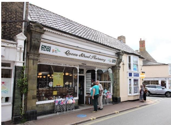
No.18 Queen Street