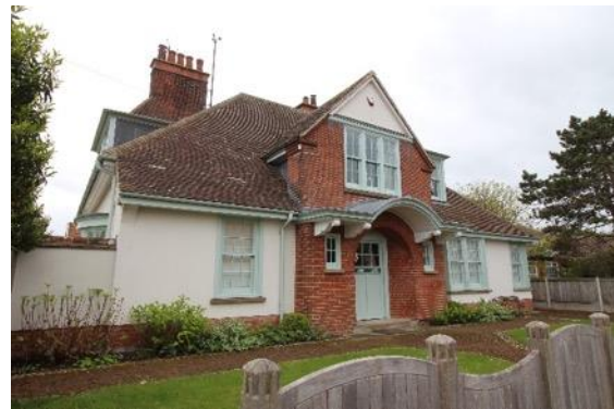
No.51 Pier Avenue

No.51 Pier Avenue (Positive Unlisted Building). A well preserved substantial detached arts and crafts house of c.1912 designed by Allan Ovenden Collard (1861-1928) which occupies a prominent corner plot on the corner of Pier Avenue and Marlborough Road. The house which was designed for C Fleetwood Pritchard of Hampstead was illustrated in The Studio after completion, in 1914. Of one and a half storeys with hipped plain tile roof and central gabled breakfront of two storeys. Largely rendered except for gabled breakfront which is faced in red brick. The breakfront contains a probably original partially glazed front door beneath a projecting semi-circular hood supported on moulded brackets. Original small pane sash windows to left and right. The flat-topped dormers within the roof appear on the drawings illustrated in The Studio in 1914.