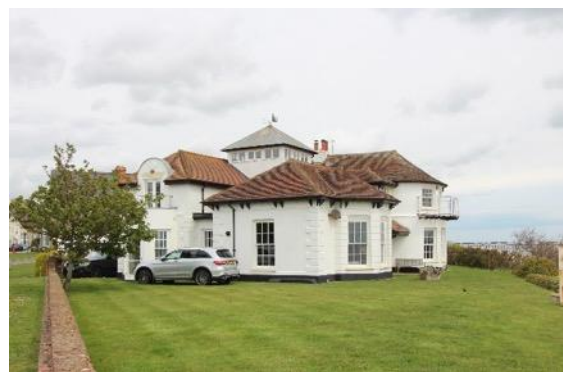
Cannons and boundary wall, Gun Hill

Cannons, Gun Hill (Positive Unlisted Building). One of four villas constructed c 1870 on Gun Hill, originally known as Marine Villa. Rendered elevations with expressed corner quoins and bracketed overhanging eaves. Two storey additions and a central belvedere have increased the prominence of what was a relatively modest villa. Good quality mid 20 th century washed cobble wall with Suffolk white brick margins, which sweeps up to meet the entrance piers.