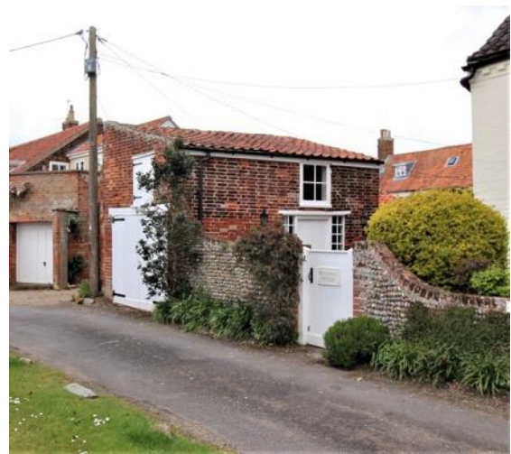
Outbuilding at Providence Cottage, No.15 South Green