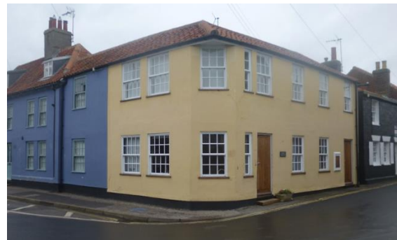
No.34 East Street

'Spindrift' No.30 & No.32 East Street (Grade II)