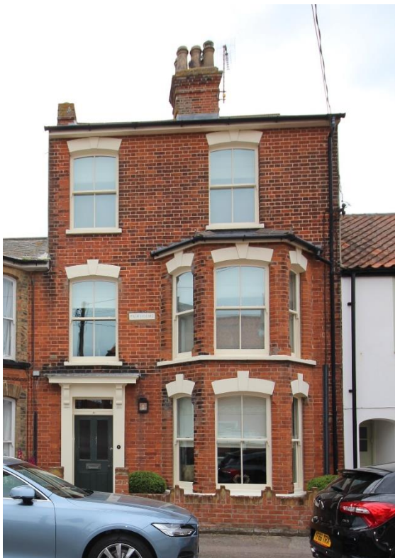
No.8 Stradbroke Road

Cornfield Mews No.6A Stradbroke Road (Positive Unlisted Building). A small cottage to the rear of No.6 Stradbroke Road and No.11 East Green accessed via a pathway to the rear of the Methodist Chapel and to the side of No.6 Stradbroke Road. Red brick with timber clad first floor, and red pan tile roof. Casement windows. A group of three small buildings appear on this narrow footway on the 1971 1:2,500 Ordnance Survey map of which this appears to be the only survivor. This building also appears to be on the 1904 map.