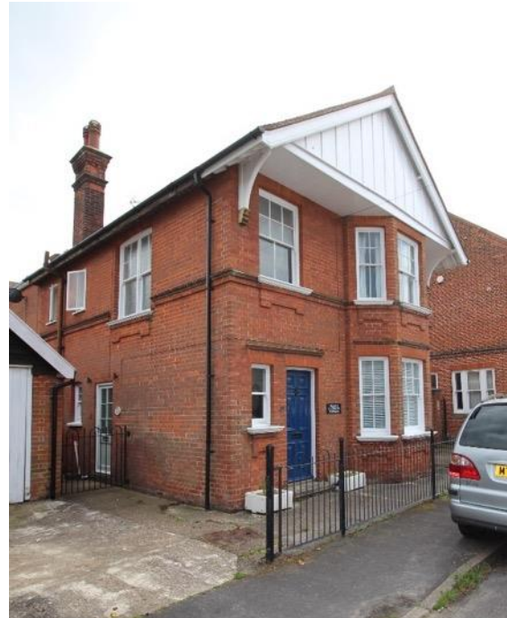
Flats 1-2 Eversley Cottage, Wymering Road

Roman Catholic Church of the Sacred Heart and Presbytery, Wymering Road (Grade II)