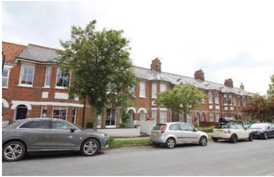
General view of Nos.5 to 19 (odd) York Road

Recessed entrance porches with half round brick lintel over; some of the porches now enclosed. The terrace retains an almost complete run of horned plate glass sash windows, only No.2 has replacement uPVC windows, which are unsympathetic. Small front gardens make a positive contribution to the conservation area, as do original tile paths, where retained. The terrace is little altered and prominent in views looking into and out of the western boundary of the Conservation Area.