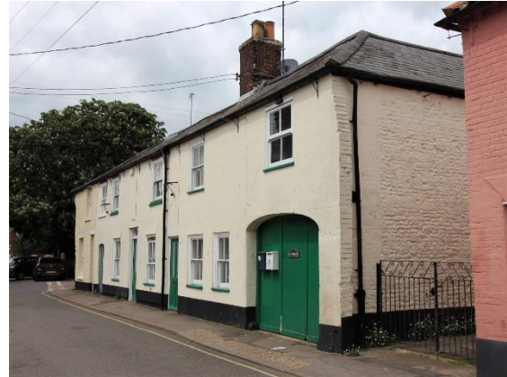
Nos.12-18 (even) Victoria Street from the south.

southern end of the terrace reads 'B.H.C. 1861' (apparently for Benjamin Howard Carter, builder and contractor, the Carters still occupying parts of the terrace into the 1990s). Originally dwellings with a builder's yard to the rear accessed through a substantial arched entrance at the terrace's southern end later partly converted to shops. Substantial two storey outshot to rear of No.16. Horned, four light plate-glass sashes at first floor level, much of ground floor however probably remodelled c.1990 when shop fascia removed. No.12 has been rendered in roughcast and has a return elevation to Bartholomew Green which contributes significantly to the setting of the Grade II listed No.16. Formerly a shop it has a splayed corner. Rear wing with a full height canted bay window and a red pan tiled roof.