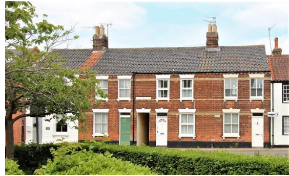
Nos.4-10 (even) High Street

Carroway Cottage, No.4 and Nos.6-10 (even) High Street (Positive Unlisted Buildings). Terrace of four small houses completed in 1881. Central passage access to rear gardens with a mirrored semi-detached pair of dwellings to either side one projecting over the central passage. Faced in red brick with white brick dressings. Black pan tiled roof with ridge stacks rising from the spine walls between the cottages. Horned plate-glass sash windows occasionally survive although a number of the houses have unsympathetic late twentieth century replacements. Plaster wedge-shaped lintels with projecting central key stones. Stone sills resting on decorative corbels. Carroway Cottage No.4 now sadly painted harming the unity of the terrace's design. Nb in the late nineteenth century this part of High Street was part of Station Road hence the name of the houses 'Station Road Villas'.