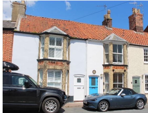
Nos.14 & 16 St James Green

Nos.14 & 16 St James Green (Positive Unlisted Buildings). Part of an early nineteenth century red brick terrace also comprising Nos. 18 & 20. Canted bay windows of red brick with Suffolk white brick dressings were added c.1890. Heavy replacement sashes to No.14. The remainder of the façade was later rendered. Red pan tile roof. Early nineteenth century door openings with shallow brick arched lintels survive but with later twentieth century partially glazed front doors.