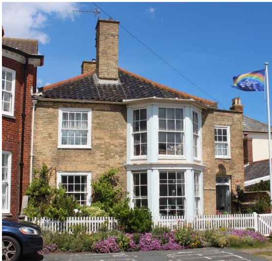
Beacon Cottage, St James Green

'Whitehall', No.26 & Guardship, Saint James' Green (Grade II)