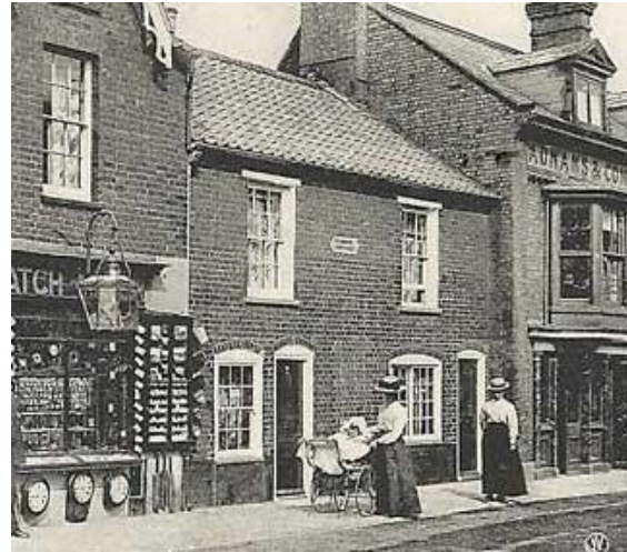
Nos.38 & 40 East Street before altering from a c.1900 postcard.

Horseshoe Cottage No.38 and Longshore, No.40 East Street (Positive Unlisted Buildings). A pair of red brick cottages of c.1800 possibly incorporating earlier fabric. Red pan tiled roof. Formerly with shallow arched brick lintels to ground floor openings, both ground floor windows have however been altered. The original small paned sash to the upper floor of No.38 survives but that to No.40 has again been replaced. Twentieth century partially glazed front doors in original openings.