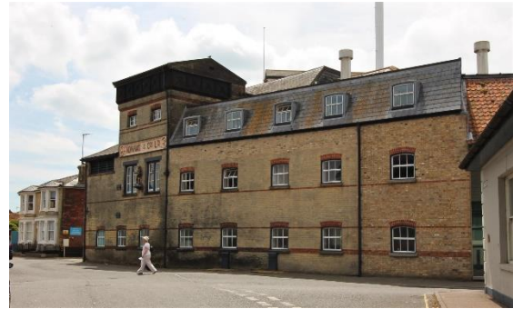
Adnams Brewery, Victoria Street

No.45 Victoria Street (Positive Unlisted Buildings). A radically altered later eighteenth-century house of painted brick which once formed part of a terrace, but which were incorporated into the Adnams Brewery complex before the publication of the 1971 1:2,500 Ordnance Survey map. Today its primary value is the contribution it makes to the setting of listed buildings on Church Street. Dentilled brick eaves cornice to No.45. Original door opening removed. Horned small pane sashes of probably later twentieth century date. One wedge shaped brick lintel at ground floor level. Largely blind gable end to Church Street, the gable itself rebuilt. No.45 was the St Edmund's Deaconess Nursing Home in the 1930s. No.47 (the lower section) has been entirely rebuilt.