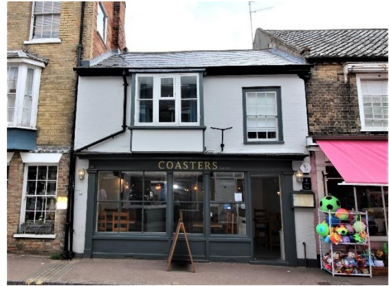
No.12 Queen Street