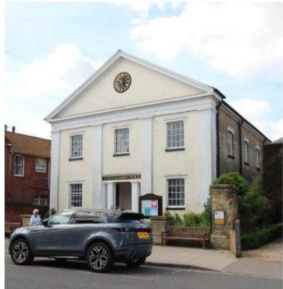
United Reformed Church, High Street

The Manor House, Nos.65-67 (odd), High Street including gate and forecourt walls (Grade II*)