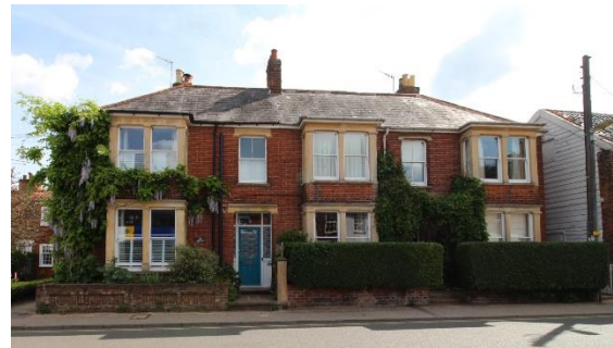
Nos.24 & 26 High Street

Nos.24 & 26 High Street (Positive Unlisted Buildings). Substantial and well-preserved pair of later nineteenth century red brick villas incorporating what appears to be an earlier range at the rear. Two storeys, steeply pitched and hipped Welsh slate roof with red brick ridge stacks. Full height bay windows with stone dressings with original horned plate-glass sash windows set within. Return elevation to north side of No.24 has canted oriel. Recessed porches with wooden glazed screens within. No.24 has decorative glazed tiled pathway and floor within porch. Panelled front doors. No.26 retains original dwarf garden wall to High Street and decorative tiled floor within porch. This pair of houses contribute significantly to the setting of the listed buildings to their north and to that of those opposite.