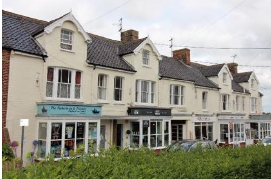
Nos.3A-9A (Odd), Station Road

Nos.3A to 9A, Station Road (Positive Unlisted Buildings). An early twentieth century terrace of houses, red brick, now painted. Originally the houses had recessed open porch entrances under stone half-round arches, with two storey canted bays. During the first quarter of the twentieth century shop fronts were introduced, until all canted bays were removed and the existing single storey square bays and entrances were built (probably during a program of works by the Town Council during the early 2000s). To the middle of the terrace is an opening leading to a commercial yard. Large attic dormers with shaped bargeboards. Blue glazed pan tile roof covering. The existing windows contribute to the group's character. The low brick walls and railings, seen on historic images, have long since been removed. The terrace is prominent in views looking south into the town and contributes to the structures grouped around Station Road, Pier Avenue and Blyth Road.