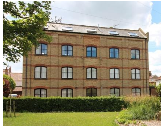
St Edmunds Court, North Green elevation