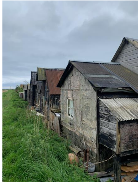
View of the rear elevation of huts, looking north east

While the elevations facing the river make a strong and positive contribution to the character area, the rear elevations, which are highly visible from the elevated footpath and also from various vantage points within the town and the land between, means that the contribution made by these seemingly modest structures is high.