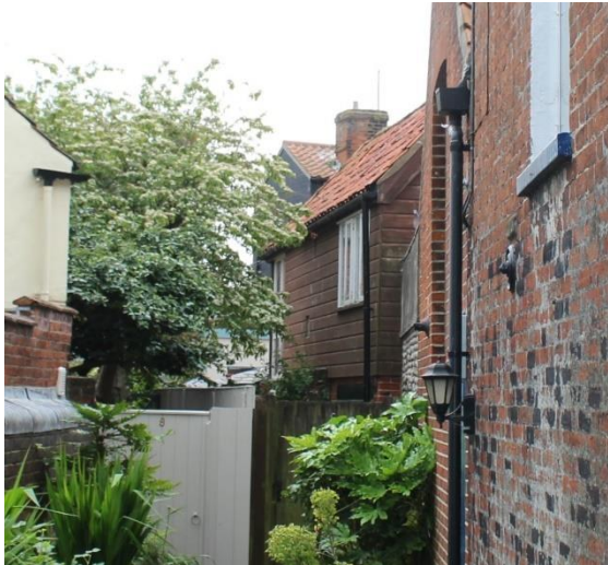
Cornfield Mews No.6A Stradbroke Road

Cornfield Mews No.6A Stradbroke Road (Positive Unlisted Building). A small cottage to the rear of No.6 Stradbroke Road and No.11 East Green accessed via a pathway to the rear of the Methodist Chapel and to the side of No.6 Stradbroke Road. Red brick with timber clad first floor, and red pan tile roof. Casement windows. A group of three small buildings appear on this narrow footway on the 1971 1:2,500 Ordnance Survey map of which this appears to be the only survivor. This building also appears to be on the 1904 map.