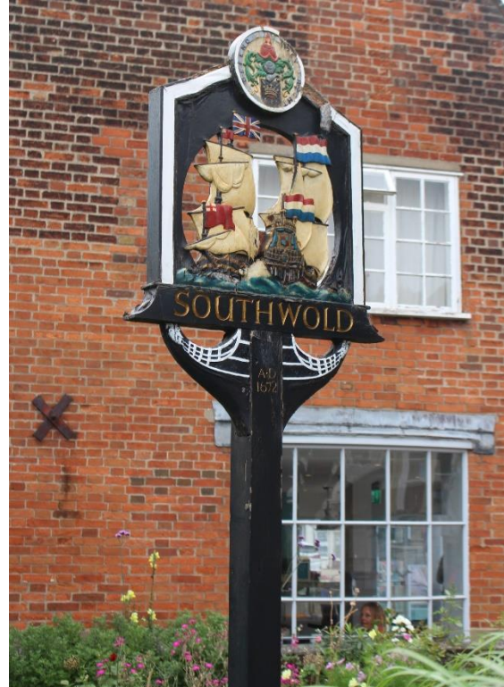
Town Sign, High Street

Nos.40A & 42 High Street (Positive Unlisted Buildings). House and Blacksmith's workshop dating from c.1800 converted to other uses in the 1930s. Built of red brick with rubbed red brick wedge-shaped lintels, but unfortunately now rendered. Hipped black glazed pan tile roof. Substantial central ridge chimneystack. No.42 the former house is little altered externally save for the loss of its twelve light hornless sashes. First floor of High Street façade to No.40A retains an original sash in a heavy moulded frame. The ground floor of this façade originally contained a similar window and no door. The northern return elevation of No.40A originally displayed its industrial use with a central taking-in door at first floor level and at ground floor level a central door flanked by twelve-light hornless sashes. Former cart shed range with frontage to Victoria Road now heavily altered.