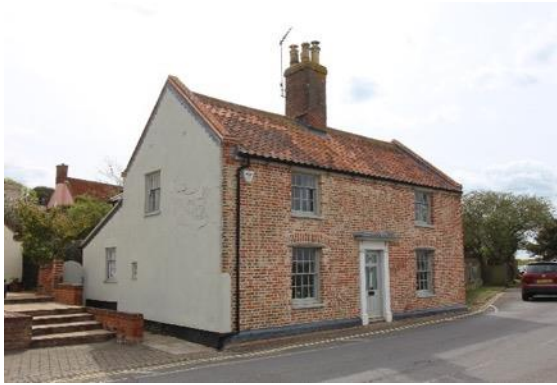
Saltworks Cottage, No.6 Ferry Road

Saltworks Cottage, No.6 Ferry Road (Grade II)