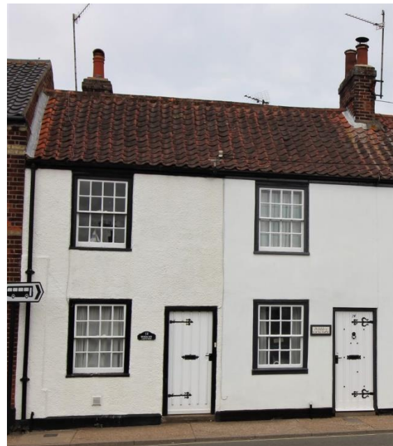
Nos.12 & 14 High Street

Carroway Cottage, No.4 and Nos.6-10 (even) High Street (Positive Unlisted Buildings). Terrace of four small houses completed in 1881. Central passage access to rear gardens with a mirrored semi-detached pair of dwellings to either side one projecting over the central passage. Faced in red brick with white brick dressings. Black pan tiled roof with ridge stacks rising from the spine walls between the cottages. Horned plate-glass sash windows occasionally survive although a number of the houses have unsympathetic late twentieth century replacements. Plaster wedge-shaped lintels with projecting central key stones. Stone sills resting on decorative corbels. Carroway Cottage No.4 now sadly painted harming the unity of the terrace's design. Nb in the late nineteenth century this part of High Street was part of Station Road hence the name of the houses 'Station Road Villas'.