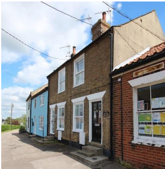
Well Cottage, No.3 and Olivers, No.4, North Green

Southwold Library, North Green (Positive Unlisted Building). Former commercial Assembly Room of probable late nineteenth century date converted to public library c.1939. For a time shortly before World War One also the town's temporary Roman Catholic Church. Red brick with a red pan tile roof. Original hornless plate glass sashes beneath painted wedge-shaped lintels. Pair of blocked doorways in Station Road elevation. The building makes an important contribution to the town's social history, reflecting its popularity as a centre for the local elite.