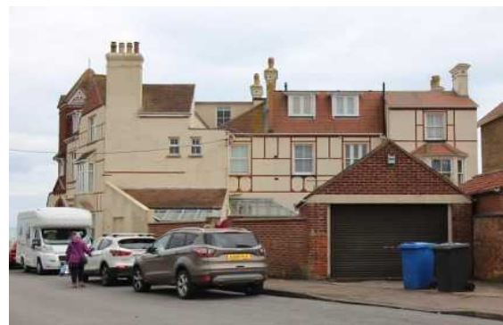
No.28 North Parade from Field Stile Road