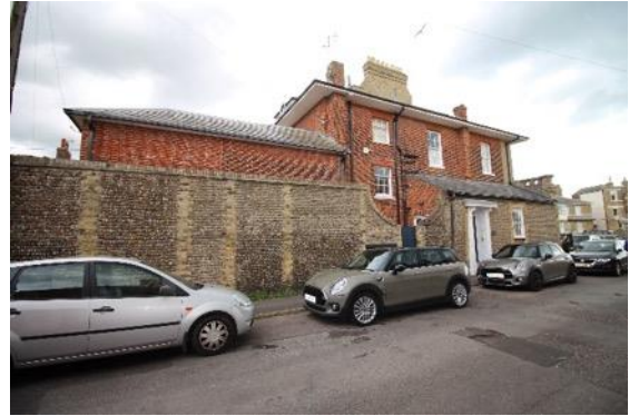
Park Lane façade of Regency House, South Green