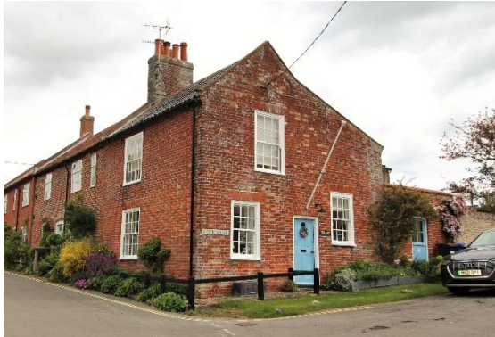
Park Lane Cottage, No.27 Park Lane

Park Lane Cottage West, Gardner Road (Grade II) See also: 27, Park Lane Cottage, Park Lane.