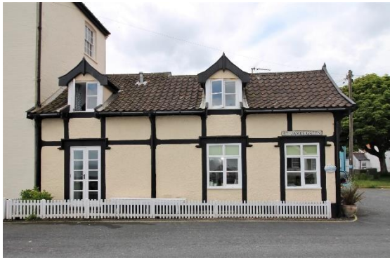
Seaview Cottage, East Cliff

applied timber framing, decorative dormers and hood moulds above the windows are not shown on late nineteenth century photographs but do appear on those of the early twentieth century. Casement windows that at the northern end appears to have originally been a door. A central ridge stack which appears on early photographs has been removed. Late twentieth century pan tiled roof. Some unsympathetic modern fenestration.