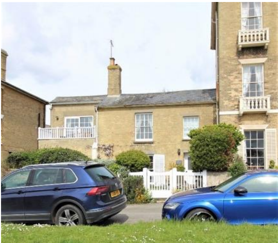
Cannon Lodge, South Green