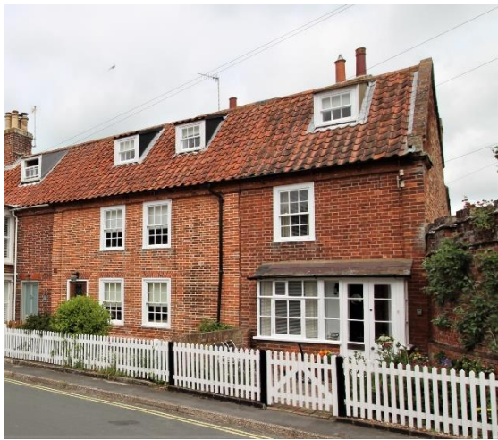
Nos.11 & 13 Lorne Road

Nos.11 & 13 Lorne Road (Positive Unlisted Structure). Probably of mid-eighteenth-century date of red brick with pilasters and a red pan tiled roof. Eastern gable of No.11 prominent in views along Lorne Road. Twelve-light hornless sash windows in heavy moulded frames beneath rubbed brick wedge-shaped lintels. Ground floor of No.11 has a twentieth century glazed lean-to porch and a twentieth century bay window beneath a continuous Welsh slate roof which replaces an earlier bay window shown on a National Monuments Record photograph of 1949 (BB49/3125). Flat roofed dormers in principal roof slope. Ridge stacks probably removed. The partially re-fronted No.15 forms part of the same structure.