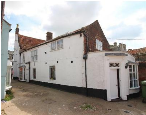
No.11 Market Place courtyard elevation