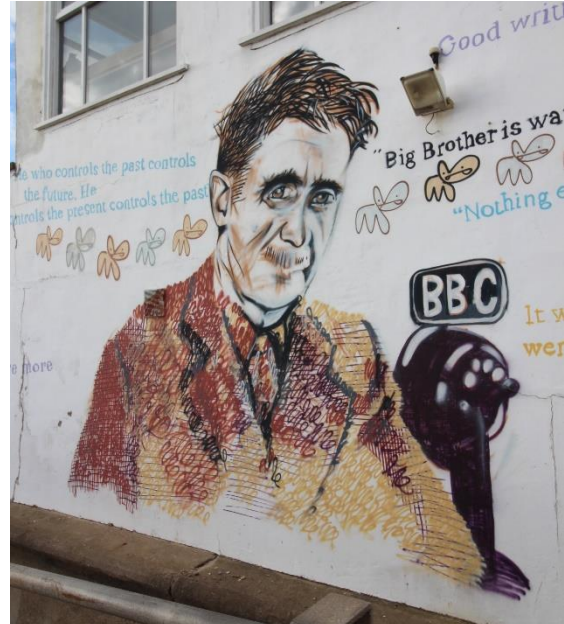
Mural of George Orwell, Pier Pavilion

In 1934 the end of the pier was swept away in a storm, and a further section was dismantled during World War Two. After the war the pier was rebuilt, but sections were also destroyed in 1955 and 1978. In 1960 the ground floor of the pavilion was converted into a public house called the Neptune Bar, it closed c.1984. The concert hall pavilion was restored in 1987 and the pier was reconstructed between 1998 and 2002 with new pavilions and stylish bench shelters designed by Southwold architect Brian Howard added. The pavilions reflected the form of the original pavilion of 1900. A water clock was added in 1998 designed by Tim Hunkin and Will Jackson.