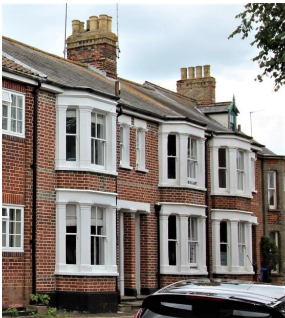
Holmes Cottages, Nos.13-15 (cons) Bartholomew Green

Nos.9-12 (cons) Bartholomew Green (Positive Unlisted Buildings). Part of a well-designed Southwold Corporation development of the early 1950s which replaced property destroyed in World War Two. It overlooks the churchyard. Probably designed by Cautley and Barefoot of Ipswich and playing an important role within the setting of the Grade I listed parish church. Red brick houses with pan tile roofs designed in a restrained Tudor-vernacular style, No.12 with crow-stepped gables. Small paned casement windows. Original partially glazed front doors survive beneath painted wooden bracketed hoods. Drawings by Cautley and Barefoot for housing at Bartholomew Green dating from between 1950 and 1953 survive in the Ipswich Branch of Suffolk Record Office but were not accessible at the time of survey (Ipswich Record Office HG400/2/468). See also Hope Cottages.