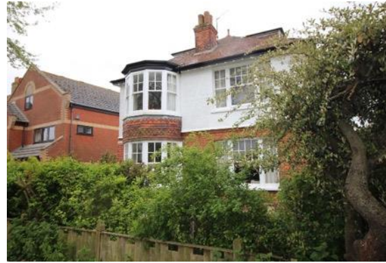
The Willows, No.66 North Road

Mights Cottages, Nos.30-40 (even) North Road (Positive Unlisted Buildings). A terrace of six pebble dashed Southwold Corporation council houses of c.1928 built on part of the allotment gardens created for the adjoining council houses c.1914. Partially glazed front doors beneath hoods supported by carved brackets, window joinery replaced. Hipped pan tile roof. Red brick chimney stacks.