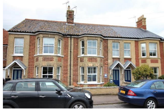
Nos.14-16 (cons) Field Stile Road

No.12A-12C Field Stile Road (Positive Unlisted Building). A three-storey semi-detached house now converted to flats. Red brick with Suffolk white brick dressings and pilasters. Constructed sometime between the publication of the 1891 Ordnance Survey map and the taking of a photograph dated 13 th October 1893 in the Southwold Museum collection. Horned plate-glass sashes. Decorative pierced bargeboards to half dormers at second floor level. Recessed arched porch sadly replaced with window but principal façade otherwise intact. Gault brick boundary wall with square section pier and pyramidal cap to east. The house plays an important role in the setting of the Grade I listed parish church which is located directly to its south.