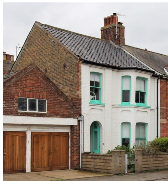
No.4 Dunwich Road

No.2 Dunwich Road – See Nos. 11-13 North Parade