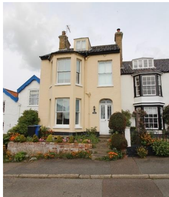
Holly Lodge, No.9 Constitution Hill