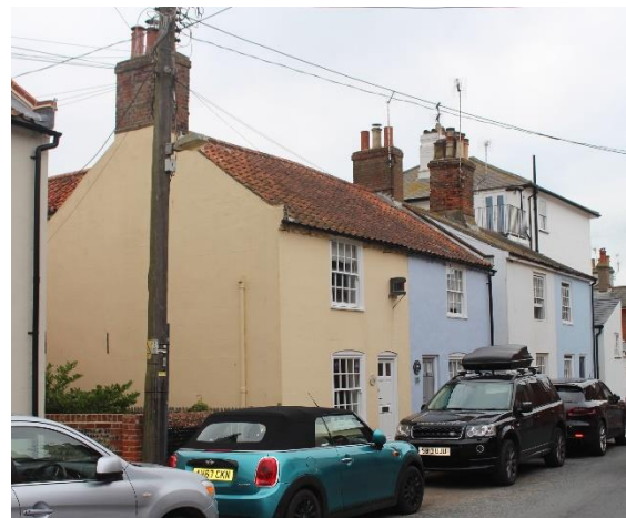
No.68 & Avocet Cottage No.70 Victoria Street

Nos.56 & 58 Victoria Street (Positive Unlisted Buildings). A pair of rendered red brick cottages of c.1800 date. Red pan tiled roof with a small stack rising from the spine wall between the two cottages. Late twentieth century replacement sashes and panelled doors. A 1949 National Monuments Record photograph shows No.56 with a boarded front door and a horned four-light plate glass sash to the first floor. Below is a small pane hornless sash. (BB49/3035).