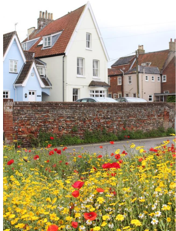
Gardner Road elevation of Nos.15A & 15B Lorne Road

Lorne Cottage, No.15 (Positive Unlisted Building). An eighteenth-century structure which probably originally looked like Nos. .11 & 13 but now with large two storey later nineteenth century bay windows. Red brick with painted stone dressings and a red pan tiled roof. Central brick pilaster and brick eaves cornice. Large possibly replaced four-light plate-glass sashes. Central red brick ridge stack flanked by flat topped dormers with six-light sashes. Partially glazed front door beneath rubbed brick wedge-shaped lintel.