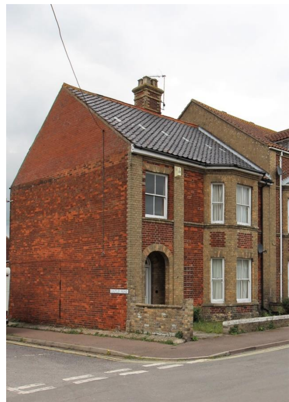
'Avondale', No.11 Field Stile Road

Queen Victoria's diamond jubilee and opened in 1903. It was designed by Thomas Edward Key of Leiston. Symmetrical façade of red brick with applied decorative timber framing to the gables. Red plain tile roof with gabled dormers. Sashes windows divided by central mullion below rubbed brick wedge shaped lintels and with decorative apron beneath. Altered 1929, operating theatre enlarged and rebuilt 1933. The hospital closed c.2015. Mid twentieth century flat-roofed additions to front and rear demolished c.2020 and buildings in process of conversion into a 'community hub' 2021. The original hospital building plays an important role in the setting of the Grade I listed parish church which is located directly to its south.