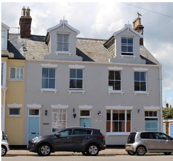
Nos.14- 14A Stradbroke Road

Dolphin House and Douglas House No.12 Stradbroke Road (Positive Unlisted Building). House, formerly house and shop of c.1895 (this site is shown as vacant on some early photographs for some time after No.14 had been completed). Rendered with a Welsh slate roof. Moulded eaves cornice. Substantial gabled dormers with elaborate decorative bargeboards and spear finials, with unsympathetic windows. The sides of the dormers clad in slate. Two storey bay windows with mullioned casements which were possibly added in the early twentieth century, that to the south formerly acting as a shop window. Applied decorative timber framing. Window joinery largely replaced. Painted stone wedge-shaped lintels to doors. Red brick ridge stacks. Ship's figure head on bracket above front door.