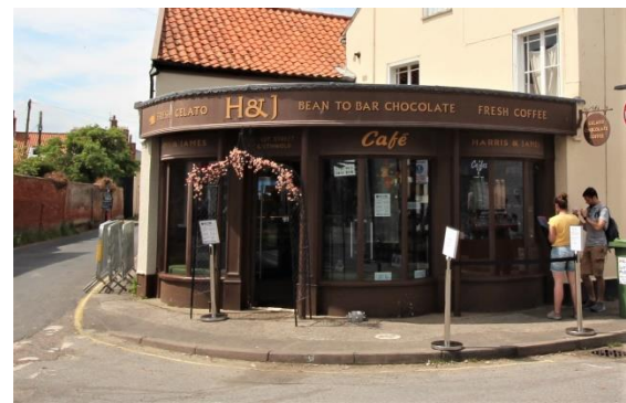
No.11 East Street

East Lodge & Upper East Lodge, East Street (Positive Unlisted Building). Rendered red brick dwelling of c.1800 with a black pan tiled roof. Now two flats. On the first floor of the principal façade are two twelve light hornless sashes flanking a central blind recess. Beneath at ground floor level is a centrally placed pilastered doorcase with a twentieth century partially glazed panelled door. To the west of the door is a mid-nineteenth century former shop window, to its east a horned sash window divided into three sections by mullions. Eastern return elevation retains two casement windows with narrow margin lights. Western return elevation with horned sashes.