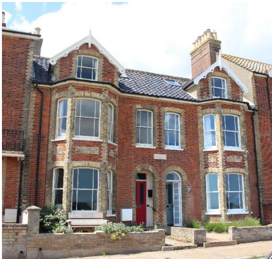
Nos. 3 & 4 North Parade

Nos.1 & 2 North Parade (Positive Unlisted Buildings). Semi-detached pair of villas built of red brick with elaborate gault brick dressings. Built sometime between the publication of the 1891 and 1904 Ordnance Survey maps. Nos.5-9 (Odd) Dunwich Road are of a similar design. Hipped Welsh slate roof with overhanging eaves. Decorative first floor balcony of cast iron resting on canted bay windows beneath. Original partially glazed front doors preserved within linked arched surrounds. Original horned plate-glass sashes throughout except to French doors to balcony which are less sympathetic visually. Rendered southern return elevation. Low gault brick garden wall of similar date to front. Nos.1 & 2 make a strong positive contribution to the setting of the Grade II listed lighthouse.