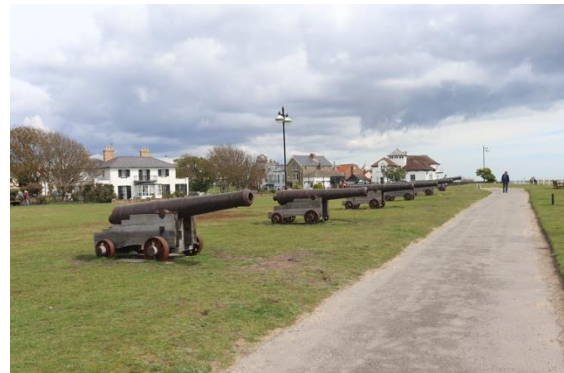
Row of six cannons, Gun Hill

Watch House (or The Casino), Gun Hill (Grade II)