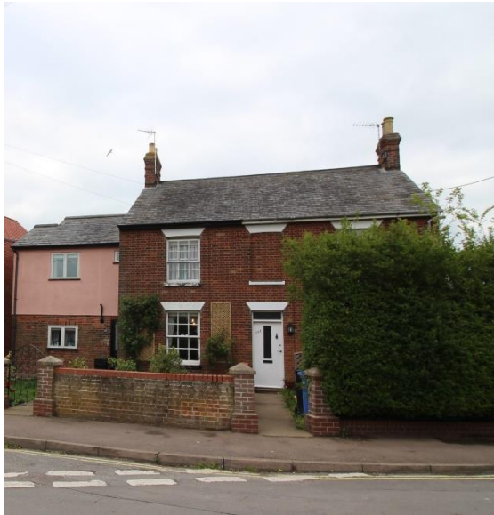
No.10A Field Stile Road

No.10A Field Stile Road (Positive Unlisted Building). Former farmhouse of c.1800 associated with the Town Farm whose lands were sold by the Corporation for development in 1899. At the time of the 1881 census the farm was comprised of 46 acres. Its farm buildings disappeared gradually during the opening decades of the twentieth century. Of red brick with a Welsh slate roof. Symmetrical three bay two storey principal façade with a blind decorative recess in the form of a window opening above the central front door. Twentieth century partially glazed front door with rectangular fanlight. Twelve light hornless sashes below plaster faced wedge shaped lintels. The house plays an important role in the setting of the Grade I listed parish church which is located directly to its south. Good twentieth century dwarf red brick walls to frontage. The attached later twentieth century property to the north does not contribute positively to the conservation area.