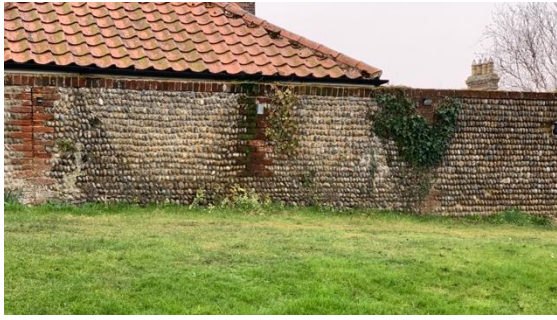
Boundary Wall to Castle Keep, Skilmans Hill

Boundary Wall to Castle Keep, Skilmans Hill (Positive Unlisted Structure). A coursed washed cobble wall with red brick capping course, rising to square section brick piers. Probably dating from the later 19 th century, although the piers look later. The wall makes an important and highly visible contribution to the south east side of Skilmans Hill as well as the properties facing Constitution Hill.