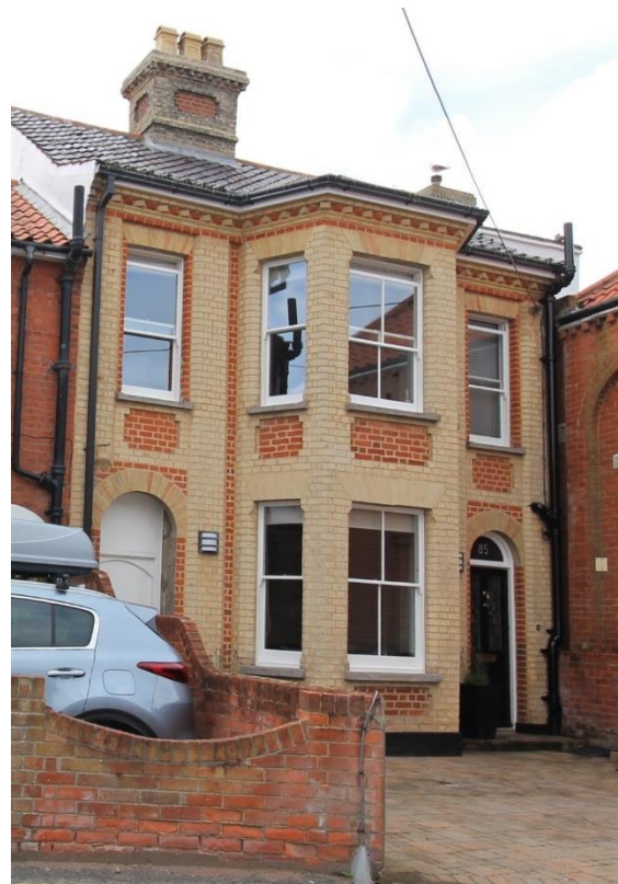
No.85 Victoria Street

No.85 Victoria Street (Positive Unlisted Building). A house of c.1890 faced in red brick with Suffolk white brick dressings. Central full height canted bay with horned plate-glass sashes flanked by arched door openings. The right-hand opening contains a partially glazed and panelled front door beneath a semi-circular plate-glass fanlight. That to the left is a passage entrance. Decorative chimneystack of red brick with Suffolk white brick dressings. Pan tiled roof.