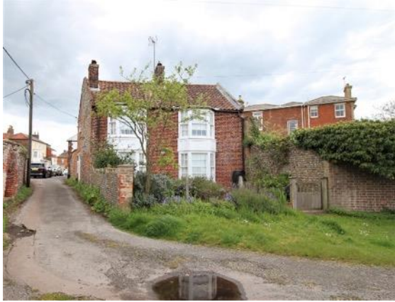
Skilmans Cottage, Skilmans Hill

Skilmans Cottage, Skilmans Hill (Positive Unlisted Building). Red brick cottage, two storey, probably dating from the early 19 th century. A pair of later two storey canted bays to the west elevation. Red clay pan tile roof with a pair of red brick stacks. The north return elevation displays the scars of various door and window alterations through an interesting mix of washed cobble and red brickwork.