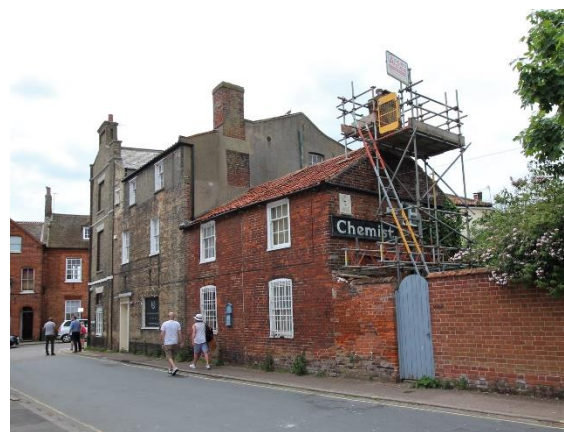
Church Street elevation of No.100 High Street

No.96 High Street (Positive Unlisted Building). Mid nineteenth century house converted to retail premises c.1900. Of painted brick with horned four light plate-glass sashes. Good c.1900 shop front with panelled pilasters and delicate cast iron columns. Original shutter box also appears to survive. Originally with arched doorway and a single window to the ground floor. No.96 makes a strong positive contribution to the setting of the adjoining listed buildings.