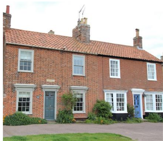
'The Retreat' No. 20 and 'Pin Cottage' No.22, South Green

wall and garden. Apparently of 1910 and possibly by Pells & Son, although it does not appear to be shown on the 1927 1:2500 Ordnance Survey map and was possibly built as part of the rebuilding work following bomb damage in 1940. Stylistically it owes much to its neighbour, Acton Lodge, to which it was linked and provided additional accommodation in the form of a Consulting Room for a GP's surgery. Later work has separated ownership and added unsympathetic entry points for a double garage and dormers to the roofline. See Bettley, J and Pevsner, N The Buildings of England, Suffolk: East (2015), p.522.