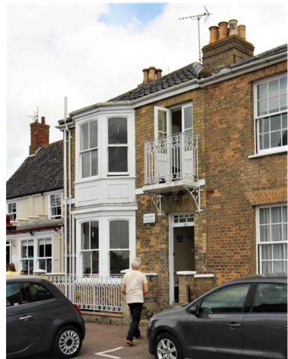
Sole Bay Cottage, No. 4 South Green