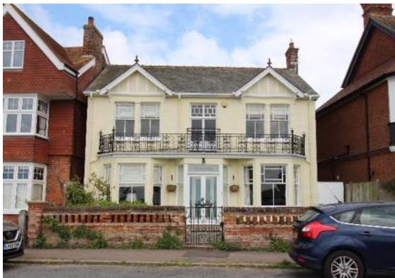
Forest Lodge, No.6 Godyll Road

Barnaby Lodge, Godyll Road (Positive Unlisted Building). A large detached villa, first shown on the 1904 Ordnance Survey map (1:2,500). Compositionally similar to No.1 and No.2 Godyll Road although differing in material use and detailing. Central entrance with balustraded balcony over, flanked by two storey square bay windows. The first floor carries out over the bays with a pair of tile hung gable ends. Regrettably the house has lost much of the joinery evident in historic photos, but the form and skill of the original design remains apparent.