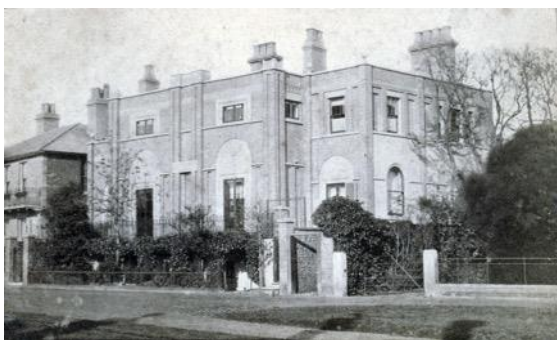
Nos. 10A-10D South Green from a c.1870 carte de visite