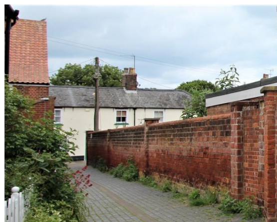
Electricity Substation Boundary Wall, Bank Alley

Nos.1 & 2 Bank Alley (Positive Unlisted Buildings). A well-preserved semi-detached pair of late nineteenth century cottages of red brick with Suffolk white brick dressings and quoins. Western return elevation now rendered. Horned plate-glass sashes. Painted stone wedge-shaped lintels with pronounced key stones. Dentilled eaves cornice of Suffolk white brick and Suffolk white brick plat band below first floor windows. Central arched doorway with boarded door giving access to rear gardens. Panelled front doors with rectangular fanlights. Good single storey red brick ranges of outbuildings attached to rear with red pan tile roofs and casement windows. Nineteenth century cobble boundary wall to rear of No.1.