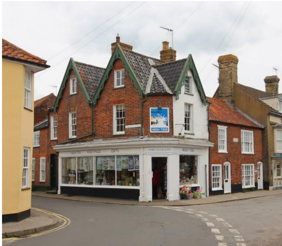
No.36 East Street

No.36 East Street incorporating the former Nos. 1 & 3 Trinity Street (Positive Unlisted Building). A prominently located mid nineteenth century shop of red brick with a black pan tiled roof. Decorative pierced bargeboards to gables now sadly lacking their spear finials. Twelve light hornless sashes to first floor windows. Casements to second floor. Ground floor retains late nineteenth century shop fascia with splayed corner entrance flanked by pilasters.