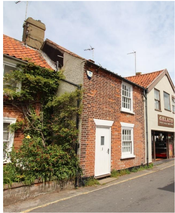
No.1 Pinkney's Lane

For Pinkney's Lane South Side see Marine Villas Character Area