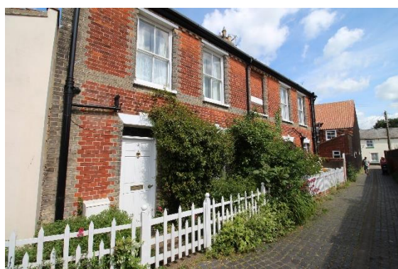
Nos.1 & 2 Bank Alley

Rutland Cottage – See Nos.80 & 80A High Street (Grade II) See also Nos. 78 High Street and 35 Victoria Street.