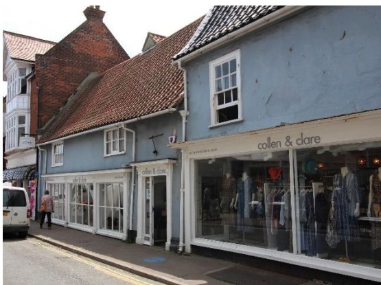
No.25 Market Place (East Street façade)