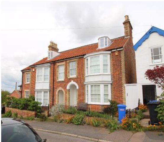
Staff Cottage, No.13 (right) and Clyde Cottage, No.15 (left), Constitution Hill

Nos.13 and 15, Constitution Hill (Positive Unlisted Buildings). A pair of late nineteenth century houses, the design of which reflects the gradient of Constitution Hill. Red brick with white brick margins, canted two storey bays and entrances grouped to the centre of the elevation. Red clay pan tile roof covering, with a canted timber attic dormer to each property. Two storey side addition to No.15 built c.2012.