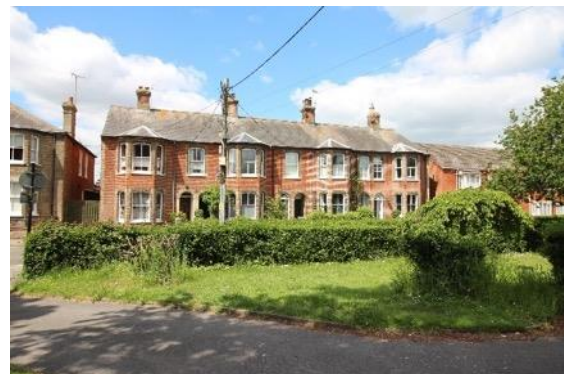
Nos.21-27 (Odd) Station Road

Nos.11 and 13, Station Road (Positive Unlisted Buildings). A pair of early twentieth century two storey cottages, with entrances grouped to the centres (now enclosed) and single plate glass sash windows to the outer edges of the elevation. Blue glazed pan tile roof, without dormers or skylights, with gable end red brick ridge stacks. The red brick elevations have attractive white brick horizontal bands to the heads and sills of the ground floor and first floor windows. Small front gardens enclosed by dwarf red brick walls.