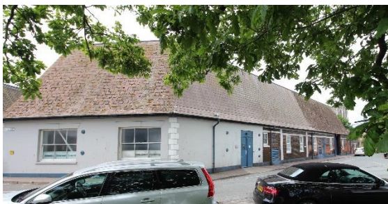
East Green façade of former maltings complex

Victoria Cottages No.36 & 38 Victoria Street (Positive Unlisted Buildings) . Rendered red brick cottages of probably mid nineteenth century date. No. 36 retaining its original window and door openings with wedge-shaped lintels. Four pane plate-glass sashes. Window openings to No.38 altered. Single storey painted brick outbuildings to rear of probably nineteenth century date, with boarded doors, casement windows and a red pan tile roof.