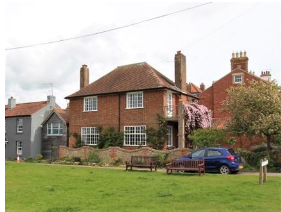
Ashleigh, Constitution Hill

Holly Lodge, No.9 Constitution Hill (Positive Unlisted Building). Late nineteenth century house. Painted brick with two storey canted bay. Entrance under a three-centered arch. Black glazed pan tile roof, with gable end stacks constructed from gault brick. The house retains its original un-horned plate glass sash windows. The attic dormer is a later addition.