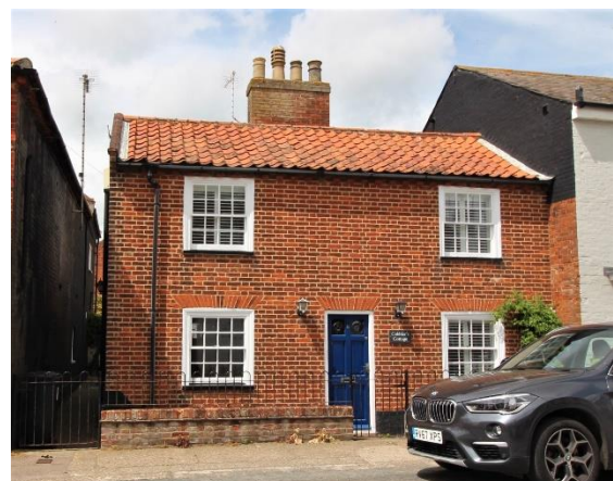
Cobbler's Cottage, No.8 Trinity Street