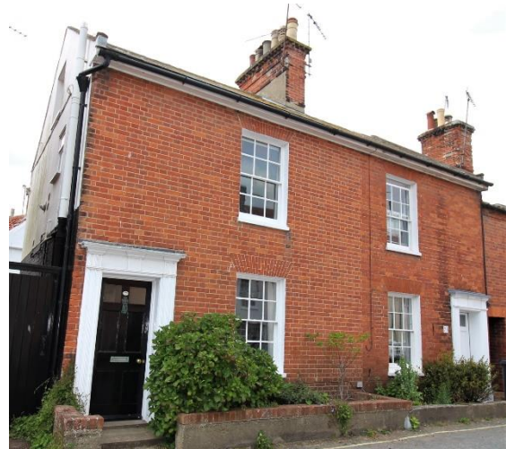
Nos.75 & 77 Victoria Street

Twitten Cottage No.71 & Cygnet Cottage, No.73 Victoria Street (Positive Unlisted Buildings). A pair of small early nineteenth century red brick cottages with black pan tiled roofs (replacing Welsh slate). Substantial ridge stack rising from spine wall between the cottages. Late twentieth century pilastered doorcases, over original simpler openings with wedge-shape rubbed brick lintels similar to those of the adjoining windows (See 1949 NMR photograph BB49/3097). Twelve-light hornless sashes beneath wooden lintels at first floor level. The cottages make a strong positive contribution to the setting of the Grade II listed Nos. 75 & 77. Miller, John Britain in Old Photographs, Southwold (Stroud, 1999) p98.