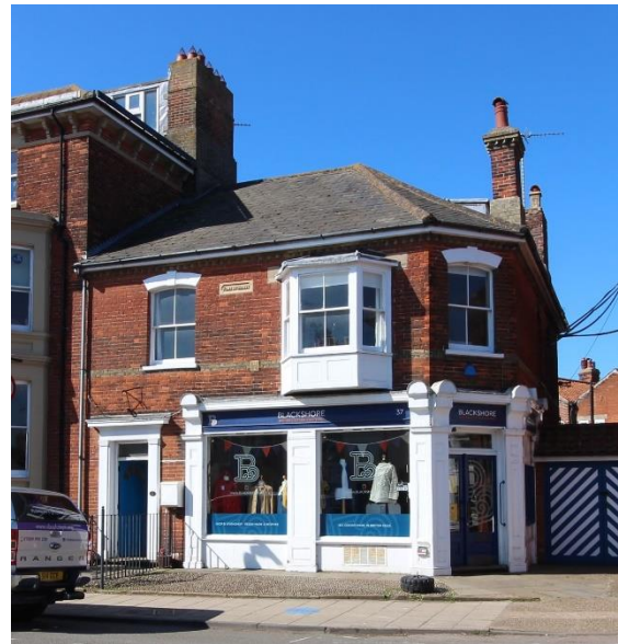
No.37 High Street

of each property. Four light plate-glass sashes set in heavy stone surrounds to first floor. Probably constructed c.1900 and shown on the 1904 1:2,500 Ordnance Survey map.