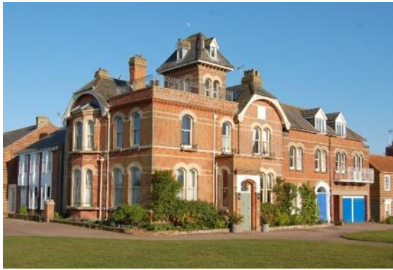
Acton Lodge, No.18 South Green

Acton Lodge, No.18 South Green (Positive Unlisted Building). An imposing and spirited red brick building of 1872. Originally 'L' plan with a striking tower located to the re-entrant angle. Early 20 th century flat roofed addition, infilling this corner of the site, and obscuring the base of the tower. Projecting porch probably also of this date. Red brick with contrasting Suffolk white brick string courses and stone surrounds. Attractive iron window railing bars to the majority of window openings. Arched heads to plate glass sash windows with a bold stone sill course to ground floor openings. Gable ends with hipped slate roofs carried forward and supported by decorative half-round timber bargeboards. Date stone to west facing gable. Pyramidal slate roof, overhanging and corbelled to the tower, with encaustic tile decoration between. Slender sash windows creating an Italianate feel. Damaged during a bombing raid in 1940 which destroyed neighbouring properties.