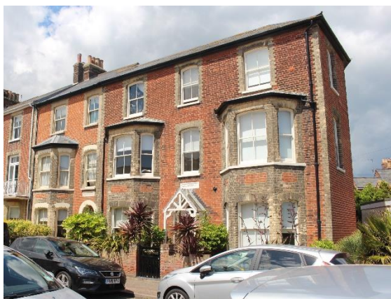
Nos.1 & 3 Dunwich Road

Wye Cottage No.1 & No.3 Dunwich Road (Positive Unlisted Buildings). A pair of substantial three storey houses with some similarities to Nos.4-10 (even) Chester Road and Nos.15-19 (Odd) Marlborough Road. Built sometime between the publication of the 1891 and 1904 Ordnance Survey maps. Red brick with elaborate gault brick dressings. Two storey canted bay windows retaining original plate-glass horned sashes. Front doors set within arched openings that to No.1 now with a late twentieth century glazed wooden porch. No.1 also has plate-glass sashes in its eastern return wall. This property is likely to have suffered bomb damage in World War Two as the neighbouring now demolished Marlborough Hotel was very badly damaged in 1943.