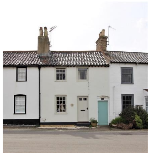
No.8 Queens Road

Garden Lodge and Mole End, Queens Road (Positive Unlisted Building). Northern range of former stable block to Southwold House, remodelled c.2017. Originally containing groom's accommodation on the first floor. The principal interest of this range is the attractive gault brick north east elevation with contrasting red brick horizontal banding and lintels.