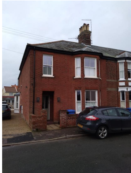
No. 9 Salisbury Road

paired recessed porches with decorative tile insets. Decorative eaves cornice. Partially glazed front doors of various designs all of which appear to be of later twentieth century date. Horned plate-glass sashes. Tall red brick ridge stacks with a decorative cap. Rebuilt dwarf red brick boundary walls to Salisbury Road. Of very similar design to Nos.31 & 33 & Nos. 58-80 Stradbroke Road.