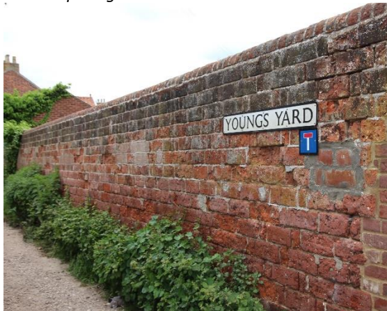
Boundary Wall to Electricity Substation on Northern Side of Youngs Yard

See also No.39 Victoria Street and attached workshop range to rear.