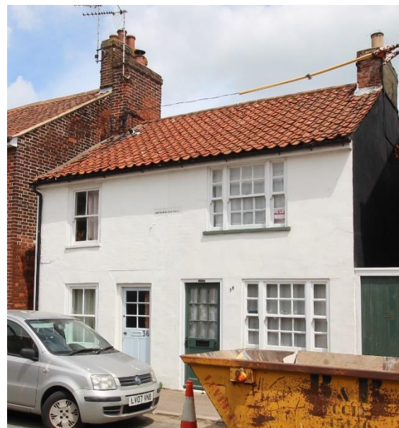
Victoria Cottages No.36 & 38 Victoria Street

the present steeply pitched roof slope blocking views of the lighthouse shown in photographs. Office range frontage to East Green now without historic door openings. See NMR photographs of c.1967 taken by Rex Wailes.