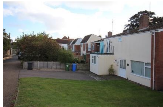
No.70 Pier Avenue

which form part of a notable group with Nos. 60 & 62. Red brick with steeply pitched red pan tiled roofs. Symmetrical façade of four bays, the end bays to each house projecting slightly and have a full height tile hung canted bay window over which the roof projects to form a hood. Replaced casements with mullions to central bays. Porches with steeply pitched pan tiled roofs supported on square section wooden pillars. Both houses retain their original partially glazed, boarded front doors. No. 64 appears also to retain its original red brick boundary wall and gate piers to Pier Avenue. To its west is a single storey recent addition of sympathetic design which replaces the original garage building. Garden façade remodelled. The large plot on which these and adjoining houses fronting Marlborough Road were built was originally intended for a place of worship by the Coast Development Company. The equally inventive Nos.59-63 (Odd) Marlborough Road also occupy part of this former plot.