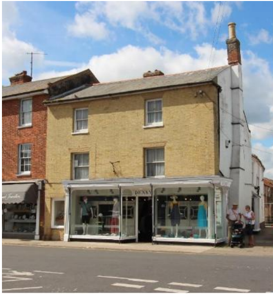
Nos.11 & 13 Market Place