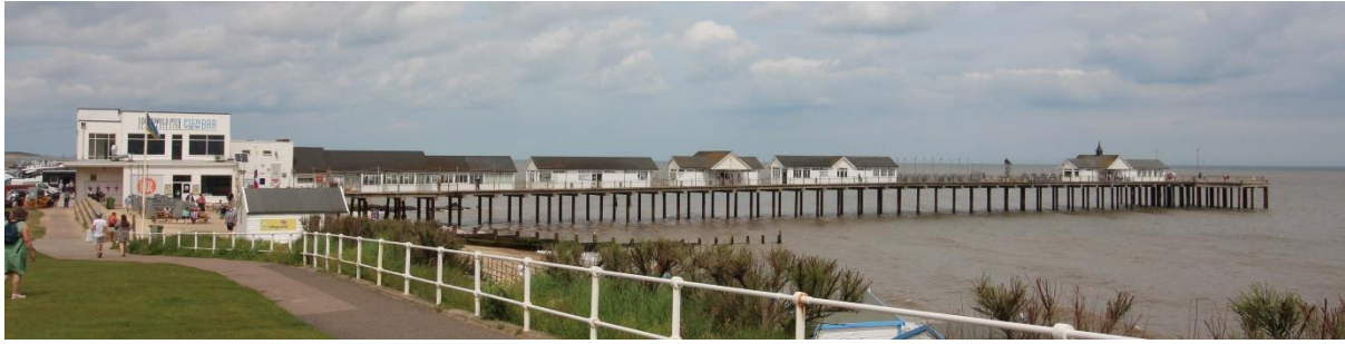
Southwold Pier from the south west.