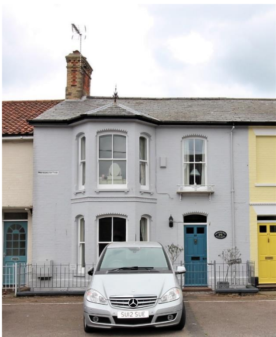
Providence Cottage, Cumberland Road

fenestration appears original. Welsh slate roofs largely replaced with red pan tiles. The Southwold and Son website intriguingly suggests that the three southern houses incorporate remains of a former flint faced fishing net manufactory and that the two southern houses were added c.1880. Traces of the earlier building can apparently be found within the fabric of the southern part of the terrace. No.17 was an academy for young ladies in the 1880s. Good boundary walls to front garden of cobble and brick to Nos.18 & 19. Southern return elevation to Cumberland Place gabled and rendered. Rendered rear elevation. Boundary walls to northern houses of rendered brick. Boarded fences and late twentieth century garages to rear.