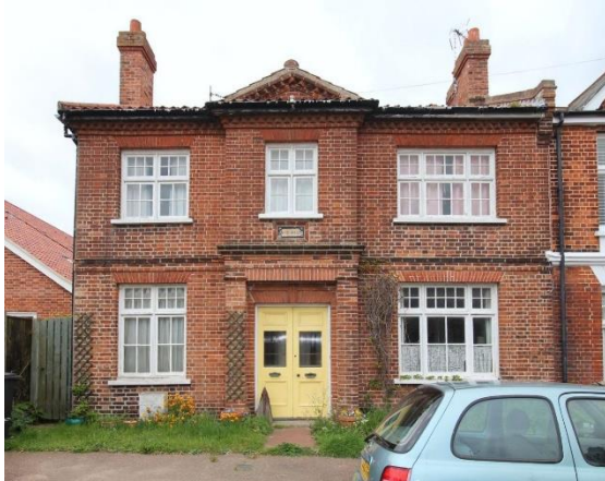
No.1 Cautley Road

No.1 Causley Road (Positive Unlisted Building). A brick villa of c.1900 (shown on the 1904 1:2,500 Ordnance Survey map) possibly associated with the adjoining former hospital. Of three bays with a central pedimented breakfront containing a pilastered porch with double, partially glazed doors. Mullioned and transomed original casement windows. Heavy dentilled brick eaves cornice. Jenkins, A Barrett A Visit to Southwold Containing Over 100 Photographs of Historic Interest (Southwold, 1983) p 28.