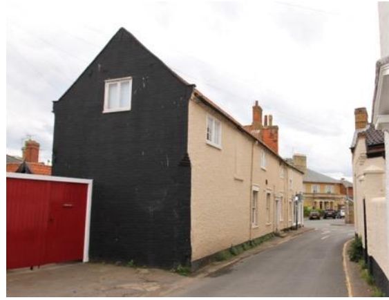
No.6 Pinkney's Lane

Red brick boundary wall, Pinkney's Lane (Positive Unlisted Building). Built using Monk Bond, and attached to the south west of No. 4. Pinkney's Lane. Probably of mid 19 th century date, and raised in height where it abuts the south gable of No.4. Buttressed along its length and probably built to enclose the western boundary of land associated with Centre Cliff.