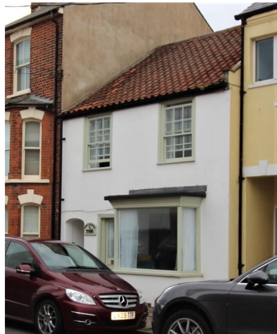
James Cottage, No.10 Stradbroke Road

No.8 Stradbroke Road (Positive Unlisted Building). One of three dwellings shown on this site on the 1884 1:2,500 Ordnance Survey map which now make up Cornfield Terrace. Two probably date from c.1880 whilst the other may be considerably earlier. Red brick with Suffolk white, or gault brick dressings and a Welsh slate roof. Overhanging eaves. Wooden doorcase with pilasters and a bracketed hood containing a partially glazed panelled front door beneath a rectangular fanlight. Original horned plate-glass sashes. Mid twentieth century dwarf red brick wall to street frontage. Cornfield Terrace plays an important role in the setting of the Grade II listed Sole Bay Inn and lighthouse.