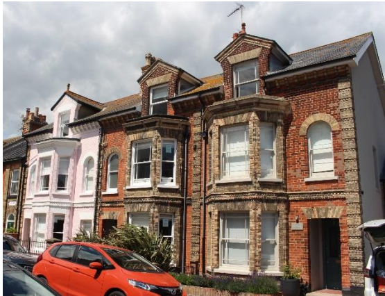
Nos.1-5 (Odd) Chester Road

Balmore Cottage, No.1A Chester Road – see No.7 North Parade and for 1B Chester Road - see No.4 Chester Road.