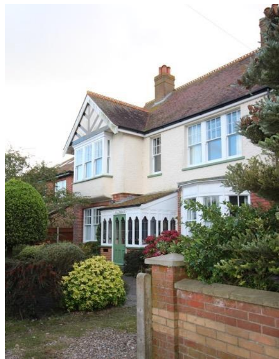
No.67 North Road

The Willows, No.66 North Road (Positive Unlisted Building). A well-preserved detached villa of c.1910 with display facades to North Road and Marlborough Road. North Road elevation of red brick with a rendered first floor and tile hung full height canted bay. Original heavy wooden sashes divided by mullions with small panes to the upper part of the sash. Plain tile roof with decorative finials to ridge and decorative overhanging eaves. Red brick stacks to ridge. Glazed front door to Marlborough Road façade now within later glazed flat roofed porch. Ground floor hung with decorative tiles; first floor rendered. Later flat roofed dormer. Southern return elevation gabled with applied timber framing to apex of gable.