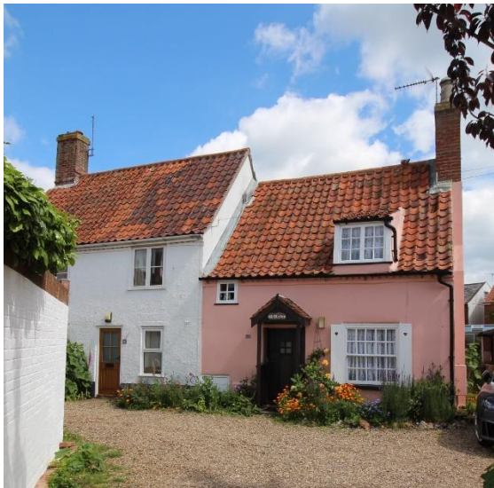
Nos.14 & 16 Snowdens Yard

Nos.14 & 16 Snowdens Yard (Positive Unlisted Buildings). A pair of early to mid-nineteenth century cottages. No.14 of a single storey and attics, built of rendered brick with a red pan tiled roof. Substantial red brick stack to eastern gable. Twenty light hornless sash window with shutters to the ground floor. Twentieth century boarded front door in late twentieth century open-sided gabled wooden porch. Small casement window to stair and dormer above. No.16 of two storeys. Rendered brick with a red pan tiled roof and unsympathetic late twentieth century windows.