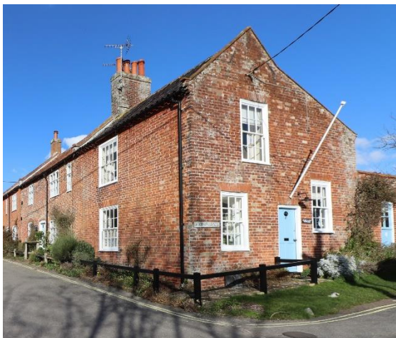
Park Lane Cottage, No.27 Park Lane