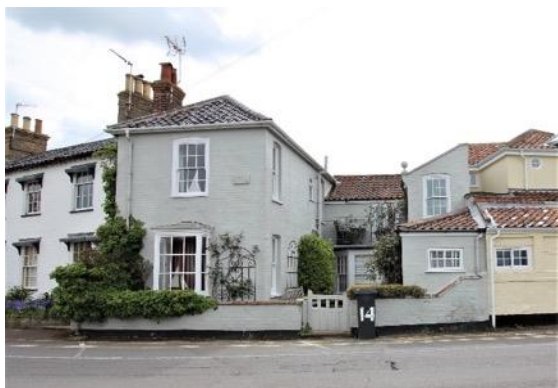
No.14 'The Moorings', Queens Road

The Bolt Hole, No.10 and Wayside Cottage, No.12 Queens Road (Grade II)