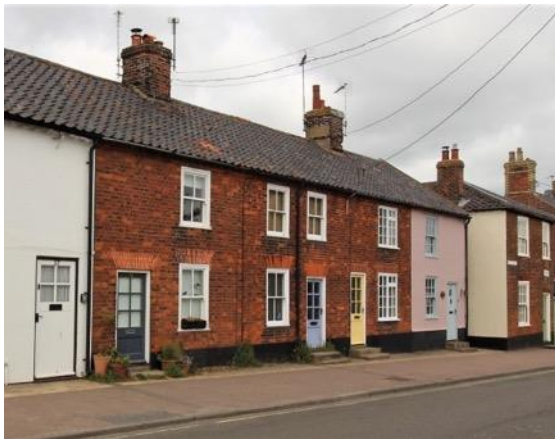
Nos.9-15 (Odd) High Street

rendered, No.9 remains the better preserved of the two and contributes positively to the setting of adjoining listed buildings. Twelve light hornless sashes and a partially glazed front door. The window and door openings to No.11 have been altered, but the red brick elevations make a positive contribution to the streetscape. Red brick ridge stack rising from party wall between the two cottages.