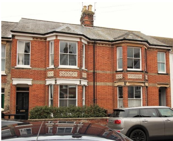
Nos.31 & 33 Stradbroke Road

Nos.21-29 (odd) Stradbroke Road (Positive Unlisted Buildings). A terrace of four red brick houses probably dating from the mid-1890s with a further identical house to their north. Red brick with a Welsh slate roof and painted plaster lintels. The original horned plate-glass sashes appear to largely survive throughout, though there have been some unsympathetic replacements. No.23 now with gabled dormer in western roof slope. No.23 still retains its original recessed porch but most of the others now have doors flush with the street façade. Dwarf red brick boundary walls, some now rendered No.29 retaining square-section piers with pyramidal caps.