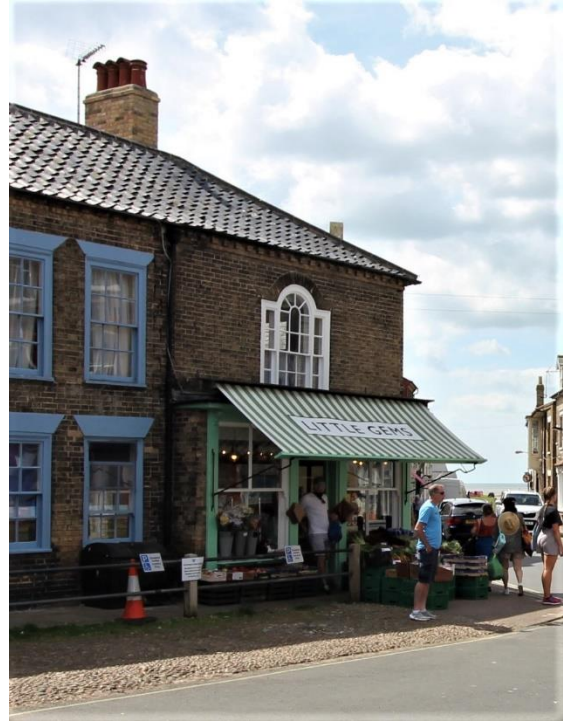
No.21 Market Place