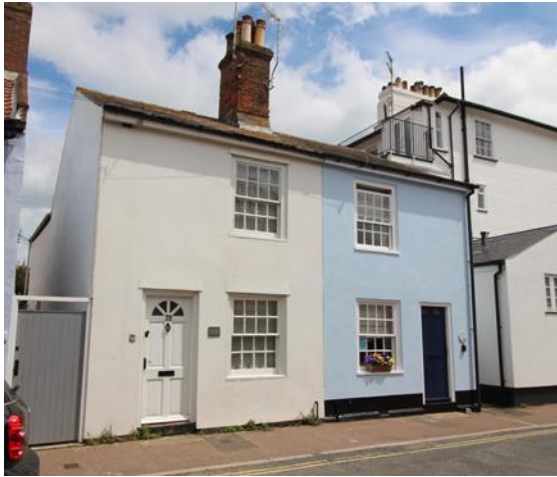
Nos.72 & 74 Victoria Street

Nos.72 & 74 Victoria Street (Positive Unlisted Buildings). A semi-detached pair of red brick cottages which were rendered in the early twenty first century. Welsh slate roof with substantial ridge stack rising from the spine wall between the two cottages. Hornless sixteen light sashes and panelled doors.