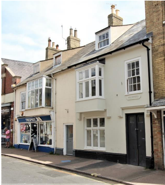
Holmwood, No.8 Queen Street