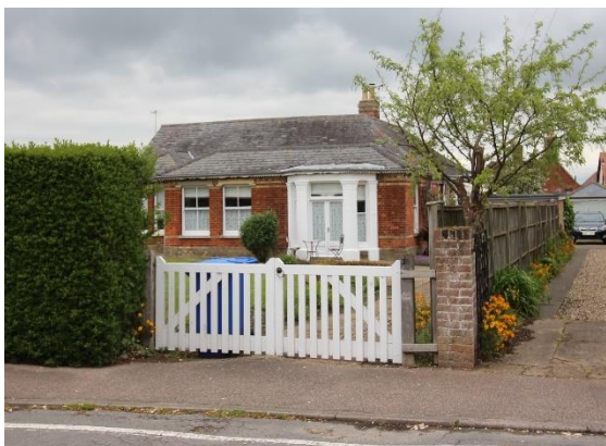
No.26A Field Stile Road

Victoria Cottages, Nos. 24 & 25 Field Stile Road (Positive Unlisted Buildings). According to the Southwold and Son website these cottages were built by the farmer William Frederick Baggot c.1877 on the site of a windmill which had recently been destroyed by fire. A pair of cottages are shown on this site on the 1884 1:2,500 Ordnance Survey map. Their façade is shown on a dated photograph of 1893. Redbrick façade with elaborate gault brick dressings. Roof of black pan tiles with red pan tile diamond shaped embellishments. No.25 has a late twentieth century small addition. Gabled nineteenth century red brick outbuilding to the rear of No.24 which may have once been connected to the Baggot's bakery business.