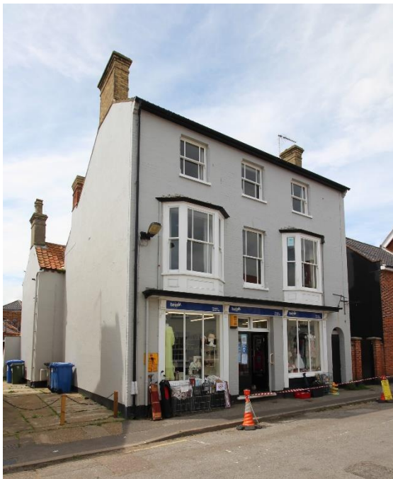
No.9 East Street

Mid to late nineteenth century red brick outbuildings buildings with chimney to rear probably constructed for Thompson and Sons whose builders' yard was here.