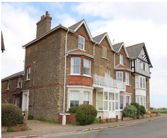
Sunset House, Godyll Road

Sunset House, Godyll Road (Positive Unlisted Building). A large villa, attached at its southern end, now flats. Shown on the 1904 1:2,500 Ordnance Survey map and likely built at the same time as the neighboring property (1897). A conservative design for this date. White brick with red brick lintels and band between the ground and first floor. Three full stories, with three attic gables, reflecting the appearance of neighboring property The Links. Below are plate glass sash windows, and a central blind opening (previously open). Two storey canted bay windows, painted stone to the ground floor and red brick above with pitched roofs covered with plain tiles. Between this is a balcony, now accessed from the bay windows, the central door shown on historic images having been removed and replaced by an off-centre sash window. Enclosed porch of later date.