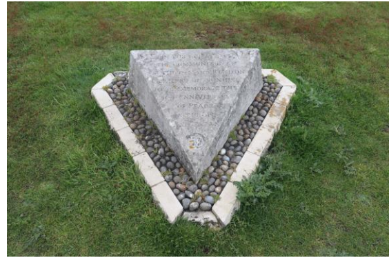
Detail of VE and VJ 50 th Anniversary Commemorative Stone, Gun Hill

Mast and VE and VJ 50 th Anniversary Commemorative Stone, Gun Hill (Positive Unlisted Structures) White painted timber mast with triangular Portland stone tablet commemorating 50 years of peace in Europe and Japan. Provided by the communities of Southwold and Reydon who gathered on Gun Hill on the 8 th May 1995 to mark the occasion. Decorative cobble border itself contained with stone edging.