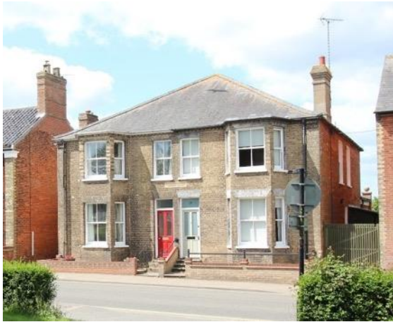
Nos.29 (right) and 31 (left), Station Road

Nos.29 and 31, Station Road (Positive Unlisted Building). White brick with red brick flank elevations (rendered to the south). Semi-detached pair of late nineteenth century houses, sharing many of the details seen in other houses on Station Road, but in slightly paired down form. Steps up to the entrances grouped to the centre of the front elevation, which is flanked by a pair of canted bay windows with flat roofs. Main roof of hipped pyramidal form, covered with Welsh slate. Good white brick stack to the return wall of No.29, with elaboratively corbelled cap, the stack to No.31 has been reduced in height. The houses retain their original plate glass horned sash windows, and the highly visible roof pitch is free from dormers or rooflights.