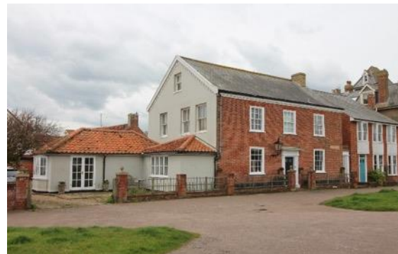
Nos.14 & 14A South Green