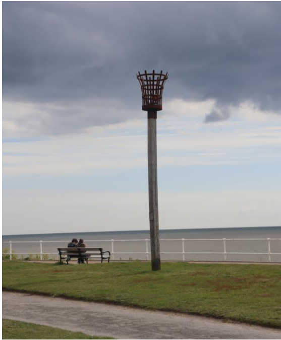
Beacon basket, Gun Hill

Beacon basket, Gun Hill (Positive Unlisted Structure). Iron basket comprising vertical straps and horizontal hoops, flaring out towards the top. Without date or inscription but possibly erected to commemorate The Queen's Silver Jubilee in 1977.