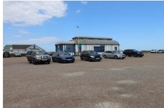
Alfred Corry Museum, Ferry Road

E16, Blackshore A former goods truck with corrugated ventilated ends, now used as a store. New pitched roof replaced the original curved structure. Timber sides, with taking in door.