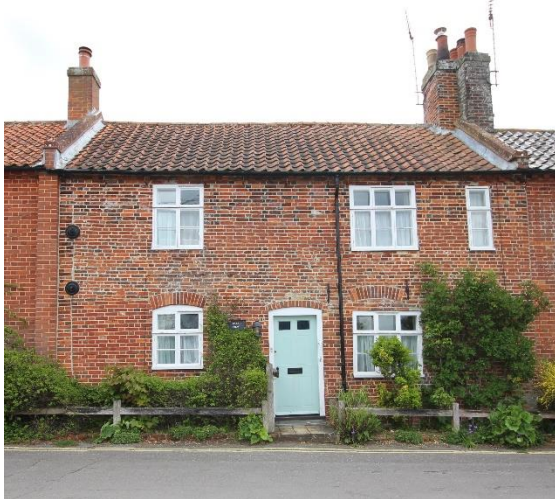
Park Lane Cottage West, Gardner Road

Park Lane Cottage West, Gardner Road (Grade II) See also: 27, Park Lane Cottage, Park Lane.