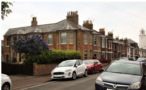
No.41 & Easton Lodge, No.43 Stradbroke Road

No.39 Stradbroke Road (Positive Unlisted Building). A late nineteenth century house of red brick with Suffolk white or gault brick dressings and painted stone lintels and sills. Replaced pan tile roof with elaborate eaves cornice. Four light horned plate-glass sashes. Recessed porch with late twentieth century replacement front door. Twentieth century dwarf red brick boundary wall capped by iron railings. The flanking square-section piers with pyramidal caps may however be original.