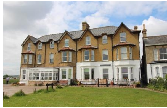
St Barnabus Residential Home, Godyll Road (façade to The Common)

Sunset House, Godyll Road (Positive Unlisted Building). A large villa, attached at its southern end, now flats. Shown on the 1904 1:2,500 Ordnance Survey map and likely built at the same time as the neighboring property (1897). A conservative design for this date. White brick with red brick lintels and band between the ground and first floor. Three full stories, with three attic gables, reflecting the appearance of neighboring property The Links. Below are plate glass sash windows, and a central blind opening (previously open). Two storey canted bay windows, painted stone to the ground floor and red brick above with pitched roofs covered with plain tiles. Between this is a balcony, now accessed from the bay windows, the central door shown on historic images having been removed and replaced by an off-centre sash window. Enclosed porch of later date.