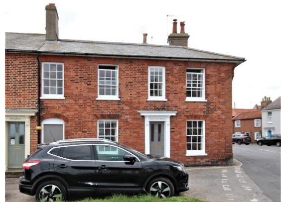
No.9 East Cliff and No.17 Trinity Street

No.11, Albion House No.13, & Kestrel Cottage No.15, Trinity Street (Positive Unlisted Buildings). A terrace of three red brick houses dating from c.1860 sharing details such as the doorcases in common with the Grade II listed No.17. Welsh slate roof with overhanging eaves. Tall brick stacks rising from the spine walls between the houses. Horned plate-glass sashes with margin lights below rubbed brick wedge-shaped brick lintels. Partially glazed and panelled front doors. The elevation of No.11 has been modified to allow for the insertion of an arched garage entrance.