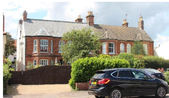
Nos.32-38 (even) Stradbroke Road

Nos.20 & 22 Stradbroke Road (Positive Unlisted Buildings). A pair of substantial semidetached houses which appear on a dated photograph of 1893 preserved in the Southwold Museum collection which was taken from the lighthouse. Red brick with red pan tile roofs (possibly replacing Welsh slate). Retaining their original horned four-light plate-glass sashes to their principal façade. Each house is of three bays with a central doorway flanked by full height canted bay windows. Red brick ridge stacks. Set back some distance from the road within mature leafy gardens. Mid twentieth century red brick gate piers to Stradbroke Road.