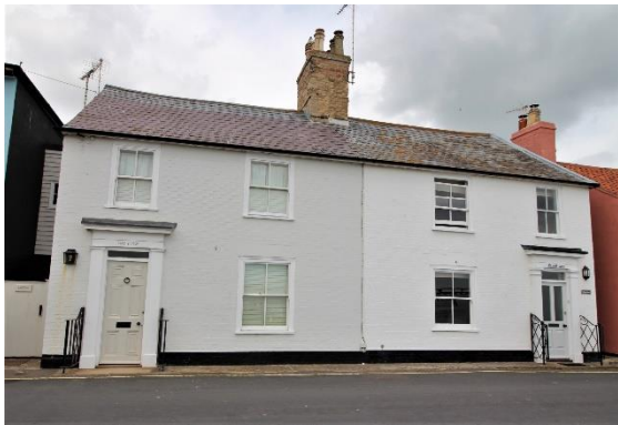
Nos.14 & 15 East Cliff