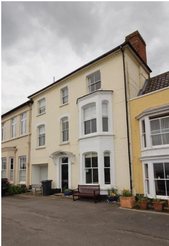
No.5 'Westbury House', South Green

The Homestead, South Green (Positive Unlisted Building). Mid 19 th century purpose-built shop premises, now with painted brickwork and converted to residential during the 1960s. The projecting single storey bay to the east elevation replacing a large plate glass shop window. The first floor, however, retains its original window configuration. Hipped slate covered roof.