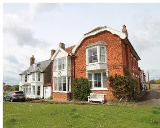
No.23 South Green

York Cottage No. 19 & No.21 South Green (Positive Unlisted Buildings). A pair of early 19 th century cottages with entrance to the outer sides of the front elevation and windows grouped towards the centre. No.19 has a pedimented doorcase with pulvinated frieze and to the side a broad tripartite window under a brick solidier course arch. Above is a hornless 8 over 8 pane sash window. No 21 has a matching door case and a two storey canted bay. Steeply pitched roof covered with red clay pan tiles and a red brick ridge stack to the party wall between the two cottages.