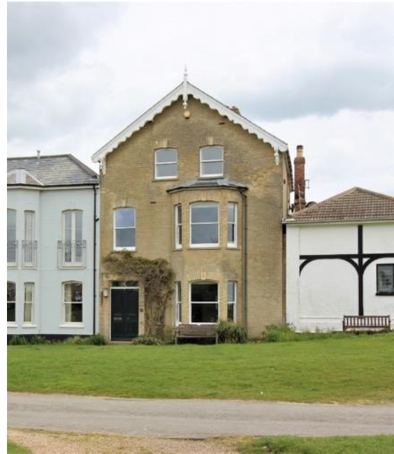
Bonsey House, No.30 South Green

'Harriet's Cottage', No.28A South Green (Positive Unlisted Building). Early 19 th century and probably originally a range of outbuildings relating to No.28. Two storey with painted render elevations. Red clay pan tile roof. Windows are a mix of ages, but with some retained historical joinery including the two storey canted bay with hornless sashes. Attached single storey range to the south east.