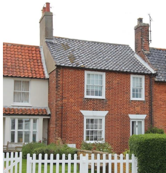
No.17 Barnaby Green

Nos.13 & 14 Barnaby Green (Positive Unlisted Buildings). A pair of houses which probably date from the 1880s and are similar in design to Nos. 8 & 9 Field Stile Road. Faced in red brick with elaborate Suffolk white brick and painted stone dressings. Welsh slate roof to frontage with ridge stacks rising from gables. Suffolk white brick dentilled eaves cornice. Canted bay windows containing horned plate-glass sashes between pilasters. Central front doors beneath shared painted stone lintel with rectangular fanlights. The doors themselves partially glazed. Northern return elevation to Spinners Lane blind. Rear elevation highly visible from Spinners Lane of red brick with a red pan tile roof and small pane sashes. Lower outshots with casement windows. Mid twentieth century front garden wall to north fronting Spinners Lane. Possibly nineteenth century cobble wall with brick dressings to rear. Nos.13 & 14 make an important contribution to the setting of adjoining listed buildings.