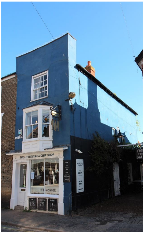
No.2 East Street