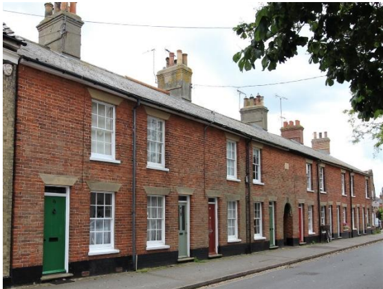
Victoria Buildings, Nos.13-29 (Odd), Victoria Street

century former gas light. Made by Child's Iron Foundry for the Southwold Gas Light Company.