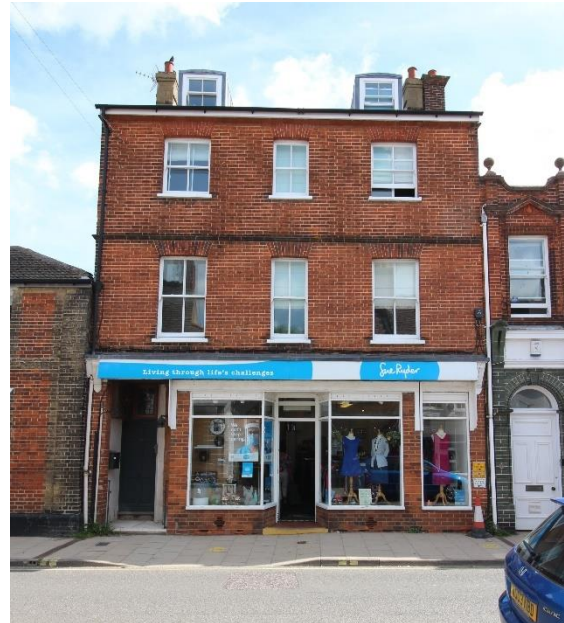
Nos.60 & 62 High Street

No.58 High Street (Positive Unlisted Building). Former Southwold Arms Public House. Closed 1996 now retail premises. A public house on this site was recorded by James Maggs in 1803, however the present building appears to date from the third quarter of the nineteenth century. Largely unaltered façade of red brick with white brick dressings and a hipped Welsh slate roof. Tall central chimneystack rising from ridge. Four light plate glass sash windows. Central pilastered wooden doorcase containing twentieth century partially glazed door. An important part of the setting of the adjoining Grade II* listed Sunderland House and of the listed buildings opposite.