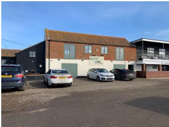
Former Warehouse, The Harbour Inn, Blackshore

Former Warehouse, Blackshore (Positive Unlisted Building). Reconstructed c.1997 to form kitchen and restaurant accommodation for the Harbour Inn Public House. Probably dating from the early 20 th century, red brick elevations with rendered ground floor. The majority of openings to the river facing elevation are from the late 20 th century conversion work. Red clay pan tile roof with upstand gable ends. This structure makes a positive contribution to the setting of the adjacent grade II listed Harbour Inn.