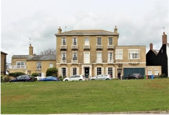
Hill House and Woldside, No.27 South Green