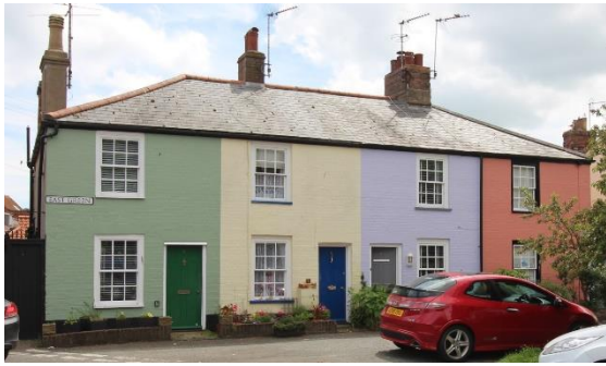
Nos.3-6 (cons) East Green