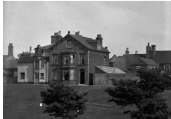
Historic view (undated) of Caneway Cottage, Skilmans Hill

sympathetically, borrowing stylistically from the neighbouring property although the first floor oriel is a departure. The house is extremely prominent in views of Skilmans Hill from Gardner Road.