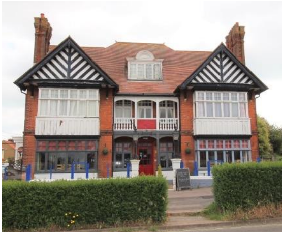
Blyth Hotel, Station Road

Blyth Hotel, Station Road (Positive Unlisted Building). An imposing and stylish building, originally called The Station Hotel owing to its close proximity to the Southwold Railway Station located opposite. Designed by Thomas Edward Key for Adnams Brewery, and built 1900-1 (The Randolph, an almost identical sister hotel, also by Key exists in Reydon). Domestic in its detailing but commercial and ambitious in scale, compositionally it owes much to the contemporary villas of Godyll Rod, particularly Langford Lodge. Symmetrical with centrally located entrance set back within an open columned porch of three bays, reflected to the first floor by an open balustraded balcony, covered by the roof over. Flanking the entrance are a pair of two storey square bays, half-timbered between floors and with closely studded diagonal timbers to the gables. To the attic is a single central dormer with projecting cornice which rises to the centre in a half-circle. The north elevation is highly visible on approach to the town, and it is perhaps this elevation, which continues the stylistic tone of the principal façade, where compositionally the building is seen to best effect. This landmark structure retains its original doors, windows balcony joinery and was designed by a significant and talented architect.