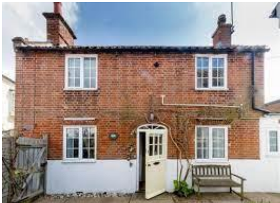
Thimble Cottage, Mill Lane

Nos.4-10 Mill Lane (Positive Unlisted Buildings). A row of four early nineteenth century cottages. Painted brick elevations with red clay pan tile roof covering. Ground floor door and casement windows under brick arch lintels, first floor casement windows tight to underside of the projecting dentil eaves course of brickwork. No.4 and No.10 have single storey side additions with a catslide roof over. The weatherboarded addition to No.4, and the flat roofed addition to No.10, are not of special interest. This row of cottages, along with No.2 Mill Lane, make a strong and positive contribution to the streetscape and character of the lane.