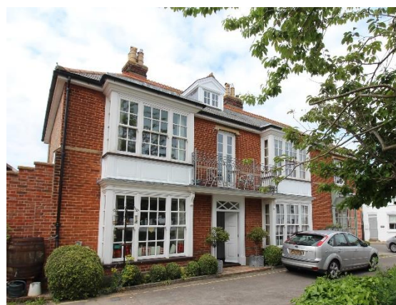
Vulcan House, No.1 Barnaby Green

Vulcan House, No.1 Barnaby Green (Positive Unlisted Building). Early twentieth century house and former bakers' shop, now house and office. Later twentieth century embellishments designed by John Bennett. Not shown on the 1904 1:2,500 Ordnance Survey map but probably dating from pre-1914. House and shop shown as a single unit on the 1927 Ordnance Survey map. Faced in red brick, beneath a hipped Welsh slate roof with overhanging eaves. A single gabled dormer in its southern with small pane casement windows.