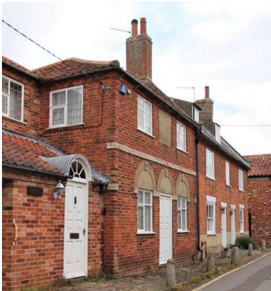
The Old Chapel, No.5 Mill Lane

Nos. 1 & 2 Rosemary Cottages, Mill Lane (Grade II)