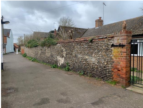
Boundary wall, to the south of Manor Lodge, Woodleys Yard

Boundary wall, to the south of Manor Lodge, Woodleys Yard (Positive Unlisted Structure). Washed cobble and flint wall, with red brick piers and capping. Probably dating from the early 19 th the wall makes a positive contribution to the character of Woodleys Yard.