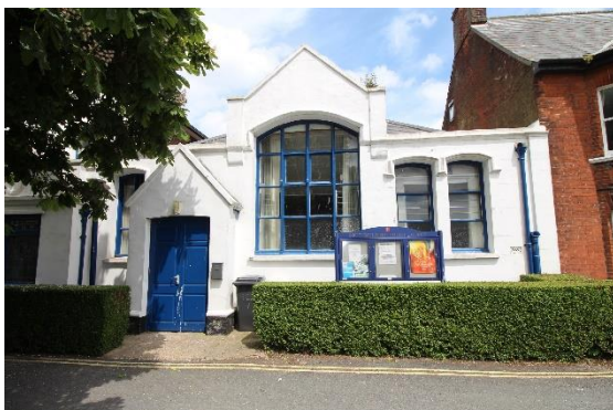
Methodist Church Hall, East Green

Rokeby Lodge, No.11 East Green (Positive Unlisted Building). A red brick villa of c.1900 with rubbed red brick dressings. The site of this dwelling is shown as vacant on the 1884 1:2,500 Ordnance Survey map but occupied by the present building by that of 1904. Full height canted bay window with horned plate-glass sashes. Steeply pitched Welsh slate roof. Front door opening modified in later twentieth century to allow glazed lights to be fitted surrounding the opening. Bracketed later twentieth century hood above. Twentieth century panelled door. Substantial chimney stack to northern gable. A prominent located house which despite alteration contributes to the setting of both the Methodist Chapel and listed buildings on St James Green.