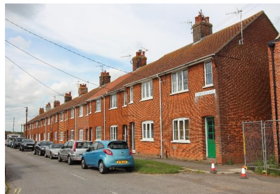
Nos.1-31 (Odd) St Edmunds Road