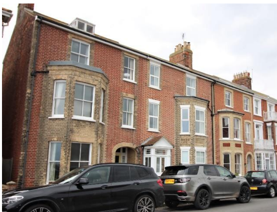
Nos.15-19 (Odd) Marlborough Road

Flats 1-3 Rochester House No.11, & No.13 Marlborough Road (Positive Unlisted Buildings). A pair of substantial three storey houses of c.1890 which were partially rebuilt after considerable bomb damage in 1943. The neighbouring buildings to the immediate south were destroyed in the same raid. Red brick with gault brick quoins and dressings and a red pan tile roof. Horned plate-glass sashes with margin lights to canted bays. Three storeys with two storey canted bay windows a narrow recessed central range. Glazed later twentieth century porch. Dwarf red brick boundary walls to Marlborough Road. Jenkins, A Barrett Reminiscences of Southwold During Two World Wars (Southwold, 1984) p67.