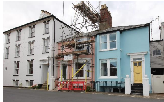
Nos.12 & 13 East Cliff

Barley Rise No.10 and Barley House, No.11 East Cliff (Positive Unlisted Buildings). A substantial pair of semi-detached houses of c.1840 now largely occupied as a hotel. Three storeys over a basement. Rendered red brick with a hipped Welsh slate roof and a ridge stack rising from the former spine wall between the two properties. The pilastered doorcase to the eastern house has been retained, but that to the west has been replaced with a small oculus. Hornless sashes with decorative margin lights, wedge shaped lintels with projecting fluted key stones. Barley Rise occupies part of the lower section of the former No.10 and has a front door in the western return elevation, and single storey rendered later additions with Welsh slate roofs.