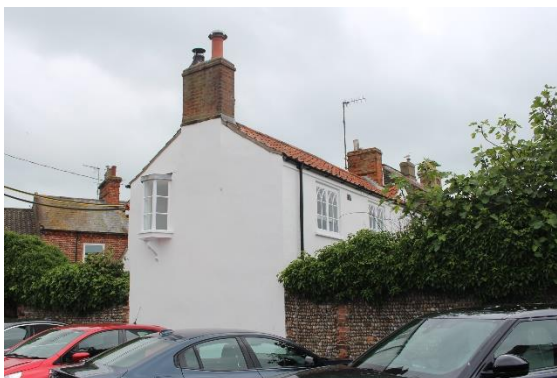
'Sea Lark', No.20 Snowdens Yard

No.18 Snowdens Yard was inaccessible at the time of survey so no assessment of the merits of this structure has been made.