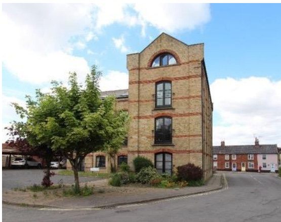
St Edmunds Court, North Green