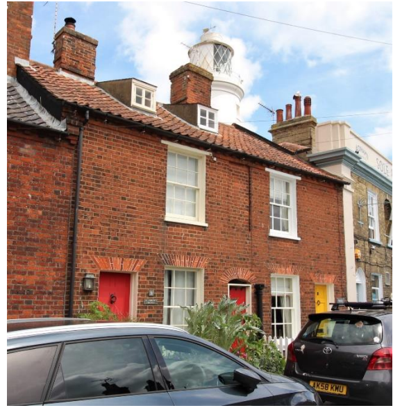
Parsley Cottage, No.8 & St Andrew Cottage No.9 East Green