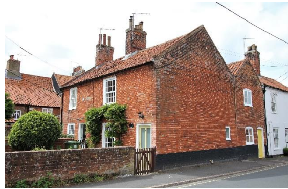
Happy Cottage No.6 Lorne Road and No.8 Lorne Road

now two dwellings. Later nineteenth century. Red brick elevation to Lorne Road, Gardner Road elevation rendered. Steeply pitched red pan tiled roof. Gardner Road elevation of three storeys with steeply pitched gable and plate glass sash windows. Lorne Road elevation of No.15A formerly with shop front. Twentieth century dwellings attached to rear. Included here primarily for the quality and presence of its Gardner Road elevation. Nineteenth century red brick and cobble boundary wall to west with return section to Gardner Road which also contributes significantly to conservation area.