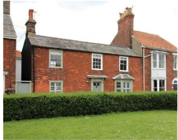
Iona, No.7 Bartholomew Green