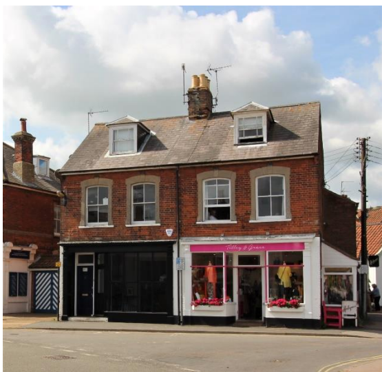
Nos.33 & 35 High Street

No.31 High Street (Positive Unlisted Building). Mid nineteenth century dwelling formerly known as Anchor Villa, extended to the rear 1960s and facaded c.2020. Its nineteenth century northern and eastern façades alone survive but these make a strong positive contribution to views along the High Street. Northern façade of three bays with a central door opening flanked by two full height canted bay windows. Panelled parapet and Welsh slate roof. Tall, rendered chimney stacks.