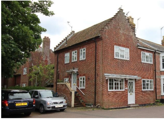
No.12 Bartholomew Green

Nos.9-12 (cons) Bartholomew Green (Positive Unlisted Buildings). Part of a well-designed Southwold Corporation development of the early 1950s which replaced property destroyed in World War Two. It overlooks the churchyard. Probably designed by Cautley and Barefoot of Ipswich and playing an important role within the setting of the Grade I listed parish church. Red brick houses with pan tile roofs designed in a restrained Tudor-vernacular style, No.12 with crow-stepped gables. Small paned casement windows. Original partially glazed front doors survive beneath painted wooden bracketed hoods. Drawings by Cautley and Barefoot for housing at Bartholomew Green dating from between 1950 and 1953 survive in the Ipswich Branch of Suffolk Record Office but were not accessible at the time of survey (Ipswich Record Office HG400/2/468). See also Hope Cottages.