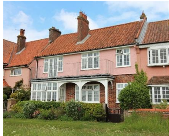
Crombie House, The Common

The wall continues to the north as a taller cobble wall, all of which makes a very positive contribution to the setting of the houses and the conservation area.