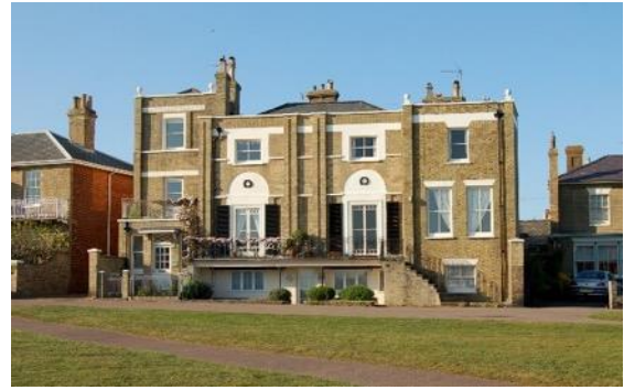
Nos. 10A-10D South Green