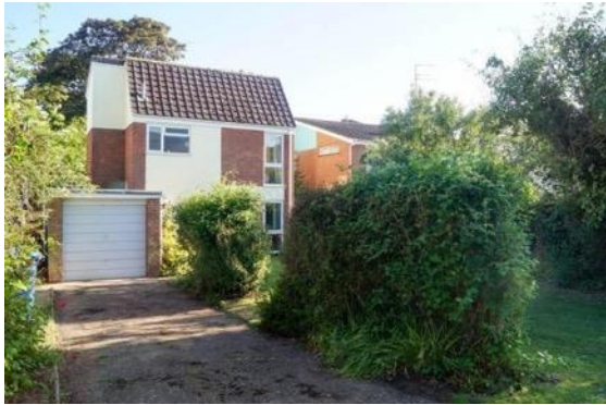
No.74 Pier Avenue

Nos. 72-78 (even) Pier Avenue (Positive Unlisted Building). Detached houses of c.1967 occupying site of former brick field, inventively designed with reception rooms at first floor height to combat split level nature of site. Two storeys with access at First Floor level via concrete foot bridges on Pier Avenue façades. The footbridges lead to large first floor balconies containing the front doors. To rear the house is of a more traditional appearance with a lawn and flat roofed garage accessed from Marlborough Road. Clad in red brick with rendered panels. Casement windows recently replaced. Steeply pitched pan tiled roof to garden façade, shallow pitched to entrance facade. No.78 unusually has a brick chimney stack which appears to be contemporary but is otherwise largely identical.