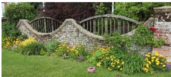
Cobble wall, stone caps and timber baluster screen to Commoners and Fairway Cottage, The Common

Commoners and Fairway Cottage, The Common (Positive Unlisted Building). A bold inter-war Arts and Crafts design. Two houses, but creating the impression of one large villa. Central gable rising to attic storey with eaves to the right stopping above the first floor, and the eaves to the left continuing down to the ground floor and over an enclosed porch (originally open). First floor windows grouped to the centre of the gable end, separated by a stone tablet depicting bearing the date 1913, although rather confusingly it is not shown on the 1927 1:2,500 Ordnance Survey map. Red brick stacks to the north and south gables ends, the shafts continuing down the elevation. Two further stacks positioned symmetrically either side of the entrance façade gable. The modern fenestration to Fairway Cottage is unsympathetic.