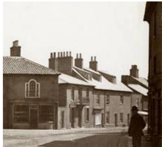
Nos.4-8 Queen Street before alteration a c.1900 view.