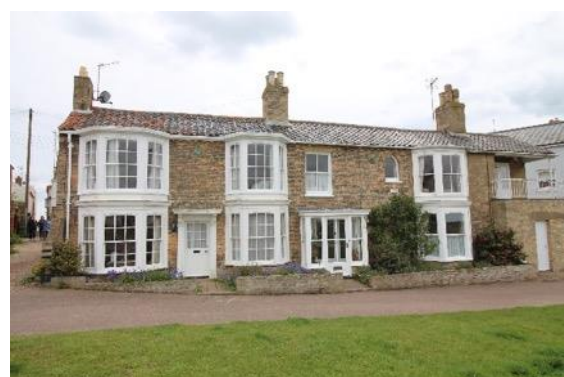
No. 24 (left) and No.26 (right), South Green

The Retreat No. 20 & Pin Cottage No.22, South Green (Grade II)