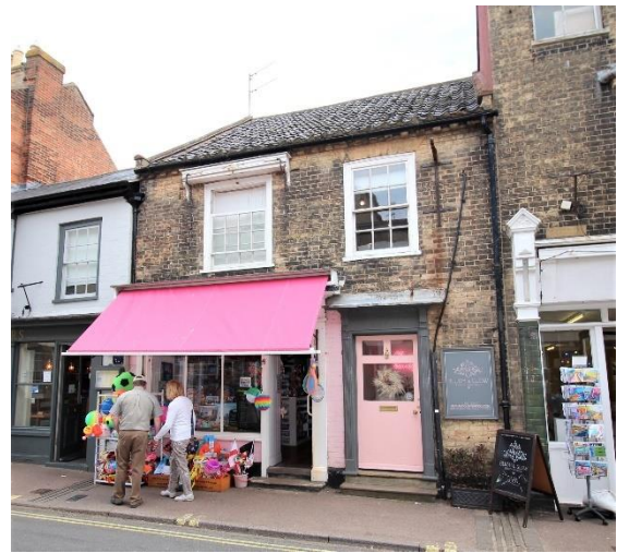
No.14 Queen Street