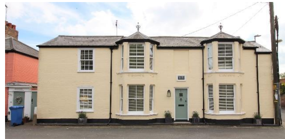
Wych Elm Cottage, East Green

Wych Elm Cottage (formerly Lyndhurst), East Green (Positive Unlisted Building). A house of c.1800 with full height canted bay windows of c.1890. Painted red brick with a Welsh slate roof. The canted bays with horned plate-glass sashes and elaborate cast iron finials. Central panelled door with blind recess above. Original twelve light sashes in heavy moulded frames to left hand bay. Nos.3-6 East Green appear to have been built within the former grounds of this house in the early nineteenth century and then rented out by its then owner Moses Storkey. Wych Elm Cottage makes a strong positive contribution to the setting of the adjoining Grade II listed buildings.