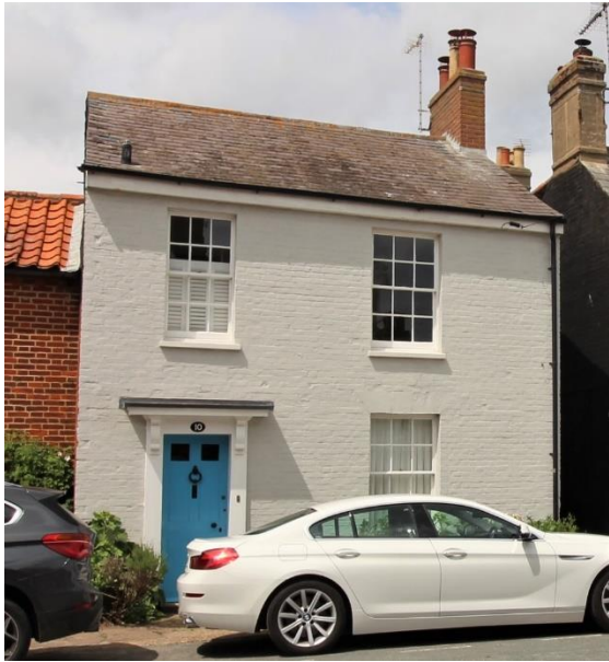
No.10 Trinity Street