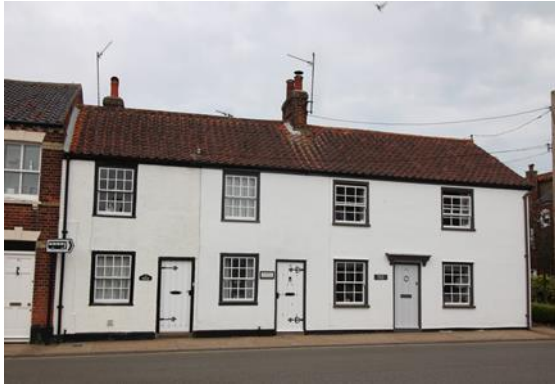
No.16 High Street

hornless sash windows within moulded wooden frames and twentieth century boarded front doors. Red pan tiled roof. No.14 has a shared red brick ridge stack with the Grade II listed No.16. No.14's stack is on the rear roof slope.