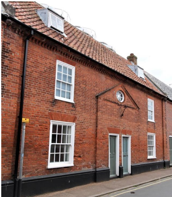
Nos.24 & 26 Church Street