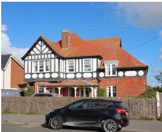
Saxon House, No.86 Pier Avenue

No.82 Pier Avenue (Positive Unlisted Building). An early twentieth century detached villa (shown on an auctioneer's plan of 1919, but not amongst the plots sold in the first sale in 1899). Bomb damaged in 1943 and altered and extended c.2015 but retaining much of its original external joinery. Red brick with a rendered upper floor and a plain tile roof. Decorative wooden veranda. Tall decorative red brick chimneystack. The applied decorative timber framing is not shown on 2011 photographs of the building. However mid-twentieth century photographs do show elaborate plasterwork in the style of applied timber framing to the entire first floor, much in the style of the adjoining Saxon House.