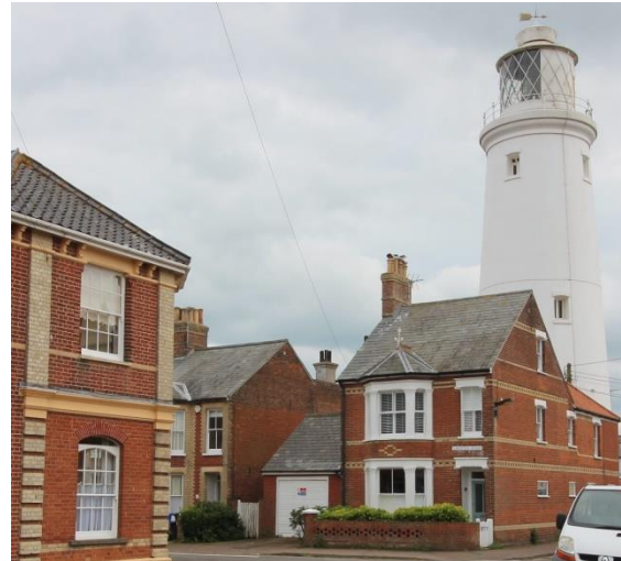
No.16 Chester Road

Nos.12 & 14 Chester Road (Positive Unlisted Buildings). A pair of villas built on plots sold by Southwold Corporation in 1885 with the proviso that dwellings costing not less than two hundred and seventy pounds be constructed on the site. Map evidence suggests that it was built between 1891 and 1904 whilst at least two houses on Chester Road were occupied by the time of the 1891 census. Save for No.16, the houses on Chester Road were probably constructed by the same builder. Red brick with elaborate gault brick dressings and pilasters. Two storeys and two bays with original horned plate-glass sashes. Recessed porches containing partially glazed front doors beneath rectangular fanlights. Nos.12 & 14 play an important role in the setting of the Grade II listed lighthouse and are remarkably well-preserved houses of their kind.