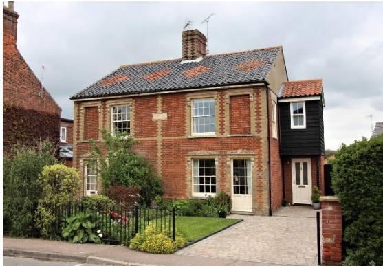
Victoria Cottages, Nos.24 & 25 Field Stile Road

rebuilt. The terrace plays an important role in the setting of the Grade I listed parish church which is located directly to its south.