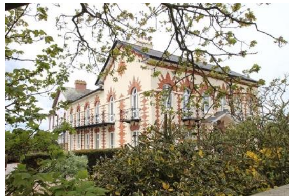
Southwold House (right) and Sole Bay House (left), from Gun Hill

Cobble boundary wall with red brick square section gate piers to north side of garden. Similar wall with arched red brick door opening to south. Substantial and prominently located single-storey red brick and cobble nineteenth century outbuilding with a red pan tiled roof at south-western corner of plot. Boarded doors within southern gable.