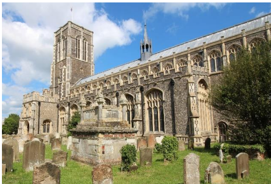
St Edmund's Church, Church Green

St Edmund's Church, Church Green (Grade I)