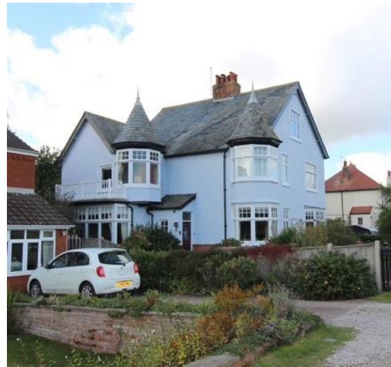
The Turrets No.71 North Road

house of c.1912 probably designed by Edward Charles Homer (1845-1914) who also designed villas on Pier Avenue. It was built to exploit views over Buss Creek to the north. Rendered with applied timber framing to the first floor. Hipped plain tile roof with decorative ridge pieces and finials. Projecting stack to centre of façade with terracotta plaque bearing the name of 'Creek House'. Original window joinery preserved. Plate glass sashes divided by a central mullion with small pane upper lights.