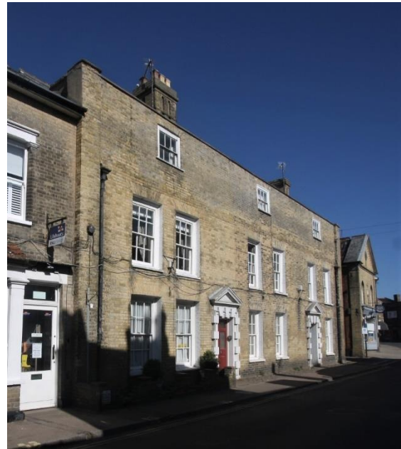
No.1 The Elms and No.3 Queen Street