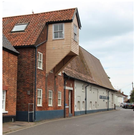
Adnams Brewery Buildings, Victoria Street

No.26, September Cottage, No.28, and Nos.30-32 (even) Victoria Street (Positive Unlisted Buildings). c.1800 terrace apparently built on the site of a small brewery associated with the adjoining Royal Public House. No.26 probably earlier in date than the remainder of the terrace. Red brick with a black pan tiled roofslope to Victoria Street and a red pan tiled slope to the rear elevation. No. 26 has sixteen light hornless sashes within heavy moulded wooden frames and a four panelled door. Brick pilasters and a substantial projecting stack to its gable end. This stack may possibly have originally been shared with the now demolished No.24. To the rear is a later nineteenth century two story brick outshot. Nos. 28-32 have rubbed brick wedge-shaped lintels to the ground floor and painted wedge shaped lintels above. The lintel above the door to No.28 has possibly been modified. Hornless sixteen-light sashes. Rear elevations rendered with small pane casement windows. The terrace remains remarkably unchanged since photographed by the National Monuments Record in 1949 ( BB49/3040).