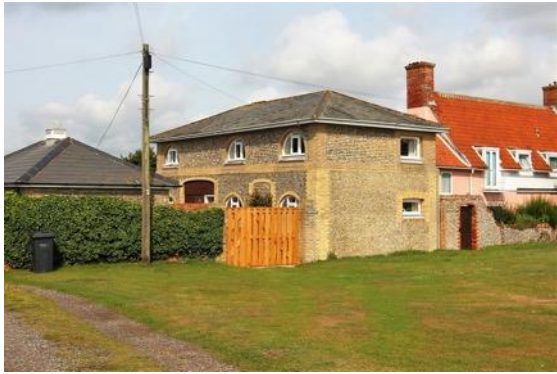
Coach House, Gun Hill

Coach House, Gun Hill (Positive Unlisted Building). Former Coach House located to the north of Stone House, with which it shares many characteristics, including cobble walls with brick margins, shallow pitched slate covered roof and overhanging eaves. Converted to residential use during the 1970s. While door and window joinery is replacement, they exist within the original openings ensuring the original form and function of the structure is easily identifiable. The unbroken roof, free from skylights and dormers, and the cobble end gable which faces Gun Hill makes a significant contribution to the conservation area.