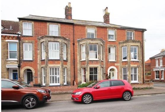
Branchester Villas, Nos.52 & 54 Stradbroke Road and Salisbury House, No.56

No.50 Stradbroke Road (Positive Unlisted Building). Substantial house of the early-1890s. Shown on a photograph dated 13 th October 1893 in the Southwold Museum collection. Red and Suffolk white brick façade with painted stone dressings and a replaced red pan tile roof. Principal façade of two bays with a finial capped gabled breakfront to the southern bay, which is of red brick, whilst the remainder of the façade is of white brick. Heavy dentilled eaves cornice of red brick. Horned, plate glass-sashes. Recessed porch containing a partially glazed panelled front door. Nos.40-44 (even) Stradbroke Road are of an identical design. Late twentieth century low wall to frontage.