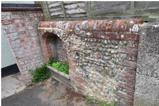
Water trough, Ferry Road

Retaining walls to Stone House, Gun Hill – (Grade II) see Stone House, Gun Hill