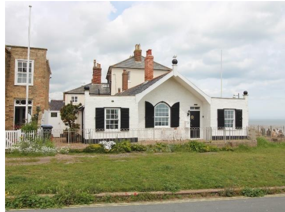
Whitehall, No.26 & Guardship, Saint James Green

'Whitehall', No.26 & Guardship, Saint James' Green (Grade II)