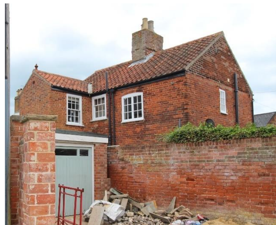
Nos.1 & 2 Youngs Yard from Bank Alley

Nos. 1 & 2 Youngs Yard (Positive Unlisted Buildings). Pair of nineteenth century red brick cottages which are shown on the 1884 1:2,500 Ordnance Survey map. Original openings with plaster faced wedge shaped lintels to ground floor preserved but sash windows and panelled doors replaced. Inserted window above entrance door to No.2. Small later gabled addition to rear of No.1 of red brick with a red pan tiled roof. Rear elevation visible from Bank Alley has largely sash windows but No.2 has an apparently original small pane casement beneath a shallow arched red brick lintel.