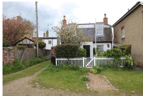
Jessamy Cottage, Skilmans Hill

Caneway Cottage, Skilmans Hill (Positive Unlisted Building). Tall and imposing, and sitting at the top of Skilmans Hill. Two storey with an attic with Suffolk white brick elevations with contrasting red brick detailing. Two storey canted timber bay to the centre of the elevation, with the entrance to the left (and later enclosed porch). To the first floor the bay is flanked by 3 over 3 pane sash windows, with a further sash window to the centre of the attic floor. Decorated bargeboards, which project slightly from the elevation.