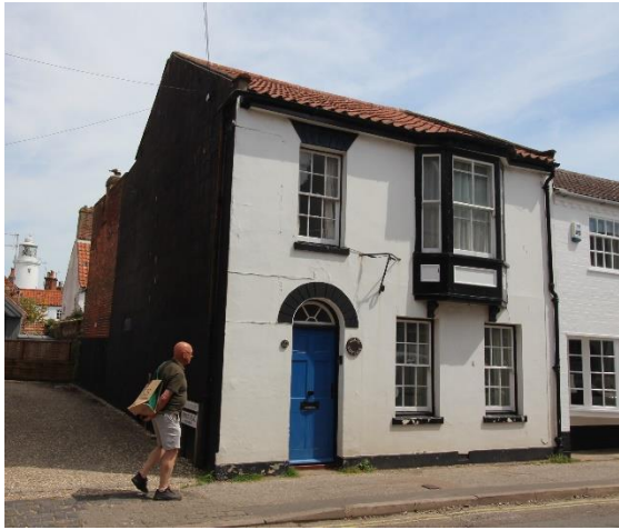
Mouse Cottage, No.10 East Street

Mouse Cottage, No.10 East Street (Positive Unlisted Building). An early nineteenth century former shop which had been converted to a dwelling by the third quarter of the twentieth century. Painted brick with a red pan tiled roof. Six panelled front door beneath a semi-circular radial fanlight. Twelve light hornless sash window above, with a wedge-shaped lintel. Mid nineteenth century canted bay window to the first floor which is supported on brackets with horned plate glass sashes. The twelve light sashes to the ground floor are probably of mid twentieth century date replacing a shop front.