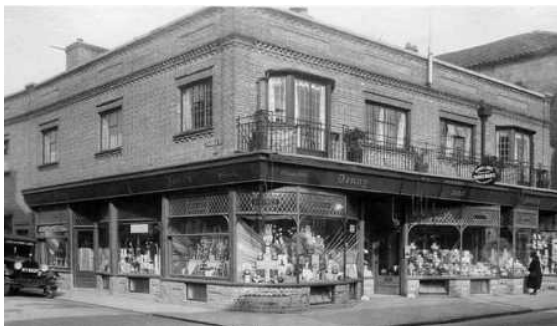
No. 2 Market Place in the 1930s.

Co-operative shop, No. 2 Market Place (Positive Unlisted Building). Constructed around 1928 and was formed of residential first floor use above a large ground floor shop, all in brick. The ground floor shop frontage projects to allow a first-floor balcony to be formed, although the balcony arrangement is now missing. The building is austere in character with curious throwback references to 18th century architecture such as toothed eaves, panelled parapet and what had been windows with leaded lights. The original shopfront wrapped around the building and along Church Street, although the flank shopfront has now been lost. Part of the original shopfront appears to survive – just. Undoubtedly, the reduced shopfront, replacement first floor fenestration and loss of balcony have all reduced the architectural interest of this building. However, it retains a presence in the town centre and its use as a local shop is very important for the vitality of the town centre. This use contributes importantly to the character of the Conservation Area in this part of it; and the overall scale, presence and some surviving detail of the building, can be judged to make a positive contribution to the overall character and appearance of the Conservation Area.