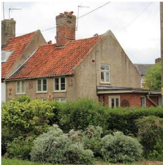
Nos.3 & 4 Bartholomew Green