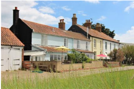
No's 4 and 5 Blackshore, Blackshore

No.4 (right) and No.5 (left), Blackshore (Positive Unlisted Buildings). A pair of early 19 th century cottages (they appear to be shown on a Parliamentary Boundaries Commission map of 1837). Painted brickwork elevations, with dentil eaves course and red clay pan tile roof covering. Red brick ridge stack marks the position of the party wall between the two properties. Brick upstand gable to the north west end, with a further stack. Both properties have single storey extensions with pan tiled roofs to the river facing elevation. Window joinery is modern but within the existing openings. The cottages form an attractive group with No's 1, 2 and 3, and their elevations are highly visible from the river and also from the marshes and town to the north east. Rear additions and alterations rather dilute the quality of the elevation as seen from York Road.