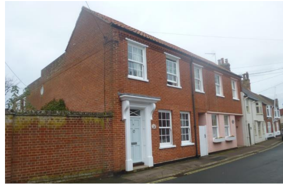
Nos.7 & 9 Lorne Road

No.1, & Jersey Cottage No.3 Lorne Road (Positive Unlisted Buildings). A pair of red brick cottages with a Suffolk white brick return elevation to May Place against which the now demolished Victorian wintergarden of that villa once stood. Red plain tile roof. Probably early nineteenth century but remodelled c.1920. The present façade is shown on a photograph of 1922 in the Southwold Museum collection. In retail use in the early twentieth century. Casement windows, those to the first floor with 3in canted bays supported on decorative wooden brackets. Red brick ridge stack rising from spine wall between properties. Top lit boarded front doors beneath wedge shaped brick lintels. Shallow arched lintel to ground floor window of No.3, that to No.1 flat and probably rebuilt in the later twentieth century. Dentilled brick eaves cornice. John Miller Britain in Old Photographs: Southwold (Stroud 1999) p91.