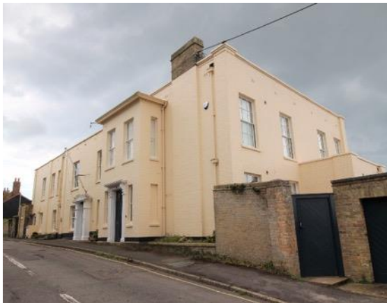
Nos. 22 - 26 Park Villa, Park Lane

Boundary Wall to The Coach House, Park Lane (Positive Unlisted Structure). Gault brick, dating from the second quarter of the 19 th century and enclosing the courtyard of the demolished coach house to Park Villa. Canted brick to the base plinth, with angled capping bricks. Square piers with stone caps, although the opening positions have changed and been widened over the years. The wall, although altered, is important for the continuation it provides of the established building line either side.