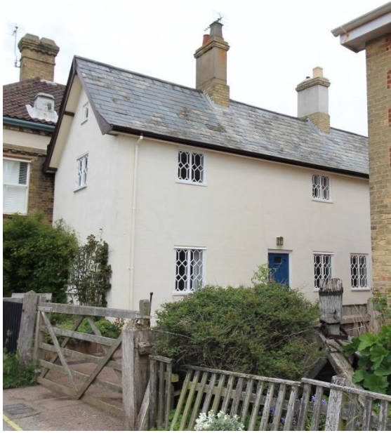
Reading Room Cottage, East Street

Reading Room Cottage, East Street (Grade II)