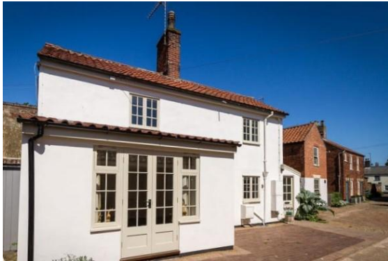
Lavender Cottage, Youngs Yard

cottages. Welsh slate roof. Later twentieth century additions to rear. Northern gabled return elevation visible from Bank Alley, largely blind with one late twentieth century casement at ground floor level.