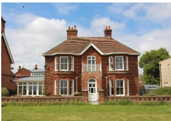
Wantage House, gate and boundary wall, The Common

The Hollies, The Common (Positive Unlisted Building). An early twentieth century villa, dominated by a two storey red brick canted bay with rendered attic gable supported on timber brackets. Balanced to the right by a dormer with pitched roof. Central entrance under a (possibly slightly later) enclosed plain tiled roof which abuts the canted side of the bay window. Projecting brick aprons below window sills. The house retains its original sash windows, divided to the upper sash and plate glass below. Railings and gate to the front garden contribute positively to the setting of the house.