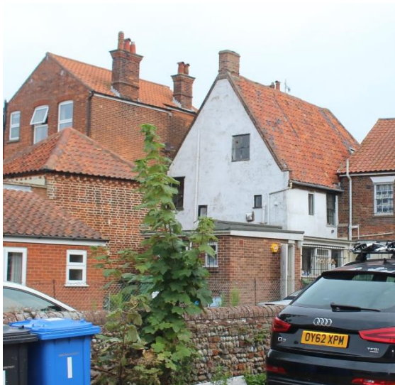
Rear of No.71 High Street from Buckenham Court