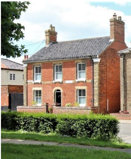
No.33 (right) and 33a (left), Station Road

Nos.29 and 31, Station Road (Positive Unlisted Building). White brick with red brick flank elevations (rendered to the south). Semi-detached pair of late nineteenth century houses, sharing many of the details seen in other houses on Station Road, but in slightly paired down form. Steps up to the entrances grouped to the centre of the front elevation, which is flanked by a pair of canted bay windows with flat roofs. Main roof of hipped pyramidal form, covered with Welsh slate. Good white brick stack to the return wall of No.29, with elaboratively corbelled cap, the stack to No.31 has been reduced in height. The houses retain their original plate glass horned sash windows, and the highly visible roof pitch is free from dormers or rooflights.