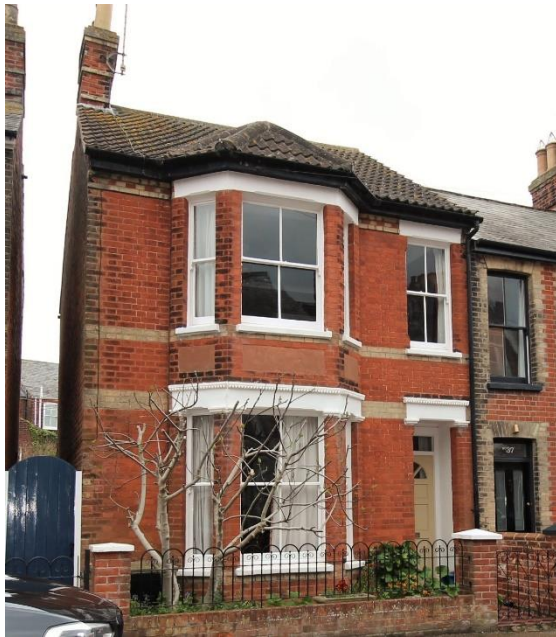
No.39 Stradbroke Road

No.39 Stradbroke Road (Positive Unlisted Building). A late nineteenth century house of red brick with Suffolk white or gault brick dressings and painted stone lintels and sills. Replaced pan tile roof with elaborate eaves cornice. Four light horned plate-glass sashes. Recessed porch with late twentieth century replacement front door. Twentieth century dwarf red brick boundary wall capped by iron railings. The flanking square-section piers with pyramidal caps may however be original.