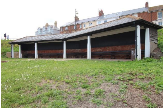
The Beach Shelter, North Parade

Shelter, North Parade (Positive Unlisted Building). Below North Parade, set into the cliff is a substantial open fronted red brick shelter of c.1920 set on a turfed platform. It has a hipped slate roof resting on wooden piers and its sides are clad in weatherboarding. This replaced an earlier, smaller, but far more elaborate hut of c.1900.