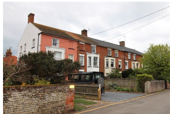
Cumberland Terrace, Nos.15-19 (cons) Cumberland Road

For the northern section of Cumberland Road see Seaside Corporation Character Area.