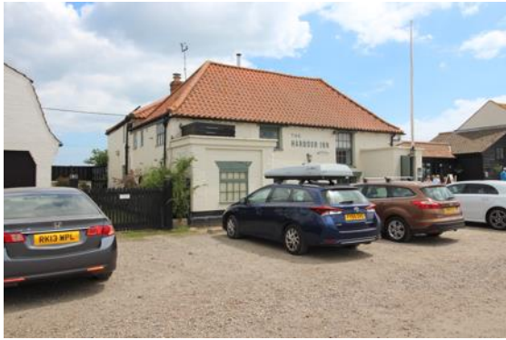
Harbour Inn, Blackshore