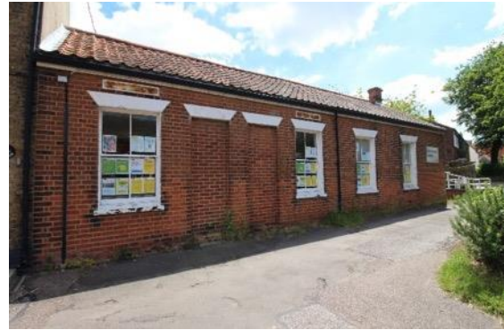
Southwold Library, North Green

No.2 North Green (Positive Unlisted Building). Rendered red brick cottage probably of early to mid nineteenth century date with red pan tile roof. Modern fenestration and front door.