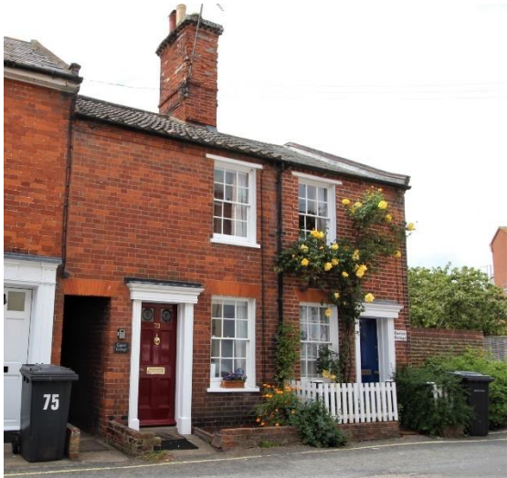
Nos.71 & 73 Victoria Street

elevation with late twentieth century windows. Two storey later twentieth century rear addition formerly linking the structure to Adnams Brewery buildings in the rear courtyard which have been replaced with bungalows. Late twentieth century railings to frontage on dwarf white brick wall. Miller, John Britain in Old Photographs, Southwold (Stroud, 1999) p98.