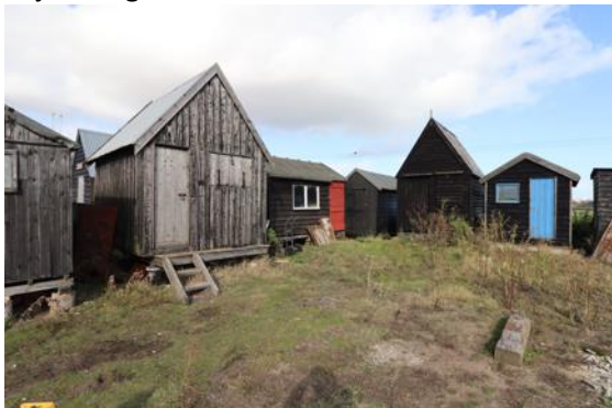
W4 to W8, Blackshore

Former Warehouse, Blackshore (Positive Unlisted Building). Reconstructed c.1997 to form kitchen and restaurant accommodation for the Harbour Inn Public House. Probably dating from the early 20 th century, red brick elevations with rendered ground floor. The majority of openings to the river facing elevation are from the late 20 th century conversion work. Red clay pan tile roof with upstand gable ends. This structure makes a positive contribution to the setting of the adjacent grade II listed Harbour Inn.