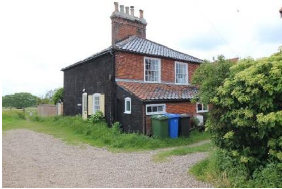
Spinners Cottage and boundary wall, Spinners Lane

Red clay pan tile covered roof, with brick upstand gable ends containing the tiles. Entrances grouped to the outer edges of the elevation, now with bracketed timber canopies over. Arched window heads with unhorned sash windows, 6 over 6 pane to the ground floor and 3 over six above, all of which contribute to the character of the conservation area.