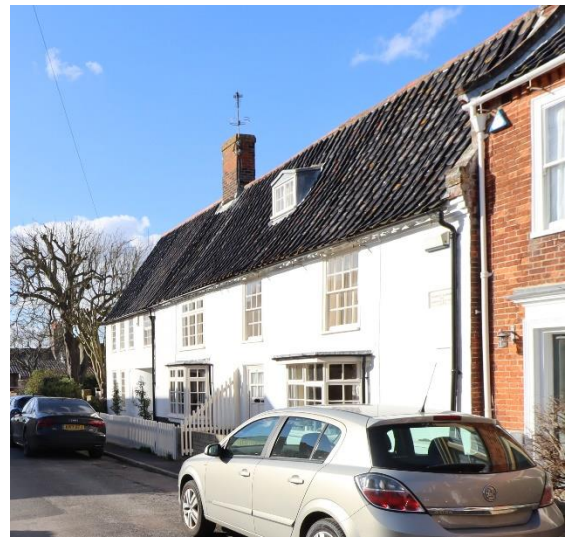
Nos.21 & 23 Park Lane