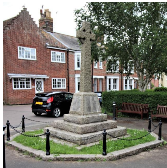
War Memorial, Bartholomew Green

Gates to St Edmund's Churchyard, Bartholomew Green (Grade II, GV).