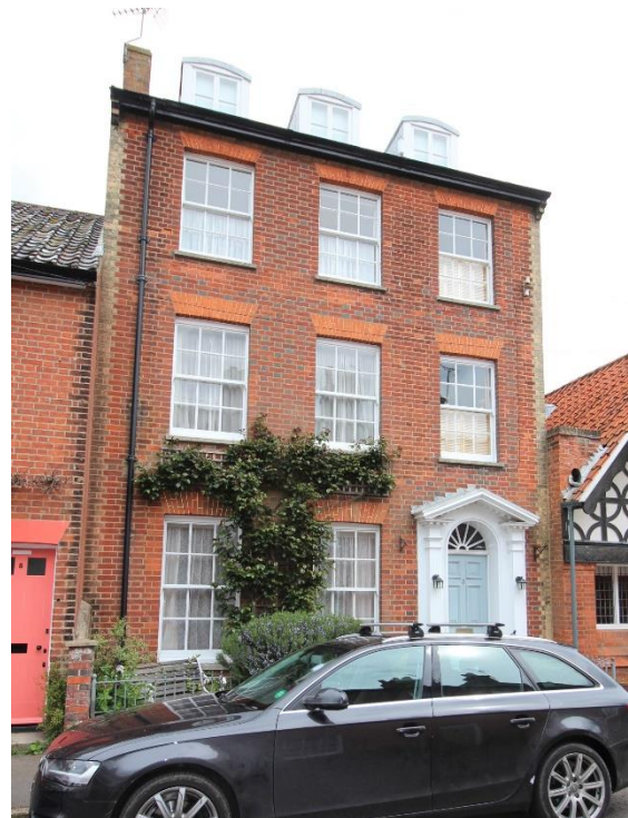
No.3 Park Lane

No.3 Park Lane (Positive Unlisted Building). A substantial Italianate house of c.1870 which was