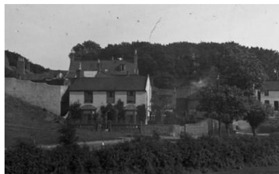
Historic view (undated) of Hill-side, Skilmans Hill

not original, and the porch is a later intervention, the house is an example of what can be achieved, and how unfortunate interventions can be improved upon.