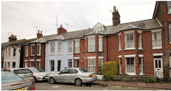
Nos.21-29 (odd) Stradbroke Road

1893 in the Southwold Museum collection. Red brick with Suffolk white brick dressings. Welsh slate roof with overhanging eaves. Four light horned plate-glass sashes to Dunwich Road elevation, some of those to Stradbroke Road replaced. Partially glazed front door with rectangular fanlight. Two storey rear range fronting Dunwich Road which is slightly set back. The rear elevation is also highly visible from Dunwich Road and has similar dressings.