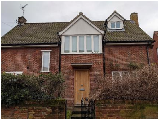
Pinkneys Way, Mill Lane

Garage to No.7 Queen Street (Positive Unlisted Building). Late-20th century small garage with gable to the street. Built of red brick with red pantile roof and dark stained waney edge timber gable. The structure contributes to the street through its modest Arts and Crafts inspired charm.