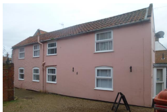
6 Smokehouse Court

Puddle Court, 6 Smokehouse Court (Positive Unlisted Building). A two-storey residential conversion, part rendered and part painted flint. It has a red pantiled roof and a gable end ground floor bay window. The building is of simple linear form and is an attractive small scale survival of a former backland working building and rear yard.