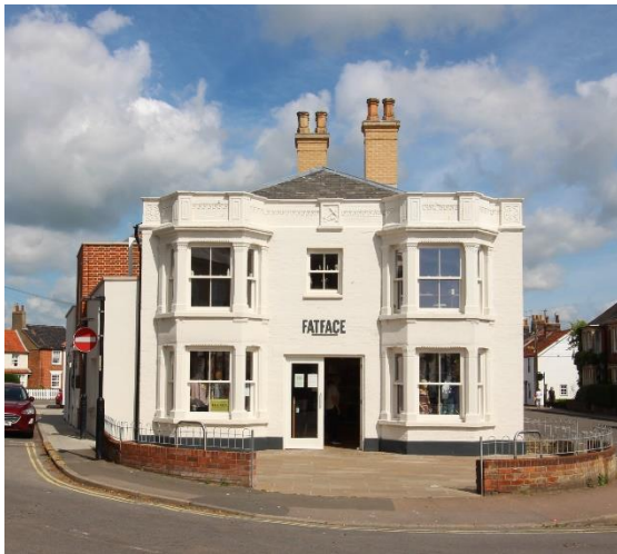
No.31 High Street

century rendered cottage with a red pan tiled roof and overhanging eaves. Late twentieth century replacement twelve-light sash windows and partially glazed twentieth century front door.