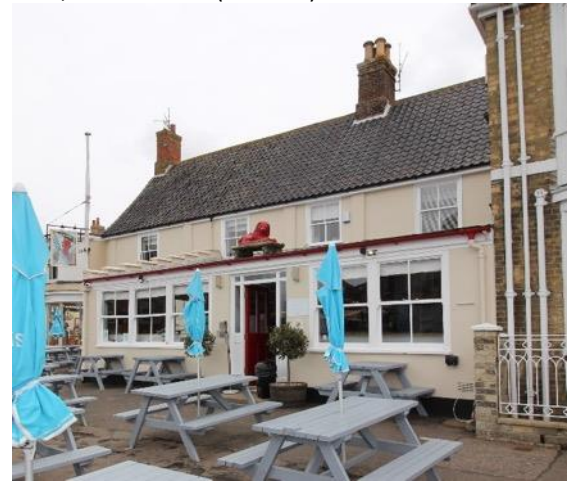
Red Lion Inn, No. 2 South Green