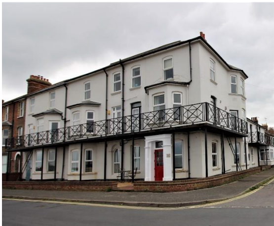
'Craighurst' Nos.11-13 (cons) North Parade

No.7 North Parade (including Balmore Cottage No.1A Chester Road) and Nos.8-10 (cons) North Parade. (Positive Unlisted Buildings). Seafront terrace built on plots sold by Southwold Corporation in 1885 with the proviso that a house costing no less than four hundred pounds should be constructed upon each. The completed terrace appears on a photograph taken on the 18th of October 1893 from the lighthouse tower (Museum collection). All the terrace houses are described as either lodging or boarding houses in the 1911 census. Red brick with gault brick dressings and a Welsh slate roof. Plate glass sashes. The rear wing of No. 7 was sensitively converted into a separate dwelling in the late twentieth century and extended around the same date. It now forms No.1A Chester Road. Late twentieth century dwarf wall to Chester Road. John Miller Britain in Old Photographs: Southwold (Stroud 1999) p83.