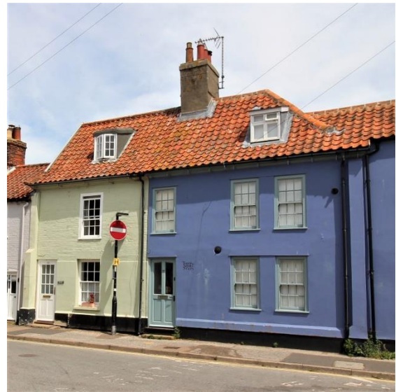
Nos.30 & 32 East Street

Replacement horned sashes and partially glazed panelled door. No.26 retains its original door opening, but the window openings have been modified. No.24 was originally two cottages, the narrow slightly lower western cottage is shown on old photographs as having at ground floor level a door and sash window beneath a single large red brick shallow arched lintel. The eastern cottage retains all of its original openings.