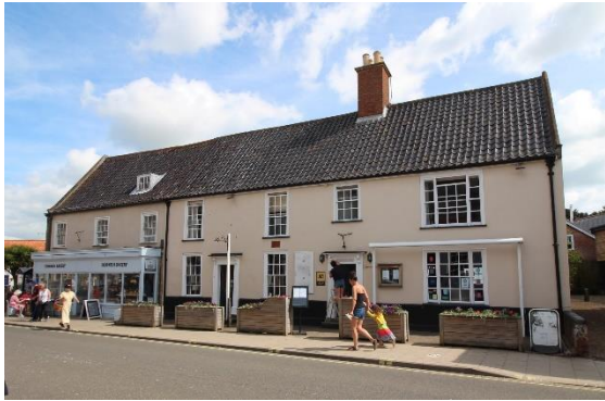
Sutherland House, No.56 High Street

Sutherland House, No.56 High Street (Grade II*)