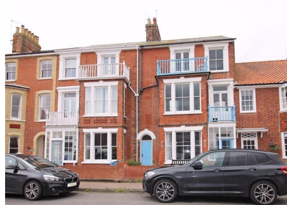
Nos.21 & 23 Marlborough Road

and canted bays. Nos.15 & 19 retain their original open fronted recessed porches. No.17 now has a pedimented wooden porch, while the windows have been unsympathetically replaced. Nos.15 & 19 however retain their original horned plate-glass sashes. Welsh slate roof with red brick ridge stacks.