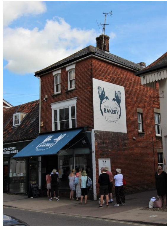
No.88 High Street

No.88 High Street (Positive Unlisted Building). Commercial building of red brick with a black glazed pan tiled roof, which was probably constructed during the third quarter of the nineteenth century. First floor canted bay window visible on c.1900 photos replaced by a large tripartite shop window in the early-twentieth century. Two light plate glass sash windows to second floor. c.1900 shop fascia retaining notable mosaic advertising panel to floor of central recessed entrance reading Stead and Simpson. An important component in the setting of flanking listed buildings to the north and south.