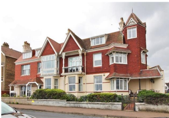
'The Cedars' and 'Duntreath' Nos.27-28 North Parade

'The Cedars' and Duntreath Nos.27-28 North Parade (Positive Unlisted Buildings). A pair of substantial semi-detached houses of a bold and inventive free 'arts and crafts' design one of the best buildings of the period in the town. Of two storeys, with attics lit by flat topped twentieth century dormers. The houses occupy a prominent seafront site and were probably constructed in the early to mid-1890s. Photographic evidence shows that they predate the adjoining Strathmore House and that the plain tile cladding to the first floor probably replaced applied timber framing within ten years of the building's original completion. The pair appear to have been occupied as a private