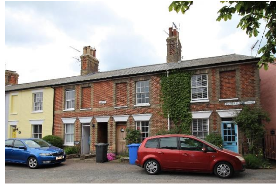
Nos.23-26 Cumberland Road

Providence Cottage, Cumberland Road (Positive Unlisted Building). A late nineteenth century painted brick villa with a Welsh slate roof. Canted bay capped with cast iron finial containing four light plate-glass sashes with horns. Lintels with saw tooth moulding and lintels resting on corbels. Decorative cast iron mini balcony to window above door. Panelled door with arched overlight.