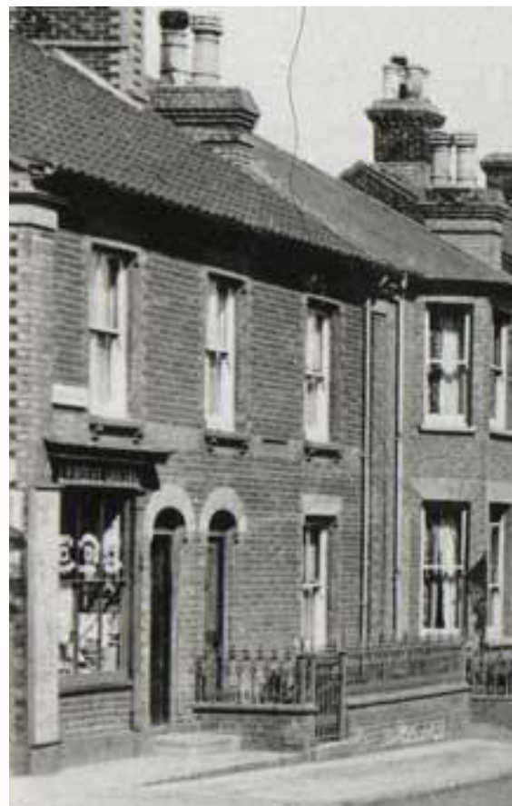
No.33 Station Road in its original form (undated)

No.33 and 33a, Station Road (Positive Unlisted Building). A stylish double fronted villa built in 1878. Originally the property had a pair of centrally located entrances under arched heads and a timber shop front to the left side (to what is now No.33a). The former small front garden is enclosed by a low brick wall with railings. All evidence of the commercial past have now been removed and a balanced street façade created. All this has been skillfully done. To the corners are white brick pilasters with painted capitals. The sash windows have projecting stone sills with lugs to the underside. Blue glazed pan tile roof with gable end stacks of red and white brick.