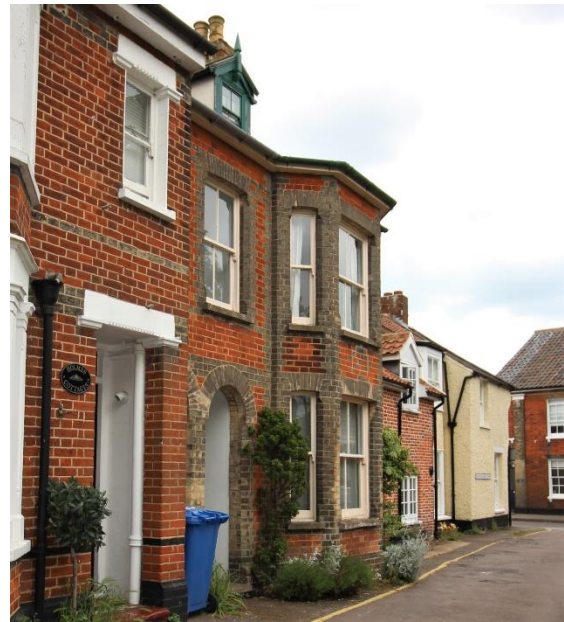
No.16 Bartholomew Green

Holmes Cottages, Nos. 13-15 (cons) Bartholomew Green (Positive Unlisted Buildings). A terrace of three house dating from the 1890s, Nos. 13 & 14 possibly built slightly earlier than No.15. Red brick with painted stone dressings and a Welsh slate roof. Horned plate-glass sashes. Each house has a full height canted bay window with pilasters and a recessed porch with a decorative tile floor. Red brick ridge sacks.