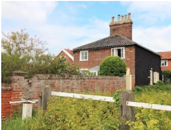
Spinners Cottage, west elevation and boundary wall, Spinners Lane

Spinners Cottage and boundary wall, Spinners Lane (Positive Unlisted Building). An early nineteenth century house, shown on the 1884 1:2,500 Ordnance Survey map as a pair of cottages, now a single house. Attractive black glazed pan tile pyramidal roof with sizeable red brick chimney stack.