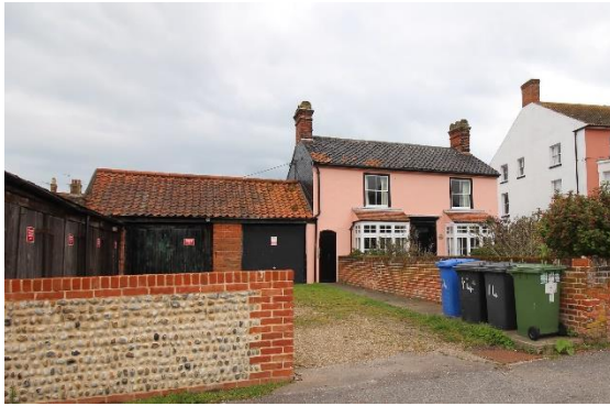
The Anchorage, No.14 Cumberland Road