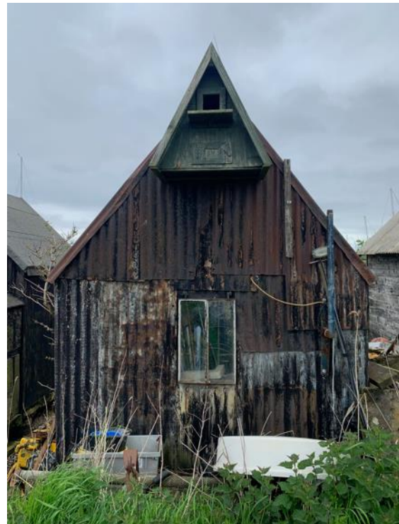
Detail of hut W14, north east elevation