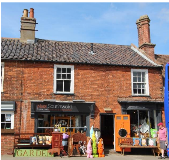
No.25 High Street

No.27 High Street (Positive Unlisted Building). Early nineteenth century former shop forming part of the same structure as the Grade II listed No.25. Red brick with a black pan tiled roof. Photographic evidence suggests that it had lost its shop fascia before 1948. Sash windows replaced by unsympathetic casements. Despite unsympathetic alteration No.27 makes an important contribution to the setting of the listed buildings to its immediate north.