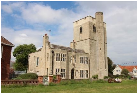
RC Church of the Sacred Heart and Presbytery, Wymering Road

Roman Catholic Church of the Sacred Heart and Presbytery, Wymering Road (Grade II)