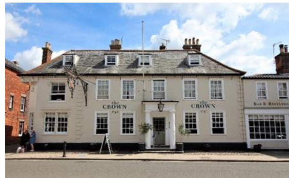
Crown Hotel Nos.90-92 (even) High Street

No.88 High Street (Positive Unlisted Building). Commercial building of red brick with a black glazed pan tiled roof, which was probably constructed during the third quarter of the nineteenth century. First floor canted bay window visible on c.1900 photos replaced by a large tripartite shop window in the early-twentieth century. Two light plate glass sash windows to second floor. c.1900 shop fascia retaining notable mosaic advertising panel to floor of central recessed entrance reading Stead and Simpson. An important component in the setting of flanking listed buildings to the north and south.