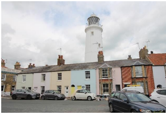
Nos.2-12 (even) St James Green

Nos.2-12 (even) St James Green (Positive Unlisted Buildings). A red brick terrace of mid nineteenth century date with a Welsh slate roof. Now rendered apart from No.12. Originally a symmetrical composition with an arched central passage leading to the rear gardens. Nos.10 & 12 were given full height canted bay windows c.1900 which retain their original horned plate-glass sashes. Nos. 2-8 have twelve light horned sashes beneath wedge shaped lintels. Front doors largely replaced. Single storey early twenty first century addition to the rear of No.2. This terrace makes an important contribution to the setting of the Grade II listed lighthouse and Sole Bay Inn.