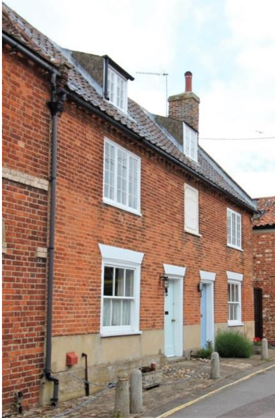
Nos. 1 & 2 Rosemary Cottages, Mill Lane

Nos. 1 & 2 Rosemary Cottages, Mill Lane (Grade II)