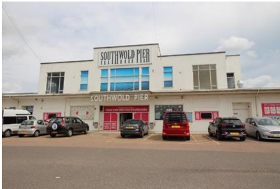
The Pavilion, Southwold Pier