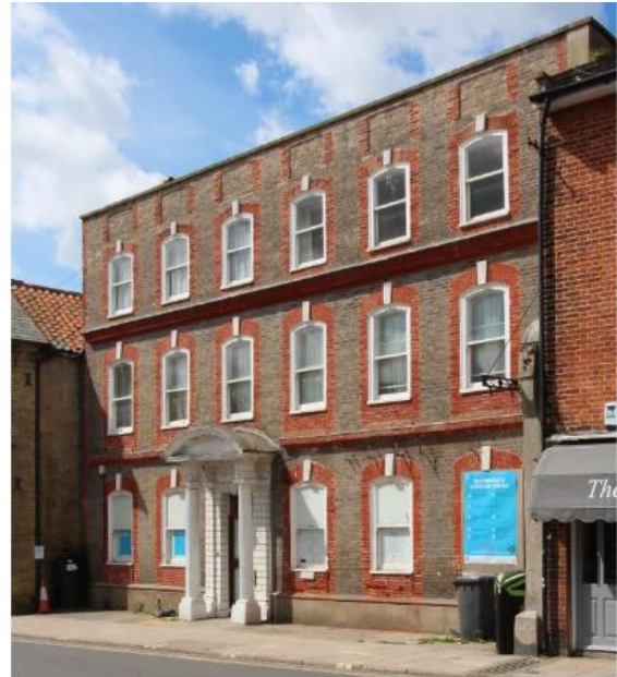
No.17 Market Place