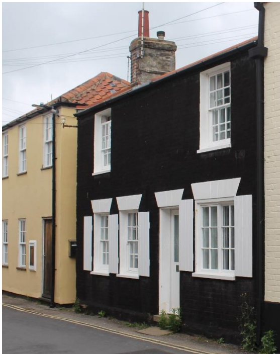
No.2 Trinity Street

No.2 Trinity Street (Positive Unlisted Building). A small cottage of early to mid-nineteenth century date of painted brick. Possibly originally a pair of cottages. Late twentieth century horned sash windows beneath wedge-shaped lintels. Partially glazed front door. The right-hand window is a later twentieth century small pane casement. Red pan tiled roof covering.