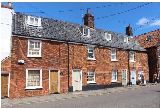
Nos.26-32 (even) Victoria Street

The Old Royal, Nos.20 & 22 Victoria Street and outbuilding (Positive Unlisted Building). Former Royal Public House (originally the White Lion) closed 1980s. Possibly early eighteenth-century gabled range with an early c.19th painted red brick former cottage (No.20) attached to its northern end. The two properties had been combined by the mid twentieth century, and now function as one dwelling. Cottage front door formerly in left hand bay on street façade. Late twentieth century pedimented doorcase surrounding historic door opening in gabled range of gabled section, with late twentieth century door within. The ground floor window is a tripartite sash beneath a shallow brick arched lintel. Small pane casement windows above. Cottage elevation with rendered wedge-shaped lintels with pronounced keystones replaced small pane sashes. Two storey canted bay window with small pane sashes to south-eastern elevation, partially clad in timber. Red brick garden wall to southeast enclosing garden of post 1950 date which occupies the site of the demolished war damaged No.24. Small single storey red pan tiled outbuilding of c.1800 or earlier date to the rear of No.20.