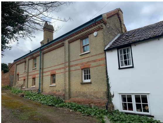
Garden Lodge and Mole End, Queens Road

Garden Lodge and Mole End, Queens Road (Positive Unlisted Building). Northern range of former stable block to Southwold House, remodelled c.2017. Originally containing groom's accommodation on the first floor. The principal interest of this range is the attractive gault brick north east elevation with contrasting red brick horizontal banding and lintels.