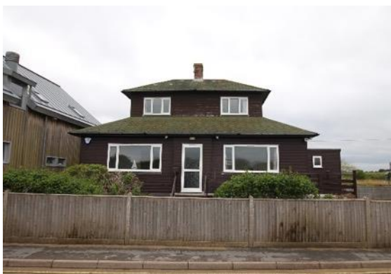
No.23 'Morningside', Ferry Road

Water trough, Ferry Road (Positive Unlisted Structure). Set within a washed cobble wall with half round red brick cappings and chamfered bricks to the recess over the trough. Trough itself of stone construction.