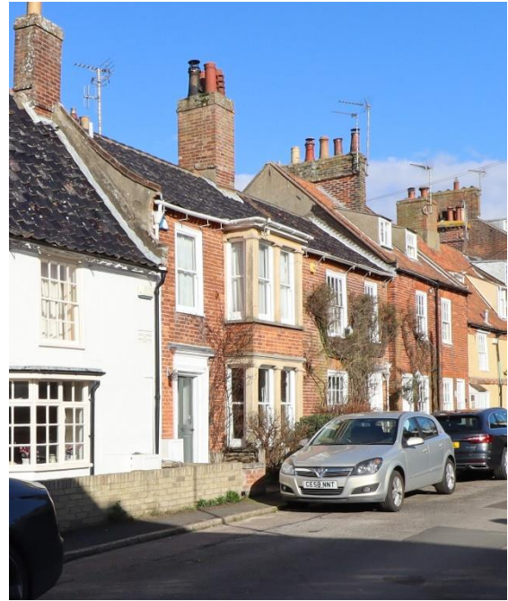
Nos.17 & Honeysuckle Cottage, No.19, Park Lane