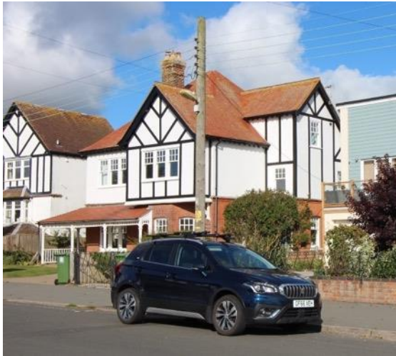
No.82 Pier Avenue

No.82 Pier Avenue (Positive Unlisted Building). An early twentieth century detached villa (shown on an auctioneer's plan of 1919, but not amongst the plots sold in the first sale in 1899). Bomb damaged in 1943 and altered and extended c.2015 but retaining much of its original external joinery. Red brick with a rendered upper floor and a plain tile roof. Decorative wooden veranda. Tall decorative red brick chimneystack. The applied decorative timber framing is not shown on 2011 photographs of the building. However mid-twentieth century photographs do show elaborate plasterwork in the style of applied timber framing to the entire first floor, much in the style of the adjoining Saxon House.