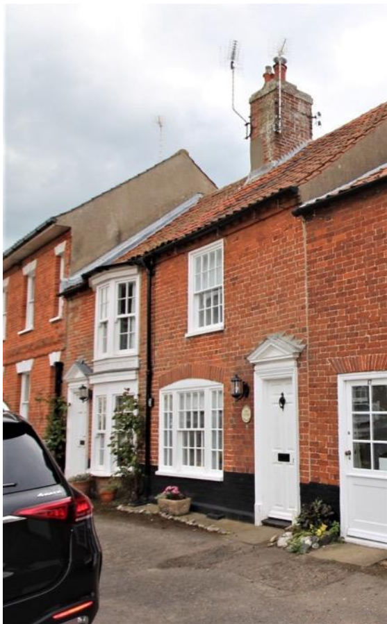
York Cottage No. 19 (right) & No.21 (left) South Green

No.17 South Green (Positive Unlisted Building). An early 19 th century cottage with red brick elevation and painted render side return. Entrance under a gauged brick arch to the left and to the right are ground and first floor 8 over 8 pane sash windows, also with gauged brick heads. Red clay pan tile roof with red brick ridge stack to the west end.