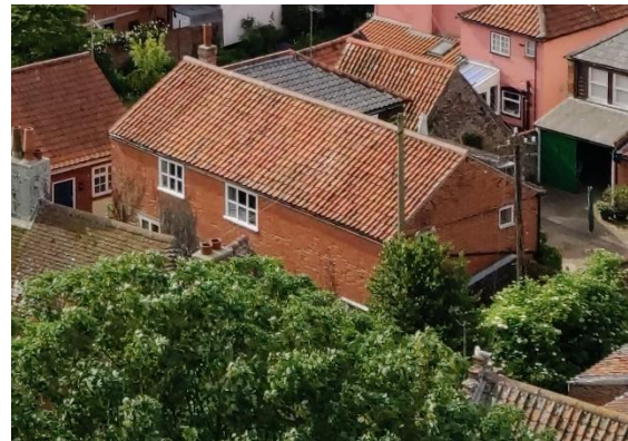
Former Barn to rear of Nos. 14-18 Victoria Street from church tower

Former Barn to the rear of Nos. 14-18 Victoria Street (Positive Unlisted Building). Two storey red brick former workshop building of probably mid nineteenth century date probably built for Carter's building contractors' business. Replacement casement windows.