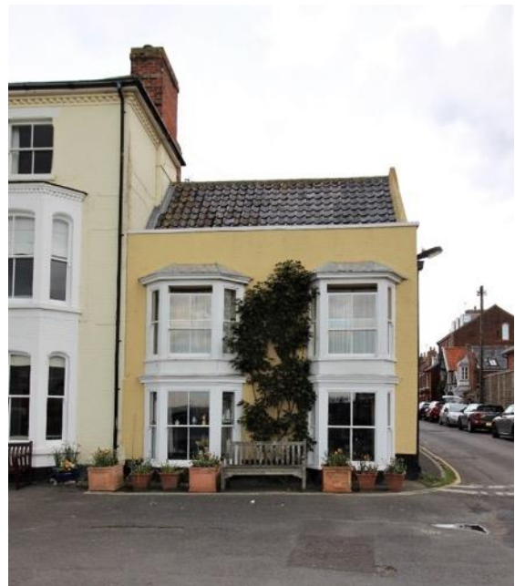
No. 7 South Green