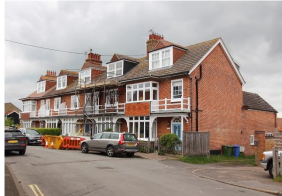
Nos.27-31 (cons) Field Stile Road

recorded on the 1891 census as unoccupied. It now forms two houses which sit back to back. Red brick with Suffolk white brick dressings and stone lintels. Welsh slate roof. Substantial canted bay with French doors. Late twentieth century flat roofed garage.