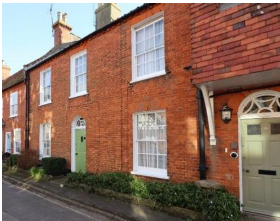
Nos.10 & 12 Park Lane