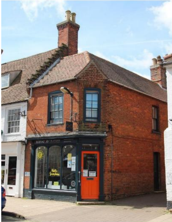
No.53 High Street

No.53 High Street (Positive Unlisted Building). House and lock up shop of c.1890 built on the site of a blacksmith's workshop. Originally with a crow-stepped gable to the splayed corner. Red brick with a Welsh slate roof. Early twentieth century photographs show this building with plate-glass sashes beneath shallow brick arched lintels, most of which still survive. Late nineteenth century shop fascia. Manor Farm Close elevation contains a partially glazed front door and four-light plate-glass sashes. No.53 makes a strong positive contribution to the setting of the listed buildings which flank it.