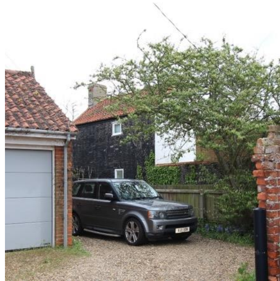
South Cliff Cottage, South Cliff, west elevation

Skilmans Cottage, Skilmans Hill (Positive Unlisted Building). Red brick cottage, two storey, probably dating from the early 19 th century. A pair of later two storey canted bays to the west elevation. Red clay pan tile roof with a pair of red brick stacks. The north return elevation displays the scars of various door and window alterations through an interesting mix of washed cobble and red brickwork.