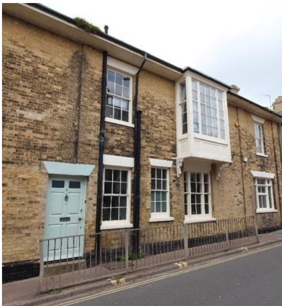
No. 7A Queen Street, rear section of May Place