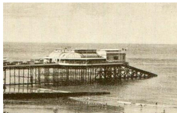
Detail from postcard c.1890 showing the Lifeboat Station at the head of Cromer Pier

Timber framed, with panels of diagonal weatherboarding between posts. Corbelled eaves supporting a shaped roof. The structure retains its original window frames, although the large sliding doors, through which the lifeboat was launched, have been altered. Extension of 2009 to the south west elevation is sympathetically detailed.