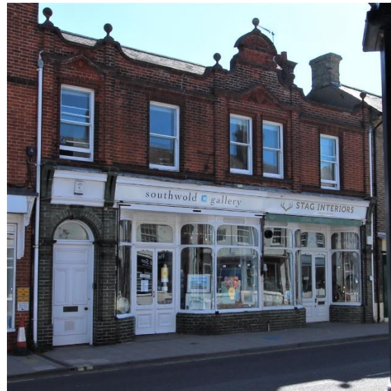
No.64 High Street

Nos.60 & 62 High Street (Positive Unlisted Building). Late nineteenth century purpose-built retail premises with living accommodation above. Faced in red brick with a Welsh slate roof. It retains its original four-light plate-glass sashes to the upper floors. Ground floor has door to living accommodation set within recessed porch at southern end. Much altered early to mid-twentieth century shop front set within probably original nineteenth century opening.