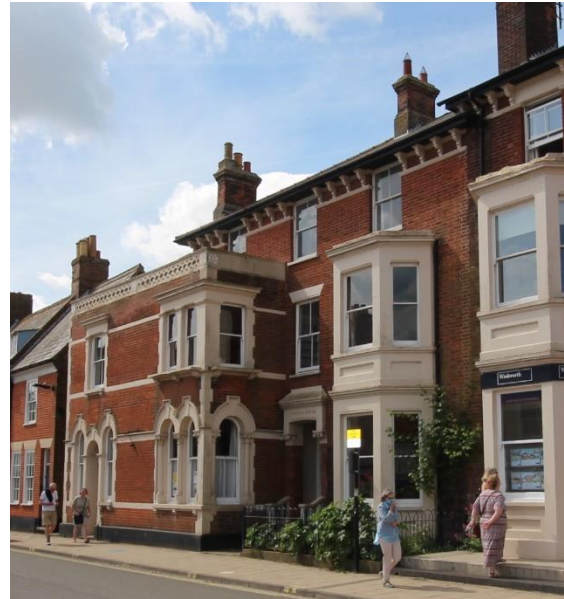
Wymering House, No.47 High Street

No.39 & Farleigh House, No.41 High Street (Positive Unlisted Buildings). Two very large houses which are shown on the 1904 1:2,500 Ordnance Survey map. Probably constructed with the northern section of the Post Office in 1895 and of the same design as Nos. 43 & 45. Three storeys over a high basement. Recessed porches with heavy moulded stone hoods to centre of façade supported on ornate carved corbels. These are approached via flights of steps with ornate stone balustrades. Canted bay windows with horned plate-glass sashes to either side of porches which rise from basement to first-floor level. Welsh slate roof with corbelled eaves cornice. No.41 has unfortunately had a number of its first-floor sashes unsympathetically replaced. Ornate cast iron railings and panelled stone gate piers to frontage.