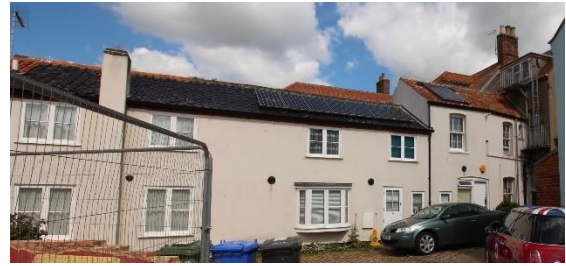
Rear of No.1 and Nos.7A & B Market Place

Nos.5 & 7 Market Place (Positive Unlisted Building). A mid nineteenth century rendered and painted brick shop with a black pan tiled roof. Nineteenth century shop fascia to southern end of principal façade with a horned plate-glass sash above. Partially glazed front door to centre with wedge-shaped lintel. Bay window with small pane sash to first floor at northern end with mid twentieth century shop fascia below. Return elevation gabled with casement windows which must be of relatively recent origins as early photographs show a further single storey small dwelling abutting the gable of Nos 5-7 within what is now the entrance to Child's Yard. Two storey nineteenth century rear range of painted brick with a red pan tile roof.