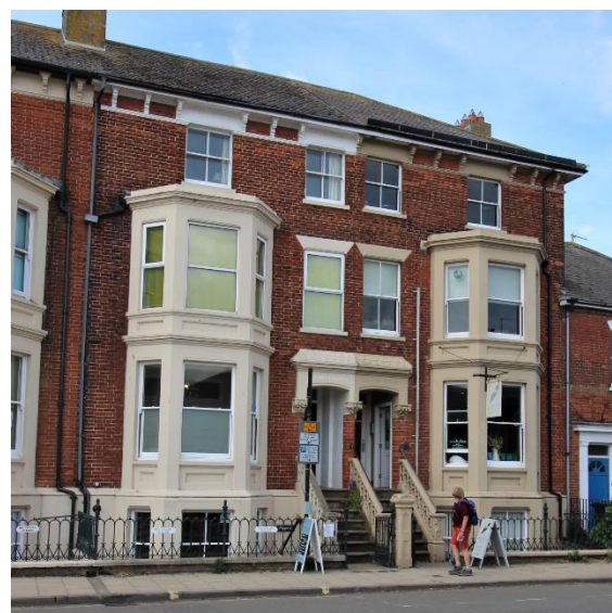
Nos.39 & 41 High Street

Forest House, No.37 High Street (Positive Unlisted Building). Late nineteenth century red brick shop with white brick embellishments. Two storeys with splayed northern corner. Welsh slate roof. c.1900 wooden shop fascia. With canted oriel and four light plate-glass sashes above. Pilastered wooden doorcase to domestic accommodation. A well-preserved example of a purpose-built late nineteenth century shop.