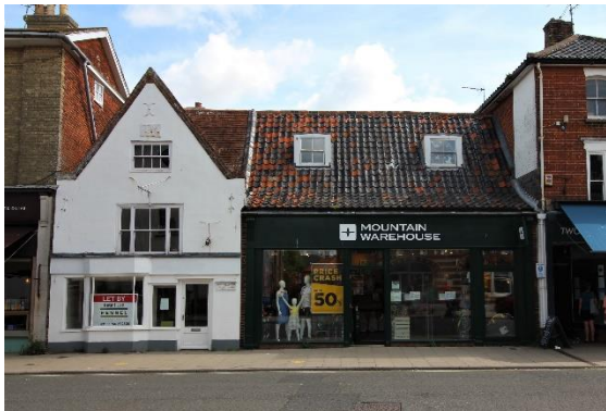
Nos.82-86 (even) High Street