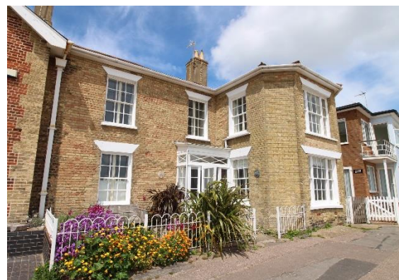
Cliff House No.2 & Shrimp Cottage, No.3 East Cliff