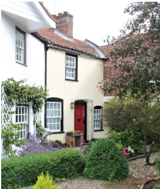
No.20 High Street

Barnaby Cottage, No.16 & 18 High Street (Grade II)