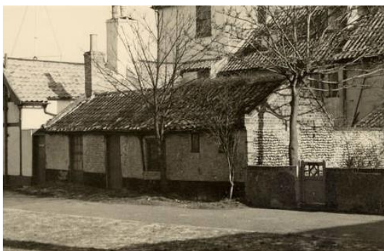
A c.1940 view of No.23 St James Green

No.23 St James Green (Positive Unlisted Building). A c.1800 structure with substantial late twentieth century alterations. Possibly originally a laundry or brewhouse for neighbouring Seaview House on East Cliff, now a dwelling. Red brick with a red pan tile roof. Old photographs show that the right-hand return elevation was originally partially of cobble. Late twentieth century casement windows. Boarded door.