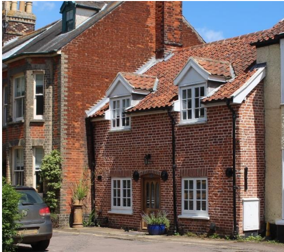
Oak Cottage, No.17 Bartholomew Green

Oak Cottage, No.17 Bartholomew Green (Grade II)