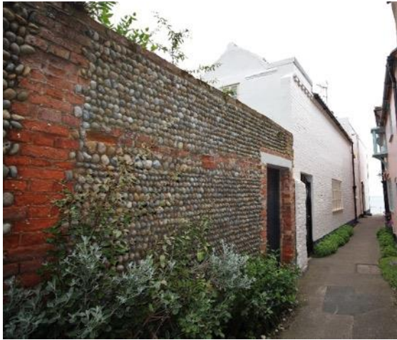
Boundary wall, to the west of The Nook, Primrose Alley

Boundary wall, to the west of The Nook, Primrose Alley (Positive Unlisted Building). Wall constructed from coursed washed cobbles set within red brick margins and cappings. The wall provides a sense of enclosure to Primrose Alley and contributes positively to the setting of several buildings.