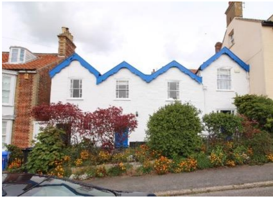
Iona Cottage No.11 and Iona Flat, No.11A Constitution Hill

Ashleigh, Constitution Hill (Positive Unlisted Building). A well-preserved detached red brick villa built in 1939. The house retains the original Crittall windows and a balcony with an oak balustrade. Balanced and reserved elevations are enlivened by good quality brickwork, substantial brick stacks rising up the south east and north west elevations, and a hipped roof covered with plain tiles. The house occupies a highly prominent location at the corner of Queens Road, Constitution Hill and Gardner Road.