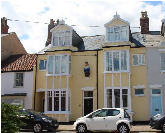
Dolphin House and Douglas House No.12 Stradbroke Road

Dolphin House and Douglas House No.12 Stradbroke Road (Positive Unlisted Building). House, formerly house and shop of c.1895 (this site is shown as vacant on some early photographs for some time after No.14 had been completed). Rendered with a Welsh slate roof. Moulded eaves cornice. Substantial gabled dormers with elaborate decorative bargeboards and spear finials, with unsympathetic windows. The sides of the dormers clad in slate. Two storey bay windows with mullioned casements which were possibly added in the early twentieth century, that to the south formerly acting as a shop window. Applied decorative timber framing. Window joinery largely replaced. Painted stone wedge-shaped lintels to doors. Red brick ridge stacks. Ship's figure head on bracket above front door.