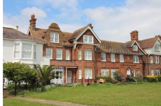
Eversley House (left) and No.10 The Master's House (right), The Common

Mariners and Old Mill, The Common (Positive Unlisted Building). A pair of double fronted villas dating from the late nineteenth century, shown on historic photographs alongside the mill, prior to demolition of the mill in 1894. Both villas are rendered, covering the original white brick elevations, and both houses have had their single storey canted bays raised in height and replacing the tripartite sash window arrangement to the first floor. Hipped roof covered with Welsh slate. Both houses retain some of their original plate glass sash windows. Finialed railings enclosing the front gardens.