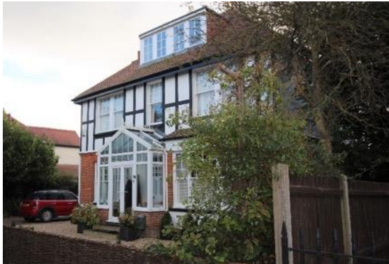
No.68 North Road

No.67 North Road (Positive Unlisted Building). A well preserved substantial detached house of c.1910. Faced in red brick with a rendered first floor and steeply pitched plain tile roof. Decorative ridge pieces and applied timber framing to gable. Original window joinery largely preserved. Plate glass sashes divided by mullions with small panes to upper lights. Decorative partially glazed wooden porch.