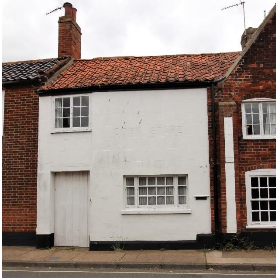
Corn Store, No.10 Victoria Street

Corn Store, No.10 Victoria Street (Positive Unlisted Building). Former grain store, possibly converted in the early to mid-nineteenth century from the service wing of the Grade II listed No.1 Bartholomew Green of which it now once again forms part. Converted to dwelling in the twentieth century. Rendered and scoured to imitate ashlar blocks with a red pan tile roof the words 'Corn Store' inscribed into the render. Two twentieth century small pane casement windows and a boarded door. A 1949 National Monuments Record photograph (BB49/3023) shows the upper floor of the façade as it is today, but with a small window and a second door where the present large ground floor window is located.