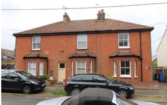
Nos. 2-6 (even) St Edmunds Road

Corporation Cottages Nos.1-31 (Odd) St Edmunds Road (Positive Unlisted Buildings). A substantial terrace of uniformly designed early local authority housing dating from 1905; some of the earliest to survive in England. They were built by Southwold Corporation from monies generated by the sale of part of the Town Farm estate for housing. Red brick with red pan tile roofs (the cottages are also shown with pan tile roofs on early photographs). Replaced casement windows divided by mullions, that to ground floor level beneath shallow arched brick lintel. Partially glazed front doors again beneath shallow arched brick lintel but set back slightly from the exterior of the building. Upper floor windows are set just below the eaves. Red brick ridge stacks.