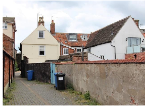
Granville House, No.78 High Street, Bank Alley Elevation

Granville House, No.78 High Street (Positive Unlisted Building). Late nineteenth century façaded dwelling of now painted brick retaining its original plate-glass sash windows and bracketed wooden doorcase. Late twentieth century partially glazed front door of unsympathetic design. Black pan tiled roof of probably much earlier date with nineteenth century flat roofed dormer containing a four-light sash to High Street façade, rear roof slope of red pan tiles. The sash window above the front door has narrow margin lights. Rear elevation visible from Bank Alley of mid eighteenth century or earlier date. Gabled and rendered with nineteenth century plate-glass sashes. Probably originally part of the same building as Nos.74 & 76 which appear to be of a mid-eighteenth century or earlier date. An important part of the setting of adjoining listed buildings.