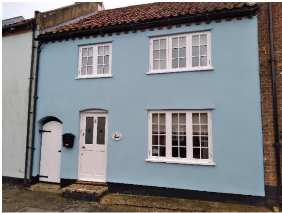
No.2 North Green

date. The relationship of the door and blind opening to the side wall is unusually close and it appears the house was to have been one half of a pair, although map evidence suggests this was never completed.