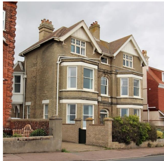
Nos. 1-3 Strathmore House, No.26 North Parade

No.23, Amber House No.24, & No.25 North Parade (Positive Unlisted Buildings). Terrace of three substantial three storey houses, possibly designed as boarding houses. Map evidence suggests that they were constructed sometime between 1891 and 1904, however their site appears to be vacant on a dated photograph of October 1893 taken from the lighthouse. Red rick with brick quoins and rubbed brick lintels. Brick parapet and moulded brick cornice. Horned plate-glass sashes survive to No.23. Nos.24 & 25 with heavier replacement sash frames to original design. Each house of two bays with a two-storey canted bay window to the northern bay. That to the central house is rendered which may possibly be an original design feature. Four panelled front doors beneath plate-glass fanlights. The rear elevations of Nos.25 & 26 are visible from Field Stile Road, that to No.25 being rendered. Both retain their horned plate-glass sashes. Nos.24 & 25 appear to retain their original boundary walls to their front gardens. No.23 was a private house in 1916 (Kelly.) John Miller Britain in Old Photographs: Southwold (Stroud 1999) p83