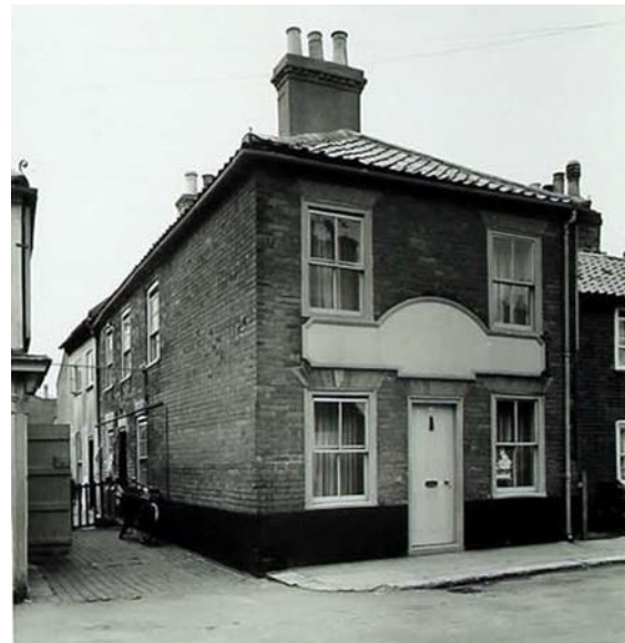
The Former Rising Sun, No.6 Trinity Street c.1949

contribution to the setting of adjacent Grade two listed 8-12 Trinity Street. The Rising Sun public house being entered via a doorway in the centre of the street façade which was removed in the later twentieth century. The Street façade now has small pane sashes which replace those shown in the NMR photograph and others. The 1949 photograph also shows wedge-shaped brick lintels with key stones which have been plastered over. The Trinity Courtyard elevation has also been altered by the insertion of additional window openings and the conversion of the original doorway to one of the houses into a window. Late twentieth century pedimented doorcase. Chimneystacks removed. Trinity Close was used for stabling for Montgomeryshire Yeomanry horses during World War One.