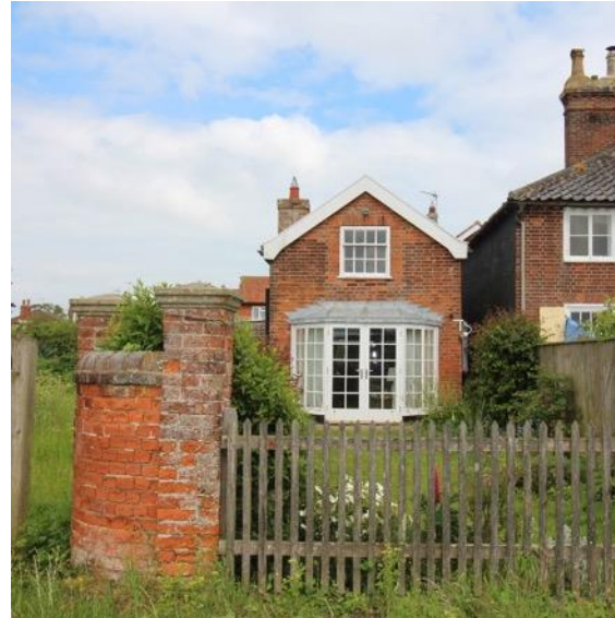
Rope Walk Cottage and boundary wall, Spinners Lane

Rope Walk Cottage, Spinners Lane (Positive Unlisted Building). A diminutive red brick structure, with gable end facing the common. Mid to late nineteenth century, with the 1904 1:2,500 Ordnance Survey map showing a larger structure extending to the west; the west elevation brickwork bears the scars of alteration to the gable end. Canted bay window with lead roof probably added when the structure was reduced in size during the mid-twentieth century. Red brick boundary wall with half round cappings and piers with stone caps fragmentary but adds to the setting of the house and forms a group with the house and wall to the south.