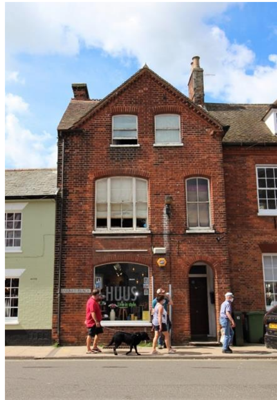
No.1 Market Place

No.1 Market Place (Positive Unlisted Building). A red brick commercial building of c.1890 probably built as a solicitor's office. It was later the architect's office of Thomas Edward Key. Gabled with a dentilled brick cornice and shallow arched brick lintels to the windows. Arched doorway leading to recessed porch containing a panelled door with rectangular fanlight above. Horned plate-glass sash windows. Tripartite sash to ground floor replaced with a single sheet of plate-glass within original opening. No.1 makes an important positive contribution to the setting of the listed buildings which flank it. Its possibly earlier rear range is now two separate dwellings known as Nos. 7A and 7B Market Place which are accessible from Child's Yard. These are discussed separately.