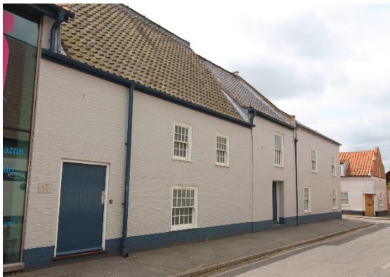
Nos.45 & 47 Victoria Street

Adnams Whisky Dunnage Premises see Crown Hotel, High Street.