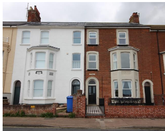
Nos.18 & 19 North Parade

accessed from French doors at second floor level. The balconies are of elaborate cast iron between gault brick piers capped with ball finials. That to No.17 has however been replaced by one of painted wood. Horned plate-glass sashes. Partially glazed panelled doors with rectangular fanlights above. Red brick ridge stacks with a gault brick dentilled cornice below the cap. Rendered brick dwarf wall to gardens with square-section gate piers. Late twentieth century iron gates. No. 16 described as apartments in Kelly's 1916 directory whilst No.15 was in single occupation. Considerably altered single storey red brick outbuilding to rear of No.15. John Miller Britain in Old Photographs: Southwold (Stroud 1999) p83