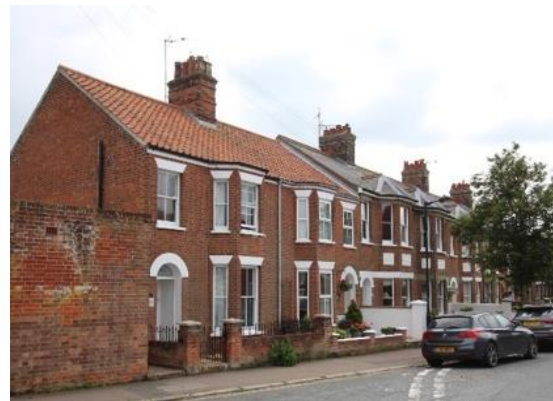
Nos.1 and 2, and Nos.5 to 19 (odd) York Road

Nos.1 and 2, and Nos.5 to 19 (odd), York Road (Positive Unlisted Buildings). A terrace of ten villas dating from the early twentieth century. Red brick, with each house having a two storey canted bay windows with decorative tile panels between the ground floor and first floor windows. Nos.1 and 2 differ in being slightly lower in height to the rest of the terrace, and the roofs covered with red clay pan tiles. The rest of the terrace has Welsh slates to their roofs.