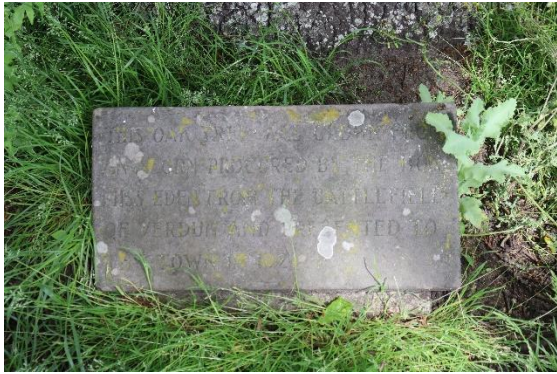
Verdun Tree Dedication Stone, East Green

Verdun Tree Dedication Stone, East Green Substantial stone with inscription commemorating the planting of an Oak tree grown from an acorn taken from the battlefield of Verdun in 1920. For the Adnams Malthouse block on the western side- See Victoria Street