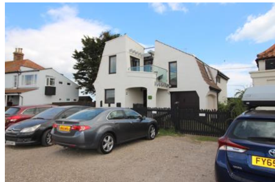
Blackshore Corner, Blackshore

No's 1, 2 and 3 Blackshore Cottages, Blackshore (Positive Unlisted Buildings). A row of cottages with painted brickwork elevations, dating from the second quarter of the 19 th century. Pan tile roof covering, hipped to the south west, and a gable end where it adjoins No's 4 and 5. Three red brick chimneys with dentil detailing to the ridge. Sash windows with margin glazing bars. Expressed keystone detail over each opening with 6 over 6 pane sash windows to the elevation facing the marshes. The addition to the south east end of is not of special interest.