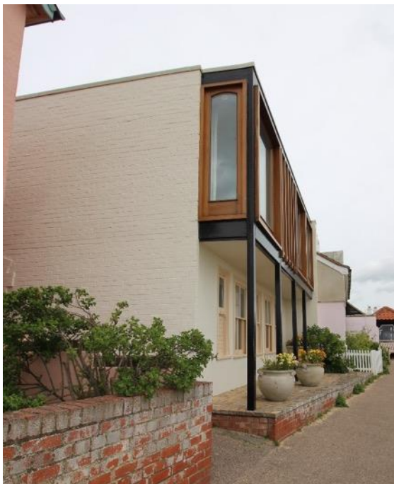
The Nook, Primrose Alley

Boundary wall, to the west of The Nook, Primrose Alley (Positive Unlisted Building). Wall constructed from coursed washed cobbles set within red brick margins and cappings. The wall provides a sense of enclosure to Primrose Alley and contributes positively to the setting of several buildings.