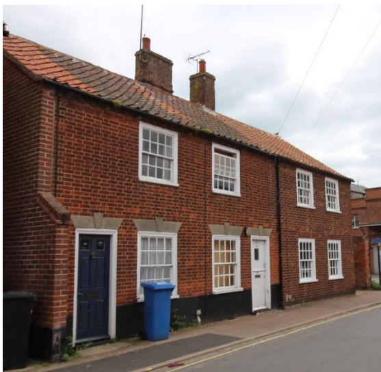
Nos.40 & 42 Church Street.

Nos.40 & 42 Church Street (Positive Unlisted Buildings). A semidetached pair of red brick cottages with pan tile roofs probably of c.1800-1820 date. Sixteen light hornless sashes in moulded wooden frames. Wedge shaped lintels with pronounced key stones. No 40 with a six panelled door with glazed top lights. The door to No.42 boarded. Large late twentieth century addition to southern end of No.42. Northern return elevation of No.40 rebuilt following the demolition of the adjoining former Brickmakers Arms public house c.1984.