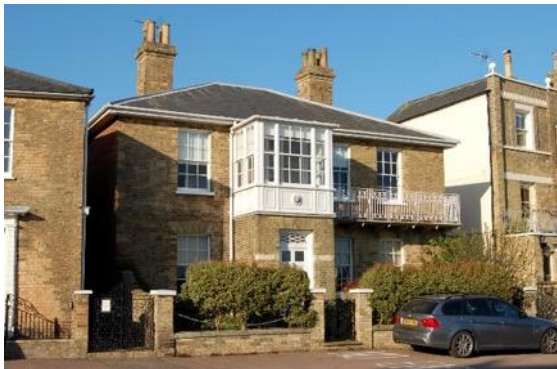
South Green House, No.8 South Green