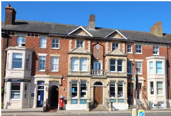
No.43, The Post Office and No.45 High Street

Wymering House, No.47 High Street (Positive Unlisted Building). A purpose-built doctor's surgery and dwelling of c.1895 of three storeys with a two-storey wing. Faced in red brick with painted stone dressings. Welsh slate roof with exaggerated overhang to eaves on three storey section, supported on carved brackets. Red brick ridge stacks. Plate-glass sashes. House with two storey canted bay window flanked by recessed porch with heavy and elaborately carved stone hood. Projecting surgery wing with decorative parapet and arched windows with corbelled hoods and pronounced key stones. Recessed porch with heavy stone hood supported on decorative corbels and flanked by arched windows. Glazed screen containing door within. Rear elevation more restrained with small late twentieth century single storey brick addition. Wymering House remained a Doctor's Surgery until the late 1950s. Its upper floor sustained bomb damage in 1943.