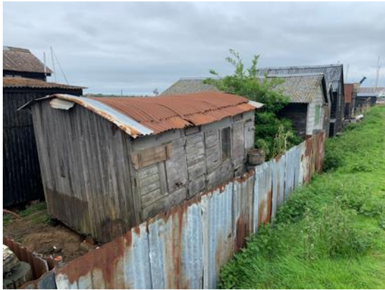
North east elevation of former railway carriage, hut W18