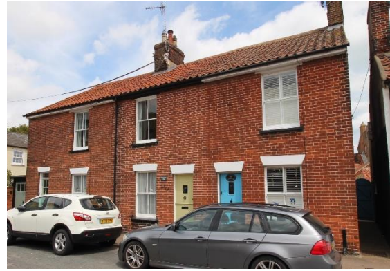
Palm Cottage, No.34 & 34A Victoria Street

appears on Wake's 1839 map and the earliest surviving fabric may be of mid nineteenth century or earlier date. The introduction c.2007 of a stainless steel Huppman brewhouse within the old fermentation house required its walls to be raised in height. The Victoria Street frontage has a three-storey red pan tiled roof range of late nineteenth century date with a boarded winch turret projecting from its façade. Red brick with inserted horned sash windows of late twentieth century date. Return elevation to narrow passage. This range appears to have been preserved largely intact. Attached to the northern end of this structure is a single storey cobble and red brick office range with a red pan tiled roof. Horned sash windows. This range also appears to be reasonably well preserved. The other single storey ranges fronting East Green, and Victoria Street were of mid nineteenth century or earlier date but are now little more than façades. The Victoria Street façade is reasonably well preserved but has lost a large pair of boarded taking in doors. Original shallow pitched roof replaced by