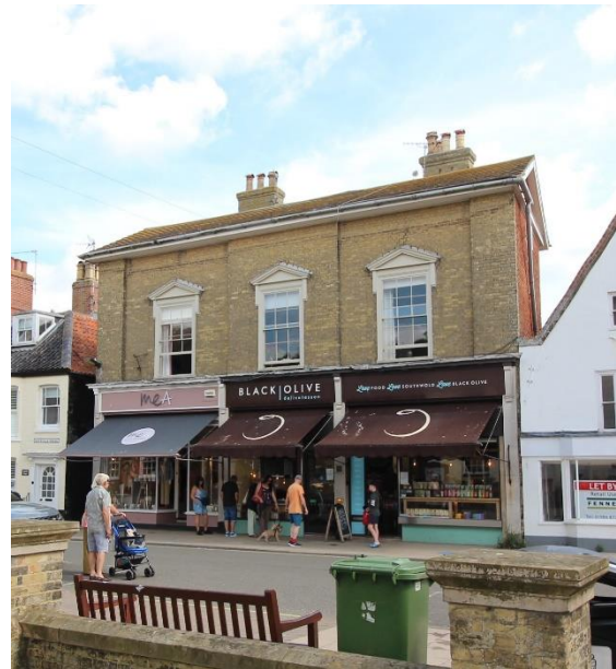
Rutland House, Nos.80 & 80A High Street

Rutland House and Rutland Cottage, Nos.80 & 80A High Street (Grade II)