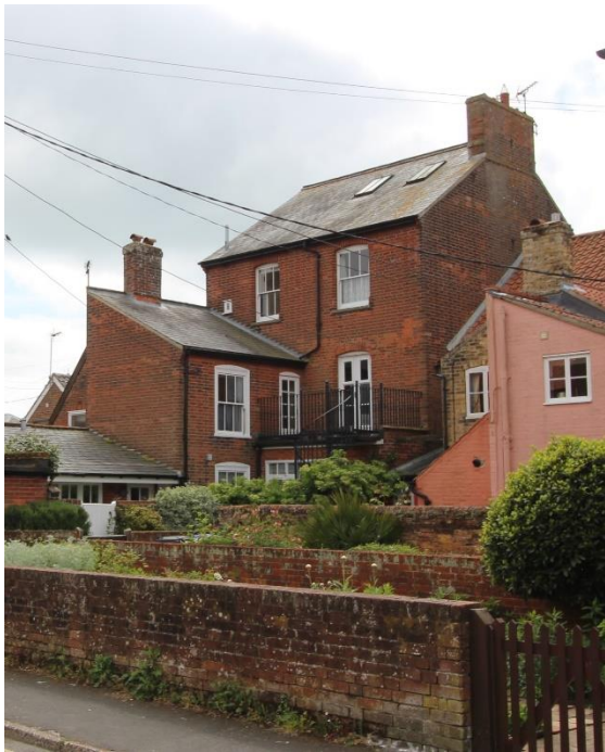
No.3 Park Lane, Lorne Road elevation

remodelled in the classical style c.1970. Its nineteenth century rear elevation is prominent in views along Lorne Road. Red brick with a Welsh slate roof and Suffolk white brick quoins. The Park Road elevation is a remarkably well executed piece of classicism for the period. Of three storeys with attics and three bays with horned twelve light sashes beneath rubbed brick wedge-shaped lintels. Open pedimented doorcase with pilasters and a radial fanlight. Six panelled door. The house's Lorne Road elevation largely retains its late nineteenth century windows. Two storey outshot.