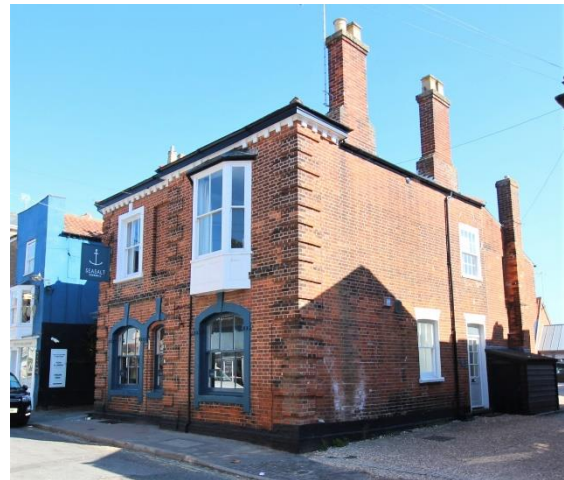
No.8 East Street

No.6 East Street (Positive Unlisted Building). A probably early nineteenth century cottage which is in a yard to the rear of No.2 East Street and has a long and largely blind rear eastern elevation to Smoke House Court. Of two storeys, rendered with a red pan tile roof and overhanging eaves. The 1971 1,2,500 Ordnance Survey map shows the house with an outshot at its southern end which is no longer extant. The house contributes to the setting of the Grade II listed No.6 East Street as well as to the character of Smoke House Court.