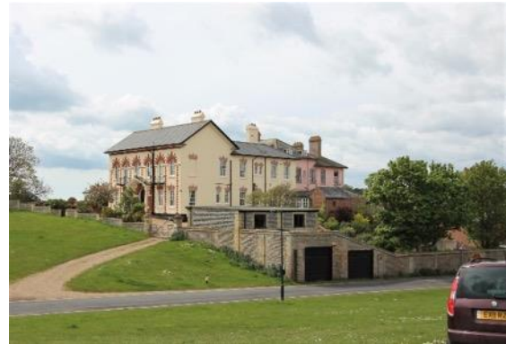
Southwold House (left) and Sole Bay House (right), from Constitution Hill