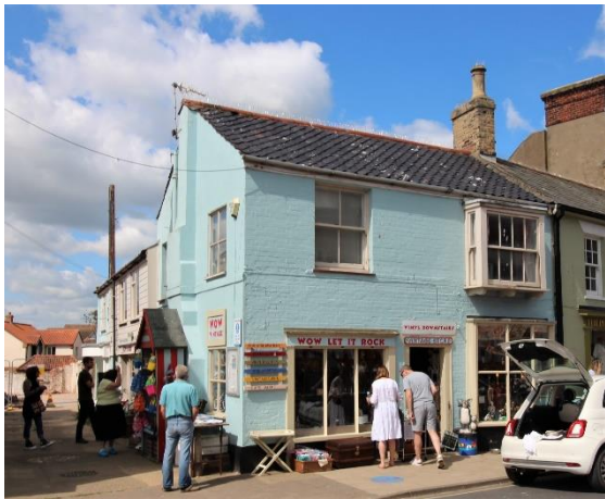
Nos.5 & 7 Market Place

Nos.5 & 7 Market Place (Positive Unlisted Building). A mid nineteenth century rendered and painted brick shop with a black pan tiled roof. Nineteenth century shop fascia to southern end of principal façade with a horned plate-glass sash above. Partially glazed front door to centre with wedge-shaped lintel. Bay window with small pane sash to first floor at northern end with mid twentieth century shop fascia below. Return elevation gabled with casement windows which must be of relatively recent origins as early photographs show a further single storey small dwelling abutting the gable of Nos 5-7 within what is now the entrance to Child's Yard. Two storey nineteenth century rear range of painted brick with a red pan tile roof.