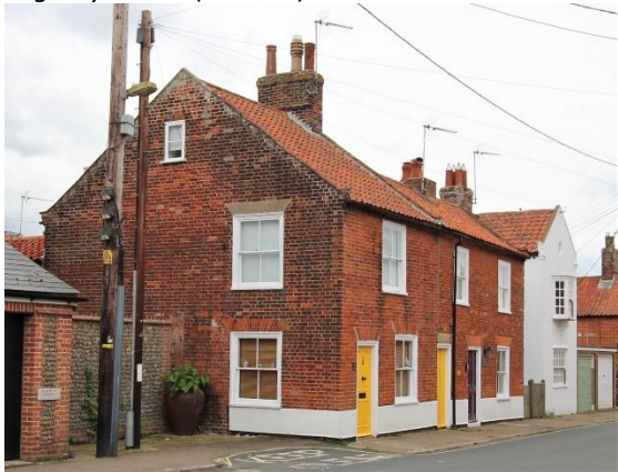
Nos.2 & 4 Lorne Road

Regency House (Grade II) – See South Green