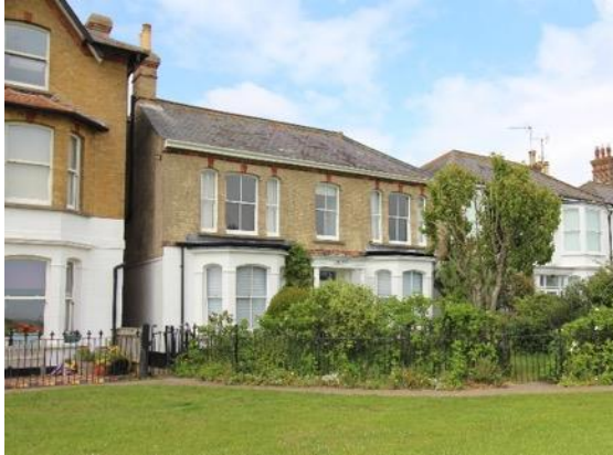
Mill House, The Common

Mill House, The Common (Positive Unlisted Building). Former home of the mill owner, and latterly formed part of the Eversley Road School complex. Presumably built prior to the demolition of the mill (1894) although the structure shown on the 1884 1:2,500 Ordnance Survey map appears to relate to the single storey building that was replaced by the existing house. White brick with rendered ground floor. Central entrance with columned porch, flanked by a pair of flat roofed canted bay windows. Above each bay are tripartite windows and to the centre of the first floor a single plate glass sash window. The openings to the first floor have red brick key stone detailing. Welsh slate roof, hipped to the east, with gable end to the west and a white brick ridge stack. Wrought iron finialed railings and hand gate enclosing the front garden.