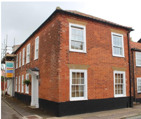
No.6 Trinity Street

No.2 Trinity Street (Positive Unlisted Building). A small cottage of early to mid-nineteenth century date of painted brick. Possibly originally a pair of cottages. Late twentieth century horned sash windows beneath wedge-shaped lintels. Partially glazed front door. The right-hand window is a later twentieth century small pane casement. Red pan tiled roof covering.