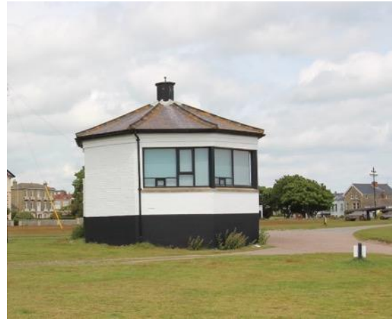
Watch House (or The Casino), Gun Hill

Watch House (or The Casino), Gun Hill (Grade II)