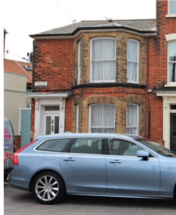
No.6 Stradbroke Road

For Nos.2 & 4 Stradbroke Road see The Sole Bay Inn (Grade II) St James Green.