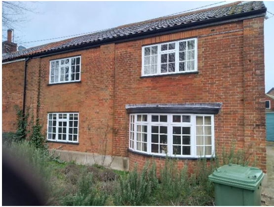
No.6 North Green

factory c.1921, converted to flats in the late twentieth century. Suffolk white brick with red brick dressings and a Welsh slate roof. Central ground floor doorway on Field Stile Road elevation and taking in door at first floor level now removed along with timber clad projecting winch houses. A prominent landmark on the approach to the town from the north former part of a notable group with other listed and non-listed structures fronting onto North Green. The structure is a reflection of Southwold's former economic history.