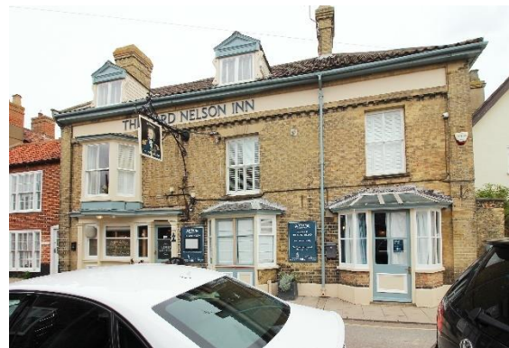
The Lord Nelson Inn, No.42 East Street

The Lord Nelson Inn, No.42 East Street (Positive Unlisted Building). A well-preserved public house of c.1860 built on the site of an earlier public house opened c.1823. Faced in Suffolk white brick with horned plate-glass sashes. Original pilastered fascia preserved to western most bay, to its east are two canted bay windows with doors inserted into their central face. The eastern canted bay replaces an arched opening into a rear courtyard visible on historic photographs. Formerly with Welsh slate roof now pan tiles. Two gabled dormers in principal roof slope with boarded sides. Decorative white brick ridge stacks. Fine decorative cast iron bracket to inn sign.