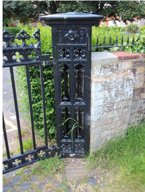
Gates to St Edmund's Churchyard, Bartholomew Green

Gates to St Edmund's Churchyard, Bartholomew Green (Grade II, GV).