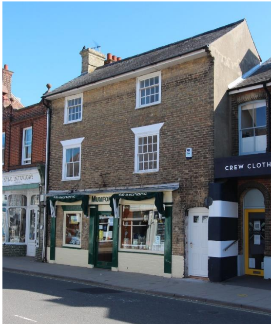
No.66 High Street

wood shop facia. Divided into two shops in the 1960s. Red brick with stone dressings and a Welsh slate roof. Plate-glass sash windows to first floor between pilasters capped with stone finials. One bay breaks forward slightly at first floor level and has an elaborate pedimented gable. Doorway at northern end to domestic accommodation recessed within glazed tile lined arched opening. With pronounced keystone. Original panelled door with fanlight above. Original glazed doors to shop facia.