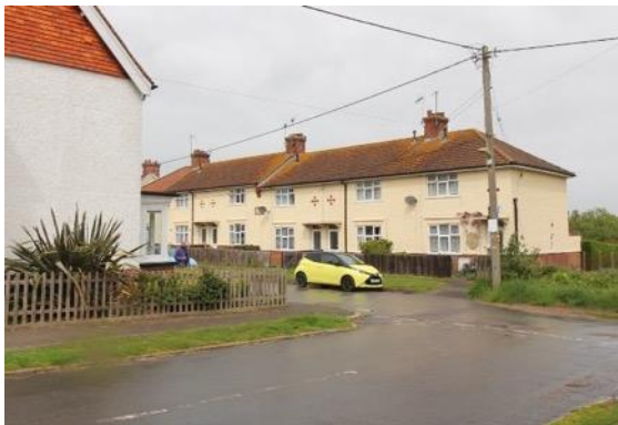
Mights Cottages, Nos.30-40 (even) North Road

Nos.6-28 (even) North Road (Positive Unlisted Buildings). Three blocks of four early Southwold Corporation council houses completed c.1914 probably to the designs of James Hurst the Borough Surveyor. Red brick with pebble dashed first floor and decorative brick quoins. Rubbed brick wedge shaped lintels. Replaced pan tile roof coverings and shared red brick ridge stacks. Terracotta commemorative plaque on central block with lugged brick surround. Nos * &.20 appear to retain their original horned sashes and partially glazed front doors with decorative stained-glass panels, all other external joinery replaced within the original openings.