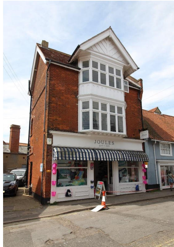
No.5 East Street

Nos.1 & 3 East Street (Grade II)- See No.25 Market Place (East Side).