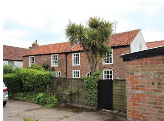
Old Hall Cottage, Woodleys Yard

Old Hall Cottage, Woodleys Yard (Positive Unlisted Building). The left hand side of a pair of cottages (the right side having been rebuilt). Probably of early 19 th century date. Red brick with red clay pan tile roof covering and gable end brick stack. The first floor retains 6 over 6 pane sash windows. The ground floor openings have been enlarged. The property and associated front garden are set back and provide a change in scale and material use when compared to the structures surrounding it.