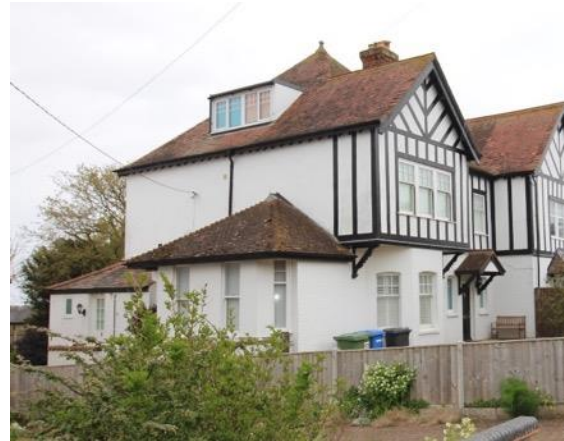
Holly House, No.80 Pier Avenue

Holly House, No.80 & No.80A Pier Avenue (Positive Unlisted Building). A substantial early twentieth century villa (Shown on an auctioneer's plan of 1919, but not amongst the plots sold in the first sale in 1899) of rendered brick with applied timber framing now subdivided into two semidetached dwellings. Originally called Grey House and until the later twentieth century painted in the same style as Nos. 60 and 62 Pier Avenue. Like these houses it may also have been designed by Edward Charles Homer (1845-1914) Holly House has a panelled front door beneath plain tile hood supported on decorative carved brackets. Original sash windows with small pane upper lights largely preserved. Rendered rear elevation retaining original window joinery to upper floor. This and the adjoining house were damaged in World War Two when the house opposite was completely destroyed in a bombing raid. Early photographs show it with a single storey lean to porch to the centre of the façade. A Barrett Jenkins, Reminiscences of Southwold in Two World Wars (Southwold, 1984) p60-62.