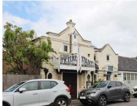
The Electric Picture Palace, Blackmill Road

Forest Cottage, Blackmill Road (Positive Unlisted Building). Detached inter-war red brick villa occupying a prominent corner location. Classical detailing, including symmetrical principal elevation, projecting central bay crowned with an open pediment. Prominent brick quoins to the corners. The projecting modillioned eaves cornice hints at Queen Anne revival styling. The grouping of paired first floor sash windows with the single storey canted bays with shallow pitched roofs below, combine to create a playful rather than scholarly principal elevation. The house and its garden to the east are prominent in views from the High Street. Garages to the north west occupy part of the former garden area and detract from the setting of the house. The site is enclosed by an attractively curved red brick boundary wall.