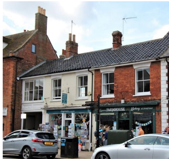
Nos.77 & 79 High Street