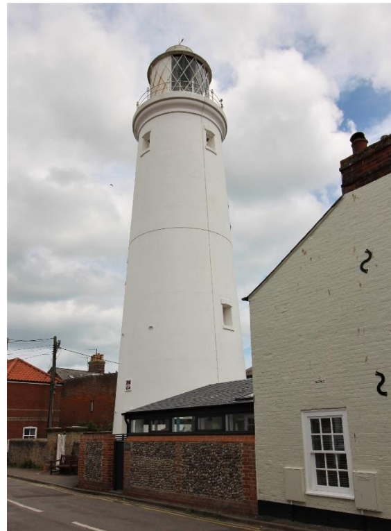
The Lighthouse, Stradbroke Road

Nos.2 & 4 Stradbroke Road - see Sole Bay Inn, No.7 East Green