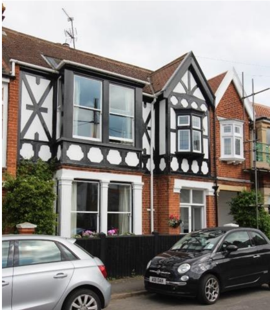
Nos.2 (left) and 3 (right), Manor Park Road

This house makes an extremely positive contribution to the character area and setting of neighbouring properties and exists in an unusually unaltered state.