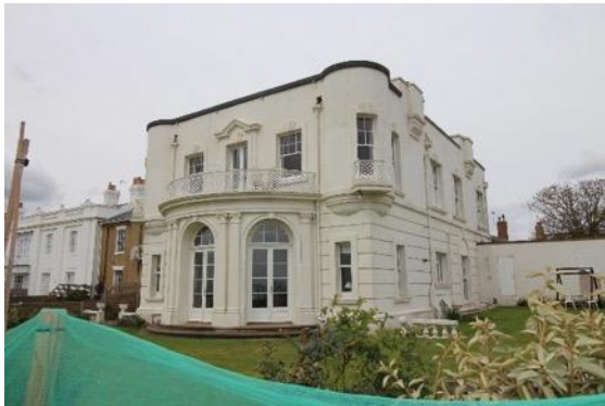
No's 4 & 5, Centre Cliff, South Green

No's 4 & 5, Centre Cliff, South Green (Positive Unlisted Building). Built as the Centre Cliff Hotel and designed by G.J. Skipper in 1899. A fusion of styles brought together with painted stucco. Upper two stories removed which has much diluted the impressive impact of the original design, and resulted in only one of the three storey corner bartizan towers being extant. However, sufficient remains, particularly to the ground floor, to hint at the full splendour of the original design. See Bettley, J and Pevsner, N The Buildings of England, Suffolk: East (2015), p.522.