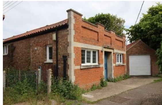
Church Hall, Manor Park Road

Wymering Road. Addition to the southern end of No.3 makes an attempt to repeat existing details.