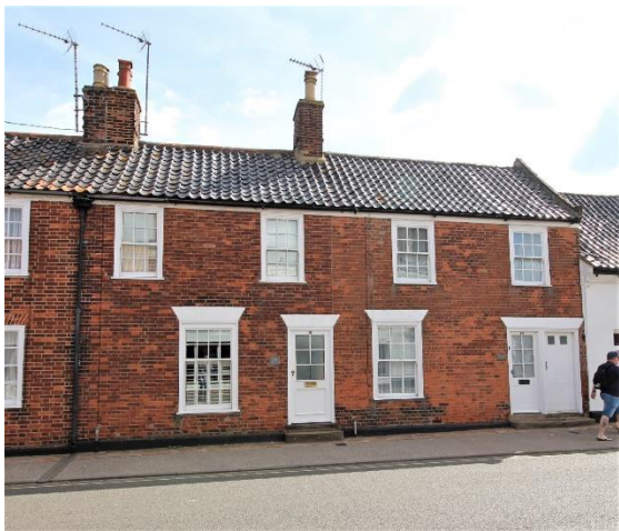
Nos.28 & 30 High Street

No.32 High Street (Positive Unlisted Building). Former cottage of a single storey and attics which is probably of eighteenth-century date, now a chip shop. Rendered brick with a black pan tiled roof and overhanging eaves. Unsympathetic twentieth century display window and partially glazed front door. Single storey lean to section to rear also with pan tiled roof.