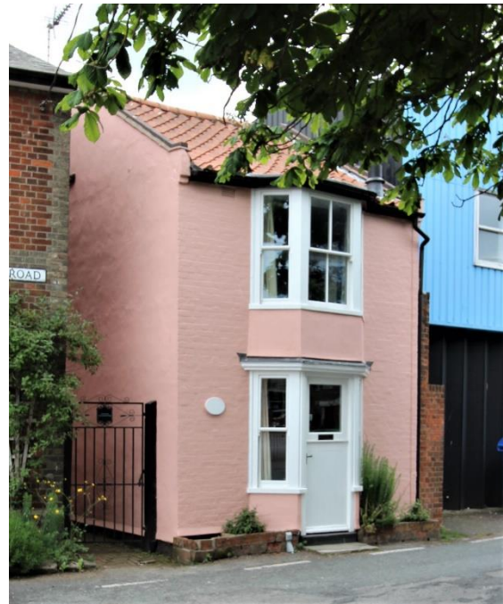
No.27 Cumberland Road

Saffron Cottage No.23, Church Green Cottage No.24, No.25 & St Edmunds Cottage, No.26 Cumberland Road (Positive Unlisted Buildings). Mid nineteenth century red brick terrace originally known as Alpha Place with Suffolk white brick dressings and a Welsh slate roof. Hornless twelve-light sashes, those to the ground floor having plaster faced wedge shaped lintels (possibly made of cast iron). Decorative blind panel above each front door. Red brick ridge stacks rising from the spine walls between the houses with elaborate white brick dressings. No.23 sadly now painted.