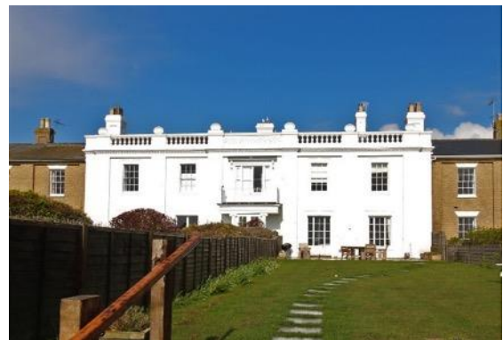
Nos.1 & 2, Centre Cliff, South Green