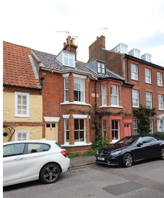
Nos.5 & 7 Park Lane

Nos.5 & 7 Park Lane (Positive Unlisted Buildings). A pair of houses dating from the late nineteenth century which were constructed within the former gardens of houses on Lorne Road. Built of red brick with blue brick embellishments and a glazed black pan tile roof. Of two storeys with two bays to each house, full height canted bay window containing original horned plate-glass sashes to inner bay of each house capped by a heavy moulded cornice. Doorway within outer bay containing panelled door beneath painted wedge-shaped lintel. Dormers with casement windows within roof and central ridge stack. Rear elevations visible from Lorne Road, red pan tile roof. No.5 with casements. No.7 rendered with a mixture of original plate-glass sashes and twentieth century casements. A well-preserved pair of nineteenth century houses which make an important contribution to the setting of adjacent listed buildings.