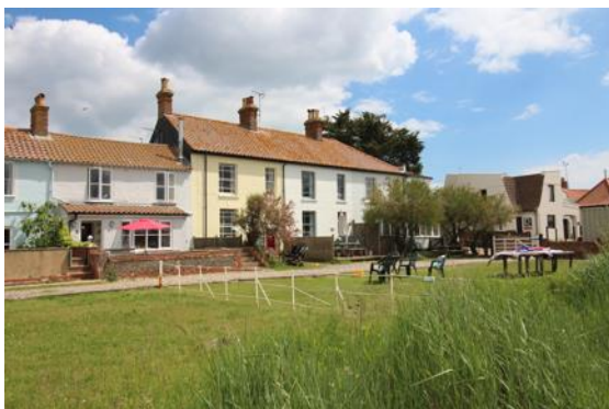
No's 1, 2 and 3 (inc) Blackshore Cottages, Blackshore

No.4 (right) and No.5 (left), Blackshore (Positive Unlisted Buildings). A pair of early 19 th century cottages (they appear to be shown on a Parliamentary Boundaries Commission map of 1837). Painted brickwork elevations, with dentil eaves course and red clay pan tile roof covering. Red brick ridge stack marks the position of the party wall between the two properties. Brick upstand gable to the north west end, with a further stack. Both properties have single storey extensions with pan tiled roofs to the river facing elevation. Window joinery is modern but within the existing openings. The cottages form an attractive group with No's 1, 2 and 3, and their elevations are highly visible from the river and also from the marshes and town to the north east. Rear additions and alterations rather dilute the quality of the elevation as seen from York Road.