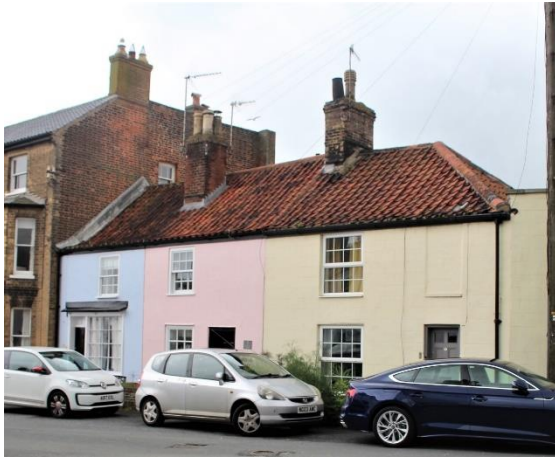
Nos.3-7 (Odd) St James Green

Nos.3-7 (Odd) St James Green (Positive Unlisted Buildings). A terrace of three late eighteenth or early nineteenth century cottages of rendered brick with a red pan tile roof. No.3 with preserved former shop fascia to ground floor and twelve light sash above. No.5 also has twelve light sashes but those to No.7 have been replaced with unsympathetic UPVC units.