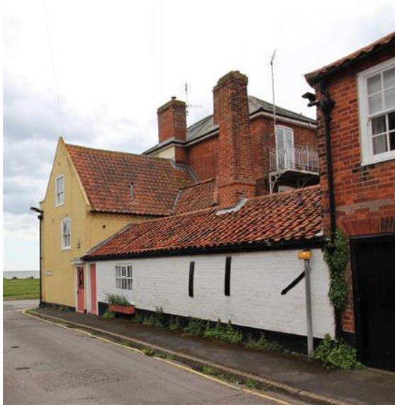
No.7 South Green, Park Road elevation

Horned plate glass sash windows within chamfered surrounds. Brick dentil course of diamond set bricks, a detail repeated to the bay window. Hipped slate roof with stout red brick stack to the north end.