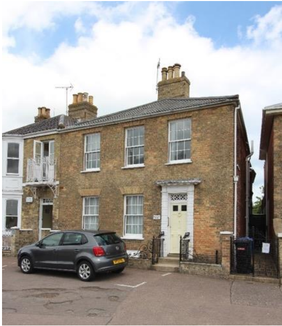
South Green Cottage, No.6 South Green