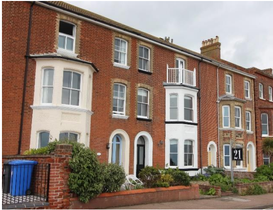
Nos. 20-22 (cons) North Parade

Nos. 20-22 (cons) North Parade (Positive Unlisted Buildings). Three substantial dwellings of red brick, with gault, or Suffolk white brick window surrounds which form part of a terrace with Nos.18 & 19 and like them probably date from c.1894. Of three storeys and two bays each. Each house has a two-storey canted bay window, those to Nos.20 & 21 are now rendered. Arched front doors in moulded surrounds with partially glazed front doors. Window joinery to No.22 replaced, the other houses retain four light horned plate-glass sashes. No.21 has had its chimney stack removed. Later twentieth century dwarf brick boundary walls to North Parade. No.22 was a hotel in 1911 according to census returns and No. 21 apartments. Nos.21 & 22 are described as 'apartments' in Kelly's 1916 Directory.