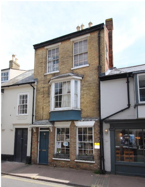
No.10 Queen Street