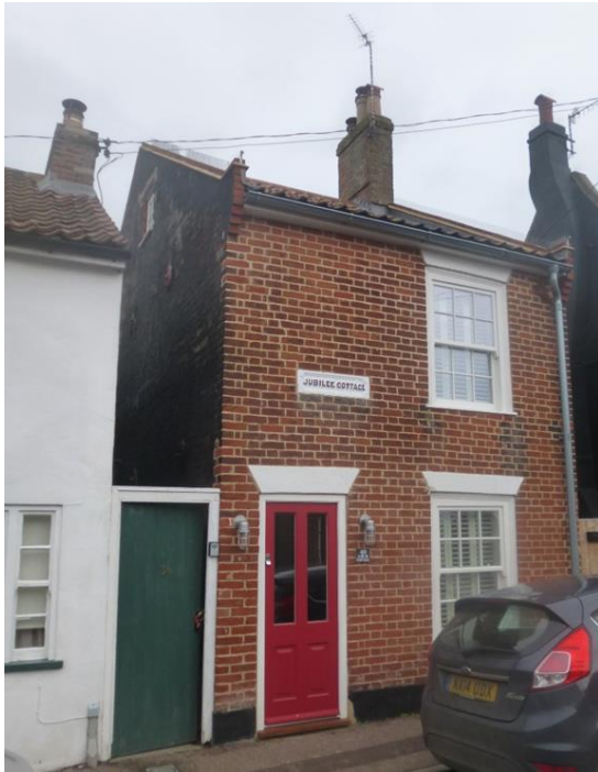
Jubilee Cottage, No. 40 Victoria Street

Jubilee Cottage, No. 40 Victoria Street (Positive Unlisted Buildings). 19 th century origin and may have been built around the time of Queen Victoria's Golden Jubilee in 1887. It is two-storey in red brick with red pantiles and a gable chimney at the ridge. The house is positioned at the back edge of the pavement and contributes valuably to a residential streetscene of continuous built frontage with an attractive and strongly historic character, that includes 18 th and 19 th century houses on either side.