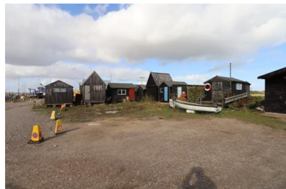
W3 to W10, Blackshore