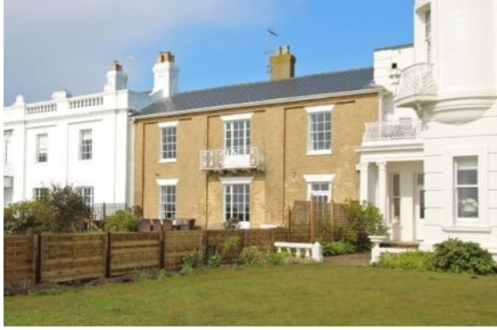
Centre Cliff, No.3 South Green