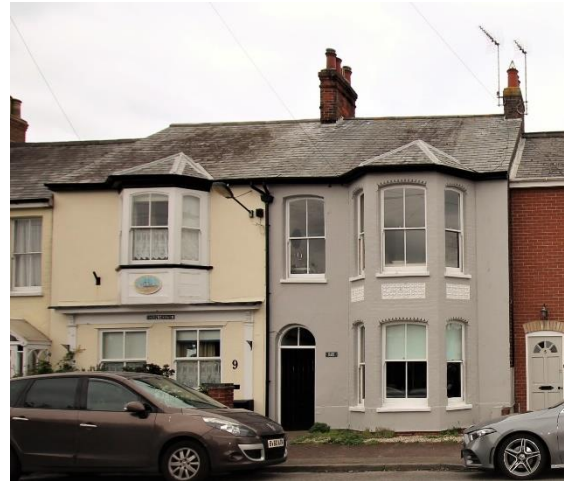
Nos.7 & 9 Stradbroke Road

Nos.7 & 9 Stradbroke Road (Positive Unlisted Buildings). A house and former shop of c.1895 of painted red brick with a Welsh slate roof and overhanging eaves. (The site is shown as vacant on a dated photograph of October 1893 in the possession of Southwold Museum). The plots were however ones auctioned by the Corporation in August 1885 with the stipulation that a house or shop costing no less than two hundred and fifty pounds be constructed on each. Old photographs suggest that No.9 also had gault or Suffolk white brick dressings. No.7 retains a simple c.1900 former shop fascia with pilasters which is now infilled, and a canted oriel window above, with horned plate-glass sashes. No.9 has a two-storey canted bay window with horned plate-glass sashes. Arched doorway with plate-glass fanlight