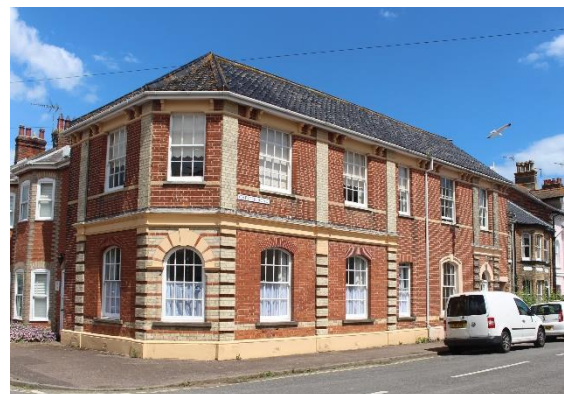
No.11 Chester Road

Nos.7 & 9A-9C Chester Road (Positive Unlisted Buildings). A pair of houses built on plots sold by Southwold Corporation in 1885 with the provision that houses costing no less than three hundred pounds should be built upon them. Map evidence suggests that they were built between 1891 and 1904, whilst at least two houses were occupied by the time of the 1891 census. They are similar in design to No.4 Dunwich Road. Save for No.16, the houses on Chester Road were probably constructed by the same builder. Red brick with elaborate gault brick dressings and pilasters. Two storeys and two bays with original horned plate-glass sashes. Reroofed in black pan tiles. Small red brick stacks rise from the spine wall between the two properties. Partially glazed front doors beneath arched fanlights. Railings removed. John Miller Britain in Old Photographs: Southwold (Stroud 1999) p87.