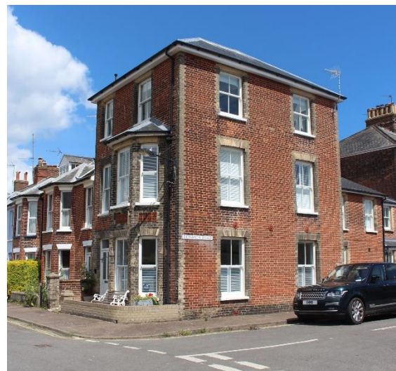
No.19 Stradbroke Road

Nos.7 & 9 Stradbroke Road (Positive Unlisted Buildings). A house and former shop of c.1895 of painted red brick with a Welsh slate roof and overhanging eaves. (The site is shown as vacant on a dated photograph of October 1893 in the possession of Southwold Museum). The plots were however ones auctioned by the Corporation in August 1885 with the stipulation that a house or shop costing no less than two hundred and fifty pounds be constructed on each. Old photographs suggest that No.9 also had gault or Suffolk white brick dressings. No.7 retains a simple c.1900 former shop fascia with pilasters which is now infilled, and a canted oriel window above, with horned plate-glass sashes. No.9 has a two-storey canted bay window with horned plate-glass sashes. Arched doorway with plate-glass fanlight