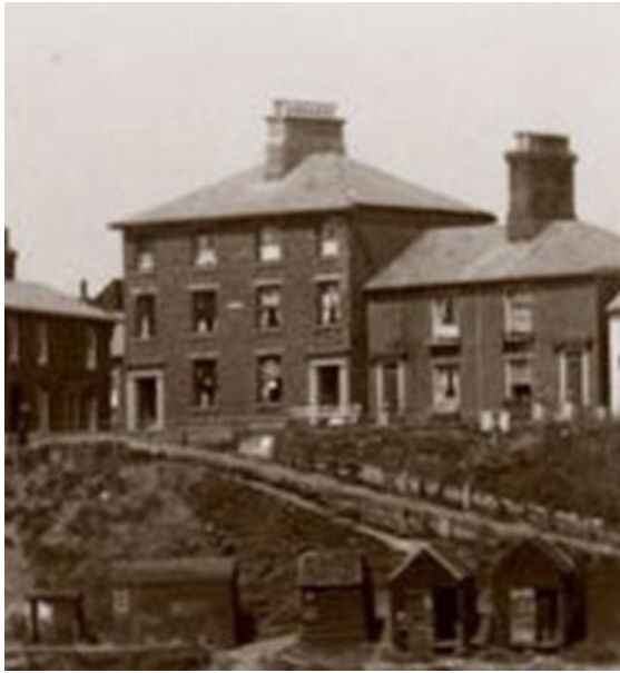
Nos.10-13 Before alteration c.1910.