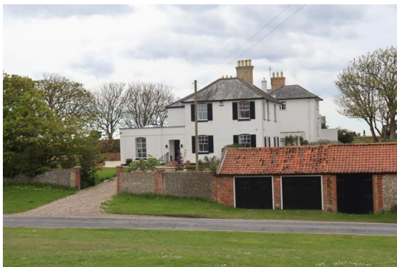
Gun Hill House, Gun Hill

Gun Hill House, Gun Hill (Positive Unlisted Building). Formerly the rear section of the adjoining villa known as Gun Hill Place, but physically separated from it by the villa's partial demolition in the 1950s. Gun Hill House, like Gun Hill Place, was originally built c.1807-1809, but it was radically remodelled and extended c.1900 probably for Charles and Charlotte Foster. A prominent landmark in views looking south and east on Constitution Hill. Painted Suffolk white brick with a hipped Welsh slate roof and overhanging eaves. Window joinery of unusual design consisting of sashes with a two paned plate-glass lower section and a six paned upper section, horned and probably dating from c.1900. Shutters and shallow arched brick lintels. Single storey wing to the side, with expressed brick quoins to the open porch and garden room addition, designed by Paul Bradley, 2016.