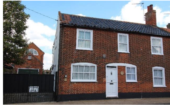
No.8 Victoria Street and outbuilding

For Adnams Shop and Café see Tibby's Triangle