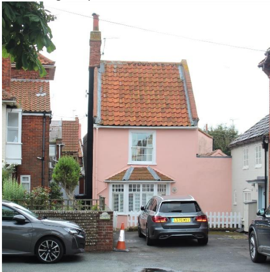
No.19 St James Green

No.17 St James Green (Positive Unlisted Building). A small painted brick cottage of later eighteenth or early nineteenth century date. Dentilled brick eaves cornice and a black pan tile roof. Original gently arched openings to ground floor windows preserved although now filled with twentieth century casements. Two small late twentieth century casements above. Boarded front door with hood. Mid twentieth century single storey addition to rear with a flat roof which terminates in a bow window. Outbuilding Two storey red brick outbuilding to rear of red brick with a red pan tiled roof. A single bay wide a boarded door.