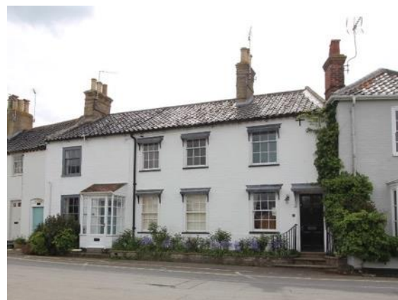
The Bolt Hole, No.10 and Wayside Cottage, No.12 Queens Road