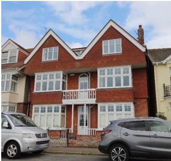
Barnaby Lodge, No.5 Godyll Road

Barnaby Lodge, Godyll Road (Positive Unlisted Building). A large detached villa, first shown on the 1904 Ordnance Survey map (1:2,500). Compositionally similar to No.1 and No.2 Godyll Road although differing in material use and detailing. Central entrance with balustraded balcony over, flanked by two storey square bay windows. The first floor carries out over the bays with a pair of tile hung gable ends. Regrettably the house has lost much of the joinery evident in historic photos, but the form and skill of the original design remains apparent.