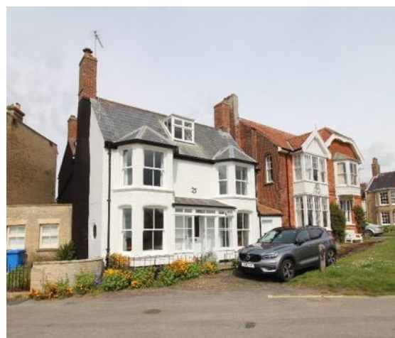
Tudor Cottage, No.25 South Green

No.23 South Green (Positive Unlisted Building). A building of two parts; the right hand section dates from the end of the 19 th century, the left hand section was constructed in 1903 and replaced a single story structure that latterly had been used as the office for the Southwold Salt Works. The taller and older right hand section has a hipped roof gable end and pierced bargeboard arrangement similar to that opposite at Acton Lodge. The north elevation has a centrally located door, with a projecting red brick stack to the left and plate glass sash windows above and to the sides. Each opening has a stone lintel over (now painted) with expressed key stone. Strong course of diamond set bricks. The 1903 addition is dominated by a two storey square bay window, with sash windows with divided upper leaf and plate glass below. To the apron of the bay, between the ground floor heads and first floor sill, is an escutcheon carrying the Southwold coat of arms and the date 1673, indicating a possible connection between the site and the original location of Southwold's Town Hall.