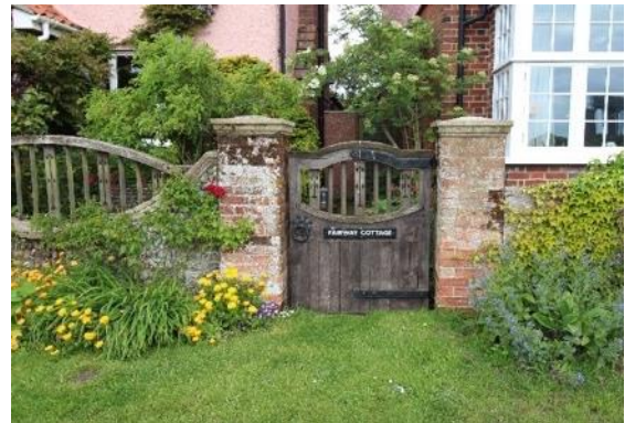
Timber hand gate, Fairway Cottage, The Common

To the west is a cobble boundary wall with stone caps that rises and falls in height, with mirrored timber balusters and cap. The capped brick piers form a part of an established run, see Spinners Cottage and Rope Walk Cottage, Spinners Lane . To the entrance of Fairway Cottage is a hardwood hand gate, the design of which reflects the wall and timber upper section, with shaped iron strap hinges and elaborate ring handle.