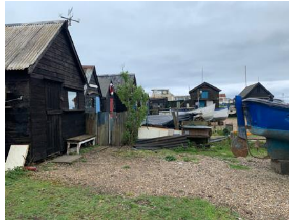
General view of huts W12 to W22, looking south east