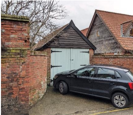
Garage to No.7 Queen Street

Garage to No.7 Queen Street (Positive Unlisted Building). Late-20th century small garage with gable to the street. Built of red brick with red pantile roof and dark stained waney edge timber gable. The structure contributes to the street through its modest Arts and Crafts inspired charm.