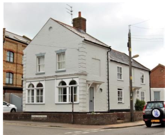
No.2 High Street, Field Stile Road elevation