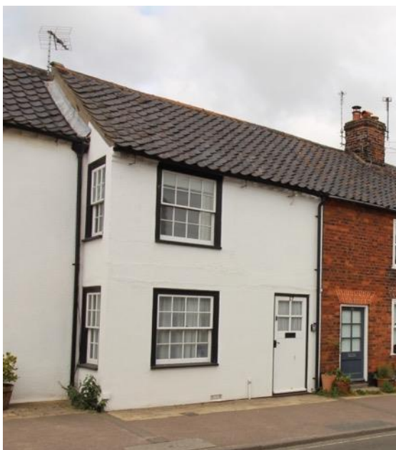
No.17 High Street

No.17, High Street (Positive Unlisted Building). Formerly a Grade II listed building but delisted at the time of the last resurvey. A cottage of c.1800 with some later twentieth century alterations which contributes significantly to the setting of adjoining listed buildings. Of painted red brick with a black pan tile roof and replacement sixteen light