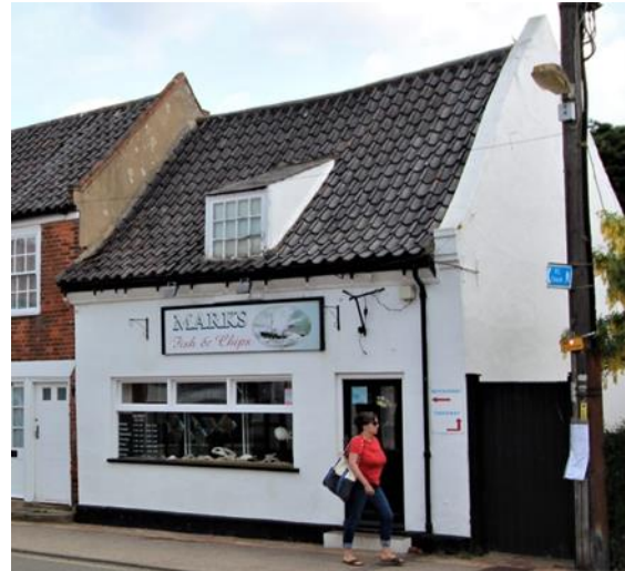
No.32 High Street

Sycamore Cottage, No.26 A High Street (Positive Unlisted Buildings). House, probably of early nineteenth century date, latterly office and now again a dwelling. Red brick with a weatherboarded northern return wall, and a black glazed pan tile roof. Façade possibly at least partially rebuilt. Twelve-light sashes beneath wedge-shaped lintels. Ridge stack rising from spine wall with No.28. Forms part of a short terrace with Nos. 28 & 30