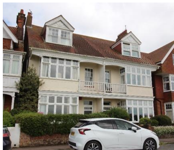
Waverley, No.3 (left) and West Lea, No.4 (right) Godyll Road

Windles and St Mary's House, Godyll Road (Positive Unlisted Building). A pair of late 19 th or early 20 th century villas, now a single house. Skillful and imaginatively composed and benefitting from much high quality joinery and detailing. A two storey red brick house with a pair of prominent attic gables; eaves supported on brackets with projecting windows also on brackets. To the ground floor are a pair of canted bays with original window joinery and above, and off-set to the extreme ends of the elevation, are a pair of flat-roofed bay windows. Linking the two is a balustraded balcony, supported below by timber columns on pedestal bases. Between each column is a gently curved soffit to the underside of the balcony. Historic photos show the first floor square bays to be later additions, and the brickwork to the first floor shows the scarring of further alterations. However, the house retains much original door, window and balcony joinery and makes a strong and highly visible contribution to view of the conservation area from the east.