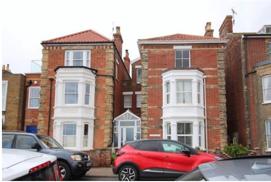
Flats 1-3 Rochester House No.11, & No.13 Marlborough Road

Flats 1-3 Rochester House No.11, & No.13 Marlborough Road (Positive Unlisted Buildings). A pair of substantial three storey houses of c.1890 which were partially rebuilt after considerable bomb damage in 1943. The neighbouring buildings to the immediate south were destroyed in the same raid. Red brick with gault brick quoins and dressings and a red pan tile roof. Horned plate-glass sashes with margin lights to canted bays. Three storeys with two storey canted bay windows a narrow recessed central range. Glazed later twentieth century porch. Dwarf red brick boundary walls to Marlborough Road. Jenkins, A Barrett Reminiscences of Southwold During Two World Wars (Southwold, 1984) p67.