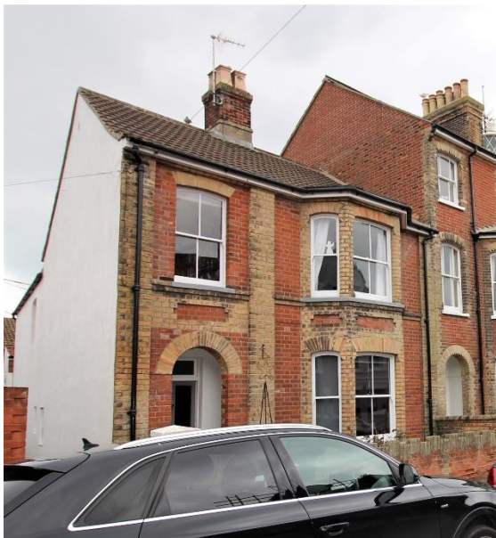
No.2 Chester Road

'Dobcott' Chester Road – see No.6 North Parade