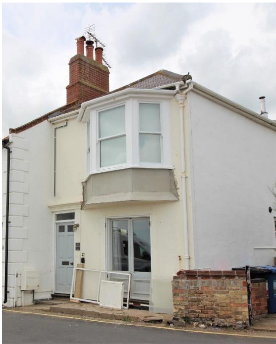
Bay Cottage, No.17A East Cliff

wooden frames they were however remodelled in the early twentieth century to form shops. Surprisingly the distinctive upper floor windows to No.16 appear on a National Monuments Record photograph of 1949 (BB49/3043) and probably therefore also date from this early twentieth century remodelling. The distinctive early twentieth century remodelling of No.17 has similarities to that of other properties located on Lorne Road and on Queen Street. Former shop window with horned plate-glass sashes, above are two early twentieth century window openings containing later twentieth century casements. The plaster quoins are of early twentieth century date.