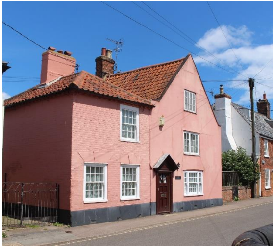
Nos.20 & 22 Victoria Street

The Old Royal, Nos.20 & 22 Victoria Street and outbuilding (Positive Unlisted Building). Former Royal Public House (originally the White Lion) closed 1980s. Possibly early eighteenth-century gabled range with an early c.19th painted red brick former cottage (No.20) attached to its northern end. The two properties had been combined by the mid twentieth century, and now function as one dwelling. Cottage front door formerly in left hand bay on street façade. Late twentieth century pedimented doorcase surrounding historic door opening in gabled range of gabled section, with late twentieth century door within. The ground floor window is a tripartite sash beneath a shallow brick arched lintel. Small pane casement windows above. Cottage elevation with rendered wedge-shaped lintels with pronounced keystones replaced small pane sashes. Two storey canted bay window with small pane sashes to south-eastern elevation, partially clad in timber. Red brick garden wall to southeast enclosing garden of post 1950 date which occupies the site of the demolished war damaged No.24. Small single storey red pan tiled outbuilding of c.1800 or earlier date to the rear of No.20.