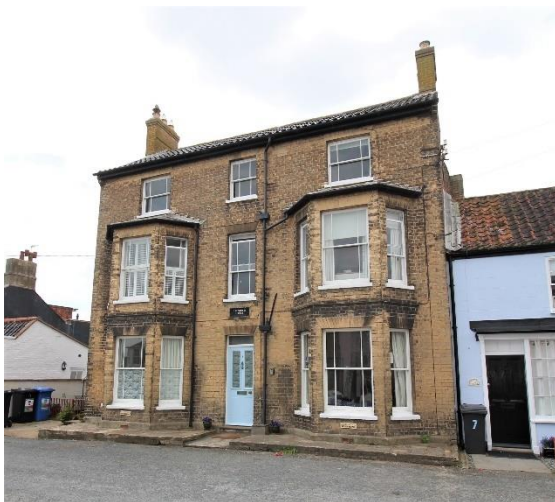
Caithness House, No.9 & 9B St James Green

Nos.3-7 (Odd) St James Green (Positive Unlisted Buildings). A terrace of three late eighteenth or early nineteenth century cottages of rendered brick with a red pan tile roof. No.3 with preserved former shop fascia to ground floor and twelve light sash above. No.5 also has twelve light sashes but those to No.7 have been replaced with unsympathetic UPVC units.