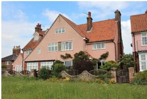
Commoners (left) and Fairway Cottage (right) and boundary wall, gate and timber screen, The Common

Spinners Cottage and Ropewalk Cottage – See Spinners Lane