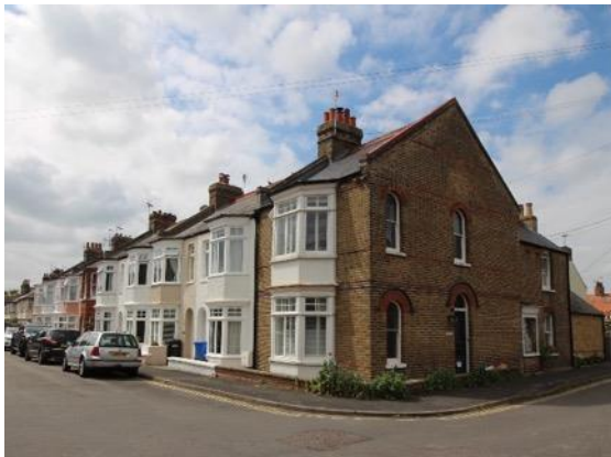
Nos.1-10 (cons), Wymering Road

structure, built c.1922. Plain principal elevation facing Wymering Road, with an unbroken red clay pan tile roof, and broad ground floor openings under flat gauged brick arches. The western end is more spirited where it turns the corner onto Blackmill Road and the accommodation becomes storey and a half, with a pair of dormer windows facing west. Prominent asymmetrical gable end facing Wymering Road. Windows are all replacement units. Forms an important part of the former school complex.