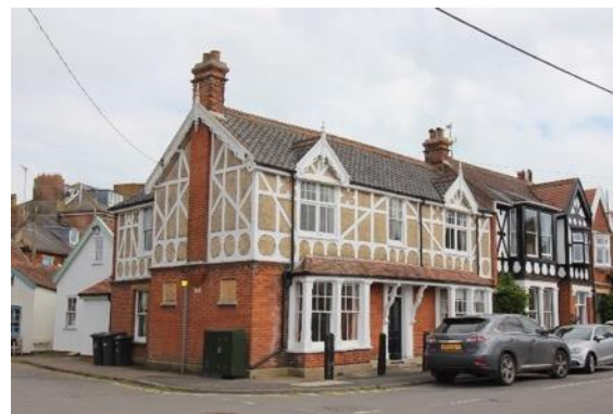
No.1, Manor Park Road

No.1, Manor Park Road (Positive Unlisted Building). A distinguished villa of 1906, located to the corner of Manor Park Road and Blackmill Road. Symmetrical principal façade with central entrance between elaborate timber brackets supporting a plain tiled roof that extends over flanking single storey bay windows. Exposed red brick to the ground floor and applied half timbering with render panels to the first floor, attractively detailed, with chamfer and quatrefoil panels. Elaborate carved and finialed bargeboards to the first floor gables. Black glazed pan tile roof with decorative ridge tiles. Red brick stacks to the north and south gable ends.