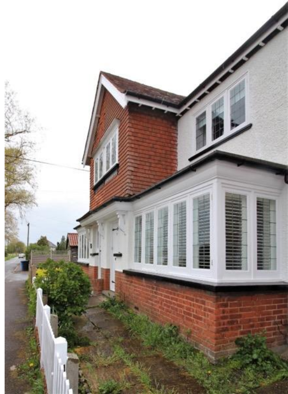
Nos.27 & 29 North Road

Nos.1-19 (Odd) North Road (Positive Unlisted Buildings). Balanced composition of five well preserved pairs of semidetached houses which were constructed to a largely uniform design c.1928. Rendered brick with horned plate-glass sash windows and plain tile roofs to porches and bay windows. Principal roof slopes of red pan tiles. Bay windows with sashes divided by mullions to the ground floors. The central pair of houses have additional embellishments including continuous wooden porches which also provide a roof for the ground floor bay windows. Partially glazed front doors. Red brick ridge stack rising from the spine wall between each pair of houses. Dwarf red brick boundary walls to frontage.