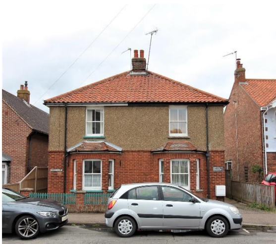
Good Hope and Coniston, Field Stile Road

Good Hope and Coniston, Field Stile Road (Positive Unlisted Buildings). A semi-detached pair of cottages which were built to a highly conservative design in the late 1920s (the site appears undeveloped on the 1927 1:2,500 Ordnance Survey map). Red brick with pebbledashed first floor and a red pan tile roof. Central ridge stack rising from spine wall. Four light plate-glass horned sashes retained. Arched doorways set within otherwise largely blind return elevations. Possibly early public housing.