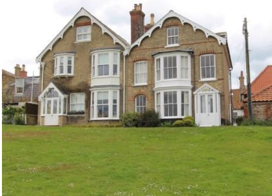
Poppy Cottage (left) and Caneway Cottage (right), Skilmans Hill

Castle Keep, Skilmans Hill (Positive Unlisted Structure). Behind the flint and brick boundary wall, only the roofs of the main house and outbuildings are visible. Hipped red pantile roof and black weatherboarding on main house. Provides a bookend to the line of buildings on the south side of Skilmans Hill.