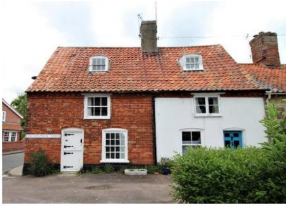
Nos.1 & 2 Bartholomew Green