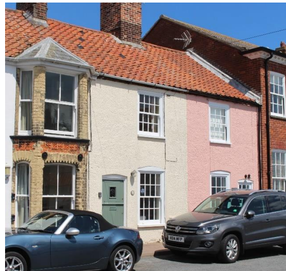
Nos.18 & 20 St James Green

Nos.14 & 16 St James Green (Positive Unlisted Buildings). Part of an early nineteenth century red brick terrace also comprising Nos. 18 & 20. Canted bay windows of red brick with Suffolk white brick dressings were added c.1890. Heavy replacement sashes to No.14. The remainder of the façade was later rendered. Red pan tile roof. Early nineteenth century door openings with shallow brick arched lintels survive but with later twentieth century partially glazed front doors.