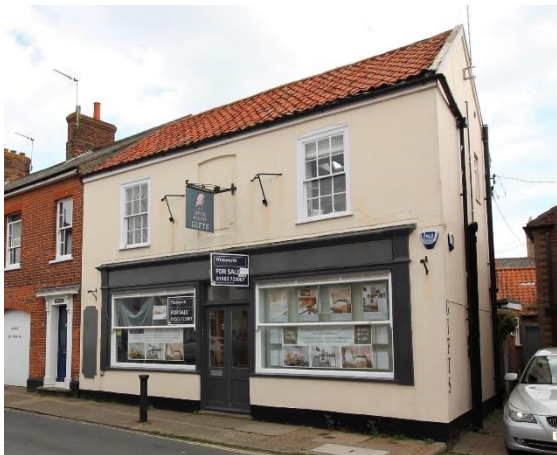
No.9 Trinity Street

Nelson House, No.5 Trinity Street (Positive Unlisted Building). Red brick dwelling dated on its façade to 1876, the datestone also bearing the initials W.F.L. This may however relate to alterations rather than the original date of construction. Dentilled brick eaves cornice. Originally a shop and dwelling and with a shallow arched brick lintel for a large opening located above where the present door and adjacent window are located. First floor window openings with wedge-shaped rubbed brick lintels. The ground floor windows are probably all relatively recent interventions replacing a shop fascia. Small pane sashes to first floor with horned plate-glass sashes to ground floor. Late twentieth century rear addition.