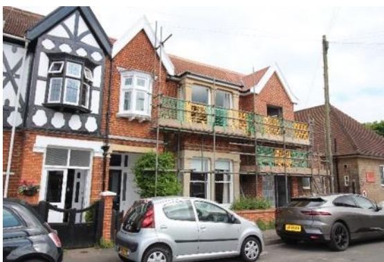
No.3 Manor Park Road

Nos.2 and 3, Manor Park Road (Positive Unlisted Building). Pair of early 20 th century houses, originally symmetrical but now with contrasting elevations. Entrances grouped to the centre, below an oriel window and gable over. To the side of each entrance is a two storey square bay window with pilasters to the ground floor. No.2 is half-timbered (like its neighbour, No.1), whereas No.3 is of red brick which sets the tone for the houses in