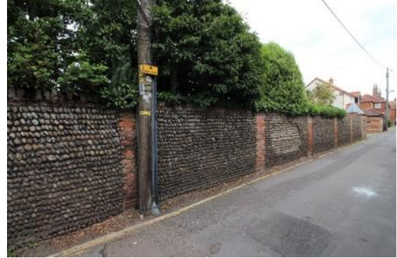
Boundary Wall to No.7 Mill Lane

The Old Chapel, No.5 Mill Lane (Grade II)