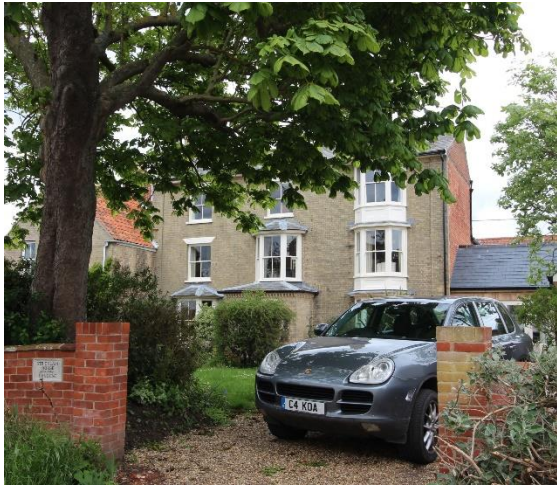
Strickland House, No.25 Park Lane