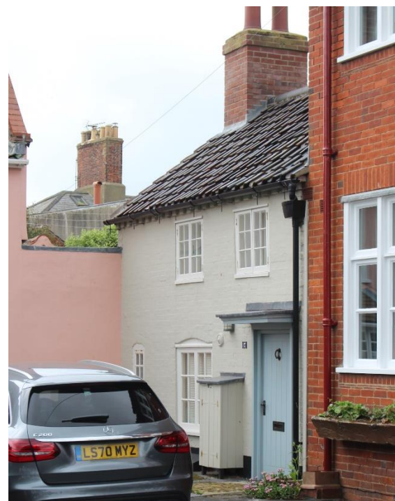
No.17 St James Green

Adelaide Cottage, St James Green (Positive Unlisted Building). Early nineteenth century single-storey dwelling of rendered and painted brick with a black pan tiled roof. Possibly a nineteenth century re-fronting of an earlier cottage. Lead roofed canted bay windows to rendered principal façade with horned plate-glass sashes, parapet above hiding roof slope. Gabled painted brick return elevation containing front door. Tall, rendered chimneystack. Less sympathetic late twentieth century railings to front.