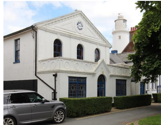
Methodist Chapel, East Green

wooden casement windows. Single storey with a pedimented central bay containing a large arched window divided by mullions and transoms. To the right a pair of casement windows with hood moulds, whilst to the left is a gabled porch containing a pair of panelled doors and a similar window. Miller, John Britain In Old Photographs, Southwold (Stroud, 1999) p101.