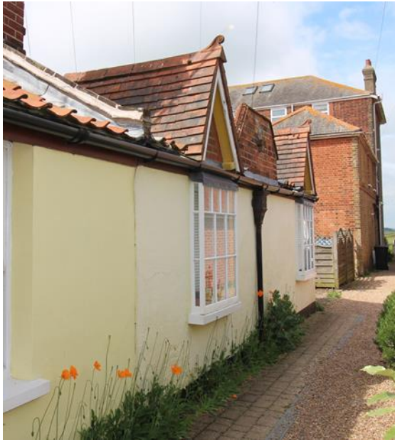
Mill Cottage, western end, located to footpath off Godyll Road