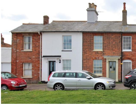
Nos.7 & 8 East Cliff showing late twentieth century addition to left.