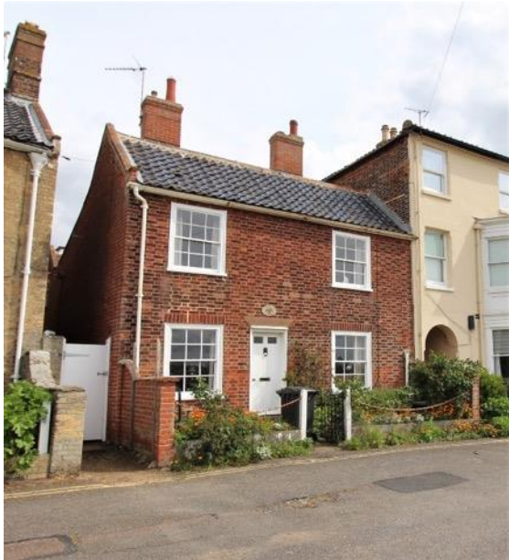
Dartmouth Cottage, No.11 South Green

glass sash windows. Arched entrance to the left side providing access to the rear.