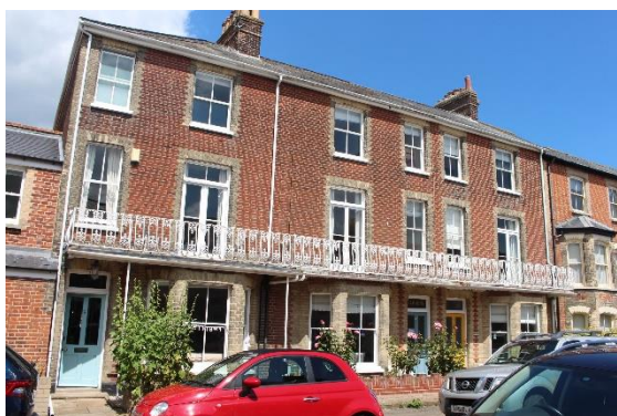
Nos. 5-9 (Odd), Dunwich Road

Wye Cottage No.1 & No.3 Dunwich Road (Positive Unlisted Buildings). A pair of substantial three storey houses with some similarities to Nos.4-10 (even) Chester Road and Nos.15-19 (Odd) Marlborough Road. Built sometime between the publication of the 1891 and 1904 Ordnance Survey maps. Red brick with elaborate gault brick dressings. Two storey canted bay windows retaining original plate-glass horned sashes. Front doors set within arched openings that to No.1 now with a late twentieth century glazed wooden porch. No.1 also has plate-glass sashes in its eastern return wall. This property is likely to have suffered bomb damage in World War Two as the neighbouring now demolished Marlborough Hotel was very badly damaged in 1943.