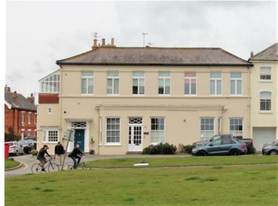
The Homestead, South Green

Horned plate glass sash windows within chamfered surrounds. Brick dentil course of diamond set bricks, a detail repeated to the bay window. Hipped slate roof with stout red brick stack to the north end.