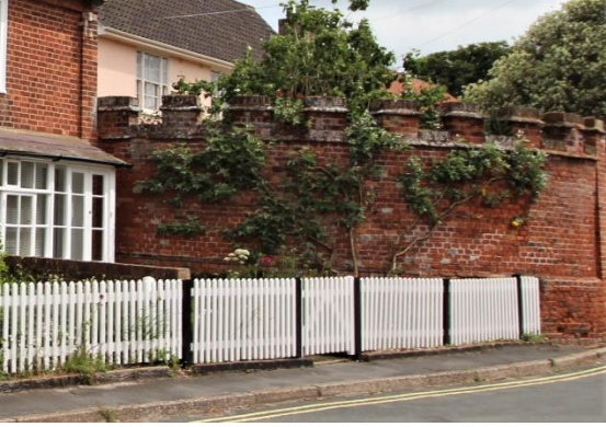
Western Section of Garden Wall to No.9B Lorne Road