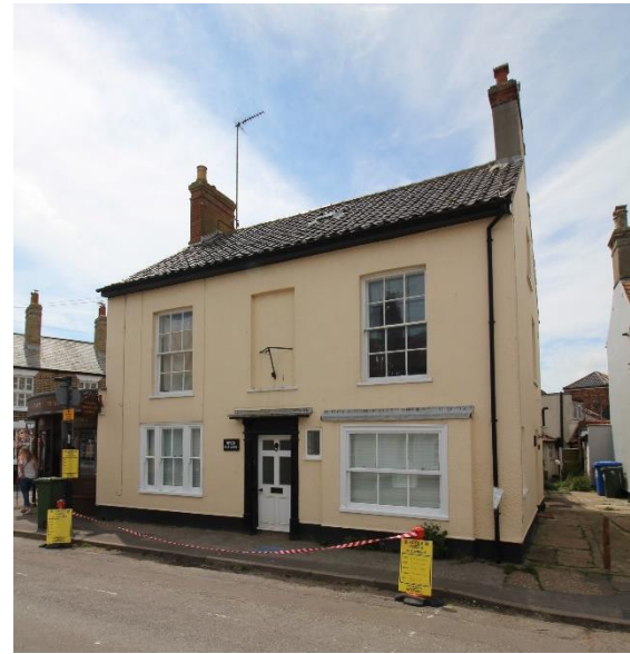
East Lodge & Upper East Lodge, East Street

second floor are of plate-glass with narrow margin lights.