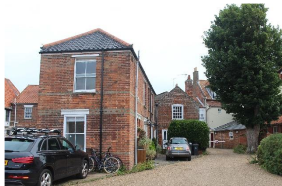
Rear of Nos.77 & 79 High Street from Buckenham Court.

Nos.77 & 79 High Street (Positive Unlisted Buildings). Two late nineteenth century shops of red brick with painted stone dressings. Originally built as houses. Glazed black pan tiled roof. Horned plate glass sashes. Red brick ridge stacks. Simple wooden shop facias with pilasters of c.1900. Southern section of No.79 contains a courtyard entrance with a large casement window above. Substantial red brick rear wing to No.77 with four light plate-glass sashes. Jenkins, A Barrett, A Visit to Southwold, Containing Over 150 Photographs of Historic Interest (Southwold, 1984) p15.