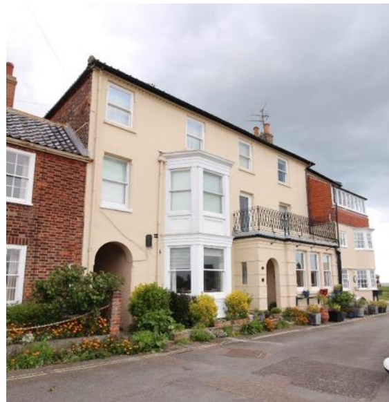
No's 1 & 2 'The Homestead', South Green

No.5 'Westbury House', South Green (Positive Unlisted Building). Three storey painted brick villa, dating from the late 19 th century. Historic photos show this as red brick with stone dressings and string courses. Now entirely residential, the left hand section (now garage doors to No.7 'The Homestead') operated as a wine shop with a separate entrance during the early 20 th century. Central entrance now under a bracketed timber canopy, with two storey canted bay to the right.