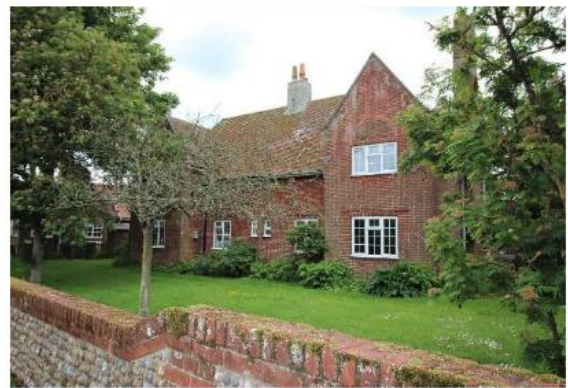
Nos.9 & 11 Bartholomew Green