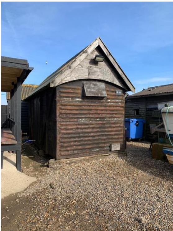
E16, Blackshore, former ventilated goods wagon repurposed as a hut

E16, Blackshore A former goods truck with corrugated ventilated ends, now used as a store. New pitched roof replaced the original curved structure. Timber sides, with taking in door.