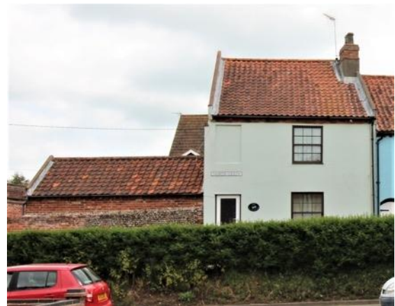
No.1 North Green and boundary wall

No.1 North Green and boundary wall (Positive Unlisted Building). Rendered red brick cottage probably of early to mid nineteenth century date with red pan tile roof. Dentilled brick eaves cornice. Late twentieth century replacement twelve-light hornless sash windows and late twentieth century glazed front door. Decorative blind recess in form of window above door. Late twentieth century single-storey pantile roofed addition to north. Notable probably nineteenth century cobble short section of boundary wall to North Green with red brick quoins which springs from northern end of principal façade. Its northern extension is entirely of red brick but may also be of nineteenth century