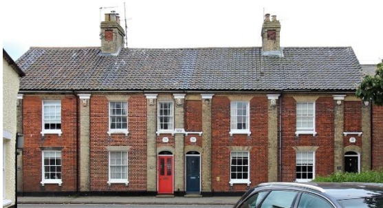
Nos.31-37 (Odd) Victoria Street

Victoria Buildings, Nos.13-29 (Odd), Victoria Street (Positive Unlisted Buildings). A well-preserved symmetrical terrace of nine cottages which probably date from the mid nineteenth century. Red brick with scoured wedge-shaped plaster lintels. Shallow pitched Welsh slate roof with overhanging eaves. Panelled doors beneath narrow rectangular fanlights. Central corbelled archway leading to rear yards with pronounced key stone. Hornless twelve light sashes. Substantial ridge stacks rising from the spine walls between the dwellings. The terrace contributes significantly to the setting of the Grade II listed Museum building to its immediate north and to that of the listed houses on Bartholomew Green opposite.