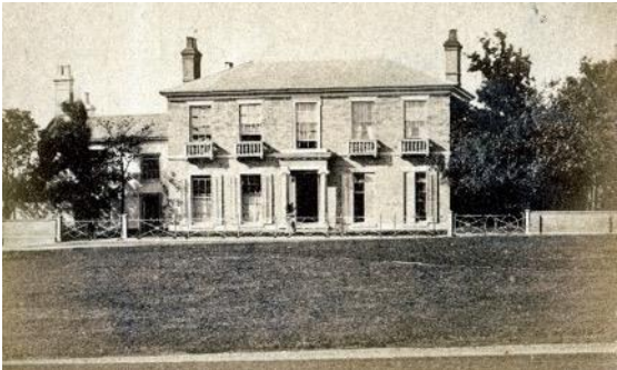
Undated postcard of Hill House, prior to the addition of the attic floor.