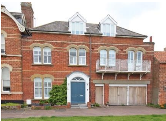
Eastbury House, No.18A South Green

See Bettley, J and Pevsner, N The Buildings of England, Suffolk: East (2015), p.522.