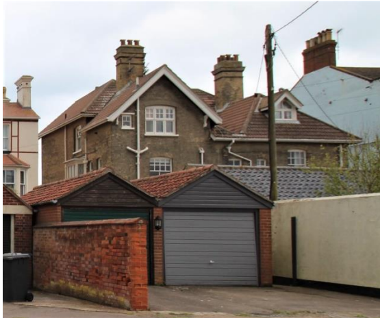
Strathmore House, No.26 North Parade from Field Stile Road

an arched doorway with plate-glass fanlight. Outer bays have canted bay windows beneath projecting gables. Southern and northern return elevations with oriel window resting on decorative brackets. Rear elevation visible from Field Stile Road has a gabled dormer window with bargeboards and projecting eaves. Original gault brick front garden walls to south and east with square-section gate piers. High rendered garden walls to rear. See Southwold and Son website for further details.