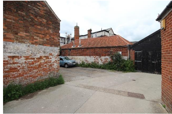
Former Outbuilding at rear of The Crown, High Street

major coaching inn. This range also forms part of the immediate setting of the listed houses on the western side of Church Street.