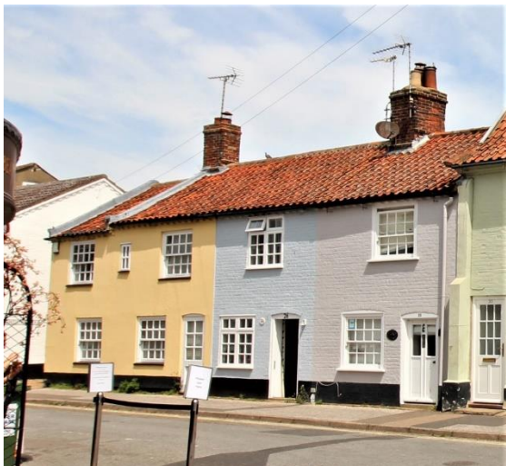
Nos.22-28 (even) East Street

Nos.22-28 (even) East Street (Positive Unlisted Buildings). An altered row of early nineteenth century cottages which nevertheless make a positive contribution to the setting of the adjoining Grade II listed Nos. 30 & 34. Of painted red brick with a red pan tile roof. No.28 is the most intact of the cottages, retaining all of its original window and door openings which have shallow arched lintels.