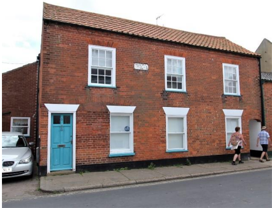
Nelson House, No.5 Trinity Street

Nelson House, No.5 Trinity Street (Positive Unlisted Building). Red brick dwelling dated on its façade to 1876, the datestone also bearing the initials W.F.L. This may however relate to alterations rather than the original date of construction. Dentilled brick eaves cornice. Originally a shop and dwelling and with a shallow arched brick lintel for a large opening located above where the present door and adjacent window are located. First floor window openings with wedge-shaped rubbed brick lintels. The ground floor windows are probably all relatively recent interventions replacing a shop fascia. Small pane sashes to first floor with horned plate-glass sashes to ground floor. Late twentieth century rear addition.