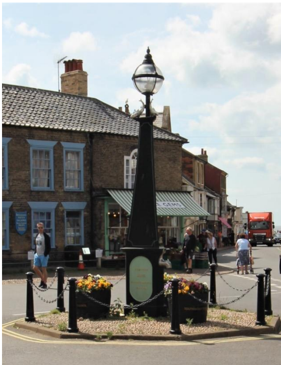
Town Pump, Market Place