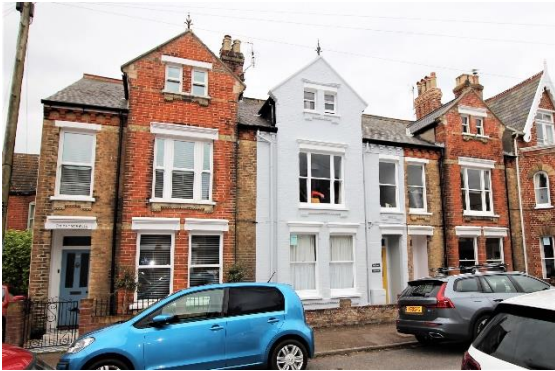
Nos.40-44 (even) Stradbroke Road

canted bay window and horned plate-glass sashes. Recessed porches with arched openings. High red brick boundary walls between properties