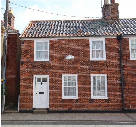
Sycamore Cottage No.26A High Street

Sycamore Cottage, No.26 A High Street (Positive Unlisted Buildings). House, probably of early nineteenth century date, latterly office and now again a dwelling. Red brick with a weatherboarded northern return wall, and a black glazed pan tile roof. Façade possibly at least partially rebuilt. Twelve-light sashes beneath wedge-shaped lintels. Ridge stack rising from spine wall with No.28. Forms part of a short terrace with Nos. 28 & 30