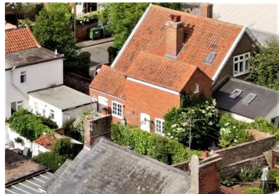
Outbuilding at 8 Victoria Street from church tower

The Old Bakehouse, No. 8 Victoria Street (Positive Unlisted Building). An early to mid-nineteenth century red brick structure with a blacked glazed pan tiled roof slope to the Victoria Street frontage and a red pan tiled slope to the rear. Occupied as a bakery by the 1880s and in use as such until the 1950s. Horned plate-glass sashes in heavy moulded frames to the first floor. A single plate-glass sash beneath a shallow arched brick lintel to the southern end of the ground floor. Large blocked shallow arched opening to centre of façade now containing a panelled door and small sash. Large nineteenth century casement to northern end which possibly functioned as a shop window. Rendered northern return elevation. Flat roofed rear additions of mid to late twentieth century date.