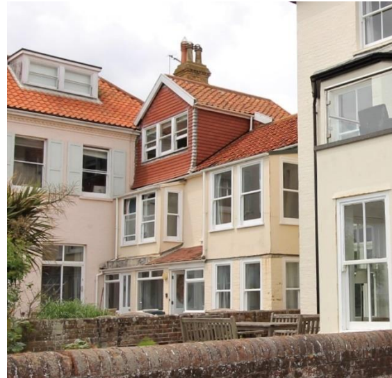
Seacroft, No.19 East Cliff

For the former No.18 East Cliff see No.21 St James Green with which it is now combined.