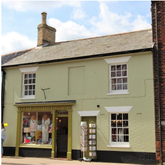
No.3 Market Place