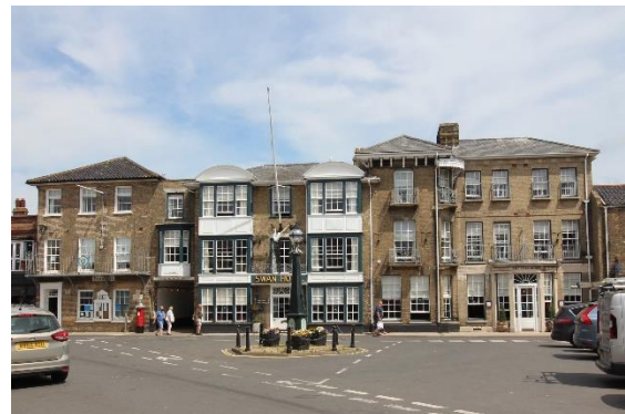
Swan Hotel, Market Place