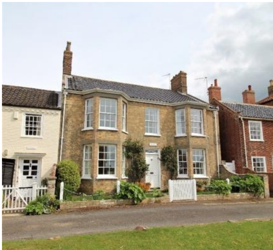
Wellesley Cottage, No.13 South Green