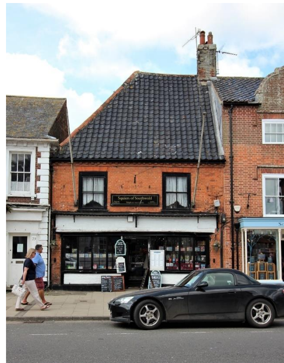
No.71 High Street