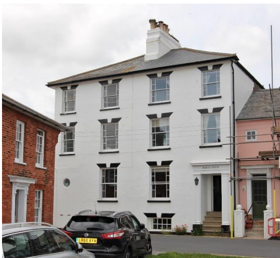
Barley Rise and Barley House, Nos.10 & 11 East Cliff

East Cliff House, No.9 East Cliff (Grade II) - see No.17 Trinity Street.