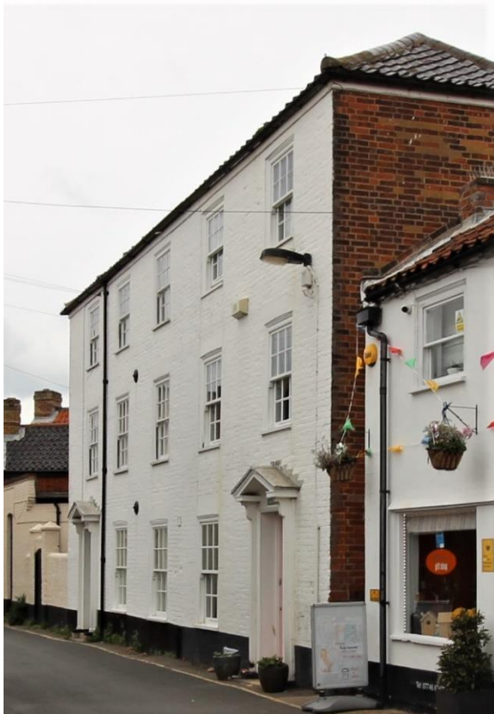
Nos.11 & 13 Pinkneys Lane

tile roof. Probably mid nineteenth century. Four light sash window to first floor. Pre 1949 shop window opening to the ground floor (shown on a National Monuments Record air photo of that year (EAW024298)). Partially glazed late twentieth century door. Later twentieth century single-storey flat roofed retail addition of unsympathetic design.