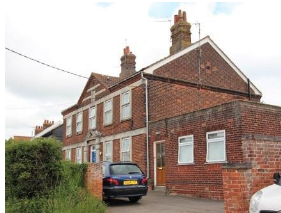
Nos. 21-27, Station Road

High Bank, Mount View and Kintyre, Station Road (Positive Unlisted Buildings). A terrace of three inter-war houses, built by the Coast Development Company on land that previously formed part of the Town Farm estate. Detailing makes reference to Blyth Hotel, particularly the square two storey bay windows and half-timbering to the gables. Red brick with rendered first floor. Pan tile roof covering with short brick ridge stacks. The replacement uPVC windows are unsympathetic, except Kintyre which fortunately retains its horned plate glass sashes. Set back from the road behind hedges and private gardens. The houses are highly visible on approach to the town owing to their elevated site.