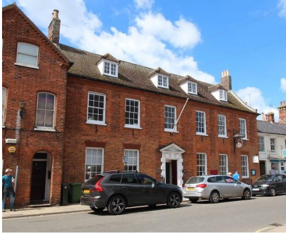
Buckenham House, Nos.81 & 83 (odd), High Street

Buckenham House, Nos.81 & 83 (odd), High Street (Grade II*)