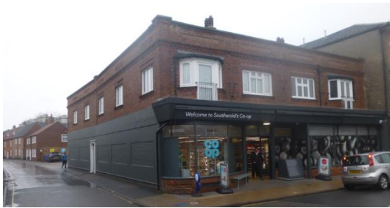
Co-operative shop, No. 2 Market Place

Co-operative shop, No. 2 Market Place (Positive Unlisted Building). Constructed around 1928 and was formed of residential first floor use above a large ground floor shop, all in brick. The ground floor shop frontage projects to allow a first-floor balcony to be formed, although the balcony arrangement is now missing. The building is austere in character with curious throwback references to 18th century architecture such as toothed eaves, panelled parapet and what had been windows with leaded lights. The original shopfront wrapped around the building and along Church Street, although the flank shopfront has now been lost. Part of the original shopfront appears to survive – just. Undoubtedly, the reduced shopfront, replacement first floor fenestration and loss of balcony have all reduced the architectural interest of this building. However, it retains a presence in the town centre and its use as a local shop is very important for the vitality of the town centre. This use contributes importantly to the character of the Conservation Area in this part of it; and the overall scale, presence and some surviving detail of the building, can be judged to make a positive contribution to the overall character and appearance of the Conservation Area.