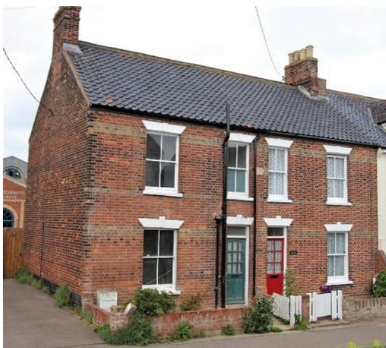
Nos.11 (right) and 13 (left), Station Road

Nos.3A to 9A, Station Road (Positive Unlisted Buildings). An early twentieth century terrace of houses, red brick, now painted. Originally the houses had recessed open porch entrances under stone half-round arches, with two storey canted bays. During the first quarter of the twentieth century shop fronts were introduced, until all canted bays were removed and the existing single storey square bays and entrances were built (probably during a program of works by the Town Council during the early 2000s). To the middle of the terrace is an opening leading to a commercial yard. Large attic dormers with shaped bargeboards. Blue glazed pan tile roof covering. The existing windows contribute to the group's character. The low brick walls and railings, seen on historic images, have long since been removed. The terrace is prominent in views looking south into the town and contributes to the structures grouped around Station Road, Pier Avenue and Blyth Road.