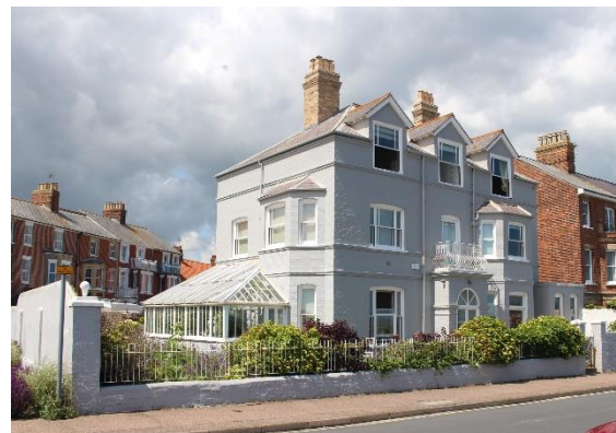
'The Mount' No.14 North Parade

unsympathetically replaced in the later twentieth century. All three were private houses in 1911 according to the census, but by 1916 directories show that No.12 was in use as apartments. No.13 was the original 'Craighurst' and later became the Craighurst Hotel. The terrace was damaged by bombs in 1941, and the balconies were probably added during reconstruction (not shown on pre-WWII pics). Converted to apartments 2001. The two-storey rear range of No.13 now forms a separate dwelling known as No.2 Dunwich Road. It has an arched recessed porch which appears to be original and one four-light plate-glass sash. First floor windows altered to allow access to the balcony. Flat roofed late twentieth century dormers in roof. John Miller Britain in Old Photographs: Southwold (Stroud 1999) p83.