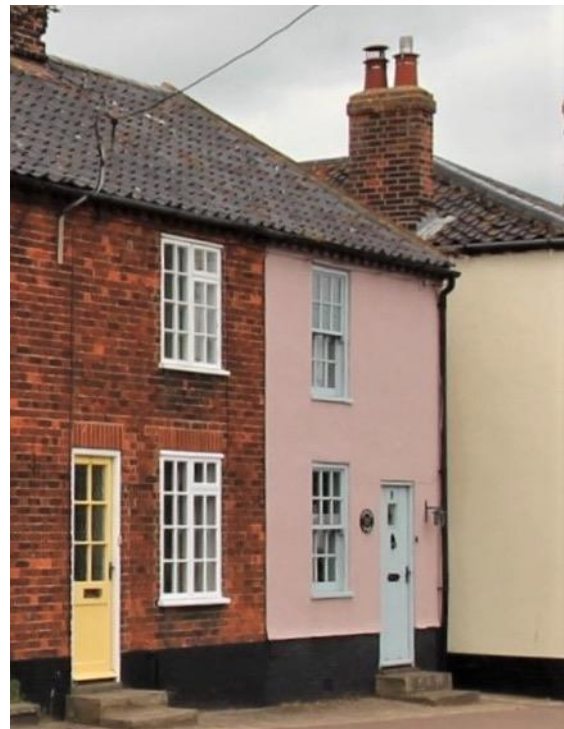
Christmas Cottage, No. 9 (right) and No.11 (left), High Street

Used from the 1930s until the 1980s as a coal merchants with coal yard to the side.