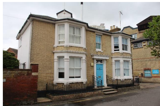
'The Brewers House', Victoria Street

Adnams Brewery, Victoria Street (Positive Unlisted Buildings). Substantial largely late nineteenth century complex including water tower with a frontage range faced in Suffolk white bricks with red brick dressings. Welsh slate roofs. Purchased by Adnams in 1895 and largely rebuilt to the designs of the accomplished brewery architects Inskipp and Mackenzie of Bedford Row London, 1897-98. They however incorporated part of a much earlier complex within their new brewery. Rear section altered in the late twentieth century. 5,000 gallon water tank of cast iron made by Braithwaites. The brewery buildings terminate views looking north along the southern section of Victoria Street. (Pearson, Lynn British Breweries, an Architectural History London: 1999 p162, and Pearson, Lynn and Anderson, Ray Gazetteer of operating pre-1940 Breweries in England Brewers History Society London: 2010). Miller, John Britain in Old Photographs, Southwold (Stroud, 1999) p98.