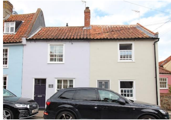
Nos.56 & 58 Victoria Street

Nos.42-54 (even), Victoria Street (Grade II)