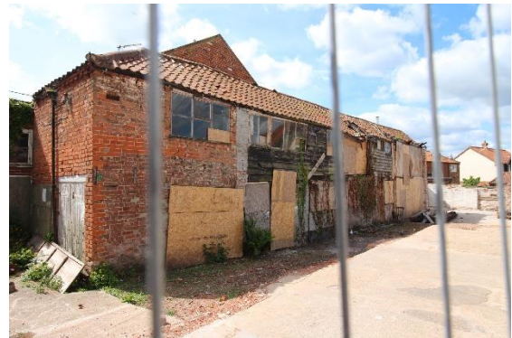
No.9 Market Place

Nos.7A and 7B Market Place (Positive Unlisted Building). A range of buildings attached to the rear of the late nineteenth century No.1 Market Place but which probably pre-date it. These cottages are shown as two separate dwellings on the 1904 1:2,500 Ordnance Survey map and that of 1971. Rendered brick with a black pan tiled roof. Twentieth century casement windows.