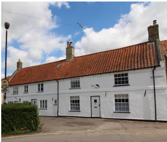
Primrose Cottage No. 7, No.8 & Dolphin Cottage No.9 North Green

factory c.1921, converted to flats in the late twentieth century. Suffolk white brick with red brick dressings and a Welsh slate roof. Central ground floor doorway on Field Stile Road elevation and taking in door at first floor level now removed along with timber clad projecting winch houses. A prominent landmark on the approach to the town from the north former part of a notable group with other listed and non-listed structures fronting onto North Green. The structure is a reflection of Southwold's former economic history.