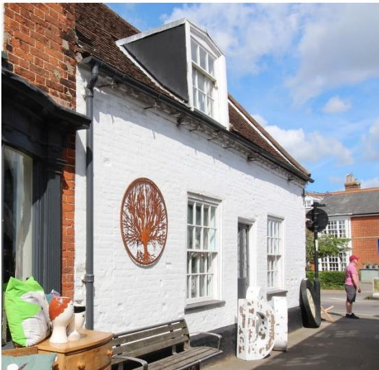
Former Kings Head Hotel, High Street