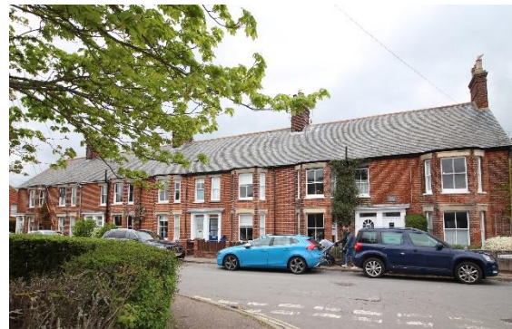
Blyth Terrace, Nos.17-23 (Cons) Field Stile Road

Nos.14-16 (cons) Field Stile Road (Positive Unlisted Buildings). Three houses, originally a semi-detached pair of c.1888, No.16 added c.2011. Red brick with elaborate Suffolk white brick dressings and plinth. Replaced, black pan tile roof. Partially glazed panelled doors beneath gabled wooden hoods resting on curved brackets. Horned plate-glass sashes. No. 16 has a substantial red brick addition of c.2000 to its rear which is visible from Foster Close and a flat-topped dormer in its rear roof slope. Dwarf Suffolk white brick boundary wall. The terrace plays an important role in the setting of the Grade I listed parish church which is located directly to its south.