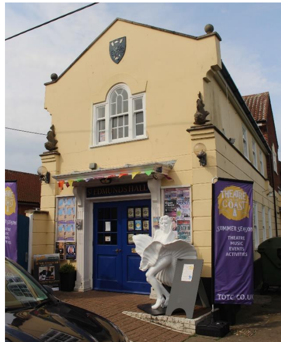
Southwold Arts Centre, Cumberland Road

Southwold Arts Centre, St Edmunds Hall, Cumberland Road (Positive Unlisted Building). A public hall of 1934 which was originally faced in red brick with concrete lintels. It was badly damaged in a bombing raid in 1941 and rebuilt 1952 to the designs of the Borough Surveyor JS Hurst. The hall was again remodelled, and its rendered classical frontage range added c.1989-92 to designs by the Southwold architect John Bennett. A prominent landmark at the northern end of the Old Town character area which plays an important role in the wider setting of the Grade I parish church.