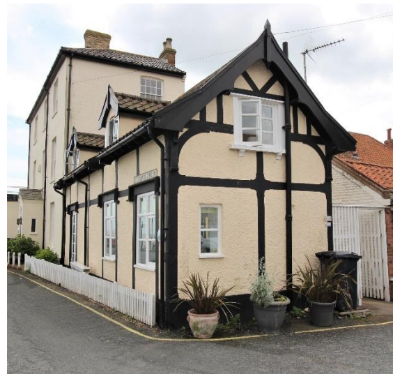
Seaview Cottage, East Cliff

Seacroft, No.19 East Cliff (Positive Unlisted Building). A double pile plan central range of the buildings attached to the rear of Seaview House. At the time of the 1905 Ordnance Survey map this was part of the present No.21 St James Green, but the two were separated before the publication of the 1927 1:2,500 Ordnance Survey map. A much altered early to mid-nineteenth century red brick structure which is now largely rendered and of early twentieth century appearance. The alterations were probably undertaken around the time of its subdivision into two dwellings. Tile hung and gabled twentieth century roof top addition.