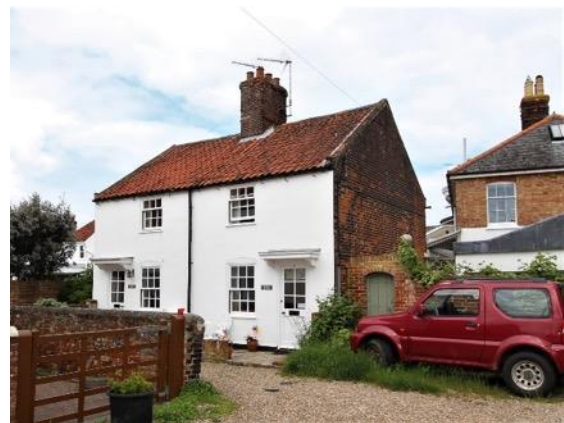
Weavers Cottage, No.5 (right) and Loom Cottage No.6 (left), Spinners Lane

St Edmunds Court, North Green (Positive Unlisted Building). Former steam powered rolling mill of c.1892 now flats. Constructed for Smith and Girling its products included flour and animal feed. Fireproof construction and originally divided into three sealable units in case of fire. Converted to bed