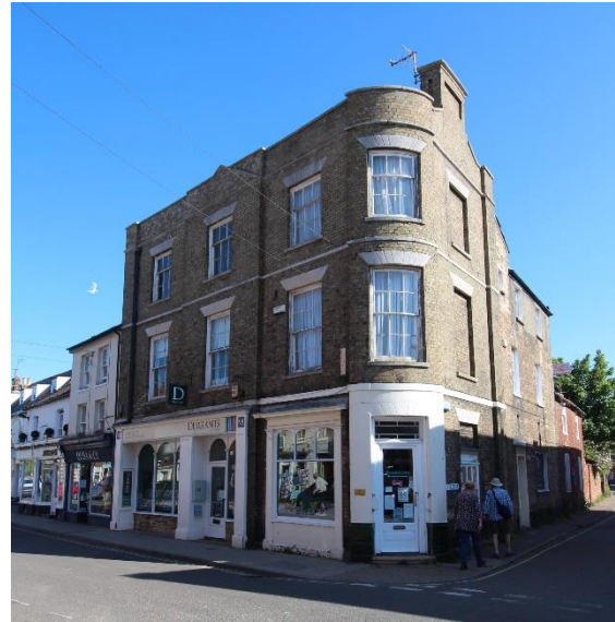
Nos.98-100 (even) High Street

Nos.98-100 (even) High Street (Grade II)