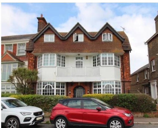
The Links, No.10 Godyll Road

Westholme and Cranbrook, Godyll Road (Positive Unlisted Building). Historic photographs show the house began its life a balanced pair of three storey houses, tile hung to the attic storey and with a regimented order of three sash windows to the first and second floors of each house. Since which time Westholme has lost a window to the attic floor and the ground floor has been reconfigured. Cranbrook now has a ground floor bay projection which partly rises to the first floor with pitched roof over. While the house is not as coherent as its neighbours, both houses retain a number of horned sash windows, with unusual glazing bar arrangement to the upper sashes and the houses continue to make a positive contribution to their setting. Elaborate wrought iron hand gates and posts to the entrances of each property.