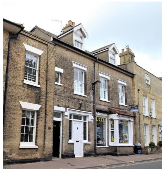
Evington, No.5 Queen Street