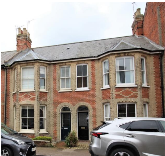
Nos.14 & 16 Dunwich Road

Dunwich Terrace, Nos.6-12 (even) Dunwich Road (Positive Unlisted Buildings). A terrace of four houses. Shown completed on a photograph taken on the 18 th of October 1893 from the lighthouse which is preserved in Southwold Museum. Red brick with painted stone dressings. Two storey canted bays with pilasters and carved lintels and decorative tile insets between the floors. Welsh slate roof with finials above the canted bay windows. Horned plate-glass sashes. Paired arched recessed porches containing partially glazed panelled doors. The door to No.8 still retains stained and leaded glass panels. Some houses now with secondary door flush with the façade. Twentieth century dwarf red brick walls to Dunwich Road. Possibly by the same builder as No.16 Chester Road. John Miller Britain in Old Photographs: Southwold (Stroud 1999) p83.