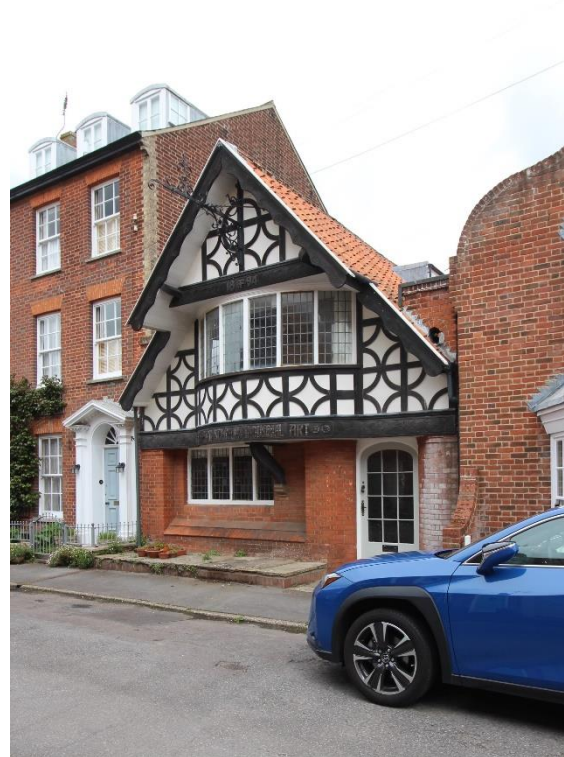
'The Studio'. No.1 Park Lane