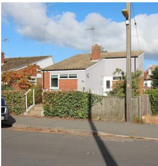
No.78 Pier Avenue

Nos. 72-78 (even) Pier Avenue (Positive Unlisted Building). Detached houses of c.1967 occupying site of former brick field, inventively designed with reception rooms at first floor height to combat split level nature of site. Two storeys with access at First Floor level via concrete foot bridges on Pier Avenue façades. The footbridges lead to large first floor balconies containing the front doors. To rear the house is of a more traditional appearance with a lawn and flat roofed garage accessed from Marlborough Road. Clad in red brick with rendered panels. Casement windows recently replaced. Steeply pitched pan tiled roof to garden façade, shallow pitched to entrance facade. No.78 unusually has a brick chimney stack which appears to be contemporary but is otherwise largely identical.