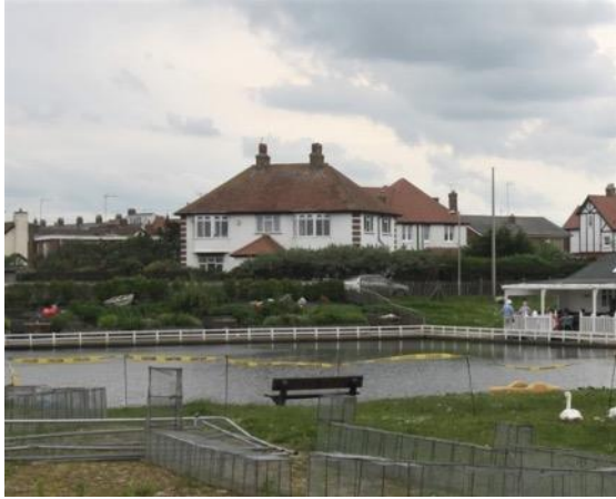
No.72 North Road