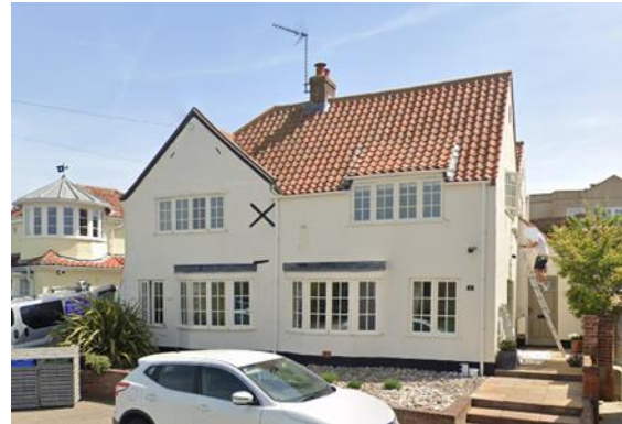
4 Ferry Road

Nos.13 and 15, Constitution Hill (Positive Unlisted Buildings). A pair of late nineteenth century houses, the design of which reflects the gradient of Constitution Hill. Red brick with white brick margins, canted two storey bays and entrances grouped to the centre of the elevation. Red clay pan tile roof covering, with a canted timber attic dormer to each property. Two storey side addition to No.15 built c.2012.