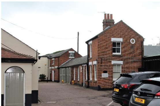
Southern Range of Outbuildings at the rear of The Crown.

Northern Range of Outbuildings at the rear of The Crown, High Street (Positive Unlisted Building). A single storey range of five open-fronted former cart sheds built of rendered red brick with wooden piers. Once part of a continuous range of outbuildings running down to Victoria Street shown on the 1884 1:2,500 Ordnance Survey map. Twentieth century addition at western end. The outbuildings at the rear of the Crown make a strong positive contribution to its setting and to our understanding of its historic role as a major coaching inn. The most complete of Southwold's former coaching inn yards.