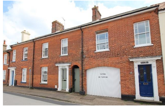
Nos.11-15 (Odd) Trinity Street

No.9 Trinity Street (Positive Unlisted Building). Early nineteenth century shop which makes a strong positive contribution to the setting of the adjoining listed buildings. Painted red brick with red pan tiled roof. Late nineteenth century shop fascia with pilasters and partially glazed central double doors. At first floor level a blind central recess flanked by twelve light sashes.