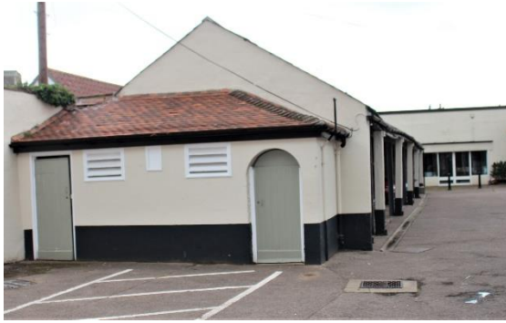
Northern Range of Outbuildings at the rear of The Crown.

Northern Range of Outbuildings at the rear of The Crown, High Street (Positive Unlisted Building). A single storey range of five open-fronted former cart sheds built of rendered red brick with wooden piers. Once part of a continuous range of outbuildings running down to Victoria Street shown on the 1884 1:2,500 Ordnance Survey map. Twentieth century addition at western end. The outbuildings at the rear of the Crown make a strong positive contribution to its setting and to our understanding of its historic role as a major coaching inn. The most complete of Southwold's former coaching inn yards.