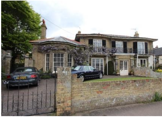
May Place and May Place Cottage, South Green