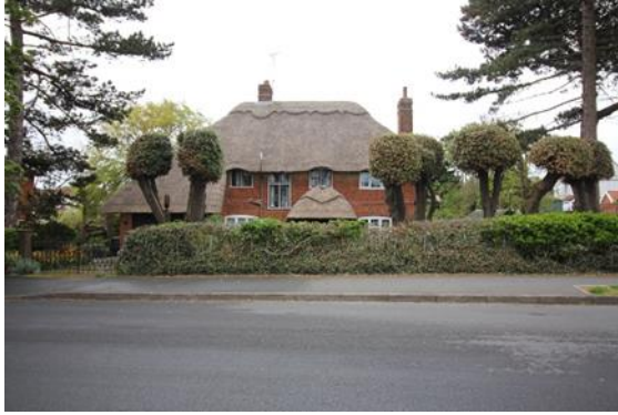
No.53 Pier Avenue

No.53 Pier Avenue (Positive Unlisted Building). A substantial and well-designed thatched roofed villa of c.1946 designed by the Norwich born architect Arthur Albert Hipperson (1877-1962) for Daisy Bywaters (drawings Suffolk Record Office 540/60/4/8). The house occupies a prominent corner plot at the junction of Pier Avenue and Marlborough Road. Built of red brick. Mullioned and transomed casement windows with leaded diamond panes, beneath shallow arched lintels. Thatched porch supported on heavy wooden piers, integral thatched garage at eastern end with what appears to be the original boarded and partially glazed garage doors. Tall red brick chimney stacks. Marlborough Road façade has substantial projecting central chimneystack flanked by diamond paned casements with central mullion. Nb both Daisy Bywaters (later Daisy Thomas) and the architect and his wife Edith are recorded as in residence in the same house in Dunwich Road Southwold in the 1939 voter registration lists.