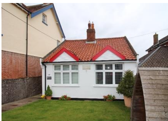
No.50 Hotson Road

No.50 Hotson Road (Positive Unlisted Building). One of three small cottages built in the town in the early 1920s for wounded returning First World War soldiers. Their construction was funded by public conscription. Single storey of rendered brick with a red pan tiled roof. Later wing to rear. Mullioned and transomed casement windows. Memorial plaque between casement windows on Hotson Road façade bearing the legend 'To The Glory of God In Honour of Our Noble Dead Crusaders of St George Memorial Homes No.3. This Home was Erected and Given to the Totally Disabled Heroes of the Great War by the Loyal and Patriotic Citizens of Southwold.'