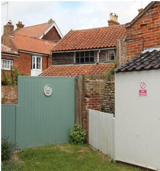
Cottage behind No.9 East Street & 5 Pinkney's Lane

Chimney stack to No.5 removed. Dentilled red brick eaves cornice and wedge-shaped red brick lintels to ground floor window and door openings. No.3 has a probably nineteenth century small pane casement and a four-light sash to the first floor with a late twentieth century horned sixteen light sash window below. Windows to No.5 are early twentieth century small pane sashes. The boundary wall to No. 5 has regrettably been painted.