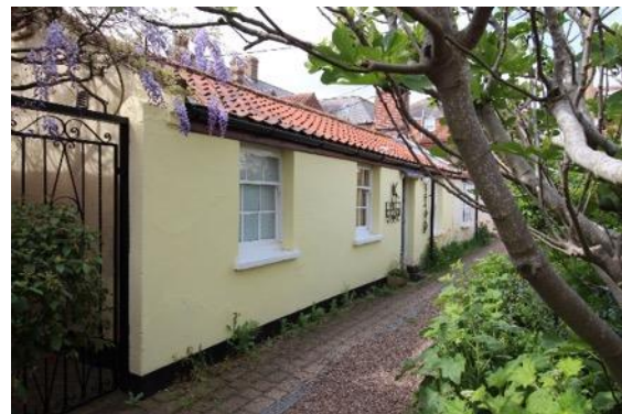
Mill Cottage, eastern end, located to the footpath off Godyll Road

To the first floor, between the bays, is a balustraded balcony, accessed from a central door. The balcony is given some weather protection by the attic storey which is carried forward over the bay windows. Tile hung attic elevation with three gables of equal size. The house retains its original windows with arched transoms. Clear bands of material use; brick to the ground floor, render to the first floor and tile hung to the attic, create a varied but very coherent elevation. Side of house, boundary wall and garden make a significant and positive contribution to footpath (No.14) which links Godyll Road and Blackmill Road.