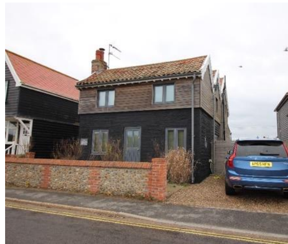
No.29 'Weathervane', Ferry Road

hipped roof and first floor of smaller footprint creating a pyramidal effect. Roof clad with felt shingles, with a central brick stack. Single storey projection to the north side. Unsympathetic replacement windows appear to be within the original openings. The house makes a significant contribution to the varied character of Ferry Road, and is one of the better preserved and more prominent structures.