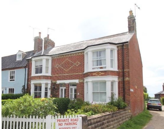
Nos.13 & 14 Barnaby Green

Nos.13 & 14 Barnaby Green (Positive Unlisted Buildings). A pair of houses which probably date from the 1880s and are similar in design to Nos. 8 & 9 Field Stile Road. Faced in red brick with elaborate Suffolk white brick and painted stone dressings. Welsh slate roof to frontage with ridge stacks rising from gables. Suffolk white brick dentilled eaves cornice. Canted bay windows containing horned plate-glass sashes between pilasters. Central front doors beneath shared painted stone lintel with rectangular fanlights. The doors themselves partially glazed. Northern return elevation to Spinners Lane blind. Rear elevation highly visible from Spinners Lane of red brick with a red pan tile roof and small pane sashes. Lower outshots with casement windows. Mid twentieth century front garden wall to north fronting Spinners Lane. Possibly nineteenth century cobble wall with brick dressings to rear. Nos.13 & 14 make an important contribution to the setting of adjoining listed buildings.