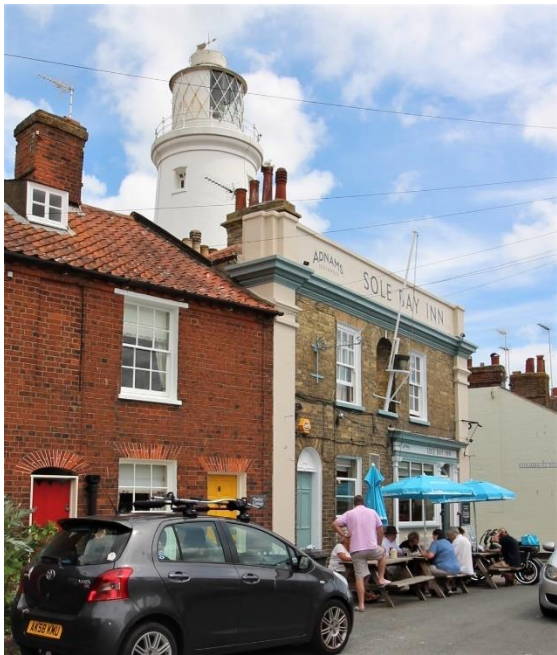
Sole Bay Inn, No.7 East Green