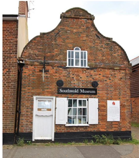
Southwold Museum, Victoria Street

K6 Telephone Box, Victoria Street (Positive Unlisted Structure). A K6 type telephone box of a design produced for the General Post Office in 1935. Sir Giles Gilbert Scott was the designer of the original prototype. Produced in cast iron and made in sections, this design was used until replaced by the K7 c.1968. A prominent structure at the junction of Victoria Street and High Street.