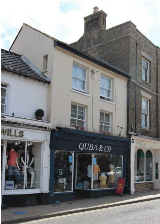
No.96 High Street

Nos.98-100 (even) High Street (Grade II)