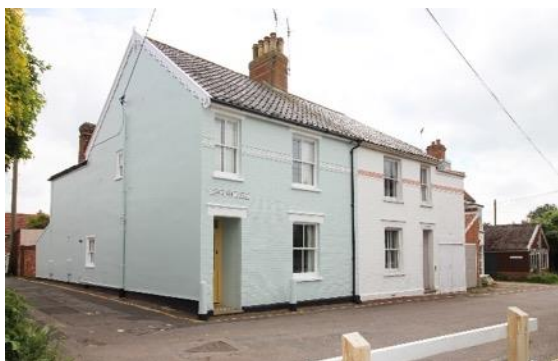
Westview (left) and Hillcrest (right), Gardner Road

Westview and Hillcrest, Gardner Road (Positive Unlisted Buildings). A stylish pair of late 19 th / early 20 th century houses. Painted brick to the entrance façade, rendered to the north. Attractive recessed open porches to either end of the principal façade, retaining stone steps and original part glazed doors. Decorative course of tiles (now painted) to the mid-point of the upper elevation, linking the first floor windows. Blue glazed pan tile roof covering with a red brick central stack to the party wall line. Both properties retain their original horned plate glass sash windows, which enhance both their character and that of the conservation area, and are set between stone lintels and sills, now painted. Two storey extension to the south of Hillcrest c.1920 and altered c.1960 to incorporate a garage. These houses form an important part of the backdrop to the open green space to the north west.