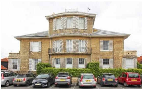
No.1 Greyfriars North, Greyfriars South, and Regency House, South Green

No's 4 & 5, Centre Cliff, South Green (Positive Unlisted Building). Built as the Centre Cliff Hotel and designed by G.J. Skipper in 1899. A fusion of styles brought together with painted stucco. Upper two stories removed which has much diluted the impressive impact of the original design, and resulted in only one of the three storey corner bartizan towers being extant. However, sufficient remains, particularly to the ground floor, to hint at the full splendour of the original design. See Bettley, J and Pevsner, N The Buildings of England, Suffolk: East (2015), p.522.