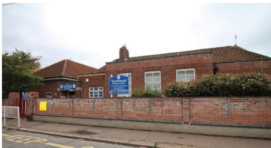
Southwold Primary and Nursery Schools, Cumberland Road

Southwold Primary and Nursery Schools, Cumberland Road (Positive Unlisted Building). A c.1930 school complex occupying an extremely sensitive site adjacent to the east end of the Grade one listed parish church. Faced in red brick and of a single storey with hipped pan tile roofs. Built around a central courtyard. Symmetrical frontage block with roof hidden behind a high parapet. Projecting flat roofed porch to northern end with boarded door. Original casement windows largely replaced but in a sympathetic style. Suffolk Record Office holds plans for the rebuilding of this school dating from 1928 (540/60/1/1-3). The school is shown complete on a dated watercolour of the town of 7 th September 1935 by Frederick Baldwin in the collection of Birmingham Art Gallery. c.1930 walls and gate piers to Cumberland Road. Munn, Geoffrey Southwold, An Earthly Paradise (Woodbridge, 2017) p25.