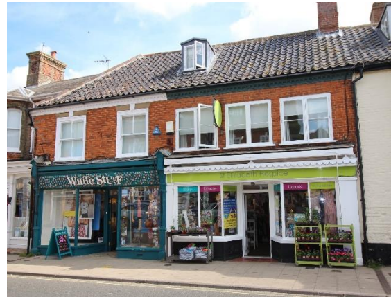
Nos.74 & 76 High Street

properties. Original plate-glass sashes survive. No.68 retains a probably original partly glazed panelled door set within an arched surround. Nos. 70 & 72 have been in retail use since at least the mid twentieth century.