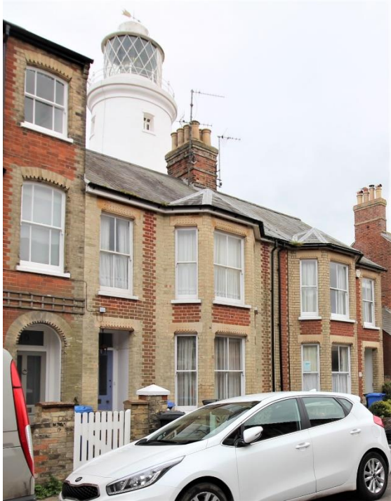
Nos.12 & 14 Chester Road

Nos.12 & 14 Chester Road (Positive Unlisted Buildings). A pair of villas built on plots sold by Southwold Corporation in 1885 with the proviso that dwellings costing not less than two hundred and seventy pounds be constructed on the site. Map evidence suggests that it was built between 1891 and 1904 whilst at least two houses on Chester Road were occupied by the time of the 1891 census. Save for No.16, the houses on Chester Road were probably constructed by the same builder. Red brick with elaborate gault brick dressings and pilasters. Two storeys and two bays with original horned plate-glass sashes. Recessed porches containing partially glazed front doors beneath rectangular fanlights. Nos.12 & 14 play an important role in the setting of the Grade II listed lighthouse and are remarkably well-preserved houses of their kind.