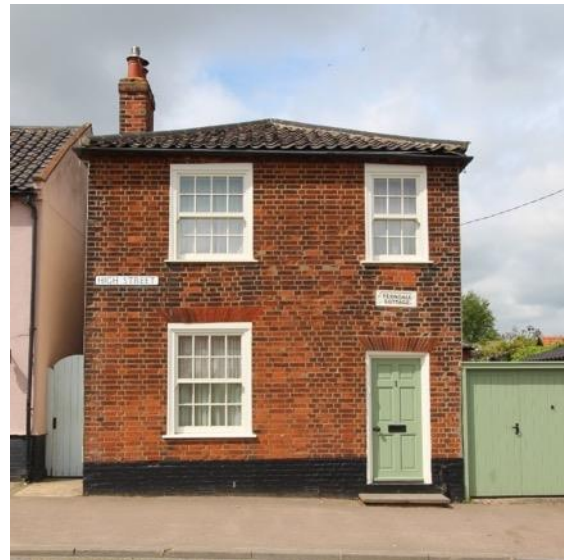
Ferndale Cottage, High Street

Ferndale Cottage, High Street (Grade II listed as No.7 and shown as Nos 3 & 7 on recent maps).