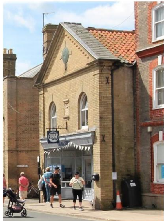
No.19 Market Place