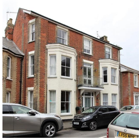
Suffolk House, No.18 Dunwich Road

glazed front doors flanked by full height canted bays.