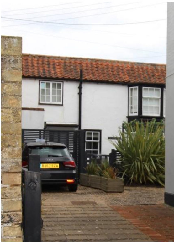
'Harriet's Cottage', No.28A South Green

radiused heads. Fire plaque located centrally to this and the neighbouring property (No.24). Garage and first floor veranda not of special interest.