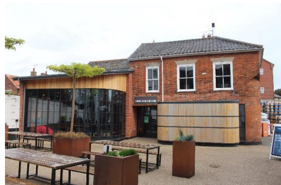
Cygnet Building, Swan Hotel Market Place

Cygnet Building, Swan Hotel, Market Place (Positive Unlisted building). Red brick mid to late nineteenth