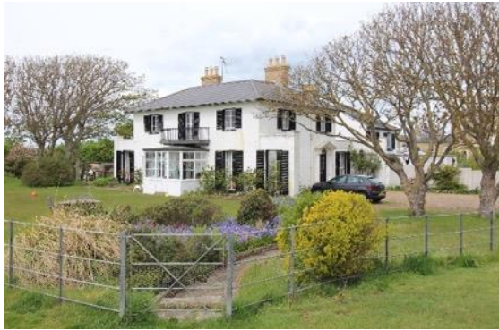
Gun Hill Place, Gun Hill