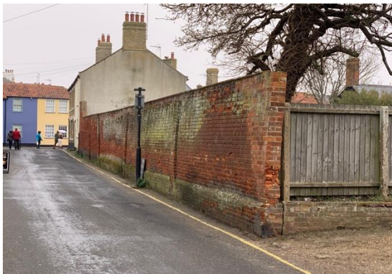
Red brick boundary wall, Pinkney's Lane

No.4 Pinkney's Lane (Positive Unlisted Building). This building appears to be a continuation of the size and form of the property to which it is attached at first floor level to the north, although it appears to be shown on the 1839 Robert Wake map. Two story, rendered, with gault brick stack to the south gable end. Black glazed pan tiled roof. The first floor has a single unhorned 8 over 8 pane sash window. Directly below is a door flanked by casement windows, probably dating from the mid 20 th century. To the left is a three-centered arch leading to an alleyway and the rear of the property.