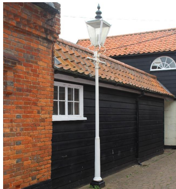
Gas light outside Southwold Museum, Victoria Street

Gas light outside Southwold Museum, Victoria Street (Positive Unlisted Structure). Mid nineteenth