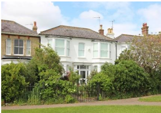
Mariners, The Common

Mill House, The Common (Positive Unlisted Building). Former home of the mill owner, and latterly formed part of the Eversley Road School complex. Presumably built prior to the demolition of the mill (1894) although the structure shown on the 1884 1:2,500 Ordnance Survey map appears to relate to the single storey building that was replaced by the existing house. White brick with rendered ground floor. Central entrance with columned porch, flanked by a pair of flat roofed canted bay windows. Above each bay are tripartite windows and to the centre of the first floor a single plate glass sash window. The openings to the first floor have red brick key stone detailing. Welsh slate roof, hipped to the east, with gable end to the west and a white brick ridge stack. Wrought iron finialed railings and hand gate enclosing the front garden.