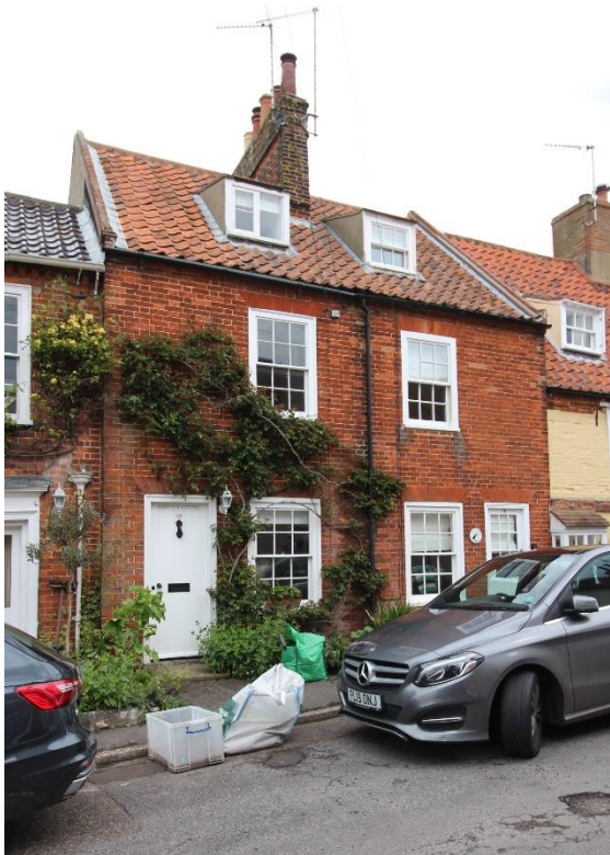
Nos.13 & 15 Park Lane