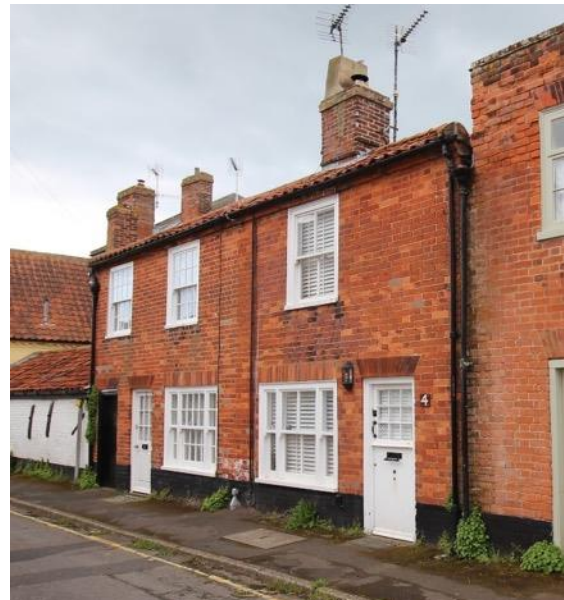
Nos.2 & 4 Park Lane

Nos. 2 & 4, Park Lane (Positive Unlisted Buildings). A pair of red brick cottages, dating from the early 19 th century. Red brick two storey cottages with red clay pantile roof covering with red brick stack to the part wall line between the two houses. No.2 is wider and accommodates a secondary door. Horned sash windows to the first floor, plate glass