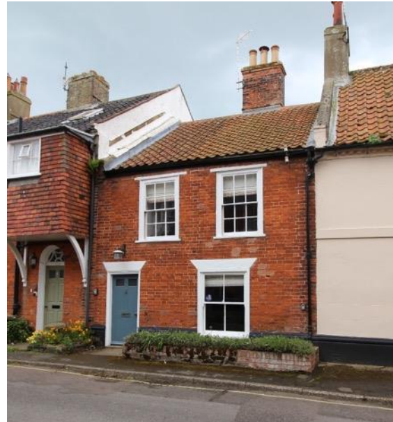
No. 14 Park Lane