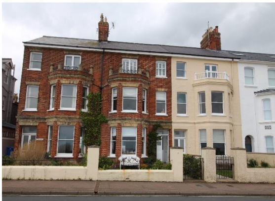
Stoke Lodge, No.15 & Nos.16-17 North Parade

evidence suggests replaces a small conservatory. Southern return elevation of two bays has a canted bay of two storeys which originally contained paired sashes with a central mullion but now contains a single plate-glass sash. Lean-to conservatory which is shown on early twentieth century photographs. Marlborough Road elevation has a twentieth century addition with a steeply pitched Welsh slate roof. Low painted brick wall to North Parade the southern section of which is capped with simple iron railings. Square section gate piers. High boundary wall to southern and Marlborough Road frontages also now painted. John Miller Britain in Old Photographs: Southwold (Stroud 1999) p83