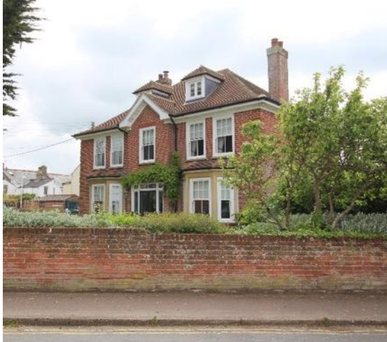
Forest Cottage, Blackmill Road

Forest Cottage, Blackmill Road (Positive Unlisted Building). Detached inter-war red brick villa occupying a prominent corner location. Classical detailing, including symmetrical principal elevation, projecting central bay crowned with an open pediment. Prominent brick quoins to the corners. The projecting modillioned eaves cornice hints at Queen Anne revival styling. The grouping of paired first floor sash windows with the single storey canted bays with shallow pitched roofs below, combine to create a playful rather than scholarly principal elevation. The house and its garden to the east are prominent in views from the High Street. Garages to the north west occupy part of the former garden area and detract from the setting of the house. The site is enclosed by an attractively curved red brick boundary wall.