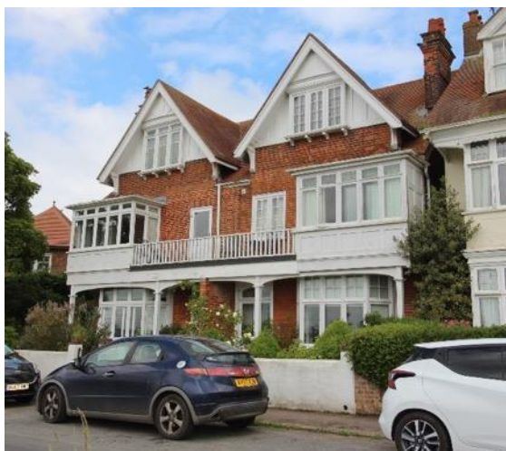
Windles, No.1 (left) and St Mary's House, No.2 (right), Godyll Road

Windles and St Mary's House, Godyll Road (Positive Unlisted Building). A pair of late 19 th or early 20 th century villas, now a single house. Skillful and imaginatively composed and benefitting from much high quality joinery and detailing. A two storey red brick house with a pair of prominent attic gables; eaves supported on brackets with projecting windows also on brackets. To the ground floor are a pair of canted bays with original window joinery and above, and off-set to the extreme ends of the elevation, are a pair of flat-roofed bay windows. Linking the two is a balustraded balcony, supported below by timber columns on pedestal bases. Between each column is a gently curved soffit to the underside of the balcony. Historic photos show the first floor square bays to be later additions, and the brickwork to the first floor shows the scarring of further alterations. However, the house retains much original door, window and balcony joinery and makes a strong and highly visible contribution to view of the conservation area from the east.