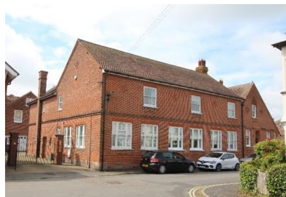
Flats 1-6 (cons) Eversley Court, Wymering Road

Flats 1-2 Eversley Cottage, Wymering Road (Positive Unlisted Building). Detached red brick house, built c.1922 and forming part of the Eversley School, complex, now converted to apartments. Bold projecting string course which runs into the sills of the first floor windows, and below are projecting brick aprons. Two storey canted bay to the right side of the entrance façade, door to left. Spanning the entire width of the entrance elevation is a half-timbered gable, carried out and over the canted bay on a pair of timber brackets, each resting on a stone corbel. The property retains its original horned sash windows, divided to the upper leaves and plate glass with central glazing bar division below. The house is prominent in views looking south along Eversley Road, and west along Wymering Road.