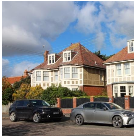
Marram House No.60 Pier Avenue