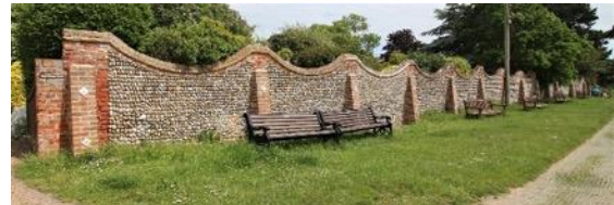
Wall to the western side of The Common fronting Homeleigh, The Paddock and Woodleys

Church of the Sacred Heart – see Wymering Road