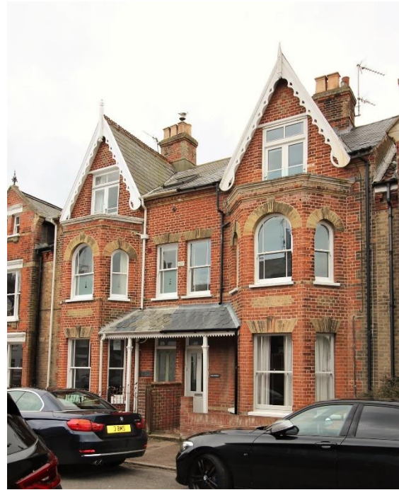
'Lighthouse View' No.46 & 'Arlington' No.48 Stradbroke Road

Brightmer Villa No.40, Spindrift & Driftwood Flats 1 & 2, No.42, and No.44 Stradbroke Road (Positive Unlisted Buildings). A terrace of three substantial houses of two storeys with attics which probably date from c.1890. Shown on a photograph dated 13 th October 1893 in the Southwold Museum collection. Of red and Suffolk white brick with painted stone dressings, Welsh slate roofs and heavy dentilled eaves cornice. The brickwork to No.42 is sadly now painted. Each house is of two bays with a gable capped full-height bay which slightly breaks forward and also lights the attics. Horned plate-glass sashes to the ground floor. Tripartite sashes to first floor of break forward with two small sashes beneath a continuous lintel at attic level. The other windows are two light plate-glass sashes. Doorways set within recessed porches. Panelled doors which are partly glazed with rectangular fanlights above. No.50 Stradbroke Road is of an identical design.