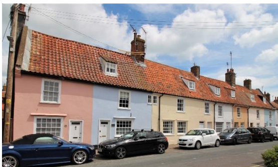
Nos.42-54 (even) Victoria Street

Jubilee Cottage, No. 40 Victoria Street (Positive Unlisted Buildings). 19 th century origin and may have been built around the time of Queen Victoria's Golden Jubilee in 1887. It is two-storey in red brick with red pantiles and a gable chimney at the ridge. The house is positioned at the back edge of the pavement and contributes valuably to a residential streetscene of continuous built frontage with an attractive and strongly historic character, that includes 18 th and 19 th century houses on either side.