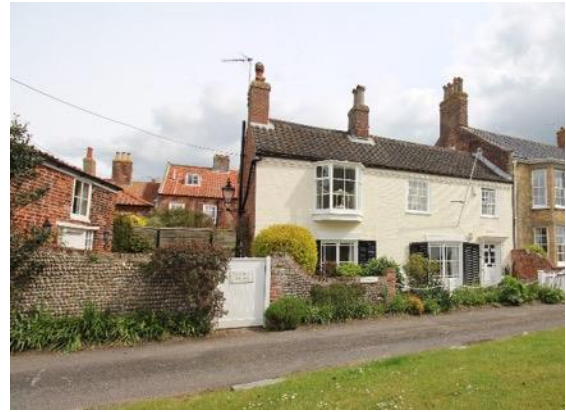
Providence Cottage, No. 15 South Green