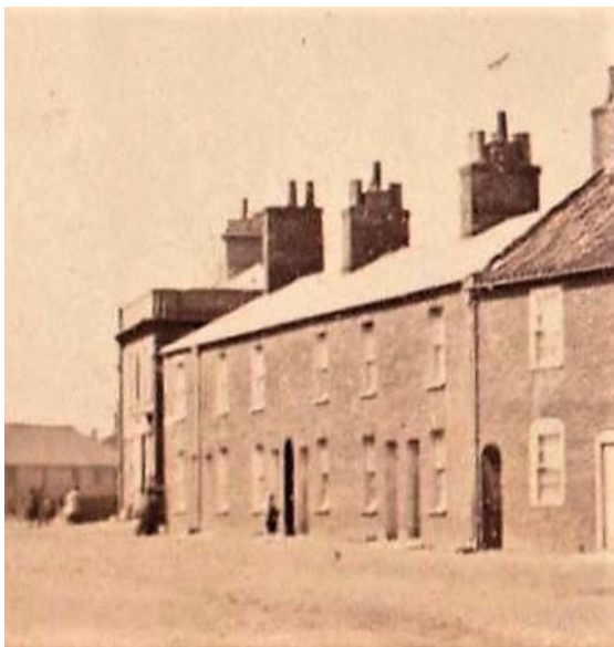
Nos.2-12 St James Green c.1870

Nos.2-12 (even) St James Green (Positive Unlisted Buildings). A red brick terrace of mid nineteenth century date with a Welsh slate roof. Now rendered apart from No.12. Originally a symmetrical composition with an arched central passage leading to the rear gardens. Nos.10 & 12 were given full height canted bay windows c.1900 which retain their original horned plate-glass sashes. Nos. 2-8 have twelve light horned sashes beneath wedge shaped lintels. Front doors largely replaced. Single storey early twenty first century addition to the rear of No.2. This terrace makes an important contribution to the setting of the Grade II listed lighthouse and Sole Bay Inn.