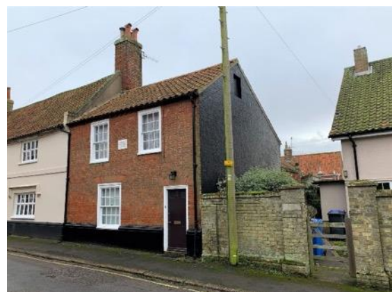
No.20 Park Lane