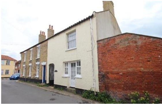
No.4 Pinkney's Lane

No.4 Pinkney's Lane (Positive Unlisted Building). This building appears to be a continuation of the size and form of the property to which it is attached at first floor level to the north, although it appears to be shown on the 1839 Robert Wake map. Two story, rendered, with gault brick stack to the south gable end. Black glazed pan tiled roof. The first floor has a single unhorned 8 over 8 pane sash window. Directly below is a door flanked by casement windows, probably dating from the mid 20 th century. To the left is a three-centered arch leading to an alleyway and the rear of the property.