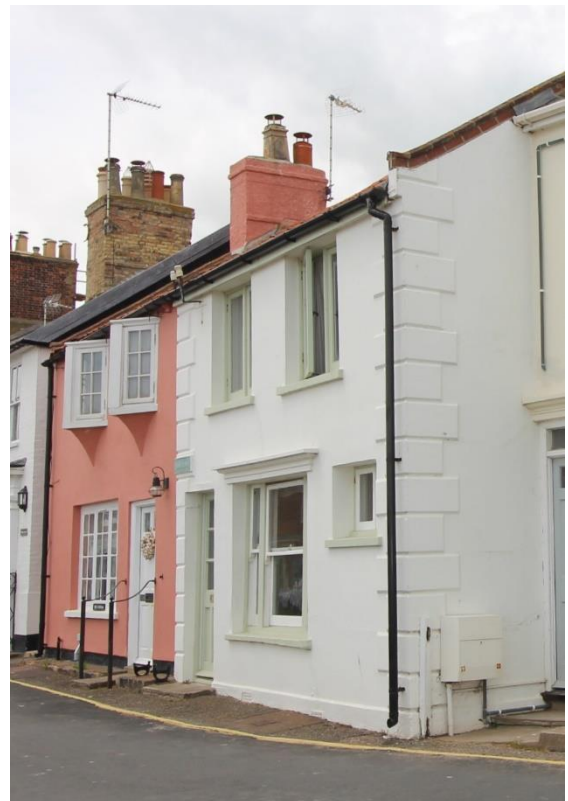
Nos.16 &.17 East Cliff