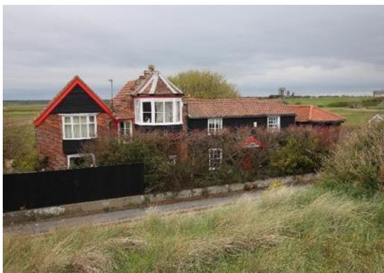
No.43 'The Inch', Ferry Road

No.33 'Kilkee', Ferry Road (Positive Unlisted Building). A single storey chalet, probably dating from the 1920s, and an example of the incremental development that typifies and unites the houses on Ferry Road. Painted brick elevations with shaped bargeboards. Rear two storey addition, and a single storey enclosed timber porch. Pitched roofs running east west. And covered with red clay pan tiles. The stepped form of the roof adds to the subtle qualities of the house.