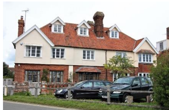
No.5 (right) and No.6 (left) and boundary wall, Strickland Place

set back entrance wing either side with a timber canopy supported on shaped brackets. Tall windows with arched heads to the ground floor and flat gauged brick lintels to the first. Above this is a brick dentil course, supporting corbelled eaves brickwork. Red pan tile covering to hipped pyramidal roof, broken by a pair of dormers to the south and a further dormer to both the east and west side elevations. Each property has a tall and wide fluted red brick chimney, off set to the side pitches. No.4 is better preserved and retains its original window joinery. The houses are of restrained but spirited design and are significant in views north from the common and the park to the immediate south.