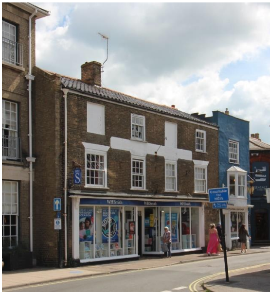
No.10 Market Place

century structure to rear of Swan Hotel, probably originally part of the hotel's stabling, it was converted into managers accommodation in the mid twentieth century and later housed Adnams board room. Altered and partially demolished c.2018 during works to convert it into a visitors' centre when zinc roofed range with glazed frontage also added. This addition replaces an unsympathetic mid twentieth century flat roofed structure. Lower left-hand section formerly garages or cart sheds. Black pan tiled roof. Four pane plate glass sashes beneath wedge-shaped lintels.