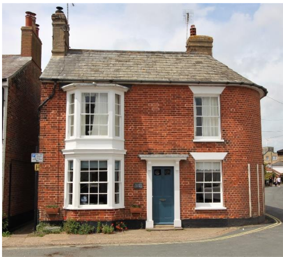
Trinity Cottage, 12 Trinity Street

Trinity Cottage, 12 Trinity Street (Grade II)