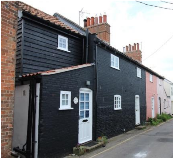
Nos.4-10 (even) Mill Lane

Nos.4-10 Mill Lane (Positive Unlisted Buildings). A row of four early nineteenth century cottages. Painted brick elevations with red clay pan tile roof covering. Ground floor door and casement windows under brick arch lintels, first floor casement windows tight to underside of the projecting dentil eaves course of brickwork. No.4 and No.10 have single storey side additions with a catslide roof over. The weatherboarded addition to No.4, and the flat roofed addition to No.10, are not of special interest. This row of cottages, along with No.2 Mill Lane, make a strong and positive contribution to the streetscape and character of the lane.