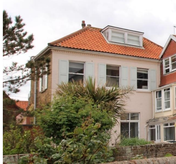
No.21 St James Green

No.19 St James Green (Positive Unlisted Building). Early nineteenth century cottage with twentieth century alterations. Rendered brick façade of a single bay containing canted bay window to the ground floor and a twelve light hornless sash above. Front door in return elevation. Single storey range of nineteenth century pan tiled roof outbuildings attached to western side elevation. Of painted brick with a largely blind rear elevation to the garden of No.17.