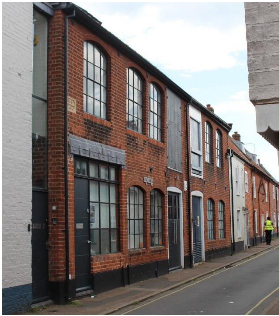
Nos.2 & 4 Church Street

Nos.2 & 4 Church Street (Positive Unlisted Building). A purpose-built former engineering works of 1896 constructed by James Powditch for William Powditch engineer and Whitesmith, now sympathetically converted to offices. Red brick with cast iron window frames. Two storey asymmetrical façade with arched red brick lintels and red brick sills. Boarded entrance doors and taking-in doors at first floor level.