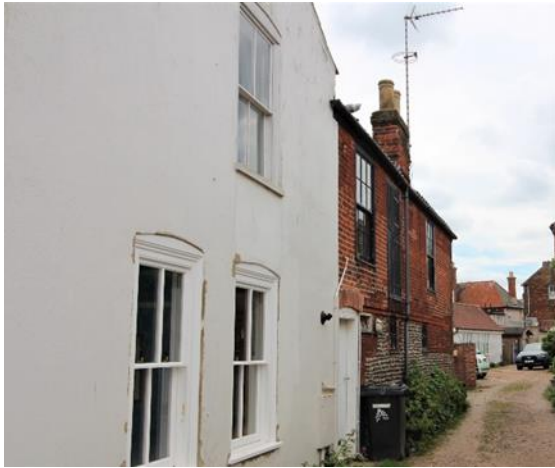
Warehouse range attached to rear of 39 Victoria Street.

Adnams Whisky Dunnage Premises see Crown Hotel, High Street.