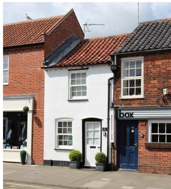
Thimble Cottage, No.29 High Street

Thimble Cottage, No.29 High Street (Positive Unlisted Building). Small probably early nineteenth