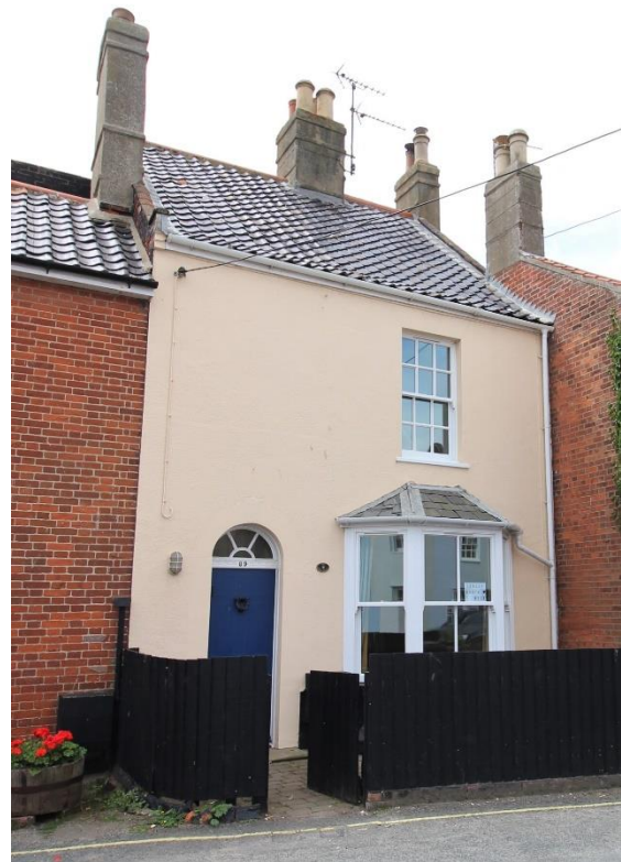
No.89 Victoria Street

Suffolk Cottage, No.87 Victoria Street (Positive Unlisted Building). Late nineteenth century villa of red brick with horned plate-glass sash windows beneath shared wedge-shaped lintels. Full height bay window. Partially glazed front door within projecting flat roofed porch with parapet. Arched doorway to passage at northern end with boarded door. Red pan tiled roof. Later twentieth century red brick garden wall to frontage recently removed.