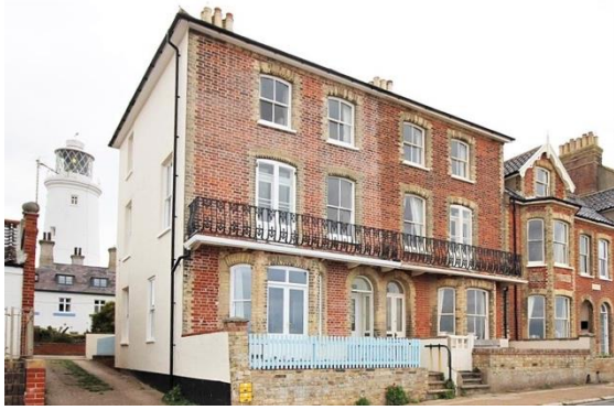
Nos.1 & 2 North Parade

Nos.1 & 2 North Parade (Positive Unlisted Buildings). Semi-detached pair of villas built of red brick with elaborate gault brick dressings. Built sometime between the publication of the 1891 and 1904 Ordnance Survey maps. Nos.5-9 (Odd) Dunwich Road are of a similar design. Hipped Welsh slate roof with overhanging eaves. Decorative first floor balcony of cast iron resting on canted bay windows beneath. Original partially glazed front doors preserved within linked arched surrounds. Original horned plate-glass sashes throughout except to French doors to balcony which are less sympathetic visually. Rendered southern return elevation. Low gault brick garden wall of similar date to front. Nos.1 & 2 make a strong positive contribution to the setting of the Grade II listed lighthouse.