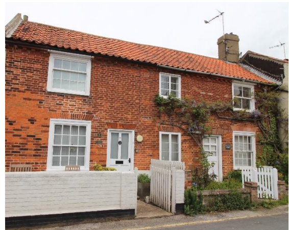
Hoskin Cottage No.5 & Dreamers Cottage, No.3 Pinkney's Lane

No.1 Pinkney's Lane (Positive Unlisted Building) Small red brick early nineteenth century cottage with a red pan tiled roof. Plastered wedge-shaped lintels above late twentieth century replacement sashes. Boarded front door. Façade possibly partially rebuilt following removal of a shop fascia.