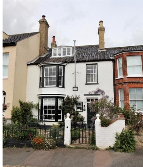
Rowan Cottage, Constitution Hill

probably originally part of the neighbouring property Rowan Cottage (Grade II listed, see below). Centrally located entrance flanked by two storey bay windows, canted to the left and square to the right. The original ridge has been raised over the right section of the property and is covered with black glazed pan tiles. The house retains its horned plate glass sash windows.