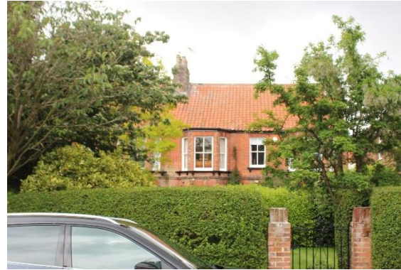
Nos.20 & 22 Stradbroke Road

resting on corbels and painted stone wedge-shaped lintels. Panelled doors with rectangular fanlights. Substantial gabled dormers with elaborate decorative bargeboards and spear finials. Probably dating from the early 1890s.