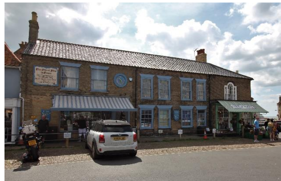
No.23 Market Place