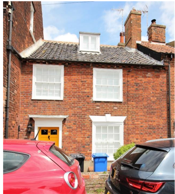
No.10 East Green