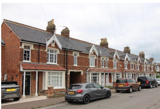
Nos.1-7 (cons) Field Stile Road

Good Hope and Coniston, Field Stile Road (Positive Unlisted Buildings). A semi-detached pair of cottages which were built to a highly conservative design in the late 1920s (the site appears undeveloped on the 1927 1:2,500 Ordnance Survey map). Red brick with pebbledashed first floor and a red pan tile roof. Central ridge stack rising from spine wall. Four light plate-glass horned sashes retained. Arched doorways set within otherwise largely blind return elevations. Possibly early public housing.