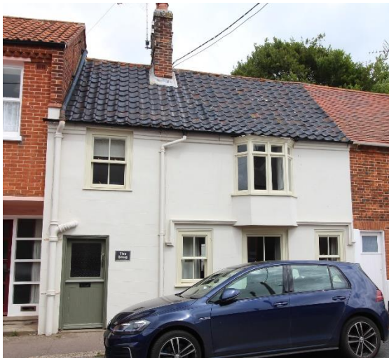
'The Snug', No.5 Lorne Road

Nos.7 & 9 Lorne Road (Positive Unlisted Structure). Post-war structures, they have been identified due to their sensitive design which permits them to integrate harmoniously with their surroundings, including their traditionally designed fenestration.