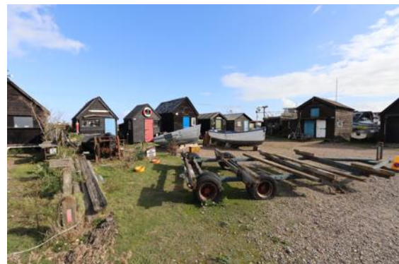
W13 to W21, Blackshore

W3 to W22, Blackshore (Positive Unlisted Buildings). A varied collection of closely grouped huts and stores connected with the fishing industry.