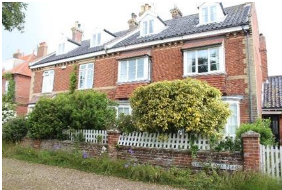
Nos.1 (left) and 2 (right), and boundary wall, Strickland Place

Nos.1 and 2, Strickland Place (Positive Unlisted Building). A pair of late nineteenth or early twentieth century houses facing Nursemaid's Park., Built from red brick with flush quoins, string course and corbelled eaves detailing in white brick. No.2 is better preserved and retains its stone lintels and sills and some original joinery. All windows to No.1 have been enlarged, to the detriment of the both properties. Side entrance extension added to No.1, probably dating from the late 1940s. Attic dormers and gable end chimney stacks with corbelled caps create a lively roofscape. The roof itself is covered with blue glazed pan tiles to the south and north pitches. Enclosing the front gardens is a low red brick boundary wall, topped with timber palisade fencing. The wall contributes positively to the setting of the houses.