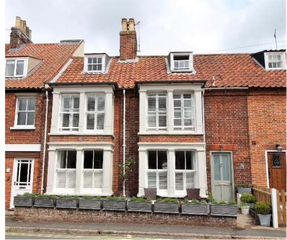
Lorne Cottage, No.15

Nos.11 & 13 Lorne Road (Positive Unlisted Structure). Probably of mid-eighteenth-century date of red brick with pilasters and a red pan tiled roof. Eastern gable of No.11 prominent in views along Lorne Road. Twelve-light hornless sash windows in heavy moulded frames beneath rubbed brick wedge-shaped lintels. Ground floor of No.11 has a twentieth century glazed lean-to porch and a twentieth century bay window beneath a continuous Welsh slate roof which replaces an earlier bay window shown on a National Monuments Record photograph of 1949 (BB49/3125). Flat roofed dormers in principal roof slope. Ridge stacks probably removed. The partially re-fronted No.15 forms part of the same structure.