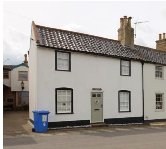
Tittle Mouse House, No.6 Queens Road