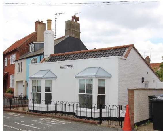
Adelaide Cottage, St James Green

13 and 15 St James Green . Previously identified as positive unlisted buildings, these structures have been substantially altered and no longer merit inclusion.