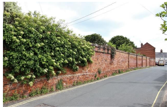
Garden Walls to The Elms and No.9B Lorne Road

'The Snug', No.5 Lorne Road (Positive Unlisted Building) Cottage with rendered red brick façade to Lorne Road and black glazed pan tile roof. Three plate-glass sashes of probably twentieth century date to ground floor beneath a single elongated hood mould. Canted bay window with mullioned and transomed casements to first floor. Partially glazed twentieth century front door. Some similarities with No.8 Queen Street however this façade was remodelled in the mid twentieth century only the western bay remaining as built.