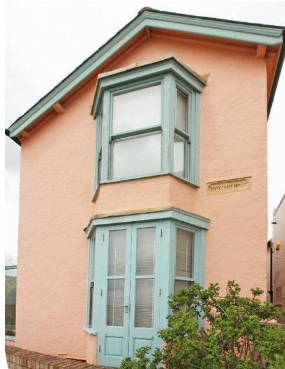
York Cliff House, Primrose Alley

York Cliff House, Primrose Alley (Positive Unlisted Building). A two storey rendered property, dating from the late 19 th century, with two storey canted bay window to the east elevation, which retains horned plate glass windows to the first floor. Asymmetric pitched roof with overhanging eaves supported on exposed purlins.