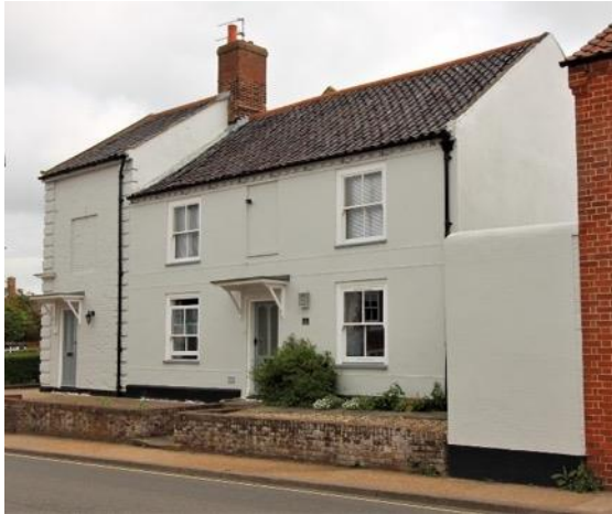
No.2 High-Street, High-Street elevation

No.2 High Street (Positive Unlisted Building). Former Marquis of Lorne public house closed c.1956. Southern section later eighteenth century and northern mid to late nineteenth. Red brick with brick embellishments and expressed brick quoins to the Field Stile Road elevation, which is now painted over. Black pan tile roof. Dentilled cornice on High Street façade.