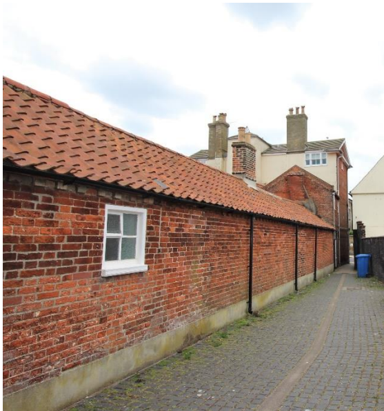
Rutland Cottage and the rear of Nos.80 & 80A High Street