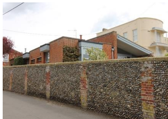
No.28 Park Lane, and boundary wall

No.28 Park Lane (Positive Unlisted Building). Designed during the 1970s by the architect Eric Sandon. Red brick with burnt headers single storey modernist house of the later 20 th century. Flat roofed in part, with a raised spine wall supporting a mono pitched roof to the east. Projecting square bay window to the south with the boarding detail of the bay repeated over window openings as modest projecting canopies. The house completely ignores the forms and styling of neighboring properties, but achieves a respectful and subservient quality through its scale and understanding of a prominent site. Boundary walls of two phases; Suffolk white brick (facing Park Lane) and early 19 th century cobble wall with red brick piers (facing Gardener Road), the latter built to enclose the western boundary of Park Villa. The walls contribute positively to the setting of the house and to the character area.