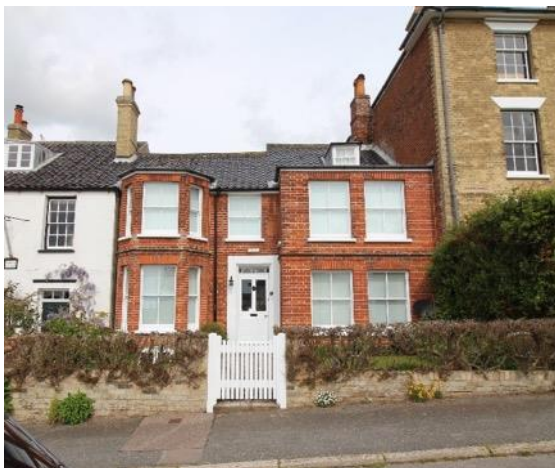
Tamarisk, Constitution Hill

Tamarisk, Constitution Hill (Positive Unlisted Building). Former public house 'The Tom and Jerry', the exterior being a re-facing in brick, completed c.1890 when the property was converted to domestic use. The timber framed core of the house, which dates from the mid seventeenth century was