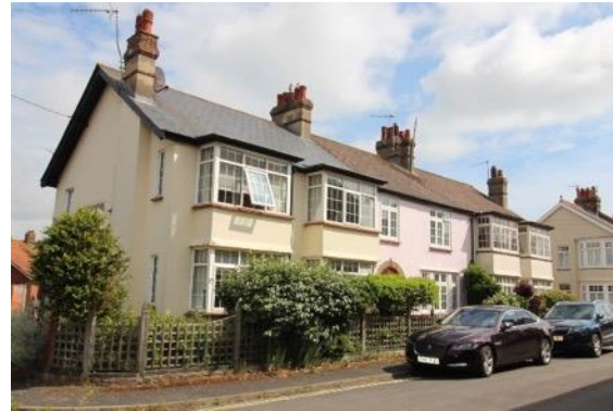
Nos.11-13 (cons), Wymering Road

Nos.1-10 (cons) Wymering Road (Positive Unlisted Buildings). A terrace of ten houses dating from the early twentieth century. No.1 is built from Suffolk white brick with horizontal bands of Suffolk red brick and lintels to door and window openings. Former shop front to the elevation facing Manor Park Road. The rest of the terrace is pebble dashed with timber two storey canted bays, except to No.7 which has a red brick canted bay that seems to pre-date the timber bays. Slate covered roofs with red clay ridge tiles with pierced detailing. Shared white brick stacks with contrasting red brick banding to the party wall line of each property. Small front gardens behind dwarf walls, mostly containing Minton tile panels before the recessed porches. The terrace retains much original door and window joinery.