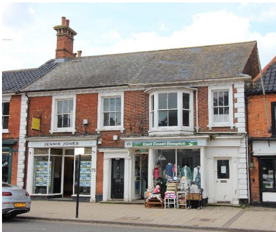
Nos.73 & 75 High Street

Nos.73 & 75 High Street (Positive Unlisted Buildings). A pair of mid-nineteenth century shops with living accommodation above which were originally built as dwellings. Red brick with painted stone dressings and a Welsh slate roof. Dentilled eaves cornice. Four-light plate-glass sashes set within heavy moulded frames. Pilastered doorcase to No.75 with panelled door. No.73 has the remains of a similar doorcase only the pilasters of which now appear to survive. Early twentieth century shop facias. Late nineteenth century photographs show that No.73 originally had a full height canted bay window which now only survives at first floor level. Jenkins, A Barrett, A Visit to Southwold, Containing Over 150 Photographs of Historic Interest (Southwold, 1984) p15.