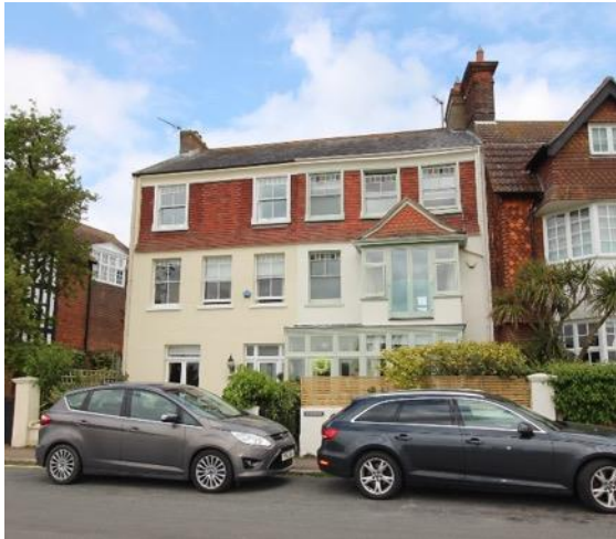
Westholme, No.8 (left) and Cranbrook, No.9 (right), Godyll Road

Westholme and Cranbrook, Godyll Road (Positive Unlisted Building). Historic photographs show the house began its life a balanced pair of three storey houses, tile hung to the attic storey and with a regimented order of three sash windows to the first and second floors of each house. Since which time Westholme has lost a window to the attic floor and the ground floor has been reconfigured. Cranbrook now has a ground floor bay projection which partly rises to the first floor with pitched roof over. While the house is not as coherent as its neighbours, both houses retain a number of horned sash windows, with unusual glazing bar arrangement to the upper sashes and the houses continue to make a positive contribution to their setting. Elaborate wrought iron hand gates and posts to the entrances of each property.