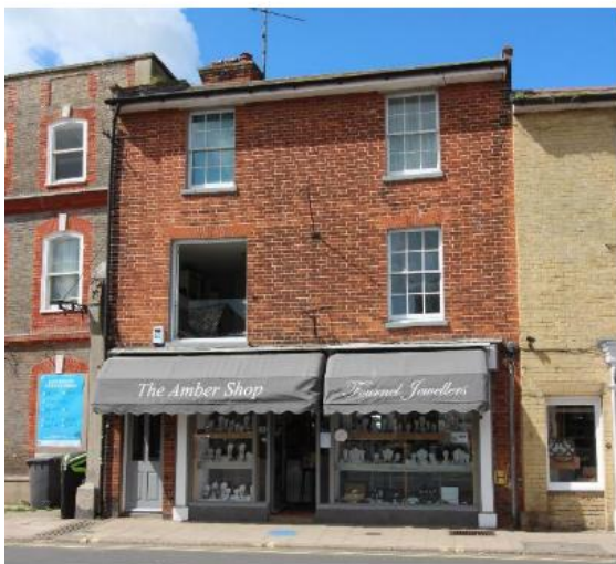
No.15 Market Place