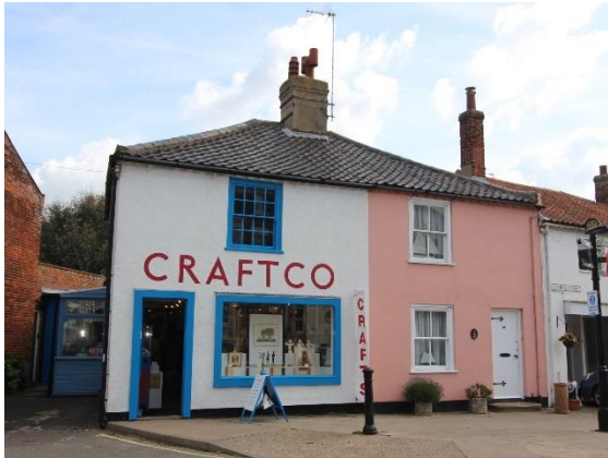
Nos.40A & 42 High Street

Nos.40A & 42 High Street (Positive Unlisted Buildings). House and Blacksmith's workshop dating from c.1800 converted to other uses in the 1930s. Built of red brick with rubbed red brick wedge-shaped lintels, but unfortunately now rendered. Hipped black glazed pan tile roof. Substantial central ridge chimneystack. No.42 the former house is little altered externally save for the loss of its twelve light hornless sashes. First floor of High Street façade to No.40A retains an original sash in a heavy moulded frame. The ground floor of this façade originally contained a similar window and no door. The northern return elevation of No.40A originally displayed its industrial use with a central taking-in door at first floor level and at ground floor level a central door flanked by twelve-light hornless sashes. Former cart shed range with frontage to Victoria Road now heavily altered.