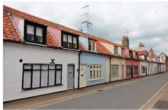
Nos.1-9 (odd) Church Street

Nos.40 & 42 Church Street (Positive Unlisted Buildings). A semidetached pair of red brick cottages with pan tile roofs probably of c.1800-1820 date. Sixteen light hornless sashes in moulded wooden frames. Wedge shaped lintels with pronounced key stones. No 40 with a six panelled door with glazed top lights. The door to No.42 boarded. Large late twentieth century addition to southern end of No.42. Northern return elevation of No.40 rebuilt following the demolition of the adjoining former Brickmakers Arms public house c.1984.