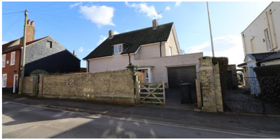
Boundary Wall to The Coach House, Park Lane

Boundary Wall to The Coach House, Park Lane (Positive Unlisted Structure). Gault brick, dating from the second quarter of the 19 th century and enclosing the courtyard of the demolished coach house to Park Villa. Canted brick to the base plinth, with angled capping bricks. Square piers with stone caps, although the opening positions have changed and been widened over the years. The wall, although altered, is important for the continuation it provides of the established building line either side.