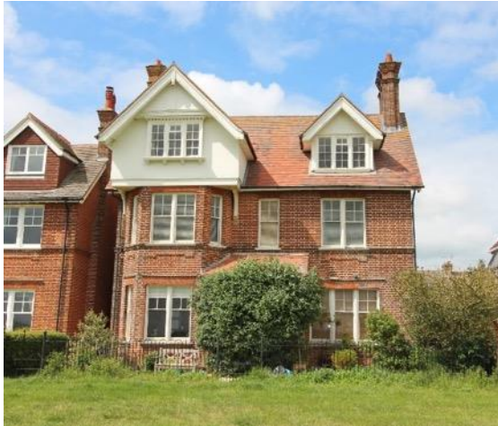
The Hollies, The Common

See Bettley, J and Pevsner, N The Buildings of England, Suffolk: East (2015), p.523.