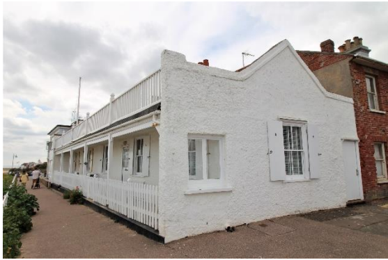
Nos.5 & 6 East Cliff