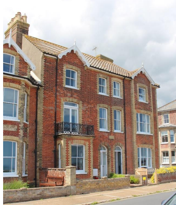
Nos.5 & 6 North Parade

decorative pierced bargeboards with spear finials. Unsympathetic rooflights added to roof above. The original horned plate-glass sashes with margin lights survive to the North Parade façade. Originally with arched recessed porches, that to No.4 is now glazed in. The original panelled front doors however survive to both houses.