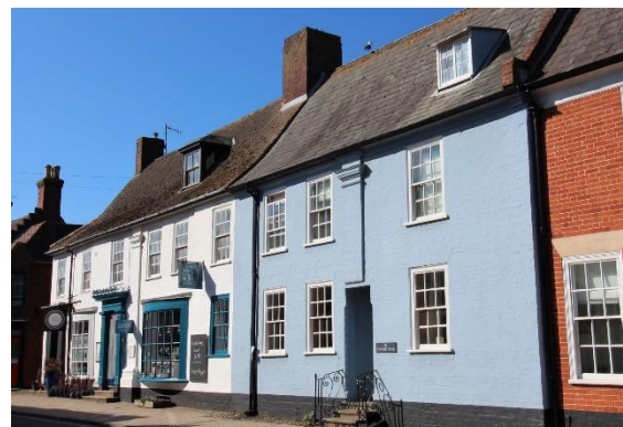
Nos.49-51A (Odd), High Street

The Post Office and Nos.43 & 45 High Street (Positive Unlisted Buildings). Commercial building with living accommodation above built in two sections, the northern part in 1895 and the southern in 1911. Red brick with stone dressings and a Welsh slate roof. Ornate stone bay window of two storeys with pyramidal roofs linked by a central single-storey stone porch containing an arched doorway and capped by a decorative stone balustrade. Twin pediments to bays flanking porch. Original horned plate-glass sashes. Recessed porches with stone hoods supported on ornately carved corbels. Secondary entrances to living accommodation in northern and southern bays flanking bays of The Post Office. The two flanking houses are of the same design as Nos.39 & 41 High Street. Ornate c.1895 cast iron railings and gate piers to the frontage of No.43