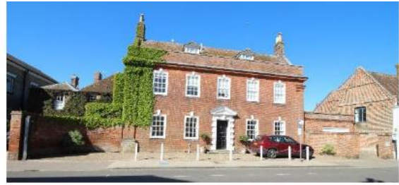
The Manor House, Nos.65-67 (odd), High Street

The Manor House, Nos.65-67 (odd), High Street including gate and forecourt walls (Grade II*)