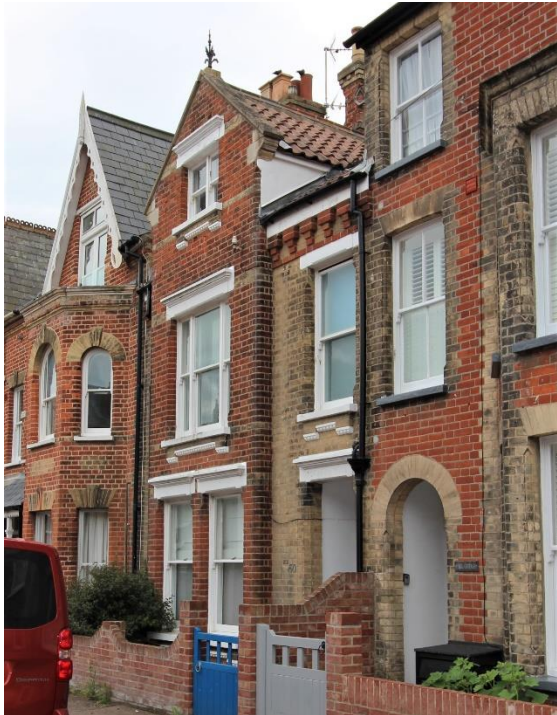
No.50 Stradbroke Road

No.50 Stradbroke Road (Positive Unlisted Building). Substantial house of the early-1890s. Shown on a photograph dated 13 th October 1893 in the Southwold Museum collection. Red and Suffolk white brick façade with painted stone dressings and a replaced red pan tile roof. Principal façade of two bays with a finial capped gabled breakfront to the southern bay, which is of red brick, whilst the remainder of the façade is of white brick. Heavy dentilled eaves cornice of red brick. Horned, plate glass-sashes. Recessed porch containing a partially glazed panelled front door. Nos.40-44 (even) Stradbroke Road are of an identical design. Late twentieth century low wall to frontage.