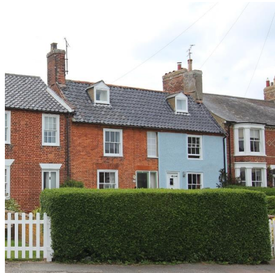
Nos.15 & 16 Barnaby Green

Southern façade has two large bay windows divided into three sections by mullions with small pane sashes set between. Between them a doorway with a moulded frame and decorative rectangular fanlight. Panelled front door set within recessed porch. Decorative iron balcony above with French doors. Former shop to east on corner of High Street with what appears to be original shop front preserved but windows now divided into small panes. Splayed corner. Horned small-pane sashes above beneath stone lintels. Late twentieth century octagonal cupola with ball finial to north-eastern corner. Small pane casement windows. Late twentieth century interventions to rear elevation. Late twentieth century stepped red brick boundary wall to west screening courtyard with further recent additions behind.