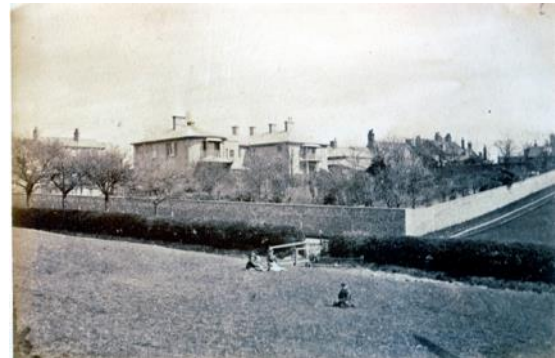
Historic view (undated) of Park Villa, facing Skillmans Hill.

See Bettley, J and Pevsner, N The Buildings of England, Suffolk: East (2015), p.522.