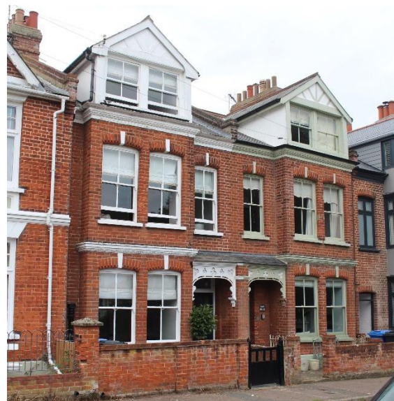
Nos. 7 & 9 Cautley Road

c.1900, (shown on the 1904 1:2,500 Ordnance Survey map). Possibly two of the three projected Cautley Road villas designed by the Walthamstow architect and civil engineer John Grant-Browning for Robert Jerman a builder of Leyton Essex. Designs for which were submitted for approval in February 1902 (Kindred). They are of three bays each, with gabled two storey bay windows to the outer bays. The houses are faced in red brick with plaster faced lintels, and mullioned and transomed windows. Central bay recessed with decorative wooden balcony beneath which is a corbeled arch. Partially glazed front doors. C Brown, B Haward & RJ Kindred Dictionary of Architects of Suffolk Buildings 1800-1914 (Ipswich, 1991) p115. Jenkins, A Barrett A Visit To Southwold, Over 100 Photographs of Historic Interest (Southwold, 1983) p 28.