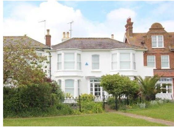
Old Mill, The Common

Mariners and Old Mill, The Common (Positive Unlisted Building). A pair of double fronted villas dating from the late nineteenth century, shown on historic photographs alongside the mill, prior to demolition of the mill in 1894. Both villas are rendered, covering the original white brick elevations, and both houses have had their single storey canted bays raised in height and replacing the tripartite sash window arrangement to the first floor. Hipped roof covered with Welsh slate. Both houses retain some of their original plate glass sash windows. Finialed railings enclosing the front gardens.