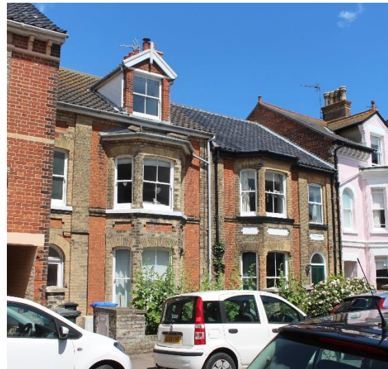
Nos.7 & 9A-9C Chester Road

Nos.1-5 (Odd) Chester Road (Positive Unlisted Buildings). A terrace of three south facing houses built on plots sold by Southwold Corporation in 1885, with the provision that houses costing no less than three hundred pounds should be built upon them. Save for No.16 all of the houses on Chester Road were probably constructed by the same builder. The completed terrace appears on a photograph taken in 1893 from the lighthouse, which is preserved within the Southwold Museum collection. Red brick with elaborate Suffolk white brick dressings and quoins. Original horned plate-glass sashes with margin lights preserved. No.5 sadly now painted. Partially glazed front doors set within recessed porches with decorative tile floors. Welsh slate roof with projecting eaves resting on heavy moulded corbels. Finialed dormers and red brick ridge stacks rising from spine walls between the houses. No.1 has a discreet and sympathetically designed c.2010 addition. Garden walls mostly rebuilt, and decorative iron railings removed. John Miller Britain in Old Photographs: Southwold (Stroud 1999) p83 & 87.