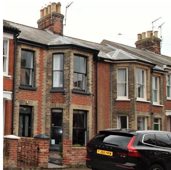
Nos.35 & 37 Stradbroke Road

brick dressings and a Welsh slate roof. Central ridge stack rising from the spine wall between the two properties. Two storey canted bays with decorative tile insets at first floor level and a dentilled eaves cornice. Original horned plate-glass sashes. Recessed porches containing partially glazed original doors. The red brick dwarf boundary wall to Stradbroke Road appears to have been rebuilt.