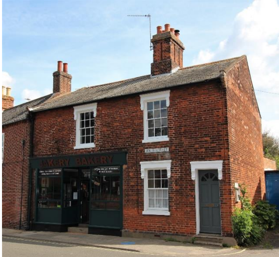
Nos.38 & 40, High Street