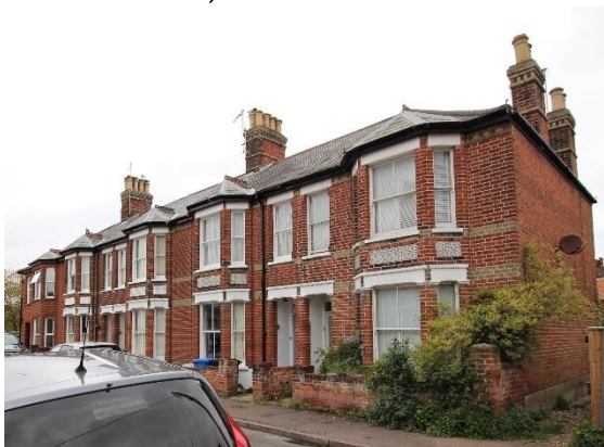
Nos.1-7 (Odd) Salisbury Road

See also Salisbury House, No.56 Stradbroke Road & The Corner House, No.58 Stradbroke Road