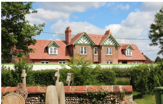
Former Hospital, Field Stile Road

No.10A Field Stile Road (Positive Unlisted Building). Former farmhouse of c.1800 associated with the Town Farm whose lands were sold by the Corporation for development in 1899. At the time of the 1881 census the farm was comprised of 46 acres. Its farm buildings disappeared gradually during the opening decades of the twentieth century. Of red brick with a Welsh slate roof. Symmetrical three bay two storey principal façade with a blind decorative recess in the form of a window opening above the central front door. Twentieth century partially glazed front door with rectangular fanlight. Twelve light hornless sashes below plaster faced wedge shaped lintels. The house plays an important role in the setting of the Grade I listed parish church which is located directly to its south. Good twentieth century dwarf red brick walls to frontage. The attached later twentieth century property to the north does not contribute positively to the conservation area.