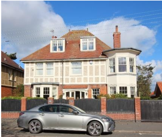
No.62 Pier Avenue

No.62 Pier Avenue (Positive Unlisted Building). A well-preserved detached villa of c.1905 which was probably designed by the London architect Edward Charles Homer (1845-1914). One of the first buildings to be completed on the Coast Development Company's building estate. Two storeys with attics. Red brick with a rendered first floor embellished with applied timber framing. Steeply pitched plain tile roof capped with decorative ridge pieces. Original plate-glass sash windows with small pane upper lights preserved. Original flat-topped dormers with casements to roof. Homer who was responsible for villas at Hampstead and Frinton Essex as well as for his early London cinemas. Designs by Homer of c.1905 for villas on Pier Avenue with applied timber framing to the upper floors were recorded by Bob Kindred in his survey of Suffolk architects but have sadly since been destroyed.