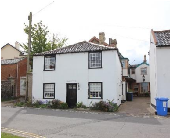
Coachman's Cottage, No.2 Queens Road