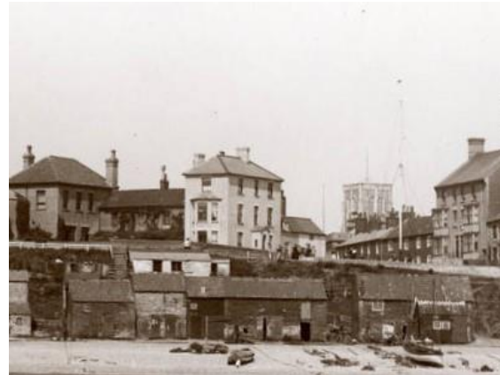
Nos.19 and 20 East Cliff, and No.21 St James Green c.1880

Seaview House, No.20 East Cliff (Positive Unlisted Building). A substantial sea front dwelling of three storeys which is attached at its rear to a further, and now much altered substantial nineteenth century villa (now Nos.19 East Cliff & 21 St James Green). A complex of similar form appears on Wake's 1839 map. The present Seaview House is probably of mid nineteenth century date and is rendered with a hipped Welsh slate roof slope to the front and a red pan tiled one to the rear. Three bay symmetrical entrance façade with horned plate-glass sashes. Single storey twentieth century canted bay addition to seaward end. Central gabled porch with arched doorway. Sea facing elevation has a two-storey canted bay window. Good nineteenth century red brick wall surrounding garden to east.