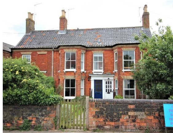
Nos.39, 39A and 41 Victoria Street

semi-circular plate-glass fanlights. St Edmunds Terrace makes a strong positive contribution to the setting of the listed buildings on Bartholomew Green onto which it faces. (Collins, Ian Artists in Southwold (Norwich, 2005) p58-59).