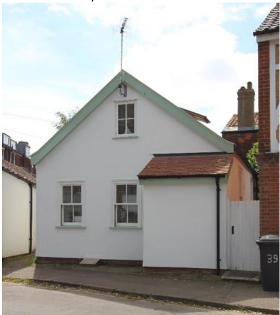
The Old Bakehouse Store, Blackmill Road

Tor Schotte Antiques, Blackmill Road (Positive Unlisted Building). Former bakehouse to Clarke's bakery premises at 35 High Street and 8 Victoria Street. First shown on the 1904 1:2,500 Ordnance Survey map. Rendered elevations with off centre ridge and pan tile covered roof. Horned two over two pane sash window, with later inserted door. The structure contributes to the conservation area through its modest charm and also reflects the economic history of the town.