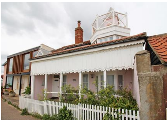
South Cliff Cottage, east elevation to South Cliff