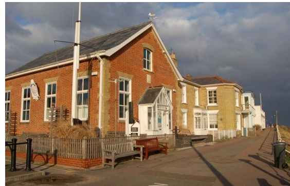
Sailors Reading Room and Simpson Memorial, East Cliff

Sailors Reading Room, East Cliff (Grade II)