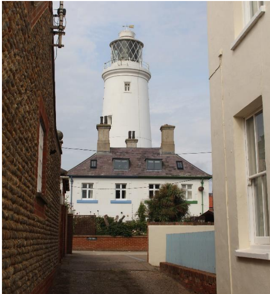
Former Lighthouse Accommodation Block from North Parade

Lighthouse Accommodation Block, Stradbroke Road (Positive Unlisted Building). Former accommodation block to lighthouse which was built c.1887-1892 by Trinity House. Its original design was by Sir James Douglass (1826-98) Chief Engineer to Trinity House. Originally designed as two cottages and shown as linked to the lighthouse on early Ordnance Survey maps. Painted brick with a hipped Welsh slate roof. The lighthouse was automated in 1938 and the cottages were no longer linked to the lighthouse by the time of the publication of the 1971 1:2,500 Ordnance Survey map. Twentieth century single storey additions to southern return elevation. Possibly a curtilage structure to the lighthouse and therefore afforded statutory protection.