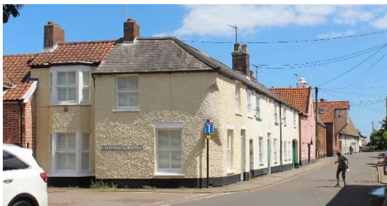
Nos.12-18 (even) Victoria Street from Bartholomew Green

Corn Store, No.10 Victoria Street (Positive Unlisted Building). Former grain store, possibly converted in the early to mid-nineteenth century from the service wing of the Grade II listed No.1 Bartholomew Green of which it now once again forms part. Converted to dwelling in the twentieth century. Rendered and scoured to imitate ashlar blocks with a red pan tile roof the words 'Corn Store' inscribed into the render. Two twentieth century small pane casement windows and a boarded door. A 1949 National Monuments Record photograph (BB49/3023) shows the upper floor of the façade as it is today, but with a small window and a second door where the present large ground floor window is located.