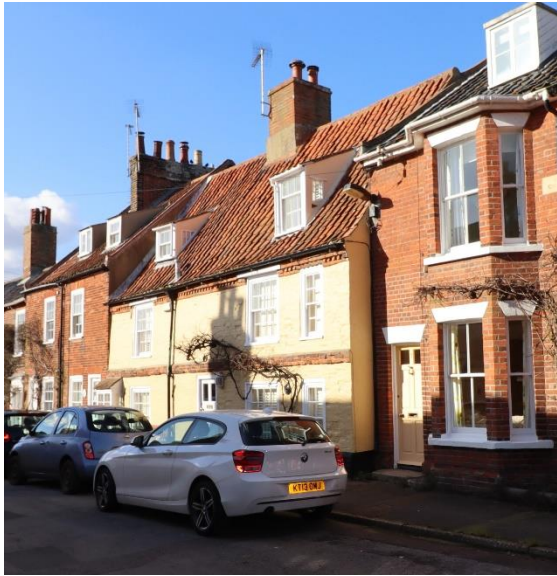
No.9 Park Lane