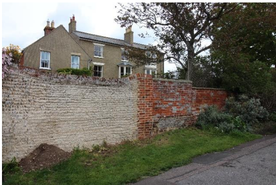
Cobble Boundary Wall, Strickland House, No.25 Park Lane