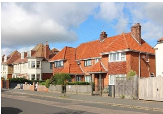
Nos.64 & 66 Pier Avenue

No.62 Pier Avenue (Positive Unlisted Building). A well-preserved detached villa of c.1905 which was probably designed by the London architect Edward Charles Homer (1845-1914). One of the first buildings to be completed on the Coast Development Company's building estate. Two storeys with attics. Red brick with a rendered first floor embellished with applied timber framing. Steeply pitched plain tile roof capped with decorative ridge pieces. Original plate-glass sash windows with small pane upper lights preserved. Original flat-topped dormers with casements to roof. Homer who was responsible for villas at Hampstead and Frinton Essex as well as for his early London cinemas. Designs by Homer of c.1905 for villas on Pier Avenue with applied timber framing to the upper floors were recorded by Bob Kindred in his survey of Suffolk architects but have sadly since been destroyed.