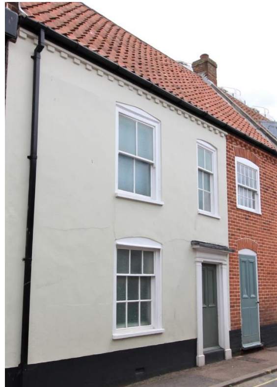
No.18 Church Street

Nos.2 & 4 Church Street (Positive Unlisted Building). A purpose-built former engineering works of 1896 constructed by James Powditch for William Powditch engineer and Whitesmith, now sympathetically converted to offices. Red brick with cast iron window frames. Two storey asymmetrical façade with arched red brick lintels and red brick sills. Boarded entrance doors and taking-in doors at first floor level.