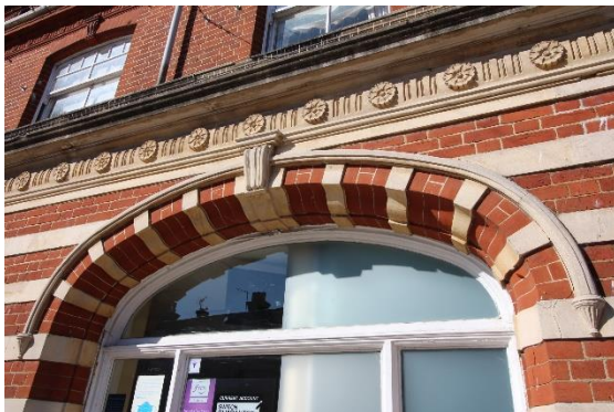
Window detail, No.67 High Street