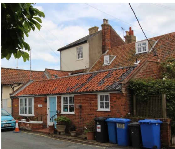
No.23 St James Green

No.23 St James Green (Positive Unlisted Building). A c.1800 structure with substantial late twentieth century alterations. Possibly originally a laundry or brewhouse for neighbouring Seaview House on East Cliff, now a dwelling. Red brick with a red pan tile roof. Old photographs show that the right-hand return elevation was originally partially of cobble. Late twentieth century casement windows. Boarded door.