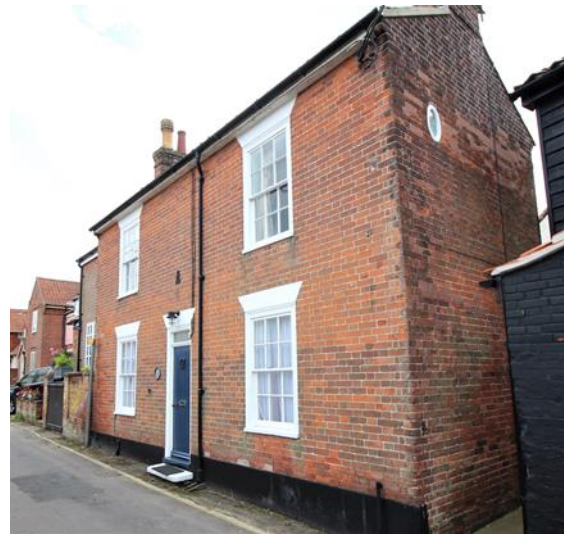
Elms Cottage, No.2 Mill Lane

Thyme Cottage, Mill Lane (Positive Unlisted Buildings). Mid-20th century cottage, painted brick at ground floor (front elevation only). 1.5 storeys with Arts and Crafts inspiration. Jettied central gable clad in hanging red tiles supported by carved timber brackets, two tile-clad dormers added in 2010s. Small-paned metal windows with red tile cills. An attractive 20 th century building, well-proportioned and maintained, which has received appropriately designed recent alterations.