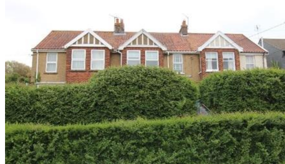
High Bank (left), Mount View and Kintyre (right), Station Road

See Bettley, J and Pevsner, N The Buildings of England, Suffolk: East (2015), p.523.