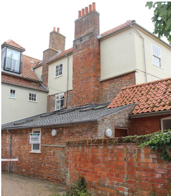
Rear of Buckenham House, High Street from Buckenham Court

Buckenham House, Nos.81 & 83 (odd), High Street (Grade II*)