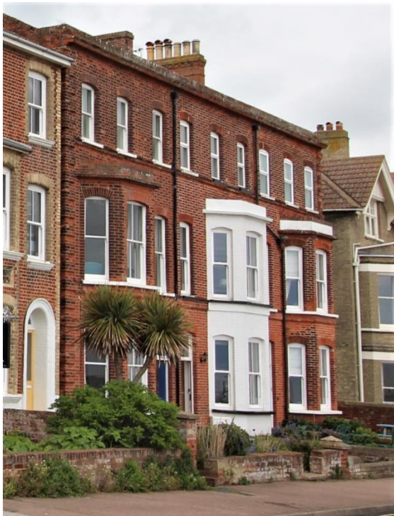
Nos.23-25 (cons) North Parade

Nos. 20-22 (cons) North Parade (Positive Unlisted Buildings). Three substantial dwellings of red brick, with gault, or Suffolk white brick window surrounds which form part of a terrace with Nos.18 & 19 and like them probably date from c.1894. Of three storeys and two bays each. Each house has a two-storey canted bay window, those to Nos.20 & 21 are now rendered. Arched front doors in moulded surrounds with partially glazed front doors. Window joinery to No.22 replaced, the other houses retain four light horned plate-glass sashes. No.21 has had its chimney stack removed. Later twentieth century dwarf brick boundary walls to North Parade. No.22 was a hotel in 1911 according to census returns and No. 21 apartments. Nos.21 & 22 are described as 'apartments' in Kelly's 1916 Directory.