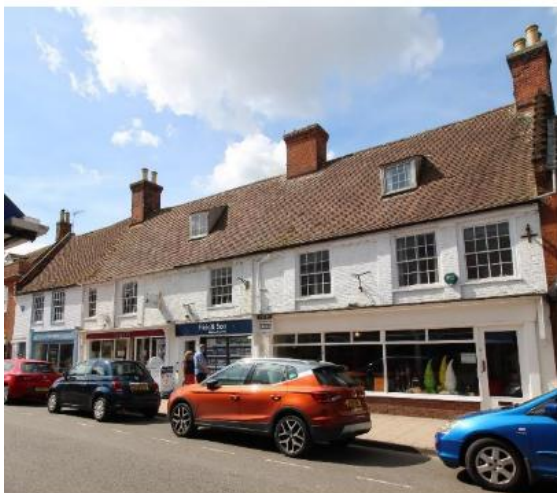
Nos.55-63 (odd), High Street

No.53 High Street (Positive Unlisted Building). House and lock up shop of c.1890 built on the site of a blacksmith's workshop. Originally with a crow-stepped gable to the splayed corner. Red brick with a Welsh slate roof. Early twentieth century photographs show this building with plate-glass sashes beneath shallow brick arched lintels, most of which still survive. Late nineteenth century shop fascia. Manor Farm Close elevation contains a partially glazed front door and four-light plate-glass sashes. No.53 makes a strong positive contribution to the setting of the listed buildings which flank it.