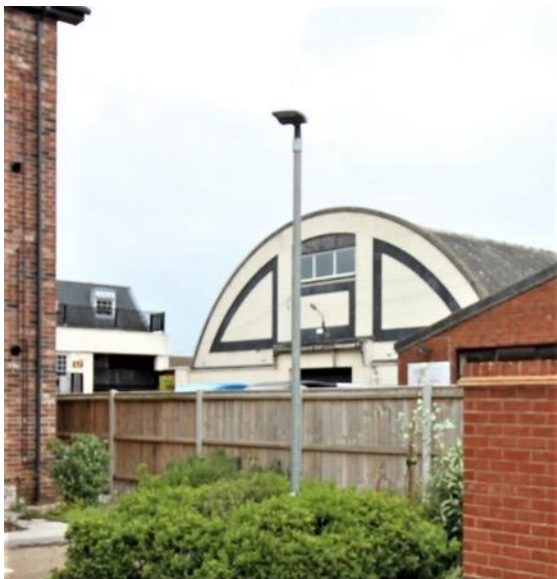
Unit 20 Southwold Business Centre, St Edmunds Road

Unit 20 Southwold Business Centre, St Edmunds Road The former Drill Hall, now known as Unit 20 Southwold Business Centre, was constructed in 1937 and has an innovative prefabricated 'Lamella' roof structure. Its geodetic barrel roof suggests that it would probably have been designed to have the capability to store anti-aircraft weaponry and vehicles as well as for its principal function as a