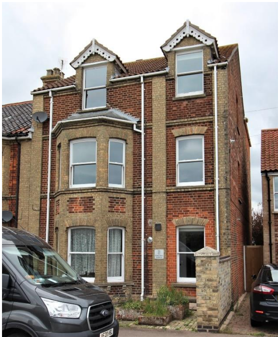
No.12A-12C Field Stile Road

entirely of red brick with two projecting wings, one of two storeys the other of a single storey, probably twentieth century and rendered. Plate glass sashes and dormers in roof slope. Good high nineteenth century red brick garden wall attached to rear of house marking Cautley Road boundary of plot. Gault brick low walls to front. The house plays an important role in the setting of the Grade I listed parish church which is located directly to its south.