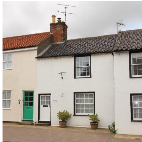
White Horse Cottage, No.19 High Street

hornless sashes. Partially glazed late twentieth century front door. Chimney stack removed.