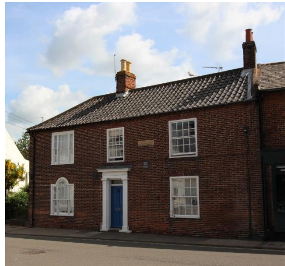
Montague House, No.36 High Street

Nos.28 & 30 High Street (Positive Unlisted Buildings). Two houses of early nineteenth century date. Built of red brick with a glazed black pan tiled roof. Twelve-light hornless sash windows. Decorative wedge shaped plaster faced wedge shaped lintels to window and door openings. Twentieth century partially glazed front doors. Tall red brick ridge stacks.