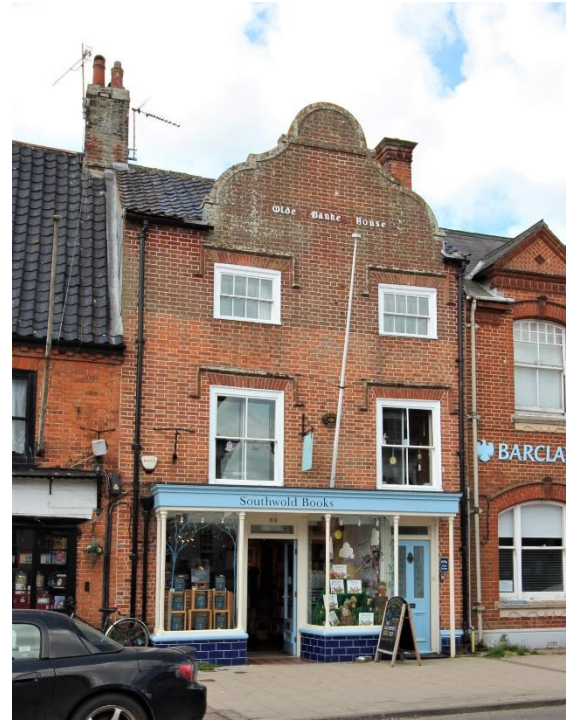
Old Banke House, No.69 High Street

buildings for the former Gurneys Bank in Norfolk and Suffolk during the late nineteenth century. Built c.1891 of red brick with stone and rubbed red brick dressings. Welsh slate roof. The former banking hall breaks forward slightly and has a decorative stone parapet, and a façade of alternate brick and stone courses. Arched window and door openings with keystones. Original partially glazed doors beneath plate-glass semi-circular fanlight. The other window openings to the principal façade have decorative stone sills and decorative brick arched lintels with pronounced fluted key stones. To the upper floor they are horned plate-glass sashes with small lights to the upper panels whilst on the ground floor is a tripartite sash. Substantial stack to the northern gable which projects slightly on the return elevation. Return elevation to Woodley's Yard of red brick with stone sills. Originally with managers accommodation on the upper floors. No.67 makes a strong positive contribution to the setting of the Grade II listed buildings which flank it and stand opposite.