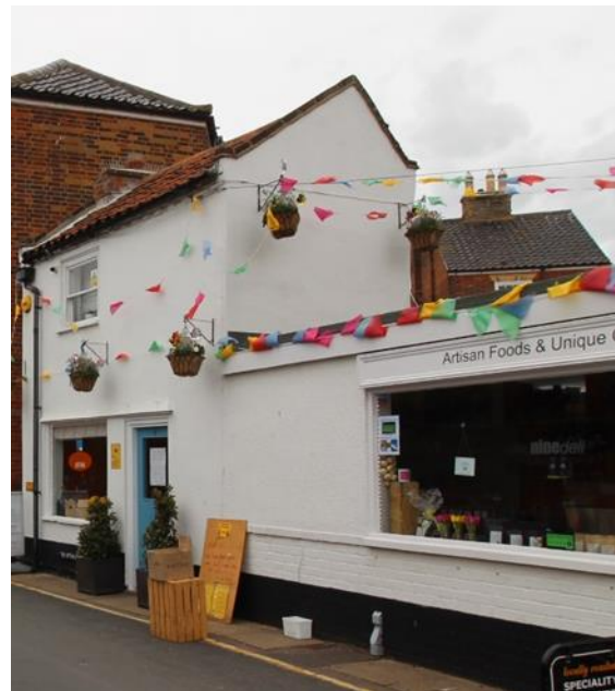
No.9 Pinkney's Lane

No.7 Pinkney's Lane and boundary wall (Positive Unlisted Building). A c.1800 red brick cottage with a red pan tile roof set within a small courtyard on the western side of Pinkneys Lane. A 1949 air photograph shows this as a pair of cottages with a second doorway in the blind left-hand section of the facade. (National Monuments Record EAW024298) Dentilled red brick eaves cornice and twelve light sashes. Lintel to ground floor window and front door appear to have been replaced. Twentieth century boarded front door. Brick capped cobble garden wall.