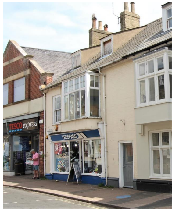
Nos.4 & 6 Queen Street