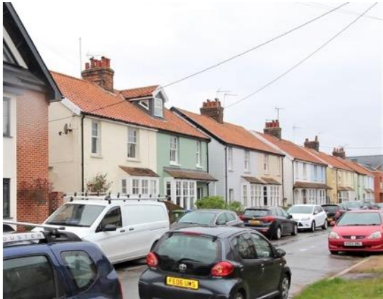
Nos.1-19 (Odd) North Road

Nos.1-19 (Odd) North Road (Positive Unlisted Buildings). Balanced composition of five well preserved pairs of semidetached houses which were constructed to a largely uniform design c.1928. Rendered brick with horned plate-glass sash windows and plain tile roofs to porches and bay windows. Principal roof slopes of red pan tiles. Bay windows with sashes divided by mullions to the ground floors. The central pair of houses have additional embellishments including continuous wooden porches which also provide a roof for the ground floor bay windows. Partially glazed front doors. Red brick ridge stack rising from the spine wall between each pair of houses. Dwarf red brick boundary walls to frontage.