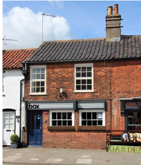
No.27 High Street

No.27 High Street (Positive Unlisted Building). Early nineteenth century former shop forming part of the same structure as the Grade II listed No.25. Red brick with a black pan tiled roof. Photographic evidence suggests that it had lost its shop fascia before 1948. Sash windows replaced by unsympathetic casements. Despite unsympathetic alteration No.27 makes an important contribution to the setting of the listed buildings to its immediate north.