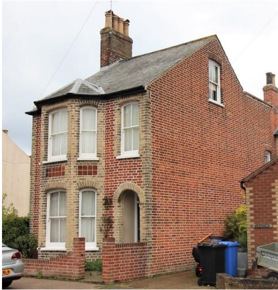
No.10 Salisbury Road

Nos.2 & 4 Salisbury Road (Positive Unlisted Buildings). A semi-detached pair of houses probably dating from the mid-1890s. Red brick with a Welsh slate roof. Tall red brick ridge stacks. No.2 retaining its original horned plate-glass sashes. Original panelled door with rectangular fanlight above. No.4 painted and with unsympathetic replacement windows and door within original openings. Low red brick boundary wall to Salisbury Road which appears to have been rebuilt.