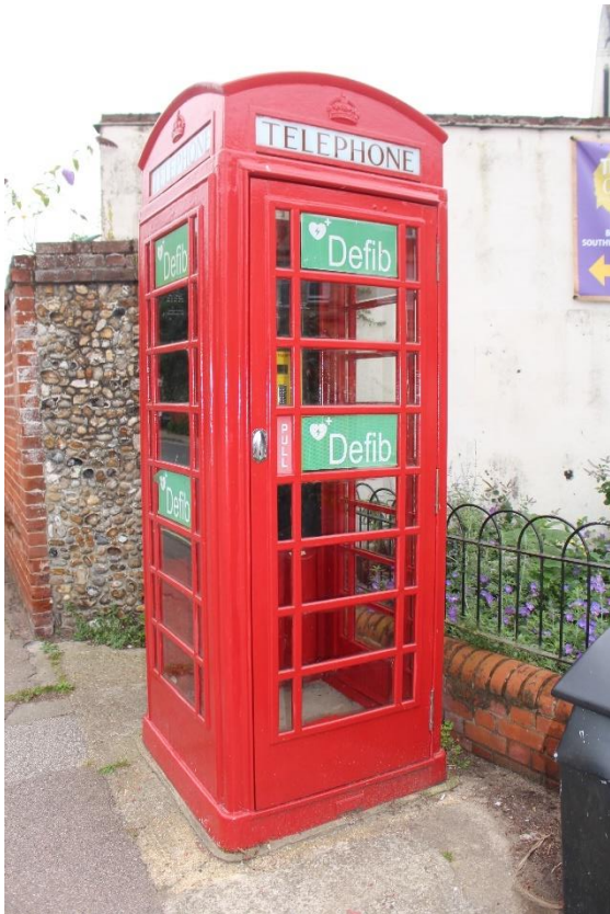
K6 Telephone Box, Victoria Street

Southwold Museum, Victoria Street (Grade II)