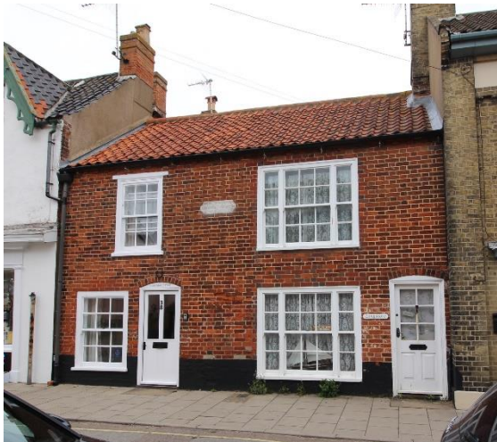
Horseshoe Cottage No.38 and Longshore, No.40 East Street

No.36 East Street incorporating the former Nos. 1 & 3 Trinity Street (Positive Unlisted Building). A prominently located mid nineteenth century shop of red brick with a black pan tiled roof. Decorative pierced bargeboards to gables now sadly lacking their spear finials. Twelve light hornless sashes to first floor windows. Casements to second floor. Ground floor retains late nineteenth century shop fascia with splayed corner entrance flanked by pilasters.