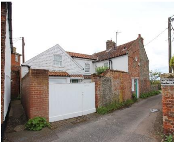
Skilmans Cottage, Skilmans Hill, north elevation

South Cliff Cottage, South Cliff (Positive Unlisted Building). A complicated and multi-phased property of mixed character. Essentially two cottages; one located to South Cliff and facing the sea and one located to the west. Both structures appear to be shown on the 1884 OS map, and have been linked by a single storey range at least since the 1970s (link range rebuilt c.2017) and the 1927 OS maps shows a range of outbuildings between the two structures. The property facing South Cliff retains much late 19 th century detailing and joinery, including the timber canopy over the veranda, and plate glass sash windows. An octagonal belvedere with slender access tower, added to the north east corner of the property, adds an unconventional flourish to the property. The cottage to the west is two storey, more conventional, constructed from flint with a pitched roof covered with pan tiles and gable end stacks.