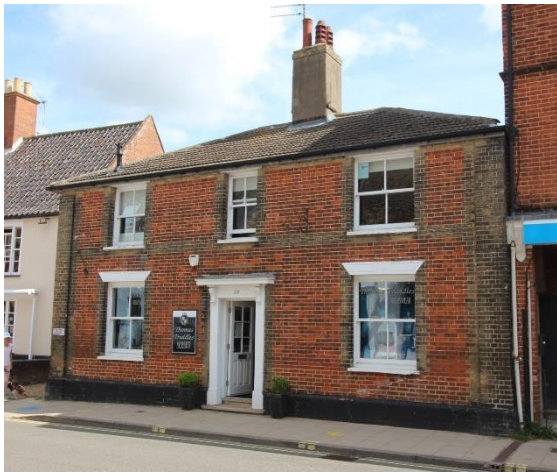
No.58 High Street

Sutherland House, No.56 High Street (Grade II*)