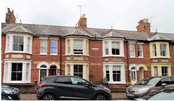
Nos. 6-12 (even) Dunwich Road

Dunwich Terrace, Nos.6-12 (even) Dunwich Road (Positive Unlisted Buildings). A terrace of four houses. Shown completed on a photograph taken on the 18 th of October 1893 from the lighthouse which is preserved in Southwold Museum. Red brick with painted stone dressings. Two storey canted bays with pilasters and carved lintels and decorative tile insets between the floors. Welsh slate roof with finials above the canted bay windows. Horned plate-glass sashes. Paired arched recessed porches containing partially glazed panelled doors. The door to No.8 still retains stained and leaded glass panels. Some houses now with secondary door flush with the façade. Twentieth century dwarf red brick walls to Dunwich Road. Possibly by the same builder as No.16 Chester Road. John Miller Britain in Old Photographs: Southwold (Stroud 1999) p83.