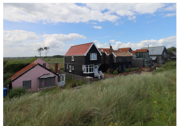
No.31 'Beach House', Ferry Road

No.29 'Weathervane', Ferry Road (Positive Unlisted Building). A modest fisherman's cottage constructed from washed cobble with brick margins, to which a first floor was added which was then remodelled, the upper floor clad in timber and bay windows and a porch were removed c.2014. Red pan tile roof covering, with three gable ends running from front to back, with a gable end brick stack to the southern end.