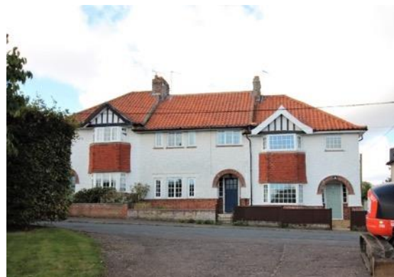
Nos.59-63 (Odd) Marlborough Road

See also No.66 North Road and Nos.51 & 53 Pier Avenue. For the southern section of Marlborough Road, south of Field Stile Road, see the Seaside Corporation Character Area.