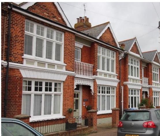
Nos.3 & 5 Cautley Road

No.1 Causley Road (Positive Unlisted Building). A brick villa of c.1900 (shown on the 1904 1:2,500 Ordnance Survey map) possibly associated with the adjoining former hospital. Of three bays with a central pedimented breakfront containing a pilastered porch with double, partially glazed doors. Mullioned and transomed original casement windows. Heavy dentilled brick eaves cornice. Jenkins, A Barrett A Visit to Southwold Containing Over 100 Photographs of Historic Interest (Southwold, 1983) p 28.