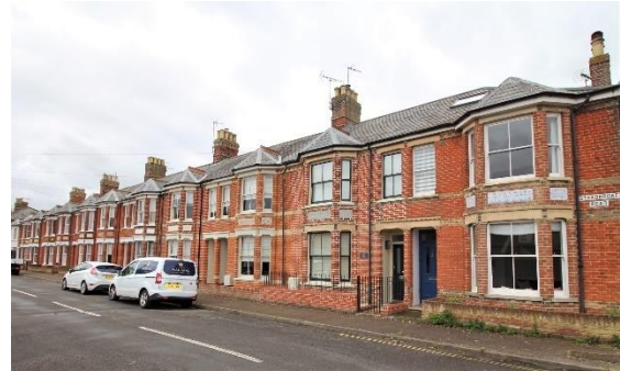
Stradbroke Terrace Nos.58-80 (even) Stradbroke Road

October 1893 in the Southwold Museum collection. Red brick with Suffolk white brick dressings and horned plate-glass sashes. Welsh slate roof with red brick ridge stacks. Recessed arched porches containing partially glazed, panelled doors beneath rectangular fanlights. No. 56 has its door set within its return elevation to Salisbury Road.