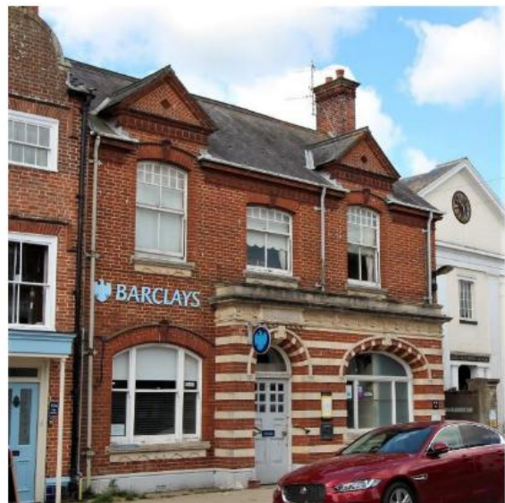
No.67 High Street

United Reformed Church, High Street (Grade II)