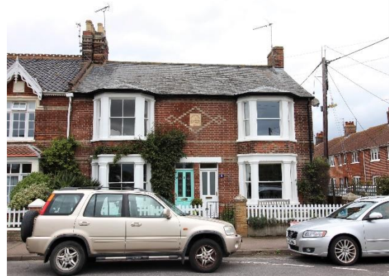
Nos.8 & 9 Field Stile Road

Museum Collection. Mullioned and transomed casement windows above. Passageway embellished with hood mould to rear gardens between Nos. 1 & 3. Contemporary gault and red brick dwarf garden walls with square-section piers with pyramidal caps. The terrace plays an important role in the setting of the Grade I listed parish church which is located directly to its south. John Miller Britain in Old Photographs: Southwold (Stroud 1999) p124.