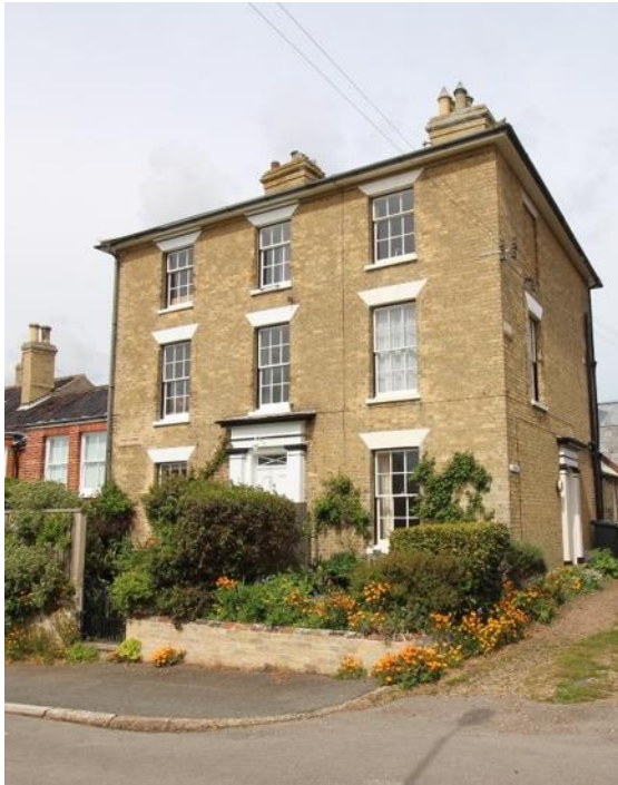
Lydstep House and Coign, Constitution Hill