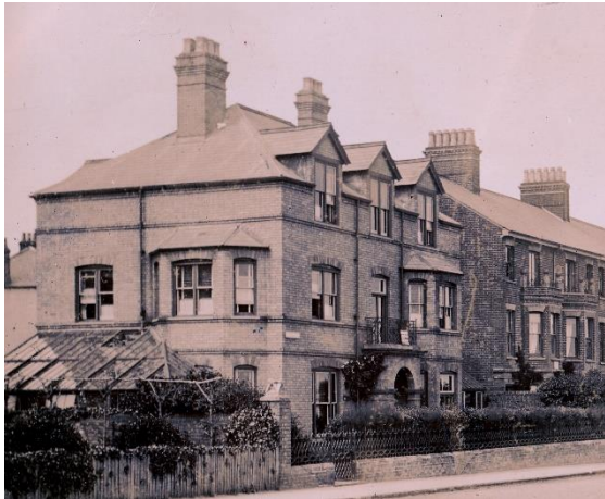
No.14 North Parade c.1910

evidence suggests replaces a small conservatory. Southern return elevation of two bays has a canted bay of two storeys which originally contained paired sashes with a central mullion but now contains a single plate-glass sash. Lean-to conservatory which is shown on early twentieth century photographs. Marlborough Road elevation has a twentieth century addition with a steeply pitched Welsh slate roof. Low painted brick wall to North Parade the southern section of which is capped with simple iron railings. Square section gate piers. High boundary wall to southern and Marlborough Road frontages also now painted. John Miller Britain in Old Photographs: Southwold (Stroud 1999) p83