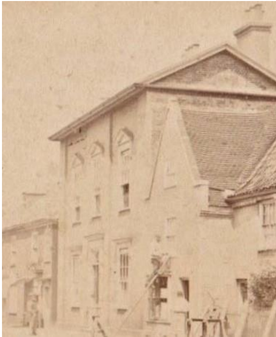
Rutland House, No.80 High Street c.1870