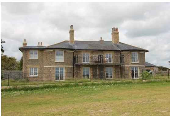
Stone House, Gun Hill

Coach House, Gun Hill (Positive Unlisted Building). Former Coach House located to the north of Stone House, with which it shares many characteristics, including cobble walls with brick margins, shallow pitched slate covered roof and overhanging eaves. Converted to residential use during the 1970s. While door and window joinery is replacement, they exist within the original openings ensuring the original form and function of the structure is easily identifiable. The unbroken roof, free from skylights and dormers, and the cobble end gable which faces Gun Hill makes a significant contribution to the conservation area.