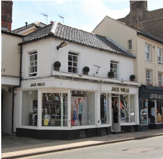
No.94 High Street