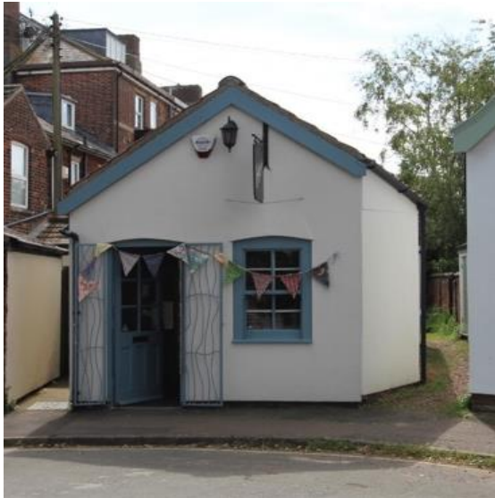
Tor Schotte Antiques, Blackmill Road

Tor Schotte Antiques, Blackmill Road (Positive Unlisted Building). Former bakehouse to Clarke's bakery premises at 35 High Street and 8 Victoria Street. First shown on the 1904 1:2,500 Ordnance Survey map. Rendered elevations with off centre ridge and pan tile covered roof. Horned two over two pane sash window, with later inserted door. The structure contributes to the conservation area through its modest charm and also reflects the economic history of the town.