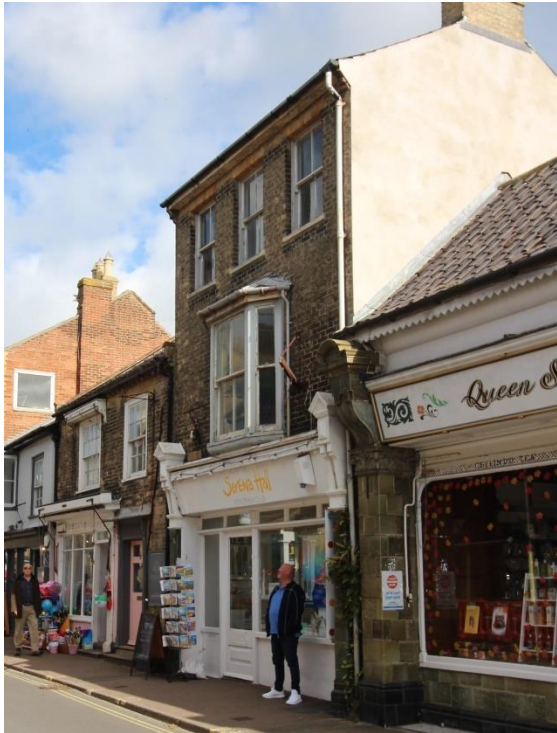
No.16 Queen Street