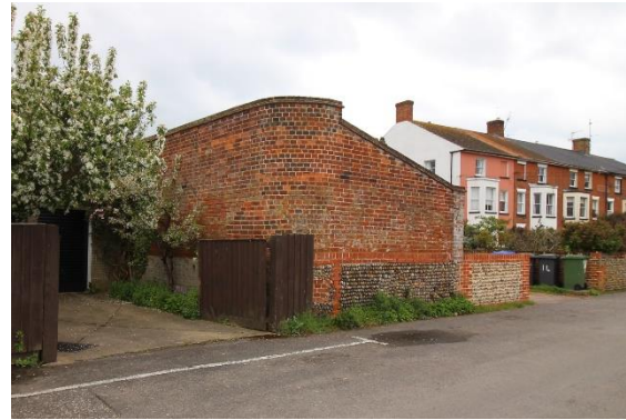
Wall enclosing courtyard at The Anchorage, No.14 Cumberland Road