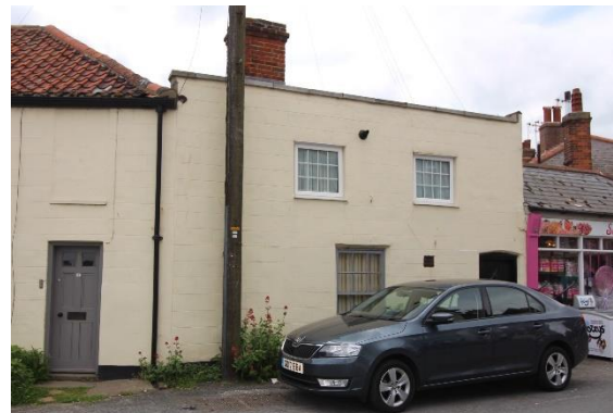
No.1 St James Green

No.1 St James Green (Positive Unlisted Building). Early to mid-nineteenth century structure of painted brick with a high parapet. Tall red brick chimneystack. Unsympathetic late twentieth century replacement windows. Attached to it a single storey lock up shop which retains its original c.1930 shop fascia. According to Southwold and Son the shop was designed by FR Rowe for the tobacconist FC Barber.