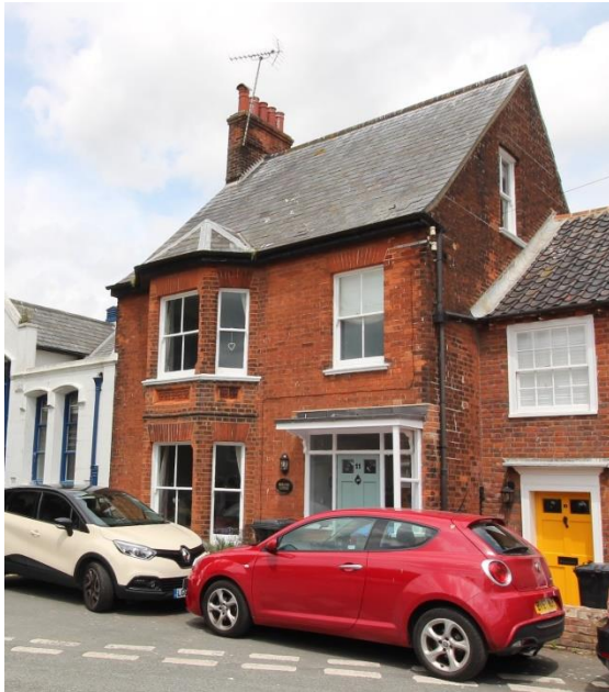
Rokeby Lodge, No.11 East Green

Rokeby Lodge, No.11 East Green (Positive Unlisted Building). A red brick villa of c.1900 with rubbed red brick dressings. The site of this dwelling is shown as vacant on the 1884 1:2,500 Ordnance Survey map but occupied by the present building by that of 1904. Full height canted bay window with horned plate-glass sashes. Steeply pitched Welsh slate roof. Front door opening modified in later twentieth century to allow glazed lights to be fitted surrounding the opening. Bracketed later twentieth century hood above. Twentieth century panelled door. Substantial chimney stack to northern gable. A prominent located house which despite alteration contributes to the setting of both the Methodist Chapel and listed buildings on St James Green.