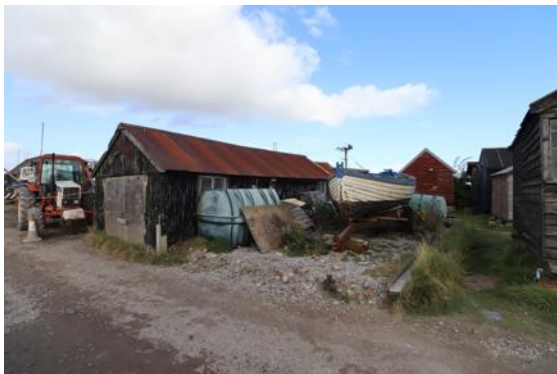
Justin E Ladd Store, Blackshore