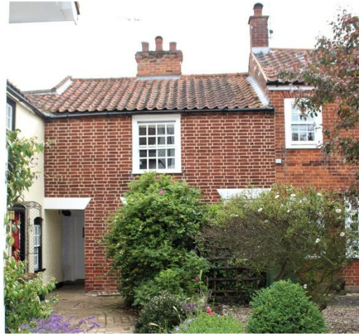
No.22 High Street