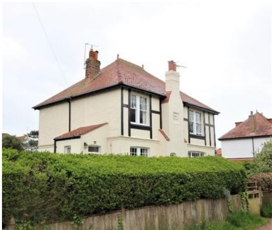
Creek House, No.70 North Road

No.68 North Road (Positive Unlisted Building). Substantial detached house of c.1912, probably designed by Edward Charles Homer (1845-1914) who also designed villas on Pier Avenue. Faced in red brick with render and applied timber framing to the first floor. Hipped plain tile roof with large late twentieth century flat roofed dormer and projecting eaves. Plate glass sashes with small panes to upper lights. Central door opening now set within late twentieth century glazed porch.