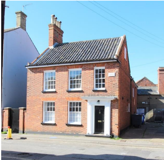
No.7 East Street