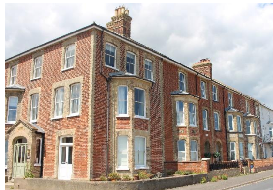
Nos. 7-10 (cons) North Parade

Nos. 5 & 6 North Parade including 'Dobcott' Chester Road (Positive Unlisted Buildings). A pair of substantial houses which probably date from the early 1890s. Of red brick with gault, or Suffolk white brick dressings. Original Welsh slate roof replaced with pan tiles, ornate bargeboards with spear finials to gables and overhanging eaves. Original four light plate-glass sashes largely retained but No.5 has French doors above its ground floor bay window. Arched door openings. Low boundary wall to No.5 of gault brick whilst that to No.6 is of red brick.