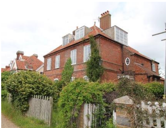
Nos.3 (right) and 4 (left), Strickland Place

Nos.1 and 2, Strickland Place (Positive Unlisted Building). A pair of late nineteenth or early twentieth century houses facing Nursemaid's Park., Built from red brick with flush quoins, string course and corbelled eaves detailing in white brick. No.2 is better preserved and retains its stone lintels and sills and some original joinery. All windows to No.1 have been enlarged, to the detriment of the both properties. Side entrance extension added to No.1, probably dating from the late 1940s. Attic dormers and gable end chimney stacks with corbelled caps create a lively roofscape. The roof itself is covered with blue glazed pan tiles to the south and north pitches. Enclosing the front gardens is a low red brick boundary wall, topped with timber palisade fencing. The wall contributes positively to the setting of the houses.