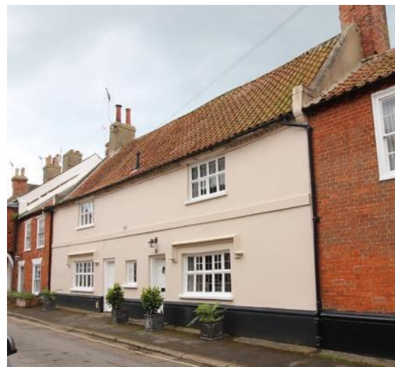
Nos.16 & 18, Park Lane