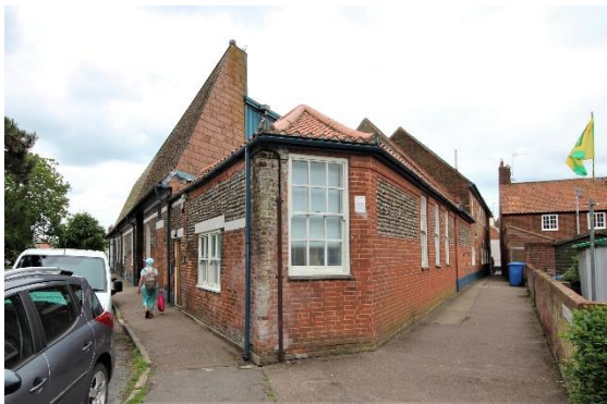
Former Maltings Complex from north

Palm Cottage, No.34 & Albert Cottage, No.34A Victoria Street (Positive Unlisted Buildings) A red brick terrace of three cottages which probably date from c.1880. Palm Cottage and No.34 retaining their original horned plate-glass sashes. Wedge shaped plaster lintels. Red pan tiled roof. Ridge stack rising from spine wall between Palm Cottage and No.34 and second stack to gable of No.34A. Twentieth century front doors.