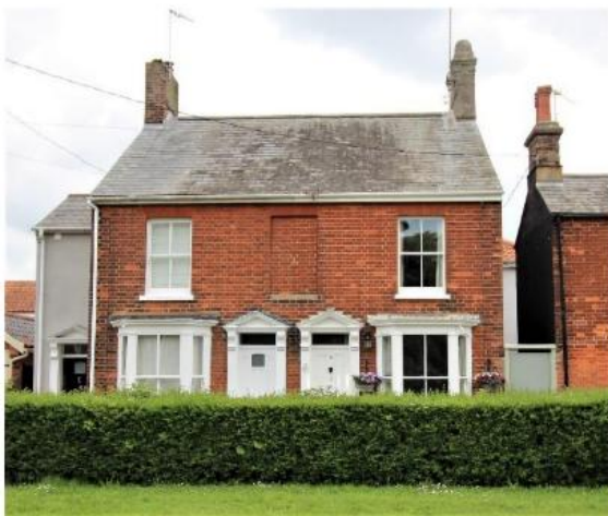
Nos. 5 & 6 Bartholomew Green