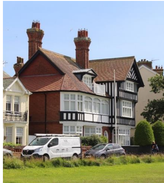
Langford Lodge, No.7 Godyll Road

windows, plate glass to the lower sash and decorative margined design to the upper, which contribute significantly to the building's character. Slate covered roof. An attractive red brick wall with pierced brickwork upper section encloses the front garden and makes a positive contribution to the setting of the house.