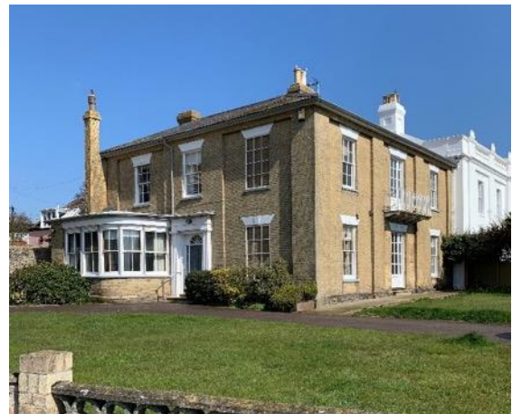
South House, No. 12 South Green