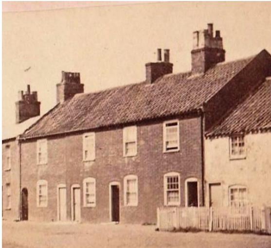
Nos.14-20 (even) St James Green from a c.1870 carte de visite.