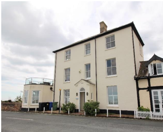
Seaview House, East Cliff

Seaview House, No.20 East Cliff (Positive Unlisted Building). A substantial sea front dwelling of three storeys which is attached at its rear to a further, and now much altered substantial nineteenth century villa (now Nos.19 East Cliff & 21 St James Green). A complex of similar form appears on Wake's 1839 map. The present Seaview House is probably of mid nineteenth century date and is rendered with a hipped Welsh slate roof slope to the front and a red pan tiled one to the rear. Three bay symmetrical entrance façade with horned plate-glass sashes. Single storey twentieth century canted bay addition to seaward end. Central gabled porch with arched doorway. Sea facing elevation has a two-storey canted bay window. Good nineteenth century red brick wall surrounding garden to east.