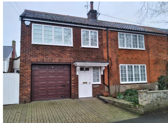
No.5 North Green

Well Cottage, No.3 & Olivers, No.4, North Green (Positive Unlisted Buildings). Pair of relatively unaltered white brick semi-detached cottages, probably of mid nineteenth century date. Plate glass horned sashes beneath decorative plaster faced wedge-shaped lintels, which contribute much to the buildings' character. No.3 has late twentieth century glazed door, which is visually jarring, while the door to No.4 partially glazed with panels beneath. Welsh slate roof with substantial brick stack rising from party wall between the cottages.