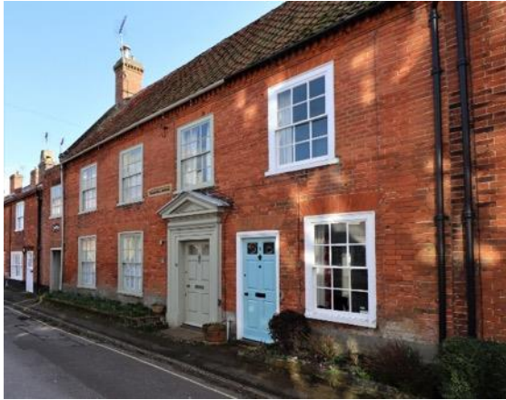
No.6 Bradwell House & No.8 Park Lane

to No.4 and smaller paned to No.2. Ground floor windows of tripartite arrangement under soldier course brick lintel is a later reworking. These cottages form part of a run of red brick cottages to the eastern end of Park Lane.