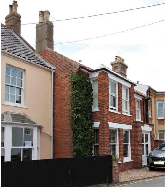
Suffolk Cottage, No.87 Victoria Street

Suffolk Cottage, No.87 Victoria Street (Positive Unlisted Building). Late nineteenth century villa of red brick with horned plate-glass sash windows beneath shared wedge-shaped lintels. Full height bay window. Partially glazed front door within projecting flat roofed porch with parapet. Arched doorway to passage at northern end with boarded door. Red pan tiled roof. Later twentieth century red brick garden wall to frontage recently removed.