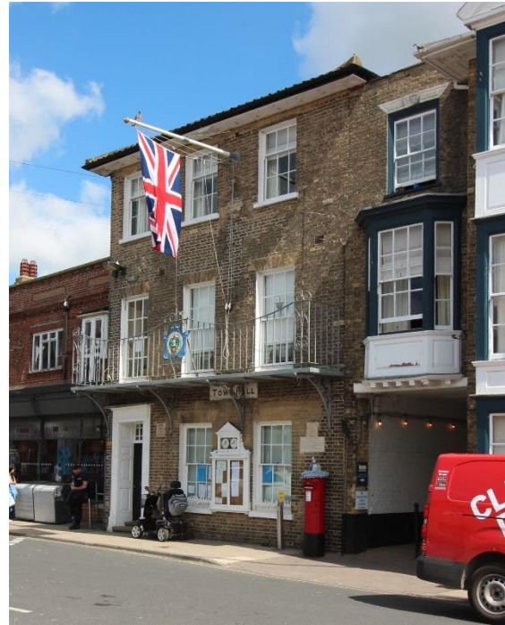
Town Hall, Market Place