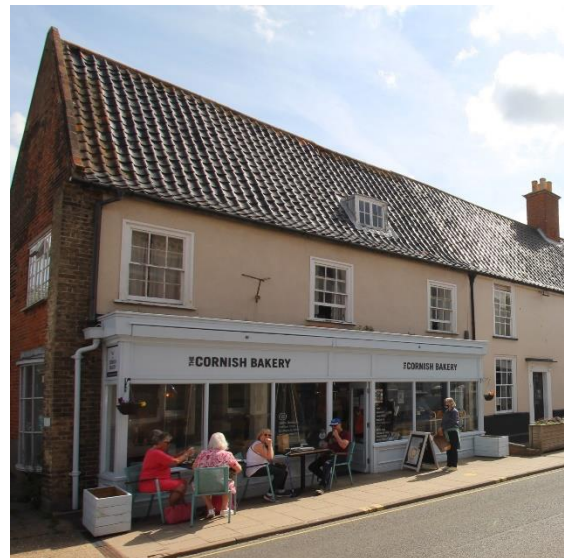
Nos.54 & 54A High Street

Town Sign, High Street (Positive Unlisted structure) A decorative mid twentieth century town sign depicting the battle of Sole Bay (1672) with the town seal above. The sign rests on brackets which form galleons. Square section wooden pole. A prominent landmark at the junction of High Street and Victoria Street. The sign occupies the site of houses demolished for road widening by Southwold Corporation in 1934.