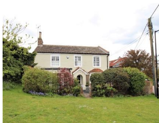
Hill-side and boundary wall, Skilmans Hill

Hill-side, Skilmans Hill (Positive Unlisted Building). A late 19 th century detached villa with two storey painted render entrance elevation. Central entrance with a projecting open porch. Either side are projecting bays; the canted bay to the left with pitched plain tile roof originally being repeated to the left of the entrance, now rebuilt as a much larger flat roofed bay. Pan tile roof with upstand brick detail to facing the road, and an usual elevation of washed cobble and red brick headers laid on edge, creating a diaper pattern. Single red brick stack to the opposite gable end. The north east boundary to Skilmans Hill is attractively informal, with the grass of the hill abutting the boundary and a good iron hand gate. To the north west is a good brick and cobble wall which encloses the boundary.