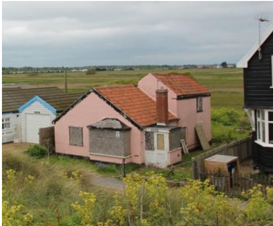
No.33 'Kilkee', Ferry Road

gable end carried out over a canted bay to the ground floor, creating a small covered entrance area and supported by timber brackets. Roof covered with unusual diamond pattern red roof tiles. Replacement uPVC windows, but the entrance door appears to be original.