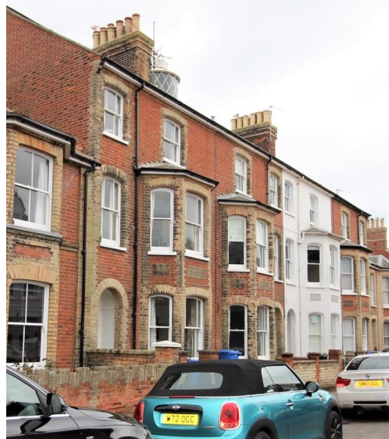
Nos.4-10 (even) Chester Road

No.2 Chester Road (Positive Unlisted Building). A villa built on a plot sold by Southwold Corporation in 1885 with the proviso that a dwelling costing not less than two hundred and seventy pounds be constructed on the site. Map evidence suggests that it was built between 1891 and 1904 whilst at least two houses were occupied by the time of the 1891 census. Save for No.16, the houses on Chester Road were probably constructed by the same builder. Red brick with elaborate gault brick dressings and pilasters. Two storeys and two bays with original horned plate-glass sashes. Partially glazed front door set within recessed arched porch. Reroofed but retaining decorative brick ridge stack and original decorative pots.