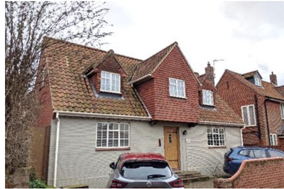
Thyme Cottage, Mill Lane

Pinkneys Way, Mill Lane Street (Positive Unlisted Building). Mid-20th century red brick house with black pantile roof. Built in Flemish bond with blue/burnt brick headers. At two storeys it is somewhat overscaled, however the use of good brick details and simple timber windows make it blend well with other historic buildings in the street.