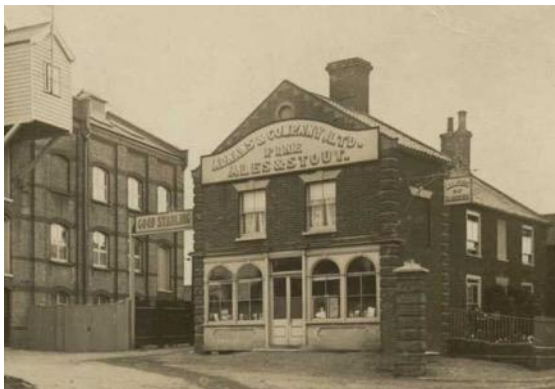
Postcard view of c.1910 showing No.2 High Street when operating as The Marquis of Lorne

Despite the loss of the central doorway on the Field Stile Road this elevation retains the windowed part of its public house frontage and the building remains a prominent and attractive landmark on the approach to the town centre from the north. Doorway inserted into northern end of High Street elevation in the later twentieth century. Nineteenth century dwarf red brick wall to High Street boundary which was formerly capped with railings.