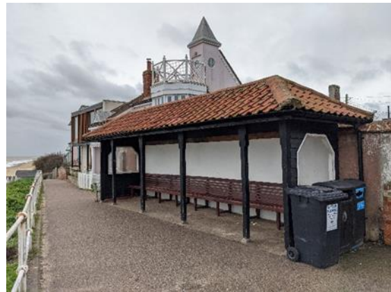
Shelter, Primrose Alley

Shelter, Primrose Alley (Positive Unlisted Building). Twentieth century, with a black stained timber frame and hipped red pantile roof. Rectangular plan, open to the east. Part of a cliff top group in Primrose Alley. Good example of a public structure.