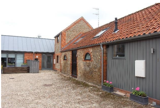
Nos.1-3 cons, Smokehouse Court

Nos. 1-3 cons, Smokehouse Court (Positive Unlisted Buildings). Former Smoke House loose box and cart shed converted to three small dwellings as part of a residential development c.2016 by Chaplin Farrant Architects. Eastern range of mid nineteenth century of cobble with red brick dressings, a dentilled red brick eaves cornice, and a red pan tiled roof. Two storey section at northern end with early twenty first century casement windows in original openings, the rear elevation of this section is in red brick. Central section of a single storey with a central boarded door flanked by lunettes. Former cart at southern end of possibly slightly later date the cart entrance now infilled with painted wooden boarding. Cobble rear elevation visible from car park on Trinity Street continued in nineteenth century cobble wall, metal covered roof slope. Northern range of a single storey retaining small nineteenth century red brick structures at either end now linked by a glazed central section with a metal covered roof slope.