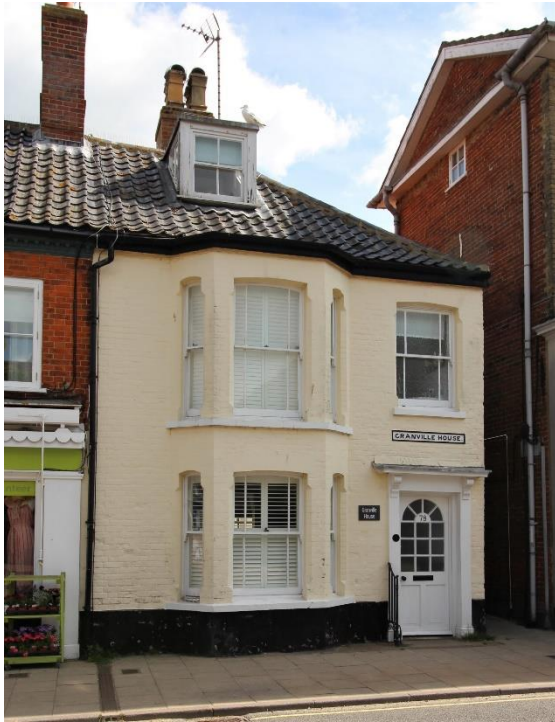
Granville House, No.78 High Street

Granville House, No.78 High Street (Positive Unlisted Building). Late nineteenth century façaded dwelling of now painted brick retaining its original plate-glass sash windows and bracketed wooden doorcase. Late twentieth century partially glazed front door of unsympathetic design. Black pan tiled roof of probably much earlier date with nineteenth century flat roofed dormer containing a four-light sash to High Street façade, rear roof slope of red pan tiles. The sash window above the front door has narrow margin lights. Rear elevation visible from Bank Alley of mid eighteenth century or earlier date. Gabled and rendered with nineteenth century plate-glass sashes. Probably originally part of the same building as Nos.74 & 76 which appear to be of a mid-eighteenth century or earlier date. An important part of the setting of adjoining listed buildings.