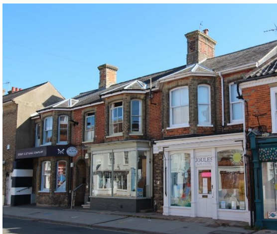
Nos.68-72 (even) High Street

Nos.68-72 (even) High Street (Positive Unlisted Buildings). A short terrace of later nineteenth century shops and dwellings faced in red brick with Suffolk white brick dressings. Welsh slate roof with ridge stacks rising from the spine wall between the