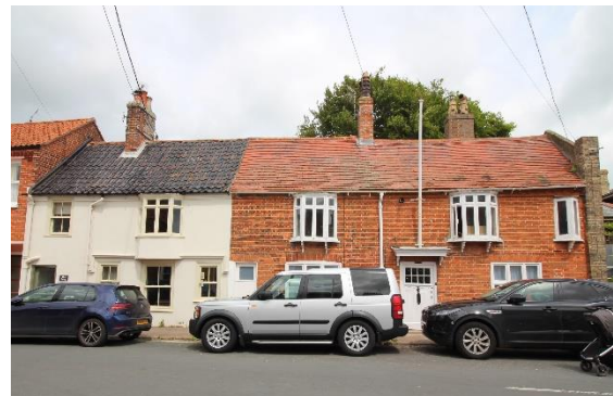
Nos.1-5 (odd) Lorne Road

May Place (Grade II) – See South Green in Marine Villas Character Area