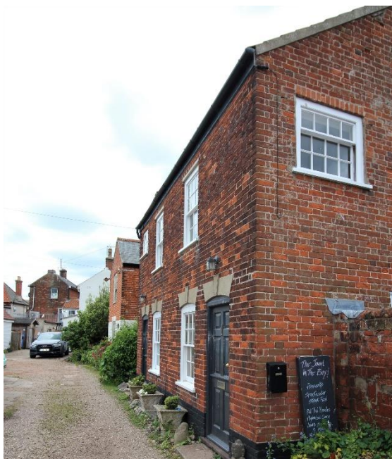
Nos.1 & 2 Youngs Yard

Boundary Wall to Electricity Substation on northern side of Youngs Yard (Positive Unlisted Structure). Red brick garden wall possibly of mid nineteenth century date and probably originally marking the boundary of the garden to Rutland House No.80 High Street. The wall springs from the gable end of No.1 Youngs Yard and runs to Victoria Street. The bricks are laid on their sides. Late twentieth century square-section gate pier at junction with Victoria Street. See also Bank Alley and Victoria Street for other sections of this wall.