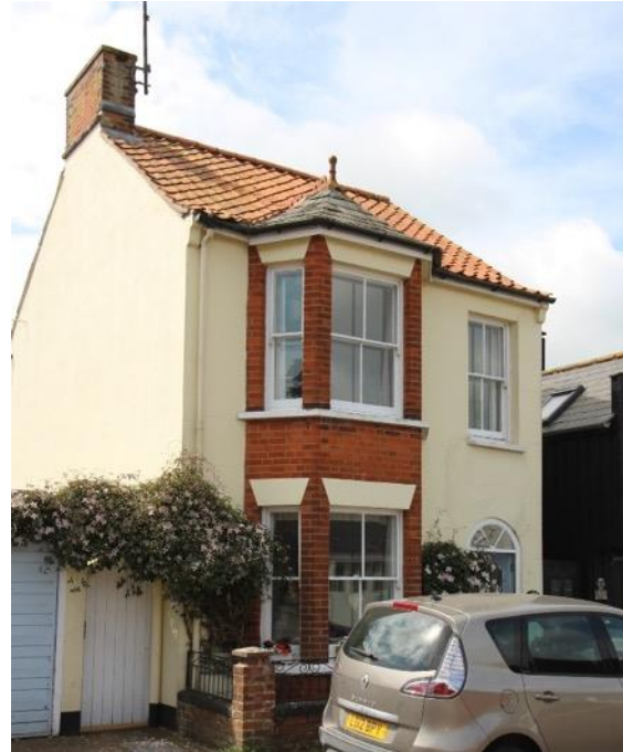
Martyn Lodge, No.1 Blackmill Road

c.2012 with additions made to the rear. The upper sash is a later insertion and the ground floor windows are replacements, originally the ground floor window to the centreline of the building was taller. Pan tile roof covering, with plain tiles to the porch addition.