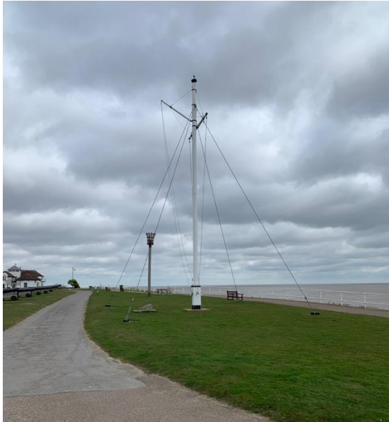
Timber mast, Gun Hill

Beacon basket, Gun Hill (Positive Unlisted Structure). Iron basket comprising vertical straps and horizontal hoops, flaring out towards the top. Without date or inscription but possibly erected to commemorate The Queen's Silver Jubilee in 1977.