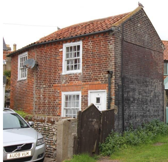
No.7 Pinkney's Lane

Cottage behind No.9 East Street & 5 Pinkney's Lane (Positive Unlisted Building). A small weatherboarded structure of probably nineteenth century date with a red pan tiled roof which is only visible from Pinkneys Lane but accessible via East Street. It appears to be shown on the 1884 1:2,500 Ordnance Survey map but has been significantly reduced in size. Partially rebuilt nineteenth century cobble boundary wall on eastern side.