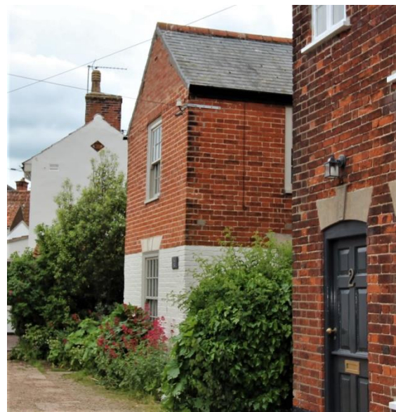
No.3 Youngs Yard

No.3 Youngs Yard (Positive Unlisted Building). Detached early nineteenth century red brick cottage, which was probably originally two cottages. Wedge shaped plaster faced lintels to the doors and windows. Late twentieth century horned small-pane sashes. Partially glazed and panelled doors. Substantial red brick stack rising from what was probably the party wall between the two