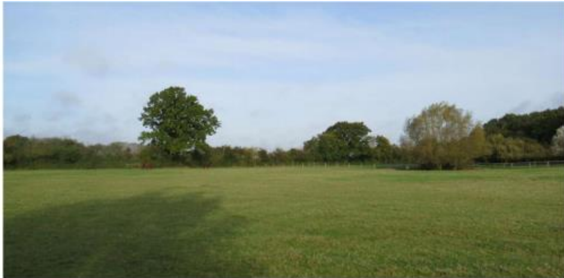
View to the north-west of the wider paddock area