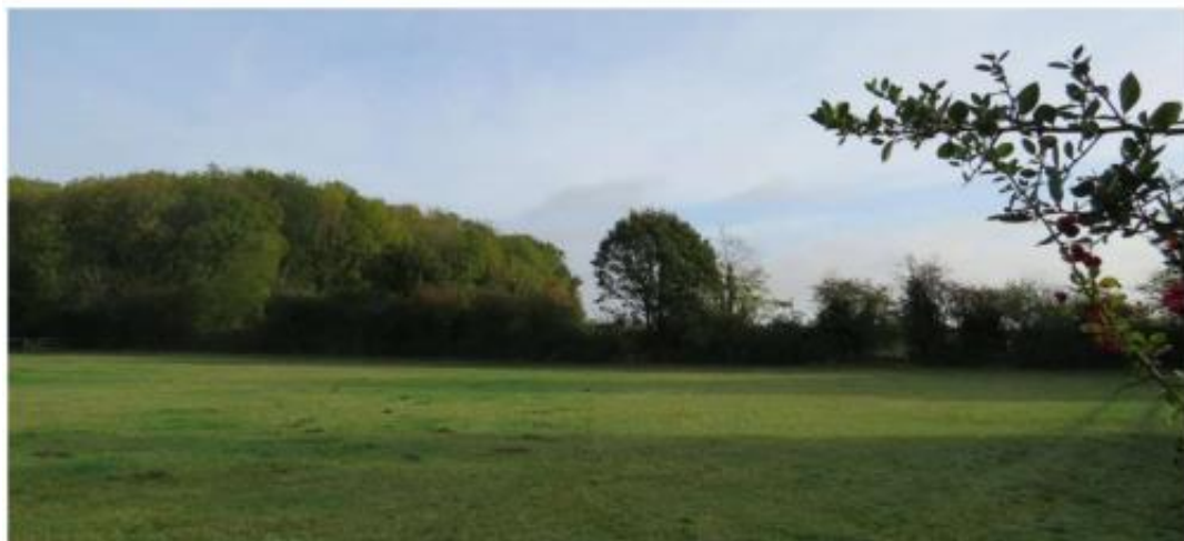
View of the eastern paddock boundary from within the site