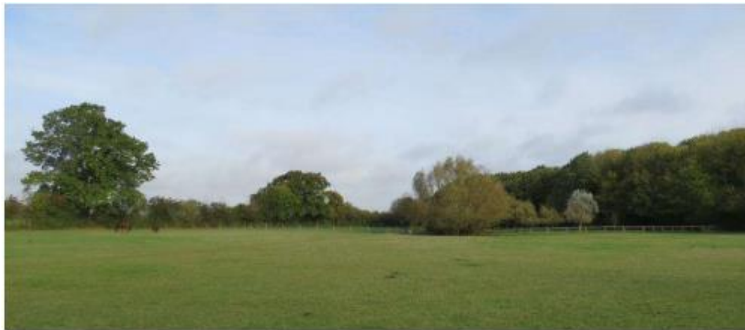
View of the paddock looking north