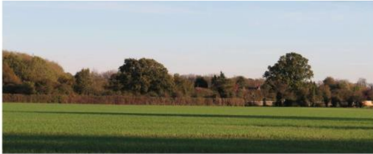
View from west of Severalls Road