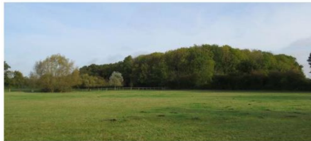
View of the wood to the north-east of the existing paddock