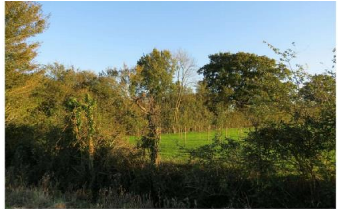
Obscured view from the footpath