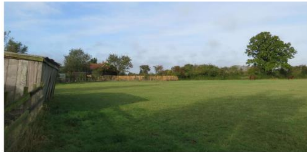
View of the western paddock boundary from within the site