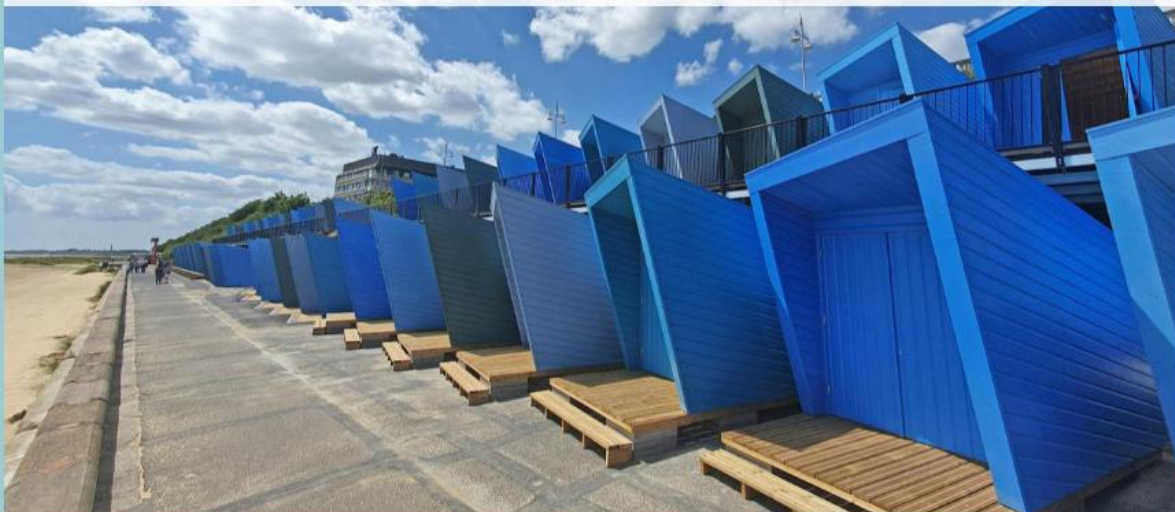
EASTERN EDGE BEACH HUTS, LOWESTOFT