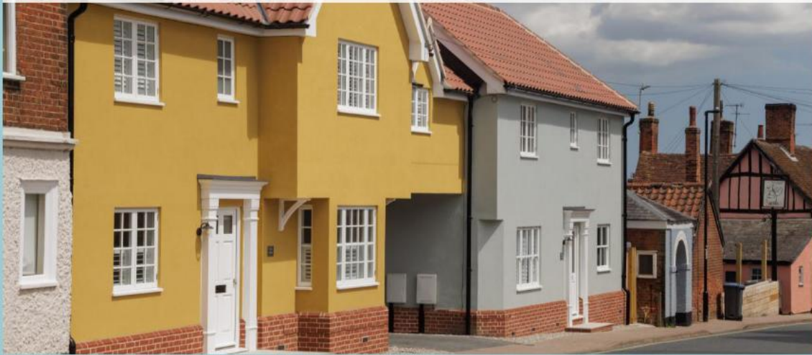
THEATRE STREET, WOODBRIDGE