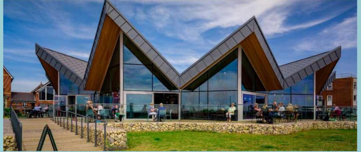
MARTELLO CAFÉ, FELIXSTOWE