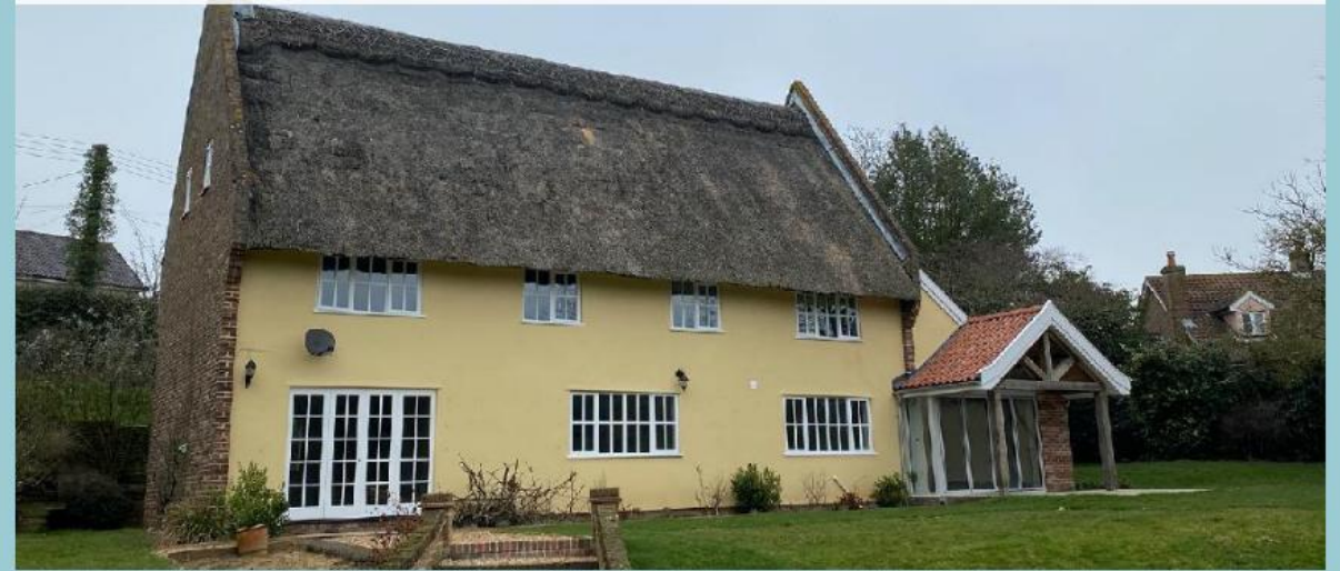
BRIDGE HOUSE, FRISTON