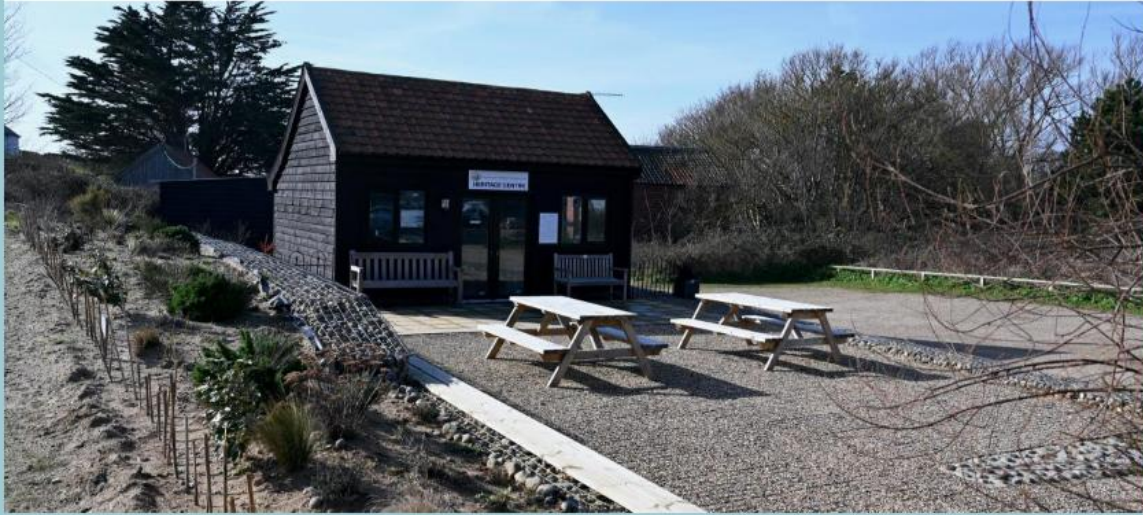
ADRINGHAM & THORPENESS HERITAGE CENTRE