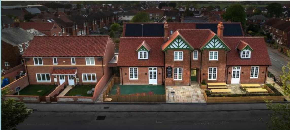
THE OLD HOSPITAL, SOUTHWOLD