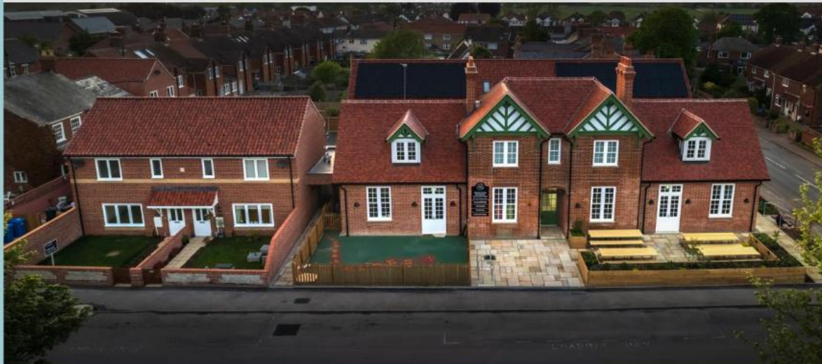
THE OLD HOSPITAL, SOUTHWOLD