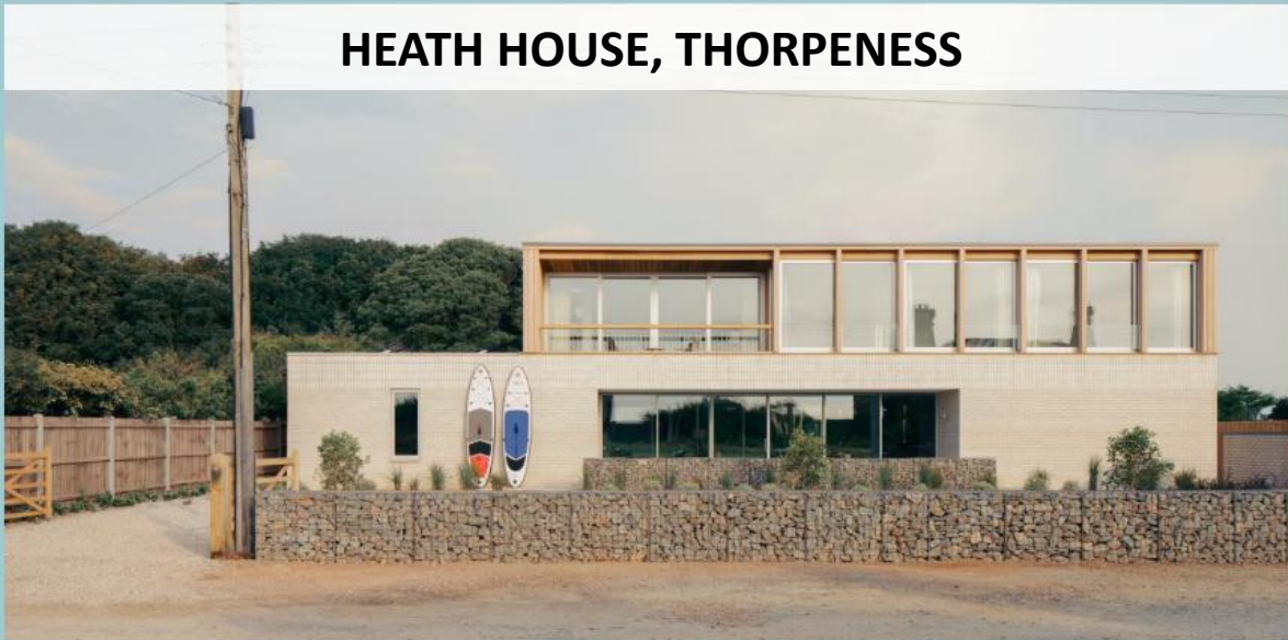
HEATH HOUSE, THORPENESS