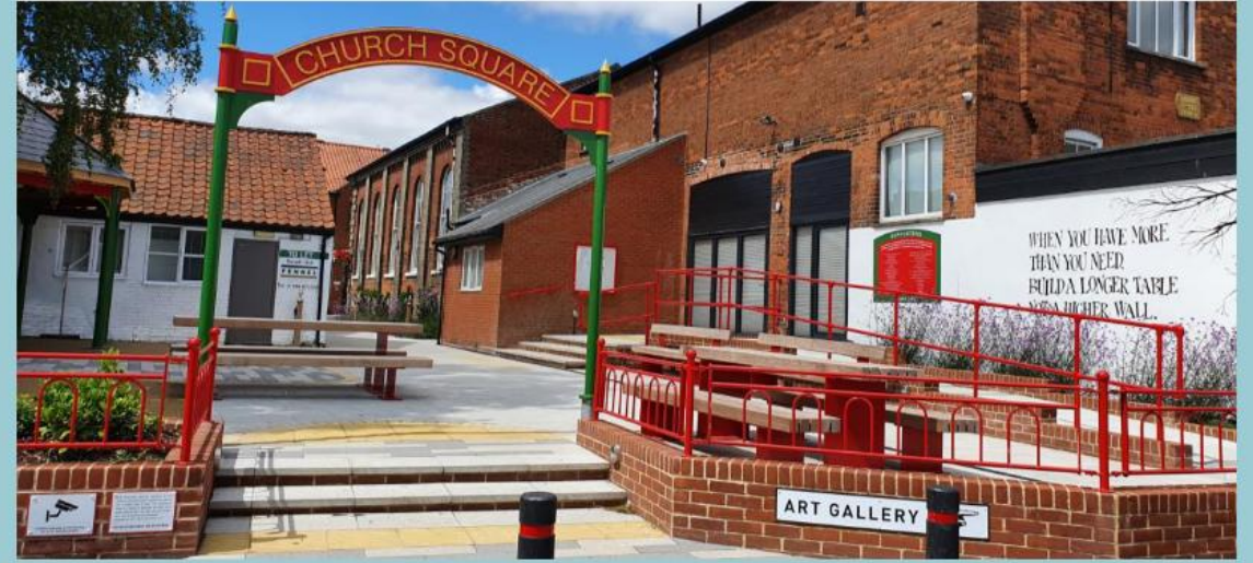
CHURCH SQUARE, LEISTON