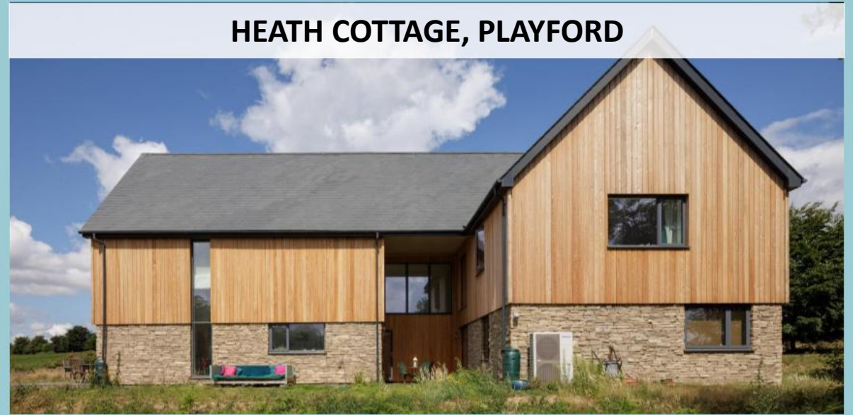
HEATH COTTAGE, PLAYFORD