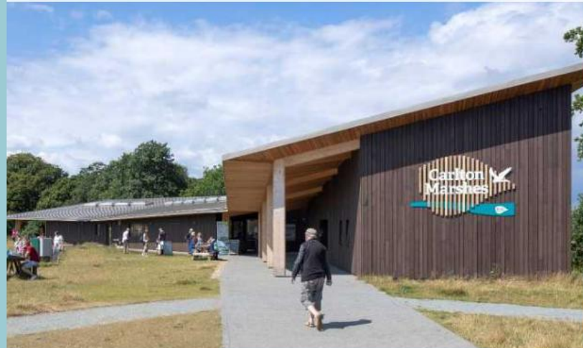
CARLTON MARSHES VISITOR CENTRE