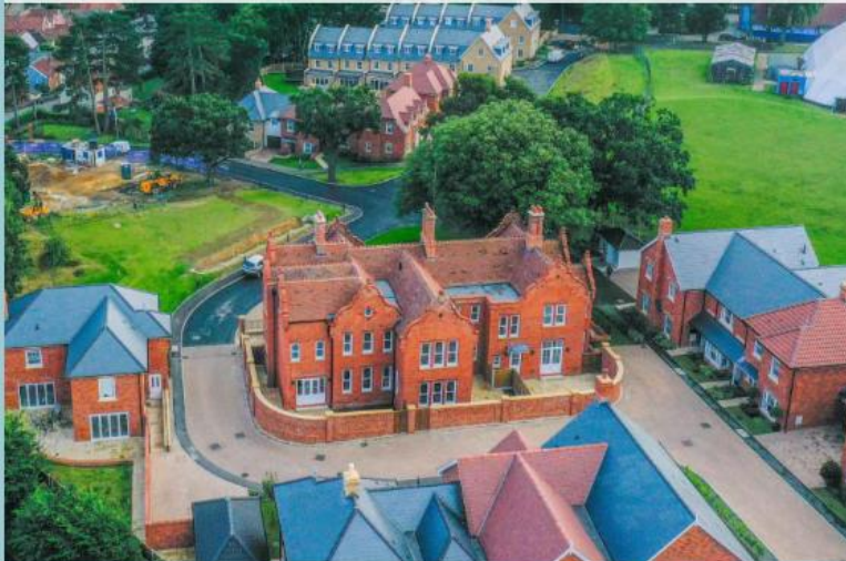
QUEENS DRIVE, WOODBRIDGE