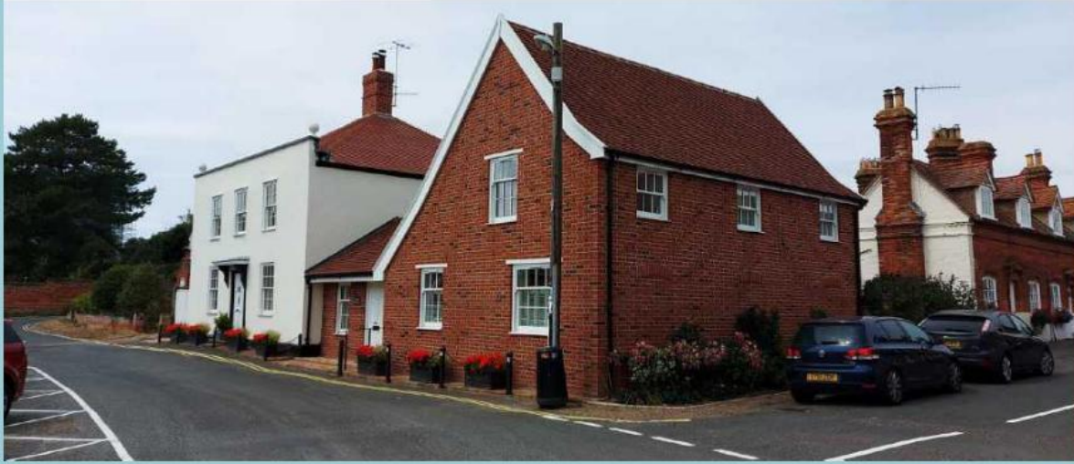
MANOR HOUSE, ORFORD