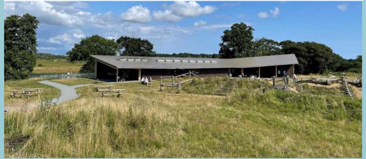
CARLTON MARSHES VISITOR CENTRE