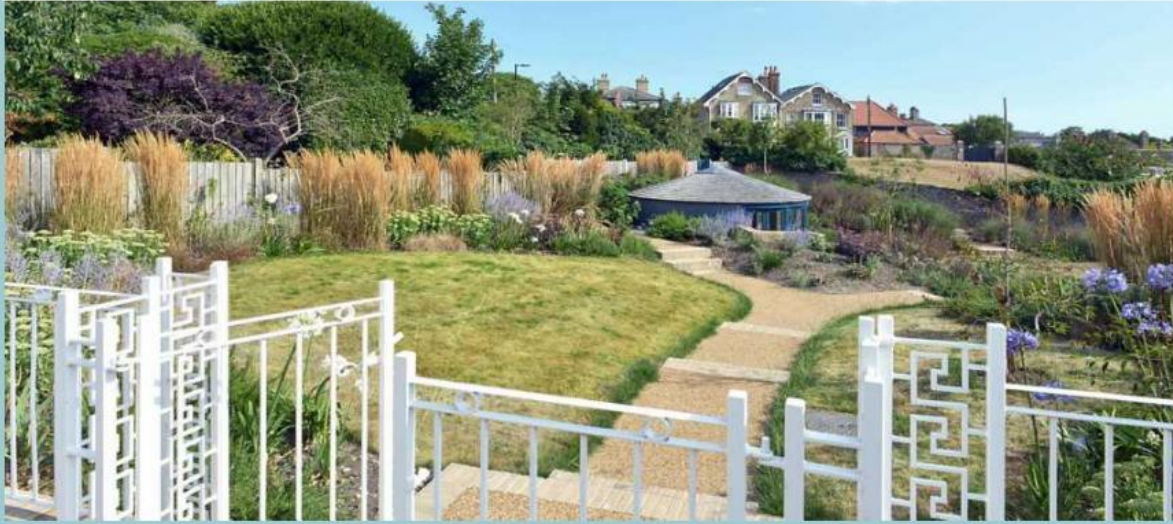
26 PARK LANE, SOUTHWOLD