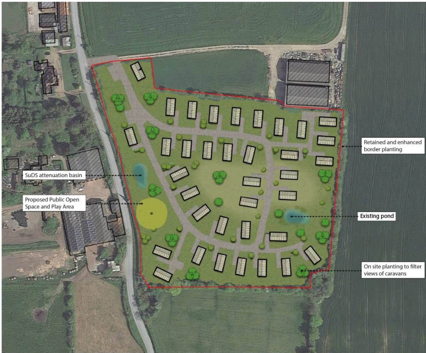
Proposed layout Plan