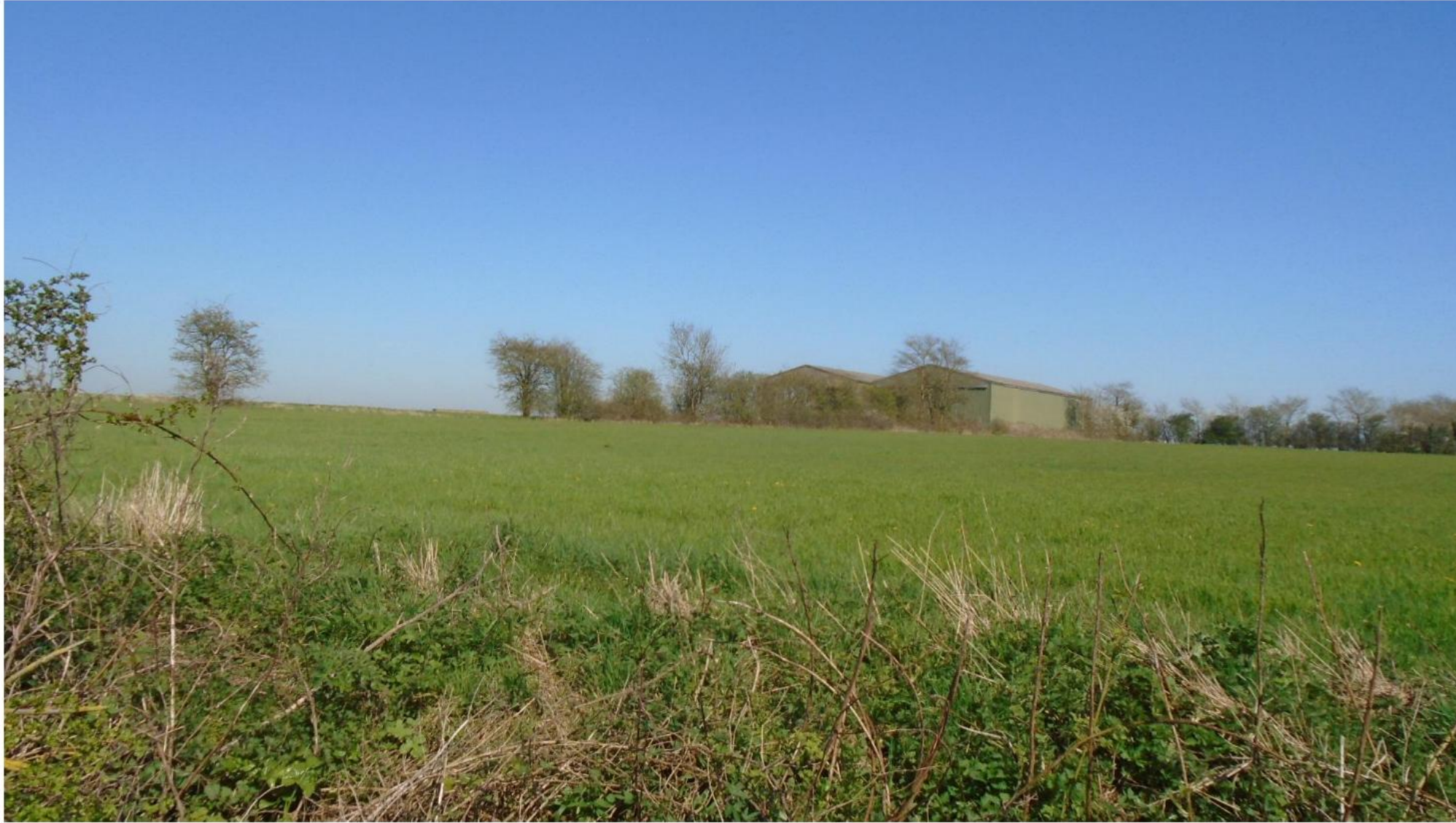
View east across the site from Church Road