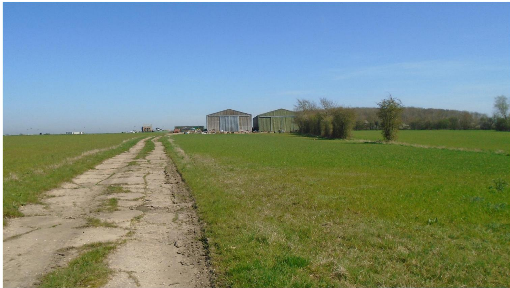
View east along existing access