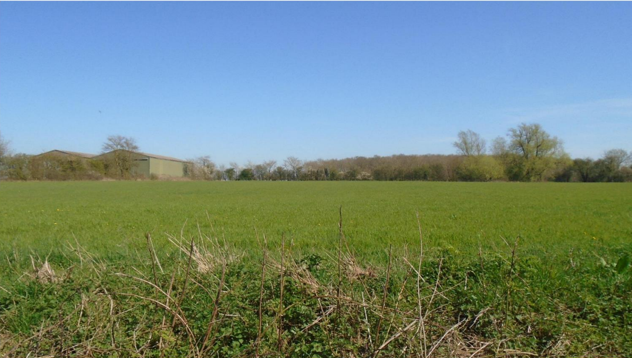
View east across the site from Church Road