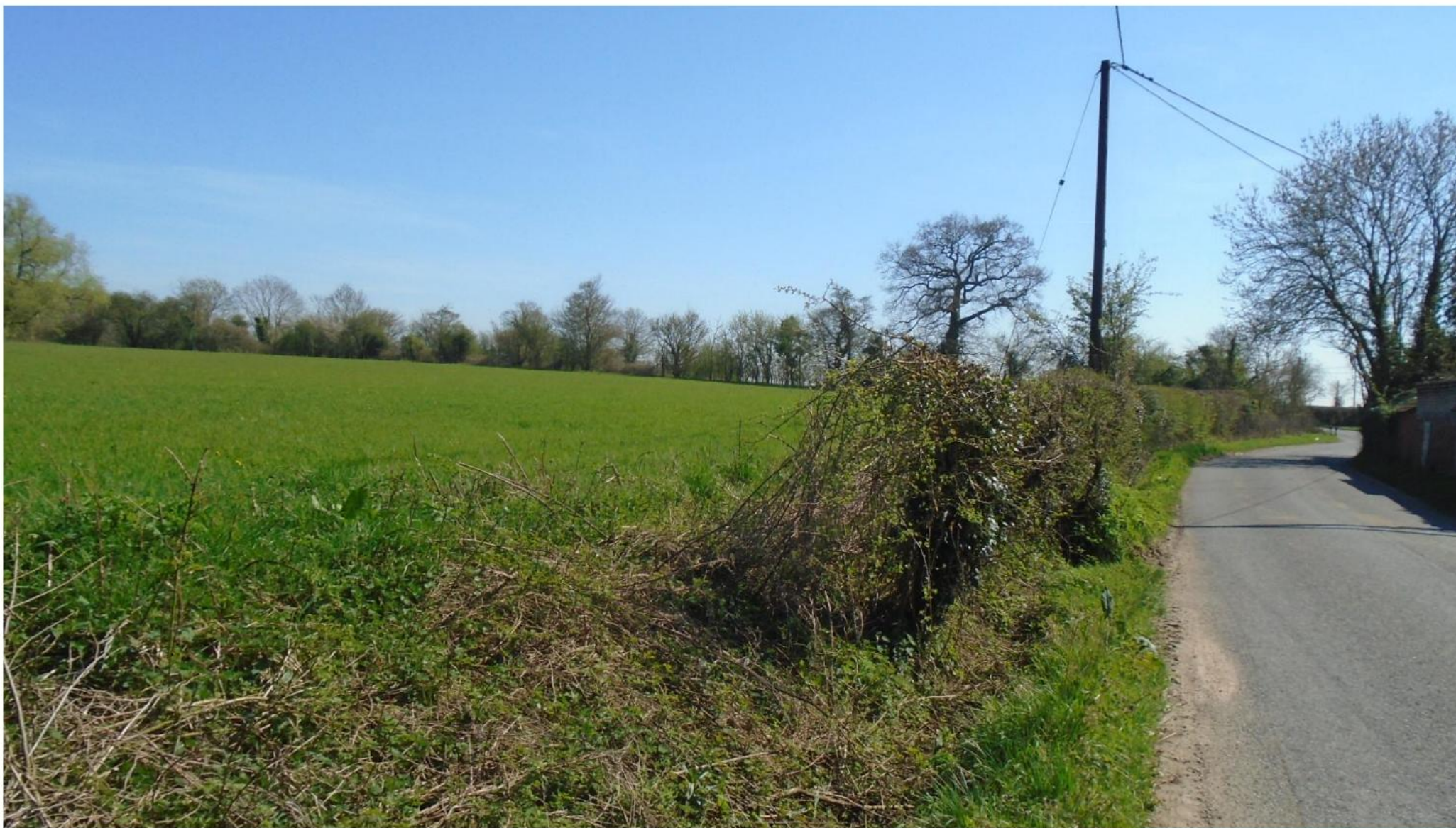
View south along Church Road