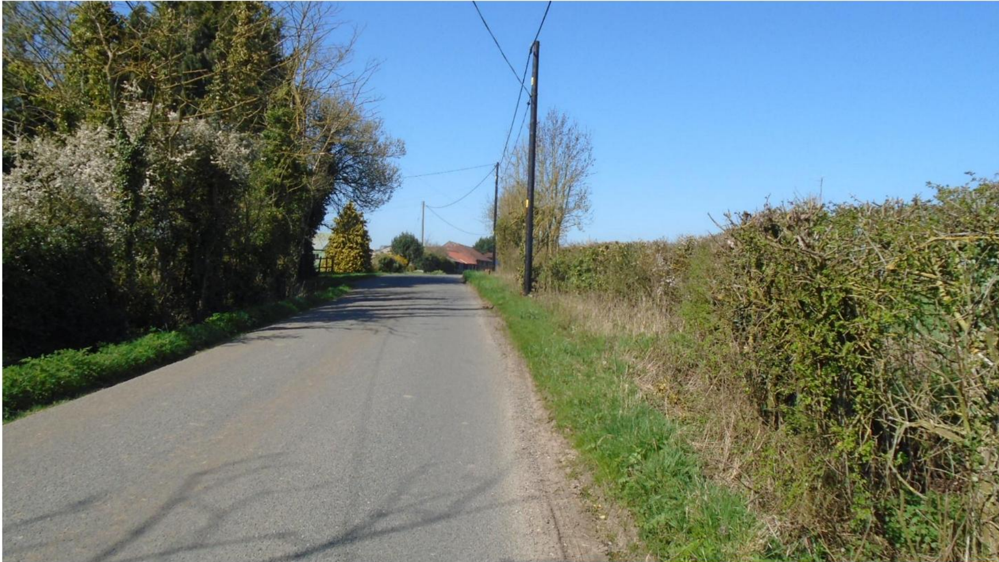
General view northwards along Church Road