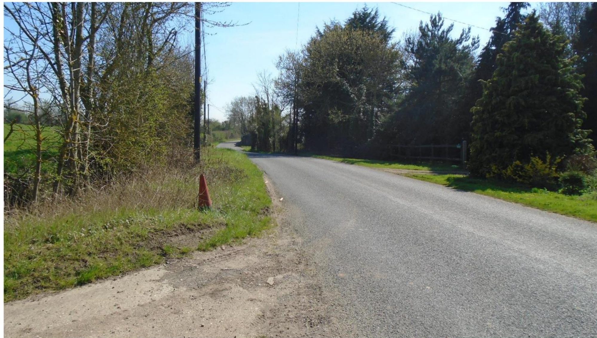
View south along Church Road from proposed site access