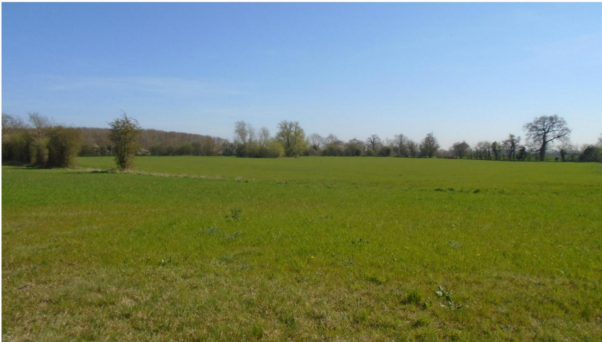
View south across the site