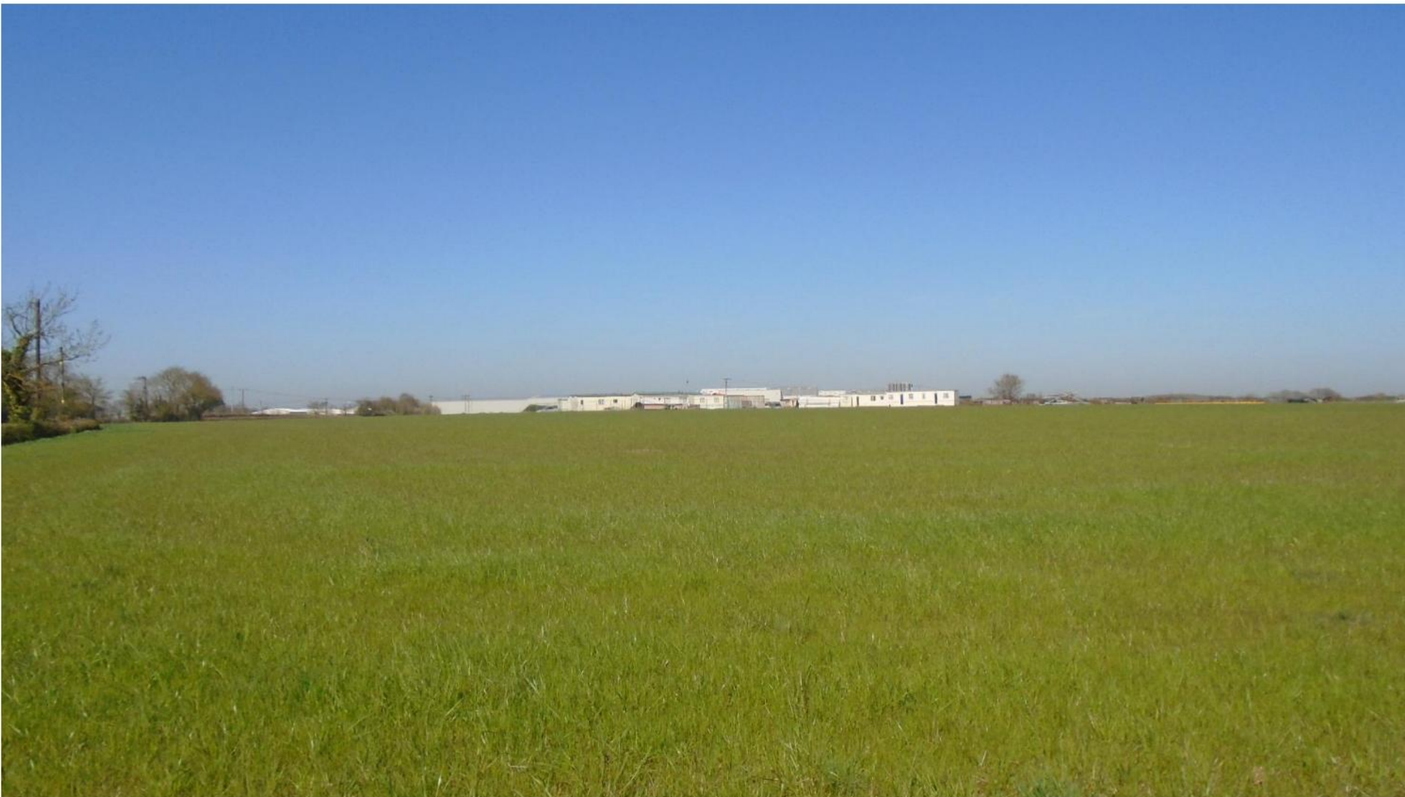
View over to buildings on Ellough Industrial Estate