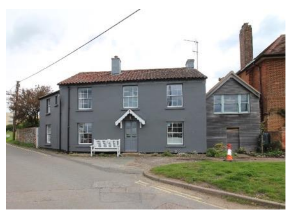
Ferry Cottage, Skilmans Hill

Ferry Cottage, Skilmans Hill (Positive Unlisted Building). A prominently positioned two storey detached villa with painted render walls and red clay pan tile roof covering. Dating from the late 19<sup>th</sup> century. Circa 2004 a scheme of restoration and alteration was undertaken, which included raising the height of the side addition from single to two storey and replacing all the enlarged window openings with sash windows. While the joinery is