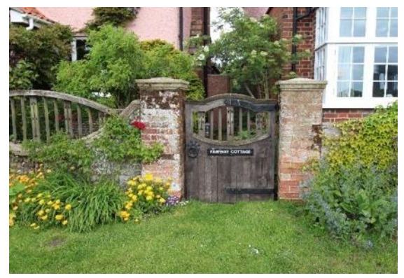
Timber hand gate, Fairway Cottage, The Common

To the west is a cobble boundary wall with stone caps that rises and falls in height, with mirrored timber balusters and cap. The capped brick piers form a part of an established run, see Spinners Cottage and Rope Walk Cottage , Spinners Lane . To the entrance of Fairway Cottage is a hardwood hand gate, the design of which reflects the wall and timber upper section, with shaped iron strap hinges and elaborate ring handle.