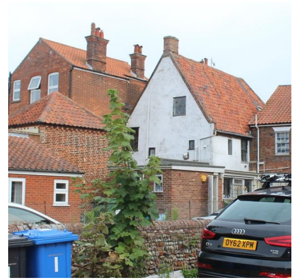
Rear of No.71 High Street from Buckenham Court