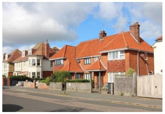
Nos.64 & 66 Pier Avenue

No.62 Pier Avenue (Positive Unlisted Building). A well-preserved detached villa of c.1905 which was probably designed by the London architect Edward Charles Homer (1845-1914). One of the first buildings to be completed on the Coast Development Company's building estate. Two storeys with attics. Red brick with a rendered first floor embellished with applied timber framing. Steeply pitched plain tile roof capped with decorative ridge pieces. Original plate-glass sash windows with small pane upper lights preserved. Original flat-topped dormers with casements to roof. Homer who was responsible for villas at Hampstead and Frinton Essex as well as for his early London cinemas. Designs by Homer of c.1905 for villas on Pier Avenue with applied timber framing to the upper floors were recorded by Bob Kindred in his survey of Suffolk architects but have sadly since been destroyed.