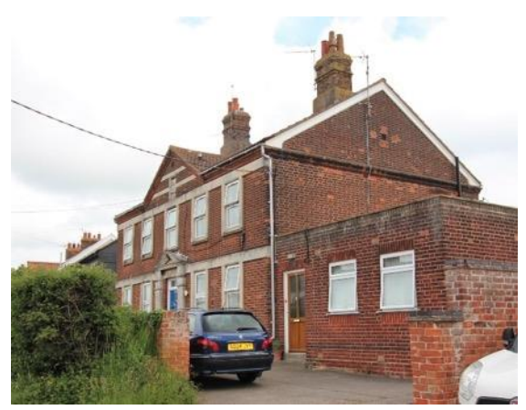
Nos. 21-27, Station Road

High Bank, Mount View and Kintyre, Station Road (Positive Unlisted Buildings). A terrace of three inter-war houses, built by the Coast Development Company on land that previously formed part of the Town Farm estate. Detailing makes reference to Blyth Hotel, particularly the square two storey bay windows and half-timbering to the gables. Red brick with rendered first floor. Pan tile roof covering with short brick ridge stacks. The replacement uPVC windows are unsympathetic, except Kintyre which fortunately retains its horned plate glass sashes. Set back from the road behind hedges and private gardens. The houses are highly visible on approach to the town owing to their elevated site.