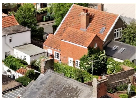
Outbuilding at 8 Victoria Street from church tower

The Old Bakehouse, No. 8 Victoria Street (Positive Unlisted Building). An early to mid-nineteenth century red brick structure with a blacked glazed pan tiled roof slope to the Victoria Street frontage and a red pan tiled slope to the rear. Occupied as a bakery by the 1880s and in use as such until the 1950s. Horned plate-glass sashes in heavy moulded frames to the first floor. A single plate-glass sash beneath a shallow arched brick lintel to the southern end of the ground floor. Large blocked shallow arched opening to centre of façade now containing a panelled door and small sash. Large nineteenth century casement to northern end which possibly functioned as a shop window. Rendered northern return elevation. Flat roofed rear additions of mid to late twentieth century date.