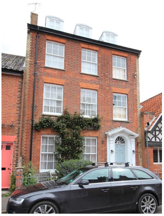
No.3 Park Lane

No.3 Park Lane (Positive Unlisted Building). A substantial Italianate house of c.1870 which was