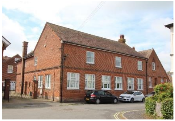
Flats 1-6 (cons) Eversley Court, Wymering Road

Flats 1-2 Eversley Cottage, Wymering Road (Positive Unlisted Building). Detached red brick house, built c.1922 and forming part of the Eversley School, complex, now converted to apartments. Bold projecting string course which runs into the sills of the first floor windows, and below are projecting brick aprons. Two storey canted bay to the right side of the entrance facade, door to left. Spanning the entire width of the entrance elevation is a half-timbered gable, carried out and over the canted bay on a pair of timber brackets, each resting on a stone corbel. The property retains its original horned sash windows, divided to the upper leaves and plate glass with central glazing bar division below. The house is prominent in views looking south along Eversley Road, and west along Wymering Road.