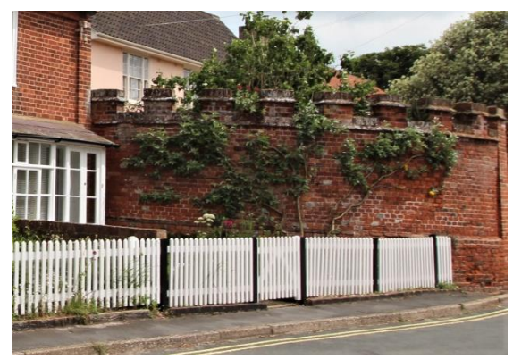
Western Section of Garden Wall to No.9B Lorne Road