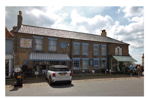
No.23 Market Place