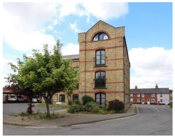
St Edmunds Court, North Green

Primrose Cottage No. 7, No.8 & Dolphin Cottage No.9 North Green (Grade II)