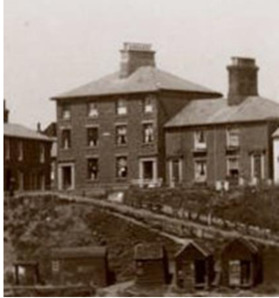
Nos.10-13 Before alteration c.1910.