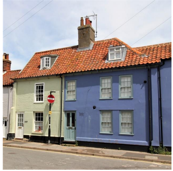
Nos.30 & 32 East Street

Replacement horned sashes and partially glazed panelled door. No.26 retains its original door opening, but the window openings have been modified. No.24 was originally two cottages, the narrow slightly lower western cottage is shown on old photographs as having at ground floor level a door and sash window beneath a single large red brick shallow arched lintel. The eastern cottage retains all of its original openings.