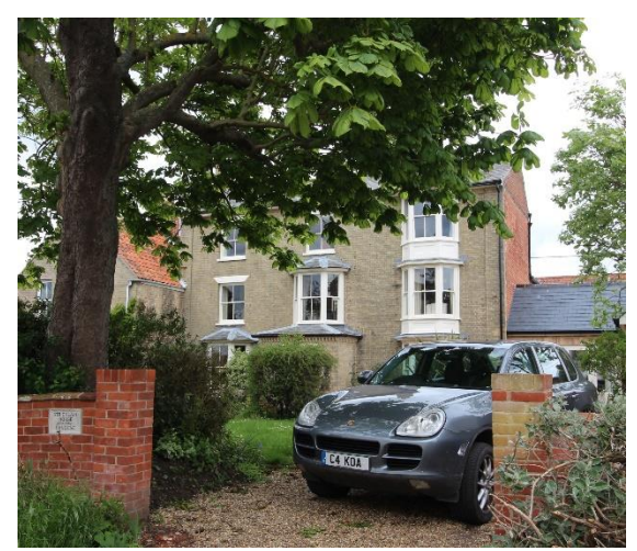
Strickland House, No.25 Park Lane

Strickland House, No.25 Park Lane (Grade II)