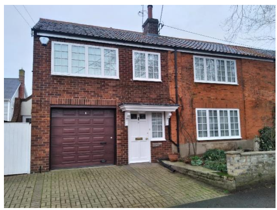
No.5 North Green

Southwold Library, North Green (Positive Unlisted Building). Former commercial Assembly Room of probable late nineteenth century date converted to public library c.1939. For a time shortly before World War One also the town's temporary Roman Catholic Church. Red brick with a red pan tile roof. Original hornless plate glass sashes beneath painted wedge-shaped lintels. Pair of blocked doorways in Station Road elevation. The building makes an important contribution to the town's social history, reflecting its popularity as a centre for the local elite.