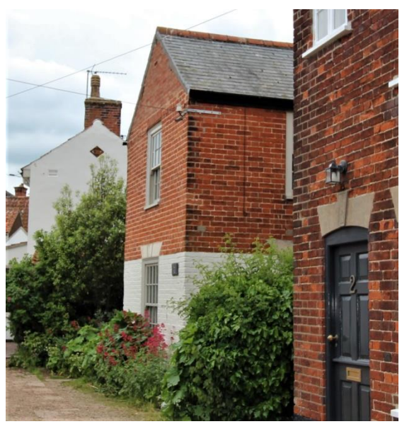
No.3 Youngs Yard

No.3 Youngs Yard (Positive Unlisted Building). Detached early nineteenth century red brick cottage, which was probably originally two cottages. Wedge shaped plaster faced lintels to the doors and windows. Late twentieth century horned small-pane sashes. Partially glazed and panelled doors. Substantial red brick stack rising from what was probably the party wall between the two