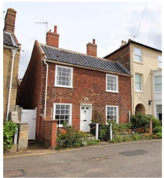
Dartmouth Cottage, No.11 South Green

glass sash windows. Arched entrance to the left side providing access to the rear.