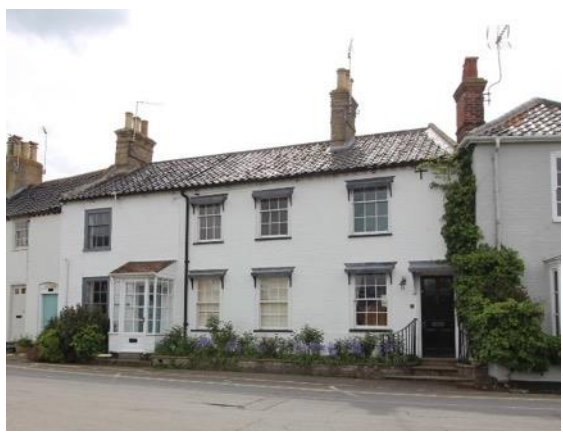
The Bolt Hole, No.10 and Wayside Cottage, No.12 Queens Road

Coachman's Cottage, No.2 Queens Road (Grade II)