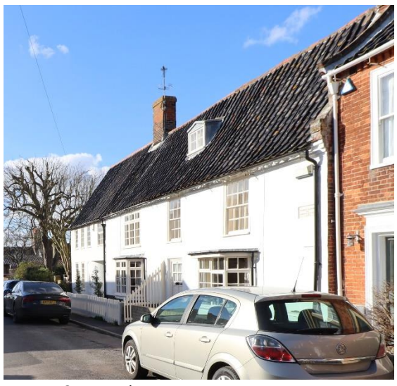
Nos.21 & 23 Park Lane

Nos.17 & Honeysuckle Cottage, No.19, Park Lane (Grade II)