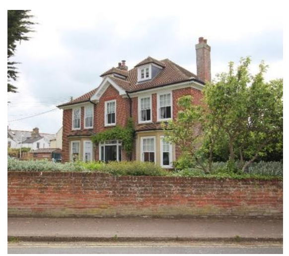
Forest Cottage, Blackmill Road

Forest Cottage, Blackmill Road (Positive Unlisted Building). Detached inter-war red brick villa occupying a prominent corner location. Classical detailing, including symmetrical principal elevation, projecting central bay crowned with an open pediment. Prominent brick quoins to the corners. The projecting modillioned eaves cornice hints at Queen Anne revival styling. The grouping of paired first floor sash windows with the single storey canted bays with shallow pitched roofs below, combine to create a playful rather than scholarly principal elevation. The house and its garden to the east are prominent in views from the High Street. Garages to the north west occupy part of the former garden area and detract from the setting of the house. The site is enclosed by an attractively curved red brick boundary wall.