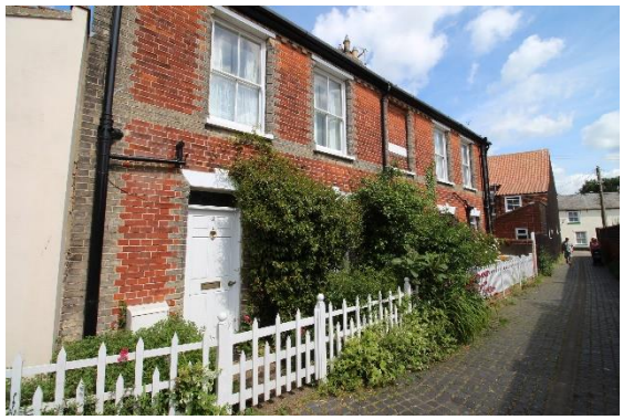
Nos.1 & 2 Bank Alley

Rutland Cottage – See Nos.80 & 80A High Street (Grade II) See also Nos. 78 High Street and 35 Victoria Street.