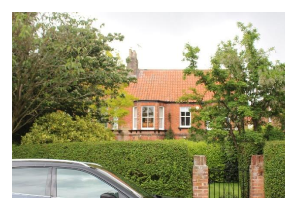
Nos.20 & 22 Stradbroke Road

resting on corbels and painted stone wedge-shaped lintels. Panelled doors with rectangular fanlights. Substantial gabled dormers with elaborate decorative bargeboards and spear finials. Probably dating from the early 1890s.