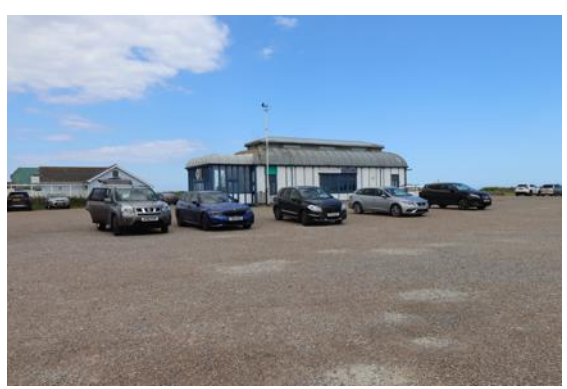
Alfred Corry Museum, Ferry Road

E16, Blackshore A former goods truck with corrugated ventilated ends, now used as a store. New pitched roof replaced the original curved structure. Timber sides, with taking in door.