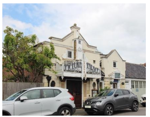
The Electric Picture Palace, Blackmill Road

Forest Cottage, Blackmill Road (Positive Unlisted Building). Detached inter-war red brick villa occupying a prominent corner location. Classical detailing, including symmetrical principal elevation, projecting central bay crowned with an open pediment. Prominent brick quoins to the corners. The projecting modillioned eaves cornice hints at Queen Anne revival styling. The grouping of paired first floor sash windows with the single storey canted bays with shallow pitched roofs below, combine to create a playful rather than scholarly principal elevation. The house and its garden to the east are prominent in views from the High Street. Garages to the north west occupy part of the former garden area and detract from the setting of the house. The site is enclosed by an attractively curved red brick boundary wall.