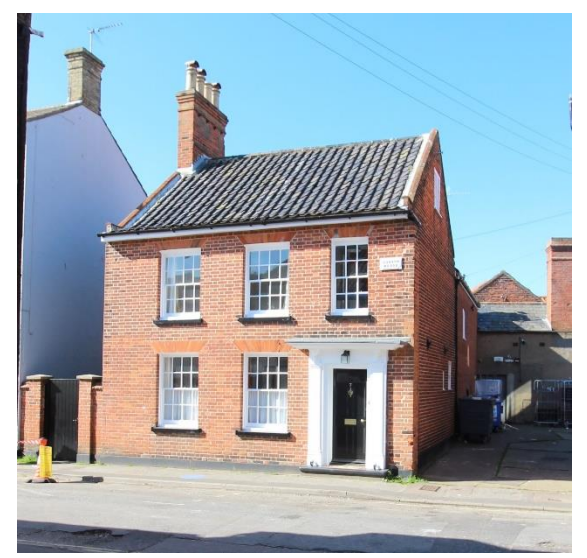
No.7 East Street

Gordon House, No.7 East Street (Grade II)