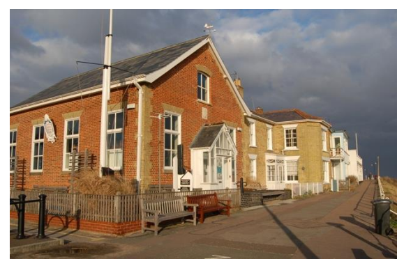
Sailors Reading Room and Simpson Memorial, East Cliff

Sailors Reading Room, East Cliff (Grade II)