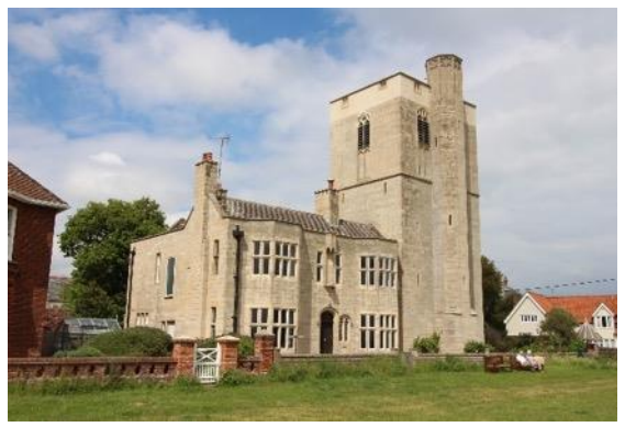
RC Church of the Sacred Heart and Presbytery, Wymering Road

Roman Catholic Church of the Sacred Heart and Presbytery, Wymering Road (Grade II)