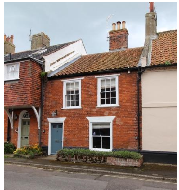
No. 14 Park Lane