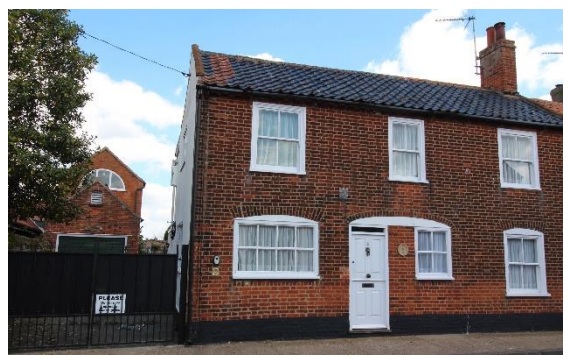
No.8 Victoria Street and outbuilding

For Adnams Shop and Café see Tibby's Triangle