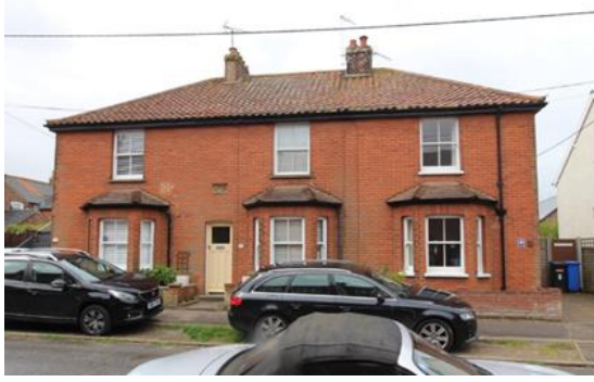
Nos. 2-6 (even) St Edmunds Road

Corporation Cottages Nos.1-31 (Odd) St Edmunds Road (Positive Unlisted Buildings). A substantial terrace of uniformly designed early local authority housing dating from 1905; some of the earliest to survive in England. They were built by Southwold Corporation from monies generated by the sale of part of the Town Farm estate for housing. Red brick with red pan tile roofs (the cottages are also shown with pan tile roofs on early photographs). Replaced casement windows divided by mullions, that to ground floor level beneath shallow arched brick lintel. Partially glazed front doors again beneath shallow arched brick lintel but set back slightly from the exterior of the building. Upper floor windows are set just below the eaves. Red brick ridge stacks.