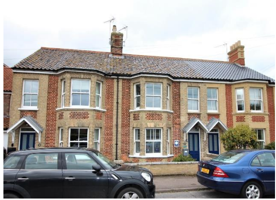
Nos.14-16 (cons) Field Stile Road

No.12A-12C Field Stile Road (Positive Unlisted Building). A three-storey semi-detached house now converted to flats. Red brick with Suffolk white brick dressings and pilasters. Constructed sometime between the publication of the 1891 Ordnance Survey map and the taking of a photograph dated 13<sup>th</sup> October 1893 in the Southwold Museum collection. Horned plate-glass sashes. Decorative pierced bargeboards to half dormers at second floor level. Recessed arched porch sadly replaced with window but principal façade otherwise intact. Gault brick boundary wall with square section pier and pyramidal cap to east. The house plays an important role in the setting of the Grade I listed parish church which is located directly to its south.