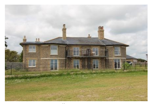
Stone House, Gun Hill Stone House, Gun Hill (Grade II)

Coach House, Gun Hill (Positive Unlisted Building). Former Coach House located to the north of Stone House, with which it shares many characteristics, including cobble walls with brick margins, shallow pitched slate covered roof and overhanging eaves. Converted to residential use during the 1970s. While door and window joinery is replacement, they exist within the original openings ensuring the original form and function of the structure is easily identifiable. The unbroken roof, free from skylights and dormers, and the cobble end gable which faces Gun Hill makes a significant contribution to the conservation area.