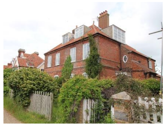
Nos.3 (right) and 4 (left), Strickland Place

Nos.1 and 2, Strickland Place (Positive Unlisted Building). A pair of late nineteenth or early twentieth century houses facing Nursemaid's Park., Built from red brick with flush quoins, string course and corbelled eaves detailing in white brick. No.2 is better preserved and retains its stone lintels and sills and some original joinery. All windows to No.1 have been enlarged, to the detriment of the both properties. Side entrance extension added to No.1, probably dating from the late 1940s. Attic dormers and gable end chimney stacks with corbelled caps create a lively roofscape. The roof itself is covered with blue glazed pan tiles to the south and north pitches. Enclosing the front gardens is a low red brick boundary wall, topped with timber palisade fencing. The wall contributes positively to the setting of the houses.