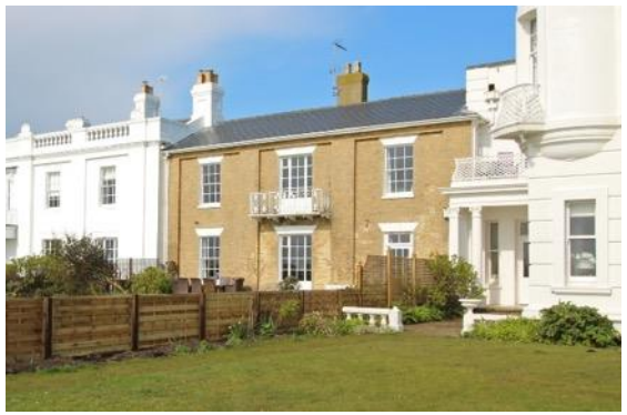
Centre Cliff, No.3 South Green