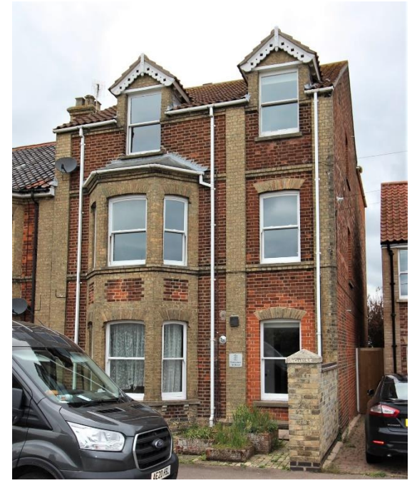
No.12A-12C Field Stile Road

entirely of red brick with two projecting wings, one of two storeys the other of a single storey, probably twentieth century and rendered. Plate glass sashes and dormers in roof slope. Good high nineteenth century red brick garden wall attached to rear of house marking Cautley Road boundary of plot. Gault brick low walls to front. The house plays an important role in the setting of the Grade I listed parish church which is located directly to its south.