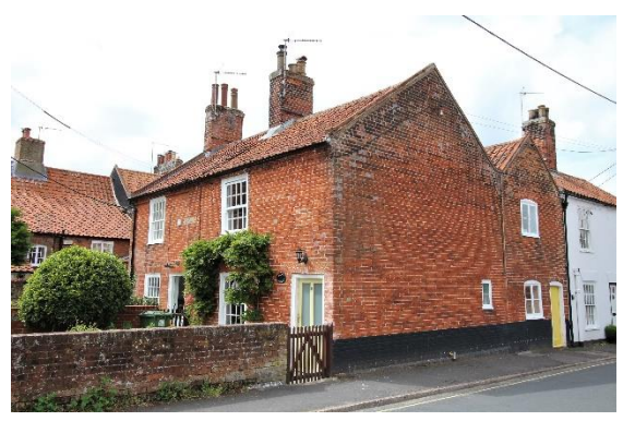
Happy Cottage No.6 Lorne Road and No.8 Lorne Road

No.2 & Stannard Cottage, No.4 Lorne Road (Positive Unlisted Buildings). Early nineteenth century red brick cottages with red pan tiled roofs. Plate-glass sash windows and panelled doors beneath wedge shaped lintels. High rendered plinth. No.2 may be slightly earlier in date than No.4 and there is a straight joint between the two properties. Eastern return elevation of No.2 gabled with hornless plate-glass sashes beneath wedge shaped lintels. Lower red brick rear range with red pan tiled roof visible from Lorne Road.