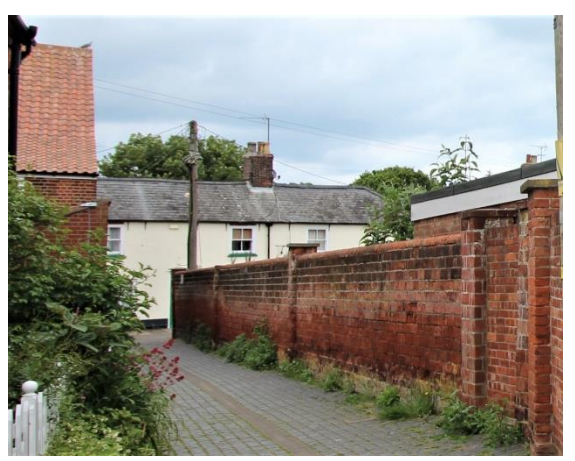
Electricity Substation Boundary Wall, Bank Alley

Nos.1 & 2 Bank Alley (Positive Unlisted Buildings). A well-preserved semi-detached pair of late nineteenth century cottages of red brick with Suffolk white brick dressings and quoins. Western return elevation now rendered. Horned plate-glass sashes. Painted stone wedge-shaped lintels with pronounced key stones. Dentilled eaves cornice of Suffolk white brick and Suffolk white brick plat band below first floor windows. Central arched doorway with boarded door giving access to rear gardens. Panelled front doors with rectangular fanlights. Good single storey red brick ranges of outbuildings attached to rear with red pan tile roofs and casement windows. Nineteenth century cobble boundary wall to rear of No.1.