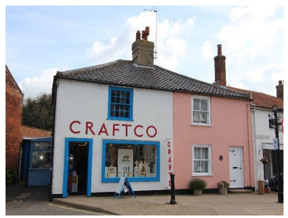
Nos.40A & 42 High Street

Nos.40A & 42 High Street (Positive Unlisted Buildings). House and Blacksmith's workshop dating from c.1800 converted to other uses in the 1930s. Built of red brick with rubbed red brick wedge-shaped lintels, but unfortunately now rendered. Hipped black glazed pan tile roof. Substantial central ridge chimneystack. No.42 the former house is little altered externally save for the loss of its twelve light hornless sashes. First floor of High Street facade to No.40A retains an original sash in a heavy moulded frame. The ground floor of this façade originally contained a similar window and no door. The northern return elevation of No.40A originally displayed its industrial use with a central taking-in door at first floor level and at ground floor level a central door flanked by twelvelight hornless sashes. Former cart shed range with frontage to Victoria Road now heavily altered.