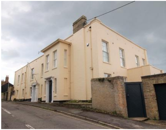
Nos. 22 - 26 Park Villa, Park Lane

Boundary Wall to The Coach House, Park Lane (Positive Unlisted Structure). Gault brick, dating from the second quarter of the 19<sup>th</sup> century and enclosing the courtyard of the demolished coach house to Park Villa. Canted brick to the base plinth, with angled capping bricks. Square piers with stone caps, although the opening positions have changed and been widened over the years. The wall, although altered, is important for the continuation it provides of the established building line either side.