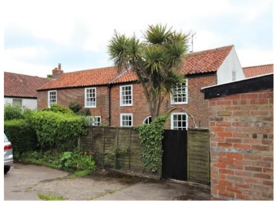
Old Hall Cottage, Woodleys Yard

Old Hall Cottage, Woodleys Yard (Positive Unlisted Building). The left hand side of a pair of cottages (the right side having been rebuilt). Probably of early 19<sup>th</sup> century date. Red brick with red clay pan tile roof covering and gable end brick stack. The first floor retains 6 over 6 pane sash windows. The ground floor openings have been enlarged. The property and associated front garden are set back and provide a change in scale and material use when compared to the structures surrounding it.