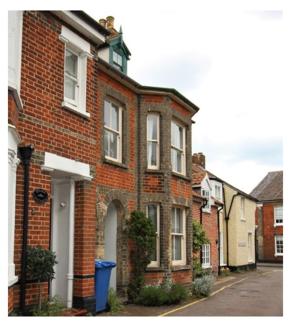
No.16 Bartholomew Green

Holmes Cottages, Nos. 13-15 (cons) Bartholomew Green (Positive Unlisted Buildings). A terrace of three house dating from the 1890s, Nos. 13 & 14 possibly built slightly earlier than No.15. Red brick with painted stone dressings and a Welsh slate roof. Horned plate-glass sashes. Each house has a full height canted by window with pilasters and a recessed porch with a decorative tile floor. Red brick ridge sacks.