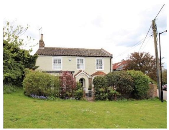
Hill-side and boundary wall, Skilmans Hill

Hill-side, Skilmans Hill (Positive Unlisted Building). A late 19th century detached villa with two story painted render entrance elevation. Central entrance with a projecting open porch. Either side are projecting bays; the canted bay to the left with pitched plain tile roof originally being repeated to the left of the entrance, now rebuilt as a much larger flat roofed bay. Pan tile roof with upstand brick detail to facing the road, and an usual elevation of washed cobble and red brick headers laid on edge, creating a diaper pattern. Single red brick stack to the opposite gable end. The north east boundary to Skillmans Hill is attractively informal, with the grass of the hill abutting the boundary and a good iron hand gate. To the north west is a good brick and cobble wall which encloses the boundary.