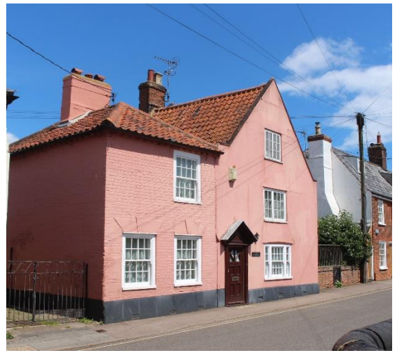
Nos.20 & 22 Victoria Street

The Old Royal, Nos.20 & 22 Victoria Street and outbuilding (Positive Unlisted Building). Former Royal Public House (originally the White Lion) closed 1980s. Possibly early eighteenth-century gabled range with an early c.19th painted red brick former cottage (No.20) attached to its northern end. The two properties had been combined by the mid twentieth century, and now function as one dwelling. Cottage front door formerly in left hand bay on street facade. Late twentieth century pedimented doorcase surrounding historic door opening in gabled range of gabled section, with late twentieth century door within. The ground floor window is a tripartite sash beneath a shallow brick arched lintel. Small pane casement windows above. Cottage elevation with rendered wedge-shaped lintels with pronounced keystones replaced small pane sashes. Two storey canted bay window with small pane sashes to south-eastern elevation, partially clad in timber. Red brick garden wall to southeast enclosing garden of post 1950 date which occupies the site of the demolished war damaged No.24. Small single storey red pan tiled outbuilding of c.1800 or earlier date to the rear of No.20.