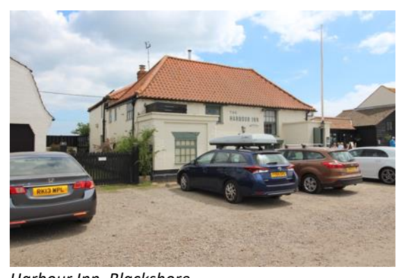
Harbour Inn, Blackshore