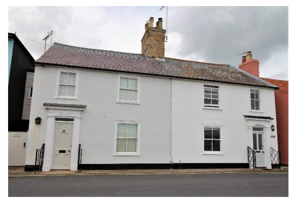
Nos.14 & 15 East Cliff

Bay View, No.14 & East Cliff, No.15 East Cliff