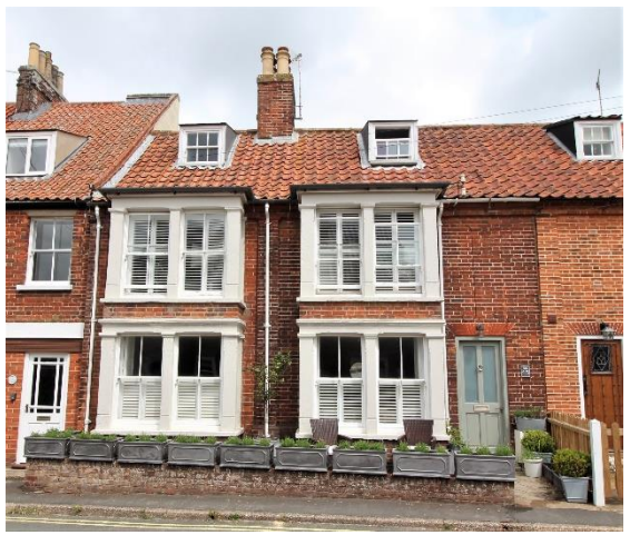
Lorne Cottage, No.15

Nos.11 & 13 Lorne Road (Positive Unlisted Structure). Probably of mid-eighteenth-century date of red brick with pilasters and a red pan tiled roof. Eastern gable of No.11 prominent in views along Lorne Road. Twelve-light hornless sash windows in heavy moulded frames beath rubbed brick wedge-shaped lintels. Ground floor of No.11 has a twentieth century glazed lean-to porch and a twentieth century bay window beneath a continuous Welsh slate roof which replaces an earlier bay window shown on a National Monuments Record photograph of 1949 (BB49/3125). Flat roofed dormers in principal roof slope. Ridge stacks probably removed. The partially re-fronted No.15 forms part of the same structure.