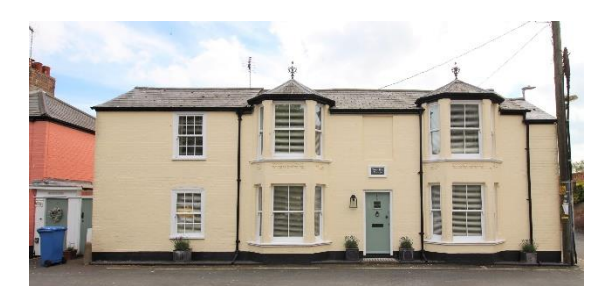
Wych Elm Cottage, East Green

Wych Elm Cottage (formerly Lyndhurst), East Green (Positive Unlisted Building). A house of c.1800 with full height canted bay windows of c.1890. Painted red brick with a Welsh slate roof. The canted bays with horned plate-glass sashes and elaborate cast iron finials. Central panelled door with blind recess above. Original twelve light sashes in heavy moulded frames to left hand bay. Nos.3-6 East Green appear to have been built within the former grounds of this house in the early nineteenth century and then rented out by its then owner Moses Storkey. Wych Elm Cottage makes a strong positive contribution to the setting of the adjoining Grade II listed buildings.