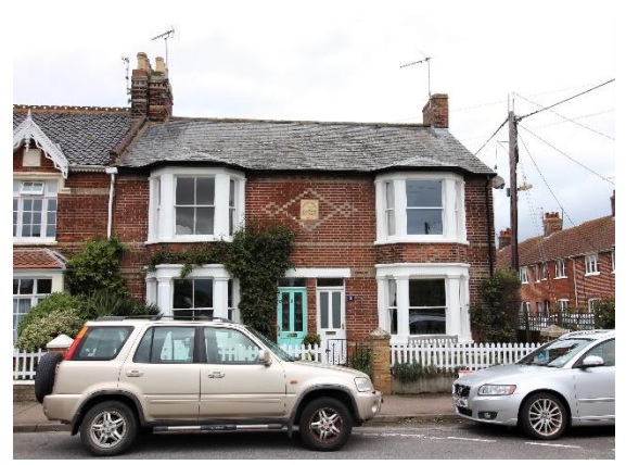
Nos.8 & 9 Field Stile Road

Museum Collection. Mullioned and transomed casement windows above. Passageway embellished with hood mould to rear gardens between Nos. 1 & 3. Contemporary gault and red brick dwarf garden walls with square-section piers with pyramidal caps. The terrace plays an important role in the setting of the Grade I listed parish church which is located directly to its south. John Miller Britain in Old Photographs: Southwold (Stroud 1999) p124.