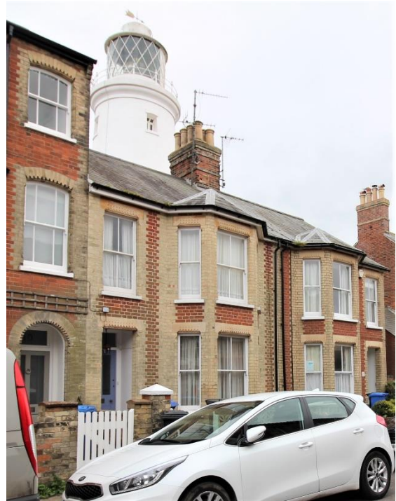
Nos.12 & 14 Chester Road

Nos.12 & 14 Chester Road (Positive Unlisted Buildings). A pair of villas built on plots sold by Southwold Corporation in 1885 with the proviso that dwellings costing not less than two hundred and seventy pounds be constructed on the site. Map evidence suggests that it was built between 1891 and 1904 whilst at least two houses on Chester Road were occupied by the time of the 1891 census. Save for No.16, the houses on Chester Road were probably constructed by the same builder. Red brick with elaborate gault brick dressings and pilasters. Two storeys and two bays with original horned plate-glass sashes. Recessed porches containing partially glazed front doors beneath rectangular fanlights. Nos.12 & 14 play an important role in the setting of the Grade II listed lighthouse and are remarkably well-preserved houses of their kind.