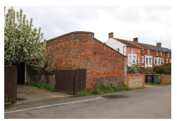
Wall enclosing courtyard at The Anchorage, No.14 Cumberland Road