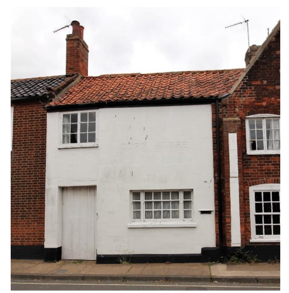
Corn Store, No.10 Victoria Street

Corn Store, No.10 Victoria Street (Positive Unlisted Building). Former grain store, possibly converted in the early to mid-nineteenth century from the service wing of the Grade II listed No.1 Bartholomew Green of which it now once again forms part. Converted to dwelling in the twentieth century. Rendered and scoured to imitate ashlar blocks with a red pan tile roof the words 'Corn Store' inscribed into the render. Two twentieth century small pane casement windows and a boarded door. A 1949 National Monuments Record photograph (BB49/3023) shows the upper floor of the façade as it is today, but with a small window and a second door where the present large ground floor window is located.