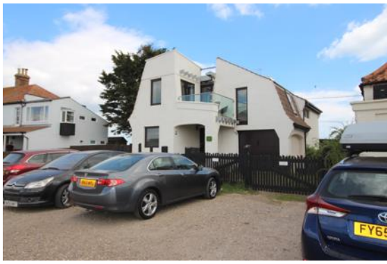
Blackshore Corner, Blackshore

No's 1, 2 and 3 Blackshore Cottages, Blackshore (Positive Unlisted Buildings). A row of cottages with painted brickwork elevations, dating from the second quarter of the 19<sup>th</sup> century. Pan tile roof covering, hipped to the south west, and a gable end where it adjoins No's 4 and 5. Three red brick chimneys with dentil detailing to the ridge. Sash windows with margin glazing bars. Expressed keystone detail over each opening with 6 over 6 pane sash windows to the elevation facing the marshes. The addition to the south east end of is not of special interest.