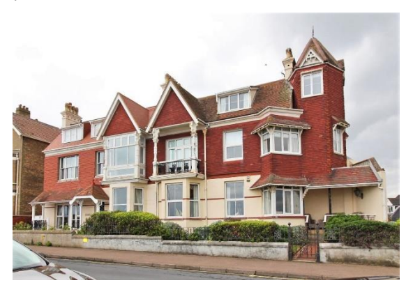
'The Cedars' and 'Duntreath' Nos.27-28 North Parade

'The Cedars' and Duntreath Nos.27-28 North Parade (Positive Unlisted Buildings). A pair of substantial semi-detached houses of a bold and inventive free 'arts and crafts' design one of the best buildings of the period in the town. Of two storeys, with attics lit by flat topped twentieth century dormers. The houses occupy a prominent seafront site and were probably constructed in the early to mid-1890s. Photographic evidence shows that they predate the adjoining Strathmore House and that the plain tile cladding to the first floor probably replaced applied timber framing within ten years of the building's original completion. The pair appear to have been occupied as a private