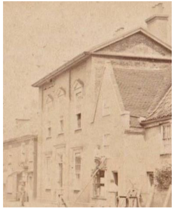
Rutland House, No.80 High Street c.1870