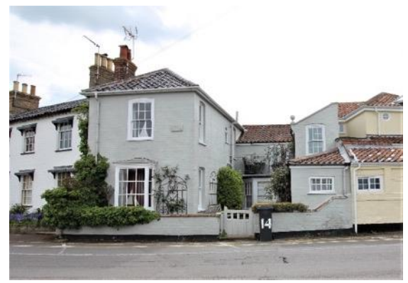
No.14 'The Moorings', Queens Road

The Bolt Hole, No.10 and Wayside Cottage, No.12 Queens Road (Grade II)