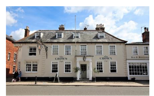
Crown Hotel Nos.90-92 (even) High Street

No.88 High Street (Positive Unlisted Building). Commercial building of red brick with a black glazed pan tiled roof, which was probably constructed during the third quarter of the nineteenth century. First floor canted bay window visible on c.1900 photos replaced by a large tripartite shop window in the early-twentieth century. Two light plate glass sash windows to second floor. c.1900 shop facia retaining notable mosaic advertising panel to floor of central recessed entrance reading Stead and Simpson. An important component in the setting of flanking listed buildings to the north and south.