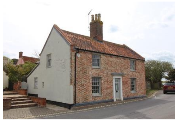
Saltworks Cottage, No.6 Ferry Road

Saltworks Cottage, No.6 Ferry Road (Grade II)