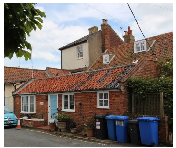
No.23 St James Green

No.23 St James Green (Positive Unlisted Building). A c.1800 structure with substantial late twentieth century alterations. Possibly originally a laundry or brewhouse for neighbouring Seaview House on East Cliff, now a dwelling. Red brick with a red pan tile roof. Old photographs show that the right-hand return elevation was originally partially of cobble. Late twentieth century casement windows. Boarded door.