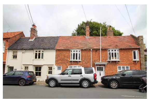
Nos.1-5 (odd) Lorne Road

May Place (Grade II) – See South Green in Marine Villas Character Area