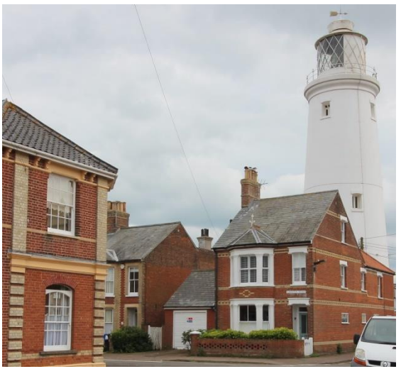
No.16 Chester Road

Nos.12 & 14 Chester Road (Positive Unlisted Buildings). A pair of villas built on plots sold by Southwold Corporation in 1885 with the proviso that dwellings costing not less than two hundred and seventy pounds be constructed on the site. Map evidence suggests that it was built between 1891 and 1904 whilst at least two houses on Chester Road were occupied by the time of the 1891 census. Save for No.16, the houses on Chester Road were probably constructed by the same builder. Red brick with elaborate gault brick dressings and pilasters. Two storeys and two bays with original horned plate-glass sashes. Recessed porches containing partially glazed front doors beneath rectangular fanlights. Nos.12 & 14 play an important role in the setting of the Grade II listed lighthouse and are remarkably well-preserved houses of their kind.