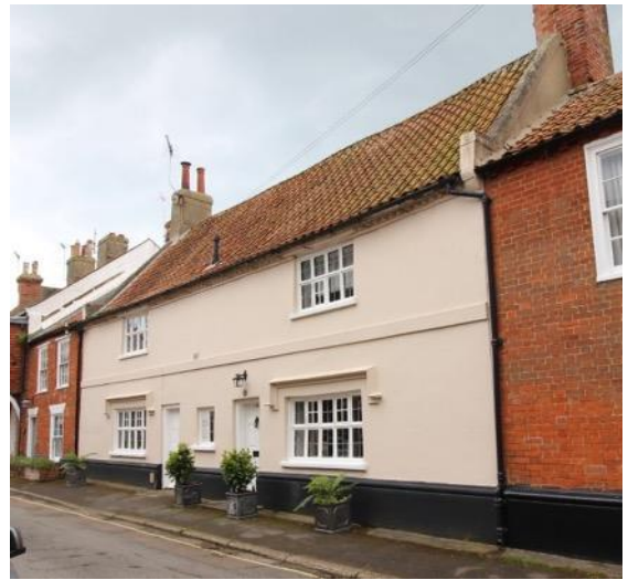
Nos.16 & 18, Park Lane