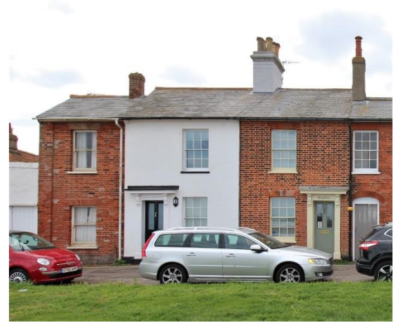
Nos.7 & 8 East Cliff showing late twentieth century addition to left.