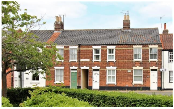
Nos.4-10 (even) High Street

Carroway Cottage, No.4 and Nos.6-10 (even) High Street (Positive Unlisted Buildings). Terrace of four small houses completed in 1881. Central passage access to rear gardens with a mirrored semidetached pair of dwellings to either side one projecting over the central passage. Faced in red brick with white brick dressings. Black pan tiled roof with ridge stacks rising from the spine walls between the cottages. Horned plate-glass sash windows occasionally survive although a number of the houses have unsympathetic late twentieth century replacements. Plaster wedge-shaped lintels with projecting central key stones. Stone sills resting on decorative corbels. Carroway Cottage No.4 now sadly painted harming the unity of the terrace's design. Nb in the late nineteenth century this part of High Street was part of Station Road hence the name of the houses 'Station Road Villas'.