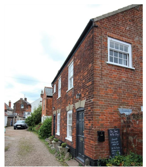
Nos.1 & 2 Youngs Yard

Boundary Wall to Electricity Substation on northern side of Youngs Yard (Positive Unlisted Structure). Red brick garden wall possibly of mid nineteenth century date and probably originally marking the boundary of the garden to Rutland House No.80 High Street. The wall springs from the gable end of No.1 Youngs Yard and runs to Victoria Street. The bricks are laid on their sides. Late twentieth century square-section gate pier at junction with Victoria Street. See also Bank Alley and Victoria Street for other sections of this wall.