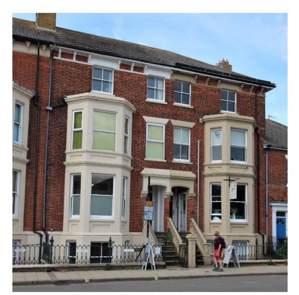
Nos.39 & 41 High Street

Forest House, No.37 High Street (Positive Unlisted Building). Late nineteenth century red brick shop with white brick embellishments. Two storeys with splayed northern corner. Welsh slate roof. c.1900 wooden shop facia. With canted oriel and four light plate-glass sashes above. Pilastered wooden doorcase to domestic accommodation. A wellpreserved example of a purpose-built late nineteenth century shop.