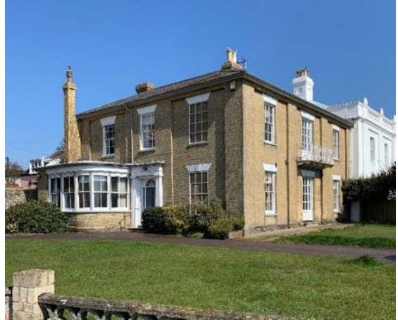
South House, No. 12 South Green

South House, No. 12 South Green (Grade II)