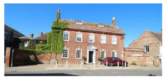
The Manor House, Nos.65-67 (odd), High Street

The Manor House, Nos.65-67 (odd), High Street including gate and forecourt walls (Grade II*)