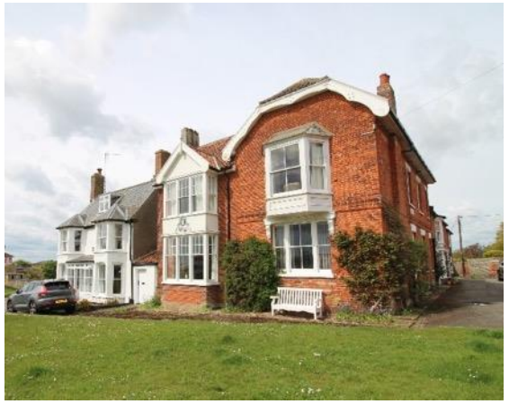
No.23 South Green

York Cottage No. 19 & No.21 South Green (Positive Unlisted Buildings). A pair of early 19<sup>th</sup> century cottages with entrance to the outer sides of the front elevation and windows grouped towards the centre. No.19 has a pedimented doorcase with pulvinated frieze and to the side a broad tripartite window under a brick solider course arch. Above is a hornless 8 over 8 pane sash window. No 21 has a matching door case and a two storey canted bay. Steeply pitched roof covered with red clay pan tiles and a red brick ridge stack to the party wall between the two cottages.