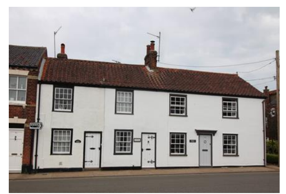
No.16 High Street

hornless sash windows within moulded wooden frames and twentieth century boarded front doors. Red pan tiled roof. No.14 has a shared red brick ridge stack with the Grade II listed No.16. No.14's stack is on the rear roof slope.