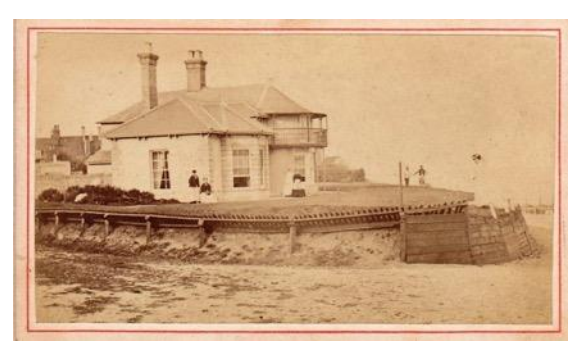
Cannons (formerly Marine Villa), Gun Hill from a carte de visite of c.1870.

See Bettley, J and Pevsner, N The Buildings of England, Suffolk: East (2015), p.522.