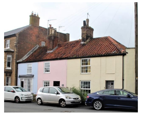
Nos.3-7 (Odd) St James Green

Nos.3-7 (Odd) St James Green (Positive Unlisted Buildings). A terrace of three late eighteenth or early nineteenth century cottages of rendered brick with a red pan tile roof. No.3 with preserved former shop facia to ground floor and twelve light sash above. No.5 also has twelve light sashes but those to No.7 have been replaced with unsympathetic UPVC units.