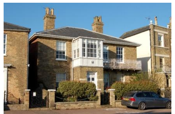
South Green House, No.8 South Green

South Green House, No.8 South Green (Grade II)