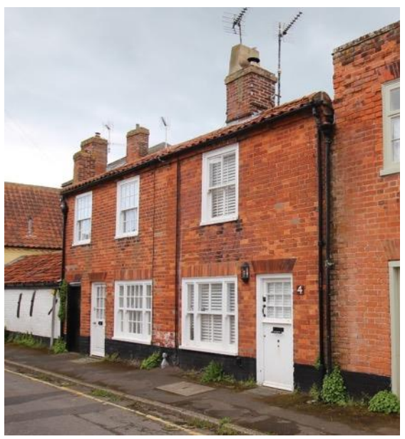
Nos.2 & 4 Park Lane

Nos. 2 & 4, Park Lane (Positive Unlisted Buildings). A pair of red brick cottages, dating from the early 19<sup>th</sup> century. Red brick two storey cottages with red clay pantile roof covering with red brick stack to the part wall line between the two houses. No.2 is wider and accommodates a secondary door. Horned sash windows to the first floor, plate glass