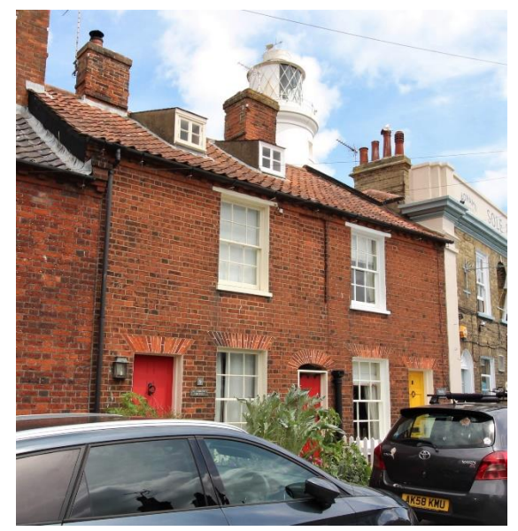
Parsley Cottage, No.8 & St Andrew Cottage No.9 East Green

Sole Bay Inn. No.7 East Green and Nos.2 & 4 Stradbroke Road (Grade II)