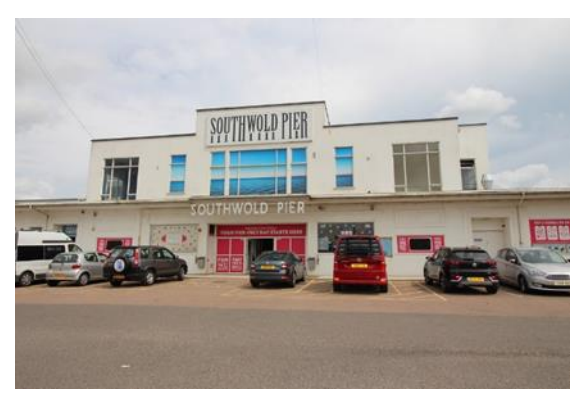
The Pavilion, Southwold Pier

Structures Which Make a Positive Contribution to the Sea Front Character Area