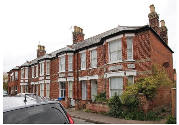
Nos.1-7 (Odd) Salisbury Road

See also Salisbury House, No.56 Stradbroke Road & The Corner House, No.58 Stradbroke Road