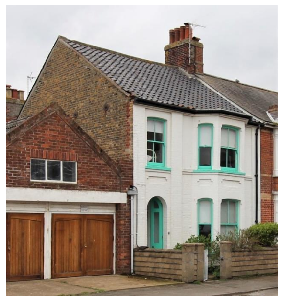
No.4 Dunwich Road

No.2 Dunwich Road – See Nos. 11-13 North Parade