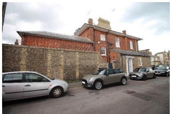
Park Lane façade of Regency House, South Green

No.1 Greyfriars North, Greyfriars South, and Regency House, South Green (Grade II)