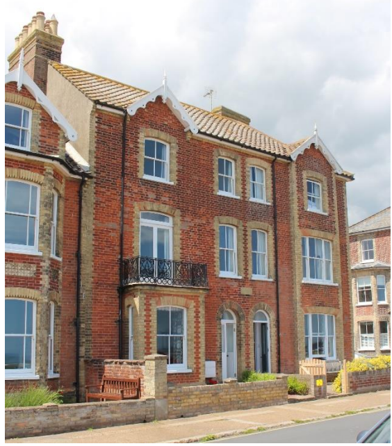
Nos.5 & 6 North Parade

decorative pierced bargeboards with spear finials. Unsympathetic rooflights added to roof above. The original horned plate-glass sashes with margin lights survive to the North Parade façade. Originally with arched recessed porches, that to No.4 is now glazed in. The original panelled front doors however survive to both houses.