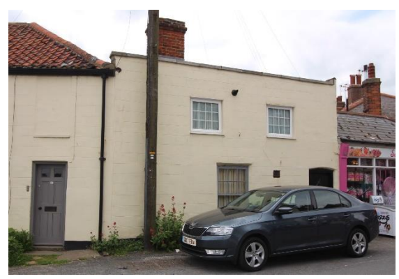
No.1 St James Green

No.1 St James Green (Positive Unlisted Building). Early to mid-nineteenth century structure of painted brick with a high parapet. Tall red brick chimneystack. Unsympathetic late twentieth century replacement windows. Attached to it a single storey lock up shop which retains its original c.1930 shop facia. According to Southwold and Son the shop was designed by FR Rowe for the tobacconist FC Barber.