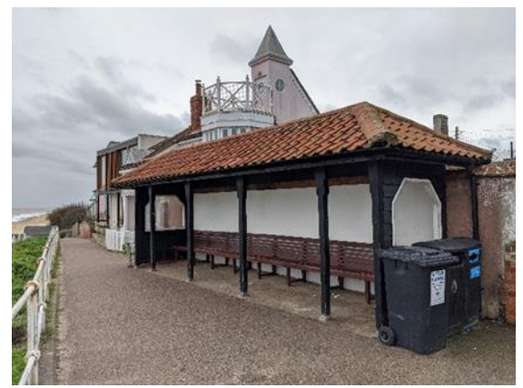
Shelter, Primrose Alley

Shelter, Primrose Alley (Positive Unlisted Building). Twentieth century, with a black stained timber frame and hipped red pantile roof. Rectangular plan, open to the east. Part of a cliff top group in Primrose Alley. Good example of a public structure.