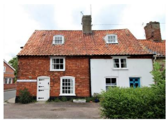
Nos.1 & 2 Bartholomew Green