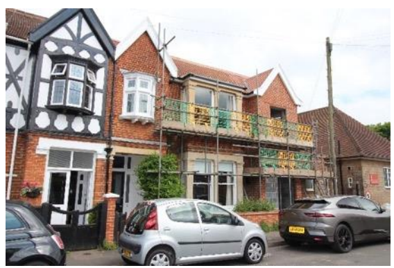
No.3 Manor Park Road

Nos.2 and 3, Manor Park Road (Positive Unlisted Building). Pair of early 20<sup>th</sup> century houses, originally symmetrical but now with contrasting elevations. Entrances grouped to the centre, below an oriel window and gable over. To the side of each entrance is a two storey square bay window with pilasters to the ground floor. No.2 is half-timbered (like its neighbour, No.1), whereas No.3 is of red brick which sets the tone for the houses in