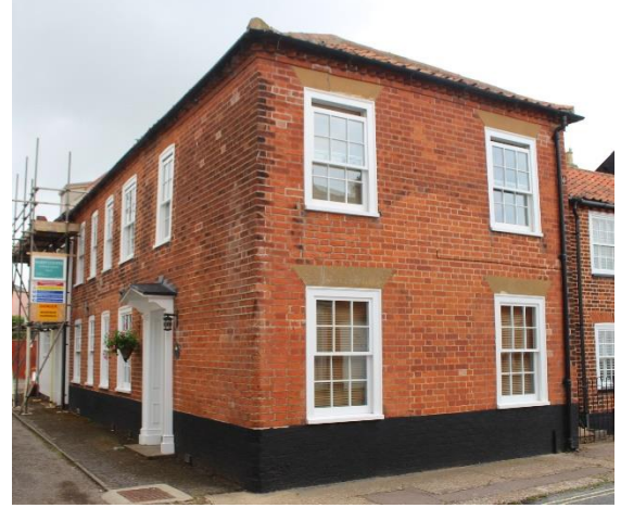
No.6 Trinity Street

No.2 Trinity Street (Positive Unlisted Building). A small cottage of early to mid-nineteenth century date of painted brick. Possibly originally a pair of cottages. Late twentieth century horned sash windows beneath wedge-shaped lintels. Partially glazed front door. The right-hand window is a later twentieth century small pane casement. Red pan tiled roof covering.