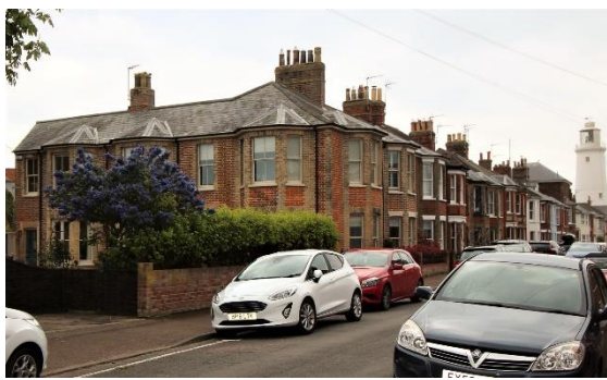
No.41 & Easton Lodge, No.43 Stradbroke Road

No.39 Stradbroke Road (Positive Unlisted Building). A late nineteenth century house of red brick with Suffolk white or gault brick dressings and painted stone lintels and sills. Replaced pan tile roof with elaborate eaves cornice. Four light horned plate-glass sashes. Recessed porch with late twentieth century replacement front door. Twentieth century dwarf red brick boundary wall capped by iron railings. The flanking square-section piers with pyramidal caps may however be original.