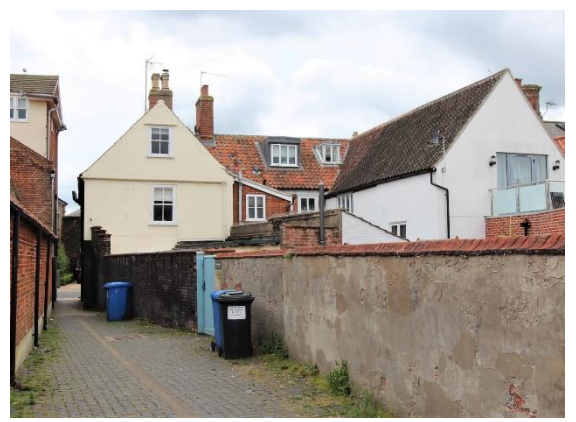
Granville House, No.78 High Street, Bank Alley Elevation

Granville House, No.78 High Street (Positive Unlisted Building). Late nineteenth century façaded dwelling of now painted brick retaining its original plate-glass sash windows and bracketed wooden doorcase. Late twentieth century partially glazed front door of unsympathetic design. Black pan tiled roof of probably much earlier date with nineteenth century flat roofed dormer containing a four-light sash to High Street façade, rear roof slope of red pan tiles. The sash window above the front door has narrow margin lights. Rear elevation visible from Bank Alley of mid eighteenth century or earlier date. Gabled and rendered with nineteenth century plate-glass sashes. Probably originally part of the same building as Nos.74 & 76 which appear to be of a mid-eighteenth century or earlier date. An important part of the setting of adjoining listed buildings.