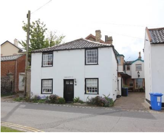
Coachman's Cottage, No.2 Queens Road