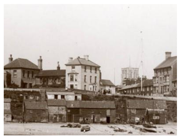
Nos.19 and 20 East Cliff, and No.21 St James Green c.1880

Seaview House, No.20 East Cliff (Positive Unlisted Building). A substantial sea front dwelling of three storeys which is attached at its rear to a further, and now much altered substantial nineteenth century villa (now Nos.19 East Cliff & 21 St James Green). A complex of similar form appears on Wake's 1839 map. The present Seaview House is probably of mid nineteenth century date and is rendered with a hipped Welsh slate roof slope to the front and a red pan tiled one to the rear. Three bay symmetrical entrance façade with horned plate-glass sashes. Single storey twentieth century canted bay addition to seaward end. Central gabled porch with arched doorway. Sea facing elevation has a two-storey canted bay window. Good nineteenth century red brick wall surrounding garden to east.