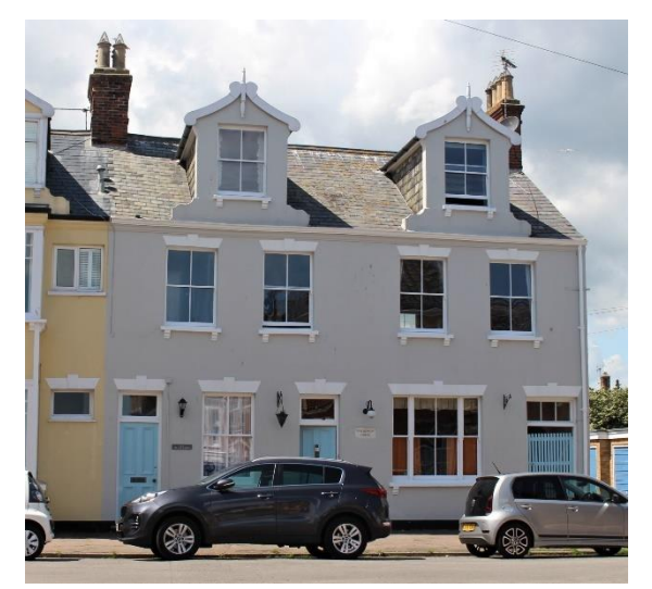
Nos.14-14A Stradbroke Road

Dolphin House and Douglas House No.12 Stradbroke Road (Positive Unlisted Building). House, formerly house and shop of c.1895 (this site is shown as vacant on some early photographs for some time after No.14 had been completed). Rendered with a Welsh slate roof. Moulded eaves cornice. Substantial gabled dormers with elaborate decorative bargeboards and spear finials, with unsympathetic windows. The sides of the dormers clad in slate. Two storey bay windows with mullioned casements which were possibly added in the early twentieth century, that to the south formerly acting as a shop window. Applied decorative timber framing. Window joinery largely replaced. Painted stone wedge-shaped lintels to doors. Red brick ridge stacks. Ship's figure head on bracket above front door.