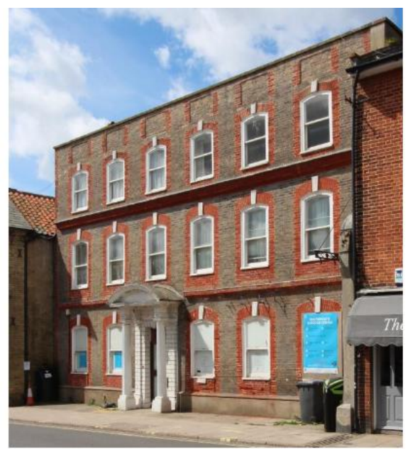
No.17 Market Place

Former Lloyds Bank, No.17 Market Place (Grade II*)