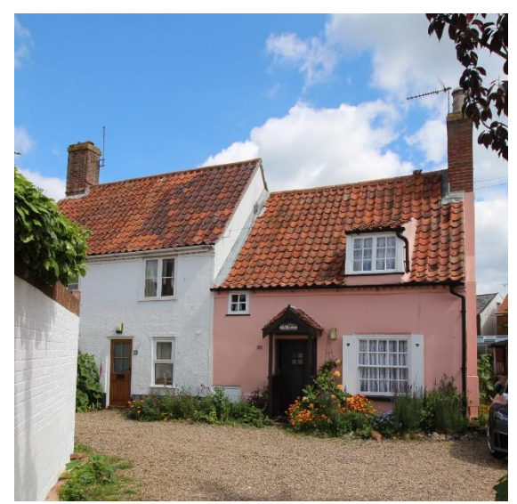
Nos.14 & 16 Snowdens Yard

Nos.14 & 16 Snowdens Yard (Positive Unlisted Buildings). A pair of early to mid-nineteenth century cottages. No.14 of a single storey and attics, built of rendered brick with a red pan tiled roof. Substantial red brick stack to eastern gable. Twenty light hornless sash window with shutters to the ground floor. Twentieth century boarded front door in late twentieth century open-sided gabled wooden porch. Small casement window to stair and dormer above. No.16 of two storeys. Rendered brick with a red pan tiled roof and unsympathetic late twentieth century windows.