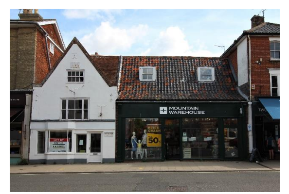
Nos.82-86 (even) High Street