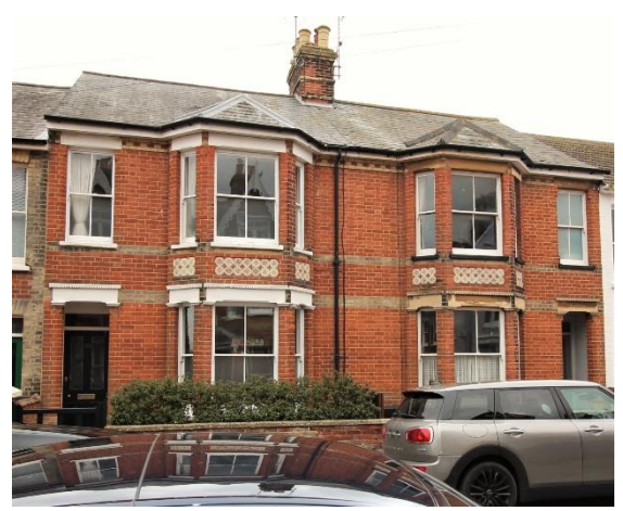
Nos.31 & 33 Stradbroke Road

Nos.21-29 (odd) Stradbroke Road (Positive Unlisted Buildings). A terrace of four red brick houses probably dating from the mid-1890s with a further identical house to their north. Red brick with a Welsh slate roof and painted plaster lintels. The original horned plate-glass sashes appear to largely survive throughout, though there have been some unsympathetic replacements. No.23 now with gabled dormer in western roof slope. No.23 still retains its original recessed porch but most of the others now have doors flush with the street façade. Dwarf red brick boundary walls, some now rendered No.29 retaining square-section piers with pyramidal caps.