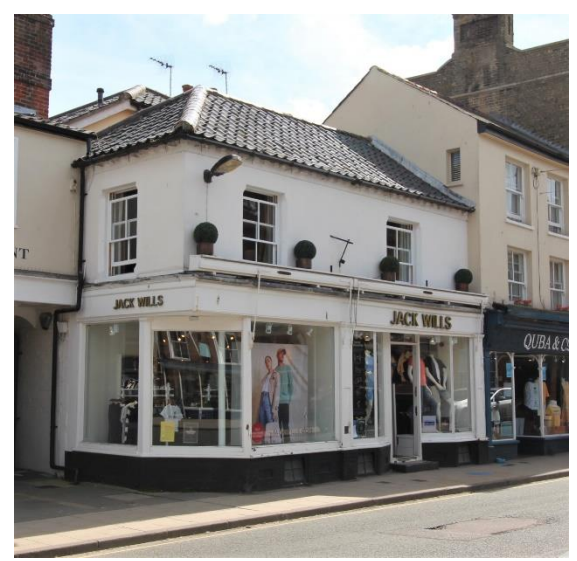
No.94 High Street