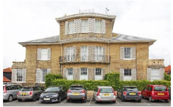
No.1 Greyfriars North, Greyfriars South, and Regency House, South Green