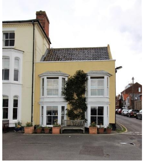
No. 7 South Green