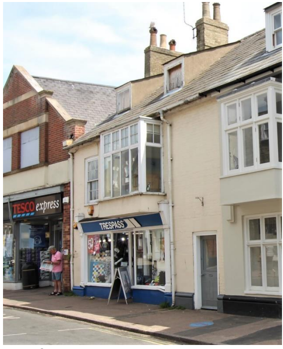
Nos.4 & 6 Queen Street