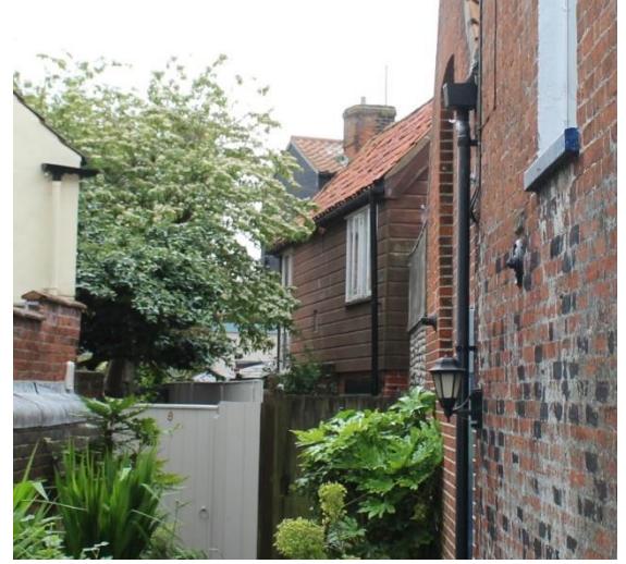
Cornfield Mews No.6A Stradbroke Road

Cornfield Mews No.6A Stradbroke Road (Positive Unlisted Building). A small cottage to the rear of No.6 Stradbroke Road and No.11 East Green accessed via a pathway to the rear of the Methodist Chapel and to the side of No.6 Stradbroke Road. Red brick with timber clad first floor, and red pan tile roof. Casement windows. A group of three small buildings appear on this narrow footway on the 1971 1:2,500 Ordnance Survey map of which this appears to be the only survivor. This building also appears to be on the 1904 map.