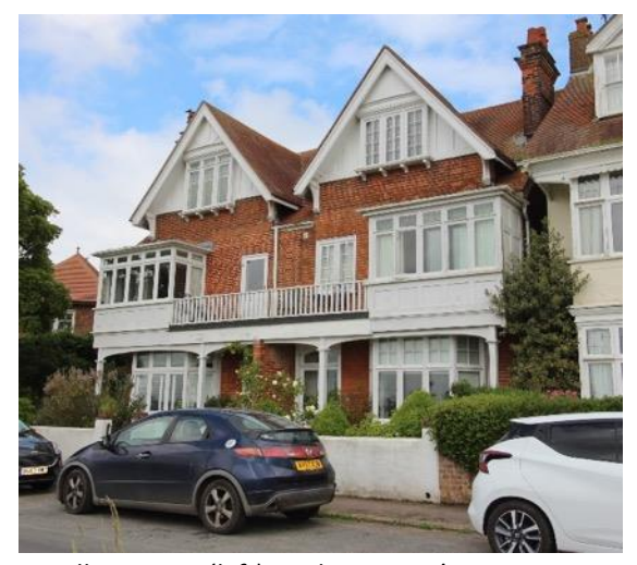
Windles, No.1 (left) and St Mary's House, No.2 (right), Godyll Road

Windles and St Mary's House, Godyll Road (Positive Unlisted Building). A pair of late 19<sup>th</sup> or early 20<sup>th</sup> century villas, now a single house. Skillful and imaginatively composed and benefitting from much high quality joinery and detailing. A two storey red brick house with a pair of prominent attic gables; eaves supported on brackets with projecting windows also on brackets. To the ground floor are a pair of canted bays with original window joinery and above, and off-set to the extreme ends of the elevation, are a pair of flat-roofed bay windows. Linking the two is a balustraded balcony, supported below by timber columns on pedestal bases. Between each column is a gently curved soffit to the underside of the balcony. Historic photos show the first floor square bays to be later additions, and the brickwork to the first floor shows the scarring of further alterations. However, the house retains much original door, window and balcony joinery and makes a strong and highly visible contribution to view of the conservation area from the east.