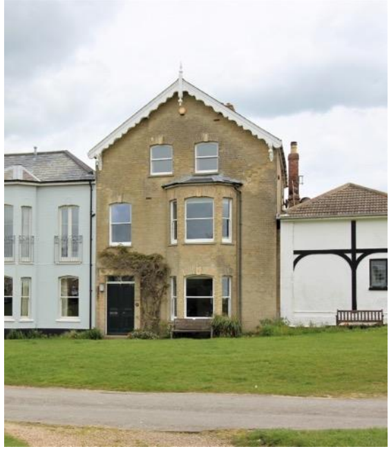
Bonsey House, No.30 South Green

'Harriet's Cottage', No.28A South Green (Positive Unlisted Building). Early 19<sup>th</sup> century and probably originally a range of outbuildings relating to No.28. Two storey with painted render elevations. Red clay pan tile roof. Windows are a mix of ages, but with some retained historical joinery including the two storey canted bay with hornless sashes. Attached single storey range to the south east.