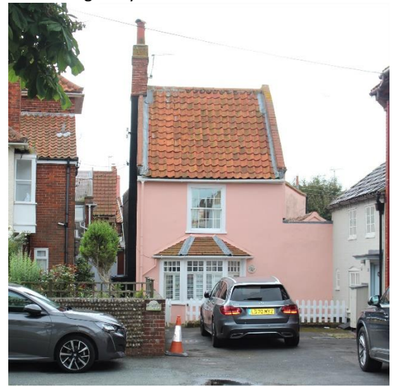
No.19 St James Green

No.17 St James Green (Positive Unlisted Building). A small painted brick cottage of later eighteenth or early nineteenth century date. Dentilled brick eaves cornice and a black pan tile roof. Original gently arched openings to ground floor windows preserved although now filled with twentieth century casements. Two small late twentieth century casements above. Boarded front door with hood. Mid twentieth century single storey addition to rear with a flat roof which terminates in a bow window. Outbuilding Two storey red brick outbuilding to rear of red brick with a red pan tiled roof. A single bay wide a boarded door.