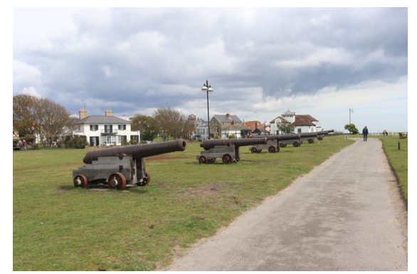
Row of six cannons, Gun Hill

Row of six cannons, Gun Hill (Positive Unlisted Structures). A row of six Elizabethan cannons, pointing out to sea, apparently given to the town by the Board of Ordnance in 1746. The timber carriages were replaced 2019. The last recorded firing is reputed to have been in 1842 to commemorate the birthday of the Prince of Wales. The cannons are a significant feature of Gun Hill and contribute positively to the character of the area. See Bettley, J and Pevsner, N The Buildings of England, Suffolk: East (2015), p.522.