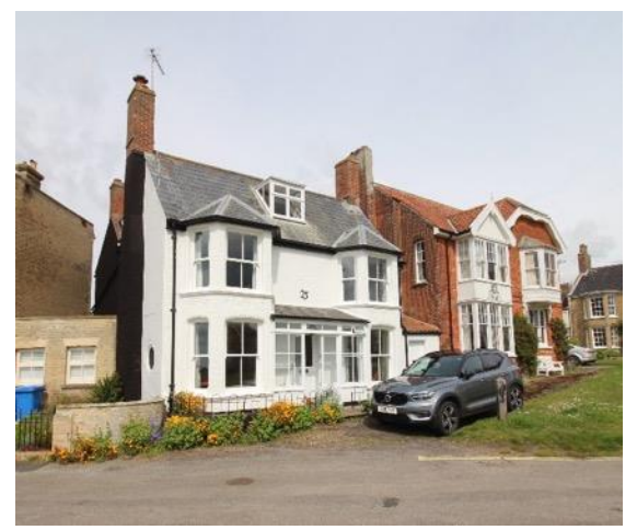
Tudor Cottage, No.25 South Green

No.23 South Green (Positive Unlisted Building). A building of two parts; the right hand section dates from the end of the 19th century, the left hand section was constructed in 1903 and replaced a single story structure that latterly had been used as the office for the Southwold Salt Works. The taller and older right hand section has a hipped roof gable end and pierced bargeboard arrangement similar to that opposite at Acton Lodge. The north elevation has a centrally located door, with a projecting red brick stack to the left and plate glass sash windows above and to the sides. Each opening has a stone lintel over (now painted) with expressed key stone. Strong course of diamond set bricks. The 1903 addition is dominated by a two storey square bay window, with shas windows with divided upper leaf and plate glass below. To the apron of the bay, between the ground floor heads and first floor sill, is an escutcheon carrying the Southwold coat of arms and the date 1673, indicating a possible connection between the site and the original location of Southwold's Town Hall.