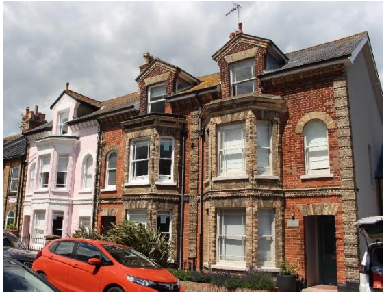
Nos.1-5 (Odd) Chester Road

Balmore Cottage, No.1A Chester Road – see No.7 North Parade and for 1B Chester Road - see No.4 Chester Road.