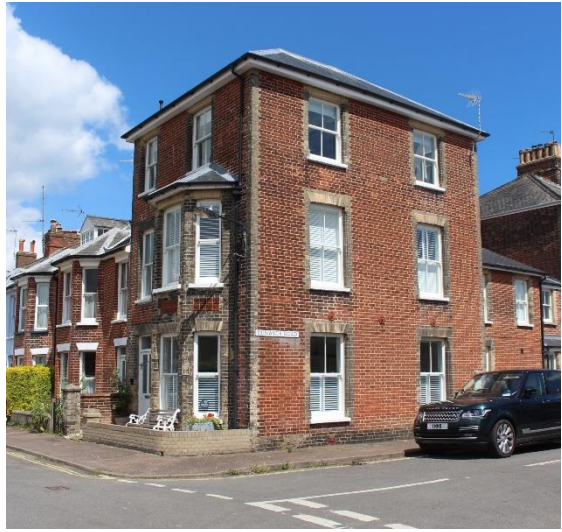
No.19 Stradbroke Road

Nos.7 & 9 Stradbroke Road (Positive Unlisted Buildings). A house and former shop of c.1895 of painted red brick with a Welsh slate roof and overhanging eaves. (The site is shown as vacant on a dated photograph of October 1893 in the possession of Southwold Museum). The plots were however ones auctioned by the Corporation in August 1885 with the stipulation that a house or shop costing no less than two hundred and fifty pounds be constructed on each. Old photographs suggest that No.9 also had gault or Suffolk white brick dressings. No.7 retains a simple c.1900 former shop facia with pilasters which is now infilled, and a canted oriel window above, with horned plate-glass sashes. No.9 has a two-storey canted bay window with horned plate-glass sashes. Arched doorway with plate-glass fanlight