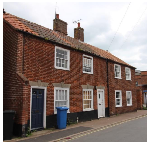
Nos.40 & 42 Church Street.

Nos.40 & 42 Church Street (Positive Unlisted Buildings). A semidetached pair of red brick cottages with pan tile roofs probably of c.1800-1820 date. Sixteen light hornless sashes in moulded wooden frames. Wedge shaped lintels with pronounced key stones. No 40 with a six panelled door with glazed top lights. The door to No.42 boarded. Large late twentieth century addition to southern end of No.42. Northern return elevation of No.40 rebuilt following the demolition of the adjoining former Brickmakers Arms public house c.1984.