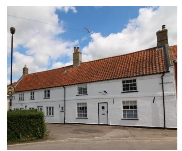
Primrose Cottage No. 7, No.8 & Dolphin Cottage No.9 North Green

Primrose Cottage No. 7, No.8 & Dolphin Cottage No.9 North Green (Grade II)