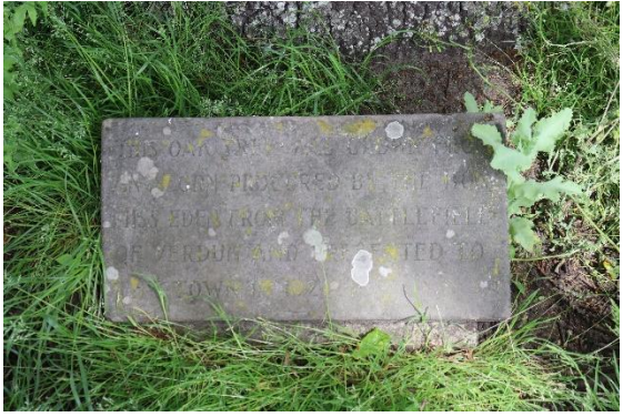
Verdun Tree Dedication Stone, East Green

Verdun Tree Dedication Stone, East Green Substantial stone with inscription commemorating the planting of an Oak tree grown from an acorn taken from the battlefield of Verdun in 1920. For the Adnams Malthouse block on the western side- See Victoria Street