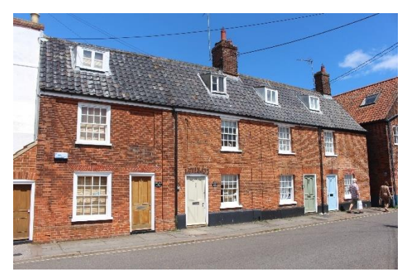
Nos.26-32 (even) Victoria Street

The Old Royal, Nos.20 & 22 Victoria Street and outbuilding (Positive Unlisted Building). Former Royal Public House (originally the White Lion) closed 1980s. Possibly early eighteenth-century gabled range with an early c.19th painted red brick former cottage (No.20) attached to its northern end. The two properties had been combined by the mid twentieth century, and now function as one dwelling. Cottage front door formerly in left hand bay on street facade. Late twentieth century pedimented doorcase surrounding historic door opening in gabled range of gabled section, with late twentieth century door within. The ground floor window is a tripartite sash beneath a shallow brick arched lintel. Small pane casement windows above. Cottage elevation with rendered wedge-shaped lintels with pronounced keystones replaced small pane sashes. Two storey canted bay window with small pane sashes to south-eastern elevation, partially clad in timber. Red brick garden wall to southeast enclosing garden of post 1950 date which occupies the site of the demolished war damaged No.24. Small single storey red pan tiled outbuilding of c.1800 or earlier date to the rear of No.20.