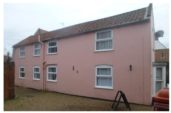
6 Smokehouse Court

Puddle Court, 6 Smokehouse Court (Positive Unlisted Building). A two-storey residential conversion, part rendered and part painted flint. It has a red pantiled roof and a gable end ground floor bay window. The building is of simple linear form and is an attractive small scale survival of a former backland working building and rear yard.