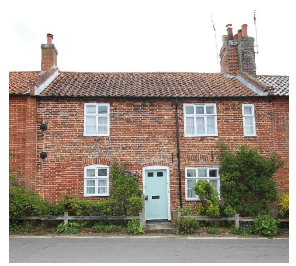
Park Lane Cottage West, Gardner Road

Park Lane Cottage West, Gardner Road (Grade II) See also: 27, Park Lane Cottage, Park Lane.