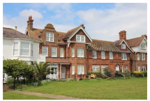
Eversley House (left) and No.10 The Master's House (right), The Common

Mariners and Old Mill, The Common (Positive Unlisted Building). A pair of double fronted villas dating from the late nineteenth century, shown on historic photographs alongside the mill, prior to demolition of the mill in 1894. Both villas are rendered, covering the original white brick elevations, and both houses have had their single storey canted bays raised in height and replacing the tripartite sash window arrangement to the first floor. Hipped roof covered with Welsh slate. Both houses retain some of their original plate glass sash windows. Finialed railings enclosing the front gardens.