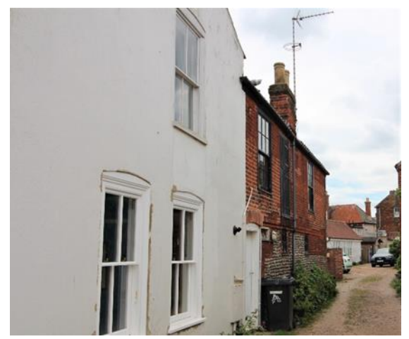
Warehouse range attached to rear of 39 Victoria Street.

Adnams Whisky Dunnage Premises see Crown Hotel, High Street.