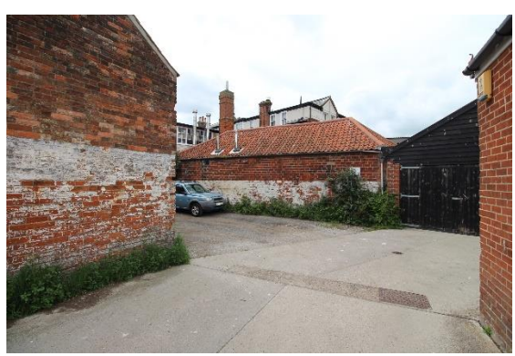
Former Outbuilding at rear of The Crown, High Street

major coaching inn. This range also forms part of the immediate setting of the listed houses on the western side of Church Street.