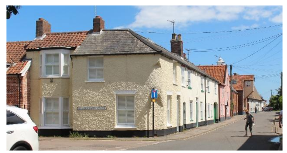
Nos.12-18 (even) Victoria Street from Bartholomew Green

Corn Store, No.10 Victoria Street (Positive Unlisted Building). Former grain store, possibly converted in the early to mid-nineteenth century from the service wing of the Grade II listed No.1 Bartholomew Green of which it now once again forms part. Converted to dwelling in the twentieth century. Rendered and scoured to imitate ashlar blocks with a red pan tile roof the words 'Corn Store' inscribed into the render. Two twentieth century small pane casement windows and a boarded door. A 1949 National Monuments Record photograph (BB49/3023) shows the upper floor of the façade as it is today, but with a small window and a second door where the present large ground floor window is located.