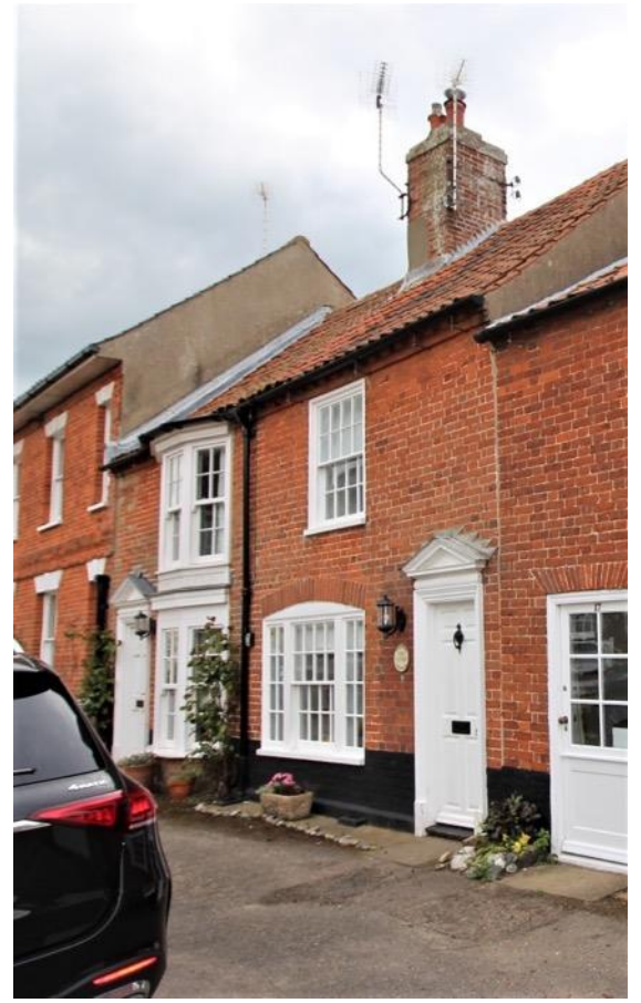
York Cottage No. 19 (right) & No.21 (left) South Green

No.17 South Green (Positive Unlisted Building). An early 19<sup>th</sup> century cottage with red brick elevation and painted render side return. Entrance under a gauged brick arch to the left and to the right are ground and first floor 8 over 8 pane sash windows, also with gauged brick heads. Red clay pan tile roof with red brick ridge stack to the west end.