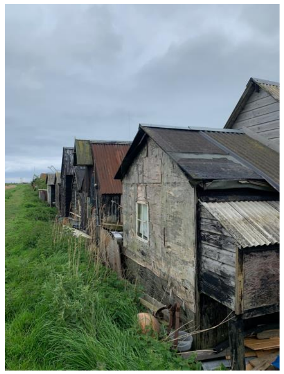
View of the rear elevation of huts, looking north east

While the elevations facing the river make a strong and positive contribution to the character area, the rear elevations, which are highly visible from the elevated footpath and also from various vantage points within the town and the land between, means that the contribution made by these seemingly modest structures is high.