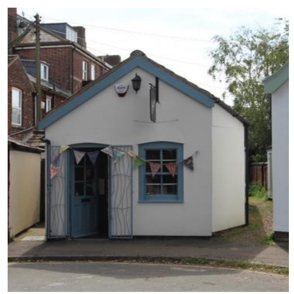
Tor Schotte Antiques, Blackmill Road

Tor Schotte Antiques, Blackmill Road (Positive Unlisted Building). Former bakehouse to Clarke's bakery premises at 35 High Street and 8 Victoria Street. First shown on the 1904 1:2,500 Ordnance Survey map. Rendered elevations with off centre ridge and pan tile covered roof. Horned two over two pane sash window, with later inserted door. The structure contributes to the conservation area through its modest charm and also reflects the economic history of the town.