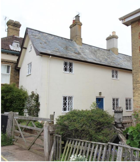
Reading Room Cottage, East Street

Reading Room Cottage, East Street (Grade II)