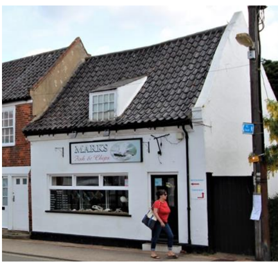
No.32 High Street

Nos.28 & 30 High Street (Positive Unlisted Buildings). Two houses of early nineteenth century date. Built of red brick with a glazed black pan tiled roof. Twelve-light hornless sash windows. Decorative wedge shaped plaster faced wedge shaped lintels to window and door openings. Twenteith century partially glazed front doors. Tall red brick ridge stacks.