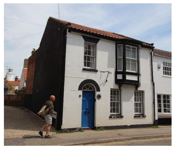
Mouse Cottage, No.10 East Street

Mouse Cottage, No.10 East Street (Positive Unlisted Building). An early nineteenth century former shop which had been converted to a dwelling by the third quarter of the twentieth century. Painted brick with a red pan tiled roof. Six panelled front door beneath a semi-circular radial fanlight. Twelve light hornless sash window above, with a wedge-shaped lintel. Mid nineteenth century canted bay window to the first floor which is supported on brackets with horned plate glass sashes. The twelve light sashes to the ground floor are probably of mid twentieth century date replacing a shop front.