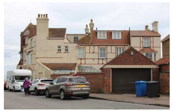
No.28 North Parade from Field Stile Road