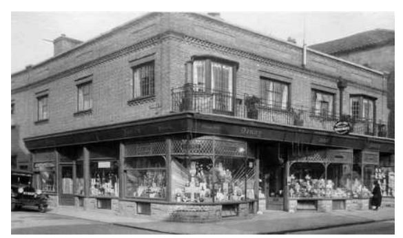
No. 2 Market Place in the 1930s.

Co-operative shop, No. 2 Market Place (Positive Unlisted Building). Constructed around 1928 and was formed of residential first floor use above a large ground floor shop, all in brick. The ground floor shop frontage projects to allow a first-floor balcony to be formed, although the balcony arrangement is now missing. The building is austere in character with curious throwback references to 18th century architecture such as toothed eaves, panelled parapet and what had been windows with leaded lights. The original shopfront wrapped around the building and along Church Street, although the flank shopfront has now been lost. Part of the original shopfront appears to survive - just. Undoubtedly, the reduced shopfront, replacement first floor fenestration and loss of balcony have all reduced the architectural interest of this building. However, it retains a presence in the town centre and its use as a local shop is very important for the vitality of the town centre. This use contributes importantly to the character of the Conservation Area in this part of it; and the overall scale, presence and some surviving detail of the building, can be judged to make a positive contribution to the overall character and appearance of the Conservation Area.