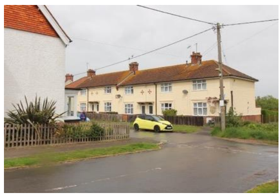
Mights Cottages, Nos.30-40 (even) North Road

Nos.6-28 (even) North Road (Positive Unlisted Buildings). Three blocks of four early council Southwold Corporation houses completed c.1914 probably to the designs of James Hurst the Borough Surveyor. Red brick with pebble dashed first floor and decorative brick quoins. Rubbed brick wedge shaped lintels. Replaced pan tile roof coverings and shared red brick ridge stacks. Terracotta commemorative plague on central block with lugged brick surround. Nos * &.20 appear to retain their original horned sashes and partially glazed front doors with decorative stainedglass panels, all other external joinery replaced within the original openings.