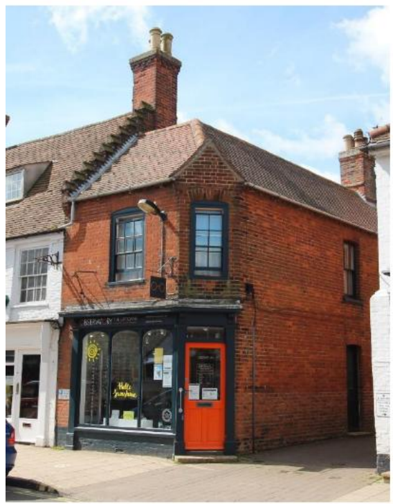
No.53 High Street

No.53 High Street (Positive Unlisted Building). House and lock up shop of c.1890 built on the site of a blacksmith's workshop. Originally with a crowstepped gable to the splayed corner. Red brick with a Welsh slate roof. Early twentieth century photographs show this building with plate-glass sashes beneath shallow brick arched lintels, most of which still survive. Late nineteenth century shop facia. Manor Farm Close elevation contains a partially glazed front door and four-light plate-glass sashes. No.53 makes a strong positive contribution to the setting of the listed buildings which flank it.