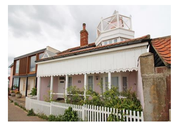
South Cliff Cottage, east elevation to South Cliff

South Cliff Cottage, South Cliff (Positive Unlisted Building). A complicated and multi-phased property of mixed character. Essentially two cottages; one located to South Cliff and facing the sea and one located to the west. Both structures appear to be shown on the 1884 OS map, and have been linked by a single storey range at least since the 1970s (link range rebuilt c.2017) and the 1927 OS maps shows a range of outbuildings between the two structures. The property facing South Cliff retains much late 19<sup>th</sup> century detailing and joinery, including the timber canopy over the veranda, and plate glass sash windows. An octagonal belvedere with slender access tower, added to the north east corner of the property, adds an unconventional flourish to the property. The cottage to the west is two storey, more conventional, constructed from flint with a pitched roof covered with pan tiles and gable end stacks.