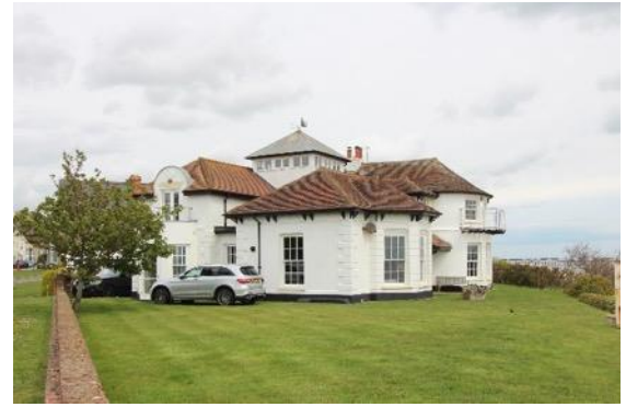
Cannons and boundary wall, Gun Hill

Cannons, Gun Hill (Positive Unlisted Building). One of four villas constructed c 1870 on Gun Hill, originally known as Marine Villa. Rendered elevations with expressed corner quoins and bracketed overhanging eaves. Two storey additions and a central belvedere have increased the prominence of what was a relatively modest villa. Good quality mid 20<sup>th</sup> century washed cobble wall with Suffolk white brick margins, which sweeps up to meet the entrance piers.