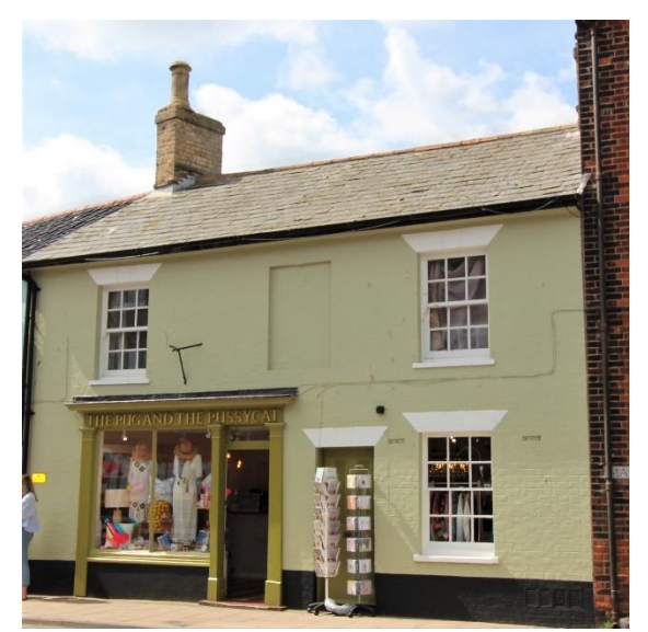
No.3 Market Place