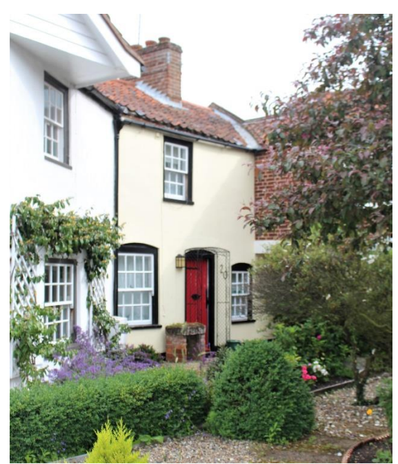
Barnaby Cottage, No.16 & 18 High Street (Grade II)