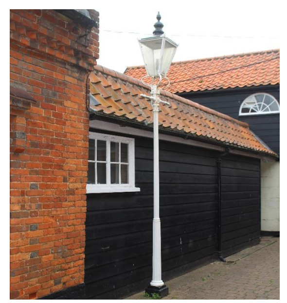
Gas light outside Southwold Museum, Victoria Street

Southwold Museum, Victoria Street (Grade II)