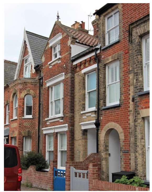
No.50 Stradbroke Road

No.50 Stradbroke Road (Positive Unlisted Building). Substantial house of the early-1890s. Shown on a photograph dated 13<sup>th</sup> October 1893 in the Southwold Museum collection. Red and Suffolk white brick façade with painted stone dressings and a replaced red pan tile roof. Principal façade of two bays with a finial capped gabled breakfront to the southern bay, which is of red brick, whilst the remainder of the façade is of white brick. Heavy dentilled eaves cornice of red brick. Horned, plate glass-sashes. Recessed porch containing a partially glazed panelled front door. Nos.40-44 (even) Stradbroke Road are of an identical design. Late twentieth century low wall to frontage.