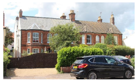
Nos.32-38 (even) Stradbroke Road

Nos.20 & 22 Stradbroke Road (Positive Unlisted Buildings). A pair of substantial semidetached houses which appear on a dated photograph of 1893 preserved in the Southwold Museum collection which was taken from the lighthouse. Red brick with red pan tile roofs (possibly replacing Welsh slate). Retaining their original horned fourlight plate-glass sashes to their principal façade. Each house is of three bays with a central doorway flanked by full height canted bay windows. Red brick ridge stacks. Set back some distance from the road within mature leafy gardens. Mid twentieth century red brick gate piers to Stradbroke Road.