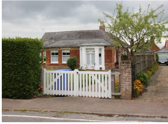
No.26A Field Stile Road

Victoria Cottages, Nos. 24 & 25 Field Stile Road (Positive Unlisted Buildings). According to the Southwold and Son website these cottages were built by the farmer William Frederick Baggot c.1877 on the site of a windmill which had recently been destroyed by fire. A pair of cottages are shown on this site on the 1884 1:2,500 Ordnance Survey map. Their facade is shown on a dated photograph of 1893. Redbrick façade with elaborate gault brick dressings. Roof of black pan tiles with red pan tile diamond shaped embellishments. No.25 has a late twentieth century small addition. Gabled nineteenth century red brick outbuilding to the rear of No.24 which may have once been connected to the Baggot's bakery business.