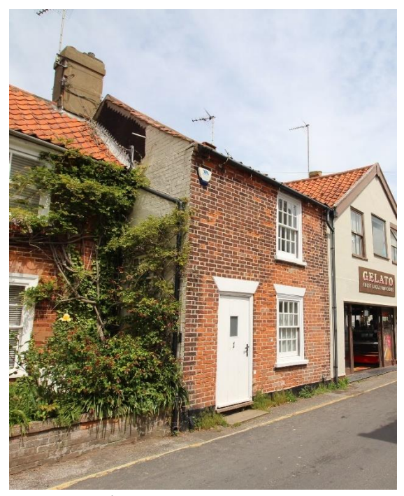
No.1 Pinkney's Lane

For Pinkney's Lane South Side see Marine Villas Character Area