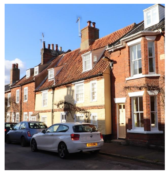
No.9 Park Lane