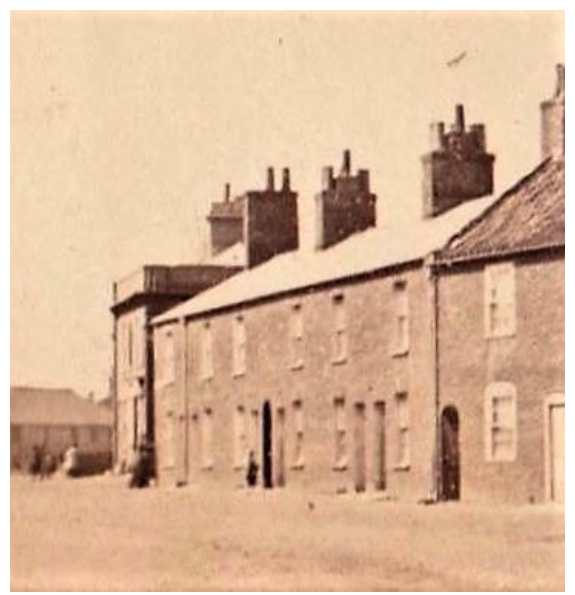
Nos.2-12 St James Green c.1870

Nos.2-12 (even) St James Green (Positive Unlisted Buildings). A red brick terrace of mid nineteenth century date with a Welsh slate roof. Now rendered apart from No.12. Originally a symmetrical composition with an arched central passage leading to the rear gardens. Nos.10 & 12 were given full height canted bay windows c.1900 which retain their original horned plate-glass sashes. Nos. 2-8 have twelve light horned sashes beneath wedge shaped lintels. Front doors largely replaced. Single storey early twenty first century addition to the rear of No.2. This terrace makes an important contribution to the setting of the Grade II listed lighthouse and Sole Bay Inn.