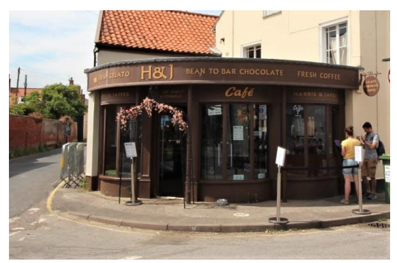
No.11 East Street

East Lodge & Upper East Lodge, East Street (Positive Unlisted Building). Rendered red brick dwelling of c.1800 with a black pan tiled roof. Now two flats. On the first floor of the principal façade are two twelve light hornless sashes flanking a central blind recess. Beneath at ground floor level is a centrally placed pilastered doorcase with a twentieth century partially glazed panelled door. To the west of the door is a mid-nineteenth century former shop window, to its east a horned sash window divided into three sections by mullions. Eastern return elevation retains two casement windows with narrow margin lights. Western return elevation with horned sashes.