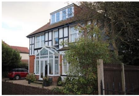
No.68 North Road

No.67 North Road (Positive Unlisted Building). A well preserved substantial detached house of c.1910. Faced in red brick with a rendered first floor and steeply pitched plain tile roof. Decorative ridge pieces and applied timber framing to gable. Original window joinery largely preserved. Plate glass sashes divided by mullions with small panes to upper lights. Decorative partially glazed wooden porch.