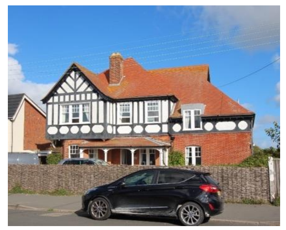
Saxon House, No.86 Pier Avenue

No.82 Pier Avenue (Positive Unlisted Building). An early twentieth century detached villa (shown on an auctioneer's plan of 1919, but not amongst the plots sold in the first sale in 1899). Bomb damaged in 1943 and altered and extended c.2015 but retaining much of its original external joinery. Red brick with a rendered upper floor and a plain tile roof. Decorative wooden veranda. Tall decorative red brick chimneystack. The applied decorative timber framing is not shown on 2011 photographs of the building. However midtwentieth century photographs do show elaborate plasterwork in the style of applied timber framing to the entire first floor, much in the style of the adjoining Saxon House.