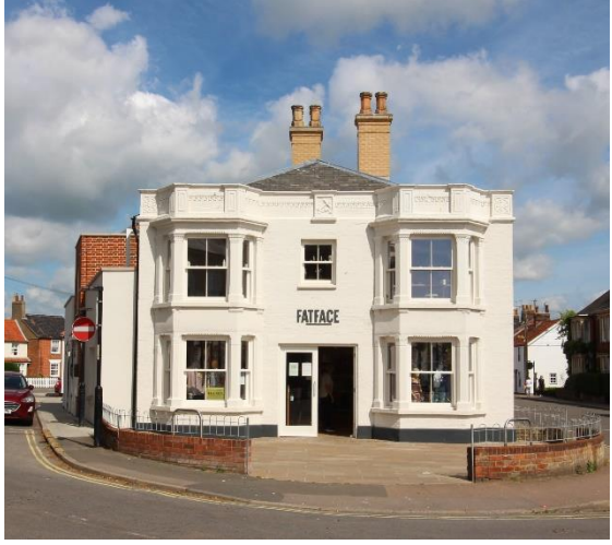
No.31 High Street

century rendered cottage with a red pan tiled roof and overhanging eaves. Late twentieth century replacement twelve-light sash windows and partially glazed twentieth century front door.