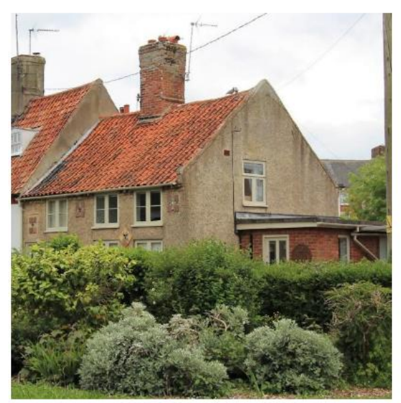
Nos.3 & 4 Bartholomew Green