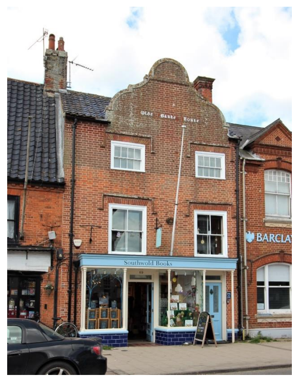
Old Banke House, No.69 High Street

Old Banke House, No.69 High Street (Grade II)