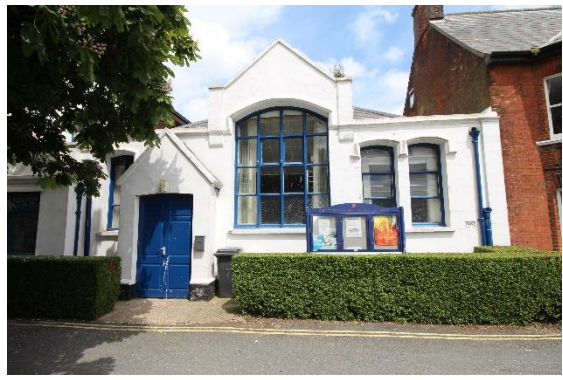
Methodist Church Hall, East Green

Rokeby Lodge, No.11 East Green (Positive Unlisted Building). A red brick villa of c.1900 with rubbed red brick dressings. The site of this dwelling is shown as vacant on the 1884 1:2,500 Ordnance Survey map but occupied by the present building by that of 1904. Full height canted bay window with horned plate-glass sashes. Steeply pitched Welsh slate roof. Front door opening modified in later twentieth century to allow glazed lights to be fitted surrounding the opening. Bracketed later twentieth century hood above. Twentieth century panelled door. Substantial chimney stack to northern gable. A prominent located house which despite alteration contributes to the setting of both the Methodist Chapel and listed buildings on St James Green.