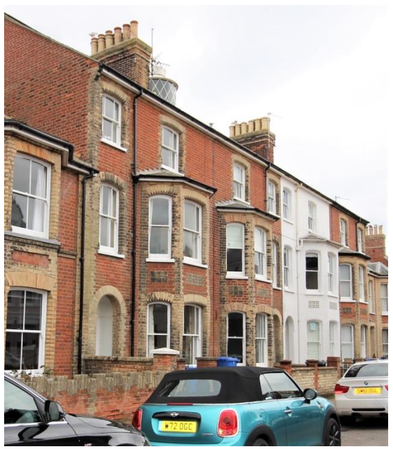
Nos.4-10 (even) Chester Road

No.2 Chester Road (Positive Unlisted Building). A villa built on a plot sold by Southwold Corporation in 1885 with the proviso that a dwelling costing not less than two hundred and seventy pounds be constructed on the site. Map evidence suggests that it was built between 1891 and 1904 whilst at least two houses were occupied by the time of the 1891 census. Save for No.16, the houses on Chester Road were probably constructed by the same builder. Red brick with elaborate gault brick dressings and pilasters. Two storeys and two bays with original horned plate-glass sashes. Partially glazed front door set within recessed arched porch. Reroofed but retaining decorative brick ridge stack and original decorative pots.