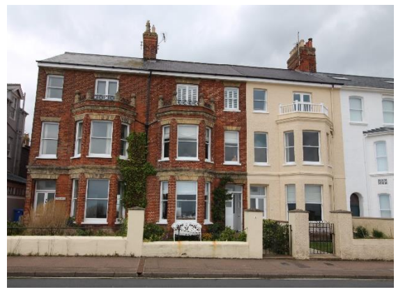
Stoke Lodge, No.15 & Nos.16-17 North Parade

evidence suggests replaces a small conservatory. Southern return elevation of two bays has a canted bay of two storeys which originally contained paired sashes with a central mullion but now contains a single plate-glass sash. Lean-to conservatory which is shown on early twentieth century photographs. Marlborough Road elevation has a twentieth century addition with a steeply pitched Welsh slate roof. Low painted brick wall to North Parade the southern section of which is capped with simple iron railings. Square section gate piers. High boundary wall to southern and Marlborough Road frontages also now painted. John Miller Britain in Old Photographs: Southwold (Stroud 1999) p83