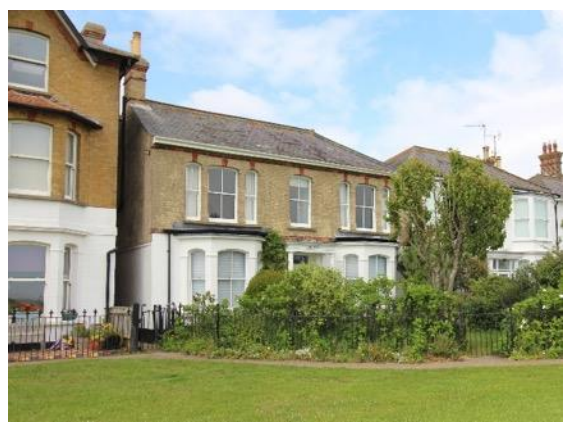
Mill House, The Common

Mill House, The Common (Positive Unlisted Building). Former home of the mill owner, and latterly formed part of the Eversley Road School complex. Presumably built prior to the demolition of the mill (1894) although the structure shown on the 1884 1:2,500 Ordnance Survey map appears to relate to the single storey building that was replaced by the existing house. White brick with rendered ground floor. Central entrance with columned porch, flanked by a pair of flat roofed canted bay windows. Above each bay are tripartite windows and to the centre of the first floor a single plate glass sash window. The openings to the first floor have red brick key stone detailing. Welsh slate roof, hipped to the east, with gable end to the west and a white brick ridge stack. Wrought iron finialed railings and hand gate enclosing the front garden.