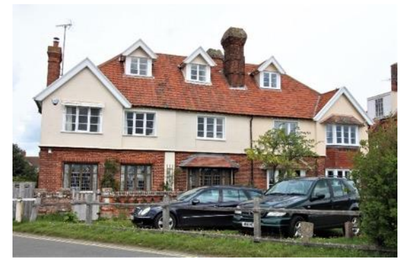
No.5 (right) and No.6 (left) and boundary wall, Strickland Place

set back entrance wing either side with a timber canopy supported on shaped brackets. Tall windows with arched heads to the ground floor and flat gauged brick lintels to the first. Above this is a brick dentil course, supporting corbelled eaves brickwork. Red pan tile covering to hipped pyramidal roof, broken by a pair of dormers to the south and a further dormer to both the east and west side elevations. Each property has a tall and wide fluted red brick chimney, off set to the side pitches. No.4 is better preserved and retains its original window joinery. The houses are of restrained but spirited design and are significant in views north from the common and the park to the immediate south.