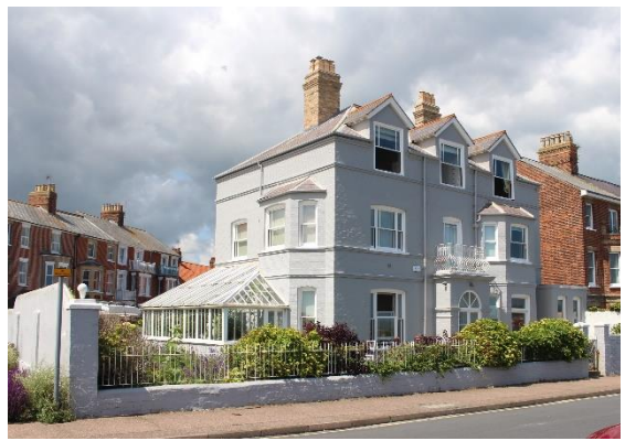
'The Mount' No.14 North Parade

unsympathetically replaced in the later twentieth century. All three were private houses in 1911 according to the census, but by 1916 directories show that No.12 was in use as apartments. No.13 was the original 'Craighurst' and later became the Craighurst Hotel. The terrace was damaged by bombs in 1941, and the balconies were probably added during reconstruction (not shown on pre-WWII pics). Converted to apartments 2001. The two-storey rear range of No.13 now forms a separate dwelling known as No.2 Dunwich Road. It has an arched recessed porch which appears to be original and one four-light plate-glass sash. First floor windows altered to allow access to the balcony. Flat roofed late twentieth century dormers in roof. John Miller Britain in Old Photographs: Southwold (Stroud 1999) p83.