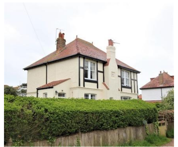
Creek House, No.70 North Road

No.68 North Road (Positive Unlisted Building). Substantial detached house of c.1912, probably designed by Edward Charles Homer (1845-1914) who also designed villas on Pier Avenue. Faced in red brick with render and applied timber framing to the first floor. Hipped plain tile roof with large late twentieth century flat roofed dormer and projecting eaves. Plate glass sashes with small panes to upper lights. Central door opening now set within late twentieth century glazed porch.