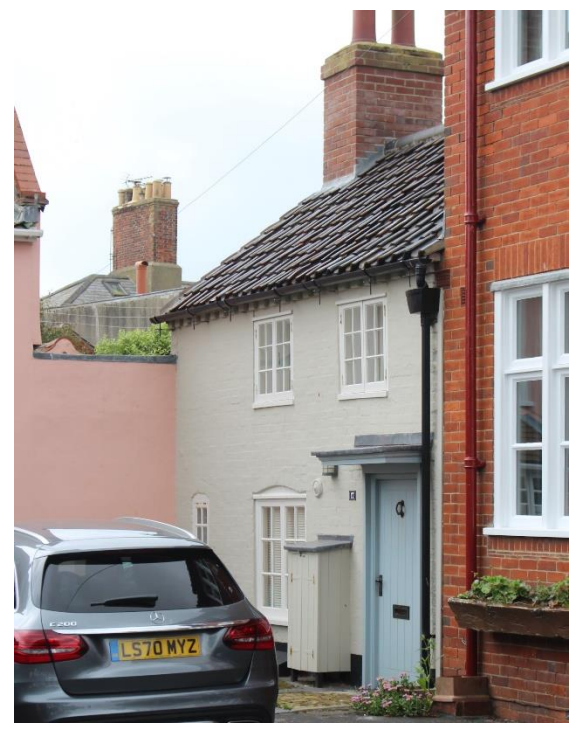
No.17 St James Green

Adelaide Cottage, St James Green (Positive Unlisted Building). Early nineteenth century single-storey dwelling of rendered and painted brick with a black pan tiled roof. Possibly a nineteenth century refronting of an earlier cottage. Lead roofed canted bay windows to rendered principal façade with horned plate-glass sashes, parapet above hiding roof slope. Gabled painted brick return elevation containing front door. Tall, rendered chimneystack. Less sympathetic late twentieth century railings to front.