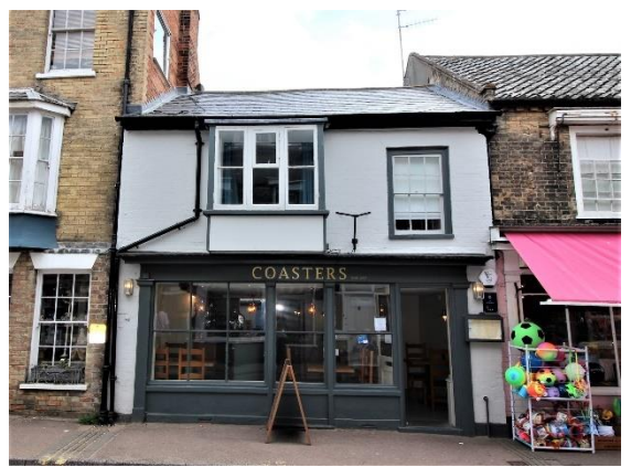
No.12 Queen Street