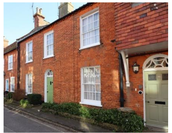
Nos.10 & 12 Park Lane

No.6 Bradwell House & No.8 Park Lane (Grade II)