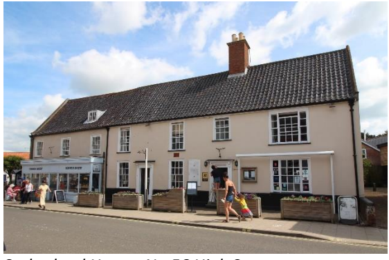
Sutherland House, No.56 High Street

Sutherland House, No.56 High Street (Grade II*)