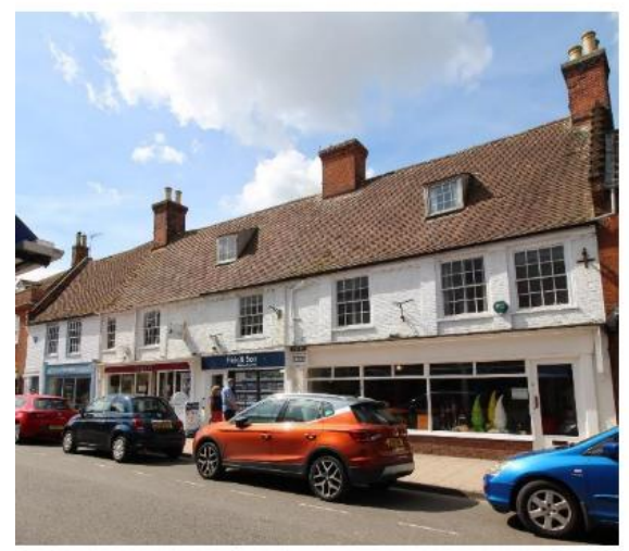
Nos.55-63 (odd), High Street

No.53 High Street (Positive Unlisted Building). House and lock up shop of c.1890 built on the site of a blacksmith's workshop. Originally with a crowstepped gable to the splayed corner. Red brick with a Welsh slate roof. Early twentieth century photographs show this building with plate-glass sashes beneath shallow brick arched lintels, most of which still survive. Late nineteenth century shop facia. Manor Farm Close elevation contains a partially glazed front door and four-light plate-glass sashes. No.53 makes a strong positive contribution to the setting of the listed buildings which flank it.