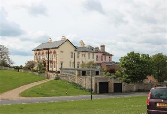
Southwold House (left) and Sole Bay House (right), from Constitution Hill

Cobble boundary wall with red brick square section gate piers to north side of garden. Similar wall with arched red brick door opening to south. Substantial and prominently located single-storey red brick and cobble nineteenth century outbuilding with a red pan tiled roof at south-western corner of plot. Boarded doors within southern gable.