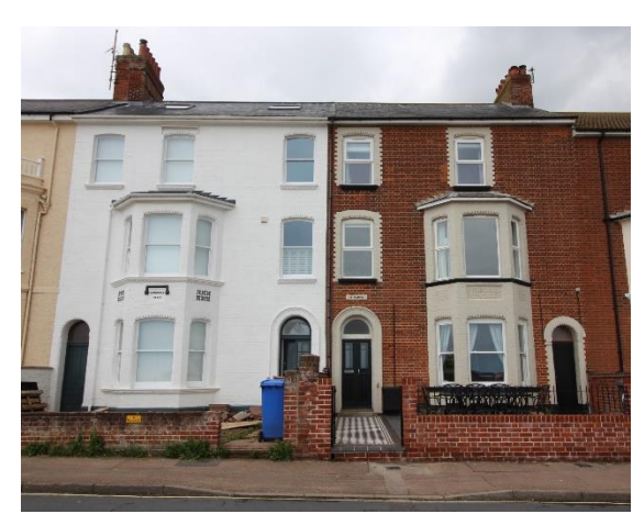
Nos.18 & 19 North Parade

accessed from French doors at second floor level. The balconies are of elaborate cast iron between gault brick piers capped with ball finials. That to No.17 has however been replaced by one of painted wood. Horned plate-glass sashes. Partially glazed panelled doors with rectangular fanlights above. Red brick ridge stacks with a gault brick dentilled cornice below the cap. Rendered brick dwarf wall to gardens with square-section gate piers. Late twentieth century iron gates. No. 16 described as apartments in Kelly's 1916 directory whilst No.15 was in single occupation. Considerably altered single storey red brick outbuilding to rear of No.15. John Miller Britain in Old Photographs: Southwold (Stroud 1999) p83