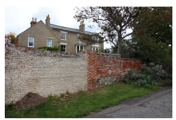
Cobble Boundary Wall, Strickland House, No.25 Park Lane

Strickland House, No.25 Park Lane (Grade II)