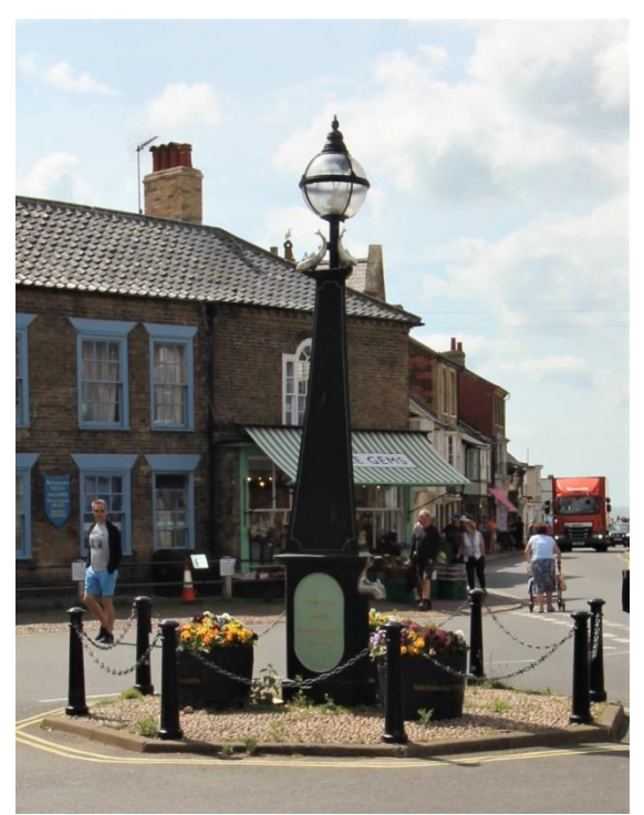
Town Pump, Market Place