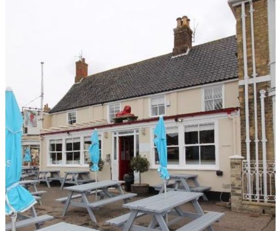
Red Lion Inn, No.2 South Green

Red Lion Inn, No.2 South Green (Grade II)