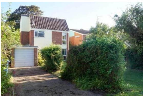
No.74 Pier Avenue

Nos. 72-78 (even) Pier Avenue (Positive Unlisted Building). Detached houses of c.1967 occupying site of former brick field, inventively designed with reception rooms at first floor height to combat split level nature of site. Two storeys with access at First Floor level via concrete foot bridges on Pier Avenue façades. The footbridges lead to large first floor balconies containing the front doors. To rear the house is of a more traditional appearance with a lawn and flat roofed garage accessed from Marlborough Road. Clad in red brick with rendered panels. Casement windows recently replaced. Steeply pitched pan tiled roof to garden façade, shallow pitched to entrance facade. No.78 unusually has a brick chimney stack which appears to be contemporary but is otherwise largely identical.