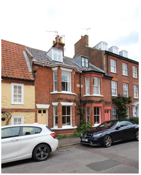
Nos.5 & 7 Park Lane

Nos.5 & 7 Park Lane (Positive Unlisted Buildings). A pair of houses dating from the late nineteenth century which were constructed within the former gardens of houses on Lorne Road. Built of red brick with blue brick embellishments and a glazed black pan tile roof. Of two storeys with two bays to each house, full height canted bay window containing original horned plate-glass sashes to inner bay of each house capped by a heavy moulded cornice. Doorway within outer bay containing panelled door beneath painted wedge-shaped lintel. Dormers with casement windows within roof and central ridge stack. Rear elevations visible from Lorne Road, red pan tile roof. No.5 with casements. No.7 rendered with a mixture of original plate-glass sashes and twentieth century casements. A wellpreserved pair of nineteenth century houses which make an important contribution to the setting of adjacent listed buildings.