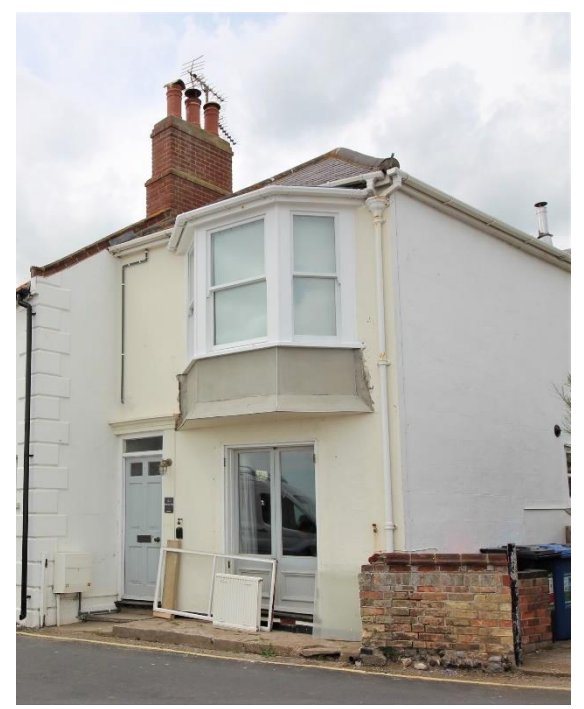
Bay Cottage, No.17A East Cliff

wooden frames they were however remodelled in the early twentieth century to form shops. Surprisingly the distinctive upper floor windows to No.16 appear on a National Monuments Record photograph of 1949 (BB49/3043) and probably therefore also date from this early twentieth century remodelling. The distinctive early twentieth century remodelling of No.17 has similarities to that of other properties located on Lorne Road and on Queen Street. Former shop window with horned plate-glass sashes, above are two early twentieth century window openings containing later twentieth century casements. The plaster quoins are of early twentieth century date.