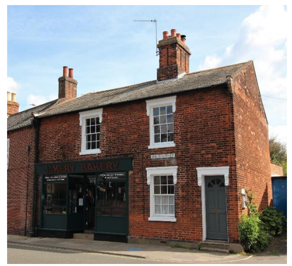
Nos.38 & 40, High Street