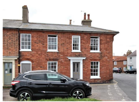
No.9 East Cliff and No.17 Trinity Street

No.11, Albion House No.13, & Kestrel Cottage No.15, Trinity Street (Positive Unlisted Buildings). A terrace of three red brick houses dating from c.1860 sharing details such as the doorcases in common with the Grade II listed No.17. Welsh slate roof with overhanging eaves. Tall brick stacks rising from the spine walls between the houses. Horned plate-glass sashes with margin lights below rubbed brick wedge-shaped brick lintels. Partially glazed and panelled front doors. The elevation of No.11 has been modified to allow for the insertion of an arched garage entrance.