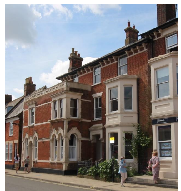
Wymering House, No.47 High Street

The Post Office and Nos.43 & 45 High Street (Positive Unlisted Buildings). Commercial building with living accommodation above built in two sections, the northern part in 1895 and the southern in 1911. Red brick with stone dressings and a Welsh slate roof. Ornate stone bay window of two storeys with pyramidal roofs linked by a central single-storey stone porch containing an arched doorway and capped by a decorative stone balustrade. Twin pediments to bays flanking porch. Original horned plate-glass sashes. Recessed porches with stone hoods supported on ornately carved corbels. Secondary entrances to living accommodation in northern and southern bays flanking bays of The Posit Office. The two flanking houses are of the same design as Nos.39 & 41 High Street. Ornate c.1895 cast iron railings and gate piers to the frontage of No.43