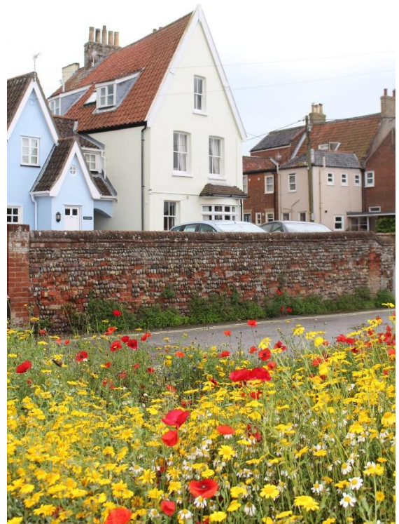
Gardner Road elevation of Nos.15A & 15B Lorne Road

Lorne Cottage, No.15 (Positive Unlisted Building). An eighteenth-century structure which probably originally looked like Nos. .11 & 13 but now with large two storey later nineteenth century bay windows. Red brick with painted stone dressings and a red pan tiled roof. Central brick pilaster and brick eaves cornice. Large possibly replaced fourlight plate-glass sashes. Central red brick ridge stack flanked by flat topped dormers with six-light sashes. Partially glazed front door beneath rubbed brick wedge-shaped lintel.