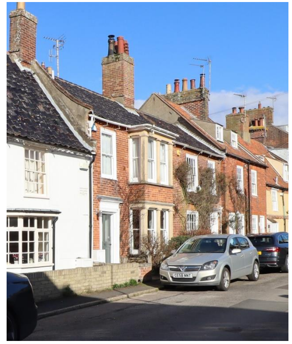
Nos.17 & Honeysuckle Cottage, No.19, Park Lane

Nos.17 & Honeysuckle Cottage, No.19, Park Lane (Grade II)