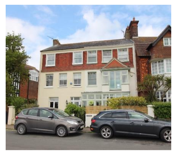
Westholme, No.8 (left) and Cranbrook, No.9 (right), Godyll Road

Westholme and Cranbrook, Godyll Road (Positive Unlisted Building). Historic photographs show the house began its life a balanced pair of three storey houses, tile hung to the attic storey and with a regimented order of three sash windows to the first and second floors of each house. Since which time Westholme has lost a window to the attic floor and the ground floor has been reconfigured. Cranbrook now has a ground floor bay projection which partly rises to the first floor with pitched roof over. While the house is not as coherent as its neighbours, both houses retain a number of horned sash windows, with unusual glazing bar arrangement to the upper sashes and the houses continue to make a positive contribution to their setting. Elaborate wrought iron hand gates and posts to the entrances of each property.