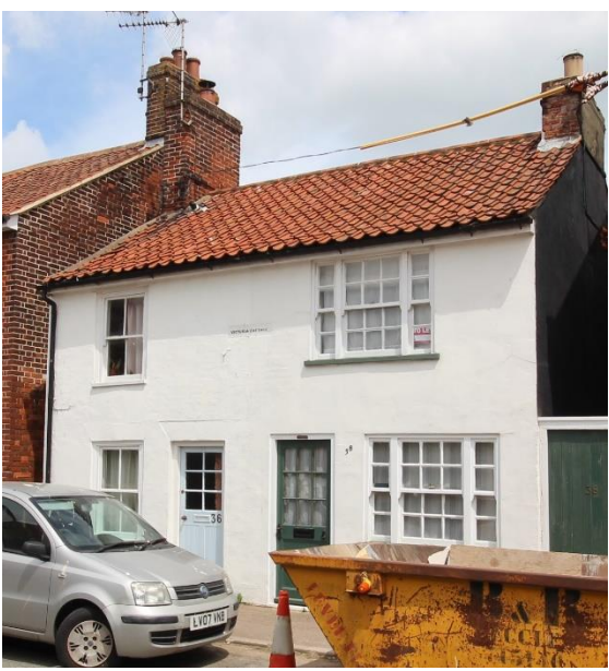
Victoria Cottages No.36 & 38 Victoria Street

Palm Cottage, No.34 & Albert Cottage, No.34A Victoria Street (Positive Unlisted Buildings) A red brick terrace of three cottages whichprobably date from c.1880. Palm Cottage and No.34 retaining their original horned plate-glass sashes. Wedge shaped plaster lintels. Red pan tiled roof. Ridge stack rising from spine wall between Palm Cottage and No.34 and second stack to gable of No.34A. Twentieth century front doors.