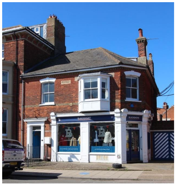
No.37 High Street

of each property. Four light plate-glass sashes set in heavy stone surrounds to first floor. Probably constructed c.1900 and shown on the 1904 1:2,500 Ordnance Survey map.