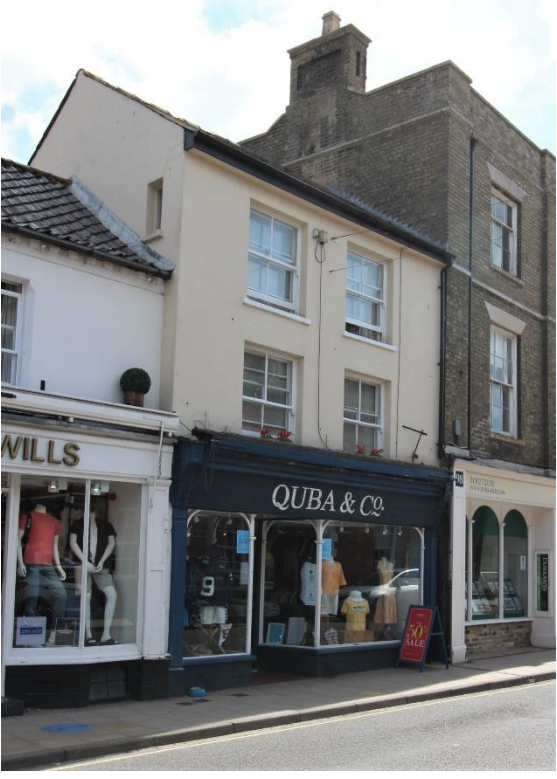
No.96 High Street

Nos.98-100 (even) High Street (Grade II)