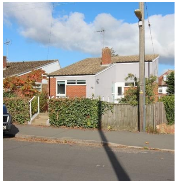
No.78 Pier Avenue

Nos. 72-78 (even) Pier Avenue (Positive Unlisted Building). Detached houses of c.1967 occupying site of former brick field, inventively designed with reception rooms at first floor height to combat split level nature of site. Two storeys with access at First Floor level via concrete foot bridges on Pier Avenue façades. The footbridges lead to large first floor balconies containing the front doors. To rear the house is of a more traditional appearance with a lawn and flat roofed garage accessed from Marlborough Road. Clad in red brick with rendered panels. Casement windows recently replaced. Steeply pitched pan tiled roof to garden façade, shallow pitched to entrance facade. No.78 unusually has a brick chimney stack which appears to be contemporary but is otherwise largely identical.