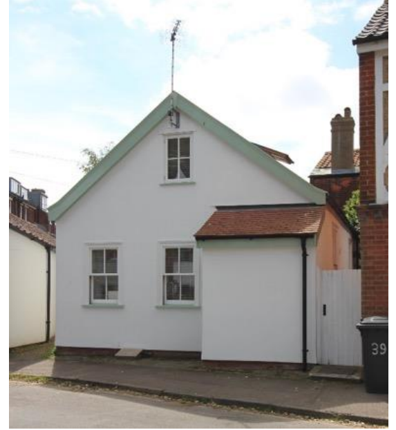
The Old Bakehouse Store, Blackmill Road

Tor Schotte Antiques, Blackmill Road (Positive Unlisted Building). Former bakehouse to Clarke's bakery premises at 35 High Street and 8 Victoria Street. First shown on the 1904 1:2,500 Ordnance Survey map. Rendered elevations with off centre ridge and pan tile covered roof. Horned two over two pane sash window, with later inserted door. The structure contributes to the conservation area through its modest charm and also reflects the economic history of the town.