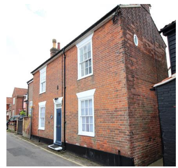
Elms Cottage, No.2 Mill Lane

Thyme Cottage, Mill Lane (Positive Unlisted Buildings). Mid-20th century cottage, painted brick at ground floor (front elevation only). 1.5 storeys with Arts and Crafts inspiration. Jettied central gable clad in hanging red tiles supported by carved timber brackets, two tile-clad dormers added in 2010s. Small-paned metal windows with red tile cills. An attractive 20<sup>th</sup> century building, wellproportioned and maintained, which has received appropriately designed recent alterations.