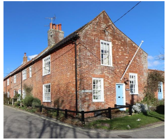
Park Lane Cottage, No.27 Park Lane

Park Lane Cottage West, Gardner Road (Grade II)