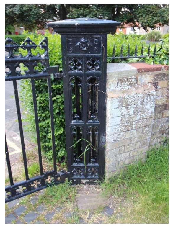
Gates to St Edmund's Churchyard, Bartholomew Green

Gates to St Edmund's Churchyard, Bartholomew Green (Grade II, GV).