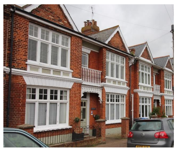
Nos.3 & 5 Cautley Road

No.1 Causley Road (Positive Unlisted Building). A brick villa of c.1900 (shown on the 1904 1:2,500 Ordnance Survey map) possibly associated with the adjoining former hospital. Of three bays with a central pedimented breakfront containing a pilastered porch with double, partially glazed doors. Mullioned and transomed original casement windows. Heavy dentilled brick eaves cornice. Jenkins, A Barrett A Visit to Southwold Containing Over 100 Photographs of Historic Interest (Southwold, 1983) p 28.