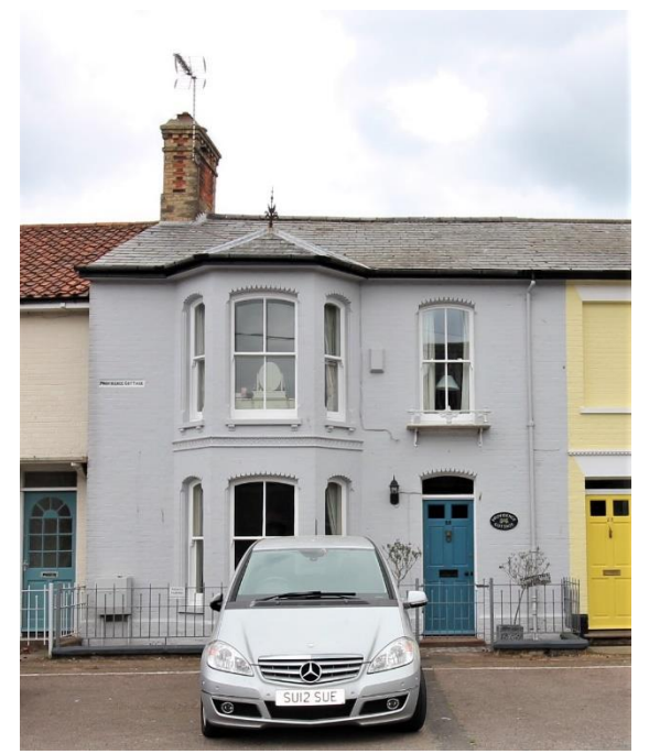
Providence Cottage, Cumberland Road

fenestration appears original. Welsh slate roofs largely replaced with red pan tiles. The Southwold and Son website intriguingly suggests that the three southern houses incorporate remains of a former flint faced fishing net manufactory and that the two southern houses were added c.1880. Traces of the earlier building can apparently be found within the fabric of the southern part of the terrace. No.17 was an academy for young ladies in the 1880s. Good boundary walls to front garden of cobble and brick to Nos.18 & 19. Southern return elevation to Cumberland Place gabled and rendered. Rendered rear elevation. Boundary walls to northern houses of rendered brick. Boarded fences and late twentieth century garages to rear.