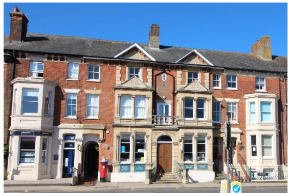
No.43, The Post Office and No.45 High Street

No.39 & Farleigh House, No.41 High Street (Positive Unlisted Buildings). Two very large houses which are shown on the 1904 1:2,500 Ordnance Survey map. Probably constructed with the northern section of the Post Office in 1895 and of the same design as Nos. 43 & 45. Three storeys over a high basement. Recessed porches with heavy moulded stone hoods to centre of façade supported on ornate carved corbels. These are approached via flights of steps with ornate stone balustrades. Canted bay windows with horned plate-glass sashes to either side of porches which rise from basement to first-floor level. Welsh slate roof with corbelled eaves cornice. No.41 has unfortunately had a number of its first-floor sashes unsympathetically replaced. Ornate cast iron railings and panelled stone gate piers to frontage.