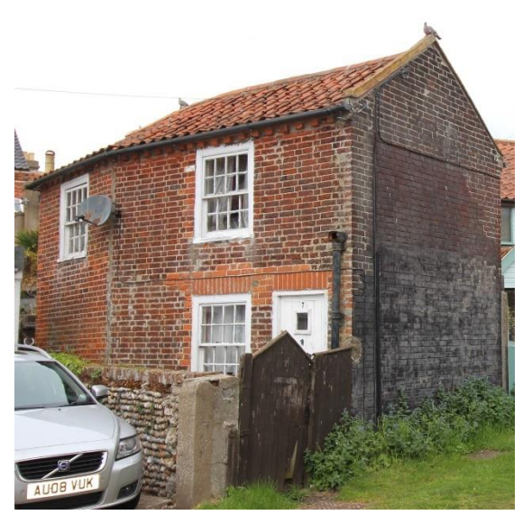
No.7 Pinkney's Lane

Cottage behind No.9 East Street & 5 Pinkney's Lane (Positive Unlisted Building). A small weatherboarded structure of probably nineteenth century date with a red pan tiled roof which is only visible from Pinkneys Lane but accessible via East Street. It appears to be shown on the 1884 1:2,500 Ordnance Survey map but has been significantly reduced in size. Partially rebuilt nineteenth century cobble boundary wall on eastern side.