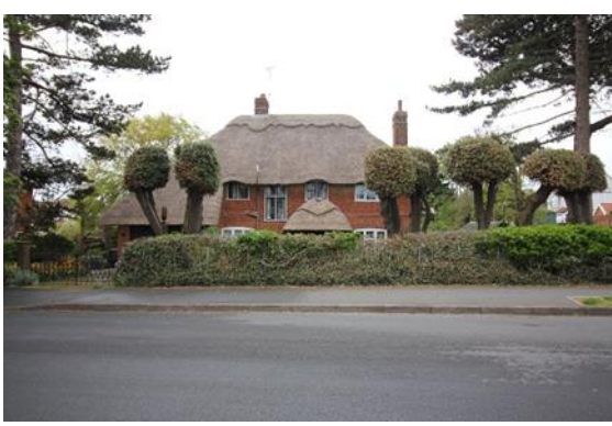
No.53 Pier Avenue

No.53 Pier Avenue (Positive Unlisted Building). A substantial and well-designed thatched roofed villa of c.1946 designed by the Norwich born architect Arthur Albert Hipperson (1877-1962) for Daisy Bywaters (drawings Suffolk Record Office 540/60/4/8). The house occupies a prominent corner plot at the junction of Pier Avenue and Marlborough Road. Built of red brick. Mullioned and transomed casement windows with leaded diamond panes, beneath shallow arched lintels. Thatched porch supported on heavy wooden piers, integral thatched garage at eastern end with what appears to be the original boarded and partially glazed garage doors. Tall red brick chimney stacks. Marlborough Road façade has substantial projecting central chimneystack flanked by diamond paned casements with central mullion. Nb both Daisy Bywaters (later Daisy Thomas) and the architect and his wife Edith are recorded as in residence in the same house in Dunwich Road Southwold in the 1939 voter registration lists.