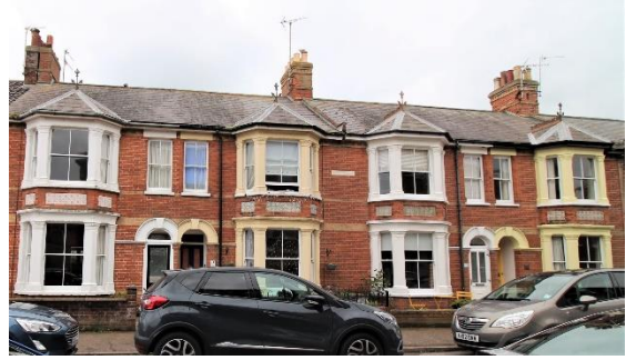
Nos. 6-12 (even) Dunwich Road

Dunwich Terrace, Nos.6-12 (even) Dunwich Road (Positive Unlisted Buildings). A terrace of four houses. Shown completed on a photograph taken on the 18<sup>th</sup> of October 1893 from the lighthouse which is preserved in Southwold Museum. Red brick with painted stone dressings. Two storey canted bays with pilasters and carved lintels and decorative tile insets between the floors. Welsh slate roof with finials above the canted bay windows. Horned plate-glass sashes. Paired arched recessed porches containing partially glazed panelled doors. The door to No.8 still retains stained and leaded glass panels. Some houses now with secondary door flush with the façade. Twentieth century dwarf red brick walls to Dunwich Road. Possibly by the same builder as No.16 Chester Road. John Miller Britain in Old Photographs: Southwold (Stroud 1999) p83.