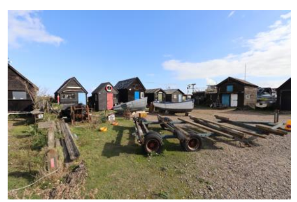
W13 to W21, Blackshore

W3 to W22, Blackshore (Positive Unlisted Buildings). A varied collection of closely grouped huts and stores connected with the fishing industry.