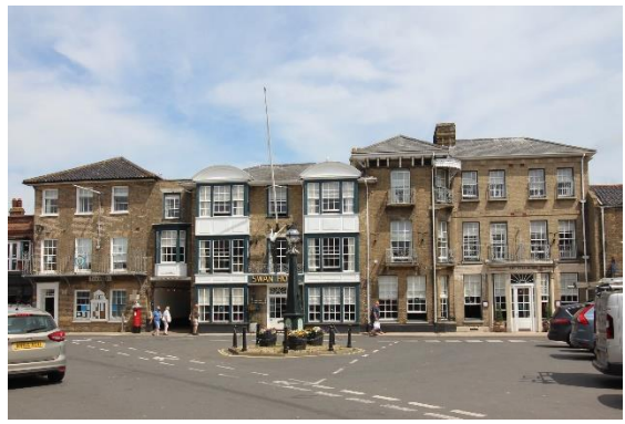
Swan Hotel, Market Place