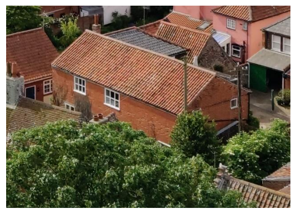
Former Barn to rear of Nos. 14-18 Victoria Street from church tower

Former Barn to the rear of Nos. 14-18 Victoria Street (Positive Unlisted Building). Two storey red brick former workshop building of probably mid nineteenth century date probably built for Carter's building contractors' business. Replacement casement windows.