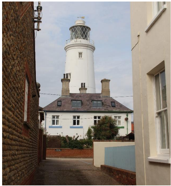
Former Lighthouse Accommodation Block from North Parade

Lighthouse Accommodation Block, Stradbroke Road (Positive Unlisted Building). Former accommodation block to lighthouse which was built c.1887-1892 by Trinity House. Its original design was by Sir James Douglass (1826-98) Chief Engineer to Trinity House. Originally designed as two cottages and shown as linked to the lighthouse on early Ordnance Survey maps. Painted brick with a hipped Welsh slate roof. The lighthouse was automated in 1938 and the cottages were no longer linked to the lighthouse by the time of the publication of the 1971 1:2,500 Ordnance Survey map. Twentieth century single storey additions to southern return elevation. Possibly a curtilage structure to the lighthouse and therefore afforded statutory protection.