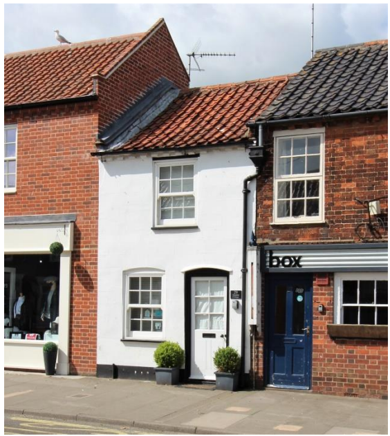
Thimble Cottage, No.29 High Street

No.27 High Street (Positive Unlisted Building). Early nineteenth century former shop forming part of the same structure as the Grade II listed No.25. Red brick with a black pan tiled roof. Photographic evidence suggests that it had lost its shop facia before 1948. Sash windows replaced by unsympathetic casements. Despite unsympathetic alteration No.27 makes an important contribution to the setting of the listed buildings to its immediate north.