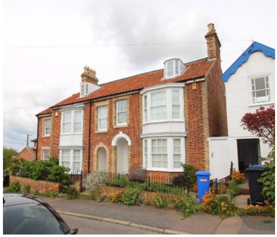
Staff Cottage, No.13 (right) and Clyde Cottage, No.15 (left), Constitution Hill

Iona Cottage No.11 and Iona Flat, No.11A Constitution Hill (Grade II)