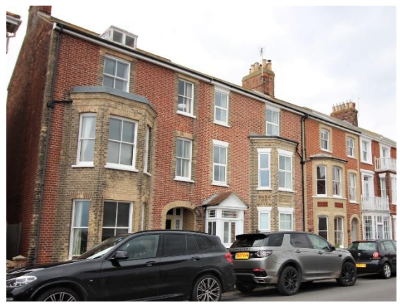
Nos.15-19 (Odd) Marlborough Road

Flats 1-3 Rochester House No.11, & No.13 Marlborough Road (Positive Unlisted Buildings). A pair of substantial three storey houses of c.1890 which were partially rebuilt after considerable bomb damage in 1943. The neighbouring buildings to the immediate south were destroyed in the same raid. Red brick with gault brick quoins and dressings and a red pan tile roof. Horned plate-glass sashes with margin lights to canted bays. Three storeys with two storey canted bay windows a narrow recessed central range. Glazed later twentieth century porch. Dwarf red brick boundary walls to Marlborough Road. Jenkins, А Barrett Reminiscences of Southwold During Two World Wars (Southwold, 1984) p67.