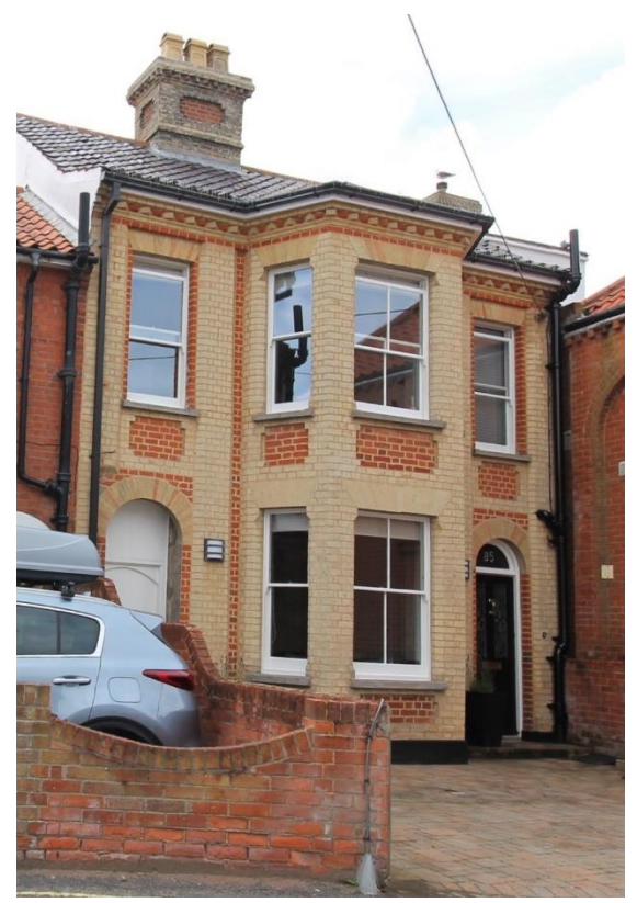
No.85 Victoria Street

No.85 Victoria Street (Positive Unlisted Building). A house of c.1890 faced in red brick with Suffolk white brick dressings. Central full height canted bay with horned plate-glass sashes flanked by arched door openings. The right-hand opening contains a partially glazed and panelled front door beneath a semi-circular plate-glass fanlight. That to the left is a passage entrance. Decorative chimneystack of red brick with Suffolk white brick dressings. Pan tiled roof.