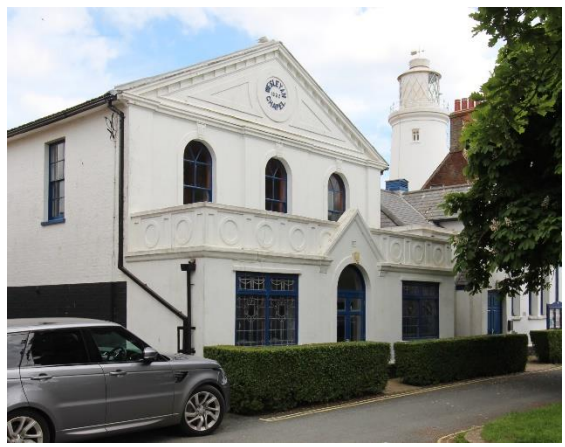
Methodist Chapel, East Green

wooden casement windows. Single storey with a pedimented central bay containing a large arched window divided by mullions and transoms. To the right a pair of casement windows with hood moulds, whilst to the left is a gabled porch containing a pair of panelled doors and a similar window. Miller, John Britain In Old Photographs, Southwold (Stroud, 1999) p101.