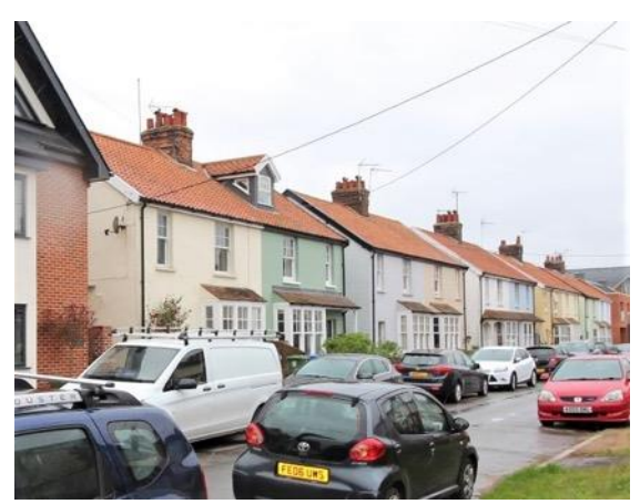
Nos.1-19 (Odd) North Road

Nos.1-19 (Odd) North Road (Positive Unlisted Buildings). Balanced composition of five well preserved pairs of semidetached houses which were constructed to a largely uniform design c.1928. Rendered brick with horned plate-glass sash windows and plain tile roofs to porches and bay windows. Principal roof slopes of red pan tiles. Bay windows with sashes divided by mullions to the ground floors. The central pair of houses have additional embellishments including continuous wooden porches which also provide a roof for the ground floor bay windows. Partially glazed front doors. Red brick ridge stack rising from the spine wall between each pair of houses. Dwarf red brick boundary walls to frontage.