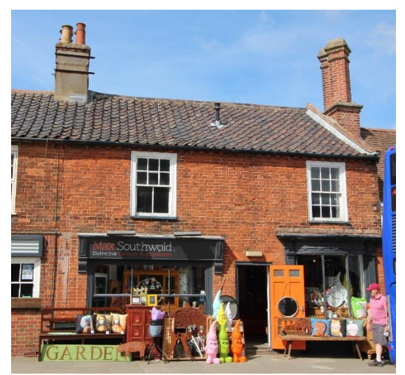
No.25 High Street

Former Kings Head Hotel, High Street (Grade II)