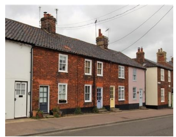
Nos.9-15 (Odd) High Street

rendered, No.9 remains the better preserved of the two and contributes positively to the setting of adjoining listed buildings. Twelve light hornless sashes and a partially glazed front door. The window and door openings to No.11 have been altered, but the red brick elevations make a positive contribution to the streetscape. Red brick ridge stack rising from party wall between the two cottages.