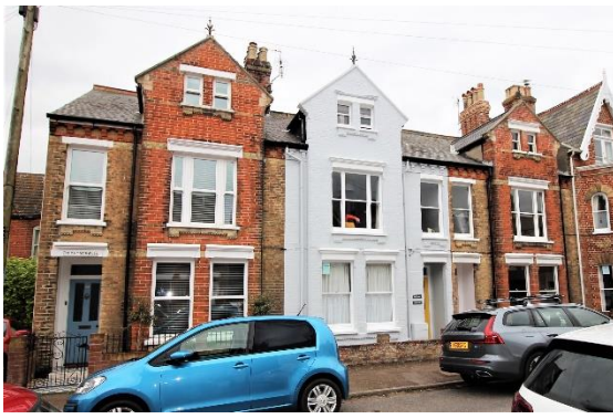
Nos.40-44 (even) Stradbroke Road

canted bay window and horned plate-glass sashes. Recessed porches with arched openings. High red brick boundary walls between properties