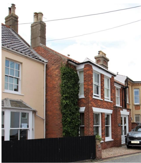
Suffolk Cottage, No.87 Victoria Street

Suffolk Cottage, No.87 Victoria Street (Positive Unlisted Building). Late nineteenth century villa of red brick with horned plate-glass sash windows beneath shared wedge-shaped lintels. Full height bay window. Partially glazed front door within projecting flat roofed porch with parapet. Arched doorway to passage at northern end with boarded door. Red pan tiled roof. Later twentieth century red brick garden wall to frontage recently removed.