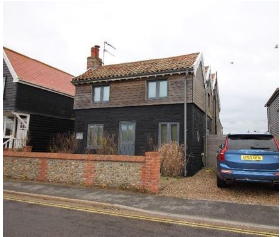
No.29 'Weathervane', Ferry Road

hipped roof and first floor of smaller footprint creating a pyramidal effect. Roof clad with felt shingles, with a central brick stack. Single storey projection to the north side. Unsympathetic replacement windows appear to be within the original openings. The house makes a significant contribution to the varied character of Ferry Road, and is one of the better preserved and more prominent structures.