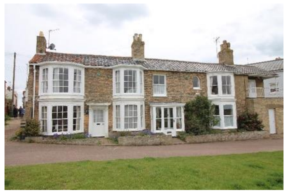
No. 24 (left) and No.26 (right), South Green

The Retreat No. 20 & Pin Cottage No.22, South Green (Grade II)