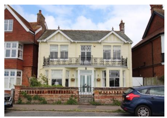
Forest Lodge, No.6 Godyll Road

Barnaby Lodge, Godyll Road (Positive Unlisted Building). A large detached villa, first shown on the 1904 Ordnance Survey map (1:2,500).Compositionally similar to No.1 and No.2 Godyll Road although differing in material use and detailing. Central entrance with balustraded balcony over, flanked by two storey square bay windows. The first floor carries out over the bays with a pair of tile hung gable ends. Regrettably the house has lost much of the joinery evident in historic photos, but the form and skill of the original design remains apparent.