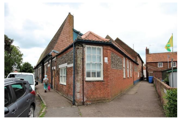
Former Maltings Complex from north

appears on Wake's 1839 map and the earliest surviving fabric may be of mid nineteenth century or earlier date. The introduction c.2007 of a stainless steel Huppman brewhouse within the old fermentation house required its walls to be raised in height. The Victoria Street frontage has a threestorey red pan tiled roof range of late nineteenth century date with a boarded winch turret projecting from its façade. Red brick with inserted horned sash windows of late twentieth century date. Return elevation to narrow passage. This range appears to have been preserved largely intact. Attached to the northern end of this structure is a single storey cobble and red brick office range with a red pan tiled roof. Horned sash windows. This range also appears to be reasonably well preserved. The other single storey ranges fronting East Green, and Victoria Street were of mid nineteenth century or earlier date but are now little more than façades. The Victoria Street façade is reasonably well preserved but has lost a large pair of boarded taking in doors. Original shallow pitched roof replaced by