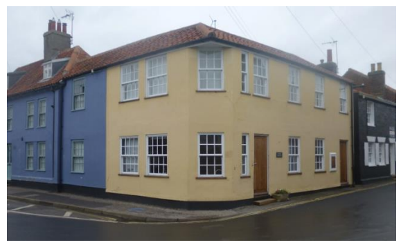
No.34 East Street

'Spindrift' No.30 & No.32 East Street (Grade II)