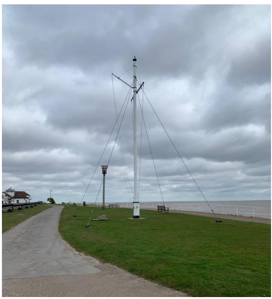
Timber mast, Gun Hill

Beacon basket, Gun Hill (Positive Unlisted Structure). Iron basket comprising vertical straps and horizontal hoops, flaring out towards the top. Without date or inscription but possibly erected to commemorate The Queen's Silver Jubilee in 1977.