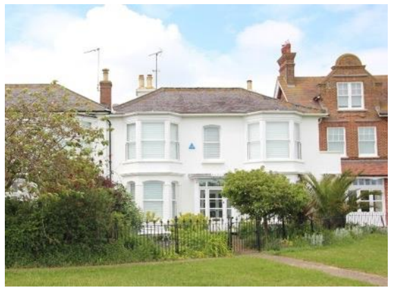
Old Mill, The Common

Mariners and Old Mill, The Common (Positive Unlisted Building). A pair of double fronted villas dating from the late nineteenth century, shown on historic photographs alongside the mill, prior to demolition of the mill in 1894. Both villas are rendered, covering the original white brick elevations, and both houses have had their single storey canted bays raised in height and replacing the tripartite sash window arrangement to the first floor. Hipped roof covered with Welsh slate. Both houses retain some of their original plate glass sash windows. Finialed railings enclosing the front gardens.