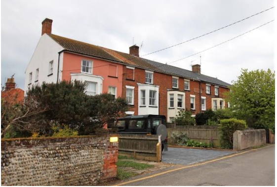
Cumberland Terrace, Nos.15-19 (cons) Cumberland Road

For the northern section of Cumberland Road see Seaside Corporation Character Area.