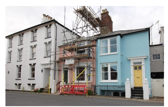
Nos.12 & 13 East Cliff

Barley Rise No.10 and Barley House, No.11 East Cliff (Positive Unlisted Buildings). A substantial pair of semi-detached houses of c.1840 now largely occupied as a hotel. Three storeys over a basement. Rendered red brick with a hipped Welsh slate roof and a ridge stack rising from the former spine wall between the two properties. The pilastered doorcase to the eastern house has been retained, but that to the west has been replaced with a small oculus. Hornless sashes with decorative margin lights, wedge shaped lintels with projecting fluted key stones. Barley Rise occupies part of the lower section of the former No.10 and has a front door in the western return elevation, and single storey rendered later additions with Welsh slate roofs.