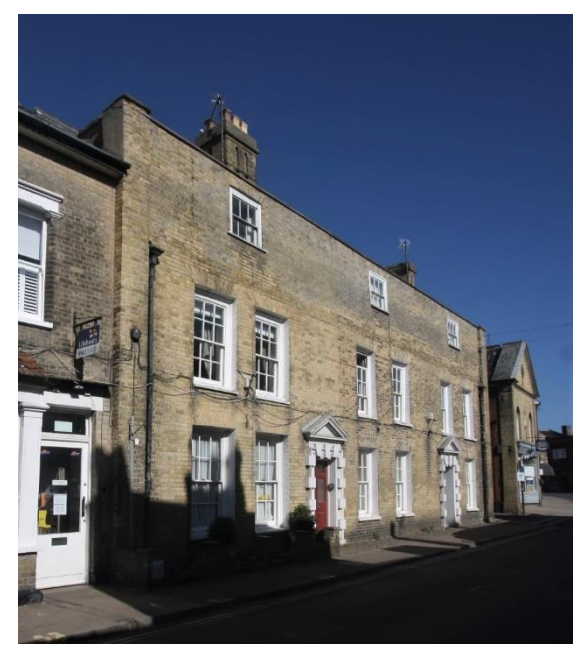
No.1 The Elms and No.3 Queen Street

No.1 The Elms and No.3 Queen Street (Grade II)