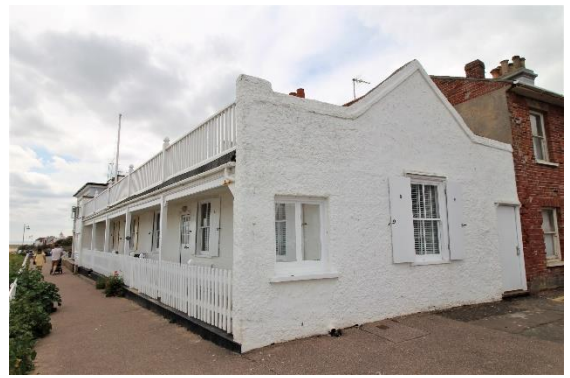
Nos.5 & 6 East Cliff