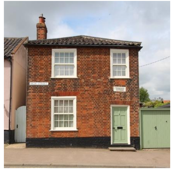
Ferndale Cottage, High Street

Ferndale Cottage, High Street (Grade II listed as No.7 and shown as Nos 3 & 7 on recent maps).