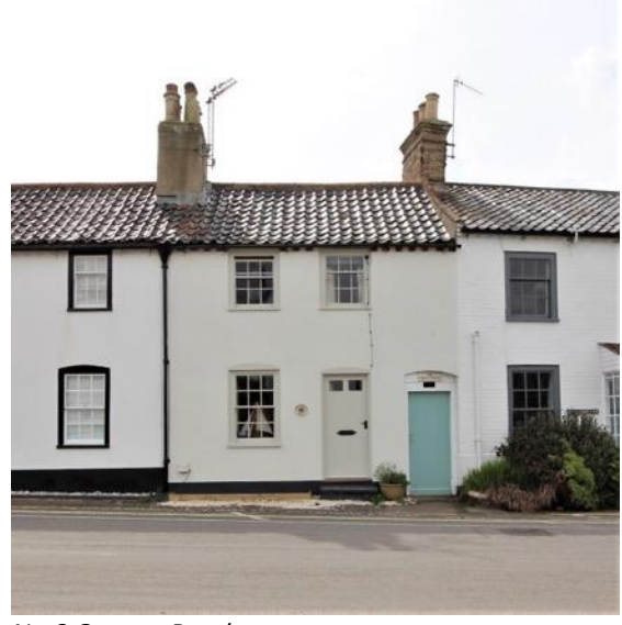
No.8 Queens Road

Tittle Mouse House, No.6 Queens Road (Grade II)