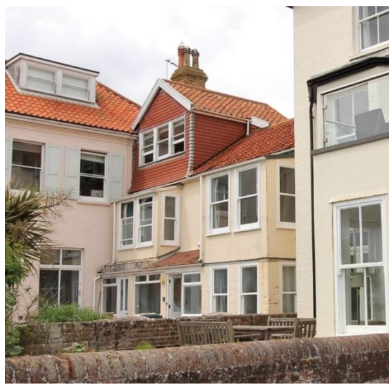
Seacroft, No.19 East Cliff

For the former No.18 East Cliff see No.21 St James Green with which it is now combined.