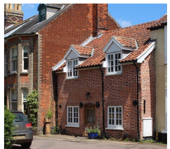
Oak Cottage, No.17 Bartholomew Green Oak Cottage, No.17 Bartholomew Green (Grade II)