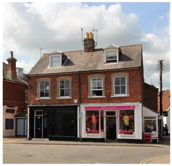
Nos.33 & 35 High Street

No.31 High Street (Positive Unlisted Building). Mid nineteenth century dwelling formerly known as Anchor Villa, extended to the rear 1960s and facaded c.2020. Its nineteenth century northern and eastern façades alone survive but these make a strong positive contribution to views along the High Street. Northern façade of three bays with a central door opening flanked by two full height canted bay windows. Panelled parapet and Welsh slate roof. Tall, rendered chimney stacks.