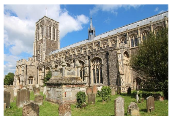
St Edmund's Church, Church Green

St Edmund's Church, Church Green (Grade I)