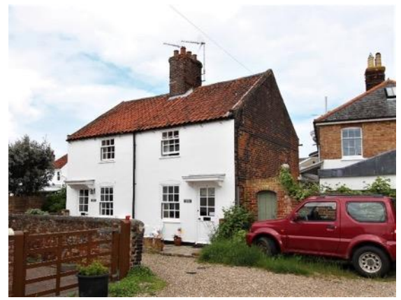
Weavers Cottage, No.5 (right) and Loom Cottage No.6 (left), Spinners Lane

Weavers Cottage and Loom Cottage, Spinners Lane (Positive Unlisted Buildings). Show as a single dwelling on the 1884 1:2,500 Ordnance Survey map, although this is possibly an error as the 1904 map of the same scale shows them as a pair. Mid to later nineteenth century, red brick which is now rendered to the entrance façade, with the south facing brickwork left exposed. Substantial brick stack rising from party wall between the cottages.