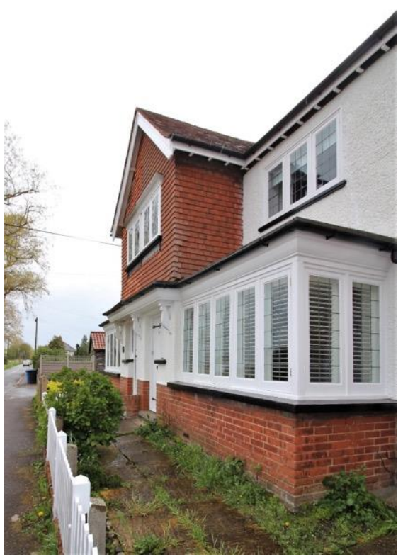
Nos.27 & 29 North Road

Nos.1-19 (Odd) North Road (Positive Unlisted Buildings). Balanced composition of five well preserved pairs of semidetached houses which were constructed to a largely uniform design c.1928. Rendered brick with horned plate-glass sash windows and plain tile roofs to porches and bay windows. Principal roof slopes of red pan tiles. Bay windows with sashes divided by mullions to the ground floors. The central pair of houses have additional embellishments including continuous wooden porches which also provide a roof for the ground floor bay windows. Partially glazed front doors. Red brick ridge stack rising from the spine wall between each pair of houses. Dwarf red brick boundary walls to frontage.