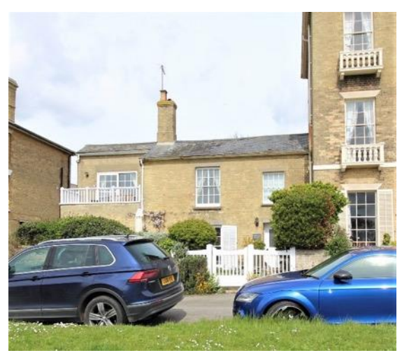
Cannon Lodge, South Green

Hill House and Woldside, No.27 South Green (Grade II)