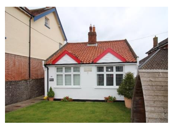
No.50 Hotson Road

No.50 Hotson Road (Positive Unlisted Building). One of three small cottages built in the town in the early 1920s for wounded returning First World War soldiers. Their construction was funded by public conscription. Single storey of rendered brick with a red pan tiled roof. Later wing to rear. Mullioned and transomed casement windows. Memorial plague between casement windows on Hotson Road façade bearing the legend 'To The Glory of God In Honour of Our Noble Dead Crusaders of St George Memorial Homes No.3. This Home was Erected and Given to the Totally Disabled Heroes of the Great War by the Loyal and Patriotic Citizens of Southwold.'