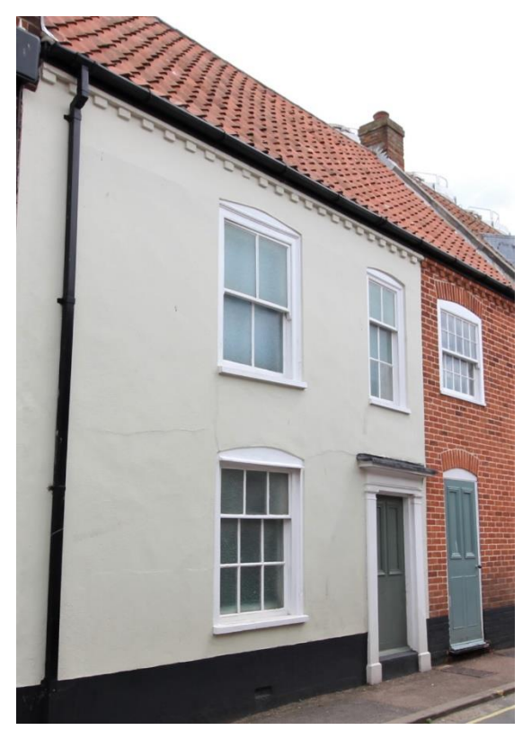
No.18 Church Street

Nos.2 & 4 Church Street (Positive Unlisted Building). A purpose-built former engineering works of 1896 constructed by James Powditch for William Powditch engineer and Whitesmith, now sympathetically converted to offices. Red brick with cast iron window frames. Two storey asymmetrical façade with arched red brick lintels and red brick sills. Boarded entrance doors and taking-in doors at first floor level.