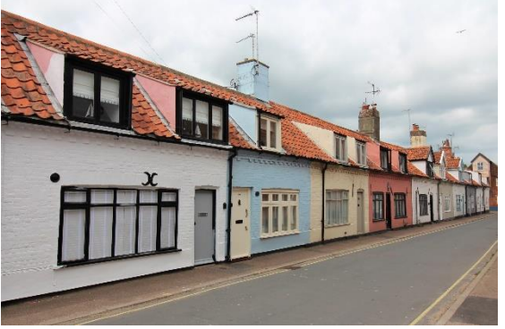
Nos.1-9 (odd) Church Street

Nos.40 & 42 Church Street (Positive Unlisted Buildings). A semidetached pair of red brick cottages with pan tile roofs probably of c.1800-1820 date. Sixteen light hornless sashes in moulded wooden frames. Wedge shaped lintels with pronounced key stones. No 40 with a six panelled door with glazed top lights. The door to No.42 boarded. Large late twentieth century addition to southern end of No.42. Northern return elevation of No.40 rebuilt following the demolition of the adjoining former Brickmakers Arms public house c.1984.