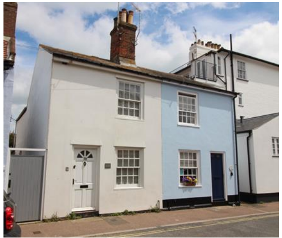
Nos.72 & 74 Victoria Street

Nos.72 & 74 Victoria Street (Positive Unlisted Buildings). A semi-detached pair of red brick cottages which were rendered in the early twenty first century. Welsh slate roof with substantial ridge stack rising from the spine wall between the two cottages. Hornless sixteen light sashes and panelled doors.