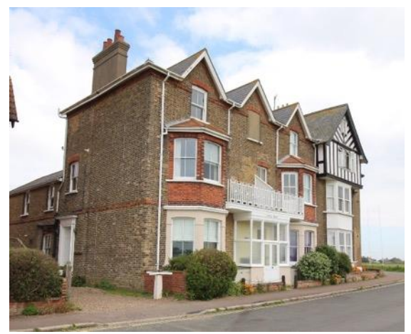
Sunset House, Godyll Road

Sunset House, Godyll Road (Positive Unlisted Building). A large villa, attached at its southern end, now flats. Shown on the 1904 1:2,500 Ordnance Survey map and likely built at the same time as the neighboring property (1897). A conservative design for this date. White brick with red brick lintels and band between the ground and first floor. Three full stories, with three attic gables, reflecting the appearance of neighboring property The Links. Below are plate glass sash windows, and a central blind opening (previously open). Two storey canted bay windows, painted stone to the ground floor and red brick above with pitched roofs covered with plain tiles. Between this is a balcony, now accessed from the bay windows, the central door shown on historic images having been removed and replaced by an off-centre sash window. Enclosed porch of later date.