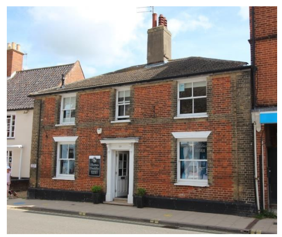
No.58 High Street

Sutherland House, No.56 High Street (Grade II*)