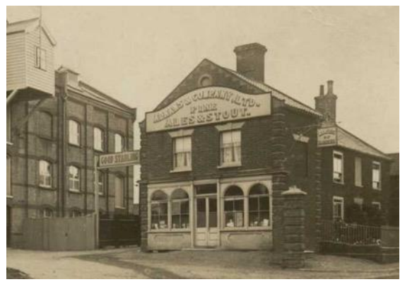
Postcard view of c.1910 showing No.2 High Street when operating as The Marquis of Lorne

Despite the loss of the central doorway on the Field Stile Road this elevation retains the windowed part of its public house frontage and the building remains a prominent and attractive landmark on the approach to the town centre from the north. Doorway inserted into northern end of High Street elevation in the later twentieth century. Nineteenth century dwarf red brick wall to High Street boundary which was formerly capped with railings.