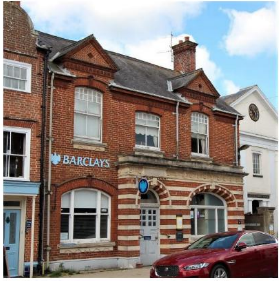
No.67 High Street

United Reformed Church, High Street (Grade II)