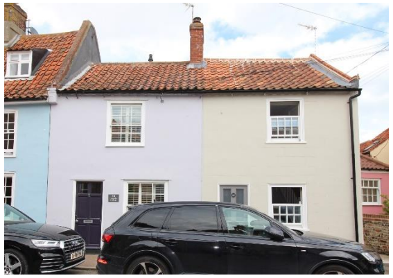
Nos.56 & 58 Victoria Street

Nos.42-54 (even), Victoria Street (Grade II)