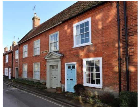
No.6 Bradwell House & No.8 Park Lane

to No.4 and smaller paned to No.2. Ground floor windows of tripartite arrangement under soldier course brick lintel is a later reworking. These cottages form part of a run of red brick cottages to the eastern end of Park Lane.