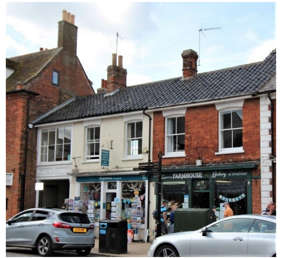
Nos.77 & 79 High Street

Nos.73 & 75 High Street (Positive Unlisted Buildings). A pair of mid-nineteenth century shops with living accommodation above which were originally built as dwellings. Red brick with painted stone dressings and a Welsh slate roof. Dentilled eaves cornice. Four-light plate-glass sashes set within heavy moulded frames. Pilastered doorcase to No.75 with panelled door. No.73 has the remains of a similar doorcase only the pilasters of which now appear to survive. Early twentieth century shop facias. Late nineteenth century photographs show that No.73 originally had a full height canted bay window which now only survives at first floor level. Jenkins, A Barrett, A Visit to Southwold, Containing Over 150 Photographs of Historic Interest (Southwold, 1984) p15.