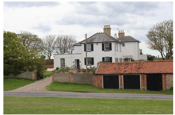
Gun Hill House, Gun Hill

Gun Hill House, Gun Hill (Positive Unlisted Building). Formerly the rear section of the adjoining villa known as Gun Hill Place, but physically separated from it by the villa's partial demolition in the 1950s. Gun Hill House, like Gun Hill Place, was originally built c.1807-1809, but it was radically remodelled and extended c.1900 probably for Charles and Charlotte Foster. A prominent landmark in views looking south and east on Constitution Hill. Painted Suffolk white brick with a hipped Welsh slate roof and overhanging eaves. Window joinery of unusual design consisting of sashes with a two paned plateglass lower section and a six paned upper section, horned and probably dating from c.1900. Shutters and shallow arched brick lintels. Single storey wing to the side, with expressed brick quoins to the open porch and garden room addition, designed by Paul Bradley, 2016.