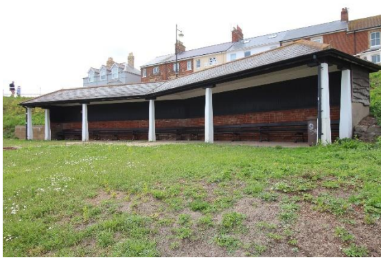
The Beach Shelter, North Parade

Shelter, North Parade (Positive Unlisted Building). Below North Parade, set into the cliff is a substantial open fronted red brick shelter of c.1920 set on a turfed platform. It has a hipped slate roof resting on wooden piers and its sides are clad in weatherboarding. This replaced an earlier, smaller, but far more elaborate hut of c.1900.