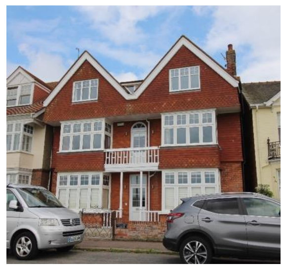
Barnaby Lodge, No.5 Godyll Road

Barnaby Lodge, Godyll Road (Positive Unlisted Building). A large detached villa, first shown on the 1904 Ordnance Survey map (1:2,500).Compositionally similar to No.1 and No.2 Godyll Road although differing in material use and detailing. Central entrance with balustraded balcony over, flanked by two storey square bay windows. The first floor carries out over the bays with a pair of tile hung gable ends. Regrettably the house has lost much of the joinery evident in historic photos, but the form and skill of the original design remains apparent.