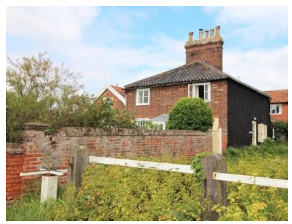
Spinners Cottage, west elevation and boundary wall, Spinners Lane

Spinners Cottage and boundary wall, Spinners Lane (Positive Unlisted Building). An early nineteenth century house, shown on the 1884 1:2,500 Ordnance Survey map as a pair of cottages, now a single house. Attractive black glazed pan tile pyramidal roof with sizeable red brick chimney stack.