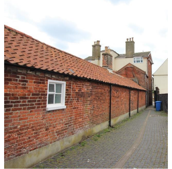
Rutland Cottage and the rear of Nos.80 & 80A High Street