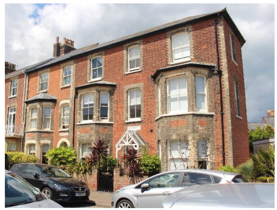
Nos.1 & 3 Dunwich Road

Wye Cottage No.1 & No.3 Dunwich Road (Positive Unlisted Buildings). A pair of substantial three storey houses with some similarities to Nos.4-10 (even) Chester Road and Nos.15-19 (Odd) Marlborough Road. Built sometime between the publication of the 1891 and 1904 Ordnance Survey maps. Red brick with elaborate gault brick dressings. Two storey canted bay windows retaining original plate-glass horned sashes. Front doors set within arched openings that to No.1 now with a late twentieth century glazed wooden porch. No.1 also has plate-glass sashes in its eastern return wall. This property is likely to have suffered bomb damage in World War Two as the neighbouring now demolished Marlborough Hotel was very badly damaged in 1943.