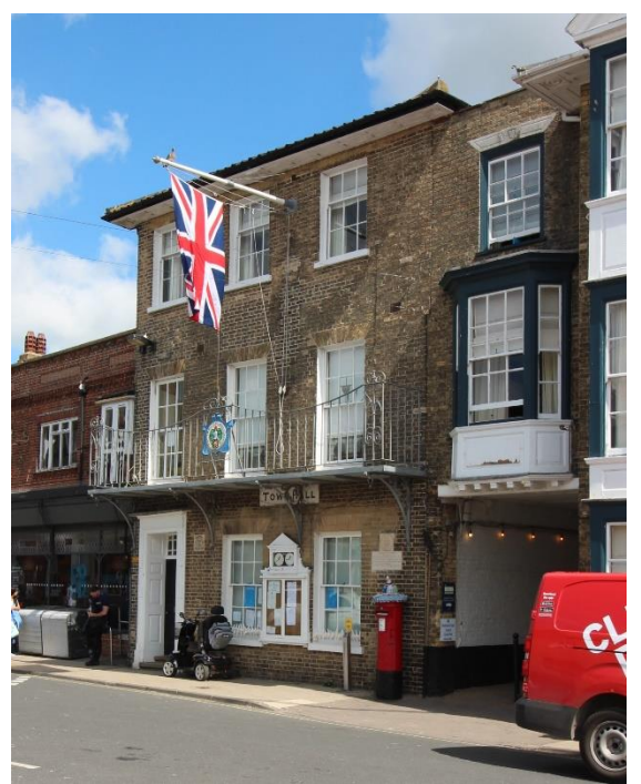
Town Hall, Market Place