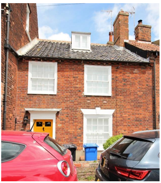
No.10 East Green

Parsley Cottage, No.8 & St Andrew Cottage No.9 East Green (Grade II)