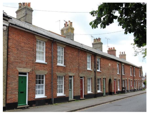
Victoria Buildings, Nos.13-29 (Odd), Victoria Street

century former gas light. Made by Child's Iron Foundry for the Southwold Gas Light Company.