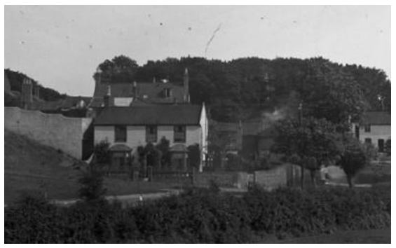
Historic view (undated) of Hill-side, Skilmans Hill

not original, and the porch is a later intervention, the house is an example of what can be achieved, and how unfortunate interventions can be improved upon.