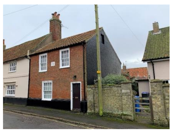
No.20 Park Lane