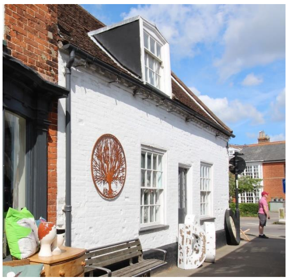
Former Kings Head Hotel, High Street

Former Kings Head Hotel, High Street (Grade II)