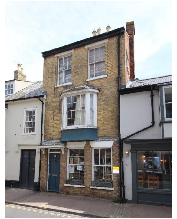
No.10 Queen Street