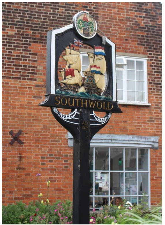
Town Sign, High Street

Nos.40A & 42 High Street (Positive Unlisted Buildings). House and Blacksmith's workshop dating from c.1800 converted to other uses in the 1930s. Built of red brick with rubbed red brick wedge-shaped lintels, but unfortunately now rendered. Hipped black glazed pan tile roof. Substantial central ridge chimneystack. No.42 the former house is little altered externally save for the loss of its twelve light hornless sashes. First floor of High Street facade to No.40A retains an original sash in a heavy moulded frame. The ground floor of this façade originally contained a similar window and no door. The northern return elevation of No.40A originally displayed its industrial use with a central taking-in door at first floor level and at ground floor level a central door flanked by twelvelight hornless sashes. Former cart shed range with frontage to Victoria Road now heavily altered.