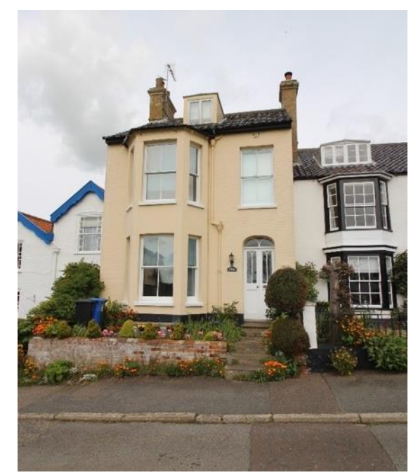
Holly Lodge, No.9 Constitution Hill

Rowan Cottage, Constitution Hill (Grade II)