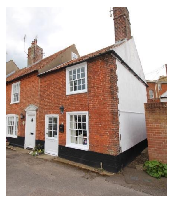
No.17 South Green