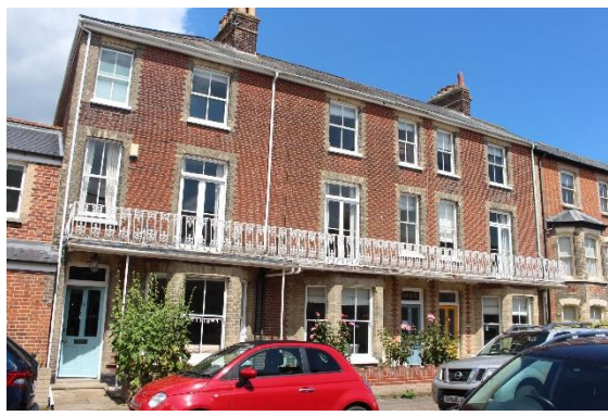
Nos. 5-9 (Odd), Dunwich Road

Wye Cottage No.1 & No.3 Dunwich Road (Positive Unlisted Buildings). A pair of substantial three storey houses with some similarities to Nos.4-10 (even) Chester Road and Nos.15-19 (Odd) Marlborough Road. Built sometime between the publication of the 1891 and 1904 Ordnance Survey maps. Red brick with elaborate gault brick dressings. Two storey canted bay windows retaining original plate-glass horned sashes. Front doors set within arched openings that to No.1 now with a late twentieth century glazed wooden porch. No.1 also has plate-glass sashes in its eastern return wall. This property is likely to have suffered bomb damage in World War Two as the neighbouring now demolished Marlborough Hotel was very badly damaged in 1943.