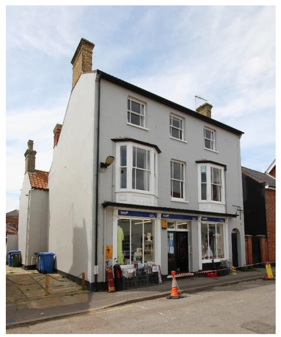
No.9 East Street

Mid to late nineteenth century red brick outbuildings buildings with chimney to rear probably constructed for Thompson and Sons whose builders' yard was here.