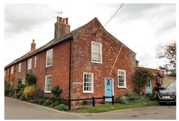
Park Lane Cottage, No.27 Park Lane

Park Lane Cottage West, Gardner Road (Grade II) See also: 27, Park Lane Cottage, Park Lane.