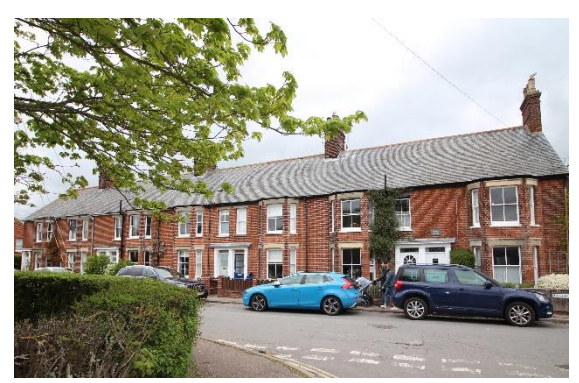
Blyth Terrace, Nos.17-23 (Cons) Field Stile Road

Nos.14-16 (cons) Field Stile Road (Positive Unlisted Buildings). Three houses, originally a semi-detached pair of c.1888, No.16 added c.2011. Red brick with elaborate Suffolk white brick dressings and plinth. Replaced, black pan tile roof. Partially glazed panelled doors beneath gabled wooden hoods resting on curved brackets. Horned plate-glass sashes. No. 16 has a substantial red brick addition of c.2000 to its rear which is visible from Foster Close and a flat-topped dormer in its rear roof slope. Dwarf Suffolk white brick boundary wall. The terrace plays an important role in the setting of the Grade I listed parish church which is located directly to its south.