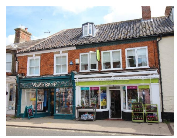
Nos.74 & 76 High Street

properties. Original plate-glass sashes survive. No.68 retains a probably original partly glazed panelled door set within an arched surround. Nos. 70 & 72 have been in retail use since at least the mid twentieth century.