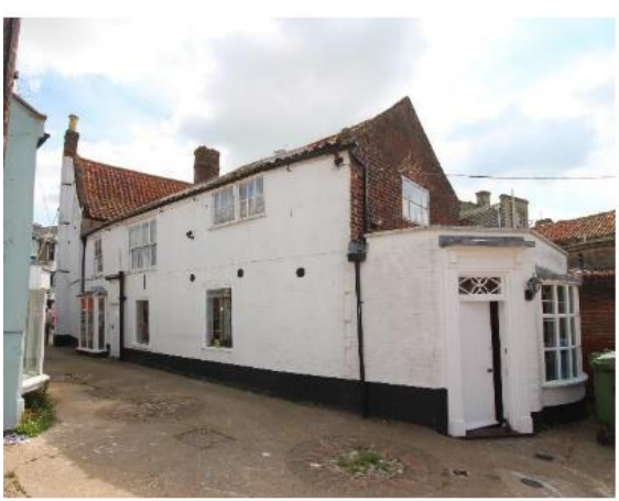
No.11 Market Place courtyard elevation