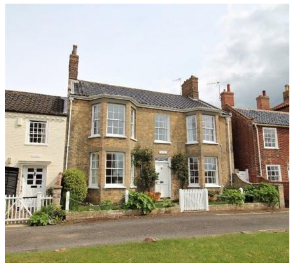
Wellesley Cottage, No.13 South Green

Dartmouth Cottage, No.11 South Green (Grade II)