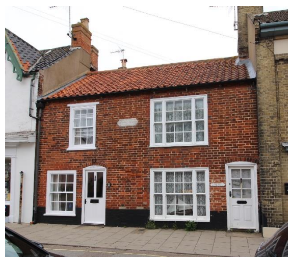
Horseshoe Cottage No.38 and Longshore, No.40 East Street

No.36 East Street incorporating the former Nos. 1 & 3 Trinity Street (Positive Unlisted Building). A prominently located mid nineteenth century shop of red brick with a black pan tiled roof. Decorative pierced bargeboards to gables now sadly lacking their spear finials. Twelve light hornless sashes to first floor windows. Casements to second floor. Ground floor retains late nineteenth century shop facia with splayed corner entrance flanked by pilasters.