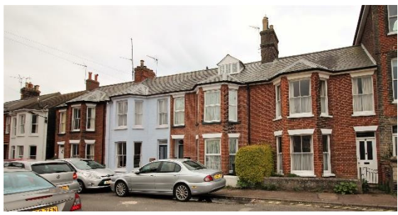
Nos.21-29 (odd) Stradbroke Road

1893 in the Southwold Museum collection. Red brick with Suffolk white brick dressings. Welsh slate roof with overhanging eaves. Four light horned plate-glass sashes to Dunwich Road elevation, some of those to Stradbroke Road replaced. Partially glazed front door with rectangular fanlight. Two storey rear range fronting Dunwich Road which is slightly set back. The rear elevation is also highly visible from Dunwich Road and has similar dressings.