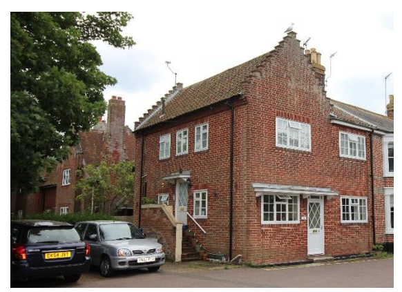
No.12 Bartholomew Green

Nos.9-12 (cons) Bartholomew Green (Positive Unlisted Buildings). Part of a well-designed Southwold Corporation development of the early 1950s which replaced property destroyed in World War Two. It overlooks the churchyard. Probably designed by Cautley and Barefoot of Ipswich and playing an important role within the setting of the Grade I listed parish church. Red brick houses with pan tile roofs designed in a restrained Tudorvernacular style, No.12 with crow-stepped gables. Small paned casement windows. Original partially glazed front doors survive beneath painted wooden bracketed hoods. Drawings by Cautley and Barefoot for housing at Bartholomew Green dating from between 1950 and 1953 survive in the Ipswich Branch of Suffolk Record Office but were not accessible at the time of survey (Ipswich Record Office HG400/2/468). See also Hope Cottages.