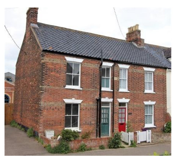
Nos.11 (right) and 13 (left), Station Road

Nos.3A to 9A, Station Road (Positive Unlisted Buildings). An early twentieth century terrace of houses, red brick, now painted. Originally the houses had recessed open porch entrances under stone half-round arches, with two storey canted bays. During the first quarter of the twentieth century shop fronts were introduced, until all canted bays were removed and the existing single storey square bays and entrances were built (probably during a program of works by the Town Council during the early 2000s). To the middle of the terrace is an opening leading to a commercial yard. Large attic dormers with shaped bargeboards. Blue glazed pan tile roof covering. The existing windows contribute to the gorup's character. The low brick walls and railings, seen on historic images, have long since been removed. The terrace is prominent in views looking south into the town and contributes to the structures grouped around Station Road, Pier Avenue and Blyth Road.