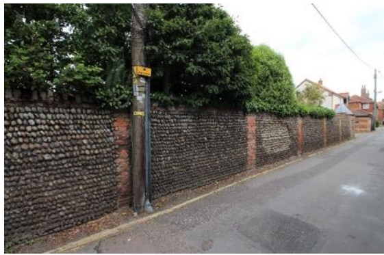
Boundary Wall to No.7 Mill Lane

The Old Chapel, No.5 Mill Lane (Grade II)