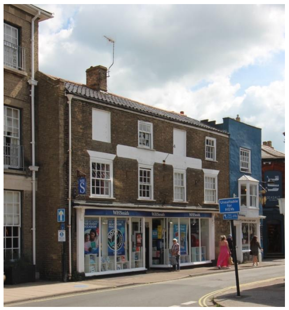
No.10 Market Place

century structure to rear of Swan Hotel, probably originally part of the hotel's stabling, it was converted into managers accommodation in the mid twentieth century and later housed Adnams board room. Altered and partially demolished c.2018 during works to convert it into a visitors' centre when zinc roofed range with glazed frontage also added. This addition replaces an unsympathetic mid twentieth century flat roofed structure. Lower left-hand section formerly garages or cart sheds. Black pan tiled roof. Four pane plate glass sashes beneath wedge-shaped lintels.