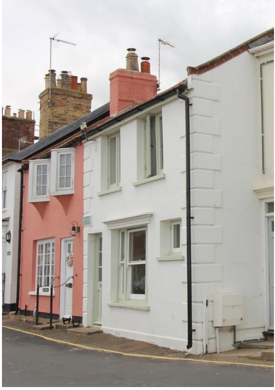
Nos.16 &.17 East Cliff

No.16, & John's Place No.17 East Cliff (Positive Unlisted Buildings). A pair of c.1800 cottages built of now rendered red brick. Originally both cottages had sixteen light sashes in heavily mounded