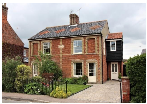
Victoria Cottages, Nos.24 & 25 Field Stile Road

rebuilt. The terrace plays an important role in the setting of the Grade I listed parish church which is located directly to its south.