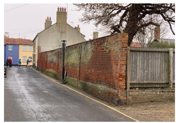
Red brick boundary wall, Pinkney's Lane

No.4 Pinkney's Lane (Positive Unlisted Building). This building appears to be a continuation of the size and form of the property to which it is attached at first floor level to the north, although it appears to be shown on the 1839 Robert Wake map. Two story, rendered, with gault brick stack to the south gable end. Black glazed pan tiled roof. The first floor has a single unhorned 8 over 8 pane sash window. Directly below is a door flanked by casement windows, probably dating from the mid 20<sup>th</sup> century. To the left is a three-centered arch leading to an alleyway and the rear of the property.