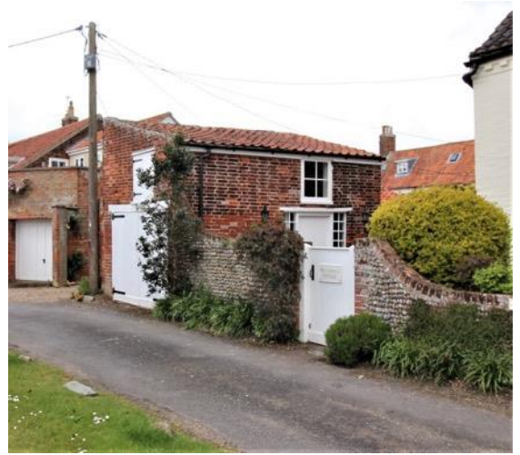
Outbuilding at Providence Cottage, No.15 South Green

Providence Cottage, No.15 South Green (Grade II)