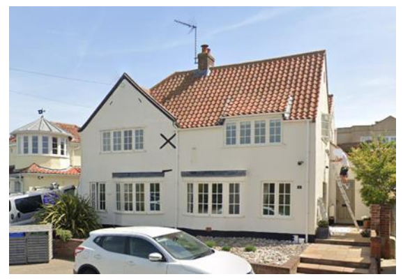
4 Ferry Road

4 Ferry Road (Positive Unlisted Building). Eighteenth century house that formed part of the salt works. Rendered timber frame or brick. Red pantile roof. First floor windows are 4-light casements and ground floor has 4-light canted bay casements in canted oriels and 2 smaller casement windows on either side.