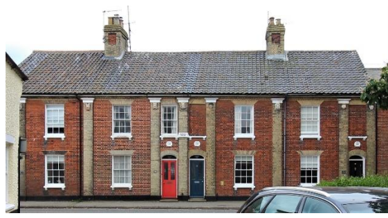
Nos.31-37 (Odd) Victoria Street

Victoria Buildings, Nos.13-29 (Odd), Victoria Street (Positive Unlisted Buildings). A well-preserved symmetrical terrace of nine cottages which probably date from the mid nineteenth century. Red brick with scoured wedge-shaped plaster lintels. Shallow pitched Welsh slate roof with overhanging eaves. Panelled doors beneath narrow rectangular fanlights. Central corbelled archway leading to rear yards with pronounced key stone. Hornless twelve light sashes. Substantial ridge stacks rising from the spine walls between the dwellings. The terrace contributes significantly to the setting of the Grade II listed Museum building to its immediate north and to that of the listed houses on Bartholomew Green opposite.