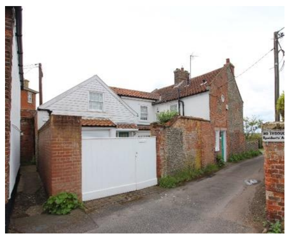
Skilmans Cottage, Skilmans Hill, north elevation

Skilmans Cottage, Skilmans Hill (Positive Unlisted Building). Red brick cottage, two storey, probably dating from the early 19<sup>th</sup> century. A pair of later two storey canted bays to the west elevation. Red clay pan tile roof with a pair of red brick stacks. The north return elevation displays the scars of various door and window alterations through an interesting mix of washed cobble and red brickwork.