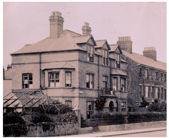
No.14 North Parade c.1910

evidence suggests replaces a small conservatory. Southern return elevation of two bays has a canted bay of two storeys which originally contained paired sashes with a central mullion but now contains a single plate-glass sash. Lean-to conservatory which is shown on early twentieth century photographs. Marlborough Road elevation has a twentieth century addition with a steeply pitched Welsh slate roof. Low painted brick wall to North Parade the southern section of which is capped with simple iron railings. Square section gate piers. High boundary wall to southern and Marlborough Road frontages also now painted. John Miller Britain in Old Photographs: Southwold (Stroud 1999) p83