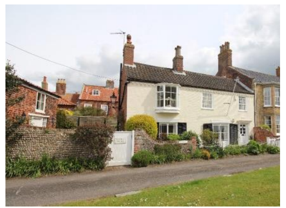
Providence Cottage, No. 15 South Green

Wellesley Cottage, No.13 South Green (Grade II)