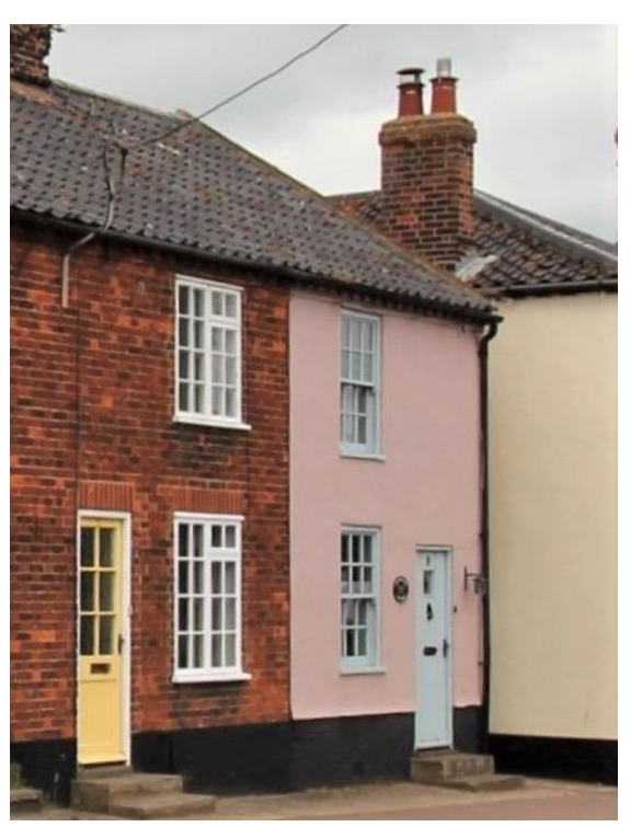
Christmas Cottage, No. 9 (right) and No.11 (left), High Street

Used form the 1930s until the 1980s as a coal merchants with coal yard to the side.