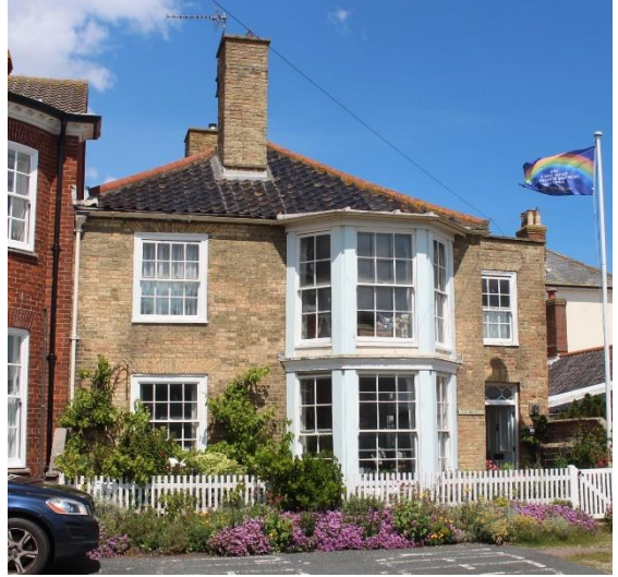
Beacon Cottage, St James Green

'Whitehall', No.26 & Guardship, Saint James' Green (Grade II)