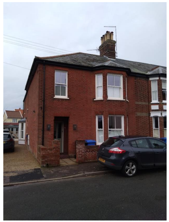
No. 9 Salisbury Road

paired recessed porches with decorative tile insets. Decorative eaves cornice. Partially glazed front doors of various designs all of which appear to be of later twentieth century date. Horned plate-glass sashes. Tall red brick ridge stacks with a decorative cap. Rebuilt dwarf red brick boundary walls to Salisbury Road. Of very similar design to Nos.31 & 33 & Nos. 58-80 Stradbroke Road.