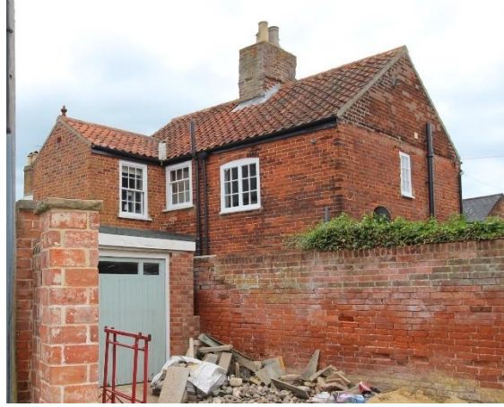
Nos.1 & 2 Youngs Yard from Bank Alley

Nos. 1 & 2 Youngs Yard (Positive Unlisted Buildings). Pair of nineteenth century red brick cottages which are shown on the 1884 1:2,500 Ordnance Survey map. Original openings with plaster faced wedge shaped lintels to ground floor preserved but sash windows and panelled doors replaced. Inserted window above entrance door to No.2. Small later gabled addition to rear of No.1 of red brick with a red pan tiled roof. Rear elevation visible from Bank Alley has largely sash windows but No.2 has an apparently original small pane casement beneath a shallow arched red brick lintel.