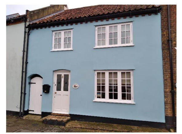
No.2 North Green

date. The relationship of the door and blind opening to the side wall is unusually close and it appears the house was to have been one half of a pair, although map evidence suggests this was never completed.