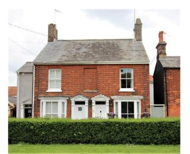
Nos. 5 & 6 Bartholomew Green