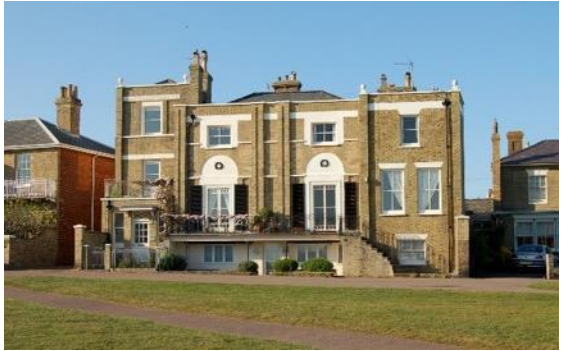
Nos. 10A-10D South Green