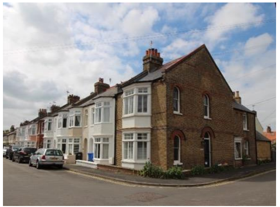
Nos.1-10 (cons), Wymering Road

structure, built c.1922. Plain principal elevation facing Wymering Road, with an unbroken red clay pan tile roof, and broad ground floor openings under flat gauged brick arches. The western end is more spirited where it turns the corner onto Blackmill Road and the accommodation becomes storey and a half, with a pair of dormer windows facing west. Prominent asymmetrical gable end facing Wymering Road. Windows are all replacement units. Forms an important part of the former school complex.