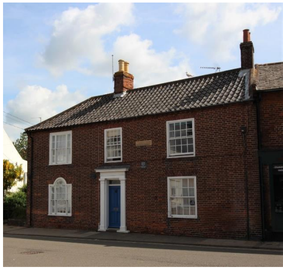
Montague House, No.36 High Street

No.32 High Street (Positive Unlisted Building). Former cottage of a single storey and attics which is probably of eighteenth-century date, now a chip shop. Rendered brick with a black pan tiled roof and overhanging eaves. Unsympathetic twentieth century display window and partially glazed front door. Single storey lean to section to rear also with pan tiled roof.