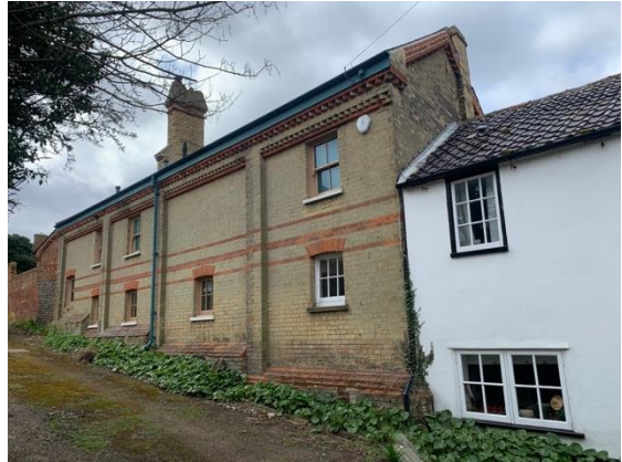
Garden Lodge and Mole End, Queens Road

Garden Lodge and Mole End, Queens Road (Positive Unlisted Building). Northern range of former stable block to Southwold House, remodelled c.2017. Originally containing groom's accommodation on the first floor. The principal interest of this range is the attractive gault brick north east elevation with contrasting red brick horizontal banding and lintels.