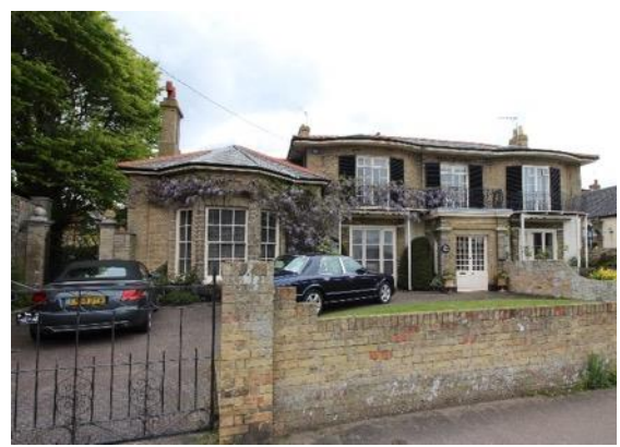
May Place and May Place Cottage, South Green

May Place & May Place Cottage, South Green (Grade II)