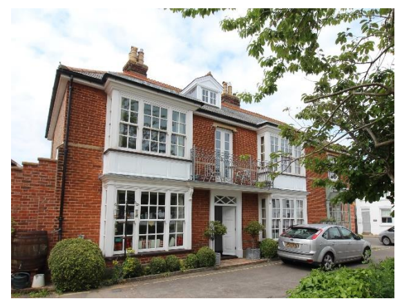
Vulcan House, No.1 Barnaby Green

Vulcan House, No.1 Barnaby Green (Positive Unlisted Building). Early twentieth century house and former bakers' shop, now house and office. Later twentieth century embellishments designed by John Bennett. Not shown on the 1904 1:2,500 Ordnance Survey map but probably dating from pre--1914. House and shop shown as a single unit on the 1927 Ordnance Survey map. Faced in red brick, beneath a hipped Welsh slate roof with overhanging eaves. A single gabled dormer in its southern with small pane casement windows.