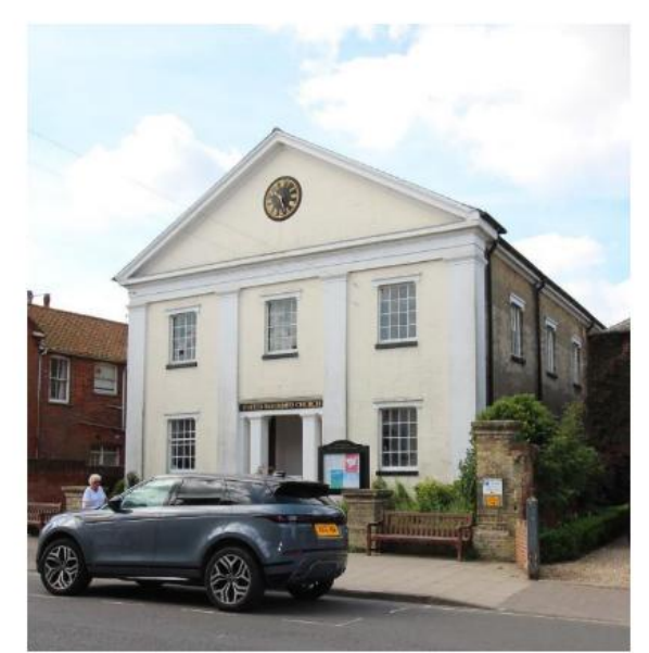
United Reformed Church, High Street

The Manor House, Nos.65-67 (odd), High Street including gate and forecourt walls (Grade II*)