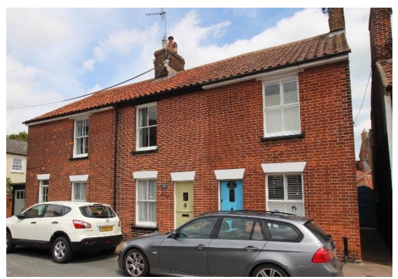
Palm Cottage, No.34 & 34A Victoria Street

Palm Cottage, No.34 & Albert Cottage, No.34A Victoria Street (Positive Unlisted Buildings) A red brick terrace of three cottages whichprobably date from c.1880. Palm Cottage and No.34 retaining their original horned plate-glass sashes. Wedge shaped plaster lintels. Red pan tiled roof. Ridge stack rising from spine wall between Palm Cottage and No.34 and second stack to gable of No.34A. Twentieth century front doors.