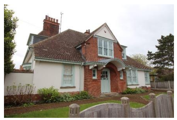
No.51 Pier Avenue

No.51 Pier Avenue (Positive Unlisted Building). A well preserved substantial detached arts and crafts house of c.1912 designed by Allan Ovenden Collard (1861-1928) which occupies a prominent corner plot on the corner of Pier Avenue and Marlborough Road. The house which was designed for C Fleetwood Pritchard of Hampstead was illustrated in The Studio after completion, in 1914. Of one and a half storeys with hipped plain tile roof and central gabled breakfront of two storeys. Largely rendered except for gabled breakfront which is faced in red brick. The breakfront contains a probably original partially glazed front door beneath a projecting semi-circular hood supported on moulded brackets. Original small pane sash windows to left and right. The flattopped dormers within the roof appear on the drawings illustrated in The Studio in 1914.