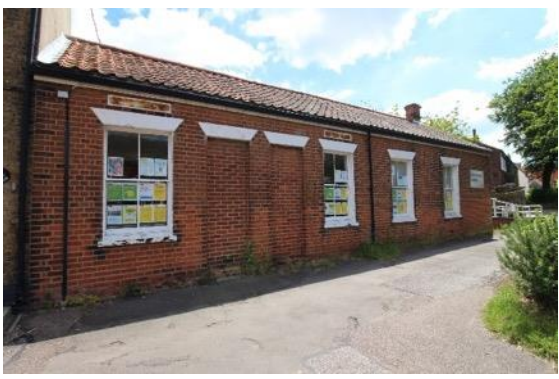
Southwold Library, North Green

Well Cottage, No.3 & Olivers, No.4, North Green (Positive Unlisted Buildings). Pair of relatively unaltered white brick semi-detached cottages, probably of mid nineteenth century date. Plate glass horned sashes beneath decorative plaster faced wedge-shaped lintels, which contribute much to the buildings' character. No.3 has late twentieth century glazed door, which is visually jarring, while the door to No.4 partially glazed with panels beneath. Welsh slate roof with substantial brick stack rising from party wall between the cottages.