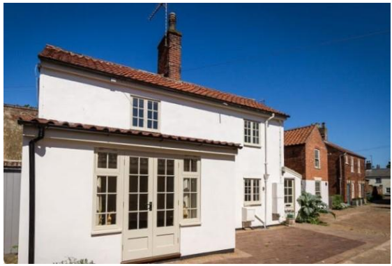
Lavender Cottage, Youngs Yard

cottages. Welsh slate roof. Later twentieth century additions to rear. Northern gabled return elevation visible from Bank Alley, largely blind with one late twentieth century casement at ground floor level.