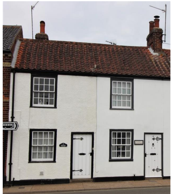
Nos.12 & 14 High Street

Carroway Cottage, No.4 and Nos.6-10 (even) High Street (Positive Unlisted Buildings). Terrace of four small houses completed in 1881. Central passage access to rear gardens with a mirrored semidetached pair of dwellings to either side one projecting over the central passage. Faced in red brick with white brick dressings. Black pan tiled roof with ridge stacks rising from the spine walls between the cottages. Horned plate-glass sash windows occasionally survive although a number of the houses have unsympathetic late twentieth century replacements. Plaster wedge-shaped lintels with projecting central key stones. Stone sills resting on decorative corbels. Carroway Cottage No.4 now sadly painted harming the unity of the terrace's design. Nb in the late nineteenth century this part of High Street was part of Station Road hence the name of the houses 'Station Road Villas'.