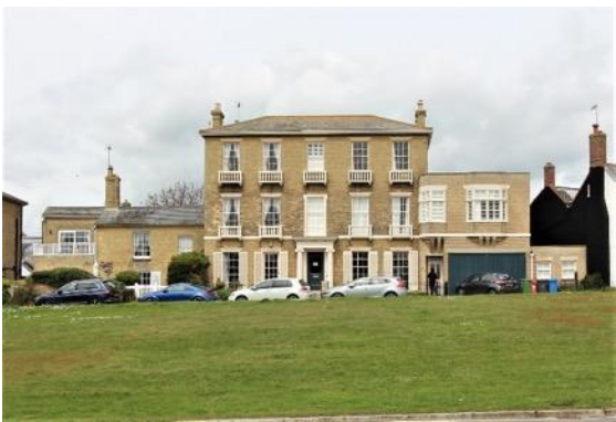
Hill House and Woldside, No.27 South Green