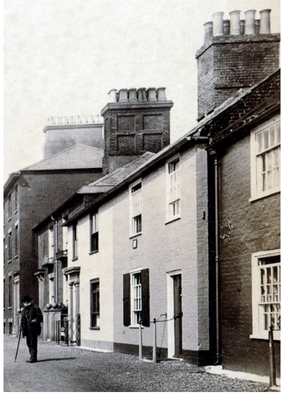
No.14 & 15 East Cliff c.1880

Bay View, No.14 & East Cliff, No.15 East Cliff