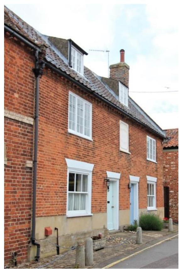
Nos. 1 & 2 Rosemary Cottages, Mill Lane