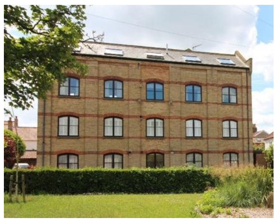
St Edmunds Court, North Green elevation

factory c.1921, converted to flats in the late twentieth century. Suffolk white brick with red brick dressings and a Welsh slate roof. Central ground floor doorway on Field Stile Road elevation and taking in door at first floor level now removed along with timber clad projecting winch houses. A prominent landmark on the approach to the town from the north former part of a notable group with other listed and non-listed structures fronting onto North Green. The structure is a reflection of Southwold's former economic history.