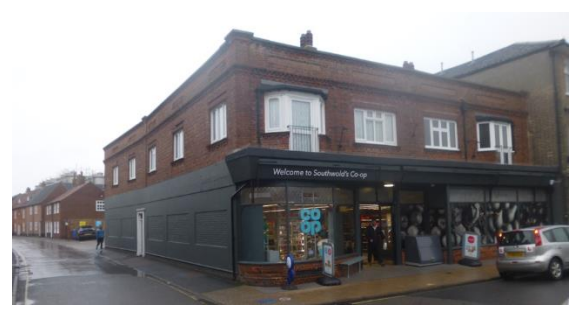
Co-operative shop, No. 2 Market Place

Co-operative shop, No. 2 Market Place (Positive Unlisted Building). Constructed around 1928 and was formed of residential first floor use above a large ground floor shop, all in brick. The ground floor shop frontage projects to allow a first-floor balcony to be formed, although the balcony arrangement is now missing. The building is austere in character with curious throwback references to 18th century architecture such as toothed eaves, panelled parapet and what had been windows with leaded lights. The original shopfront wrapped around the building and along Church Street, although the flank shopfront has now been lost. Part of the original shopfront appears to survive - just. Undoubtedly, the reduced shopfront, replacement first floor fenestration and loss of balcony have all reduced the architectural interest of this building. However, it retains a presence in the town centre and its use as a local shop is very important for the vitality of the town centre. This use contributes importantly to the character of the Conservation Area in this part of it; and the overall scale, presence and some surviving detail of the building, can be judged to make a positive contribution to the overall character and appearance of the Conservation Area.