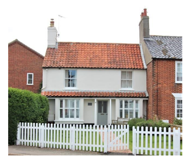
No.19 Barnaby Green

No.19 Barnaby Green (Positive unlisted building) A rendered brick cottage of possibly early to midnineteenth century date with a red pan tile roof. Central, partially glazed and panelled front door, flanked by bay windows with mullions dividing the sashes which are capped by a continuous pan tile roof forming a porch. Four light plate-glass sash windows above. No.19 Barnaby Green suffered considerable blast damage on the 12th of May 1941, a cottage which was attached to its southern return elevation being destroyed. Jenkins, A Barrett Reminiscences of Southwold During Two World Wars (Southwold, 1984) p55-56.