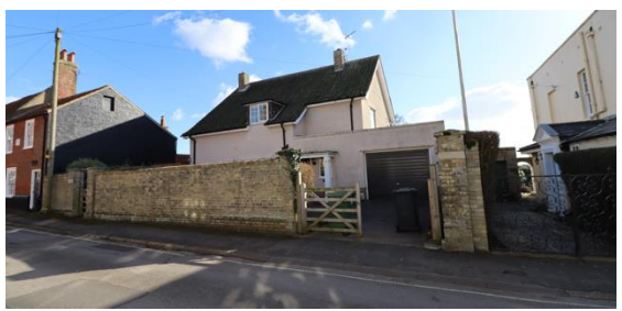
Boundary Wall to The Coach House, Park Lane

Boundary Wall to The Coach House, Park Lane (Positive Unlisted Structure). Gault brick, dating from the second quarter of the 19<sup>th</sup> century and enclosing the courtyard of the demolished coach house to Park Villa. Canted brick to the base plinth, with angled capping bricks. Square piers with stone caps, although the opening positions have changed and been widened over the years. The wall, although altered, is important for the continuation it provides of the established building line either side.