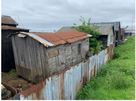
North east elevation of former railway carriage, hut W18