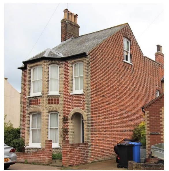
No.10 Salisbury Road

Nos.2 & 4 Salisbury Road (Positive Unlisted Buildings). A semi-detached pair of houses probably dating from the mid-1890s. Red brick with a Welsh slate roof. Tall red brick ridge stacks. No.2 retaining its original horned plate-glass sashes. Original panelled door with rectangular fanlight above. No.4 painted and with unsympathetic replacement windows and door within original openings. Low red brick boundary wall to Salisbury Road which appears to have been rebuilt.