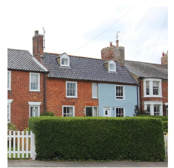
Nos.15 & 16 Barnaby Green

Nos.13 & 14 Barnaby Green (Positive Unlisted Buildings). A pair of houses which probably date from the 1880s and are similar in design to Nos. 8 & 9 Field Stile Road. Faced in red brick with elaborate Suffolk white brick and painted stone dressings. Welsh slate roof to frontage with ridge stacks rising from gables. Suffolk white brick dentilled eaves cornice. Canted bay windows containing horned plate-glass sashes between pilasters. Central front doors beneath shared painted stone lintel with rectangular fanlights. The doors themselves partially glazed. Northern return elevation to Spinners Lane blind. Rear elevation highly visible from Spinners Lane of red brick with a red pan tile roof and small pane sashes. Lower outshots with casement windows. Mid twentieth century front garden wall to north fronting Spinners Lane. Possibly nineteenth century cobble wall with brick dressings to rear. Nos.13 & 14 make an important contribution to the setting of adjoining listed buildings.