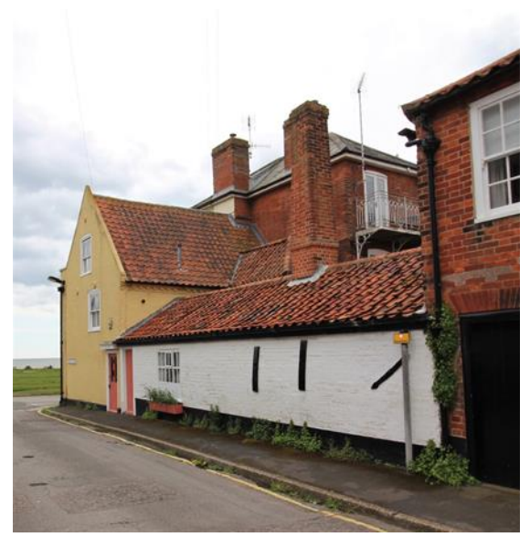
No.7 South Green, Park Road elevation