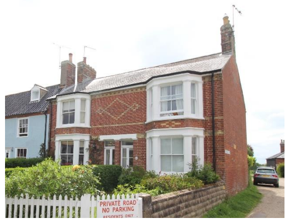
Nos.13 & 14 Barnaby Green

Southern facade has two large bay windows divided into three sections by mullions with small pane sashes set between. Between them a doorway with a moulded frame and decorative rectangular fanlight. Panelled front door set within recessed porch. Decorative iron balcony above with French doors. Former shop to east on corner of High Street with what appears to be original shop front preserved but windows now divided into small panes. Splayed corner. Horned small-pane sashes above beneath stone lintels. Late twentieth century octagonal cupola with ball finial to north-eastern corner. Small pane casement windows. Late twentieth century interventions to rear elevation. Late twentieth century stepped red brick boundary wall to west screening courtyard with further recent additions behind.