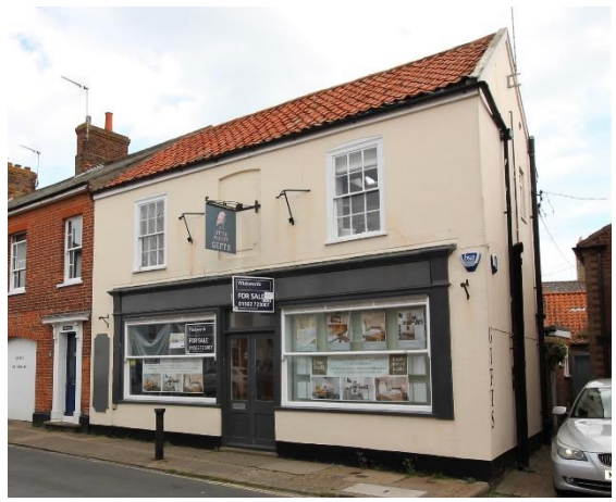
No.9 Trinity Street

Nelson House, No.5 Trinity Street (Positive Unlisted Building). Red brick dwelling dated on its façade to 1876, the datestone also baring the initials W.F.L. This may however relate to alterations rather than the original date of construction. Dentilled brick eaves cornice. Originally a shop and dwelling and with a shallow arched brick lintel for a large opening located above where the present door and adjacent window are located. First floor window openings with wedge-shaped rubbed brick lintels. The ground floor windows are probably all relatively recent interventions replacing a shop facia. Small pane sashes to first floor with horned plate-glass sashes to ground floor. Late twentieth century rear addition.