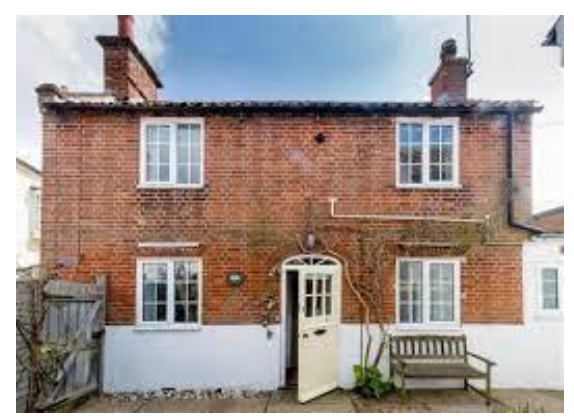
Thimble Cottage, Mill Lane

Nos.4-10 Mill Lane (Positive Unlisted Buildings). A row of four early nineteenth century cottages. Painted brick elevations with red clay pan tile roof covering. Ground floor door and casement windows under brick arch lintels, first floor casement windows tight to underside of the projecting dentil eaves course of brickwork. No.4 and No.10 have single storey side additions with a catslide roof over. The weatherboarded addition to No.4, and the flat roofed addition to No.10, are not of special interest. This row of cottages, along with No.2 Mill Lane, make a strong and positive contribution to the streetscape and character of the lane.