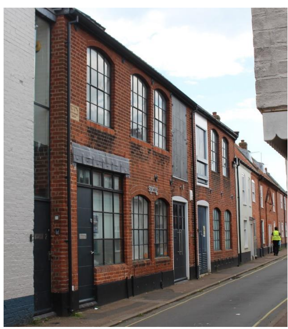
Nos.2 & 4 Church Street

Nos.2 & 4 Church Street (Positive Unlisted Building). A purpose-built former engineering works of 1896 constructed by James Powditch for William Powditch engineer and Whitesmith, now sympathetically converted to offices. Red brick with cast iron window frames. Two storey asymmetrical façade with arched red brick lintels and red brick sills. Boarded entrance doors and taking-in doors at first floor level.