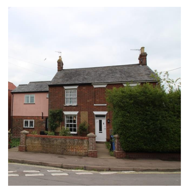
No.10A Field Stile Road

No.10A Field Stile Road (Positive Unlisted Building). Former farmhouse of c.1800 associated with the Town Farm whose lands were sold by the Corporation for development in 1899. At the time of the 1881 census the farm was comprised of 46 acres. Its farm buildings disappeared gradually during the opening decades of the twentieth century. Of red brick with a Welsh slate roof. Symmetrical three bay two storey principal façade with a blind decorative recess in the form of a window opening above the central front door. Twentieth century partially glazed front door with rectangular fanlight. Twelve light hornless sashes below plaster faced wedge shaped lintels. The house plays an important role in the setting of the Grade I listed parish church which is located directly to its south. Good twentieth century dwarf red brick walls to frontage. The attached later twentieth century property to the north does not contribute positively to the conservation area.