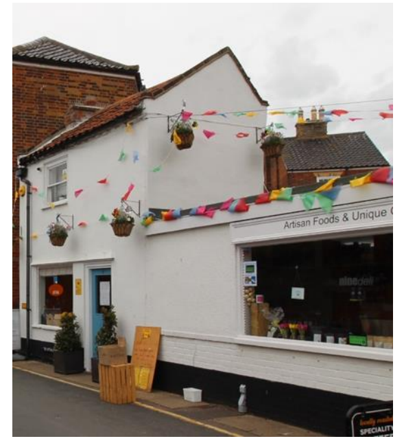
No.9 Pinkney's Lane

No.7 Pinkney's Lane and boundary wall (Positive Unlisted Building). A c.1800 red brick cottage with a red pan tile roof set within a small courtyard on the western side of Pinkneys Lane. A 1949 air photograph shows this as a pair of cottages with a second doorway in the blind left-hand section of the facade. (National Monuments Record EAW024298) Dentilled red brick eaves cornice and twelve light sashes. Lintel to ground floor window and front door appear to have been replaced. Twentieth century boarded front door. Brick capped cobble garden wall.