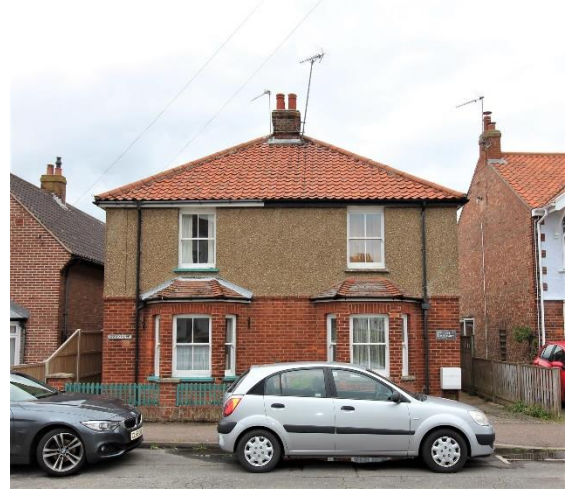
Good Hope and Coniston, Field Stile Road

Good Hope and Coniston, Field Stile Road (Positive Unlisted Buildings). A semi-detached pair of cottages which were built to a highly conservative design in the late 1920s (the site appears undeveloped on the 1927 1:2,500 Ordnance Survey map). Red brick with pebbledashed first floor and a red pan tile roof. Central ridge stack rising from spine wall. Four light plate-glass horned sashes retained. Arched doorways set within otherwise largely blind return elevations. Possibly early public housing.