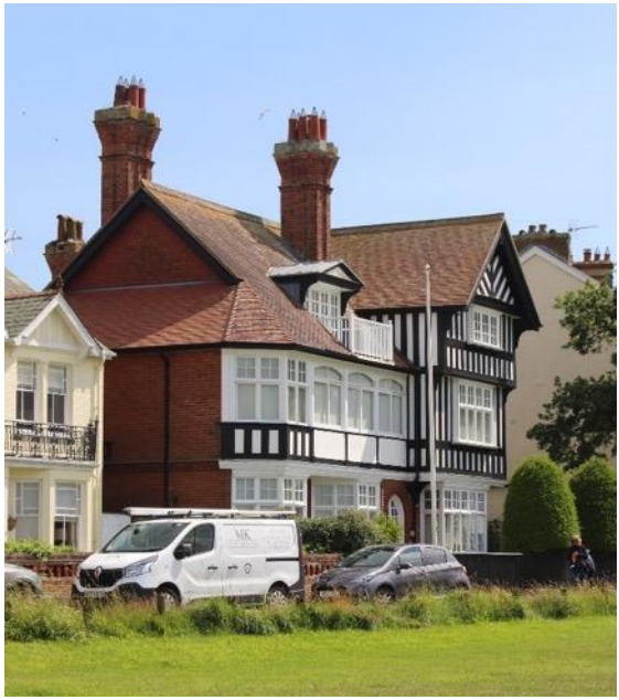
Langford Lodge, No.7 Godyll Road

windows, plate glass to the lower sash and decorative margined design to the upper, which contribute significantly to the building's character. Slate covered roof. An attractive red brick wall with pierced brickwork upper section encloses the front garden and makes a positive contribution to the setting of the house.