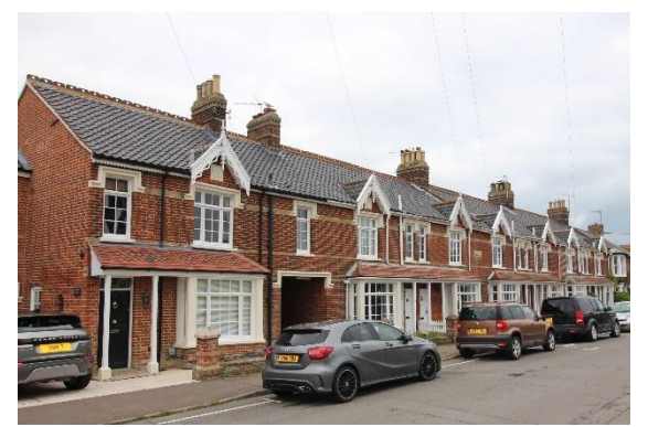
Nos.1-7 (cons) Field Stile Road

Good Hope and Coniston, Field Stile Road (Positive Unlisted Buildings). A semi-detached pair of cottages which were built to a highly conservative design in the late 1920s (the site appears undeveloped on the 1927 1:2,500 Ordnance Survey map). Red brick with pebbledashed first floor and a red pan tile roof. Central ridge stack rising from spine wall. Four light plate-glass horned sashes retained. Arched doorways set within otherwise largely blind return elevations. Possibly early public housing.