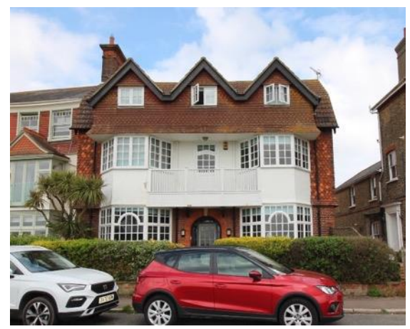
The Links, No.10 Godyll Road

Westholme and Cranbrook, Godyll Road (Positive Unlisted Building). Historic photographs show the house began its life a balanced pair of three storey houses, tile hung to the attic storey and with a regimented order of three sash windows to the first and second floors of each house. Since which time Westholme has lost a window to the attic floor and the ground floor has been reconfigured. Cranbrook now has a ground floor bay projection which partly rises to the first floor with pitched roof over. While the house is not as coherent as its neighbours, both houses retain a number of horned sash windows, with unusual glazing bar arrangement to the upper sashes and the houses continue to make a positive contribution to their setting. Elaborate wrought iron hand gates and posts to the entrances of each property.