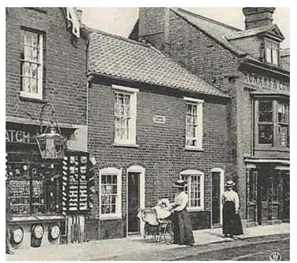
Nos.38 & 40 East Street before altering from a c.1900 postcard.

Horseshoe Cottage No.38 and Longshore, No.40 East Street (Positive Unlisted Buildings). A pair of red brick cottages of c.1800 possibly incorporating earlier fabric. Red pan tiled roof. Formerly with shallow arched brick lintels to ground floor openings, both ground floor windows have however been altered. The original small paned sash to the upper floor of No.38 survives but that to No.40 has again been replaced. Twentieth century partially glazed front doors in original openings.