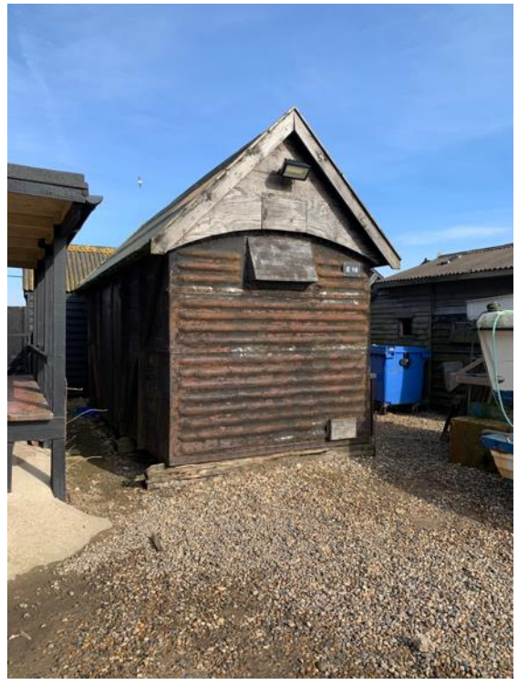
E16, Blackshore, former ventilated goods wagon repurposed as a hut

E16, Blackshore A former goods truck with corrugated ventilated ends, now used as a store. New pitched roof replaced the original curved structure. Timber sides, with taking in door.