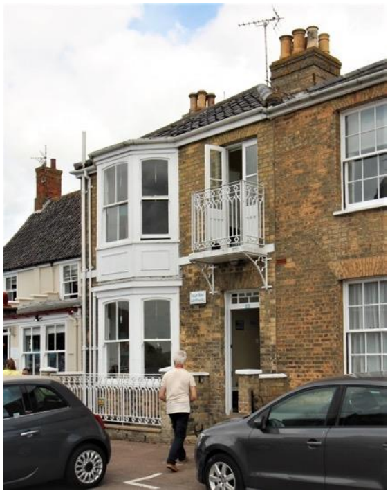
Sole Bay Cottage, No.4 South Green

Red Lion Inn, No.2 South Green (Grade II)