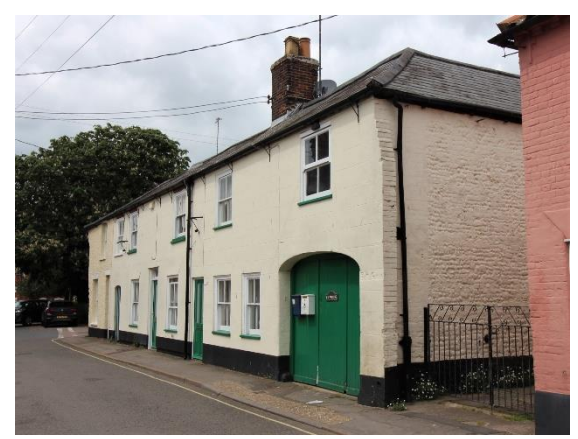
Nos.12-18 (even) Victoria Street from the south.

southern end of the terrace reads 'B.H.C. 1861' (apparently for Benjamin Howard Carter, builder and contractor, the Carters still occupying parts of the terrace into the 1990s). Originally dwellings with a builder's yard to the rear accessed through a substantial arched entrance at the terrace's southern end later partly converted to shops. Substantial two storey outshot to rear of No.16. Horned, four light plate-glass sashes at first floor level, much of ground floor however probably remodelled c.1990 when shop facia removed. No.12 has been rendered in roughcast and has a return elevation to Bartholomew Green which contributes significantly to the setting of the Grade II listed No.16. Formerly a shop it has a splayed corner. Rear wing with a full height canted bay window and a red pan tiled roof.