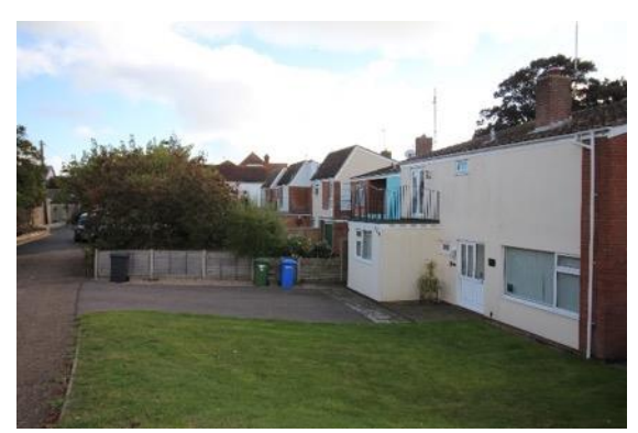
No.70 Pier Avenue

which form part of a notable group with Nos. 60 & 62. Red brick with steeply pitched red pan tiled roofs. Symmetrical facade of four bays, the end bays to each house projecting slightly and have a full height tile hung canted bay window over which the roof projects to forma hood. Replaced casements with mullions to central bays. Porches with steeply pitched pan tiled roofs supported on square section Both houses retain their wooden pillars. original partially glazed, boarded front doors. No. 64 appears also to retain its original red brick boundary wall and gate piers to Pier Avenue. To its west is a single storey recent addition of sympathetic design which replaces the original garage building. Garden façade remodelled. The large plot on which these and adjoining houses fronting Marlborough Road were built was originally intended for a place of worship by the Coast Development Company. The equally inventive Nos.59-63 (Odd) Marlborough Road also occupy part of this former plot.