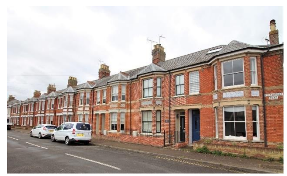
Stradbroke Terrace Nos.58-80 (even) Stradbroke Road

October 1893 in the Southwold Museum collection. Red brick with Suffolk white brick dressings and horned plate-glass sashes. Welsh slate roof with red brick ridge stacks. Recessed arched porches containing partially glazed, panelled doors beneath rectangular fanlights. No. 56 has its door set within its return elevation to Salisbury Road.