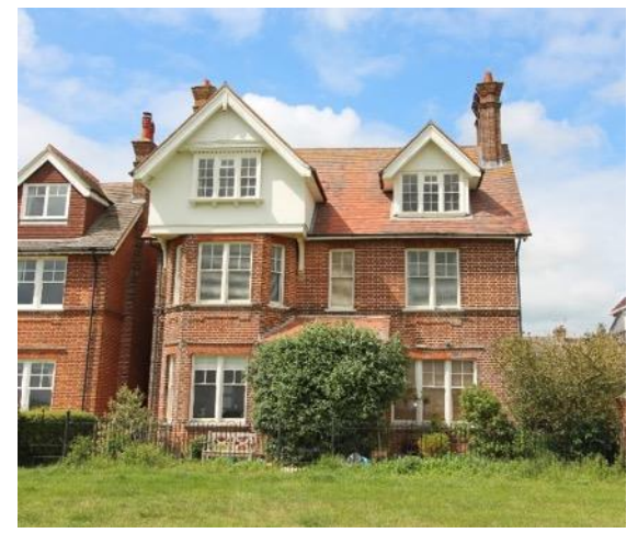
The Hollies, The Common

See Bettley, J and Pevsner, N The Buildings of England, Suffolk: East (2015), p.523.