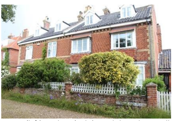
Nos.1 (left) and 2 (right), and boundary wall, Strickland Place

Nos.1 and 2, Strickland Place (Positive Unlisted Building). A pair of late nineteenth or early twentieth century houses facing Nursemaid's Park., Built from red brick with flush quoins, string course and corbelled eaves detailing in white brick. No.2 is better preserved and retains its stone lintels and sills and some original joinery. All windows to No.1 have been enlarged, to the detriment of the both properties. Side entrance extension added to No.1, probably dating from the late 1940s. Attic dormers and gable end chimney stacks with corbelled caps create a lively roofscape. The roof itself is covered with blue glazed pan tiles to the south and north pitches. Enclosing the front gardens is a low red brick boundary wall, topped with timber palisade fencing. The wall contributes positively to the setting of the houses.