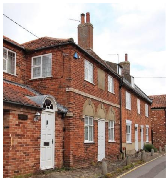
The Old Chapel, No.5 Mill Lane

The Old Chapel, No.5 Mill Lane (Grade II)