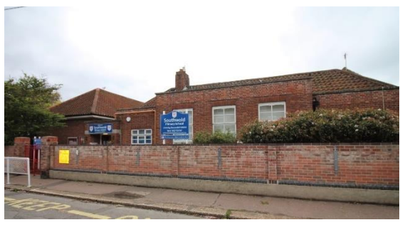
Southwold Primary and Nursery Schools, Cumberland Road

Southwold Primary and Nursery Schools, Cumberland Road (Positive Unlisted Building). A c.1930 school complex occupying an extremely sensitive site adjacent to the east end of the Grade one listed parish church. Faced in red brick and of a single storey with hipped pan tile roofs. Built around a central courtyard. Symmetrical frontage block with roof hidden behind a high parapet. Projecting flat roofed porch to northern end with boarded door. Original casement windows largely replaced but in a sympathetic style. Suffolk Record Office holds plans for the rebuilding of this school dating from 1928 (540/60/1/1-3). The school is shown complete on a dated watercolour of the town of 7<sup>th</sup> September 1935 by Frederick Baldwin in the collection of Birmingham Art Gallery. c.1930 walls and gate piers to Cumberland Road. Munn, Geoffrey Southwold, An Earthly Paradise (Woodbridge, 2017) p25.