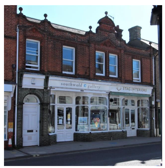
No.64 High Street

Nos.60 & 62 High Street (Positive Unlisted Building). Late nineteenth century purpose-built retail premises with living accommodation above. Faced in red brick with a Welsh slate roof. It retains its original four-light plate-glass sashes to the upper floors. Ground floor has door to living accommodation set within recessed porch at southern end. Much altered early to mid-twentieth century shop front set within probably original nineteenth century opening.