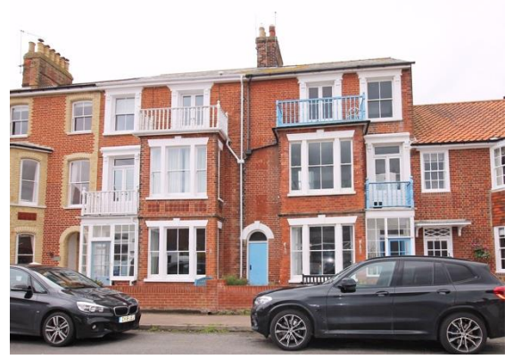
Nos.21 & 23 Marlborough Road

and canted bays. Nos.15 & 19 retain their original open fronted recessed porches. No.17 now has a pedimented wooden porch, while the windows have been unsympathetically replaced. Nos.15 & 19 however retain their original horned plate-glass sashes. Welsh slate roof with red brick ridge stacks.