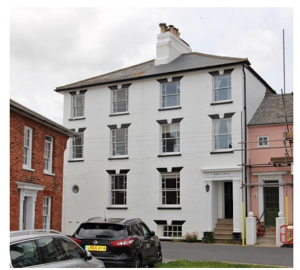
Barley Rise and Barley House, Nos.10 & 11 East Cliff

East Cliff House, No.9 East Cliff (Grade II) - see No.17 Trinity Street.