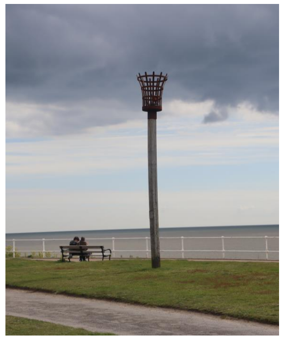
Beacon basket, Gun Hill

Beacon basket, Gun Hill (Positive Unlisted Structure). Iron basket comprising vertical straps and horizontal hoops, flaring out towards the top. Without date or inscription but possibly erected to commemorate The Queen's Silver Jubilee in 1977.