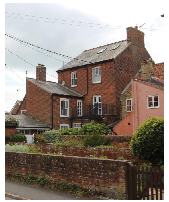
No.3 Park Lane, Lorne Road elevation

remodelled in the classical style c.1970. Its nineteenth century rear elevation is prominent in views along Lorne Road. Red brick with a Welsh slate roof and Suffolk white brick quoins. The Park Road elevation is a remarkably well executed piece of classicism for the period. Of three storeys with attics and three bays with horned twelve light sashes beneath rubbed brick wedge-shaped lintels. Open pedimented doorcase with pilasters and a radial fanlight. Six panelled door. The house's Lorne Road elevation largely retains its late nineteenth century windows. Two storey outshot.