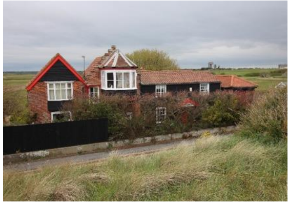
No.43 'The Inch', Ferry Road

No.33 'Kilkee', Ferry Road (Positive Unlisted Building). A single storey chalet, probably dating from the 1920s, and an example of the incremental development that typifies and unites the houses on Ferry Road. Painted brick elevations with shaped bargeboards. Rear two storey addition, and a single storey enclosed timber porch. Pitched roofs running east west. And covered with red clay pan tiles. The stepped form of the roof adds to the subtle qualities of the house.