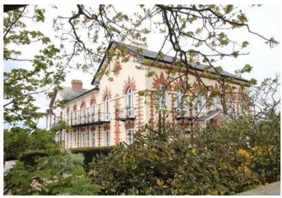
Southwold House (right) and Sole Bay House (left), from Gun Hill

Southwold House and Sole Bay House, Gun Hill (Positive Unlisted Building). A large villa of c.1855, now two houses, with its principal elevation forming an attractive backdrop to Gun Hill. Two storey with an attic, on a steeply sloping site from the plateau of Gun Hill down to Queen's Road. Painted render elevations with elaborate rubbed red brick detailing to openings (those to Sole Bay House haven been painted over). Elaborate wrought iron railings to the sea facing elevation. Low pitched roof covered with Welsh slate, with overhanging eaves and gable ends with circular windows facing the sea, which give the house a mildly Italianate flavour. Open pediment porch to the north east elevation, supported on Tuscan columns. Within the grounds of Sole Bay House is an attached diary wing and detached garage, both heavily altered but adding interest to the composition as seen from Queen's Road. Enclosing the site is a good quality cobble wall with brick margins and piers, a blocked garden entrance and a fine set of gates iron gates. The garaging to Southwold House does not enhance the setting of the property of contribute positively to the conservation area. See Bettley, J and Pevsner, N The Buildings of England, Suffolk: East (2015), p.522.