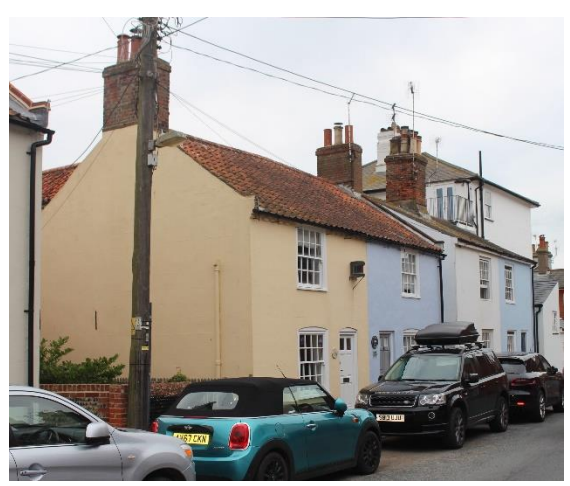
No.68 & Avocet Cottage No.70 Victoria Street

Nos.56 & 58 Victoria Street (Positive Unlisted Buildings). A pair of rendered red brick cottages of c.1800 date. Red pan tiled roof with a small stack rising from the spine wall between the two cottages. Late twentieth century replacement sashes and panelled doors. A 1949 National Monuments Record photograph shows No.56 with a boarded front door and a horned four-light plate glass sash to the first floor. Below is a small pane hornless sash. (BB49/3035).