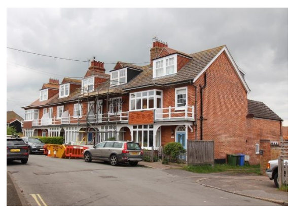
Nos.27-31 (cons) Field Stile Road

recorded on the 1891 census as unoccupied. It now forms two houses which sit back to back. Red brick with Suffolk white brick dressings and stone lintels. Welsh slate roof. Substantial canted bay with French doors. Late twentieth century flat roofed garage.