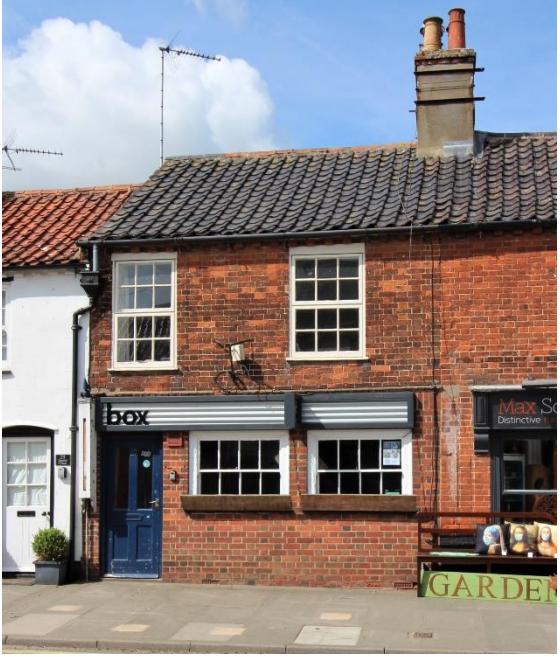
No.27 High Street

No.27 High Street (Positive Unlisted Building). Early nineteenth century former shop forming part of the same structure as the Grade II listed No.25. Red brick with a black pan tiled roof. Photographic evidence suggests that it had lost its shop facia before 1948. Sash windows replaced by unsympathetic casements. Despite unsympathetic alteration No.27 makes an important contribution to the setting of the listed buildings to its immediate north.