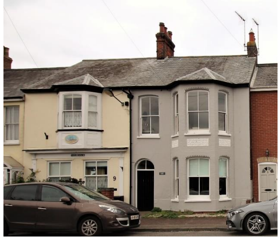
Nos.7 & 9 Stradbroke Road

Nos.7 & 9 Stradbroke Road (Positive Unlisted Buildings). A house and former shop of c.1895 of painted red brick with a Welsh slate roof and overhanging eaves. (The site is shown as vacant on a dated photograph of October 1893 in the possession of Southwold Museum). The plots were however ones auctioned by the Corporation in August 1885 with the stipulation that a house or shop costing no less than two hundred and fifty pounds be constructed on each. Old photographs suggest that No.9 also had gault or Suffolk white brick dressings. No.7 retains a simple c.1900 former shop facia with pilasters which is now infilled, and a canted oriel window above, with horned plate-glass sashes. No.9 has a two-storey canted bay window with horned plate-glass sashes. Arched doorway with plate-glass fanlight