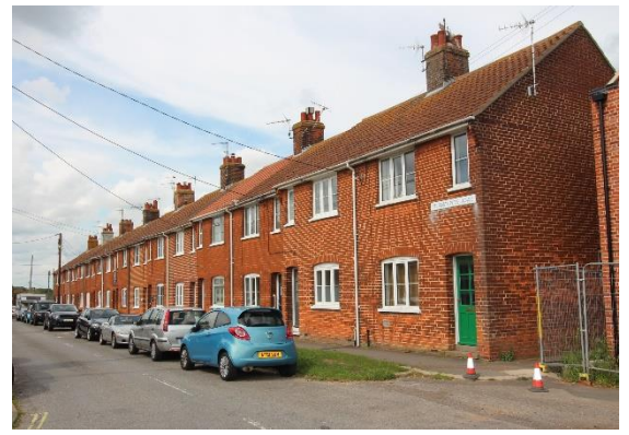
Nos.1-31 (Odd) St Edmunds Road