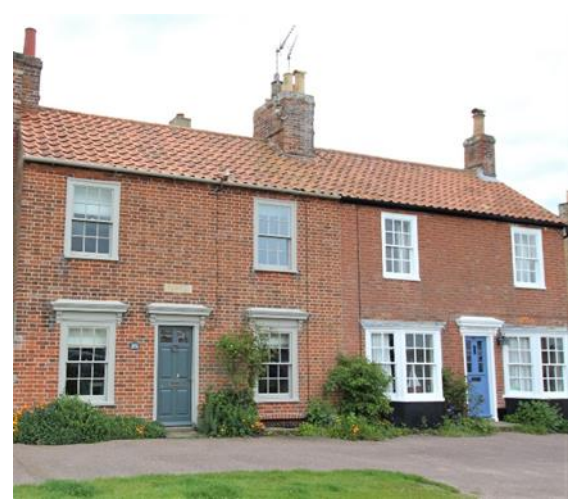
'The Retreat' No. 20 and 'Pin Cottage' No.22, South Green

wall and garden. Apparently of 1910 and possibly by Pells & Son, although it does not appear to be shown on the 1927 1:2500 Ordnance Survey map and was possibly built as part of the rebuilding work following bomb damage in 1940. Stylistically it owes much to its neighbour, Acton Lodge, to which it was linked and provided additional accommodation in the form of a Consulting Room for a GP's surgery. Later work has separated ownership and added unsympathetic entry points for a double garage and dormers to the roofline. See Bettley, J and Pevsner, N The Buildings of England, Suffolk: East (2015), p.522.