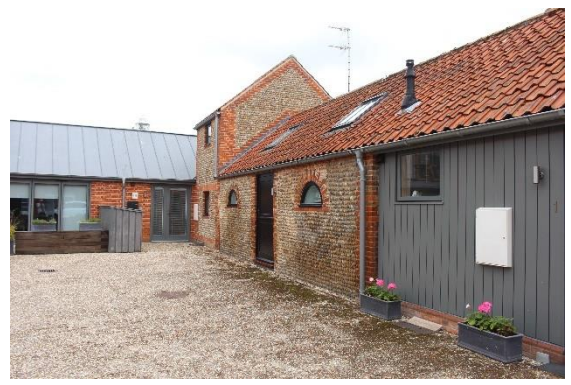
Nos.1-3 cons, Smokehouse Court

Nos. 1-3 cons, Smokehouse Court (Positive Unlisted Buildings). Former Smoke House loose box and cart shed converted to three small dwellings as part of a residential development c.2016 by Chaplin Farrant Architects. Eastern range of mid nineteenth century of cobble with red brick dressings, a dentilled red brick eaves cornice, and a red pan tiled roof. Two storey section at northern end with early twenty first century casement windows in original openings, the rear elevation of this section is in red brick. Central section of a single storey with a central boarded door flanked by lunettes. Former cart at southern end of possibly slightly later date the cart entrance now infilled with painted wooden boarding. Cobble rear elevation visible from car park on Trinity Street continued in nineteenth century cobble wall, metal covered roof slope. Northern range of a single storey retaining small nineteenth century red brick structures at either end now linked by a glazed central section with a metal covered roof slope.