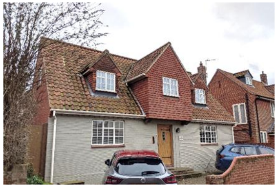
Thyme Cottage, Mill Lane

Pinkneys Way, Mill Lane Street (Positive Unlisted Building). Mid-20th century red brick house with black pantile roof. Built in Flemish bond with blue/burnt brick headers. At two storeys it is somewhat overscaled, however the use of good brick details and simple timber windows make it blend well with other historic buildings in the street.