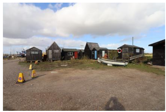
W3 to W10, Blackshore