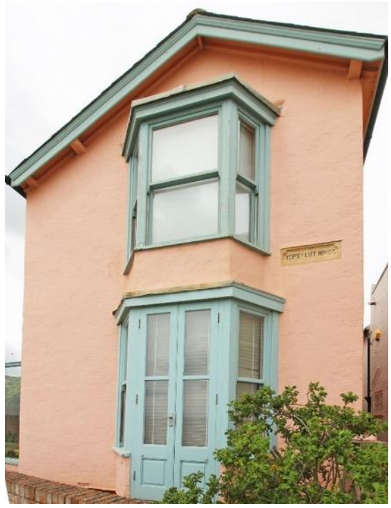
York Cliff House, Primrose Alley

York Cliff House, Primrose Alley (Positive Unlisted Building). A two storey rendered property, dating from the late 19<sup>th</sup> century, with two storey canted bay window to the east elevation, which retains horned plate glass windows to the first floor. Asymmetric pitched roof with overhanging eaves supported on exposed purlins.