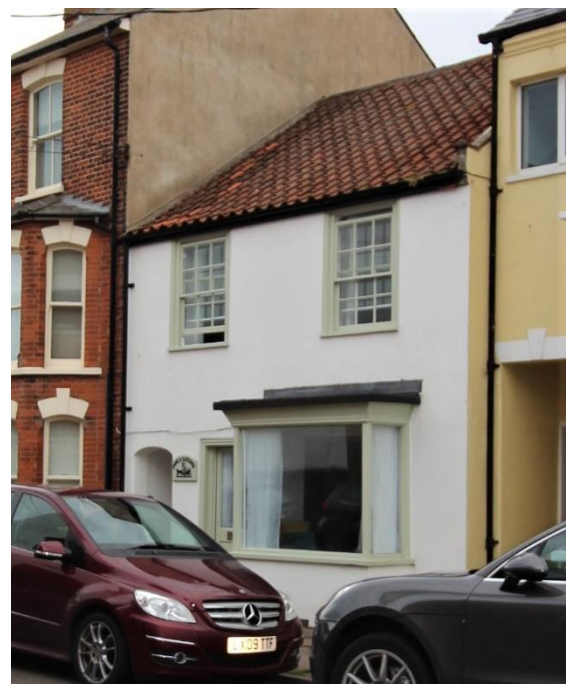
James Cottage, No.10 Stradbroke Road

No.8 Stradbroke Road (Positive Unlisted Building). One of three dwellings shown on this site on the 1884 1:2,500 Ordnance Survey map which now make up Cornfield Terrace. Two probably date from c.1880 whilst the other may be considerably earlier. Red brick with Suffolk white, or gault brick dressings and a Welsh slate roof. Overhanging eaves. Wooden doorcase with pilasters and a bracketed hood containing a partially glazed panelled front door beneath a rectangular fanlight. Original horned plate-glass sashes. Mid twentieth century dwarf red brick wall to street frontage. Cornfield Terrace plays an important role in the setting of the Grade II listed Sole Bay Inn and lighthouse.