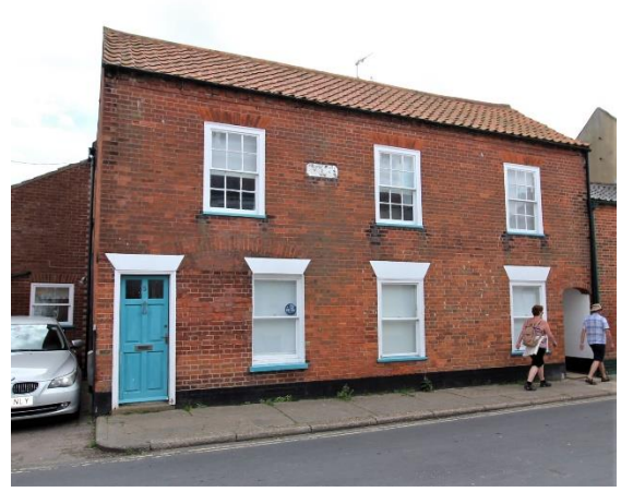
Nelson House, No.5 Trinity Street

Nelson House, No.5 Trinity Street (Positive Unlisted Building). Red brick dwelling dated on its façade to 1876, the datestone also baring the initials W.F.L. This may however relate to alterations rather than the original date of construction. Dentilled brick eaves cornice. Originally a shop and dwelling and with a shallow arched brick lintel for a large opening located above where the present door and adjacent window are located. First floor window openings with wedge-shaped rubbed brick lintels. The ground floor windows are probably all relatively recent interventions replacing a shop facia. Small pane sashes to first floor with horned plate-glass sashes to ground floor. Late twentieth century rear addition.