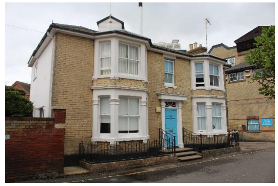
'The Brewers House', Victoria Street

Adnams Brewery, Victoria Street (Positive Unlisted Buildings). Substantial largely late nineteenth century complex including water tower with a frontage range faced in Suffolk white bricks with red brick dressings. Welsh slate roofs. Purchased by Adnams in 1895 and largely rebuilt to the designs of the accomplished brewery architects Inskipp and Mackenzie of Bedford Row London, 1897-98. They however incorporated part of a much earlier complex within their new brewery. Rear section altered in the late twentieth century. 5,000 gallon water tank of cast iron made by Braithwaites. The brewery buildings terminate views looking north along the southern section of Victoria Street. (Pearson, Lynn British Breweries, an Architectural History London: 1999 p162, and Pearson, Lynn and Anderson, Ray Gazetteer of operating pre-1940 Breweries in England Brewers History Society London: 2010). Miller, John Britain in Old Photographs, Southwold (Stroud, 1999) p98.