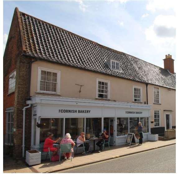
Nos.54 & 54A High Street

Town Sign, High Street (Positive Unlisted structure) A decorative mid twentieth century town sign depicting the battle of Sole Bay (1672) with the town seal above. The sign rests on brackets which form galleons. Square section wooden pole. A prominent landmark at the junction of High Street and Victoria Street. The sign occupies the site of houses demolished for road widening by Southwold Corporation in 1934.