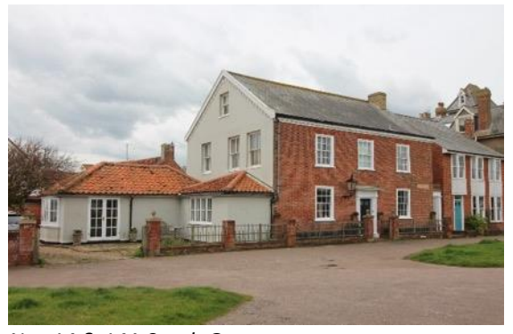
Nos.14 & 14A South Green