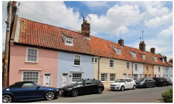
Nos.42-54 (even) Victoria Street

Jubilee Cottage, No. 40 Victoria Street (Positive Unlisted Buildings). 19<sup>th</sup> century origin and may have been built around the time of Queen Victoria's Golden Jubilee in 1887. It is two-storey in red brick with red pantiles and a gable chimney at the ridge. The house is positioned at the back edge of the pavement and contributes valuably to a residential streetscene of continuous built frontage with an attractive and strongly historic character, that includes 18<sup>th</sup> and 19<sup>th</sup> century houses on either side.