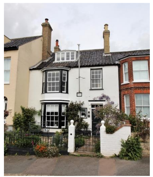
Rowan Cottage, Constitution Hill

probably originally part of the neighbouring property Rowan Cottage (Grade II listed, see below). Centrally located entrance flanked by two storey bay windows, canted to the left and square to the right. The original ridge has been raised over the right section of the property and is covered with black glazed pan tiles. The house retains its horned plate glass sash windows.