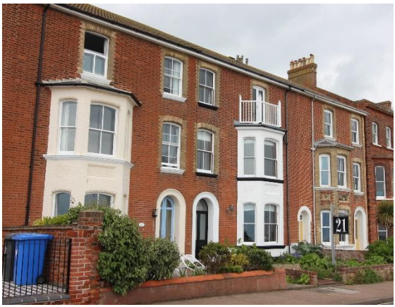
Nos. 20-22 (cons) North Parade

Nos. 20-22 (cons) North Parade (Positive Unlisted Buildings). Three substantial dwellings of red brick, with gault, or Suffolk white brick window surrounds which form part of a terrace with Nos.18 & 19 and like them probably date from c.1894. Of three storeys and two bays each. Each house has a twostorey canted bay window, those to Nos.20 & 21 are now rendered. Arched front doors in moulded surrounds with partially glazed front doors. Window joinery to No.22 replaced, the other houses retain four light horned plate-glass sashes. No.21 has had its chimney stack removed. Later twentieth century dwarf brick boundary walls to North Parade. No.22 was a hotel in 1911 according to census returns and No. 21 apartments. Nos.21 & 22 are described as 'apartments' in Kelly's 1916 Directory.