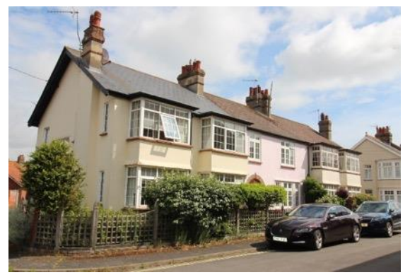
Nos.11-13 (cons), Wymering Road

Nos.1-10 (cons) Wymering Road (Positive Unlisted Buildings). A terrace of ten houses dating from the early twentieth century. No.1 is built from Suffolk white brick with horizontal bands of Suffolk red brick and lintels to door and window openings. Former shop front to the elevation facing Manor Park Road. The rest of the terrace is pebble dashed with timber two storey canted bays, except to No.? which has a red brick canted bay that seems to predate the timber bays. Slate covered roofs with red clay ridge tiles with pierced detailing. Shared white brick stacks with contrasting red brick banding to the party wall line of each property. Small front gardens behind dwarf walls, mostly containing Minton tile panels before the recessed porches. The terrace retains much original door and window joinery.