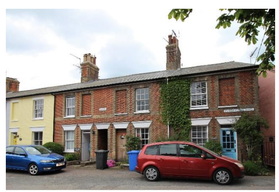
Nos.23-26 Cumberland Road

Providence Cottage, Cumberland Road (Positive Unlisted Building). A late nineteenth century painted brick villa with a Welsh slate roof. Canted bay capped with cast iron finial containing four light plate-glass sashes with horns. Lintels with saw tooth moulding and lintels resting on corbels. Decorative cast iron mini balcony to window above door. Panelled door with arched overlight.