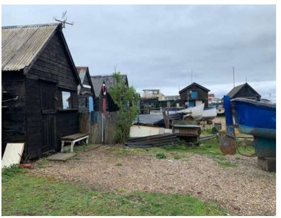
General view of huts W12 to W22, looking south east