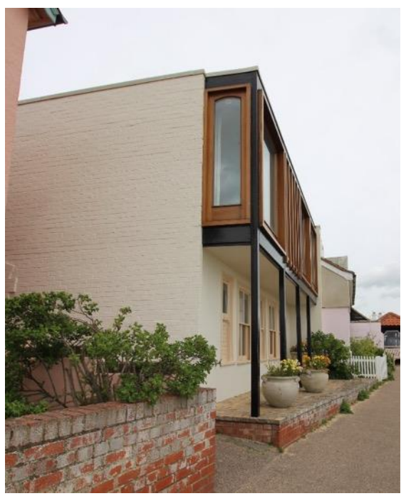
The Nook, Primrose Alley

Boundary wall, to the west of The Nook, Primrose Alley (Positive Unlisted Building). Wall constructed from coursed washed cobbles set within red brick margins and cappings. The wall provides a sense of enclosure to Primrose Alley and contributes positively to the setting of several buildings.