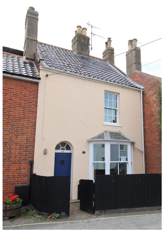
No.89 Victoria Street

Suffolk Cottage, No.87 Victoria Street (Positive Unlisted Building). Late nineteenth century villa of red brick with horned plate-glass sash windows beneath shared wedge-shaped lintels. Full height bay window. Partially glazed front door within projecting flat roofed porch with parapet. Arched doorway to passage at northern end with boarded door. Red pan tiled roof. Later twentieth century red brick garden wall to frontage recently removed.