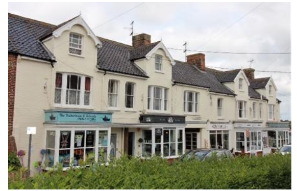
Nos.3A-9A (Odd), Station Road

Nos.3A to 9A, Station Road (Positive Unlisted Buildings). An early twentieth century terrace of houses, red brick, now painted. Originally the houses had recessed open porch entrances under stone half-round arches, with two storey canted bays. During the first quarter of the twentieth century shop fronts were introduced, until all canted bays were removed and the existing single storey square bays and entrances were built (probably during a program of works by the Town Council during the early 2000s). To the middle of the terrace is an opening leading to a commercial yard. Large attic dormers with shaped bargeboards. Blue glazed pan tile roof covering. The existing windows contribute to the gorup's character. The low brick walls and railings, seen on historic images, have long since been removed. The terrace is prominent in views looking south into the town and contributes to the structures grouped around Station Road, Pier Avenue and Blyth Road.