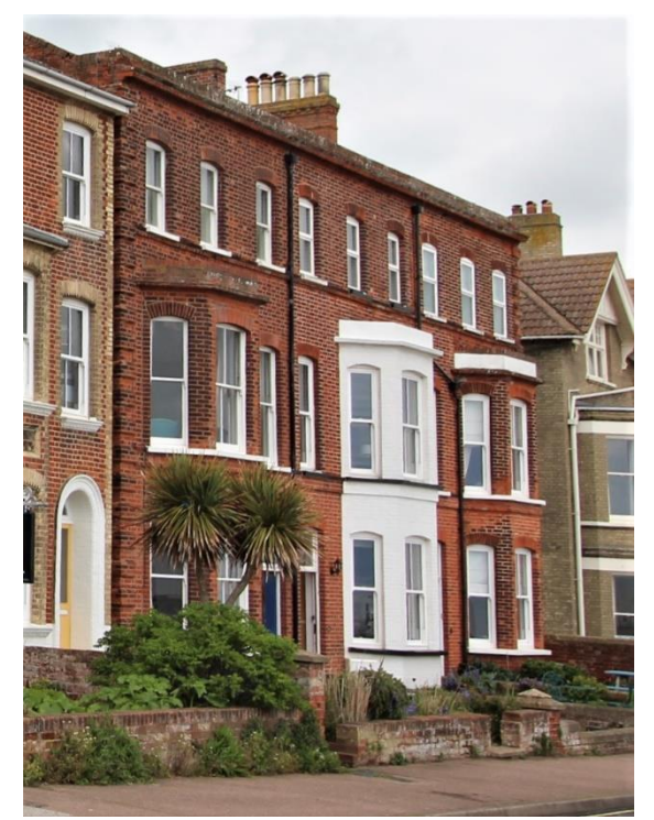
Nos.23-25 (cons) North Parade

Nos. 20-22 (cons) North Parade (Positive Unlisted Buildings). Three substantial dwellings of red brick, with gault, or Suffolk white brick window surrounds which form part of a terrace with Nos.18 & 19 and like them probably date from c.1894. Of three storeys and two bays each. Each house has a twostorey canted bay window, those to Nos.20 & 21 are now rendered. Arched front doors in moulded surrounds with partially glazed front doors. Window joinery to No.22 replaced, the other houses retain four light horned plate-glass sashes. No.21 has had its chimney stack removed. Later twentieth century dwarf brick boundary walls to North Parade. No.22 was a hotel in 1911 according to census returns and No. 21 apartments. Nos.21 & 22 are described as 'apartments' in Kelly's 1916 Directory.