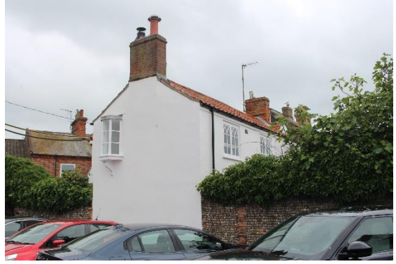
'Sea Lark', No.20 Snowdens Yard

No.18 Snowdens Yard was inaccessible at the time of survey so no assessment of the merits of this structure has been made.