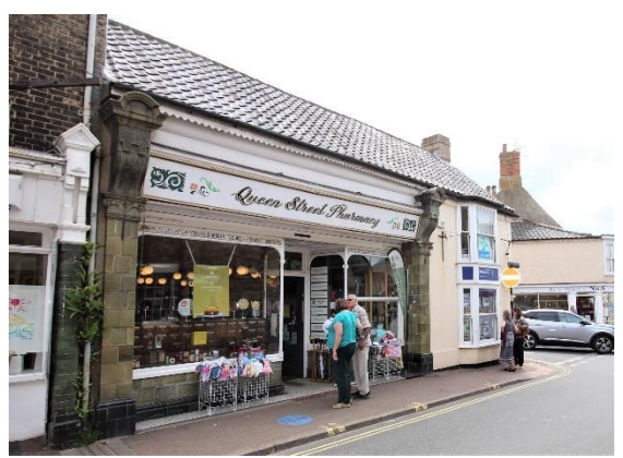
No.18 Queen Street

No.1 The Elms and No.3 Queen Street (Grade II)