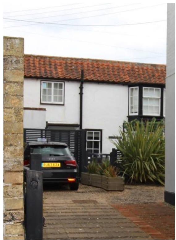
'Harriet's Cottage', No.28A South Green

radiused heads. Fire plaque located centrally to this and the neighbouring property (No.24). Garage and first floor veranda not of special interest.