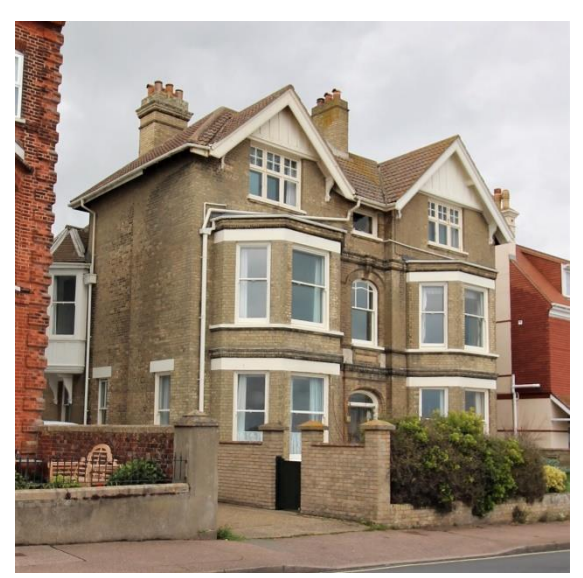
Nos. 1-3 Strathmore House, No.26 North Parade

No.23, Amber House No.24, & No.25 North Parade (Positive Unlisted Buildings). Terrace of three substantial three storey houses, possibly designed as boarding houses. Map evidence suggests that they were constructed sometime between 1891 and 1904, however their site appears to be vacant on a dated photograph of October 1893 taken from the lighthouse. Red rick with brick quoins and rubbed brick lintels. Brick parapet and moulded brick cornice. Horned plate-glass sashes survive to No.23. Nos.24 & 25 with heavier replacement sash frames to original design. Each house of two bays with a two-storey canted bay window to the northern bay. That to the central house is rendered which may possibly be an original design feature. Four panelled front doors beneath plate-glass fanlights. The rear elevations of Nos.25 & 26 are visible from Field Stile Road, that to No.25 being rendered. Both retain their horned plate-glass sashes. Nos.24 & 25 appear to retain their original boundary walls to their front gardens. No.23 was a private house in 1916 (Kelly.) John Miller Britain in Old Photographs: Southwold (Stroud 1999) p83