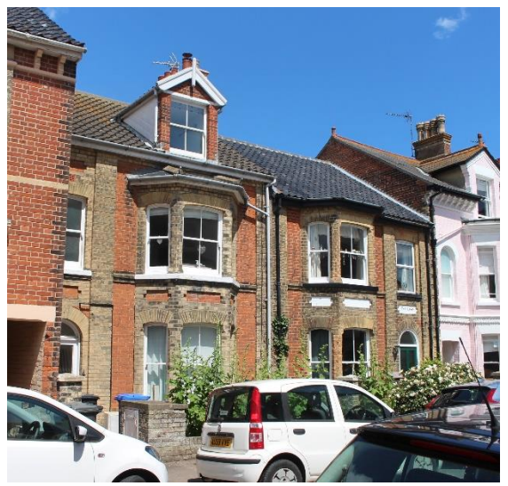
Nos.7 & 9A-9C Chester Road

Nos.1-5 (Odd) Chester Road (Positive Unlisted Buildings). A terrace of three south facing houses built on plots sold by Southwold Corporation in 1885, with the provision that houses costing no less than three hounded pounds should be built upon them. Save for No.16 all of the houses on Chester Road were probably constructed by the same builder. The completed terrace appears on a photograph taken in 1893 from the lighthouse, which is preserved within the Southwold Museum collection. Red brick with elaborate Suffolk white brick dressings and quoins. Original horned plateglass sashes with margin lights preserved. No.5 sadly now painted. Partially glazed front doors set within recessed porches with decorative tile floors. Welsh slate roof with projecting eaves resting on heavy moulded corbels. Finialed dormers and red brick ridge stacks rising from spine walls between the houses. No.1 has a discreet and sympathetically designed c.2010 addition. Garden walls mostly rebuilt, and decorative iron railings removed. John Miller Britain in Old Photographs: Southwold (Stroud 1999) p83 & 87.