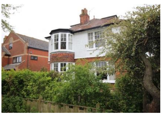
The Willows, No.66 North Road

Mights Cottages, Nos.30-40 (even) North Road (Positive Unlisted Buildings). A terrace of six pebble dashed Southwold Corporation council houses of c.1928 built on part of the allotment gardens created for the adjoining council houses c.1914. Partially glazed front doors beneath hoods supported by carved brackets, window joinery replaced. Hipped pan tile roof. Red brick chimney stacks.