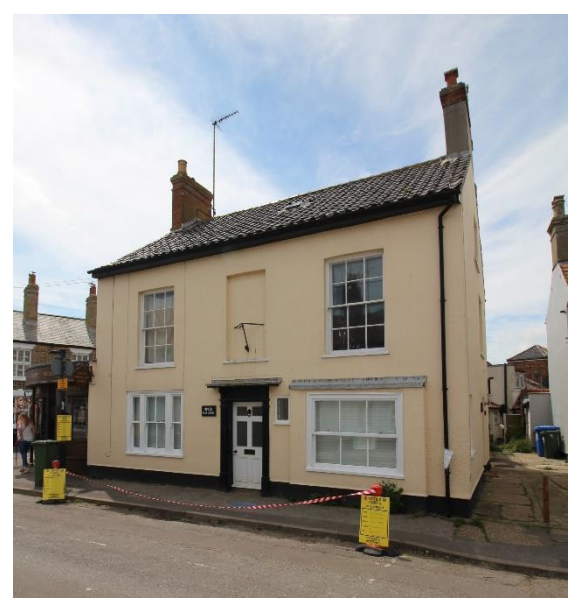
East Lodge & Upper East Lodge, East Street

second floor are of plate-glass with narrow margin lights.