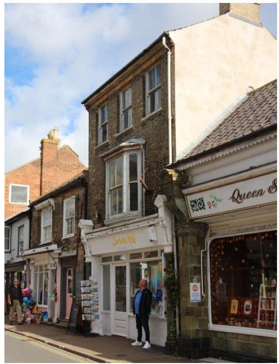
No.16 Queen Street