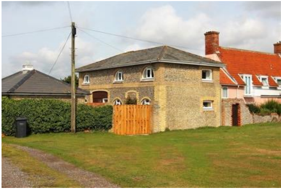
Coach House, Gun Hill

Coach House, Gun Hill (Positive Unlisted Building). Former Coach House located to the north of Stone House, with which it shares many characteristics, including cobble walls with brick margins, shallow pitched slate covered roof and overhanging eaves. Converted to residential use during the 1970s. While door and window joinery is replacement, they exist within the original openings ensuring the original form and function of the structure is easily identifiable. The unbroken roof, free from skylights and dormers, and the cobble end gable which faces Gun Hill makes a significant contribution to the conservation area.