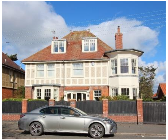
No.62 Pier Avenue

No.62 Pier Avenue (Positive Unlisted Building). A well-preserved detached villa of c.1905 which was probably designed by the London architect Edward Charles Homer (1845-1914). One of the first buildings to be completed on the Coast Development Company's building estate. Two storeys with attics. Red brick with a rendered first floor embellished with applied timber framing. Steeply pitched plain tile roof capped with decorative ridge pieces. Original plate-glass sash windows with small pane upper lights preserved. Original flat-topped dormers with casements to roof. Homer who was responsible for villas at Hampstead and Frinton Essex as well as for his early London cinemas. Designs by Homer of c.1905 for villas on Pier Avenue with applied timber framing to the upper floors were recorded by Bob Kindred in his survey of Suffolk architects but have sadly since been destroyed.