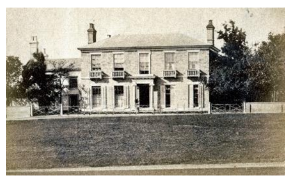
Undated postcard of Hill House, prior to the addition of the attic floor.

Hill House and Woldside, No.27 South Green (Grade II)