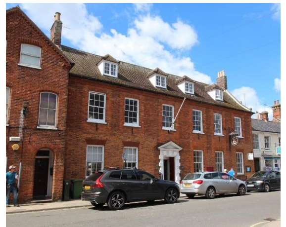
Buckenham House, Nos.81 & 83 (odd), High Street

Buckenham House, Nos.81 & 83 (odd), High Street (Grade II*)