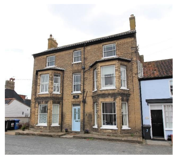
Caithness House, No.9 & 9B St James Green

Nos.3-7 (Odd) St James Green (Positive Unlisted Buildings). A terrace of three late eighteenth or early nineteenth century cottages of rendered brick with a red pan tile roof. No.3 with preserved former shop facia to ground floor and twelve light sash above. No.5 also has twelve light sashes but those to No.7 have been replaced with unsympathetic UPVC units.