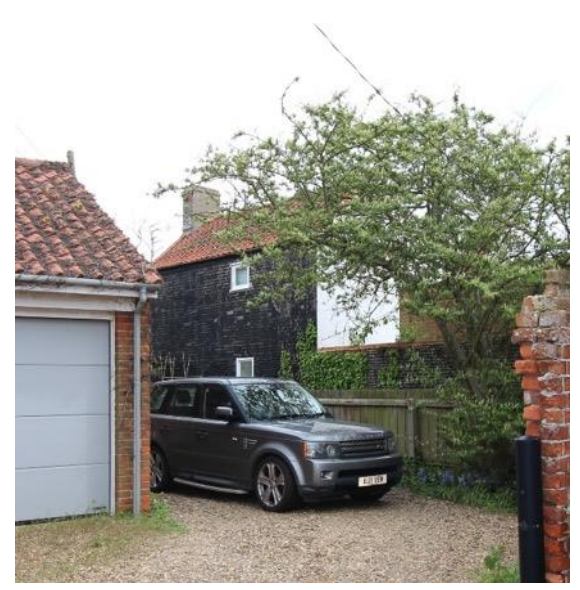
South Cliff Cottage, South Cliff, west elevation

South Cliff Cottage, South Cliff (Positive Unlisted Building). A complicated and multi-phased property of mixed character. Essentially two cottages; one located to South Cliff and facing the sea and one located to the west. Both structures appear to be shown on the 1884 OS map, and have been linked by a single storey range at least since the 1970s (link range rebuilt c.2017) and the 1927 OS maps shows a range of outbuildings between the two structures. The property facing South Cliff retains much late 19<sup>th</sup> century detailing and joinery, including the timber canopy over the veranda, and plate glass sash windows. An octagonal belvedere with slender access tower, added to the north east corner of the property, adds an unconventional flourish to the property. The cottage to the west is two storey, more conventional, constructed from flint with a pitched roof covered with pan tiles and gable end stacks.