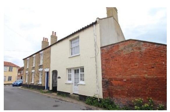
No.4 Pinkney's Lane

No.4 Pinkney's Lane (Positive Unlisted Building). This building appears to be a continuation of the size and form of the property to which it is attached at first floor level to the north, although it appears to be shown on the 1839 Robert Wake map. Two story, rendered, with gault brick stack to the south gable end. Black glazed pan tiled roof. The first floor has a single unhorned 8 over 8 pane sash window. Directly below is a door flanked by casement windows, probably dating from the mid 20<sup>th</sup> century. To the left is a three-centered arch leading to an alleyway and the rear of the property.