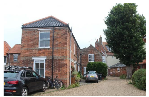
Rear of Nos.77 & 79 High Street from Buckenham Court.

Nos.77 & 79 High Street (Positive Unlisted Buildings). Two late nineteenth century shops of red brick with painted stone dressings. Originally built as houses. Glazed black pan tiled roof. Horned plate glass sashes. Red brick ridge stacks. Simple wooden shop facias with pilasters of c.1900. Southern section of No.79 contains a courtyard entrance with a large casement window above. Substantial red brick rear wing to No.77 with four light plate-glass sashes. Jenkins, A Barrett, A Visit to Southwold, Containing Over 150 Photographs of Historic Interest (Southwold, 1984) p15.