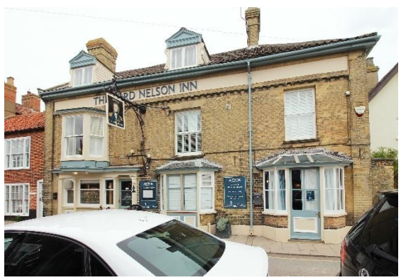
The Lord Nelson Inn, No.42 East Street

The Lord Nelson Inn, No.42 East Street (Positive Unlisted Building). A well-preserved public house of c.1860 built on the site of an earlier public house opened c.1823. Faced in Suffolk white brick with horned plate-glass sashes. Original pilastered facia preserved to western most bay, to its east are two canted bay windows with doors inserted into their central face. The eastern canted bay replaces an arched opening into a rear courtyard visible on historic photographs. Formerly with Welsh slate roof now pan tiles. Two gabled dormers in principal roof slope with boarded sides. Decorative white brick ridge stacks. Fine decorative cast iron bracket to inn sign.