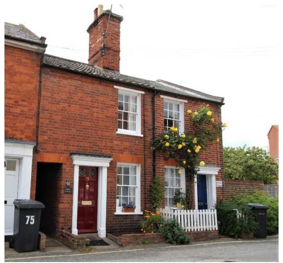
Nos.71 & 73 Victoria Street

elevation with late twentieth century windows. Two storey later twentieth century rear addition formerly linking the structure to Adnams Brewery buildings in the rear courtyard which have been replaced with bungalows. Late twentieth century railings to frontage on dwarf white brick wall. Miller, John Britain in Old Photographs, Southwold (Stroud, 1999) p98.