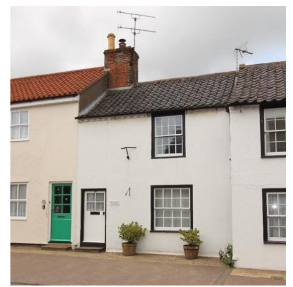
White Horse Cottage, No.19 High Street

hornless sashes. Partially glazed late twentieth century front door. Chimney stack removed.