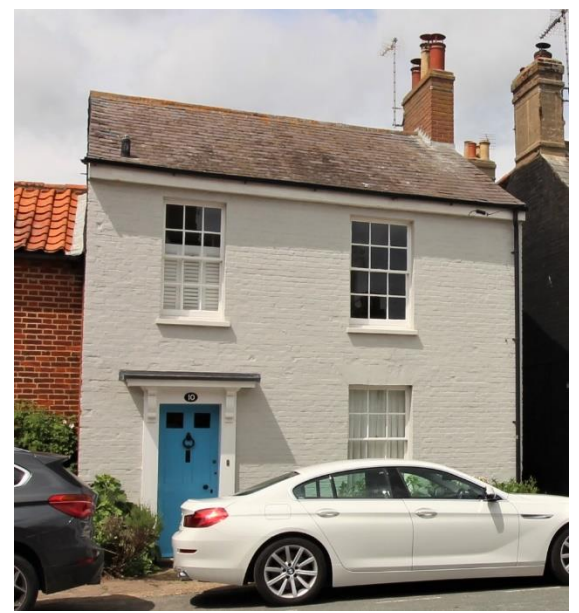
No.10 Trinity Street