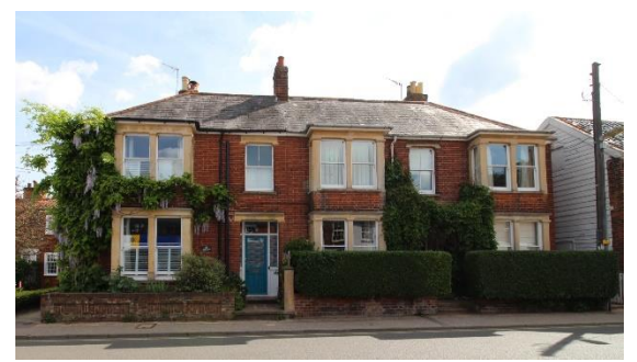
Nos.24 & 26 High Street

Nos.24 & 26 High Street (Positive Unlisted Buildings). Substantial and well-preserved pair of later nineteenth century red brick villas incorporating what appears to be an earlier range at the rear. Two storeys, steeply pitched and hipped Welsh slate roof with red brick ridge stacks. Full height bay windows with stone dressings with original horned plate-glass sash windows set within. Return elevation to north side of No.24 has canted Recessed porches with wooden glazed oriel. screens within. No.24 has decorative glazed tiled pathway and floor within porch. Panelled front doors. No.26 retains original dwarf garden wall to High Street and decorative tiled floor within porch. This pair of houses contribute significantly to the setting of the listed buildings to their north and to that of those opposite.