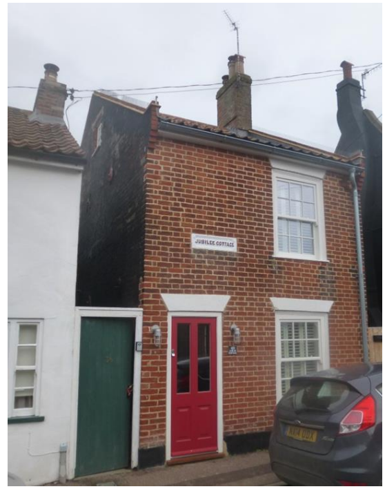
Jubilee Cottage, No. 40 Victoria Street

Jubilee Cottage, No. 40 Victoria Street (Positive Unlisted Buildings). 19<sup>th</sup> century origin and may have been built around the time of Queen Victoria's Golden Jubilee in 1887. It is two-storey in red brick with red pantiles and a gable chimney at the ridge. The house is positioned at the back edge of the pavement and contributes valuably to a residential streetscene of continuous built frontage with an attractive and strongly historic character, that includes 18<sup>th</sup> and 19<sup>th</sup> century houses on either side.