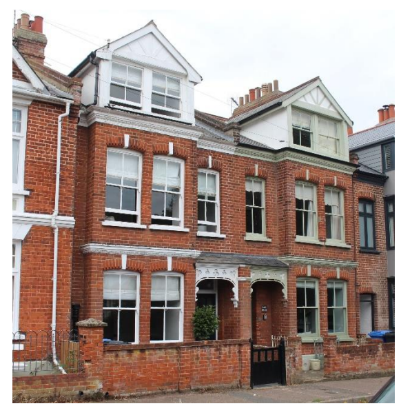
Nos. 7 & 9 Cautley Road

c.1900, (shown on the 1904 1:2,500 Ordnance Survey map). Possibly two of the three projected Cautley Road villas designed by the Walthamstow architect and civil engineer John Grant-Browning for Robert Jerman a builder of Leyton Essex. Designs for which were submitted for approval in February 1902 (Kindred). They are of three bays each, with gabled two storey bay windows to the outer bays. The houses are faced in red brick with plaster faced lintels, and mullioned and transomed windows. Central bay recessed with decorative wooden balcony beneath which is a corbeled arch. Partially glazed front doors. C Brown, B Haward & RJ Kindred Dictionary of Architects of Suffolk Buildings 1800-1914 (Ipswich, 1991) p115. Jenkins, A Barrett A Visit To Southwold, Over 100 Photographs of Historic Interest (Southwold, 1983) p 28.