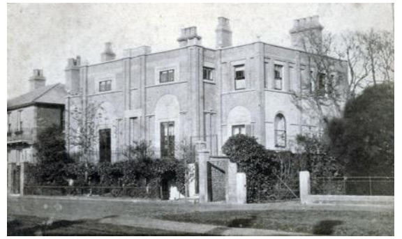
Nos. 10A-10D South Green from a c.1870 carte de visite

South Green House, No.8 South Green (Grade II)