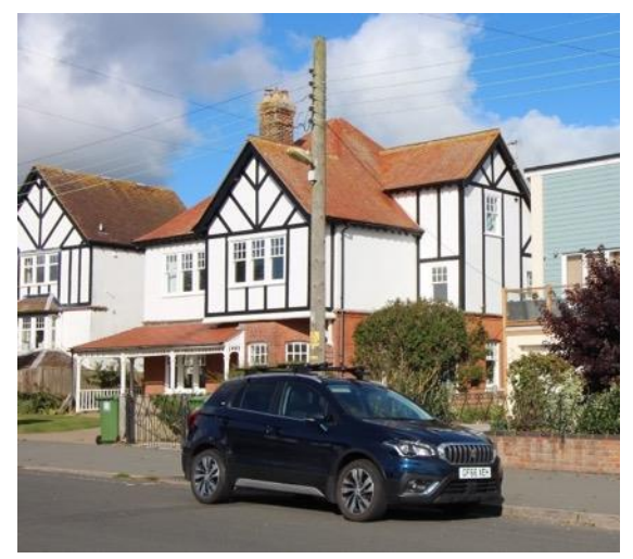
No.82 Pier Avenue

No.82 Pier Avenue (Positive Unlisted Building). An early twentieth century detached villa (shown on an auctioneer's plan of 1919, but not amongst the plots sold in the first sale in 1899). Bomb damaged in 1943 and altered and extended c.2015 but retaining much of its original external joinery. Red brick with a rendered upper floor and a plain tile roof. Decorative wooden veranda. Tall decorative red brick chimneystack. The applied decorative timber framing is not shown on 2011 photographs of the building. However midtwentieth century photographs do show elaborate plasterwork in the style of applied timber framing to the entire first floor, much in the style of the adjoining Saxon House.