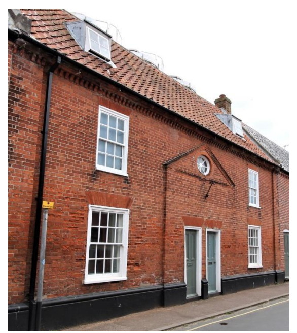
Nos.24 & 26 Church Street