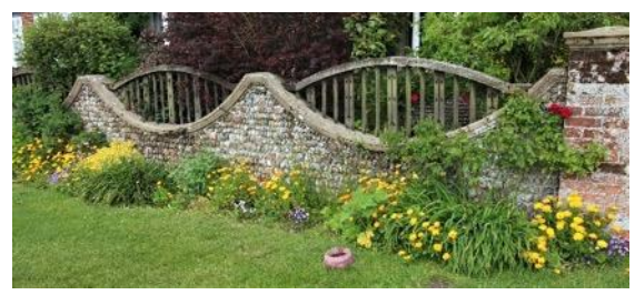
Cobble wall, stone caps and timber baluster screen to Commoners and Fairway Cottage, The Common

Commoners and Fairway Cottage, The Common (Positive Unlisted Building). A bold inter-war Arts and Crafts design. Two houses, but creating the impression of one large villa. Central gable rising to attic storey with eaves to the right stopping above the first floor, and the eaves to the left continuing down to the ground floor and over an enclosed porch (originally open). First floor windows grouped to the centre of the gable end, separated by a stone tablet depicting bearing the date 1913, although rather confusingly it is not shown on the 1927 1:2,500 Ordnance Survey map. Red brick stacks to the north and south gables ends, the shafts continuing down the elevation. Two further stacks positioned symmetrically either side of the entrance façade gable. The modern fenestration to Fairway Cottage is unsympathetic.