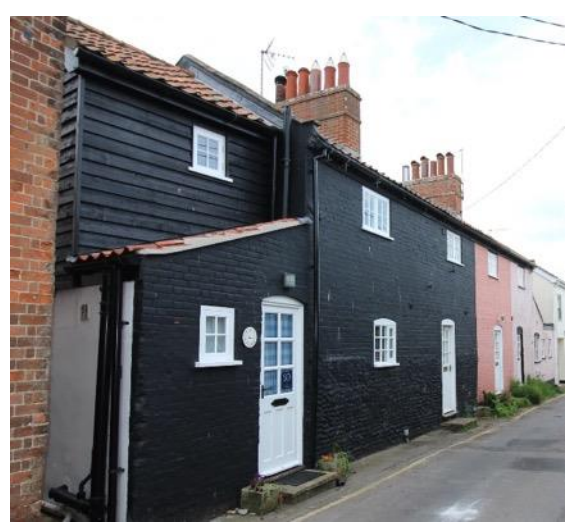
Nos.4-10 (even) Mill Lane

Nos.4-10 Mill Lane (Positive Unlisted Buildings). A row of four early nineteenth century cottages. Painted brick elevations with red clay pan tile roof covering. Ground floor door and casement windows under brick arch lintels, first floor casement windows tight to underside of the projecting dentil eaves course of brickwork. No.4 and No.10 have single storey side additions with a catslide roof over. The weatherboarded addition to No.4, and the flat roofed addition to No.10, are not of special interest. This row of cottages, along with No.2 Mill Lane, make a strong and positive contribution to the streetscape and character of the lane.