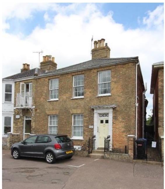
South Green Cottage, No.6 South Green South Green Cottage, No.6 South Green (Grade II)