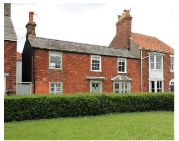
Iona, No.7 Bartholomew Green