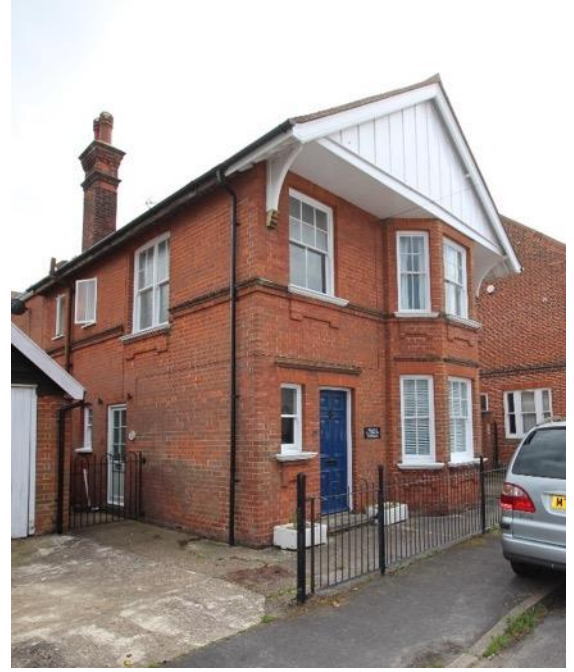
Flats 1-2 Eversley Cottage, Wymering Road

Roman Catholic Church of the Sacred Heart and Presbytery, Wymering Road (Grade II)