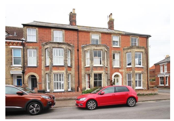
Branchester Villas, Nos.52 & 54 Stradbroke Road and Salisbury House, No.56

No.50 Stradbroke Road (Positive Unlisted Building). Substantial house of the early-1890s. Shown on a photograph dated 13<sup>th</sup> October 1893 in the Southwold Museum collection. Red and Suffolk white brick façade with painted stone dressings and a replaced red pan tile roof. Principal façade of two bays with a finial capped gabled breakfront to the southern bay, which is of red brick, whilst the remainder of the façade is of white brick. Heavy dentilled eaves cornice of red brick. Horned, plate glass-sashes. Recessed porch containing a partially glazed panelled front door. Nos.40-44 (even) Stradbroke Road are of an identical design. Late twentieth century low wall to frontage.