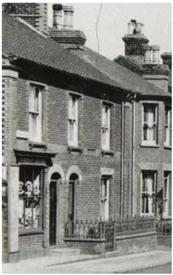
No.33 Station Road in its original form (undated)

No.33 and 33a, Station Road (Positive Unlisted Building). A stylish double fronted villa built in 1878. Originally the property had a pair of centrally located entrances under arched heads and a timber shop front to the left side (to what is now No.33a). The former small front garden is enclosed by a low brick will with railings. All evidence of the commercial past have now been removed and a balanced street façade created. All this has been skillfully done. To the corners are white brick pilasters with painted capitals. The sash windows have projecting tone sills with luggs to the underside. Blue glazed pan tile roof with gable end stacks of red and white brick.