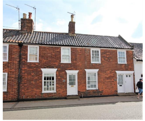
Nos.28 & 30 High Street

Sycamore Cottage, No.26 A High Street (Positive Unlisted Buildings). House, probably of early nineteenth century date, latterly office and now again a dwelling. Red brick with a weatherboarded northern return wall, and a black glazed pan tile roof. Façade possibly at least partially rebuilt. Twelve-light sashes beneath wedge-shaped lintels. Ridge stack rising from spine wall with No.28. Forms part of a short terrace with Nos. 28 & 30