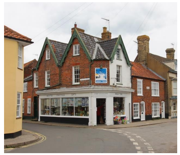
No.36 East Street

No.36 East Street incorporating the former Nos. 1 & 3 Trinity Street (Positive Unlisted Building). A prominently located mid nineteenth century shop of red brick with a black pan tiled roof. Decorative pierced bargeboards to gables now sadly lacking their spear finials. Twelve light hornless sashes to first floor windows. Casements to second floor. Ground floor retains late nineteenth century shop facia with splayed corner entrance flanked by pilasters.