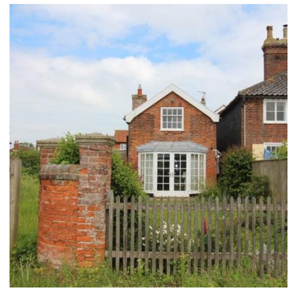
Rope Walk Cottage and boundary wall, Spinners Lane

Rope Walk Cottage, Spinners Lane (Positive Unlisted Building). A diminutive red brick structure, with gable end facing the common. Mid to late nineteenth century, with the 1904 1:2,500 Ordnance Survey map showing a larger structure extending to the west; the west elevation brickwork bears the scars of alteration to the gable end. Canted bay window with lead roof probably added when the structure was reduced in size during the mid-twentieth century. Red brick boundary wall with half round cappings and piers with stone caps fragmentary but adds to the setting of the house and forms a group with the house and wall to the south.