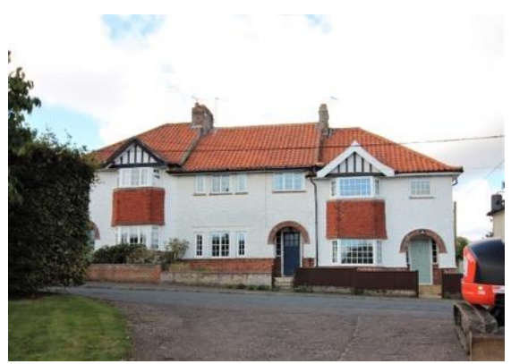
Nos.59-63 (Odd) Marlborough Road

See also No.66 North Road and Nos.51 & 53 Pier Avenue. For the southern section of Marlborough Road, south of Field Stile Road, see the Seaside Corporation Character Area.