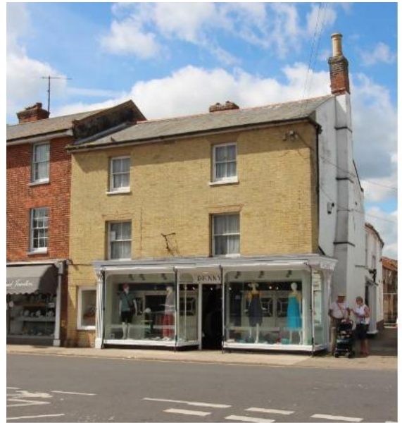
Nos.11 & 13 Market Place