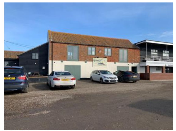
Former Warehouse, The Harbour Inn, Blackshore

Former Warehouse, Blackshore (Positive Unlisted Building). Reconstructed c.1997 to form kitchen and restaurant accommodation for the Harbour Inn Public House. Probably dating from the early 20<sup>th</sup> century, red brick elevations with rendered ground floor. The majority of openings to the river facing elevation are from the late 20<sup>th</sup> century conversion work. Red clay pan tile roof with upstand gable ends. This structure makes a positive contribution to the setting of the adjacent grade II listed Harbour Inn.