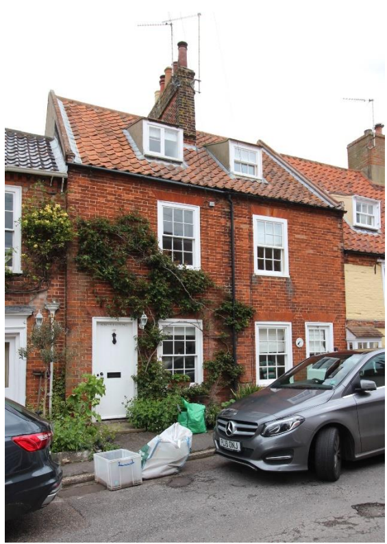
Nos.13 & 15 Park Lane