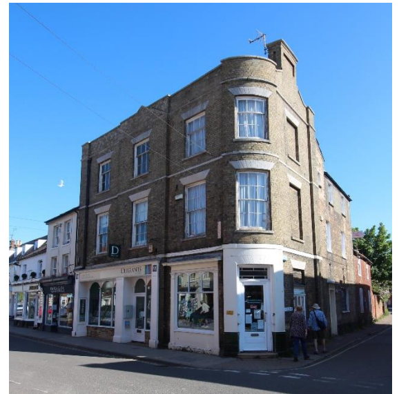
Nos.98-100 (even) High Street

Nos.98-100 (even) High Street (Grade II)