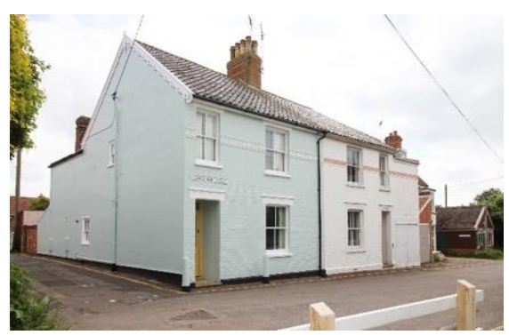
Westview (left) and Hillcrest (right), Gardner Road

Westview and Hillcrest, Gardner Road (Positive Unlisted Buildings). A stylish pair of late 19<sup>th</sup> / early 20<sup>th</sup> century houses. Painted brick to the entrance façade, rendered to the north. Attractive recessed open porches to either end of the principal façade, retaining stone steps and original part glazed doors. Decorative course of tiles (now painted) to the midpoint of the upper elevation, linking the first floor windows. Blue glazed pan tile roof covering with a red brick central stack to the party wall line. Both properties retain their original horned plate glass sash windows, which enhance both their character and that of the conservation area, and are set between stone lintels and sills, now painted. Two storey extension to the south of Hillcrest c.1920 and altered c.1960 to incorporate a garage. These houses form an important part of the backdrop to the open green space to the north west.