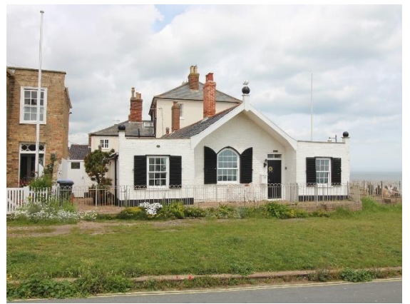
Whitehall, No.26 & Guardship, Saint James Green

'Whitehall', No.26 & Guardship, Saint James' Green (Grade II)