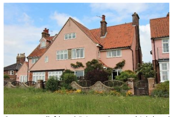
Commoners (left) and Fairway Cottage (right) and boundary wall, gate and timber screen, The Common

Spinners Cottage and Ropewalk Cottage – See Spinners Lane