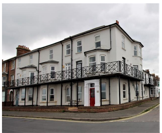
'Craighurst' Nos.11-13 (cons) North Parade

No.7 North Parade (including Balmore Cottage No.1A Chester Road) and Nos.8-10 (cons) North Parade. (Positive Unlisted Buildings). Seafront terrace built on plots sold by Southwold Corporation in 1885 with the proviso that a house costing no less than four hundred pounds should be constructed upon each. The completed terrace appears on a photograph taken on the 18th of October 1893 from the lighthouse tower (Museum collection). All the terrace houses are described as either lodging or boarding houses in the 1911 census. Red brick with gault brick dressings and a Welsh slate roof. Plate glass sashes. The rear wing of No. 7 was sensitively converted into a separate dwelling in the late twentieth century and extended around the same date. It now forms No.1A Chester Road. Late twentieth century dwarf wall to Chester Road. John Miller Britain in Old Photographs: Southwold (Stroud 1999) p83.