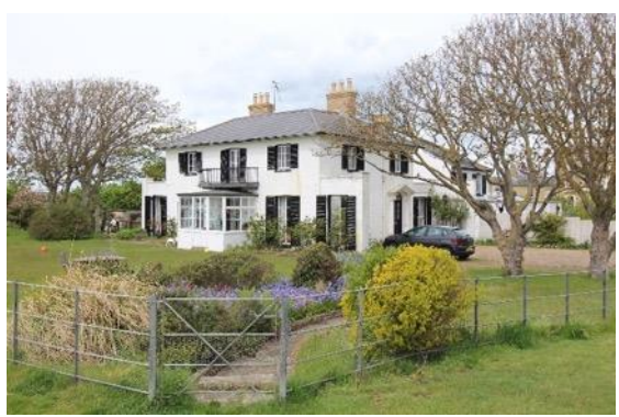
Gun Hill Place, Gun Hill