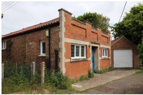
Church Hall, Manor Park Road

Wymering Road. Addition to the southern end of No.3 makes an attempt to repeat existing details.