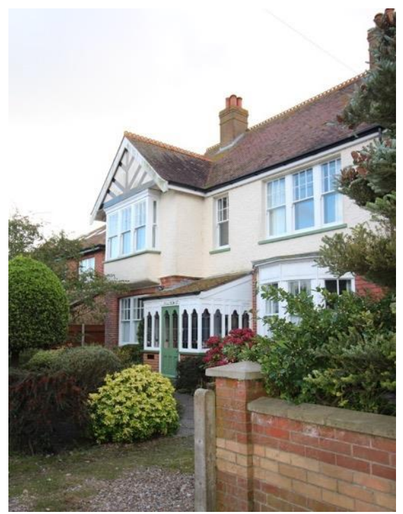
No.67 North Road

The Willows, No.66 North Road (Positive Unlisted Building). A well-preserved detached villa of c.1910 with display facades to North Road and Marlborough Road. North Road elevation of red brick with a rendered first floor and tile hung full height canted bay. Original heavy wooden sashes divided by mullions with small panes to the upper part of the sash. Plain tile roof with decorative finials to ridge and decorative overhanging eaves. Red brick stacks to ridge. Glazed front door to Marlborough Road façade now within later glazed flat roofed porch. Ground floor hung with decorative tiles; first floor rendered. Later flat roofed dormer. Southern return elevation gabled with applied timber framing to apex of gable.