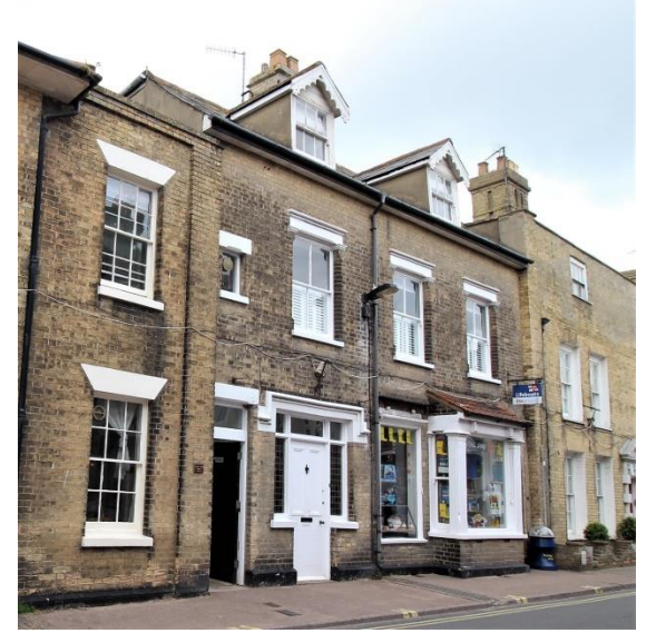
Evington, No.5 Queen Street