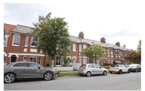
General view of Nos.5 to 19 (odd) York Road

Recessed entrance porches with half round brick lintel over; some of the porches now enclosed. The terrace retains an almost complete run of horned plate glass sash windows, only No.2 has replacement uPVC windows, which are unsympathetic. Small front gardens make a positive contribution to the conservation area, as do original tile paths, where retained. The terrace is little altered and prominent in views looking into and out of the western boundary of the Conservation Area.