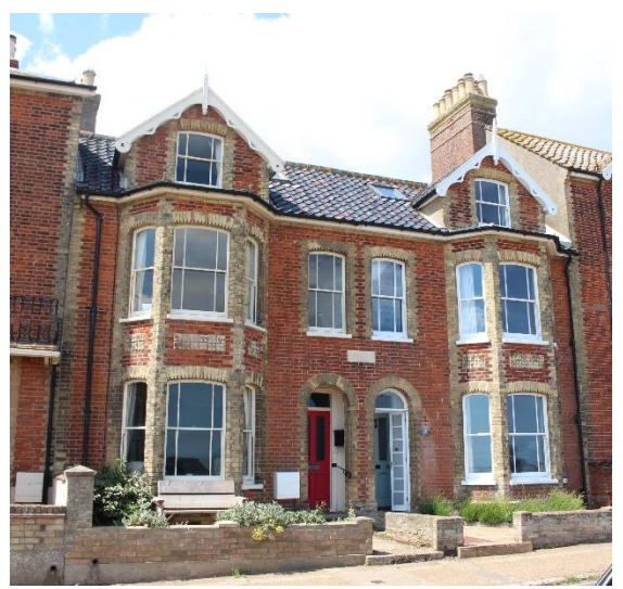
Nos. 3 & 4 North Parade

Nos.1 & 2 North Parade (Positive Unlisted Buildings). Semi-detached pair of villas built of red brick with elaborate gault brick dressings. Built sometime between the publication of the 1891 and 1904 Ordnance Survey maps. Nos.5-9 (Odd) Dunwich Road are of a similar design. Hipped Welsh slate roof with overhanging eaves. Decorative first floor balcony of cast iron resting on canted bay windows beneath. Original partially glazed front doors preserved within linked arched surrounds. Original horned plate-glass sashes throughout except to French doors to balcony which are less sympathetic visually. Rendered southern return elevation. Low gault brick garden wall of similar date to front. Nos.1 & 2 make a strong positive contribution to the setting of the Grade II listed lighthouse.