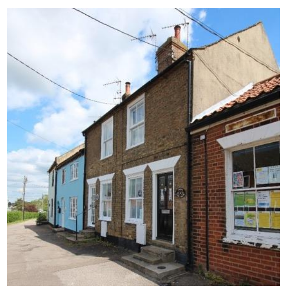
Well Cottage, No.3 and Olivers, No.4, North Green

No.2 North Green (Positive Unlisted Building). Rendered red brick cottage probably of early to mid nineteenth century date with red pan tile roof. Modern fenestration and front door.