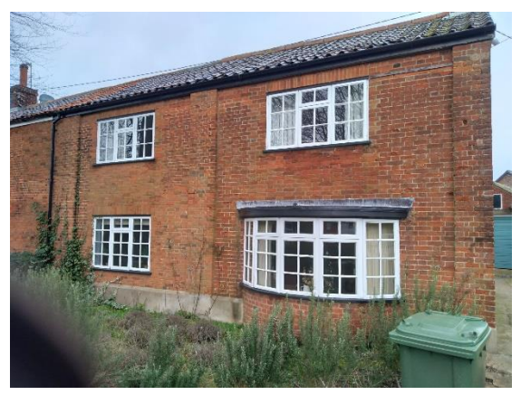
No.6 North Green