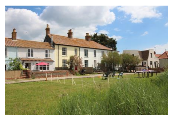
No's 1, 2 and 3 (inc) Blackshore Cottages, Blackshore

No.4 (right) and No.5 (left), Blackshore (Positive Unlisted Buildings). A pair of early 19<sup>th</sup> century cottages (they appear to be shown on a Parliamentary Boundaries Commission map of 1837). Painted brickwork elevations, with dentil eaves course and red clay pan tile roof covering. Red brick ridge stack marks the position of the party wall between the two properties. Brick upstand gable to the north west end, with a further stack. Both properties have single storey extensions with pan tiled roofs to the river facing elevation. Window joinery is modern but within the existing openings. The cottages form an attractive group with No's 1, 2 and 3, and their elevations are highly visible from the river and also from the marshes and town to the north east. Rear additions and alterations rather dilute the quality of the elevation as seen from York Road.