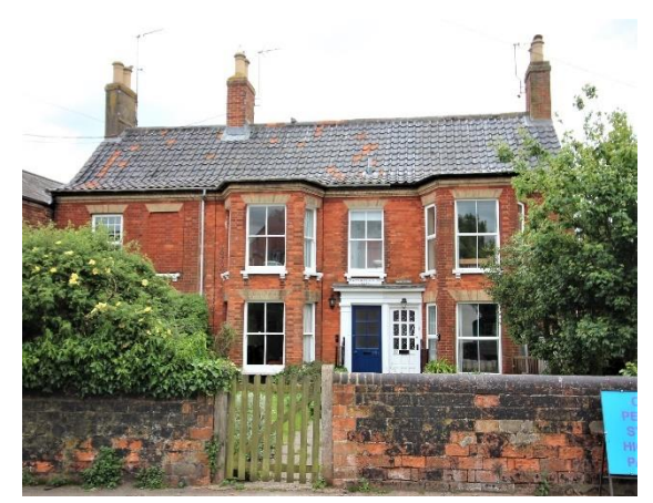
Nos.39, 39A and 41 Victoria Street

semi-circular plate-glass fanlights. St Edmunds Terrace makes a strong positive contribution to the setting of the listed buildings on Bartholomew Green onto which it faces. (Collins, Ian Artists in Southwold (Norwich, 2005) p58-59).