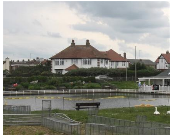
No.72 North Road

No.72 North Road (Positive Unlisted Building) A substantial detached villa of the early 1920s (shown on 1925 Ordnance Survey map) built to exploit views out to sea and over the marshes and dunes to the northeast. Facades to North Parade Gardens and North Road. No.72 is visible from the north side of the pier between the beach front huts. It is rendered with a hipped plain tile roof and red brick quoins. Two red brick ridge stacks. Central single storey plain tile roofed porch flanked by windows. Canted bays to first floor with casements Window joinery replaced. below. Return elevation to North Road of two bays and again with brick quoins. Despite the unfortunate replacement of its window joinery No.72 remains an inventively designed villa which occupies a highly prominent site.