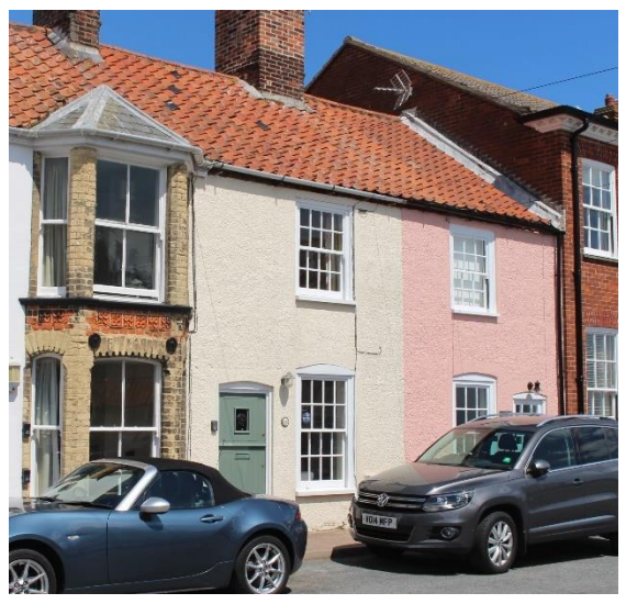
Nos.18 & 20 St James Green

Nos.14 & 16 St James Green (Positive Unlisted Buildings). Part of an early nineteenth century red brick terrace also comprising Nos. 18 & 20. Canted bay windows of red brick with Suffolk white brick dressings were added c.1890. Heavy replacement sashes to No.14. The remainder of the façade was later rendered. Red pan tile roof. Early nineteenth century door openings with shallow brick arched lintels survive but with later twentieth century partially glazed front doors.