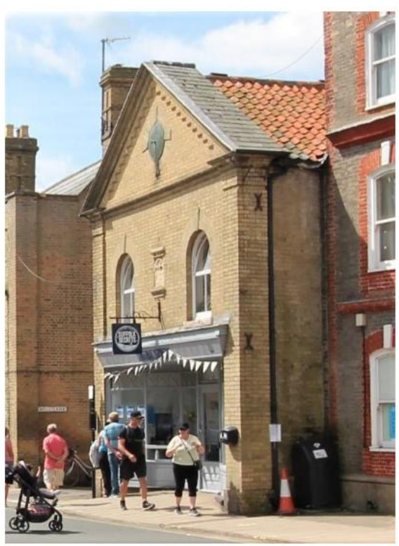
No.19 Market Place

Former Lloyds Bank, No.17 Market Place (Grade II*)