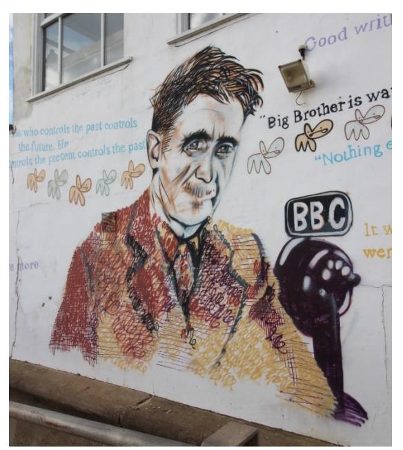
Mural of George Orwell, Pier Pavilion

In 1934 the end of the pier was swept away in a storm, and a further section was dismantled during World War Two. After the war the pier was rebuilt, but sections were also destroyed in 1955 and 1978. In 1960 the ground floor of the pavilion was converted into a public house called the Neptune Bar, it closed c.1984. The concert hall pavilion was restored in 1987 and the pier was reconstructed between 1998 and 2002 with new pavilions and stylish bench shelters designed by Southwold architect Brian Howard added. The pavilions reflected the form of the original pavilion of 1900. A water clock was added in 1998 designed by Tim Hunkin and Will Jackson.