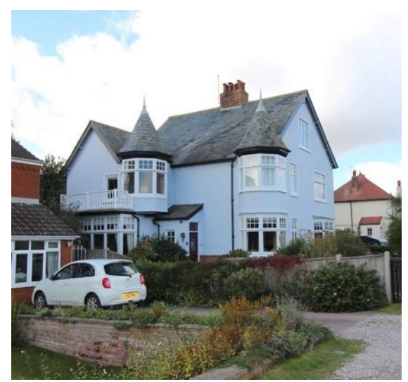
The Turrets No.71 North Road

house of c.1912 probably designed by Edward Charles Homer (1845-1914) who also designed villas on Pier Avenue. It was built to exploit views over Buss Creek to the north. Rendered with applied timber framing to the first floor. Hipped plain tile roof with decorative ridge pieces and finials. Projecting stack to centre of façade with terracotta plaque bearing the name of 'Creek House'. Original window joinery preserved. Plate glass sashes divided by a central mullion with small pane upper lights.