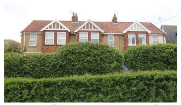
High Bank (left), Mount View and Kintyre (right), Station Road

See Bettley, J and Pevsner, N The Buildings of England, Suffolk: East (2015), p.523.