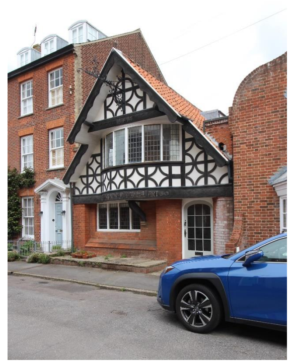
'The Studio'. No.1 Park Lane