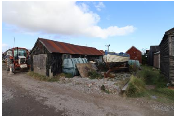
Justin E Ladd Store, Blackshore