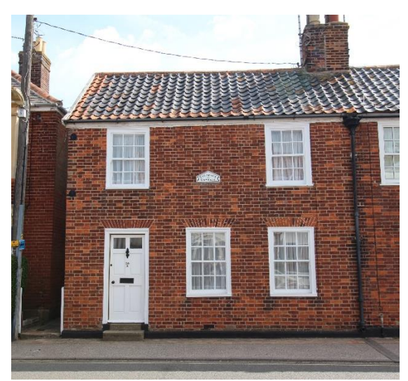
Sycamore Cottage No.26A High Street

Sycamore Cottage, No.26 A High Street (Positive Unlisted Buildings). House, probably of early nineteenth century date, latterly office and now again a dwelling. Red brick with a weatherboarded northern return wall, and a black glazed pan tile roof. Façade possibly at least partially rebuilt. Twelve-light sashes beneath wedge-shaped lintels. Ridge stack rising from spine wall with No.28. Forms part of a short terrace with Nos. 28 & 30