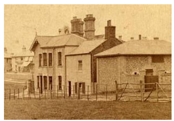
Historic view (undated), showing Gun Hill Cottage when in use as a stable and loft.

Bonsey House, No.30 South Green (Positive Unlisted Building). Named after a former resident who ran a kindergarten from the property during the mid to later 20<sup>th</sup> century. A late 19<sup>th</sup> century three storey house built from Suffolk white brick, constructed following the motifs of the neighbouring property (No.28). Two storey canted bay window with slate covered roof and expressed stone keystones to window heads. Plate glass sash windows and entrance to the left of the bay. Scalloped bargeboards supported on brackets, with central finial. Slate covered roof. Taller than its immediate neighbour and with its gable end facing the green it presents an imposing façade.