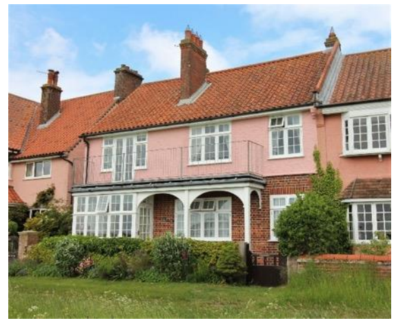
Crombie House, The Common

The wall continues to the north as a taller cobble wall, all of which makes a very positive contribution to the setting of the houses and the conservation area.