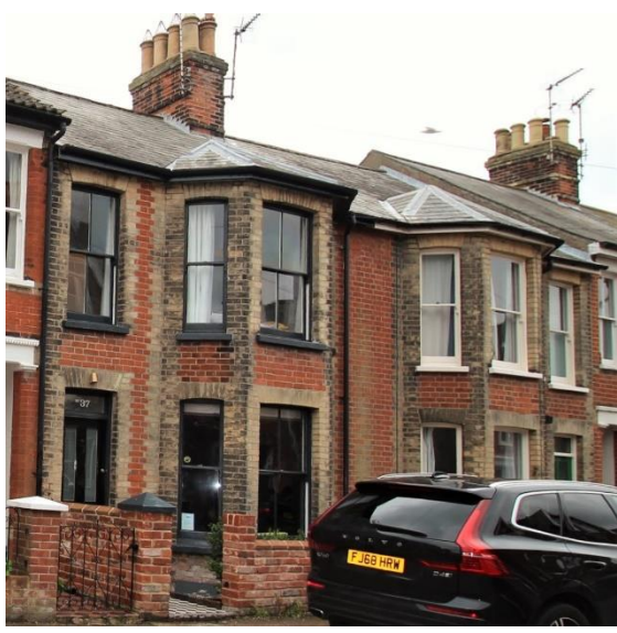
Nos.35 &37 Stradbroke Road

brick dressings and a Welsh slate roof. Central ridge stack rising from the spine wall between the two properties. Two storey canted bays with decorative tile insets at first floor level and a dentilled eaves cornice. Original horned plate-glass sashes. Recessed porches containing partially glazed original doors. The red brick dwarf boundary wall to Stradbroke Road appears to have been rebuilt.