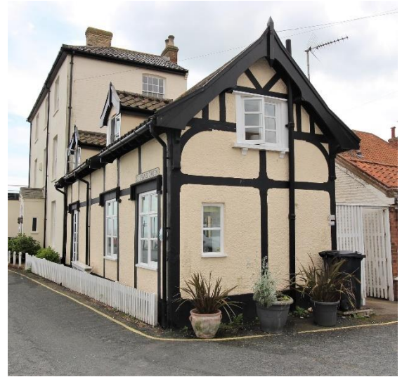
Seaview Cottage, East Cliff

Seacroft, No.19 East Cliff (Positive Unlisted Building). A double pile plan central range of the buildings attached to the rear of Seaview House. At the time of the 1905 Ordnance Survey map this was part of the present No.21 St James Green, but the two were separated before the publication of the 1927 1:2,500 Ordnance Survey map. A much altered early to mid-nineteenth century red brick structure which is now largely rendered and of early twentieth century appearance. The alterations were probably undertaken around the time of its subdivision into two dwellings. Tile hung and gabled twentieth century roof top addition.