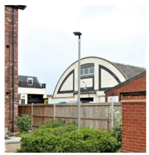
Unit 20 Southwold Business Centre, St Edmunds Road

Unit 20 Southwold Business Centre, St Edmunds Road The former Drill Hall, now known as Unit 20 Southwold Business Centre, was constructed in 1937 and has an innovative prefabricated 'Lamella' roof structure. Its geodetic barrel roof suggests that it would probably have been designed to have the capability to store anti-aircraft weaponry and vehicles as well as for its principal function as a