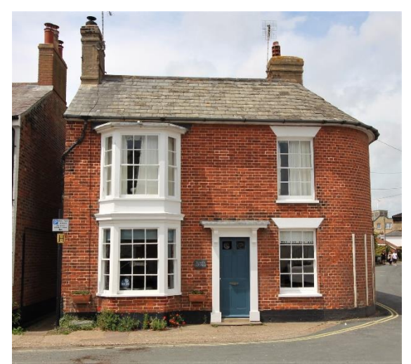
Trinity Cottage, 12 Trinity Street

Trinity Cottage, 12 Trinity Street (Grade II)