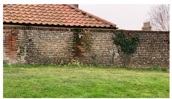
Boundary Wall to Castle Keep, Skilmans Hill

Boundary Wall to Castle Keep, Skilmans Hill (Positive Unlisted Structure). A coursed washed cobble wall with red brick capping course, rising to square section brick piers. Probably dating from the later 19<sup>th</sup> century, although the piers look later. The wall makes an important and highly visible contribution to the south east side of Skilmans Hill as well as the properties facing Constitution Hill.