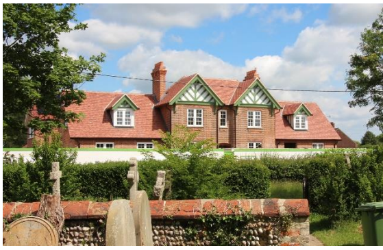
Former Hospital, Field Stile Road

No.10A Field Stile Road (Positive Unlisted Building). Former farmhouse of c.1800 associated with the Town Farm whose lands were sold by the Corporation for development in 1899. At the time of the 1881 census the farm was comprised of 46 acres. Its farm buildings disappeared gradually during the opening decades of the twentieth century. Of red brick with a Welsh slate roof. Symmetrical three bay two storey principal façade with a blind decorative recess in the form of a window opening above the central front door. Twentieth century partially glazed front door with rectangular fanlight. Twelve light hornless sashes below plaster faced wedge shaped lintels. The house plays an important role in the setting of the Grade I listed parish church which is located directly to its south. Good twentieth century dwarf red brick walls to frontage. The attached later twentieth century property to the north does not contribute positively to the conservation area.