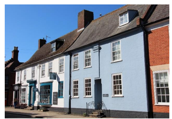
Nos.49-51A (Odd), High Street

Wymering House, No.47 High Street (Positive Unlisted Building). A purpose-built doctor's surgery and dwelling of c.1895 of three storeys with a twostorey wing. Faced in red brick with painted stone dressings. Welsh slate roof with exaggerated overhang to eaves on three storey section, supported on carved brackets. Red brick ridge stacks. Plate-glass sashes. House with two storey canted bay window flanked by recessed porch with heavy and elaborately carved stone hood. Projecting surgery wing with decorative parapet and arched windows with corbelled hoods and pronounced key stones. Recessed porch with heavy stone hood supported on decorative corbels and flanked by arched windows. Glazed screen containing door within. Rear elevation more restrained with small late twentieth century single storey brick addition. Wymering House remained a Doctor's Surgery until the late 1950s. Its upper floor sustained bomb damage in 1943.