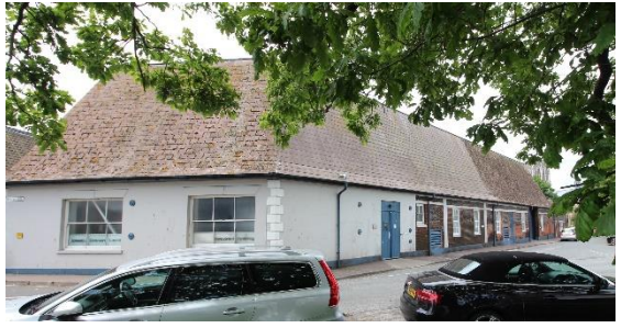
East Green façade of former maltings complex

the present steeply pitched roof slope blocking views of the lighthouse shown in photographs. Office range frontage to East Green now without historic door openings. See NMR photographs of c.1967 taken by Rex Wailes.