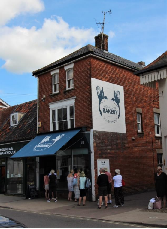
No.88 High Street

No.88 High Street (Positive Unlisted Building). Commercial building of red brick with a black glazed pan tiled roof, which was probably constructed during the third quarter of the nineteenth century. First floor canted bay window visible on c.1900 photos replaced by a large tripartite shop window in the early-twentieth century. Two light plate glass sash windows to second floor. c.1900 shop facia retaining notable mosaic advertising panel to floor of central recessed entrance reading Stead and Simpson. An important component in the setting of flanking listed buildings to the north and south.