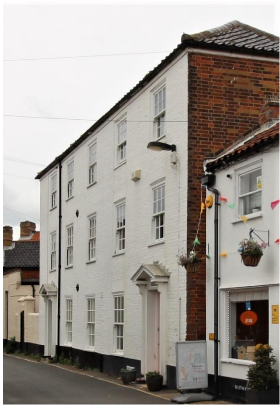
Nos.11 & 13 Pinkneys Lane

tile roof. Probably mid nineteenth century. Four light sash window to first floor. Pre 1949 shop window opening to the ground floor (shown on a National Monuments Record air photo of that year (EAW024298)). Partially glazed late twentieth century door. Later twentieth century single-storey flat roofed retail addition of unsympathetic design.