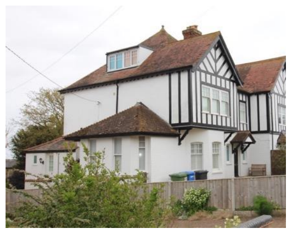
Holly House, No.80 Pier Avenue

Holly House, No.80 & No.80A Pier Avenue (Positive Unlisted Building). A substantial early twentieth century villa (Shown on an auctioneer's plan of 1919, but not amongst the plots sold in the first sale in 1899) of rendered brick with applied timber framing now subdivided into two semidetached dwellings. Originally called Grey House and until the later twentieth century painted in the same style as Nos. 60 and 62 Pier Avenue. Like these houses it may also have been designed by Edward Charles Homer (1845-1914) Holly House has a panelled front door beneath plain tile hood supported on decorative carved brackets. Original sash windows with small pane upper lights largely preserved. Rendered rear elevation retaining original window joinery to upper floor. This and the adjoining house were damaged in World War Two when the house opposite was completely destroyed in a bombing raid. Early photographs show it with a single storey lean to porch to the centre of the façade. A Barrett Jenkins, Reminiscences of Southwold in Two World Wars (Southwold, 1984) p60-62.