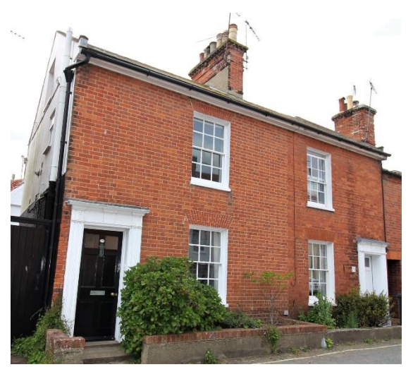
Nos.75 & 77 Victoria Street

Twitten Cottage No.71 & Cygnet Cottage, No.73 Victoria Street (Positive Unlisted Buildings). A pair of small early nineteenth century red brick cottages with black pan tiled roofs (replacing Welsh slate). Substantial ridge stack rising from spine wall between the cottages. Late twentieth century pilastered doorcases, over original simpler openings with wedge-shape rubbed brick lintels similar to those of the adjoining windows (See 1949 NMR photograph BB49/3097). Twelve-light hornless sashes beneath wooden lintels at first floor level. The cottages make a strong positive contribution to the setting of the Grade II listed Nos. 75 & 77. Miller, John Britain in Old Photographs, Southwold (Stroud, 1999) p98.