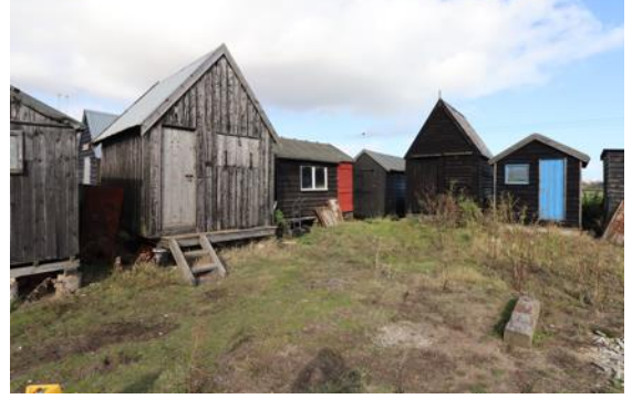
W4 to W8, Blackshore

Former Warehouse, Blackshore (Positive Unlisted Building). Reconstructed c.1997 to form kitchen and restaurant accommodation for the Harbour Inn Public House. Probably dating from the early 20<sup>th</sup> century, red brick elevations with rendered ground floor. The majority of openings to the river facing elevation are from the late 20<sup>th</sup> century conversion work. Red clay pan tile roof with upstand gable ends. This structure makes a positive contribution to the setting of the adjacent grade II listed Harbour Inn.