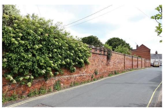
Garden Walls to The Elms and No.9B Lorne Road

Nos.7 & 9 Lorne Road (Positive Unlisted Structure). Post-war structures, they have been identified due to their sensitive design which permits them to integrate harmoniously with their surroundings, including their traditionally designed fenestration.