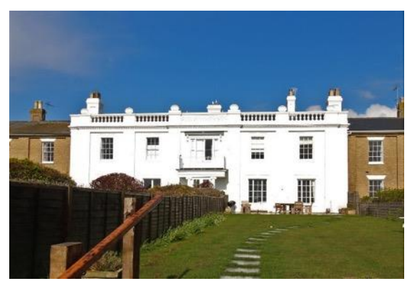
Nos.1 & 2, Centre Cliff, South Green

South House, No. 12 South Green (Grade II)