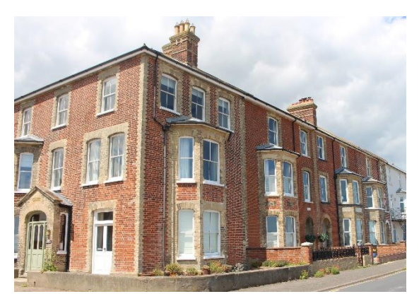
Nos. 7-10 (cons) North Parade

Nos. 5 & 6 North Parade including 'Dobcott' Chester Road (Positive Unlisted Buildings). A pair of substantial houses which probably date from the early 1890s. Of red brick with gault, or Suffolk white brick dressings. Original Welsh slate roof replaced with pan tiles, ornate bargeboards with spear finials to gables and overhanging eaves. Original four light plate-glass sashes largely retained but No.5 has French doors above its ground floor bay window. Arched door openings. Low boundary wall to No.5 of gault brick whilst that to No.6 is of red brick.