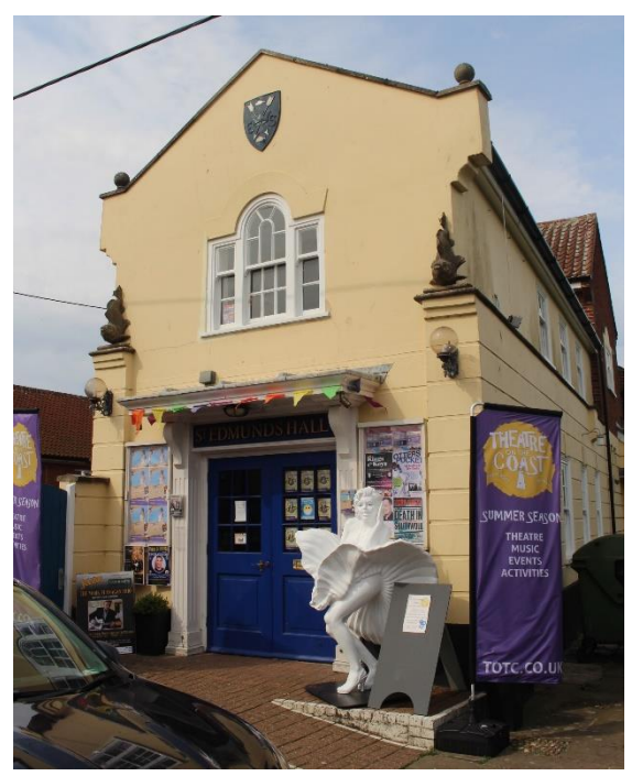
Southwold Arts Centre, Cumberland Road

Southwold Arts Centre, St Edmunds Hall, Cumberland Road (Positive Unlisted Building). A public hall of 1934 which was originally faced in red brick with concrete lintels. It was badly damaged in a bombing raid in 1941 and rebuilt 1952 to the designs of the Borough Surveyor JS Hurst. The hall was again remodelled, and its rendered classical frontage range added c.1989-92 to designs by the Southwold architect John Bennett. A prominent landmark at the northern end of the Old Town character area which plays an important role in the wider setting of the Grade I parish church.