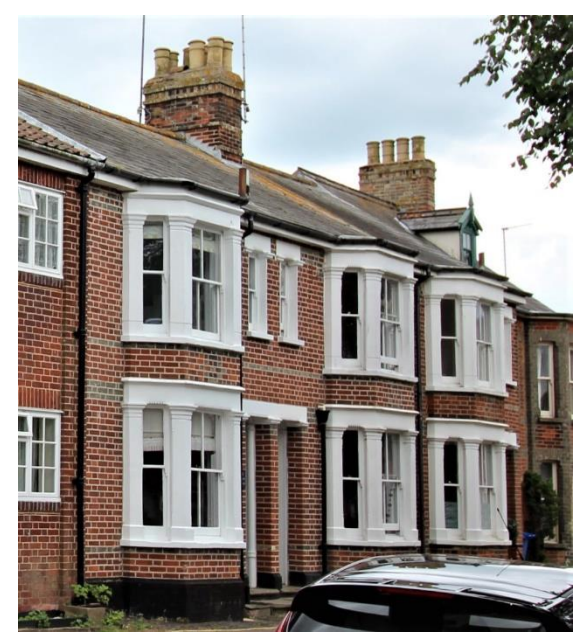
Holmes Cottages, Nos.13-15 (cons) Bartholomew Green

Nos.9-12 (cons) Bartholomew Green (Positive Unlisted Buildings). Part of a well-designed Southwold Corporation development of the early 1950s which replaced property destroyed in World War Two. It overlooks the churchyard. Probably designed by Cautley and Barefoot of Ipswich and playing an important role within the setting of the Grade I listed parish church. Red brick houses with pan tile roofs designed in a restrained Tudorvernacular style, No.12 with crow-stepped gables. Small paned casement windows. Original partially glazed front doors survive beneath painted wooden bracketed hoods. Drawings by Cautley and Barefoot for housing at Bartholomew Green dating from between 1950 and 1953 survive in the Ipswich Branch of Suffolk Record Office but were not accessible at the time of survey (Ipswich Record Office HG400/2/468). See also Hope Cottages.