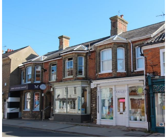
Nos.68-72 (even) High Street

Nos.68-72 (even) High Street (Positive Unlisted Buildings). A short terrace of later nineteenth century shops and dwellings faced in red brick with Suffolk white brick dressings. Welsh slate roof with ridge stacks rising from the spine wall between the