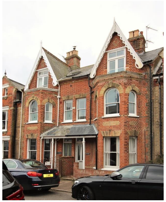
'Lighthouse View' No.46 & 'Arlington' No.48 Stradbroke Road

Brightmer Villa No.40, Spindrift & Driftwood Flats 1 & 2, No.42, and No.44 Stradbroke Road (Positive Unlisted Buildings). A terrace of three substantial houses of two storeys with attics which probably date from c.1890. Shown on a photograph dated 13<sup>th</sup> October 1893 in the Southwold Museum collection. Of red and Suffolk white brick with painted stone dressings, Welsh slate roofs and heavy dentilled eaves cornice. The brickwork to No.42 is sadly now painted. Each house is of two bays with a gable capped full-height bay which slightly breaks forward and also lights the attics. Horned plate-glass sashes to the ground floor. Tripartite sashes to first floor of break forward with two small sashes beneath a continuous lintel at attic level. The other windows are two light plateglass sashes. Doorways set within recessed porches. Panelled doors which are partly glazed with rectangular fanlights above. No.50 Stradbroke Road is of an identical design.