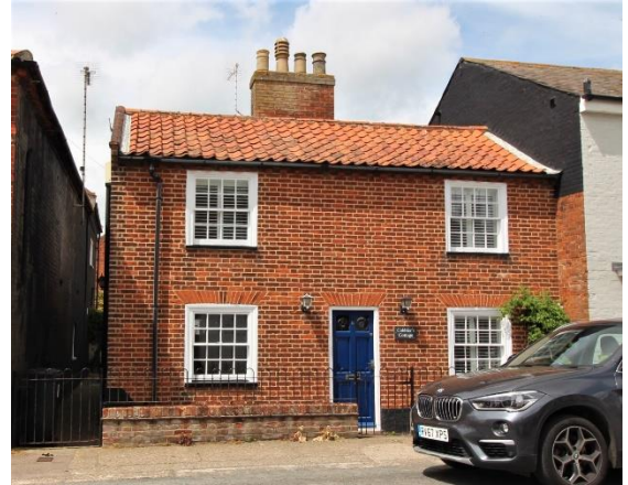
Cobbler's Cottage, No.8 Trinity Street