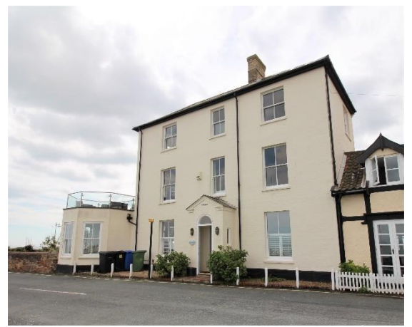
Seaview House, East Cliff

Seaview House, No.20 East Cliff (Positive Unlisted Building). A substantial sea front dwelling of three storeys which is attached at its rear to a further, and now much altered substantial nineteenth century villa (now Nos.19 East Cliff & 21 St James Green). A complex of similar form appears on Wake's 1839 map. The present Seaview House is probably of mid nineteenth century date and is rendered with a hipped Welsh slate roof slope to the front and a red pan tiled one to the rear. Three bay symmetrical entrance façade with horned plate-glass sashes. Single storey twentieth century canted bay addition to seaward end. Central gabled porch with arched doorway. Sea facing elevation has a two-storey canted bay window. Good nineteenth century red brick wall surrounding garden to east.