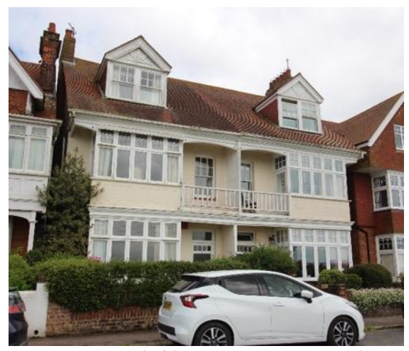
Waverley, No.3 (left) and West Lea, No.4 (right) Godyll Road

Windles and St Mary's House, Godyll Road (Positive Unlisted Building). A pair of late 19<sup>th</sup> or early 20<sup>th</sup> century villas, now a single house. Skillful and imaginatively composed and benefitting from much high quality joinery and detailing. A two storey red brick house with a pair of prominent attic gables; eaves supported on brackets with projecting windows also on brackets. To the ground floor are a pair of canted bays with original window joinery and above, and off-set to the extreme ends of the elevation, are a pair of flat-roofed bay windows. Linking the two is a balustraded balcony, supported below by timber columns on pedestal bases. Between each column is a gently curved soffit to the underside of the balcony. Historic photos show the first floor square bays to be later additions, and the brickwork to the first floor shows the scarring of further alterations. However, the house retains much original door, window and balcony joinery and makes a strong and highly visible contribution to view of the conservation area from the east.