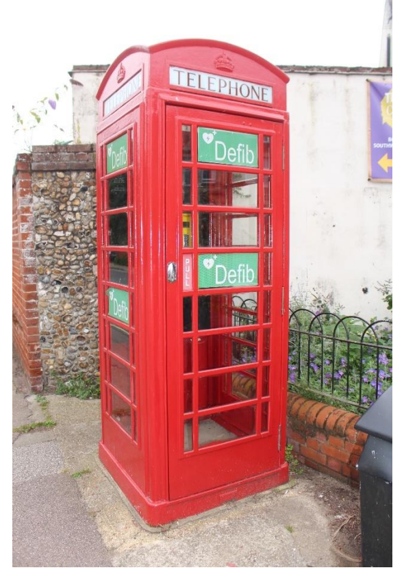
K6 Telephone Box, Victoria Street

See Also Crown Hotel, High Street (Grade II)