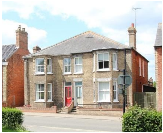
Nos.29 (right) and 31 (left), Station Road

Nos.29 and 31, Station Road (Positive Unlisted Building). White brick with red brick flank elevations (rendered to the south). Semi-detached pair of late nineteenth century houses, sharing many of the details seen in other houses on Station Road, but in slightly paired down form. Steps up to the entrances grouped to the centre of the front elevation, which is flanked by a pair of canted bay windows with flat roofs. Main roof of hipped pyramidal form, covered with Welsh slate. Good white brick stack to the return wall of No.29, with elaboratively corbelled cap, the stack to No.31 has been reduced in height. The houses retain their original plate glass horned sash windows, and the highly visible roof pitch is free from dormers or rooflights.