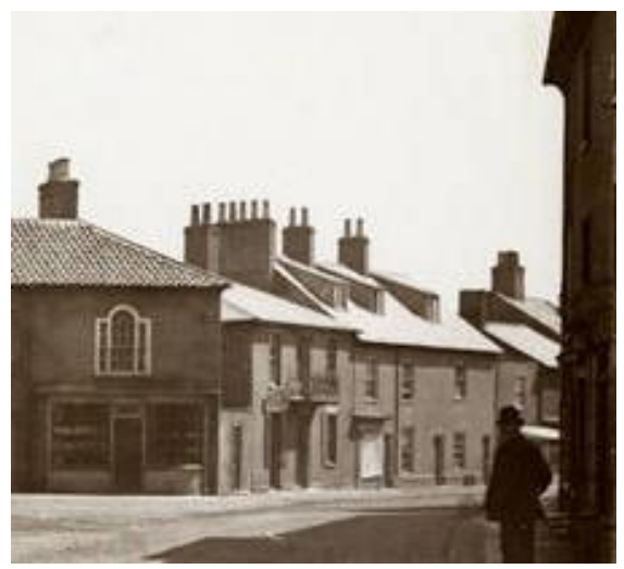
Nos.4-8 Queen Street before alteration a c.1900 view.