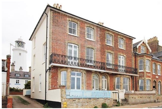
Nos.1 & 2 North Parade

Nos.1 & 2 North Parade (Positive Unlisted Buildings). Semi-detached pair of villas built of red brick with elaborate gault brick dressings. Built sometime between the publication of the 1891 and 1904 Ordnance Survey maps. Nos.5-9 (Odd) Dunwich Road are of a similar design. Hipped Welsh slate roof with overhanging eaves. Decorative first floor balcony of cast iron resting on canted bay windows beneath. Original partially glazed front doors preserved within linked arched surrounds. Original horned plate-glass sashes throughout except to French doors to balcony which are less sympathetic visually. Rendered southern return elevation. Low gault brick garden wall of similar date to front. Nos.1 & 2 make a strong positive contribution to the setting of the Grade II listed lighthouse.