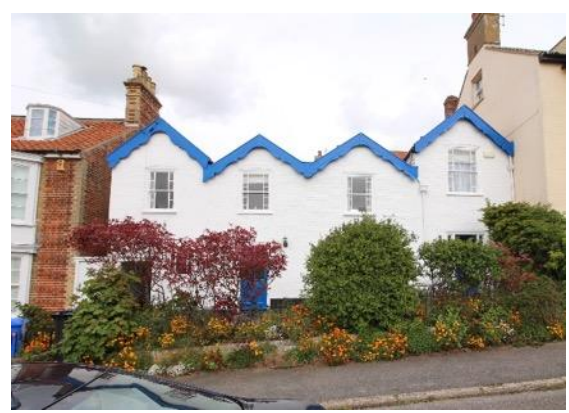
Iona Cottage No.11 and Iona Flat, No.11A Constitution Hill

Holly Lodge, No.9 Constitution Hill (Positive Unlisted Building). Late nineteenth century house. Painted brick with two storey canted bay. Entrance under a three-centered arch. Black glazed pan tile roof, with gable end stacks constructed from gault brick. The house retains its original un-horned plate glass sash windows. The attic dormer is a later addition.