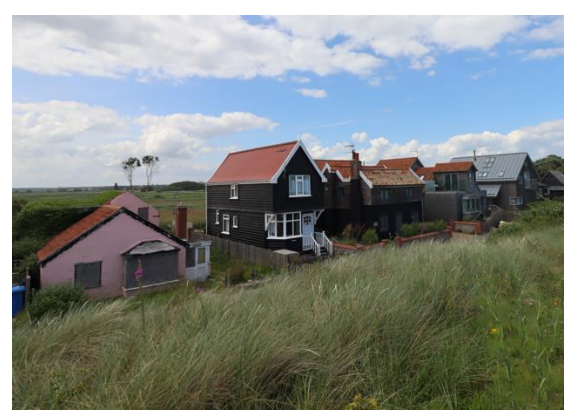
No.31 'Beach House', Ferry Road

No.29 'Weathervane', Ferry Road (Positive Unlisted Building). A modest fisherman's cottage constructed from washed cobble with brick margins, to which a first floor was added which was then remodelled, the upper floor clad in timber and bay windows and a porch were removed c.2014. Red pan tile roof covering, with three gable ends running from front to back, with a gable end brick stack to the southern end.