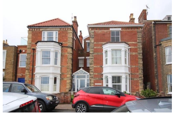
Flats 1-3 Rochester House No.11, & No.13 Marlborough Road

Flats 1-3 Rochester House No.11, & No.13 Marlborough Road (Positive Unlisted Buildings). A pair of substantial three storey houses of c.1890 which were partially rebuilt after considerable bomb damage in 1943. The neighbouring buildings to the immediate south were destroyed in the same raid. Red brick with gault brick quoins and dressings and a red pan tile roof. Horned plate-glass sashes with margin lights to canted bays. Three storeys with two storey canted bay windows a narrow recessed central range. Glazed later twentieth century porch. Dwarf red brick boundary walls to Marlborough Road. Jenkins, А Barrett Reminiscences of Southwold During Two World Wars (Southwold, 1984) p67.