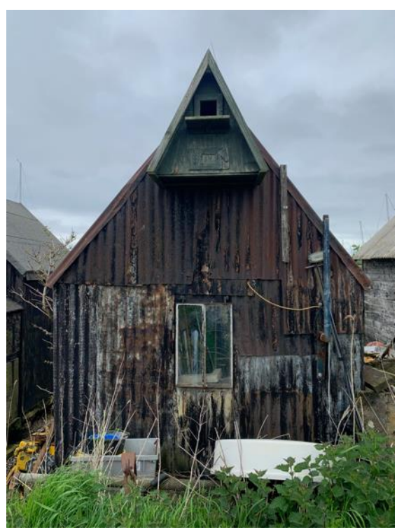
Detail of hut W14, north east elevation