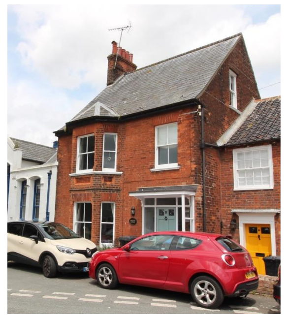
Rokeby Lodge, No.11 East Green

Rokeby Lodge, No.11 East Green (Positive Unlisted Building). A red brick villa of c.1900 with rubbed red brick dressings. The site of this dwelling is shown as vacant on the 1884 1:2,500 Ordnance Survey map but occupied by the present building by that of 1904. Full height canted bay window with horned plate-glass sashes. Steeply pitched Welsh slate roof. Front door opening modified in later twentieth century to allow glazed lights to be fitted surrounding the opening. Bracketed later twentieth century hood above. Twentieth century panelled door. Substantial chimney stack to northern gable. A prominent located house which despite alteration contributes to the setting of both the Methodist Chapel and listed buildings on St James Green.