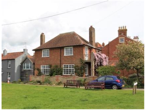
Ashleigh, Constitution Hill

Nos.13 and 15, Constitution Hill (Positive Unlisted Buildings). A pair of late nineteenth century houses, the design of which reflects the gradient of Constitution Hill. Red brick with white brick margins, canted two storey bays and entrances grouped to the centre of the elevation. Red clay pan tile roof covering, with a canted timber attic dormer to each property. Two storey side addition to No.15 built c.2012.