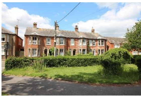
Nos.21-27 (Odd) Station Road

Nos.11 and 13, Station Road (Positive Unlisted Buildings). A pair of early twentieth century two storey cottages, with entrances grouped to the centres (now enclosed) and single plate glass sash windows to the outer edges of the elevation. Blue glazed pan tile roof, without dormers of skylights, with gable end red brick ridge stacks. The red brick elevations have attractive white brick horizontal bands to the heads and sills of the ground floor and first floor windows. Small front gardens enclosed by dwarf red brick walls.