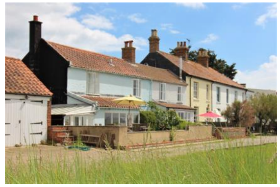
No's 4 and 5 Blackshore, Blackshore

Structures Which Make a Positive Contribution to the Blackshore Character Area