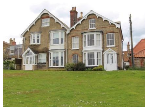
Poppy Cottage (left) and Caneway Cottage (right), Skilmans Hill

Castle Keep, Skilmans Hill (Positive Unlisted Structure). Behind the flint and brick boundary wall, only the roofs of the main house and outbuildings are visible. Hipped red pantile roof and black weatherboarding on main house. Provides a bookend to the line of buildings on the south side of Skilmans Hill.