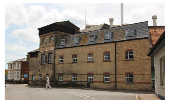
Adnams Brewery, Victoria Street

No.45 Victoria Street (Positive Unlisted Buildings). A radically altered later eighteenth-century house of painted brick which once formed part of a terrace, but which were incorporated into the Adnams Brewery complex before the publication of the 1971 1:2,500 Ordnance Survey map. Today its primary value is the contribution it makes to the setting of listed buildings on Church Street. Dentilled brick eaves cornice to No.45. Original door opening removed. Horned small pane sashes of probably later twentieth century date. One wedge shaped brick lintel at ground floor level. Largely blind gable end to Church Street, the gable itself rebuilt. No.45 was the St Edmund's Deaconess Nursing Home in the 1930s. No.47 (the lower section) has been entirely rebuilt.