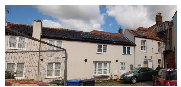
Rear of No.1 and Nos.7A & B Market Place

Nos.5 & 7 Market Place (Positive Unlisted Building). A mid nineteenth century rendered and painted brick shop with a black pan tiled roof. Nineteenth century shop facia to southern end of principal façade with a horned plate-glass sash above. Partially glazed front door to centre with wedge-shaped lintel. Bay window with small pane sash to first floor at northern end with mid twentieth century shop facia below. Return elevation gabled with casement windows which must be of relatively recent origins as early photographs show a further single storey small dwelling abutting the gable of Nos 5-7 within what is now the entrance to Child's Yard. Two storey nineteenth century rear range of painted brick with a red pan tile roof.