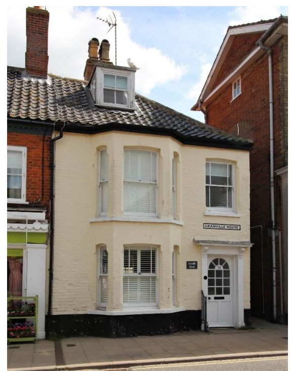
Granville House, No.78 High Street

Granville House, No.78 High Street (Positive Unlisted Building). Late nineteenth century façaded dwelling of now painted brick retaining its original plate-glass sash windows and bracketed wooden doorcase. Late twentieth century partially glazed front door of unsympathetic design. Black pan tiled roof of probably much earlier date with nineteenth century flat roofed dormer containing a four-light sash to High Street façade, rear roof slope of red pan tiles. The sash window above the front door has narrow margin lights. Rear elevation visible from Bank Alley of mid eighteenth century or earlier date. Gabled and rendered with nineteenth century plate-glass sashes. Probably originally part of the same building as Nos.74 & 76 which appear to be of a mid-eighteenth century or earlier date. An important part of the setting of adjoining listed buildings.