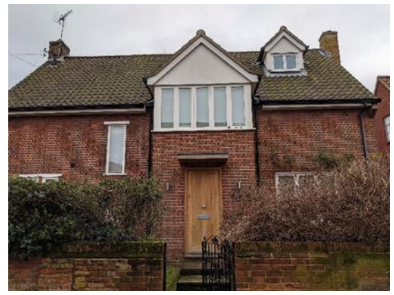
Pinkneys Way, Mill Lane

Garage to No.7 Queen Street (Positive Unlisted Building). Late-20th century small garage with gable to the street. Built of red brick with red pantile roof and dark stained waney edge timber gable. The structure contributes to the street through its modest Arts and Crafts inspired charm.