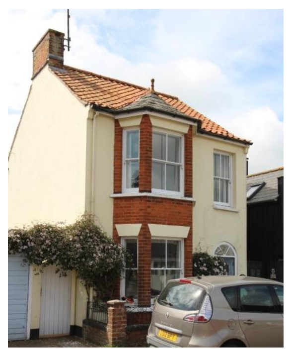
Martyn Lodge, No.1 Blackmill Road

c.2012 with additions made to the rear. The upper sash is a later insertion and the ground floor windows are replacements, originally the ground floor window to the centreline of the building was taller. Pan tile roof covering, with plain tiles to the porch addition.