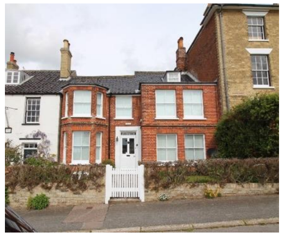
Tamarisk, Constitution Hill

Tamarisk, Constitution Hill (Positive Unlisted Building). Former public house 'The Tom and Jerry', the exterior being a re-facing in brick, completed c.1890 when the property was converted to domestic use. The timber framed core of the house, which dates from the mid seventeenth century was