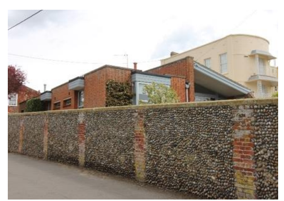
No.28 Park Lane, and boundary wall

No.28 Park Lane (Positive Unlisted Building). Designed during the 1970s by the architect Eric Sandon. Red brick with burnt headers single storey modernist house of the later 20<sup>th</sup> century. Flat roofed in part, with a raised spine wall supporting a mono pitched roof to the east. Projecting square bay window to the south with the boarding detail of the bay repeated over window openings as modest projecting canopies. The house completely ignores the forms and styling of neighboring properties, but achieves a respectful and subservient quality through its scale and understanding of a prominent site. Boundary walls of two phases; Suffolk white brick (facing Park Lane) and early 19<sup>th</sup> century cobble wall with red brick piers (facing Gardener Road), the latter built to enclose the western boundary of Park Villa. The walls contribute positively to the setting of the house and to the character area.