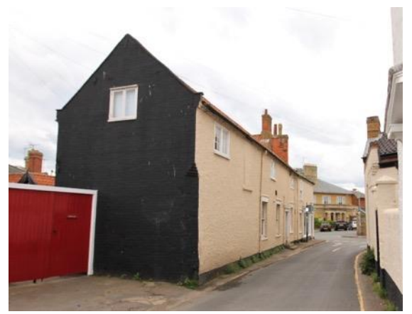
No.6 Pinkney's Lane

Red brick boundary wall, Pinkney's Lane (Positive Unlisted Building). Built using Monk Bond, and attached to the south west of No. 4. Pinkney's Lane. Probably of mid 19<sup>th</sup> century date, and raised in height where it abuts the south gable of No.4. Buttressed along its length and probably built to enclose the western boundary of land associated with Centre Cliff.