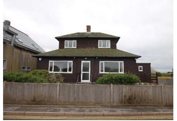
No.23 'Morningside', Ferry Road

Water trough, Ferry Road (Positive Unlisted Structure). Set within a washed coble wall with half round red brick cappings and chamfered bricks to the recess over the trough. Trough itself of stone construction.