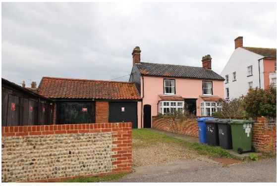
The Anchorage, No.14 Cumberland Road