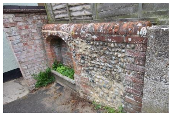
Water trough, Ferry Road

Retaining walls to Stone House, Gun Hill – (Grade II) see Stone House, Gun Hill