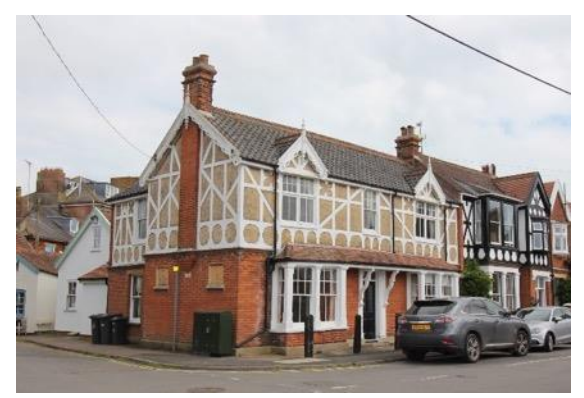
No.1, Manor Park Road

No.1, Manor Park Road (Positive Unlisted Building). A distinguished villa of 1906, located to the corner of Manor Park Road and Blackmill Road. Symmetrical principal façade with central entrance between elaborate timber brackets supporting a plain tiled roof that extends over flanking single storey bay windows. Exposed red brick to the ground floor and applied half timbering with render panels to the first floor, attractively detailed, with chamfer and quatrefoil panels. Elaborate carved and finialed bargeboards to the first floor gables. Black glazed pan tile roof with decorative ridge tiles. Red brick stacks to the north and south gable ends.