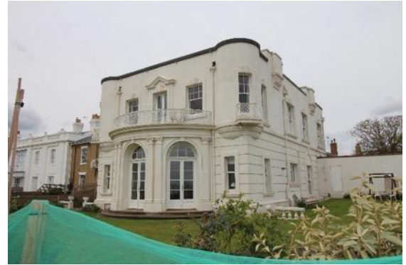
No's 4 & 5, Centre Cliff, South Green

No's 4 & 5, Centre Cliff, South Green (Positive Unlisted Building). Built as the Centre Cliff Hotel and designed by G.J. Skipper in 1899. A fusion of styles brought together with painted stucco. Upper two stories removed which has much diluted the impressive impact of the original design, and resulted in only one of the three storey corner bartizan towers being extant. However, sufficient remains, particularly to the ground floor, to hint at the full splendour of the original design. See Bettley, J and Pevsner, N The Buildings of England, Suffolk: East (2015), p.522.