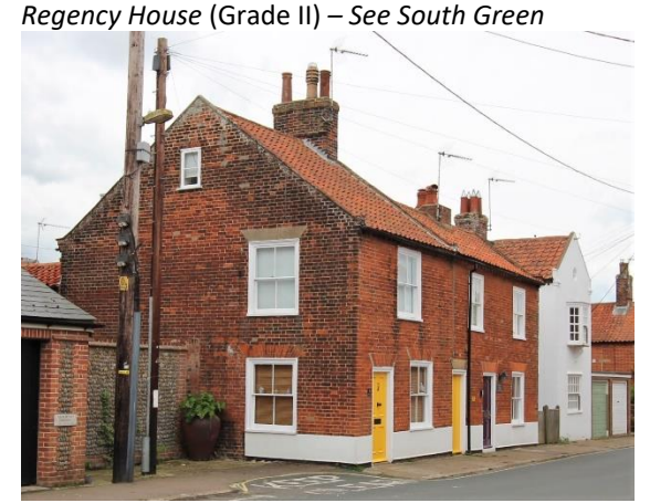
Nos.2 & 4 Lorne Road

No.2 & Stannard Cottage, No.4 Lorne Road (Positive Unlisted Buildings). Early nineteenth century red brick cottages with red pan tiled roofs. Plate-glass sash windows and panelled doors beneath wedge shaped lintels. High rendered plinth. No.2 may be slightly earlier in date than No.4 and there is a straight joint between the two properties. Eastern return elevation of No.2 gabled with hornless plate-glass sashes beneath wedge shaped lintels. Lower red brick rear range with red pan tiled roof visible from Lorne Road.