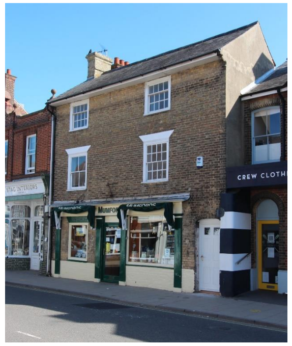
No.66 High Street

wood shop facia. Divided into two shops in the 1960s. Red brick with stone dressings and a Welsh slate roof. Plate-glass sash windows to first floor between pilasters capped with stone finials. One bay breaks forward slightly at first floor level and has an elaborate pedimented gable. Doorway at northern end to domestic accommodation recessed within glazed tile lined arched opening. With pronounced keystone. Original panelled door with fanlight above. Original glazed doors to shop facia.