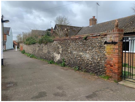
Boundary wall, to the south of Manor Lodge, Woodleys Yard

Boundary wall, to the south of Manor Lodge, Woodleys Yard (Positive Unlisted Structure). Washed cobble and flint wall, with red brick piers and capping. Probably dating from the early 19<sup>th</sup> the wall makes a positive contribution to the character of Woodleys Yard.