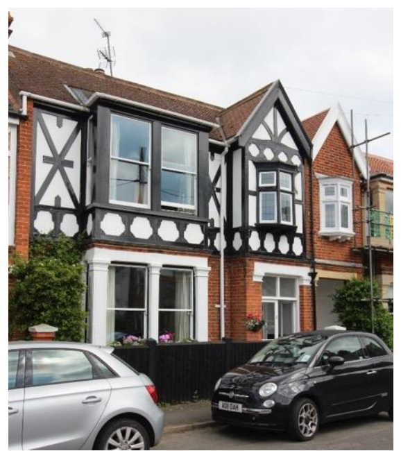
Nos.2 (left) and 3 (right), Manor Park Road

This house makes an extremely positive contribution to the character area and setting of neighbouring properties and exists in an unusually unaltered state.