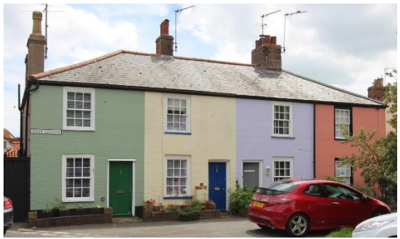
Nos.3-6 (cons) East Green