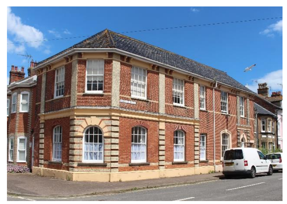
No.11 Chester Road

Nos.7 & 9A-9C Chester Road (Positive Unlisted Buildings). A pair of houses built on plots sold by Southwold Corporation in 1885 with the provision that houses costing no less than three hounded pounds should be built upon them. Map evidence suggests that they were built between 1891 and 1904, whilst at least two houses were occupied by the time of the 1891 census. They are similar in design to No.4 Dunwich Road. Save for No.16, the houses on Chester Road were probably constructed by the same builder. Red brick with elaborate gault brick dressings and pilasters. Two storeys and two bays with original horned plate-glass sashes. Reroofed in black pan tiles. Small red brick stacks rise from the spine wall between the two properties. Partially glazed front doors beneath arched fanlights. Railings removed. John Miller Britain in Old Photographs: Southwold (Stroud 1999) p87.