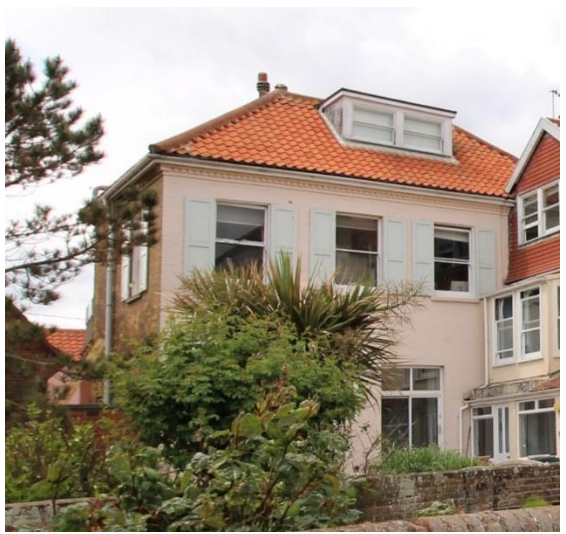
No.21 St James Green

No.19 St James Green (Positive Unlisted Building). Early nineteenth century cottage with twentieth century alterations. Rendered brick façade of a single bay containing canted bay window to the ground floor and a twelve light hornless sash above. Front door in return elevation. Single storey range of nineteenth century pan tiled roof outbuildings attached to western side elevation. Of painted brick with a largely blind rear elevation to the garden of No.17.