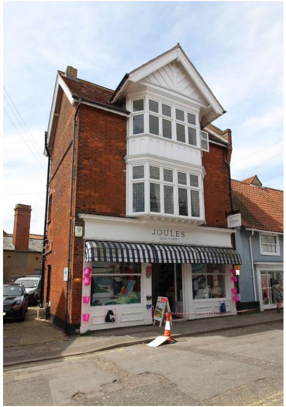
No.5 East Street

Nos.1 & 3 East Street (Grade II)- See No.25 Market Place (East Side).