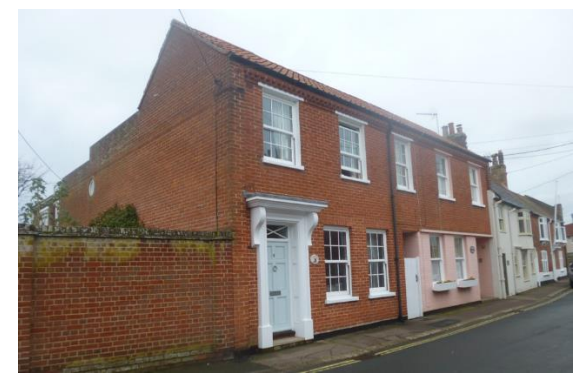
Nos.7 & 9 Lorne Road

'The Snug', No.5 Lorne Road (Positive Unlisted Building) Cottage with rendered red brick façade to Lorne Road and black glazed pan tile roof. Three plate-glass sashes of probably twentieth century date to ground floor beneath a single elongated hood mould. Canted bay window with mullioned and transomed casements to first floor. Partially glazed twentieth century front door. Some similarities with No.8 Queen Street however this façade was remodelled in the mid twentieth century only the western bay remining as built.