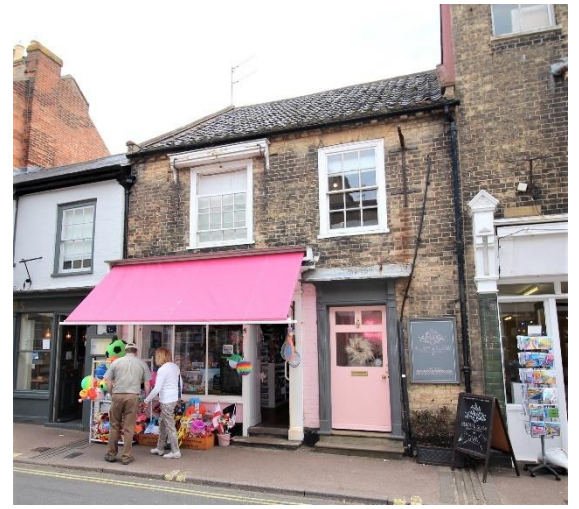
No.14 Queen Street