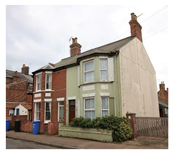
Nos.2 & 4 Salisbury Road

No. 9 Salisbury Road (Positive Unlisted Building). Similar in design to Nos. 1-7, yet lacking ornamental features such as polychrome brickwork. Modern fenestration.