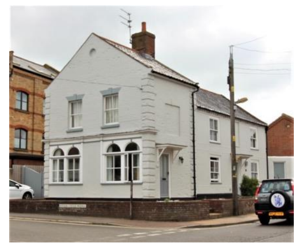
No.2 High Street, Field Stile Road elevation