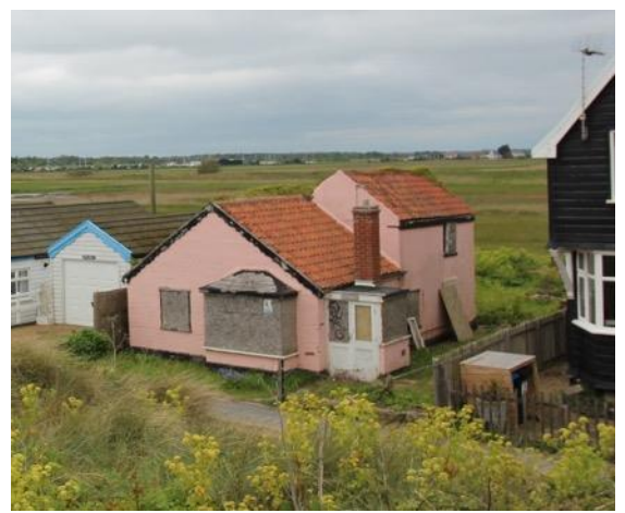
No.33 'Kilkee', Ferry Road

gable end carried out over a canted bay to the ground floor, creating a small covered entrance area and supported by timber brackets. Roof covered with unusual diamond pattern red roof tiles. Replacement uPVC windows, but the entrance door appears to be original.