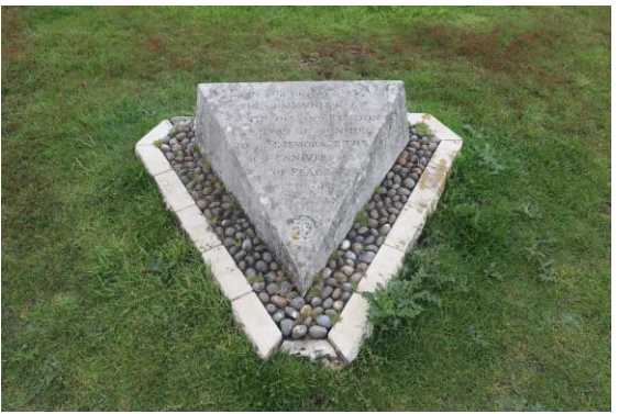
Detail of VE and VJ 50<sup>th</sup> Anniversary Commemorative Stone, Gun Hill

Mast and VE and VJ 50<sup>th</sup> Anniversary Commemorative Stone, Gun Hill (Positive Unlisted Structures) White painted timber mast with triangular Portland stone tablet commemorating 50 years of peace in Europe and Japan. Provided by the communities of Southwold and Reydon who gathered on Gun Hill on the 8<sup>th</sup> May 1995 to mark the occasion. Decorative cobble border itself contained with stone edging.