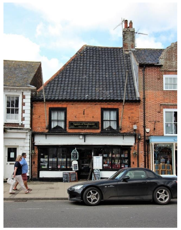
No.71 High Street

Old Banke House, No.69 High Street (Grade II)