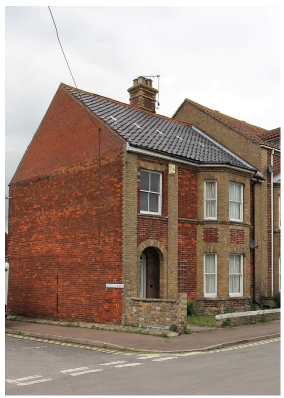
'Avondale', No.11 Field Stile Road

Queen Victoria's diamond jubilee and opened in 1903. It was designed by Thomas Edward Key of Leiston. Symmetrical façade of red brick with applied decorative timber framing to the gables. Red plain tile roof with gabled dormers. Sashes windows divided by central mullion below rubbed brick wedge shaped lintels and with decorative apron beneath. Altered 1929, operating theatre enlarged and rebuilt 1933. The hospital closed c.2015. Mid twentieth century flat-roofed additions to front and rear demolished c.2020 and buildings in process of conversion into a 'community hub' 2021. The original hospital building plays an important role in the setting of the Grade I listed parish church which is located directly to its south.