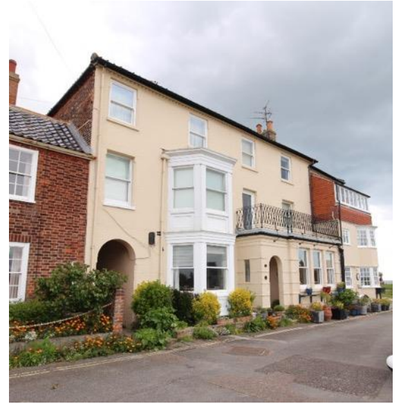
No's 1 & 2 'The Homestead', South Green

The Homestead, South Green (Positive Unlisted Building). Mid 19<sup>th</sup> century purpose-built shop premises, now with painted brickwork and converted to residential during the 1960s. The projecting single storey bay to the east elevation replacing a large plate glass shop window. The first floor, however, retains its original window configuration. Hipped slate covered roof.