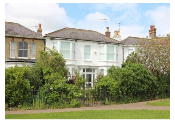
Mariners, The Common

Mill House, The Common (Positive Unlisted Building). Former home of the mill owner, and latterly formed part of the Eversley Road School complex. Presumably built prior to the demolition of the mill (1894) although the structure shown on the 1884 1:2,500 Ordnance Survey map appears to relate to the single storey building that was replaced by the existing house. White brick with rendered ground floor. Central entrance with columned porch, flanked by a pair of flat roofed canted bay windows. Above each bay are tripartite windows and to the centre of the first floor a single plate glass sash window. The openings to the first floor have red brick key stone detailing. Welsh slate roof, hipped to the east, with gable end to the west and a white brick ridge stack. Wrought iron finialed railings and hand gate enclosing the front garden.