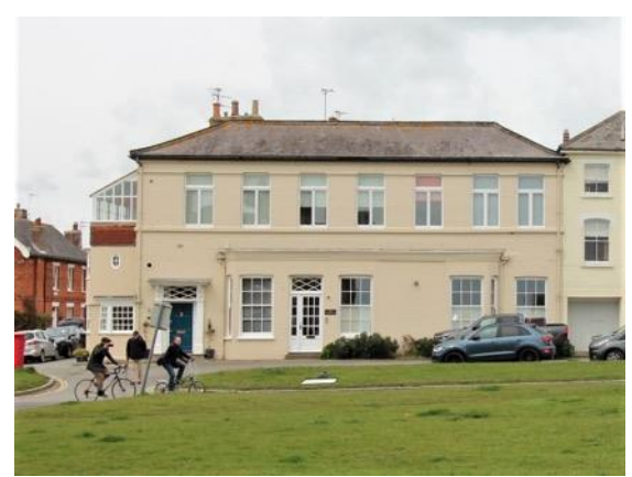
The Homestead, South Green

Horned plate glass sash windows within chamfered surrounds. Brick dentil course of diamond set bricks, a detail repeated to the bay window. Hipped slate roof with stout red brick stack to the north end.