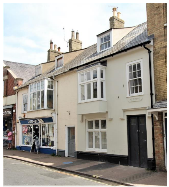
Holmwood, No.8 Queen Street