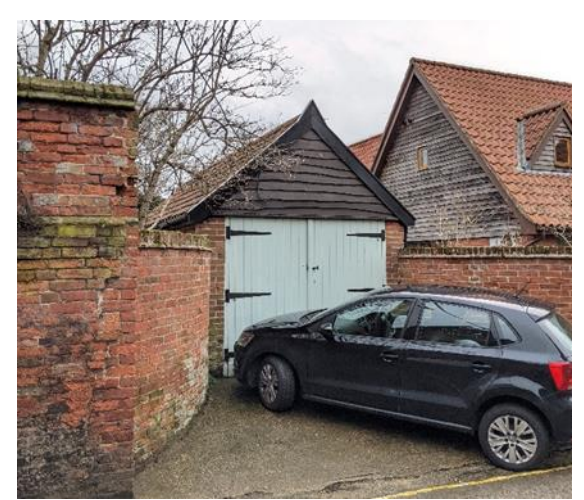
Garage to No.7 Queen Street

Garage to No.7 Queen Street (Positive Unlisted Building). Late-20th century small garage with gable to the street. Built of red brick with red pantile roof and dark stained waney edge timber gable. The structure contributes to the street through its modest Arts and Crafts inspired charm.