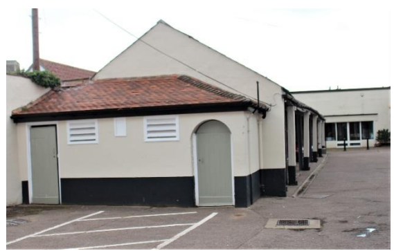
Northern Range of Outbuildings at the rear of The Crown.

Northern Range of Outbuildings at the rear of The Crown, High Street (Positive Unlisted Building). A single storey range of five open-fronted former cart sheds built of rendered red brick with wooden piers. Once part of a continuous range of outbuildings running down to Victoria Street shown on the 1884 1:2,500 Ordnance Survey map. Twentieth century addition at western end. The outbuildings at the rear of the Crown make a strong positive contribution to its setting and to our understanding of its historic role as a major coaching inn. The most complete of Southwold's former coaching inn yards.