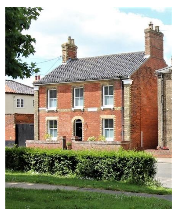
No.33 (right) and 33a (left), Station Road

Nos.29 and 31, Station Road (Positive Unlisted Building). White brick with red brick flank elevations (rendered to the south). Semi-detached pair of late nineteenth century houses, sharing many of the details seen in other houses on Station Road, but in slightly paired down form. Steps up to the entrances grouped to the centre of the front elevation, which is flanked by a pair of canted bay windows with flat roofs. Main roof of hipped pyramidal form, covered with Welsh slate. Good white brick stack to the return wall of No.29, with elaboratively corbelled cap, the stack to No.31 has been reduced in height. The houses retain their original plate glass horned sash windows, and the highly visible roof pitch is free from dormers or rooflights.