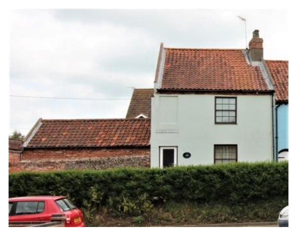
No.1 North Green and boundary wall

No.1 North Green and boundary wall (Positive Unlisted Building). Rendered red brick cottage probably of early to mid nineteenth century date with red pan tile roof. Dentilled brick eaves cornice. Late twentieth century replacement twelve-light hornless sash windows and late twentieth century glazed front door. Decorative blind recess in form of window above door. Late twentieth century single-storey pantile roofed addition to north. Notable probably nineteen century cobble short section of boundary wall to North Green with red brick quoins which springs from northern end of principal façade. Its northern extension is entirely of red brick but may also be of nineteenth century