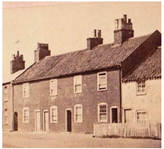
Nos.14-20 (even) St James Green from a c.1870 carte de visite.