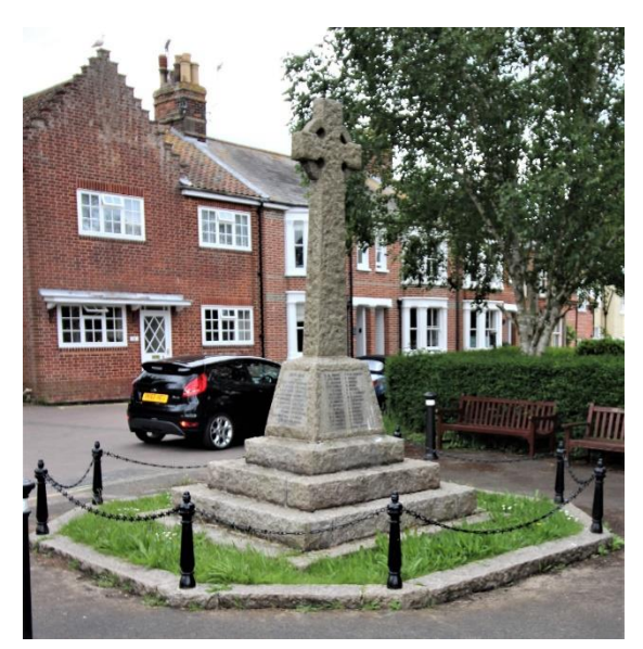
War Memorial, Bartholomew Green

Gates to St Edmund's Churchyard, Bartholomew Green (Grade II, GV).