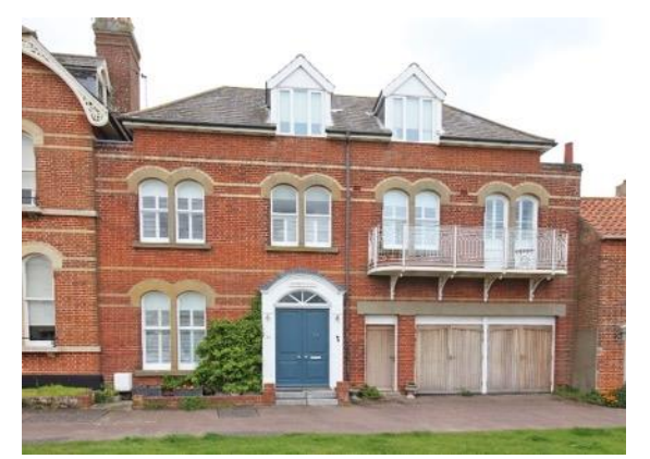
Eastbury House, No.18A South Green

See Bettley, J and Pevsner, N The Buildings of England, Suffolk: East (2015), p.522.