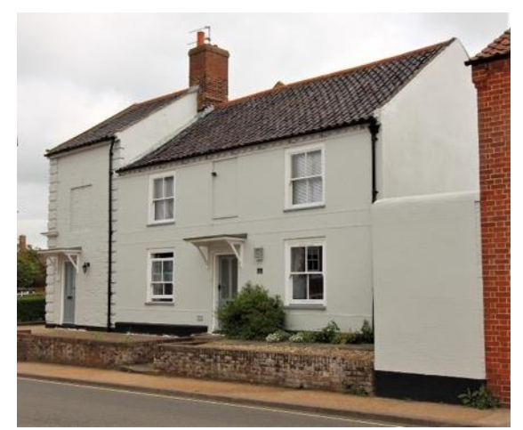
No.2 High-Street, High-Street elevation

No.2 High Street (Positive Unlisted Building). Former Marquis of Lorne public house closed c.1956. Southern section later eighteenth century and northern mid to late nineteenth. Red brick with brick embellishments and expressed brick quoins to the Field Stile Road elevation, which is now painted over. Black pan tile roof. Dentilled cornice on High Street façade.