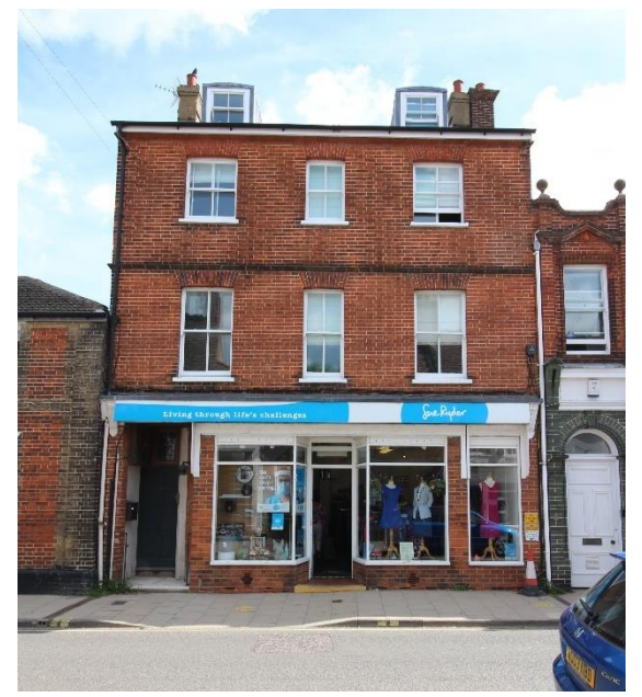
Nos.60 & 62 High Street

No.58 High Street (Positive Unlisted Building). Former Southwold Arms Public House. Closed 1996 now retail premises. A public house on this site was recorded by James Maggs in 1803, however the present building appears to date from the third quarter of the nineteenth century. Largely unaltered façade of red brick with white brick dressings and a hipped Welsh slate roof. Tall central chimneystack rising from ridge. Four light plate glass sash windows. Central pilastered wooden doorcase containing twentieth century partially glazed door. An important part of the setting of the adjoining Grade II* listed Sunderland House and of the listed buildings opposite.