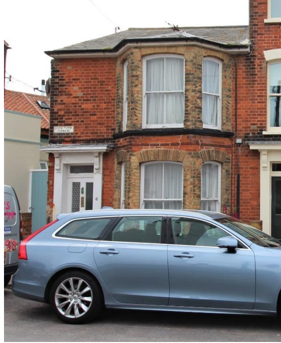
No.6 Stradbroke Road

For Nos.2 & 4 Stradbroke Road see The Sole Bay Inn (Grade II) St James Green.