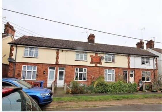
Nos.14-20 (even) North Road

Nos.6-28 (even) North Road (Positive Unlisted Buildings). Three blocks of four early council Southwold Corporation houses completed c.1914 probably to the designs of James Hurst the Borough Surveyor. Red brick with pebble dashed first floor and decorative brick quoins. Rubbed brick wedge shaped lintels. Replaced pan tile roof coverings and shared red brick ridge stacks. Terracotta commemorative plague on central block with lugged brick surround. Nos * &.20 appear to retain their original horned sashes and partially glazed front doors with decorative stainedglass panels, all other external joinery replaced within the original openings.