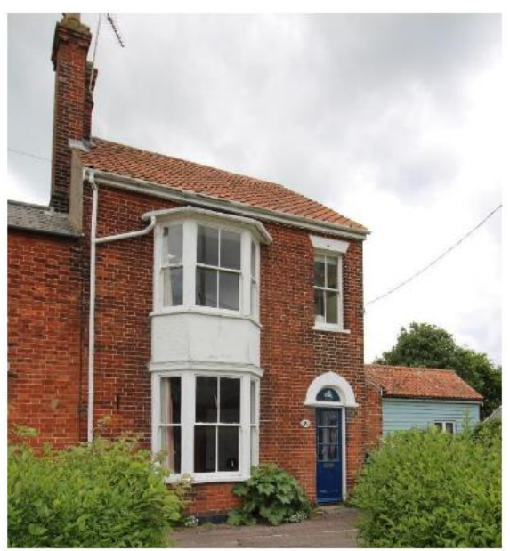
Vanessa Villa No.8 Bartholomew Green

Vanessa Villa No.8 Bartholomew Green (Grade II)