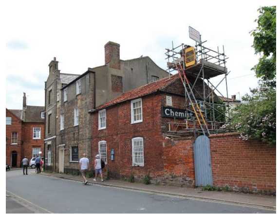
Church Street elevation of No.100 High Street

No.96 High Street (Positive Unlisted Building). Mid nineteenth century house converted to retail premises c.1900. Of painted brick with horned four light plate-glass sashes. Good c.1900 shop front with panelled pilasters and delicate cast iron columns. Original shutter box also appears to survive. Originally with arched doorway and a single window to the ground floor. No.96 makes a strong positive contribution to the setting of the adjoining listed buildings.