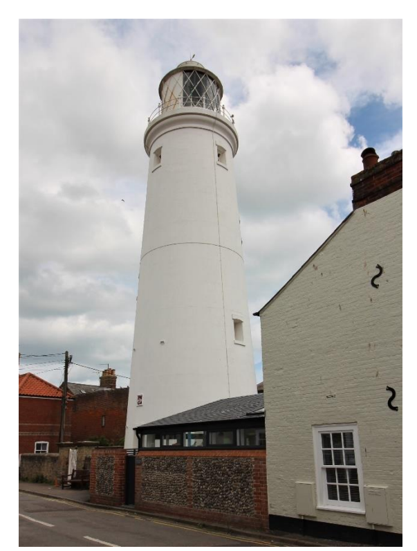
The Lighthouse, Stradbroke Road

Nos.2 & 4 Stradbroke Road - see Sole Bay Inn, No.7 East Green