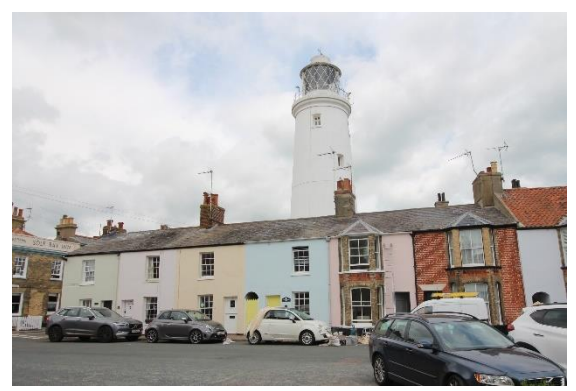
Nos.2-12 (even) St James Green

Nos.2-12 (even) St James Green (Positive Unlisted Buildings). A red brick terrace of mid nineteenth century date with a Welsh slate roof. Now rendered apart from No.12. Originally a symmetrical composition with an arched central passage leading to the rear gardens. Nos.10 & 12 were given full height canted bay windows c.1900 which retain their original horned plate-glass sashes. Nos. 2-8 have twelve light horned sashes beneath wedge shaped lintels. Front doors largely replaced. Single storey early twenty first century addition to the rear of No.2. This terrace makes an important contribution to the setting of the Grade II listed lighthouse and Sole Bay Inn.