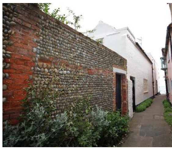
Boundary wall, to the west of The Nook, Primrose Alley

Boundary wall, to the west of The Nook, Primrose Alley (Positive Unlisted Building). Wall constructed from coursed washed cobbles set within red brick margins and cappings. The wall provides a sense of enclosure to Primrose Alley and contributes positively to the setting of several buildings.