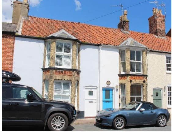
Nos.14 & 16 St James Green

Nos.14 & 16 St James Green (Positive Unlisted Buildings). Part of an early nineteenth century red brick terrace also comprising Nos. 18 & 20. Canted bay windows of red brick with Suffolk white brick dressings were added c.1890. Heavy replacement sashes to No.14. The remainder of the façade was later rendered. Red pan tile roof. Early nineteenth century door openings with shallow brick arched lintels survive but with later twentieth century partially glazed front doors.