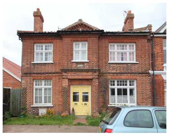
No.1 Cautley Road

No.1 Causley Road (Positive Unlisted Building). A brick villa of c.1900 (shown on the 1904 1:2,500 Ordnance Survey map) possibly associated with the adjoining former hospital. Of three bays with a central pedimented breakfront containing a pilastered porch with double, partially glazed doors. Mullioned and transomed original casement windows. Heavy dentilled brick eaves cornice. Jenkins, A Barrett A Visit to Southwold Containing Over 100 Photographs of Historic Interest (Southwold, 1983) p 28.