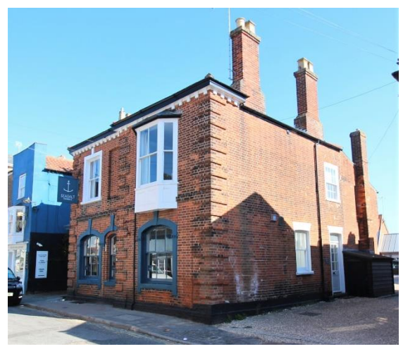
No.8 East Street

No.6 East Street (Positive Unlisted Building). A probably early nineteenth century cottage which is in a yard to the rear of No.2 East Street and has a long and largely blind rear eastern elevation to Smoke House Court. Of two storeys, rendered with a red pan tile roof and overhanging eaves. The 1971 1,2,500 Ordnance Survey map shows the house with an outshot at its southern end which is no longer extant. The house contributes to the setting of the Grade II listed No.6 East Street as well as to the character of Smoke House Court.