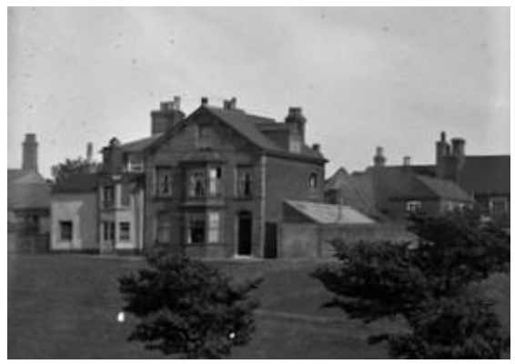
Historic view (undated) of Caneway Cottage, Skilmans Hill

sympathetically, borrowing stylistically from the neighbouring property although the first floor oriel is a departure. The house is extremely prominent in views of Skilmans Hill from Gardner Road.