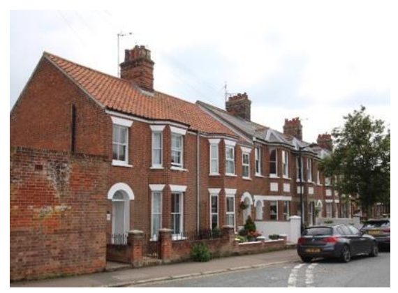
Nos.1 and 2, and Nos.5 to 19 (odd) York Road

Nos.1 and 2, and Nos.5 to 19 (odd), York Road (Positive Unlisted Buildings). A terrace of ten villas dating from the early twentieth century. Red brick, with each house having a two storey canted bay windows with decorative tile panels between the ground floor and first floor windows. Nos.1 and 2 differ in being slightly lower in height to the rest of the terrace, and the roofs covered with red clay pan tiles. The rest of the terrace has Welsh slates to their roofs.