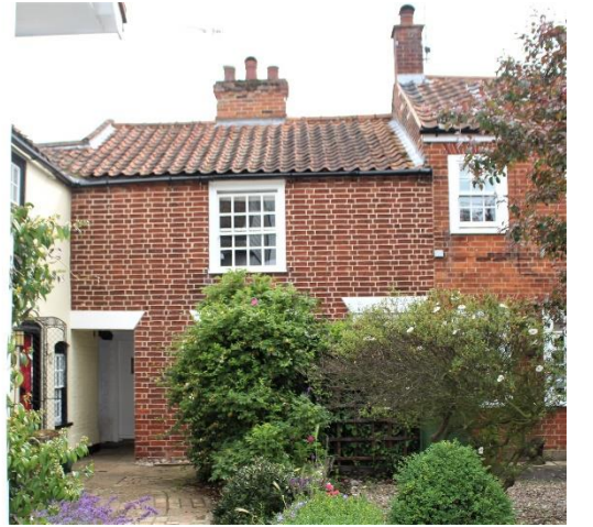
No.22 High Street