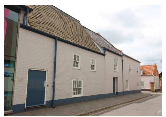
Nos.45 & 47 Victoria Street

Adnams Whisky Dunnage Premises see Crown Hotel, High Street.