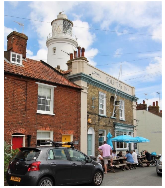
Sole Bay Inn, No.7 East Green

Sole Bay Inn. No.7 East Green and Nos.2 & 4 Stradbroke Road (Grade II)