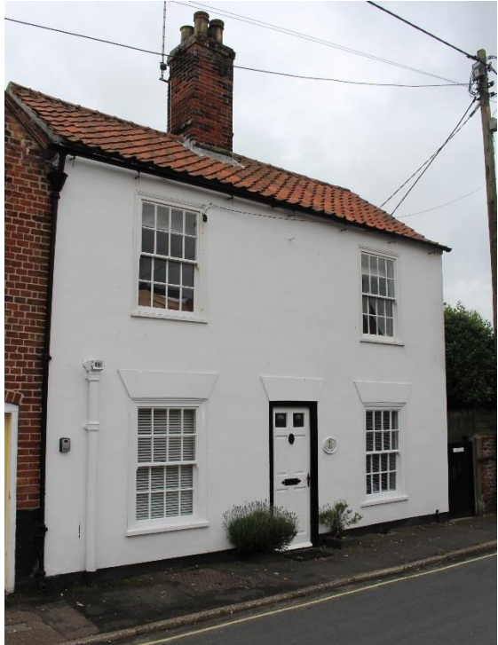
White Cottage, No.10 Lorne Road

Happy Cottage No.6 Lorne Road and No.8 Lorne Road (Positive Unlisted Building). A pair of red brick probably late eighteenth-century cottages with a red pan tile roof standing at a right-angle to Lorne Road within large gardens. Within these gardens the rear elevations of listed houses on Park Lane can also be seen. No.6 has replacement sixteenlight horned sashes beneath wedge-shaped lintels and a partially glazed panelled front door. No.8 has unhorned sixteen light sashes and a partially glazed door. Return elevation of No.6 to Lorne Road of red brick with two gables, panelled door, and casement windows beneath shallow arched brick lintels. Subsidiary features. Twentieth century low red brick garden walls.