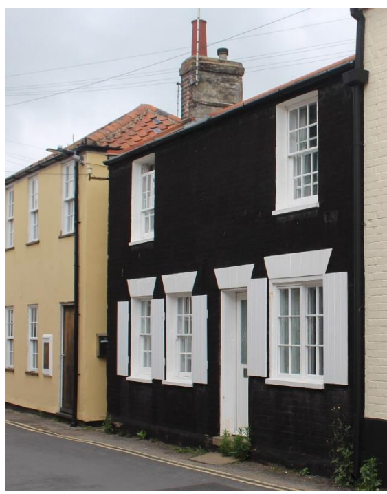
No.2 Trinity Street

No.2 Trinity Street (Positive Unlisted Building). A small cottage of early to mid-nineteenth century date of painted brick. Possibly originally a pair of cottages. Late twentieth century horned sash windows beneath wedge-shaped lintels. Partially glazed front door. The right-hand window is a later twentieth century small pane casement. Red pan tiled roof covering.