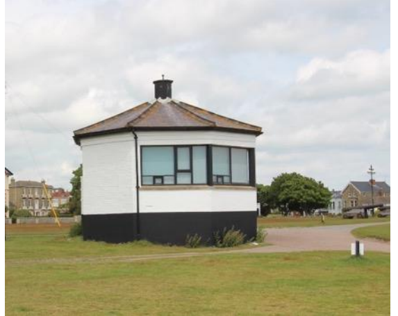
Watch House (or The Casino), Gun Hill Watch House (or The Casino), Gun Hill (Grade II)