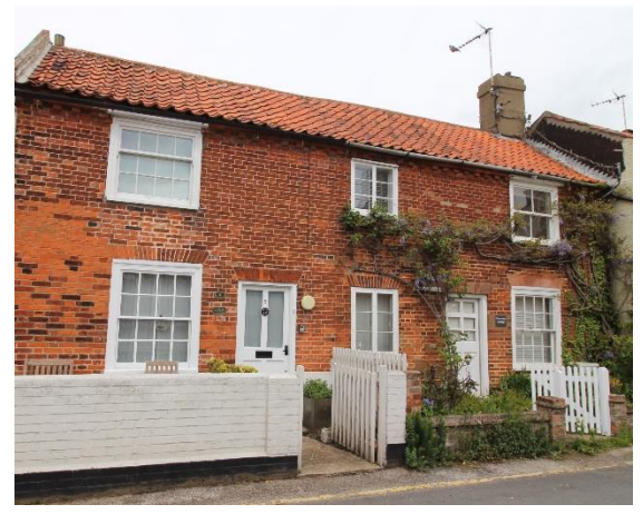
Hoskin Cottage No.5 & Dreamers Cottage, No.3 Pinkney's Lane

No.1 Pinkney's Lane (Positive Unlisted Building) Small red brick early nineteenth century cottage with a red pan tiled roof. Plastered wedge-shaped lintels above late twentieth century replacement sashes. Boarded front door. Façade possibly partially rebuilt following removal of a shop facia.