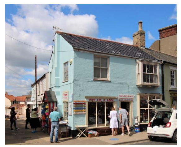
Nos.5 & 7 Market Place

Nos.5 & 7 Market Place (Positive Unlisted Building). A mid nineteenth century rendered and painted brick shop with a black pan tiled roof. Nineteenth century shop facia to southern end of principal façade with a horned plate-glass sash above. Partially glazed front door to centre with wedge-shaped lintel. Bay window with small pane sash to first floor at northern end with mid twentieth century shop facia below. Return elevation gabled with casement windows which must be of relatively recent origins as early photographs show a further single storey small dwelling abutting the gable of Nos 5-7 within what is now the entrance to Child's Yard. Two storey nineteenth century rear range of painted brick with a red pan tile roof.