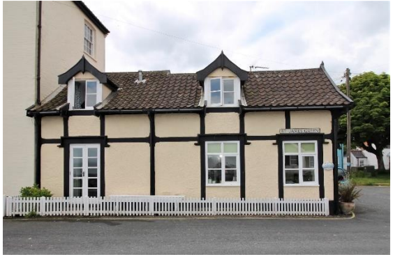
Seaview Cottage, East Cliff

applied timber framing, decorative dormers and hood moulds above the windows are not shown on late nineteenth century photographs but do appear on those of the early twentieth century. Casement windows that at the northern end appears to have originally been a door. A central ridge stack which appears on early photographs has been removed. Late twentieth century pan tiled roof. Some unsympathetic modern fenestration.