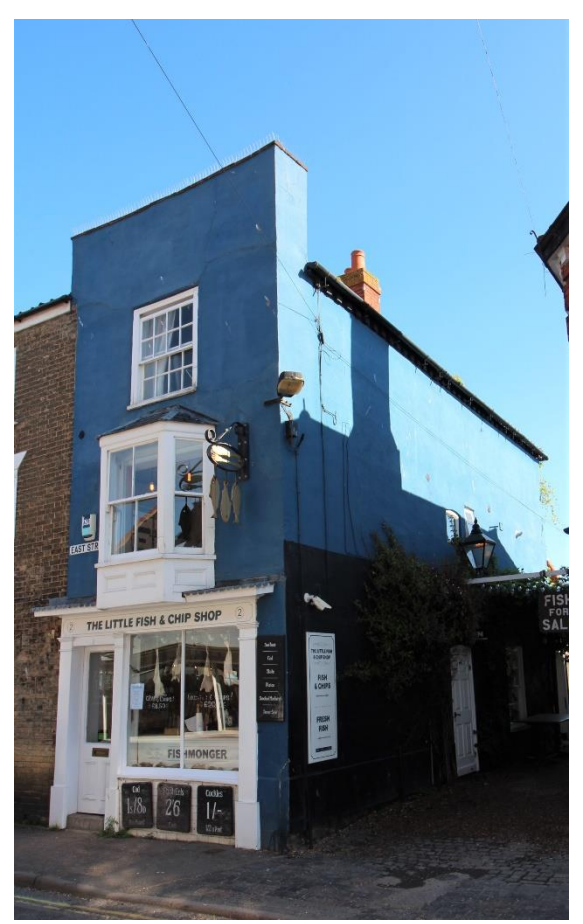
No.2 East Street