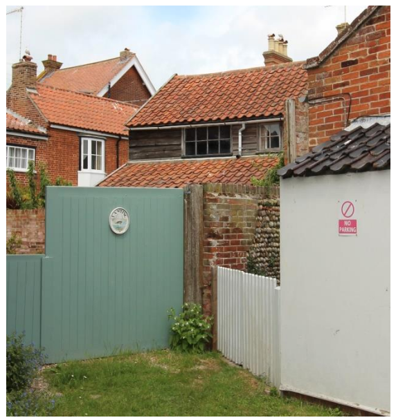
Cottage behind No.9 East Street & 5 Pinkney's Lane

Chimney stack to No.5 removed. Dentilled red brick eaves cornice and wedge-shaped red brick lintels to ground floor window and door openings. No.3 has a probably nineteenth century small pane casement and a four-light sash to the first floor with a late twentieth century horned sixteen light sash window below. Windows to No.5 are early twenty first century small pane sashes. The boundary wall to No. 5 has regrettably been painted.