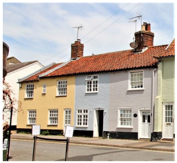
Nos.22-28 (even) East Street

Nos.22-28 (even) East Street (Positive Unlisted Buildings). An altered row of early nineteenth century cottages which nevertheless make a positive contribution to the setting of the adjoining Grade II listed Nos. 30 & 34. Of painted red brick with a red pan tile roof. No.28 is the most intact of the cottages, retaining all of its original window and door openings which have shallow arched lintels.