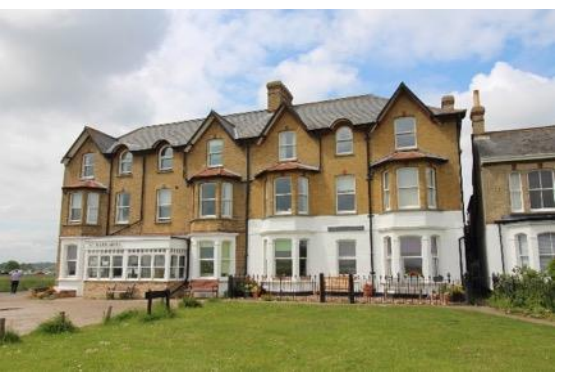
St Barnabus Residential Home, Godyll Road (façade to The Common)

Sunset House, Godyll Road (Positive Unlisted Building). A large villa, attached at its southern end, now flats. Shown on the 1904 1:2,500 Ordnance Survey map and likely built at the same time as the neighboring property (1897). A conservative design for this date. White brick with red brick lintels and band between the ground and first floor. Three full stories, with three attic gables, reflecting the appearance of neighboring property The Links. Below are plate glass sash windows, and a central blind opening (previously open). Two storey canted bay windows, painted stone to the ground floor and red brick above with pitched roofs covered with plain tiles. Between this is a balcony, now accessed from the bay windows, the central door shown on historic images having been removed and replaced by an off-centre sash window. Enclosed porch of later date.