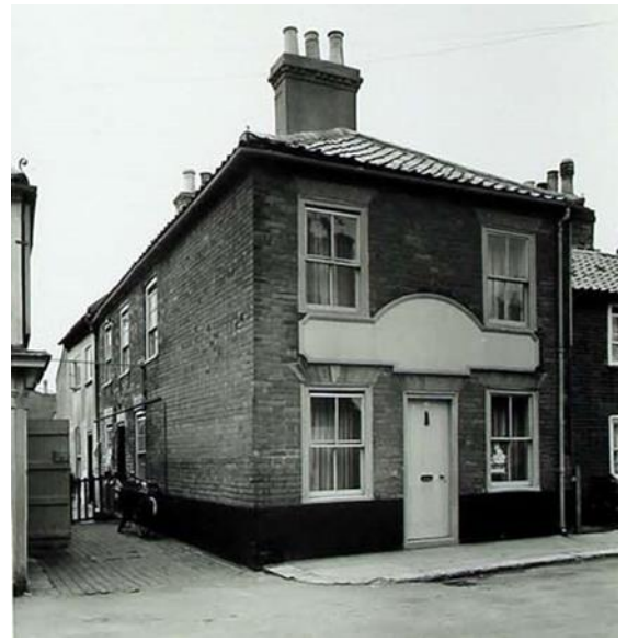
The Former Rising Sun, No.6 Trinity Street c.1949

contribution to the setting of adjacent Grade two listed 8-12 Trinity Street. The Rising Sun public house being entered via a doorway in the centre of the street façade which was removed in the later twentieth century. The Street façade now has small pane sashes which replace those shown in the NMR photograph and others. The 1949 photograph also shows wedge-shaped brick lintels with key stones which have been plastered over. The Trinity Courtyard elevation has also been altered by the insertion of additional window openings and the conversion of the original doorway to one of the houses into a window. Late twentieth century pedimented doorcase. Chimneystacks removed. Trinity Close was used for stabling for Montgomeryshire Yeomanry horses during World War One.