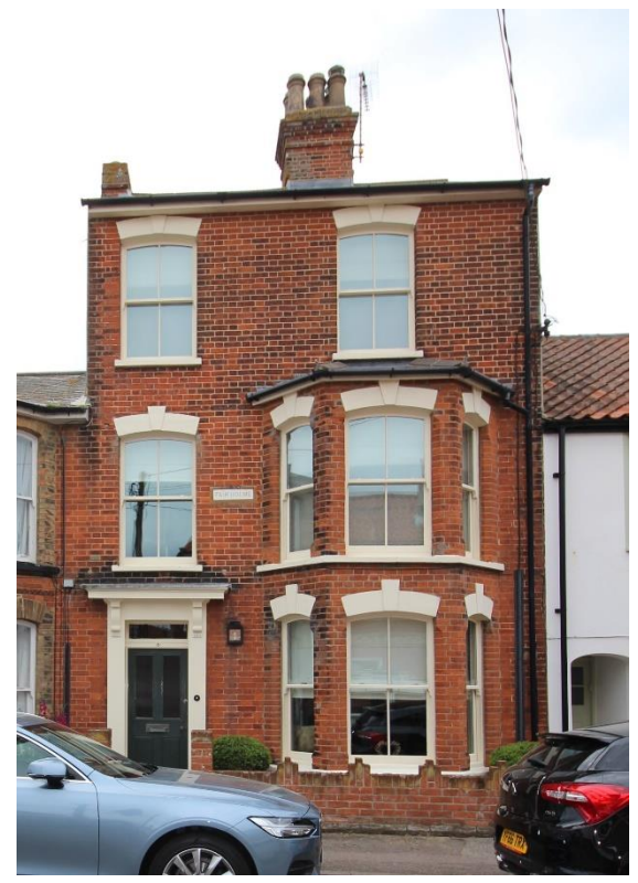
No.8 Stradbroke Road

Cornfield Mews No.6A Stradbroke Road (Positive Unlisted Building). A small cottage to the rear of No.6 Stradbroke Road and No.11 East Green accessed via a pathway to the rear of the Methodist Chapel and to the side of No.6 Stradbroke Road. Red brick with timber clad first floor, and red pan tile roof. Casement windows. A group of three small buildings appear on this narrow footway on the 1971 1:2,500 Ordnance Survey map of which this appears to be the only survivor. This building also appears to be on the 1904 map.