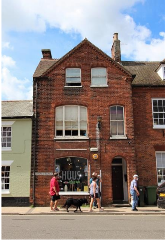
No.1 Market Place

No.1 Market Place (Positive Unlisted Building). A red brick commercial building of c.1890 probably built as a solicitor's office. It was later the architect's office of Thomas Edward Key. Gabled with a dentilled brick cornice and shallow arched brick lintels to the windows. Arched doorway leading to recessed porch containing a panelled door with rectangular fanlight above. Horned plateglass sash windows. Tripartite sash to ground floor replaced with a single sheet of plate-glass within original opening. No.1 makes and important positive contribution to the setting of the listed buildings which flank it. Its possibly earlier rear range is now two separate dwellings known as Nos. 7A and 7B Market Place which are accessible from Child's Yard. These are discussed separately.