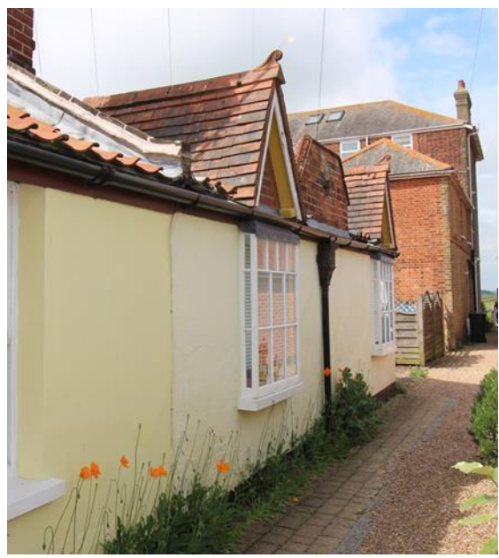
Mill Cottage, western end, located to footpath off Godyll Road