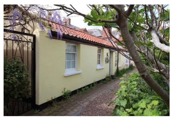
Mill Cottage, eastern end, located to the footpath off Godyll Road

To the first floor, between the bays, is a balustraded balcony, accessed from a central door. The balcony is given some weather protection by the attic storey which is carried forward over the bay windows. Tile hung attic elevation with three gables of equal size. The house retains its original windows with arched transoms. Clear bands of material use; brick to the ground floor, render to the first floor and tile hung to the attic, create a varied but very coherent elevation. Side of house, boundary wall and garden make a significant and positive contribution to footpath (No.14) which links Godyll Road and Blackmill Road.