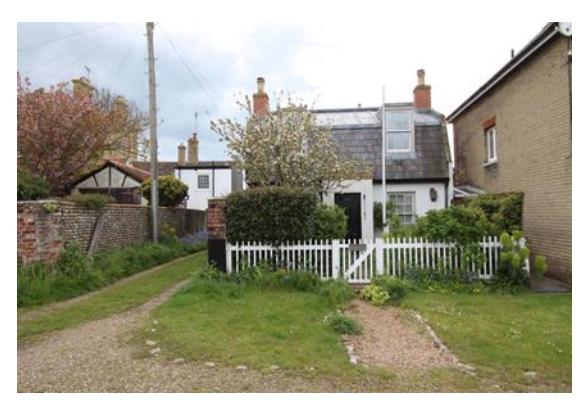
Jessamy Cottage, Skilmans Hill

Caneway Cottage, Skilmans Hill (Positive Unlisted Building). Tall and imposing, and sitting at the top of Skilmans Hill. Two storey with an attic with Suffolk white brick elevations with contrasting red brick detailing. Two storey canted timber bay to the centre of the elevation, with the entrance to the left (and later enclosed porch). To the first floor the bay is flanked by 3 over 3 pane sash windows, with a further sash window to the centre of the attic floor. Decorated bargeboards, which project slightly from the elevation.