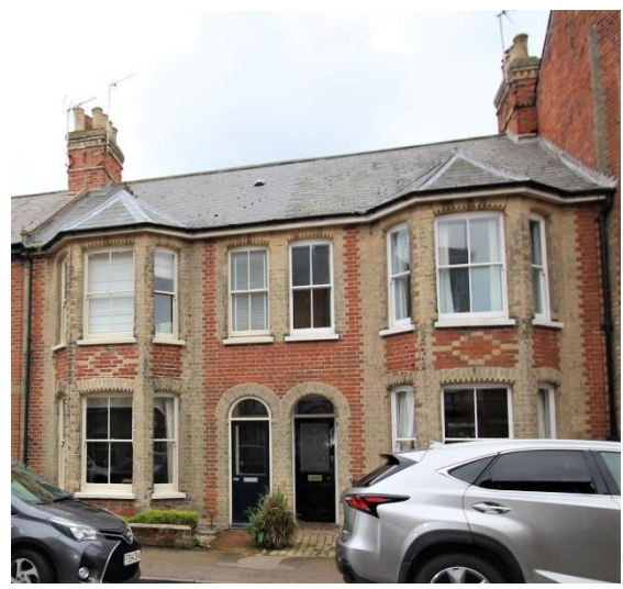
Nos.14 & 16 Dunwich Road

Dunwich Terrace, Nos.6-12 (even) Dunwich Road (Positive Unlisted Buildings). A terrace of four houses. Shown completed on a photograph taken on the 18<sup>th</sup> of October 1893 from the lighthouse which is preserved in Southwold Museum. Red brick with painted stone dressings. Two storey canted bays with pilasters and carved lintels and decorative tile insets between the floors. Welsh slate roof with finials above the canted bay windows. Horned plate-glass sashes. Paired arched recessed porches containing partially glazed panelled doors. The door to No.8 still retains stained and leaded glass panels. Some houses now with secondary door flush with the façade. Twentieth century dwarf red brick walls to Dunwich Road. Possibly by the same builder as No.16 Chester Road. John Miller Britain in Old Photographs: Southwold (Stroud 1999) p83.