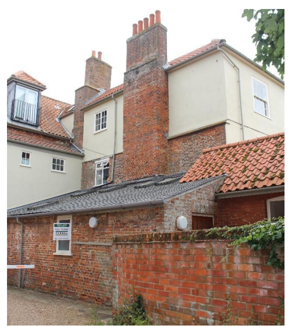
Rear of Buckenham House, High Street from Buckenham Court

Buckenham House, Nos.81 & 83 (odd), High Street (Grade II*)