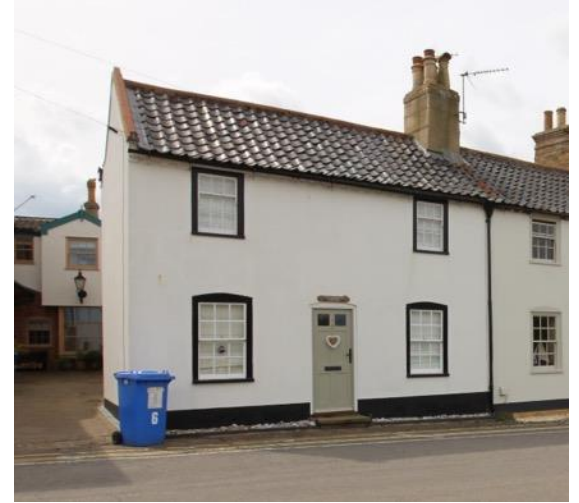
Tittle Mouse House, No.6 Queens Road

Garden Lodge and Mole End, Queens Road (Positive Unlisted Building). Northern range of former stable block to Southwold House, remodelled c.2017. Originally containing groom's accommodation on the first floor. The principal interest of this range is the attractive gault brick north east elevation with contrasting red brick horizontal banding and lintels.