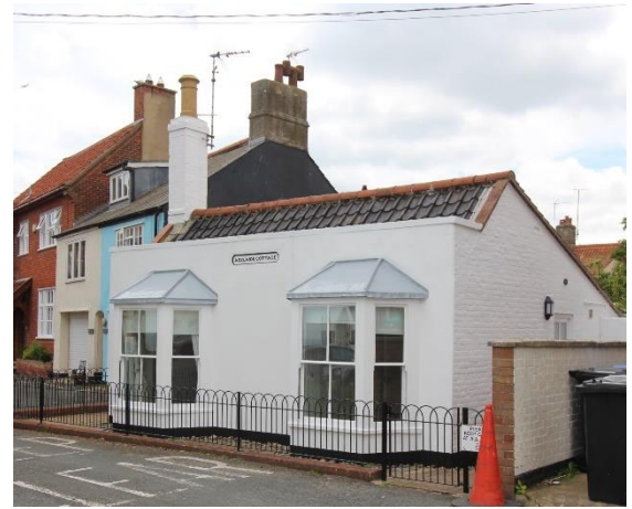
Adelaide Cottage, St James Green

13 and 15 St James Green. Previously identified as positive unlisted buildings, these structures have been substantially altered and no longer merit inclusion.