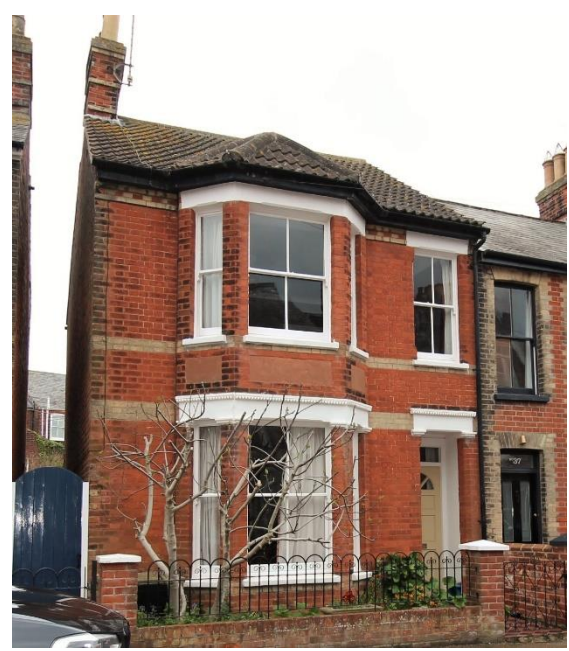
No.39 Stradbroke Road

No.39 Stradbroke Road (Positive Unlisted Building). A late nineteenth century house of red brick with Suffolk white or gault brick dressings and painted stone lintels and sills. Replaced pan tile roof with elaborate eaves cornice. Four light horned plate-glass sashes. Recessed porch with late twentieth century replacement front door. Twentieth century dwarf red brick boundary wall capped by iron railings. The flanking square-section piers with pyramidal caps may however be original.