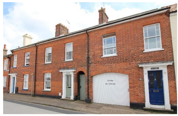
Nos.11-15 (Odd) Trinity Street

No.9 Trinity Street (Positive Unlisted Building). Early nineteenth century shop which makes a strong positive contribution to the setting of the adjoining listed buildings. Painted red brick with red pan tiled roof. Late nineteenth century shop facia with pilasters and partially glazed central double doors. At first floor level a blind central recess flanked by twelve light sashes.