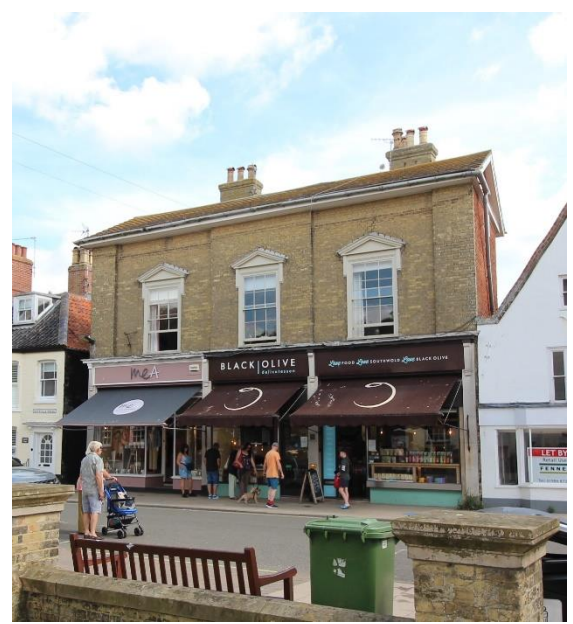
Rutland House, Nos.80 & 80A High Street

Rutland House and Rutland Cottage, Nos.80 & 80A High Street (Grade II)