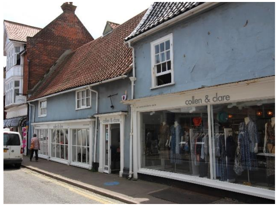
No.25 Market Place (East Street façade)