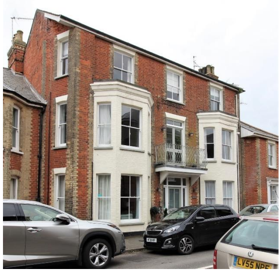
Suffolk House, No.18 Dunwich Road

glazed front doors flanked by full height canted bays.