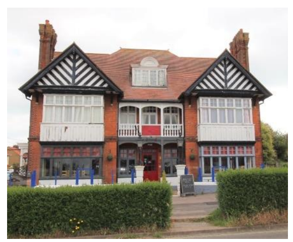
Blyth Hotel, Station Road

Blyth Hotel, Station Road (Positive Unlisted Building). An imposing and stylish building, originally called The Station Hotel owing to its close proximity to the Southwold Railway Station located opposite. Designed by Thomas Edward Key for Adnams Brewery, and built 1900-1 (The Randolph, an almost identical sister hotel, also by Key exists in Reydon). Domestic in its detailing but commercial and ambitious in scale, compositionally it owes much to the contemporary villas of Godyll Rod, particularly Langford Lodge. Symmetrical with centrally located entrance set back within an open columned porch of three bays, reflected to the first floor by an open balustraded balcony, covered by the roof over. Flanking the entrance are a pair of two storey square bays, half-timbered between floors and with closely studded diagonal timbers to the gables. To the attic is a single central dormer with projecting cornice which rises to the centre in a half-circle. The north elevation is highly visible on approach to the town, and it is perhaps this elevation, which continues the stylistic tone of the principal façade, where compositionally the building is seen to best effect. This landmark structure retains its original doors, windows balcony joinery and was designed by a significant and talented architect.