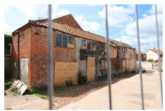
No.9 Market Place

Nos.7A and 7B Market Place (Positive Unlisted Building). A range of buildings attached to the rear of the late nineteenth century No.1 Market Place but which probably pre-date it. These cottages are shown as two separate dwellings on the 1904 1:2,500 Ordnance Survey map and that of 1971. Rendered brick with a black pan tiled roof. Twentieth century casement windows.