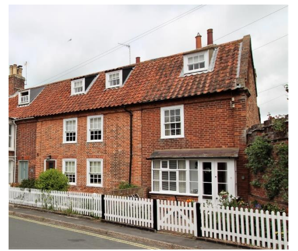
Nos.11 & 13 Lorne Road

Nos.11 & 13 Lorne Road (Positive Unlisted Structure). Probably of mid-eighteenth-century date of red brick with pilasters and a red pan tiled roof. Eastern gable of No.11 prominent in views along Lorne Road. Twelve-light hornless sash windows in heavy moulded frames beath rubbed brick wedge-shaped lintels. Ground floor of No.11 has a twentieth century glazed lean-to porch and a twentieth century bay window beneath a continuous Welsh slate roof which replaces an earlier bay window shown on a National Monuments Record photograph of 1949 (BB49/3125). Flat roofed dormers in principal roof slope. Ridge stacks probably removed. The partially re-fronted No.15 forms part of the same structure.