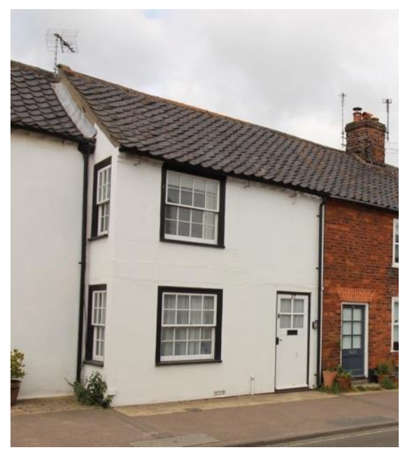
No.17 High Street

White Horse Cottage, No.19 High Street (Grade II)