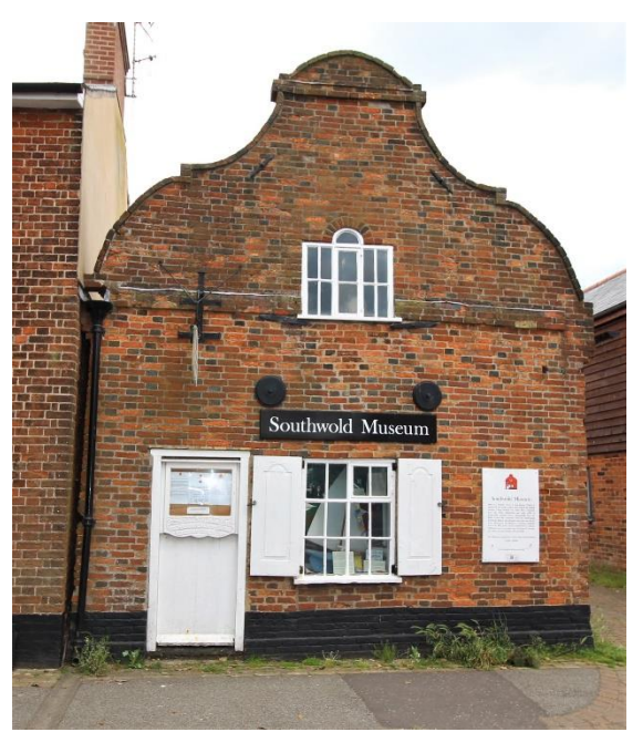
Southwold Museum, Victoria Street

K6 Telephone Box, Victoria Street (Positive Unlisted Structure). A K6 type telephone box of a design produced for the General Post Office in 1935. Sir Giles Gilbert Scott was the designer of the original prototype. Produced in cast iron and made in sections, this design was used until replaced by the K7 c.1968. A prominent structure at the junction of Victoria Street and High Street.