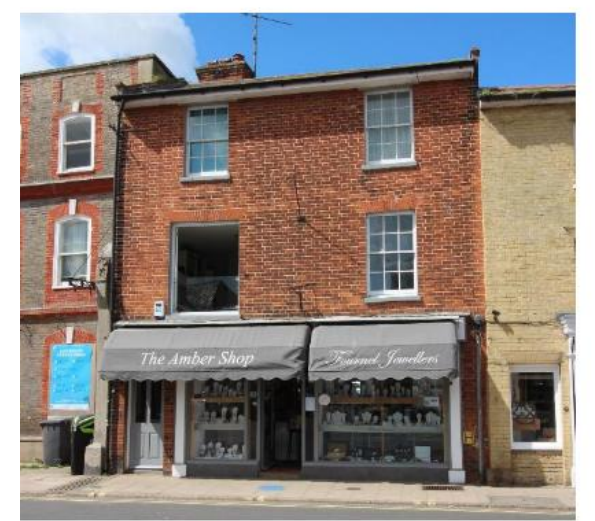
No.15 Market Place