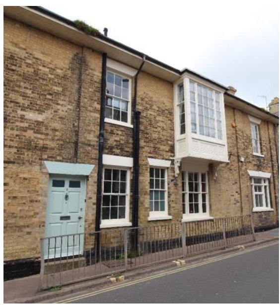
No.7A Queen Street, rear section of May Place

May Place & May Place Cottage, South Green (Grade II)