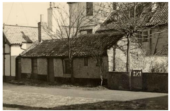
A c.1940 view of No.23 St James Green

No.23 St James Green (Positive Unlisted Building). A c.1800 structure with substantial late twentieth century alterations. Possibly originally a laundry or brewhouse for neighbouring Seaview House on East Cliff, now a dwelling. Red brick with a red pan tile roof. Old photographs show that the right-hand return elevation was originally partially of cobble. Late twentieth century casement windows. Boarded door.