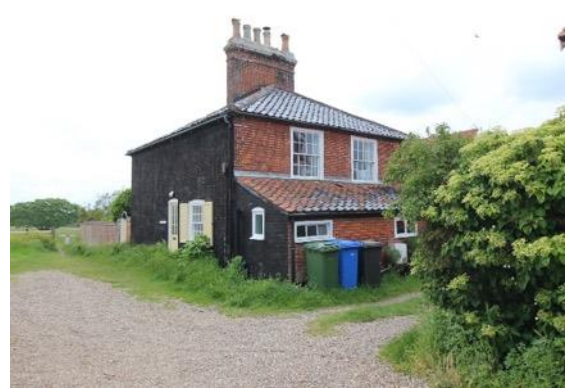
Spinners Cottage and boundary wall, Spinners Lane

Red clay pan tile covered roof, with brick upstand gable ends containing the tiles. Entrances grouped to the outer edges of the elevation, now with bracketed timber canopies over. Arched window heads with unhorned sash windows, 6 over 6 pane to the ground floor and 3 over six above, all of which contribute to the character of the conservation area.