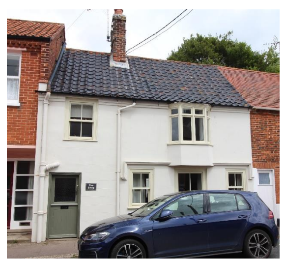
'The Snug', No.5 Lorne Road

No.1, & Jersey Cottage No.3 Lorne Road (Positive Unlisted Buildings). A pair of red brick cottages with a Suffolk white brick return elevation to May Place against which the now demolished Victorian wintergarden of that villa once stood. Red plain tile roof. Probably early nineteenth century but remodelled c.1920. The present facade is shown on a photograph of 1922 in the Southwold Museum collection. In retail use in the early twentieth century. Casement windows, those to the first floor wit3in canted bays supported on decorative wooden brackets. Red brick ridge stack rising from spine wall between properties. Top lit boarded front doors beneath wedge shaped brick lintels. Shallow arched lintel to ground floor window of No.3, that to No.1 flat and probably rebuilt in the later twentieth century. Dentilled brick eaves cornice. John Miller Britain in Old Photographs: Southwold (Stroud 1999) p91.