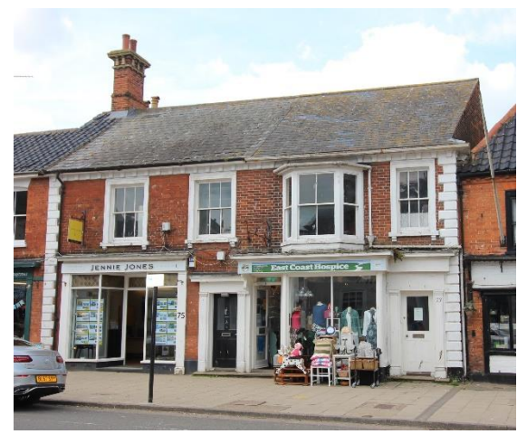
Nos.73 & 75 High Street

Nos.73 & 75 High Street (Positive Unlisted Buildings). A pair of mid-nineteenth century shops with living accommodation above which were originally built as dwellings. Red brick with painted stone dressings and a Welsh slate roof. Dentilled eaves cornice. Four-light plate-glass sashes set within heavy moulded frames. Pilastered doorcase to No.75 with panelled door. No.73 has the remains of a similar doorcase only the pilasters of which now appear to survive. Early twentieth century shop facias. Late nineteenth century photographs show that No.73 originally had a full height canted bay window which now only survives at first floor level. Jenkins, A Barrett, A Visit to Southwold, Containing Over 150 Photographs of Historic Interest (Southwold, 1984) p15.