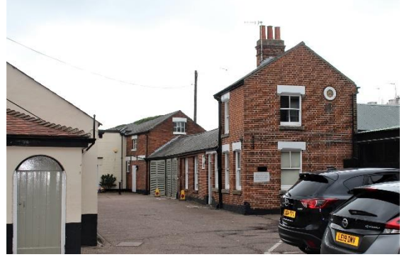
Southern Range of Outbuildings at the rear of The Crown.

Northern Range of Outbuildings at the rear of The Crown, High Street (Positive Unlisted Building). A single storey range of five open-fronted former cart sheds built of rendered red brick with wooden piers. Once part of a continuous range of outbuildings running down to Victoria Street shown on the 1884 1:2,500 Ordnance Survey map. Twentieth century addition at western end. The outbuildings at the rear of the Crown make a strong positive contribution to its setting and to our understanding of its historic role as a major coaching inn. The most complete of Southwold's former coaching inn yards.