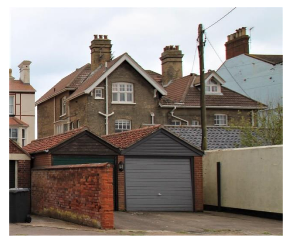
Strathmore House, No.26 North Parade from Field Stile Road

an arched doorway with plate-glass fanlight. Outer bays have canted bay windows beneath projecting gables. Southern and northern return elevations with oriel window resting on decorative brackets. Rear elevation visible from Field Stile Road has a gabled dormer window with bargeboards and projecting eaves. Original gault brick front garden walls to south and east with square-section gate piers. High rendered garden walls to rear. See Southwold and Son website for further details.