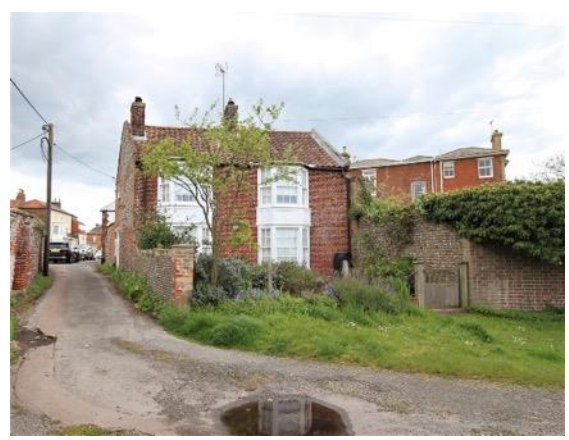
Skilmans Cottage, Skilmans Hill

Skilmans Cottage, Skilmans Hill (Positive Unlisted Building). Red brick cottage, two storey, probably dating from the early 19<sup>th</sup> century. A pair of later two storey canted bays to the west elevation. Red clay pan tile roof with a pair of red brick stacks. The north return elevation displays the scars of various door and window alterations through an interesting mix of washed cobble and red brickwork.