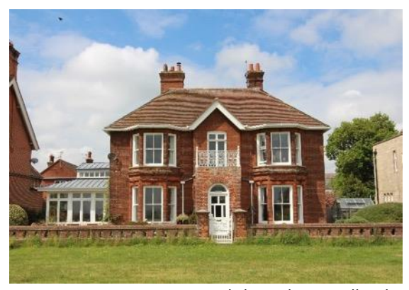
Wantage House, gate and boundary wall, The Common

The Hollies, The Common (Positive Unlisted Building). An early twentieth century villa, dominated by a two storey red brick canted bay with rendered attic gable supported on timber brackets. Balanced to the right by a dormer with pitched roof. Central entrance under a (possibly slightly later) enclosed plain tiled roof which abuts the canted side of the bay window. Projecting brick aprons below window sills. The house retains its original sash windows, divided to the upper sash and plate glass below. Railings and gate to the front garden contribute positively to the setting of the house.