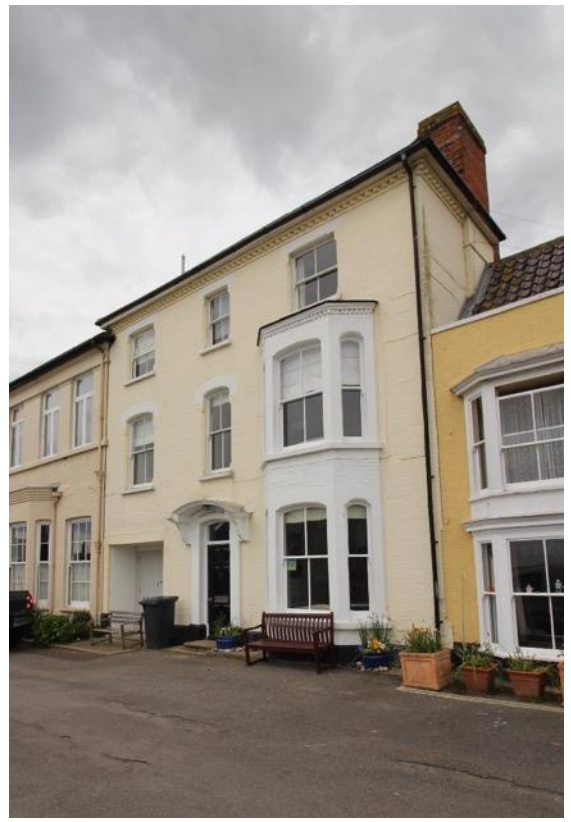
No.5 'Westbury House', South Green

No.5 'Westbury House', South Green (Positive Unlisted Building). Three storey painted brick villa, dating from the late 19<sup>th</sup> century. Historic photos show this as red brick with stone dressings and string courses. Now entirely residential, the left hand section (now garage doors to No.7 'The Homestead') operated as a wine shop with a separate entrance during the early 20<sup>th</sup> century. Central entrance now under a bracketed timber canopy, with two storey canted bay to the right.