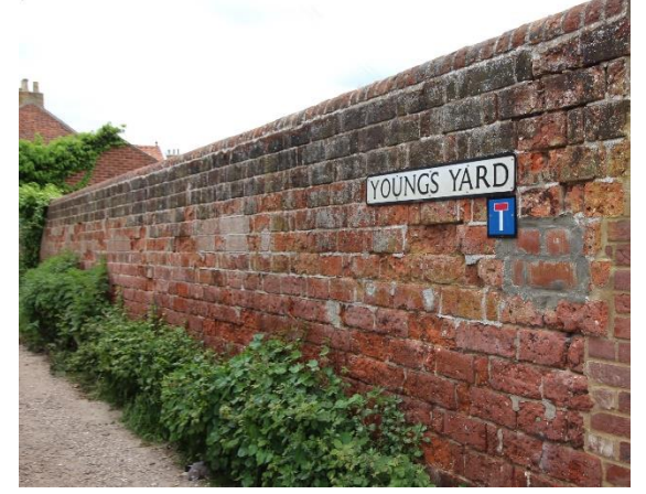
Boundary Wall to Electricity Substation on Northern Side of Youngs Yard

See also No.39 Victoria Street and attached workshop range to rear.