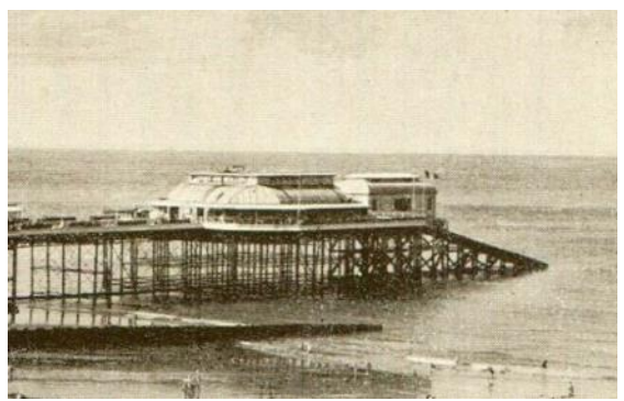
Detail from postcard c.1890 showing the Lifeboat Station at the head of Cromer Pier

Timber framed, with panels of diagonal weatherboarding between posts. Corbelled eaves supporting a shaped roof. The structure retains its original window frames, although the large sliding doors, through which the lifeboat was launched, have been altered. Extension of 2009 to the south west elevation is sympathetically detailed.