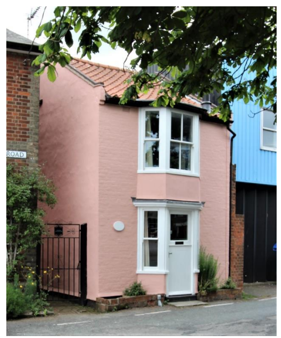
No.27 Cumberland Road

Saffron Cottage No.23, Church Green Cottage No.24, No.25 & St Edmunds Cottage, No.26 Cumberland Road (Positive Unlisted Buildings). Mid nineteenth century red brick terrace originally known as Alpha Place with Suffolk white brick dressings and a Welsh slate roof. Hornless twelvelight sashes, those to the ground floor having plaster faced wedge shaped lintels (possibly made of cast iron). Decorative blind panel above each front door. Red brick ridge stacks rising from the spine walls between the houses with elaborate white brick dressings. No.23 sadly now painted.