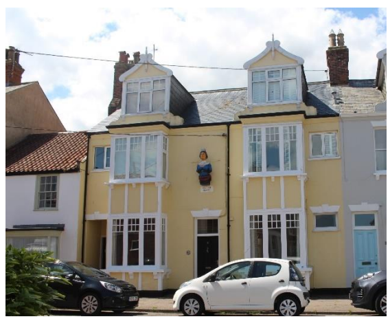
Dolphin House and Douglas House No.12 Stradbroke Road

Dolphin House and Douglas House No.12 Stradbroke Road (Positive Unlisted Building). House, formerly house and shop of c.1895 (this site is shown as vacant on some early photographs for some time after No.14 had been completed). Rendered with a Welsh slate roof. Moulded eaves cornice. Substantial gabled dormers with elaborate decorative bargeboards and spear finials, with unsympathetic windows. The sides of the dormers clad in slate. Two storey bay windows with mullioned casements which were possibly added in the early twentieth century, that to the south formerly acting as a shop window. Applied decorative timber framing. Window joinery largely replaced. Painted stone wedge-shaped lintels to doors. Red brick ridge stacks. Ship's figure head on bracket above front door.