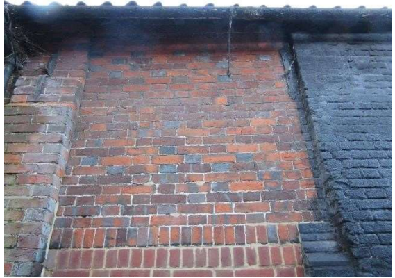
Proposed position for accessible entrance door. It appears there is evidence of a former opening here.

Some flooring will need to be removed behind this opening to allow for the accessible entrance.