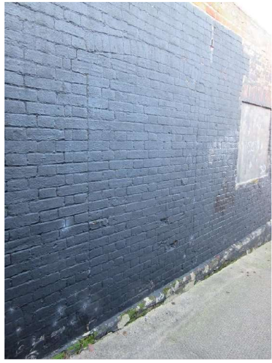
Proposed position for entrance doors to storage area. Evidence of a former opening here.