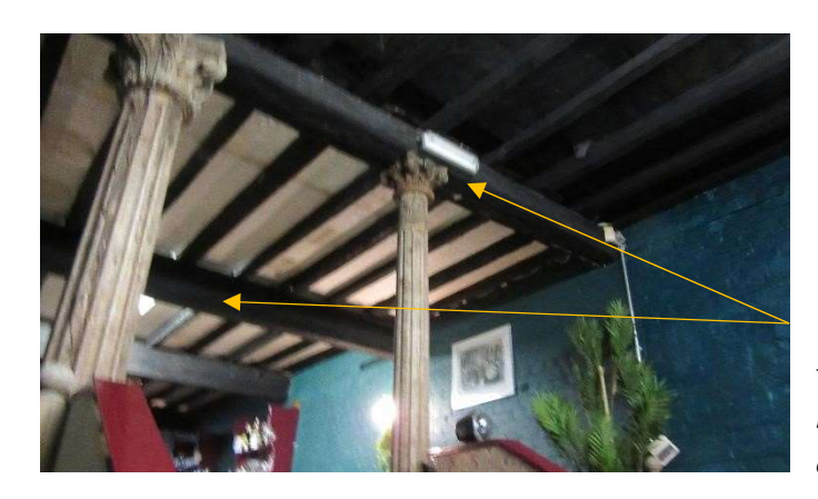
The partial replacement of the stud walls will be under these two existing beams. The pillars are temporary and only decorative.

Two studwork walls have been removed but it is intended that these be partially replaced.