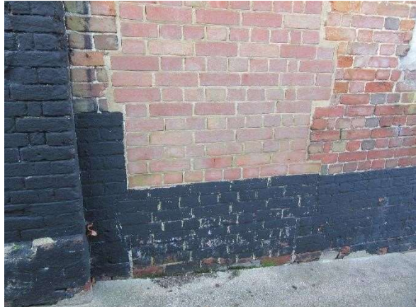
Proposed position for entrance door to warehouse. Evidence of a former opening here.

Two studwork walls have been removed but it is intended that these be partially replaced.