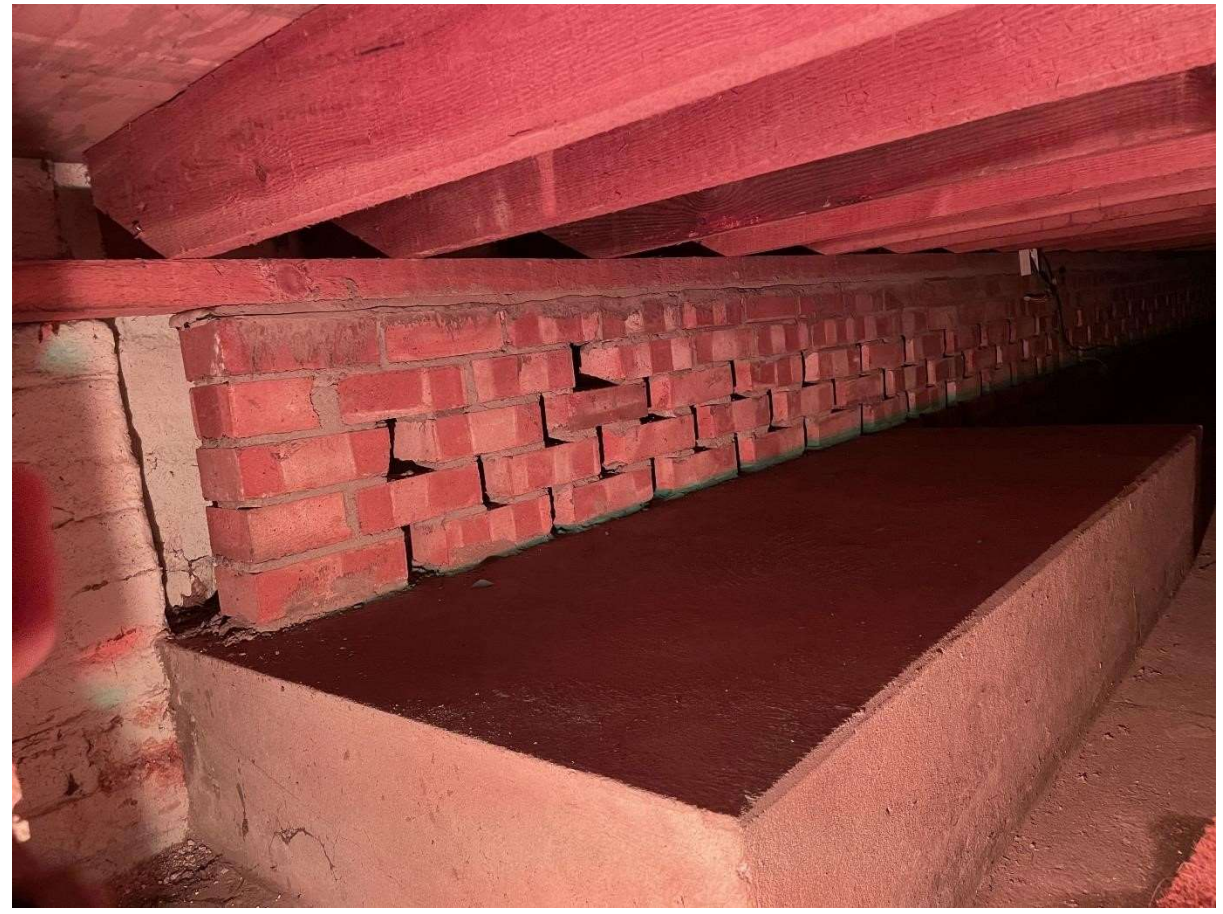
This is the space under the floor at the point of the proposed re-opening of the accessible entrance.