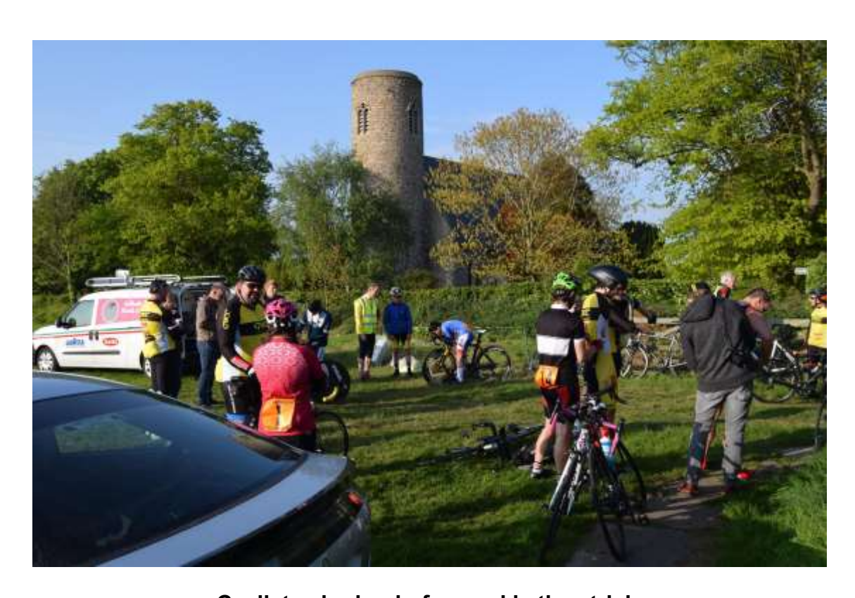
Cyclists signing in for weekly time trial