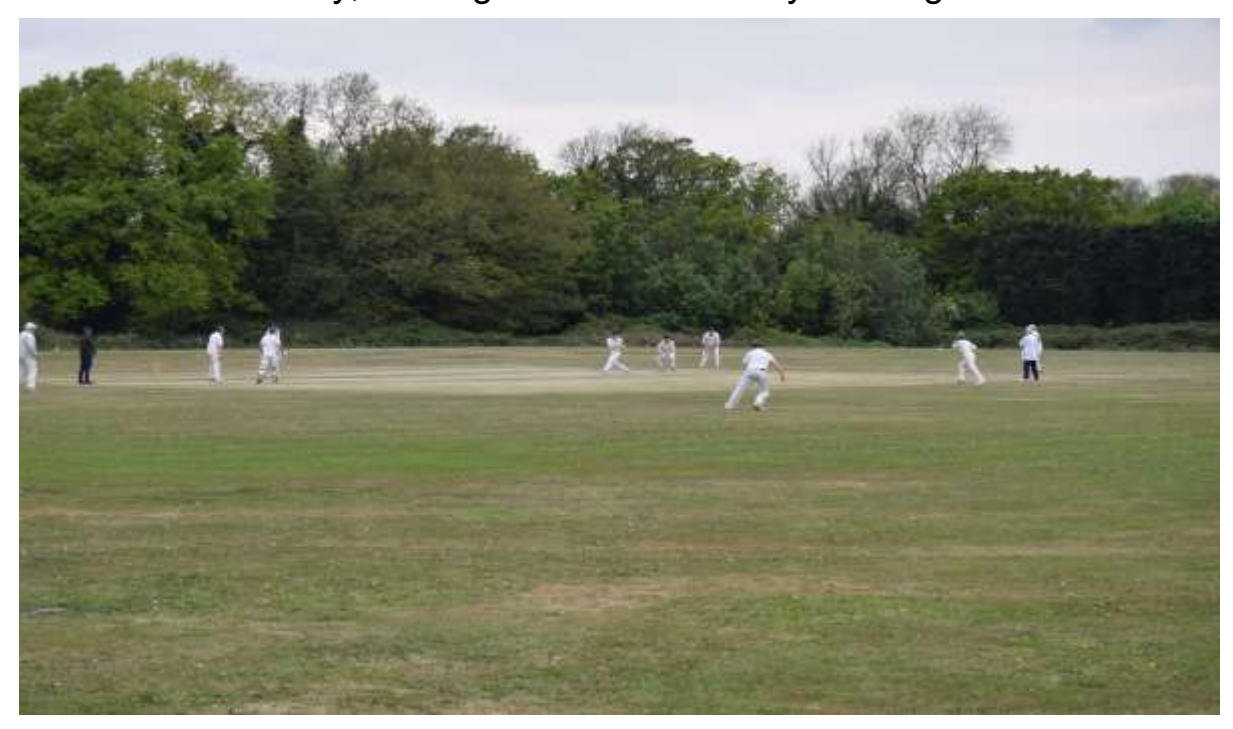
Cricket on Somerleyton Playing Field