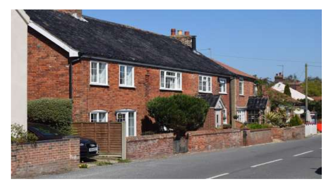
The Street, Lound