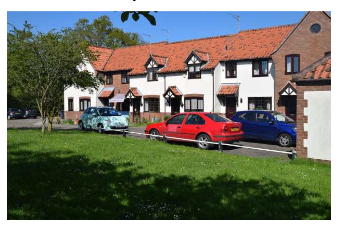
Modern housing with green open space and parking is highly visible