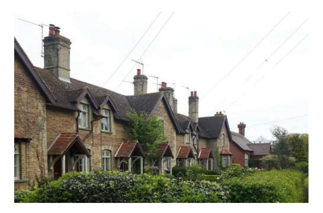
Victorian Estate Housing in Somerleyton