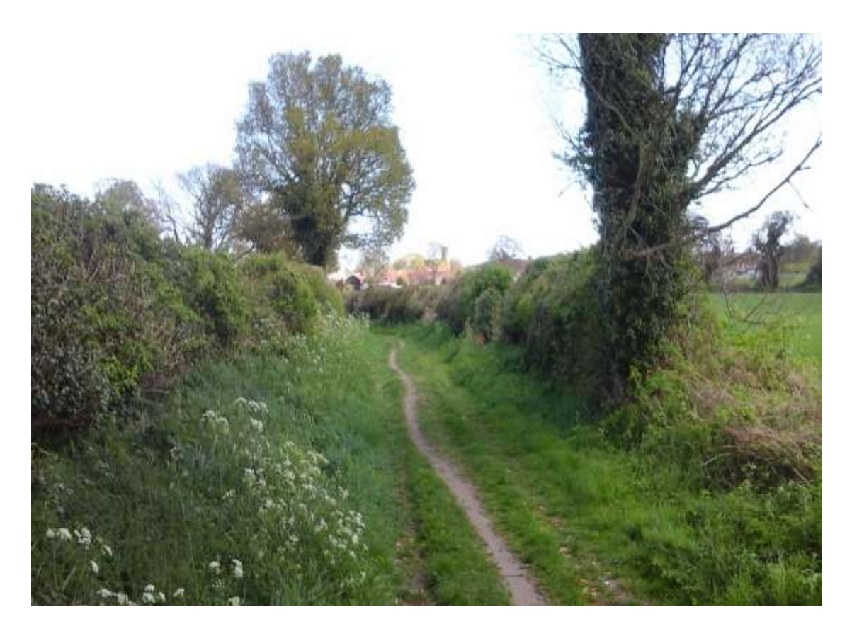
Snakes Lane approaching Lound

8.2.3 In response to our questionnaire virtually everyone said they walk these footpaths and bridleways regularly, with 30% saying they also use them for cycling, and 10% using them for horse-riding. Many people said they would like to see enhancements to this network of footpaths, with better maintenance and some additional routes