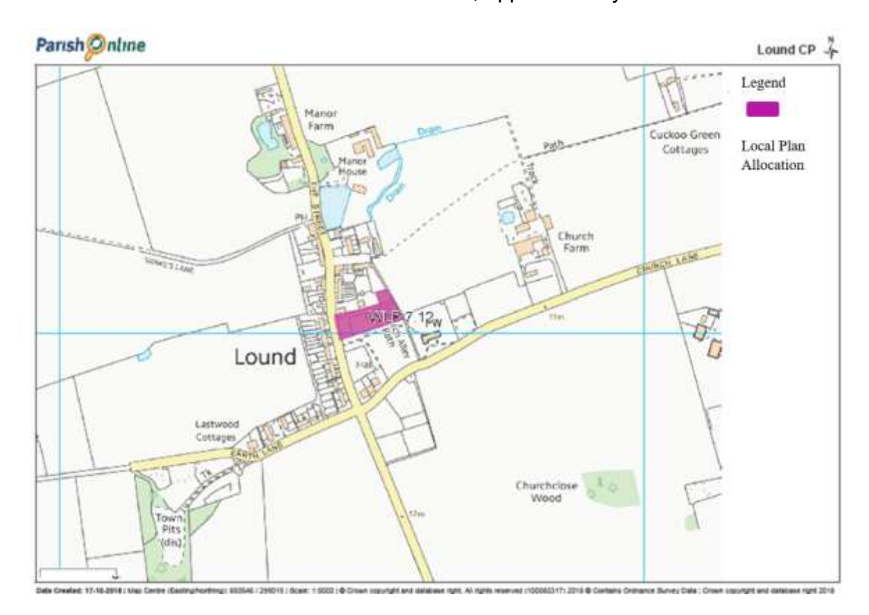
Lound Map indicating Local Plan allocation