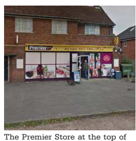
Rigbourne Hill where the assaults happened