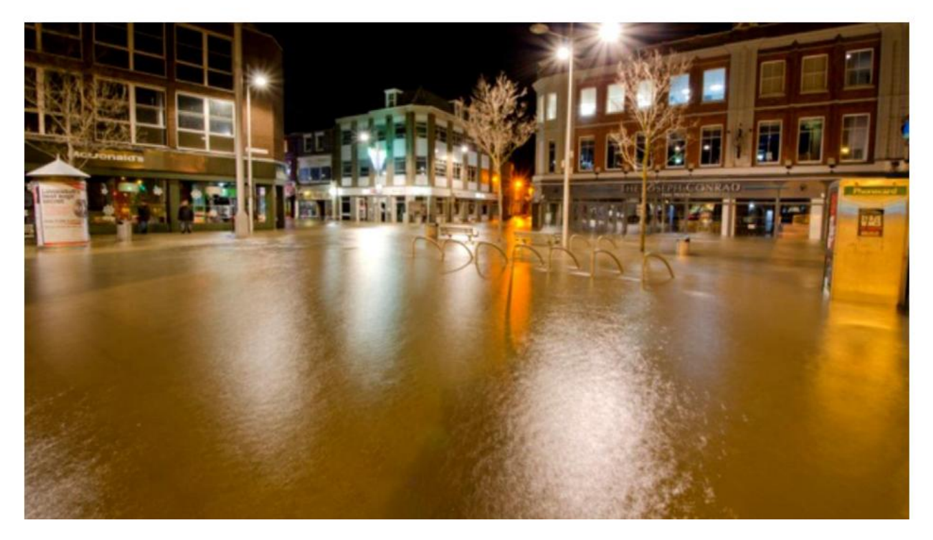
Plate 2-1: View of station square in December 2013.

Lowestoft is largely undefended from tidal flooding and is the largest UK coastal town with no formal tidal defences. As such, Lowestoft has been affected by a number of historic tidal flood events. A recent example in 2013 is shown in Plate 2-1where 158 residential and 233 commercial properties were reported to have flooded in the Lowestoft and Oulton Broad area. This included 90 residential and 143 commercial properties in the low-lying central area of Lowestoft. In addition, tidal flooding resulted in the closure of key transportation links including Lowestoft railway station (see Plate 2-2) and the A12 / A47 through Lowestoft.