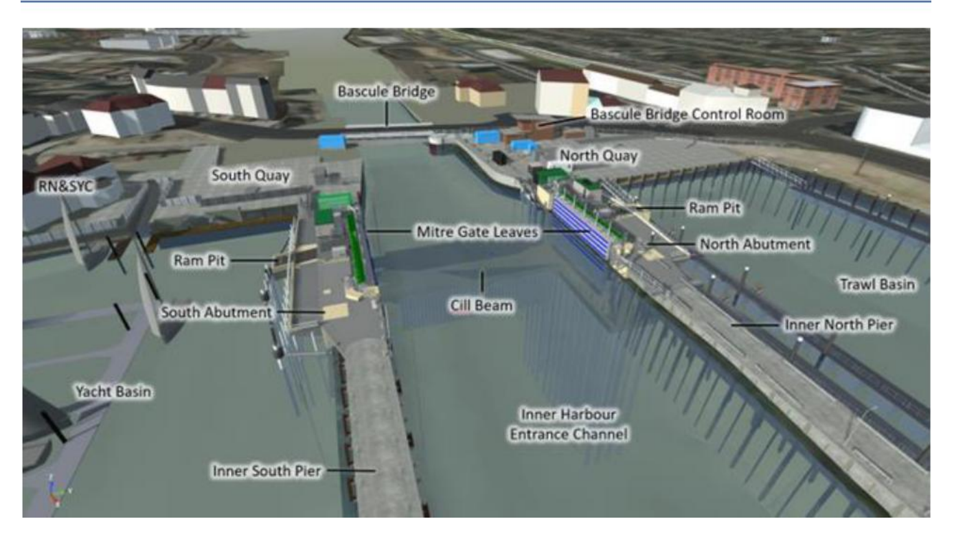
Plate 2-4: Visualisation of the proposed 40m Barrier (note: some of the plant builds to be located on the quaysides are not shown).