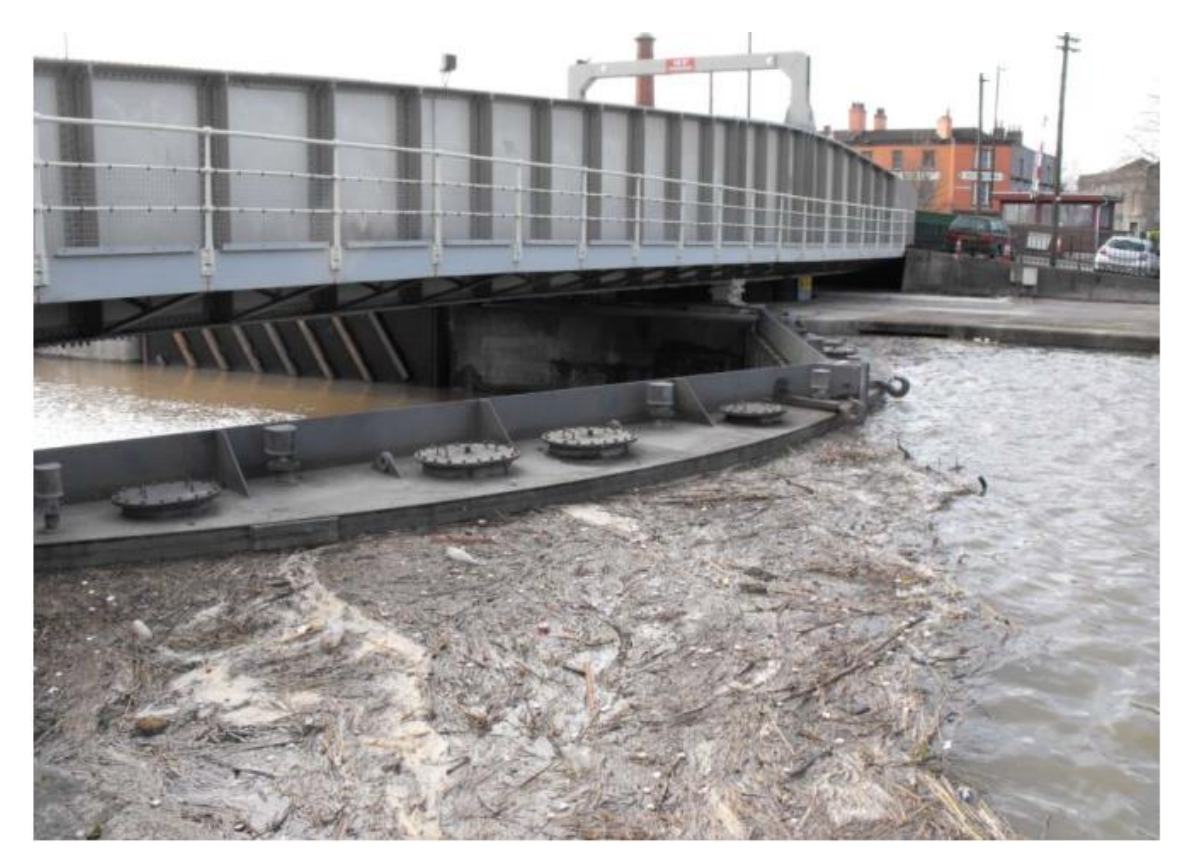
Plate 3-7: Mitre gates deployed against high surge.

This type of gate comprises a relatively simple lattice of structural beams, with all parts accessible for maintenance, painting and inspection. The gate only functions in one direction and will only support a differential head of the sea level being higher than Lake Lothing. The gate cannot open against any significant differential head, meaning it would be necessary to wait for the tide level to fall to match the Lake Lothing level before opening the harbour entrance.