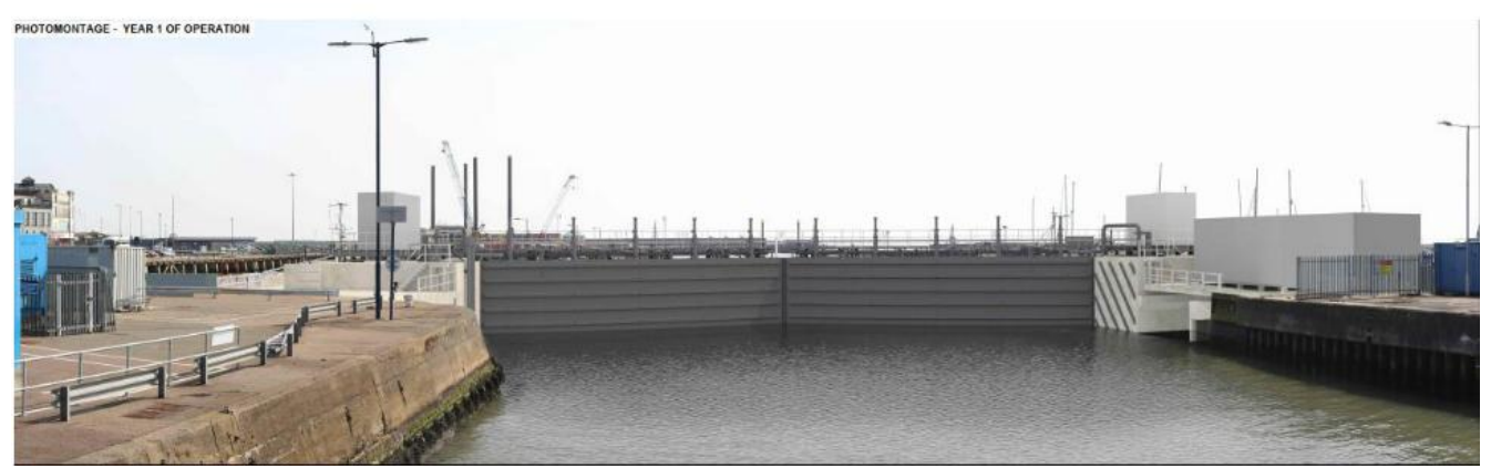
Plate 2-3: The proposed tidal barrier in the gate closed position (view looking east/seaward).

The Scheme involves construction of a tidal flood barrier across the Inner Harbour Entrance Channel to Lake Lothing and the Inner Harbour of the Port of Lowestoft, approximately 40m downstream (east) of the Bascule Bridge and the long term inspection, operation and maintenance of a short length (approximately 35m) of the new tidal flood walls at the western extent of Hamilton Road. A visualisation of the barrier is shown on Plate 2-3. Short sections of temporary flood barrier known as demountable defences are required to connect the tidal barrier to the flood walls under construction as part of the wider LFP project. In addition to the barrier structure, a series of plant buildings will be constructed on the quayside adjacent to the barrier.