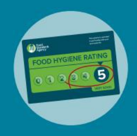
Food hygiene ratings 98.75 at rating 3-5