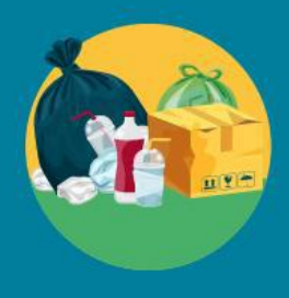
2000 fly tipping incidents per year